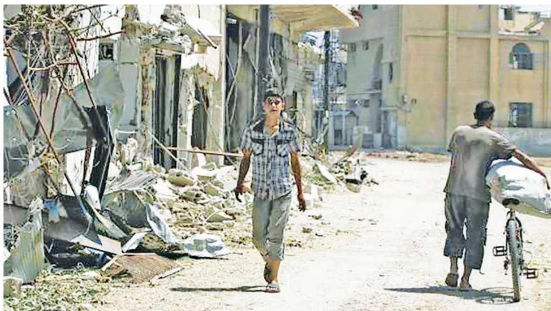
Residents walk in Jobar, a suburb of Damascus, which activists claim has been undergoing violent clashes between forces loyal to Syria's President Bashar al-Assad and rebel fighters on 31 Aug, 2014.

In a statement, the military said the drone was downed by a Patriot missile near the Quneitra crossing between the Israeli-held Golan Heights and Syria.