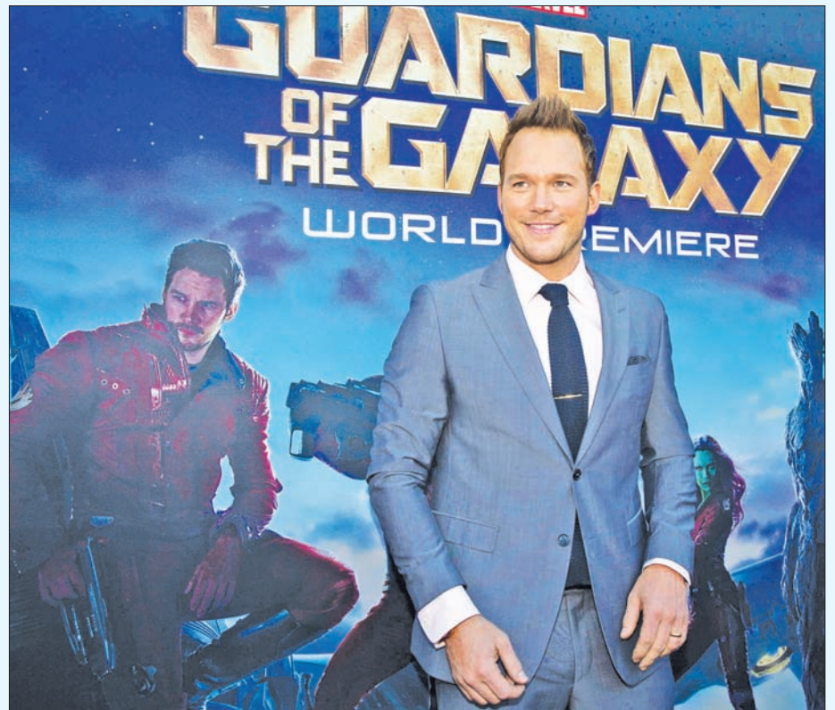
Cast member Chris Pratt poses at the premiere of "Guardians of the Galaxy" in Hollywood, California on 21 July, 2014.

"Guardians" rang up $16.3 million (9.8 million pounds) in US and Canadian ticket sales from Friday through Sunday, topping weekend charts for the third time since its 1 August debut, according to estimates from tracking firm Rentrak. Total domestic sales climbed to $274.6 million, surpassing the $259.8 million earned by April release, "Captain America: The