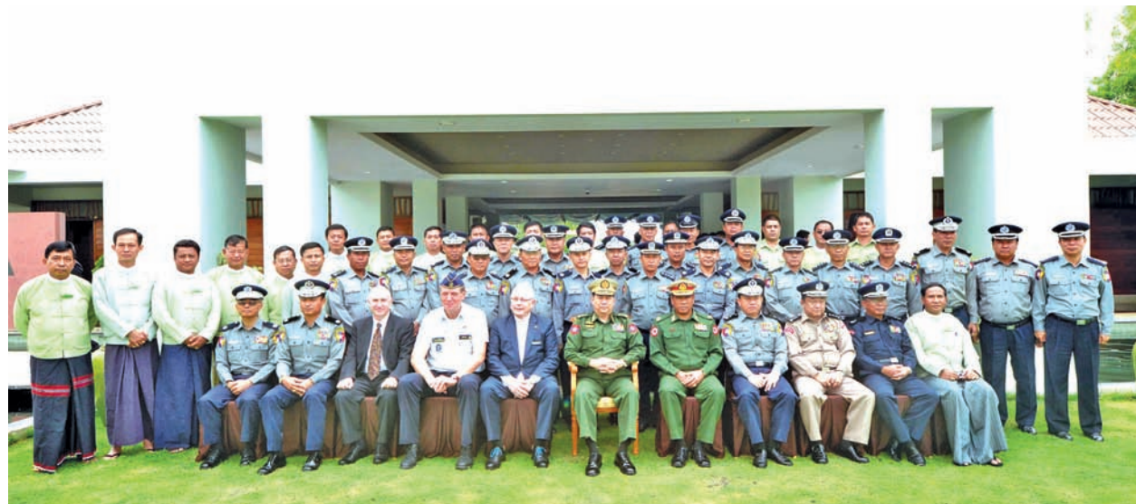
Union Minister for Home Affairs Lt-Gen Ko Ko and senior police officers with officials of EU (IMG Project) seen after holding discussions on crowd management topic for ensuing rule of law in society.—MNA

NAY PYI TAW, 1 Sept — The Myanmar Police Force is implementing the reform process for providing technical assistance, expertise, modern police equipment, arms and ammunition and new policing tactics to the servicemen in carrying out local security duty, Union Minister for Home Affairs Lt-Gen Ko Ko said at the senior officers meeting on crowd management at Thingaha Hotel in Nay Pyi Taw on Monday.