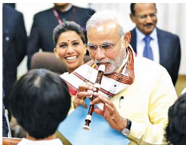
Prime Minister Narendra Modi (C) tries to play a soprano recorder before school children at a music class during a visit at Taimei Elementary School in Tokyo on 1 Sept, 2014.

TOKYO, 1 Sept — Japanese Prime Minister Shinzo Abe will tell his Indian counterpart Narendra Modi at a summit on Monday that Japan aims to double its direct investment in India in five years from some $2 billion last year, the Nikkei business daily reported.