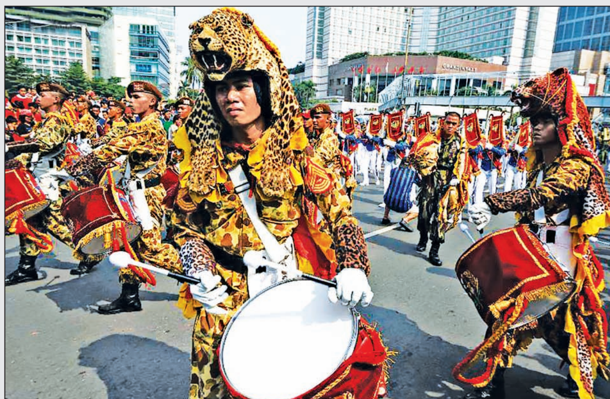
Members of Indonesian military academy marching bands participate in Independence Day Run 2014 in Jakarta, Indonesia on 31 Aug, 2014. Around 45,000 runners participate in this event celebrating the 69 th anniversary of Indonesia's Independence.