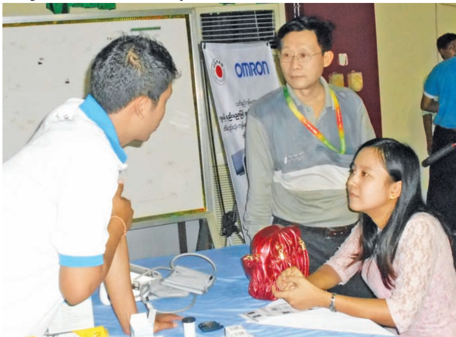
Doctor discusses with a woman who wants to make medical consultation at a seminar.