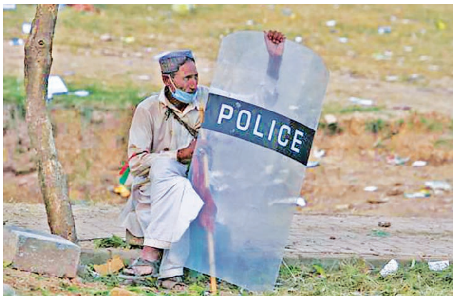
A supporter of Tahir ul-Qadri, Sufi cleric and opposition leader of political party Pakistan Awami Tehreek (PAT), holds a police shield as he sits along a road in Islamabad on 31 Aug, 2014.