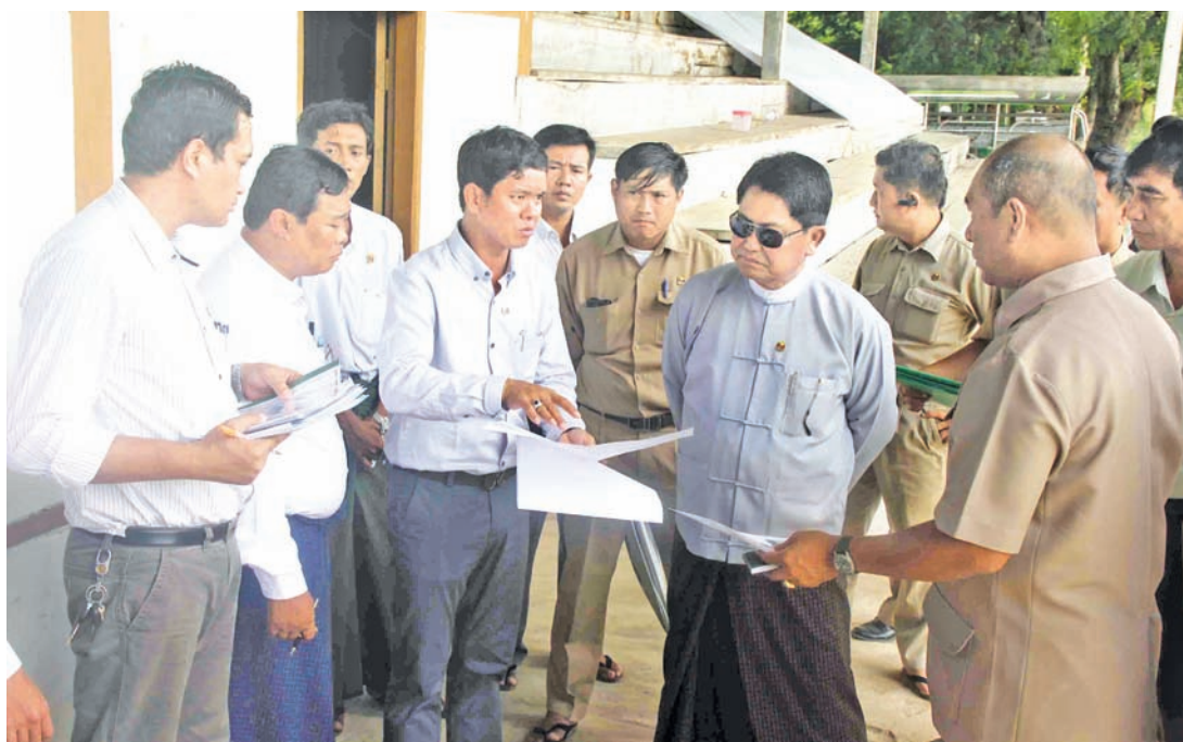
Union Minister for Sports U Tint Hsan hears the reports on upgrading of sport grounds in Nay Pyi Taw.