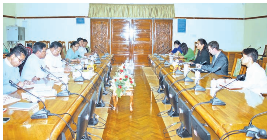
Union Minister U Win Myint in face to face meeting with a delegation from the International Trade Centre, Geneva, Switzerland, led by Associate Advisor Mr Charles Roberge for improvement of national export strategy.

NAY PYI TAW, 1 Sept — Union Minister for Commerce U Win Myint received a delegation from the International Trade Centre, Geneva, Switzerland, led