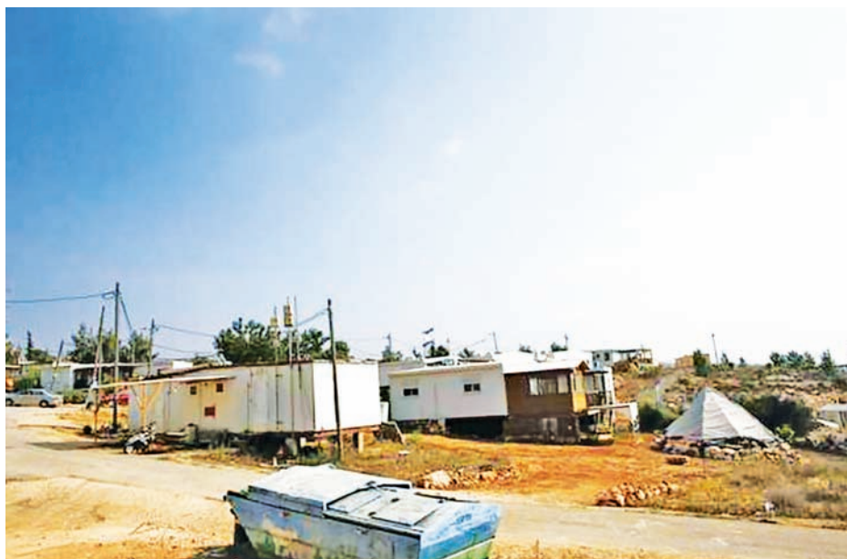
Prefabricated homes are seen in a Jewish settlement known as "Gevaot", in the Etzion settlement bloc, near Bethlehem on 31 Aug, 2014.