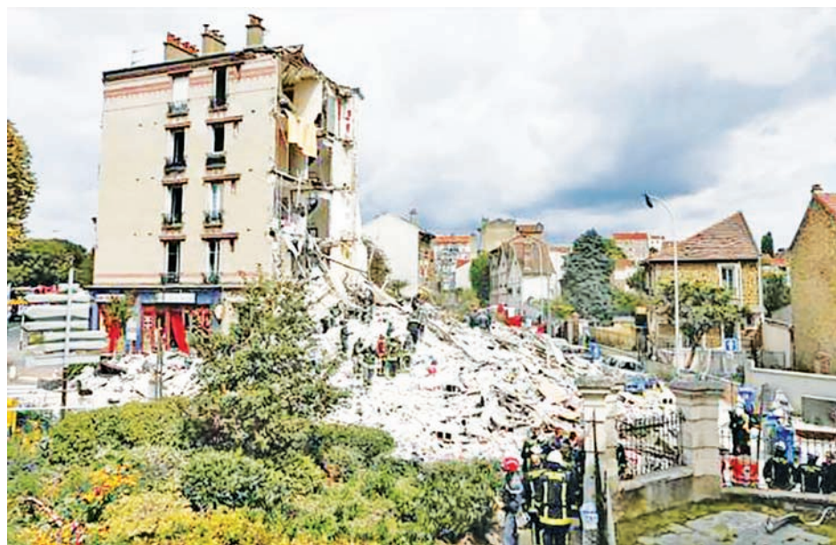
French firefighters search the rubble of a collapsed building in Rosny-Sous-Bois, near Paris on 31 Aug, 2014.

ROSNY-SOUS-BOIS, (France) 1 Sept — A building in a Paris suburb collapsed after an explosion on Sunday morning, killing two children and two women, and teams were searching the rubble for four other people still missing by evening.