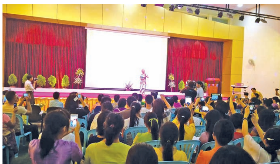
Foreign students of Yangon University of Foreign Languages perform entertainments at regional culture comparing show at the university on Thursday with participation of students from China, Korea, Japan, Vietnam, Thailand, India, Bangladesh, Laos, Germany and Cambodia. (News reported)—MNA

USD Buying K970 - Selling K974 SGD Buying K773 - Selling K782 Euro Buying K1275 - Selling K1295