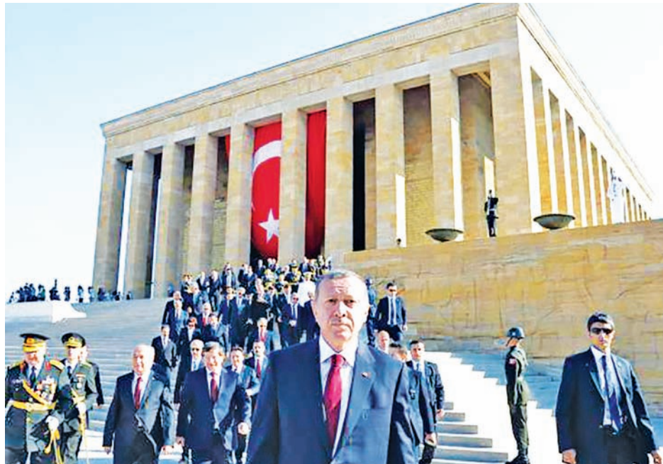
Turkey's President Tayyip Erdogan (C) attends a ceremony marking the 92 nd anniversary of Victory Day at Anitkabir, mausoleum of modern Turkey's founder Ataturk, in Ankara on 30 Aug, 2014.

ISTANBUL, 1 Sept — Dozens of Turkish police officers, including a former chief of a police financial unit, were de-