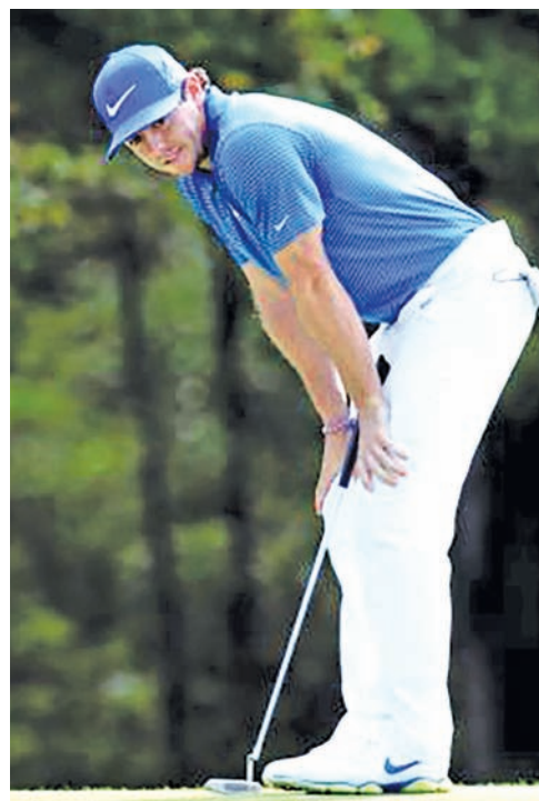
Rory McIlroy reacts to missing his birdie putt on the 18 th hole during the third round of the Deutsche Bank Championship golf tournament at TPC of Boston on 31 Aug, 2014.

The 25-year-old has recorded two PGA Tour victories, most recently at the Honda Classic in March when he beat McIlroy and two others in a playoff.—Reuters