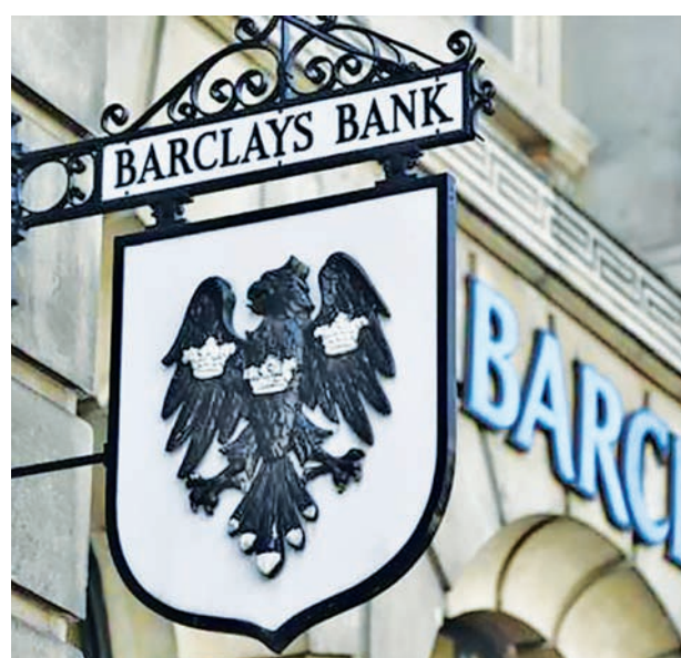
A Barclays sign hangs outside a branch of the bank in the City of London on 30 July, 2014.

It has been gradually selling off units it now considers non-core — including its United Arab Emirates retail banking business, sold to Abu Dhabi Islamic Bank in a deal also complet-