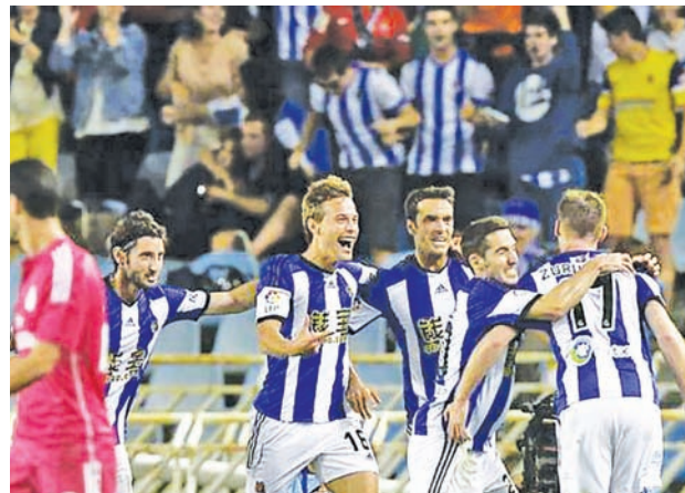
Real Sociedad's players celebrate a goal during their Spanish first division soccer match against Real Madrid at Anoeta stadium in San Sebastian on 31 Aug, 2014.

Messi hit the post with a free kick from the right of the area in the first half but Barca were also lucky when Jeremy Mathieu turned a cross onto an upright. To-