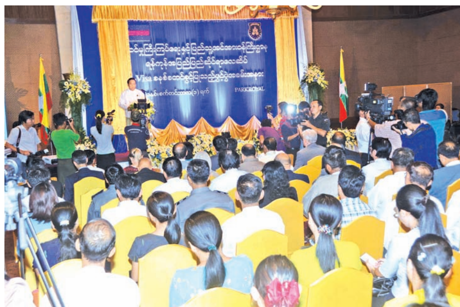
In an attempt to boost tourism, Myanmar introduces e-Visas at Yangon International Airport.—MNA

Tourism Council estimated that hotel and tourist sector of Myanmar con-