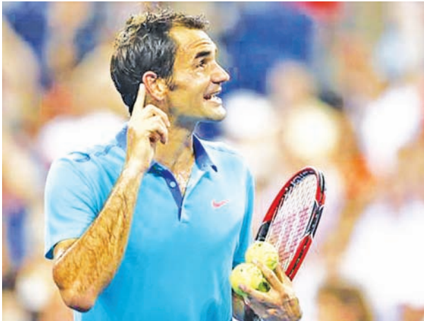
Roger Federer of Switzerland listens to the crowd before hitting autographed tennis ball into the crowd after defeating Marcel Granollers of Spain in the men's singles play following their match at the 2014 US Open tennis tournament in New York on 31 Aug, 2014.

NEW YORK, 1 Sept— Baking heat, rain and the threat of lightning all forced stoppages in play at the US Open on Sunday