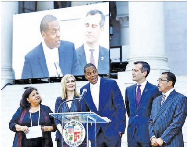
Rapper Jay-Z (C) speaks during a news conference after announcing his two-day "Made in America" music festival with Los Angeles Mayor Eric Garcetti, in Los Angeles on 16 April, 2014.

LOS ANGELES, 1 Sept — Seven people were arrested on Sunday at the Made in America music festival in downtown Los Angeles, following an opening day that left more than two dozen people in handcuffs, police said.