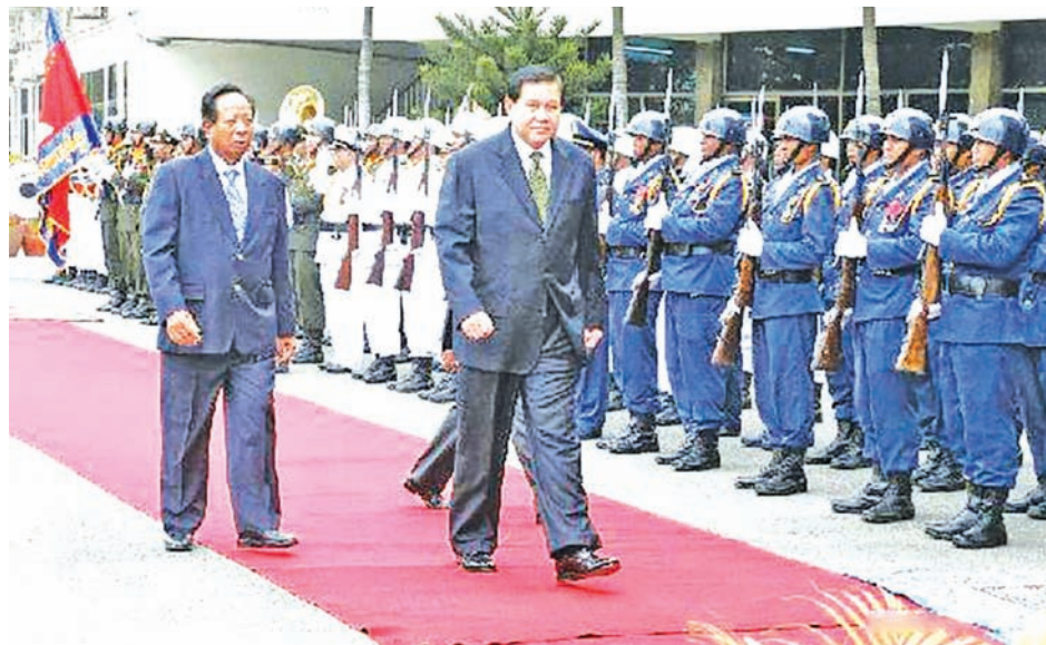
Cambodian Deputy Prime Minister and Defence Minister Gen Tea Banh (front L) and visiting new Thai Foreign Minister Gen Tanasak Patimapragorn (front R) inspect guards of honor in Phnom Penh, capital of Cambodia, on 1 Sept, 2014. Cambodian Deputy Prime Minister and Defense Minister Gen Tea Banh on Monday met with new Thai Foreign Minister Gen. Tanasak Patimapragorn to discuss ways to tighten bilateral relations and cooperation.—XINHUA

PHNOM PENH, 1 Sept — Cambodian Deputy Prime Minister and Defence Minister Gen Tea Banh on Monday met with new Thai Foreign Minister Gen Tanasak Patimapragorn to discuss ways to tighten bilateral relations and cooperation.