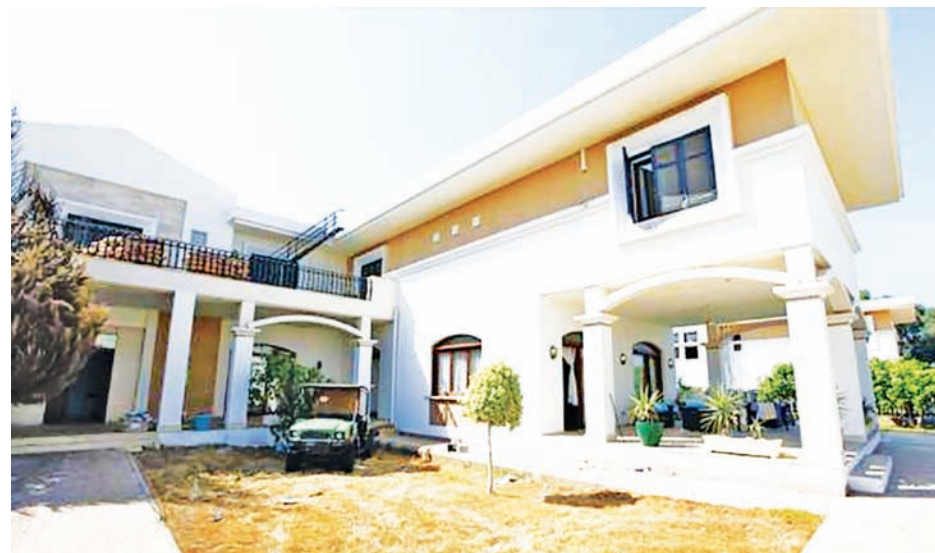
A view of an annex of the US embassy in Tripoli during a media tour organized by Operation Dawn, a group of Islamist-leaning forces mainly from Misrata, on 31 Aug, 2014, after the group took over the annex.