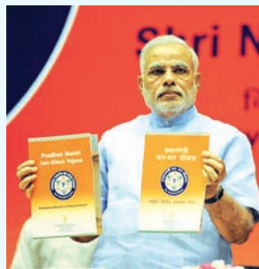
Indian Prime Minister Narendra Modi holds brochures at a campaign aimed at opening millions of accounts to provide insurance to the country's poor people, in New Delhi, India, on 28 Aug, 2014.

NEW DELHI, 29 Aug — Indian Prime Minister Narendra Modi on Thursday launched a massive banking programme by opening 15 million bank accounts to provide insurance to the account holders, most of whom are the country's poor people.