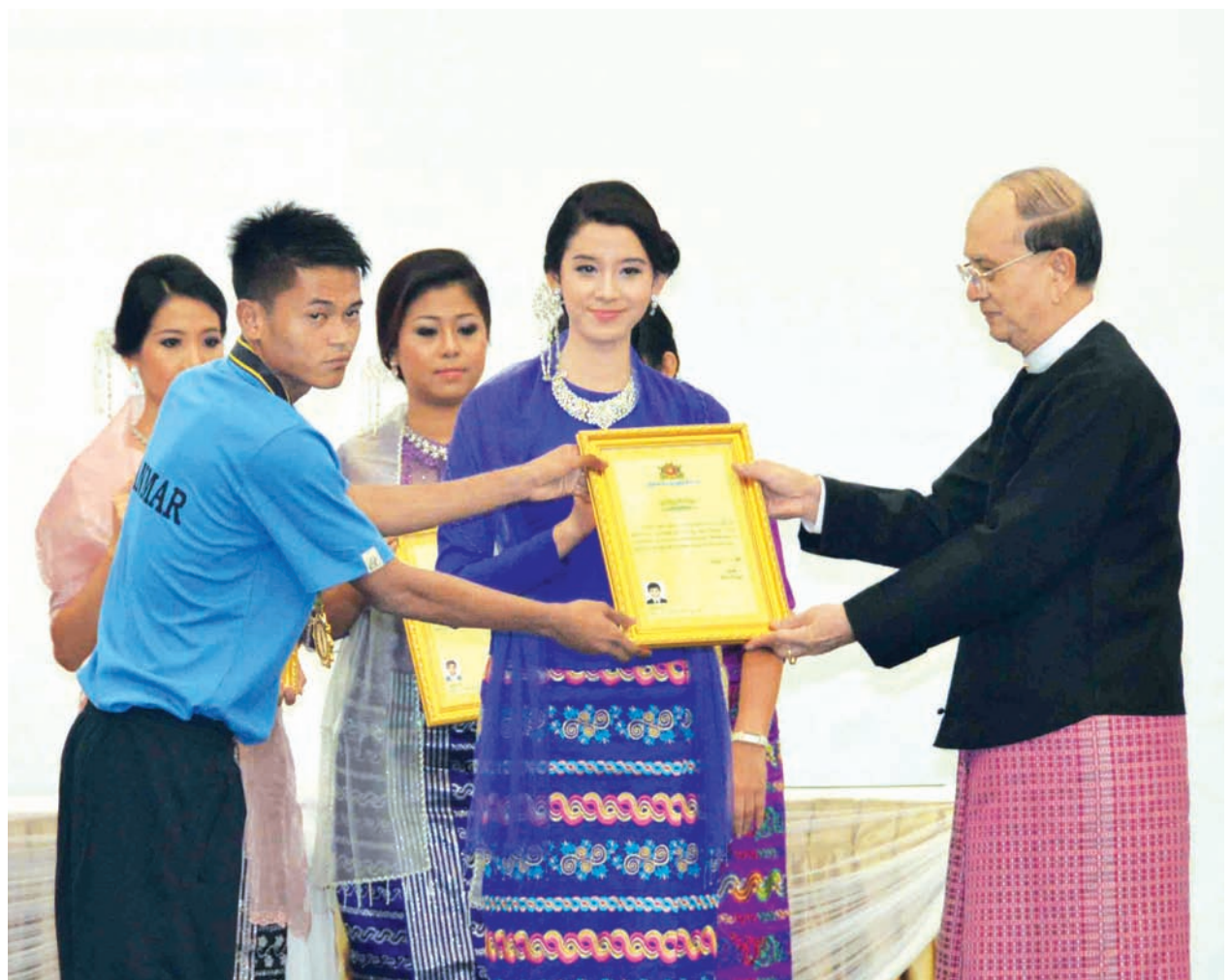
President U Thein Sein presents certificate of honour to a player from victorious Myanmar U-19 team at the dinner in honour of the U-19 Myanmar football team.

Details of the preliminary population census will be announced on 30 August, according to the Central Census Commission. —NLM