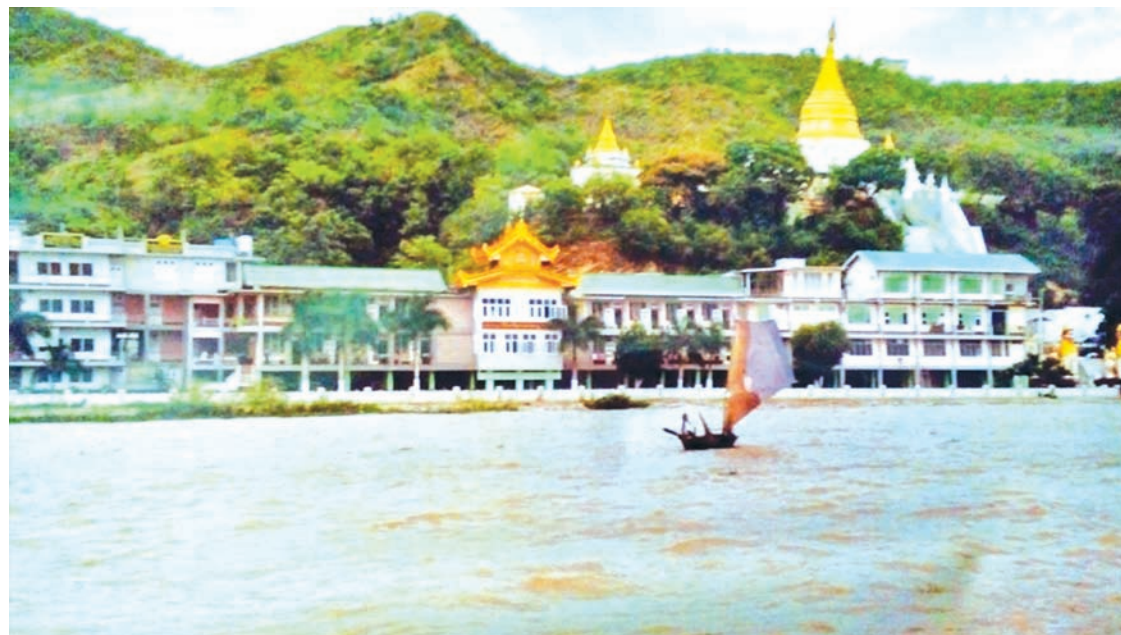
Wachet Jivitadana Sangha Hospital.

The Cambridge University Hospitals NHS Foundation Trust (CUH) is one of the United Kingdom's NHS Foundation Trusts. The Trust provides healthcare for