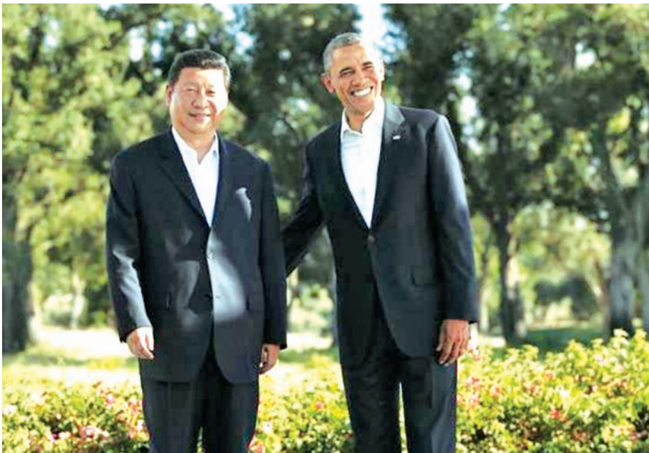
US President Barack Obama meets Chinese President Xi Jinping at The Annenberg Retreat at Sunnylands in Rancho Mirage, California on 7 June, 2013.

The United States and China have strong economic and commercial ties but are at odds over China's pressing of territorial claims in East Asia, where Washington has several treaty allies, and over issues such as cyberspying. — Reuters