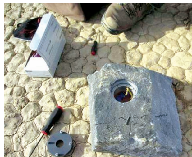
A rock containing a motion-activated Global Positioning System (GPS) unit is seen in the so-called Racetrack Playa of California's Death Valley in this undated handout photo provided by the Scripps Institution of Oceanography. —REUTERS

the dry lake bed they are in freezes over with a thin layer of ice which then breaks apart in a light wind, sending large sheets of ice against the rocks with enough force to move them a few yards per minute, Norris said.