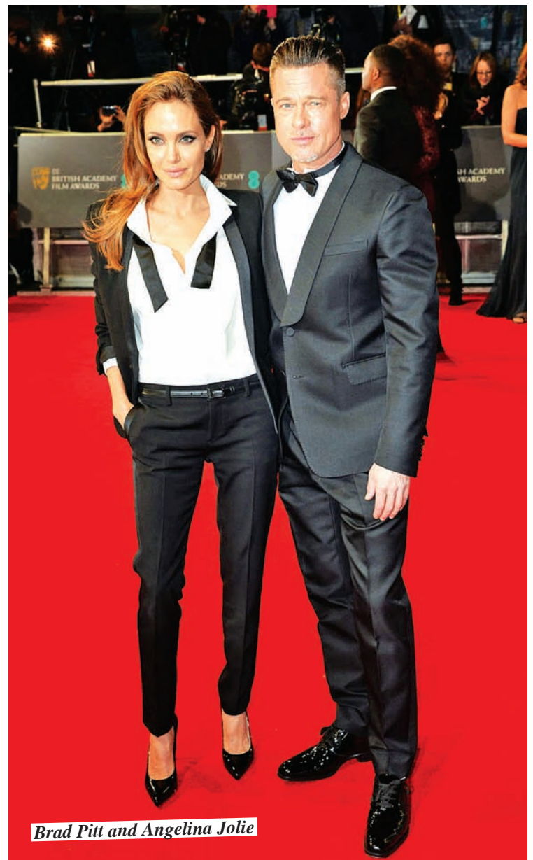
Brad Pitt and Angelina Jolie