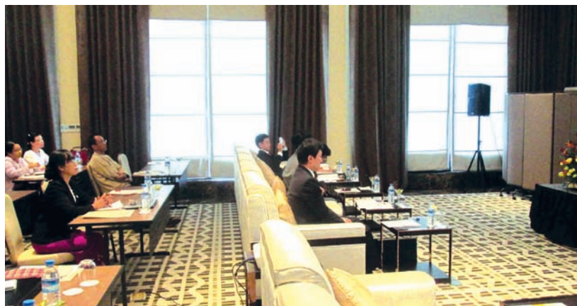
Union Minister U Tin Naing Thein addresses the workshop on ease of doing business and enforcing contracts in Myanmar organized in cooperation between Myanmar Investment Commission and Ministry of Justice of Republic of Korea.—MNA

NAY PYI TAW, 29 Aug—The Myanmar Investment Commission has cooperated with Republic of Korea's Ministry of Justice in accelerating the third phase of the development of trade and investment.