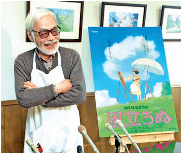
File photo taken in March 2014 shows Japanese animation director Hayao Miyazaki at Studio Ghibli in Koganei, Tokyo. The Board of Governors of the Academy of Motion Picture Arts and Sciences said 28 Aug, 2014, it has picked Miyazaki as one of three recipients of its Honorary Award for the year.

LOS ANGELES, 29 Aug — The Academy of Motion Picture Arts and Sciences said on Thursday it has picked Japanese animated film director Hayao Miyazaki as one of three recipients of this year's honorary Governors Award for his lifetime achievements in the film industry.