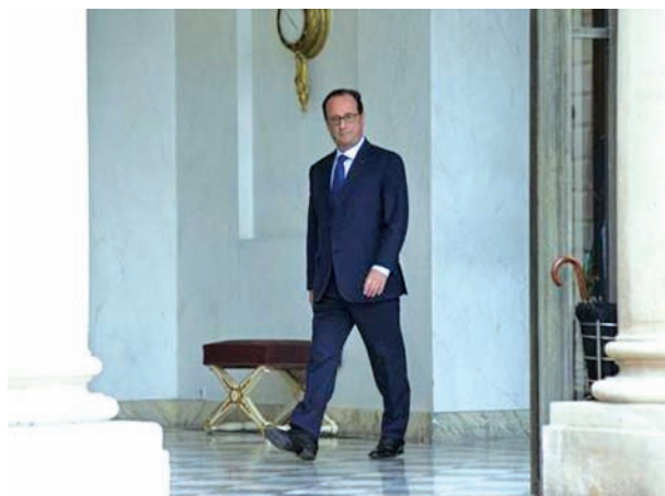
French President Francois Hollande walks in the Elysee Palace in Paris following the weekly cabinet meeting after a government reshuffle, on 27 August, 2014.

Syrian rebel forces have been fighting Assad for more than three years with political backing from the West in a war that has cost 190,000 lives. But hardline Islamist groups have increasingly dominated the anti-Assad struggle, posing a dilemma for Western