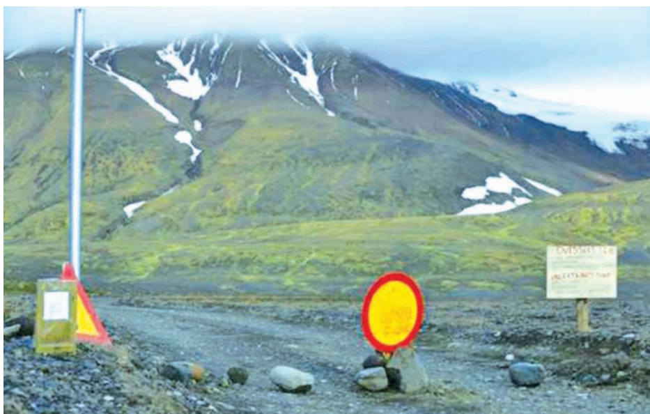
Warning signs block the road to Bardarbunga volcano, some 20 kilometres (12.5 miles) away, in the north-west region of the Vatnajökull glacier on 19 Aug, 2014.