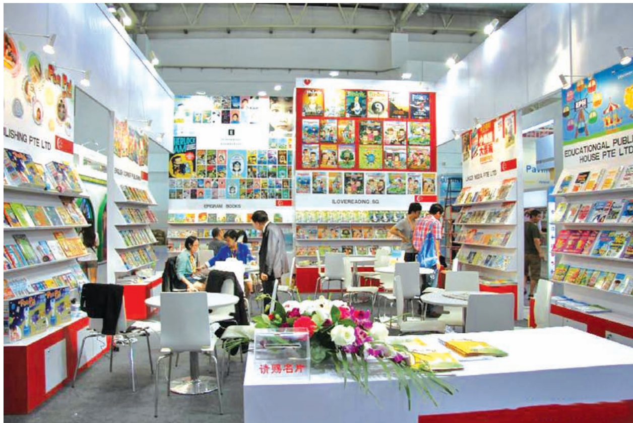
People visit the 21 st Beijing International Book Fair in China International Exhibition Center in Beijing, capital of China on 27 Aug, 2014. More than 2,162 exhibitors from 78 countries and regions participate in the book fair. The book fair, which consists of four exhibition halls, was opened on Wednesday. —XINHUA

"The event is an attempt to boost international exchange and culture. We hope that it will make more kids fall in love with children's literature," Kan said.—Xinhua