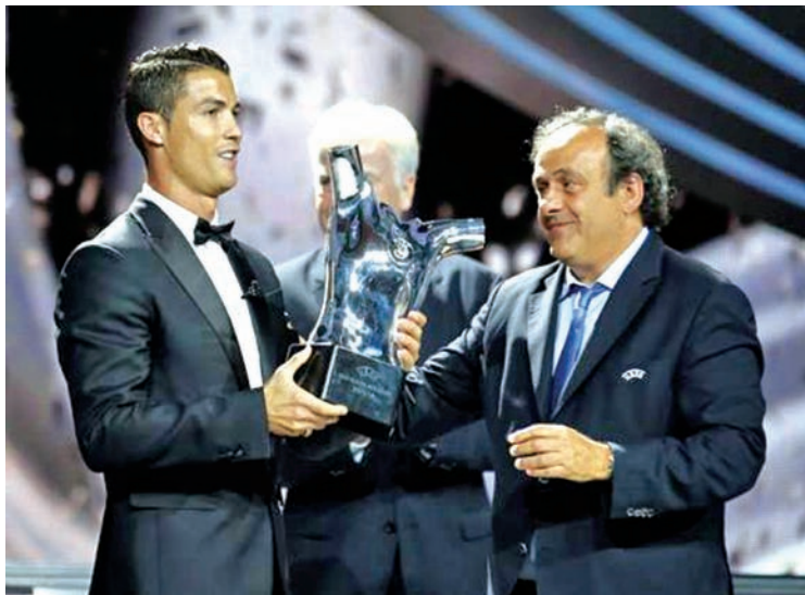
Real Madrid’s Cristiano Ronaldo (L) receives his Best Player UEFA 2014 Award from UEFA President Michel Platini during the draw ceremony for the 2014/2015 Champions League Cup soccer competition at Monaco’s Grimaldi Forum in Monte Carlo on 28 Aug, 2014.

MONACO, 29 Aug — Cristiano Ronaldo, whose extra-time penalty put the seal on Real Madrid’s 4-1 Champions League