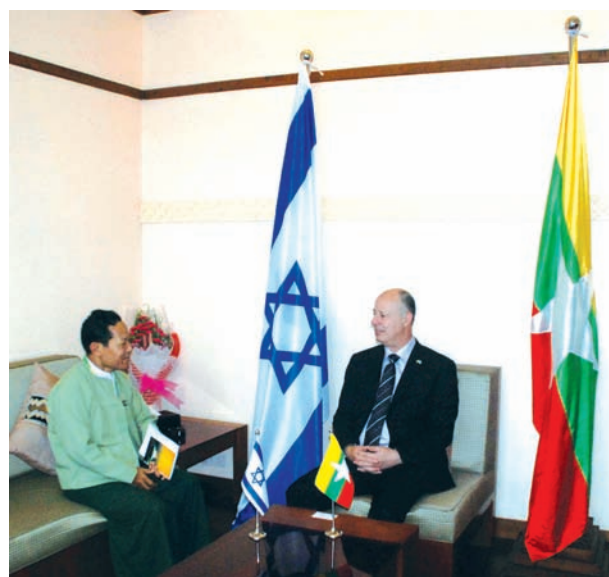
Israeli Deputy Minister of Foreign Affairs Tzachi Hanegbi explains prospects of Israeli companies to invest in telecommunications and health systems to education.

A: During the 60th Anniversary, the Israeli embassy in Yangon organized a large number of activities including Logo (See page 3)