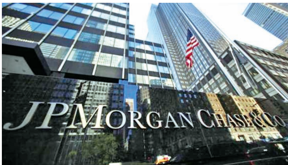
A sign outside the headquarters of JP Morgan Chase & Co in New York on 19 Sept, 2013.

FS-ISAC told members in the email that it decided not to raise its barometer of threats facing banks during a regularly scheduled conference call on Thursday. During the call,