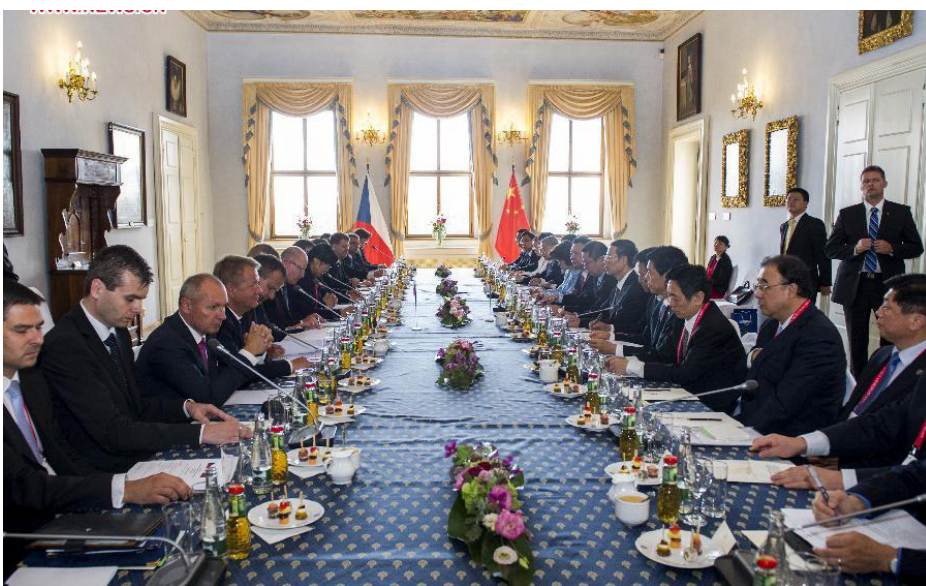
Chinese Vice Premier Zhang Gaoli (6th, R) meets with Czech Prime Minister Bohuslav Sobotka in Prague, Czech Republic, on 28 Aug, 2014.

the meeting is being hosted — and China are celebrating the 65 th anniversary of the establishment of diplomatic relations.