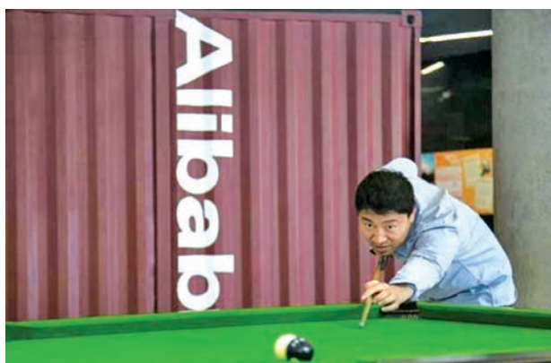
A man plays snooker in a hall inside Alibaba's headquarters in Hangzhou, Zhejiang Province on 23 April, 2014.