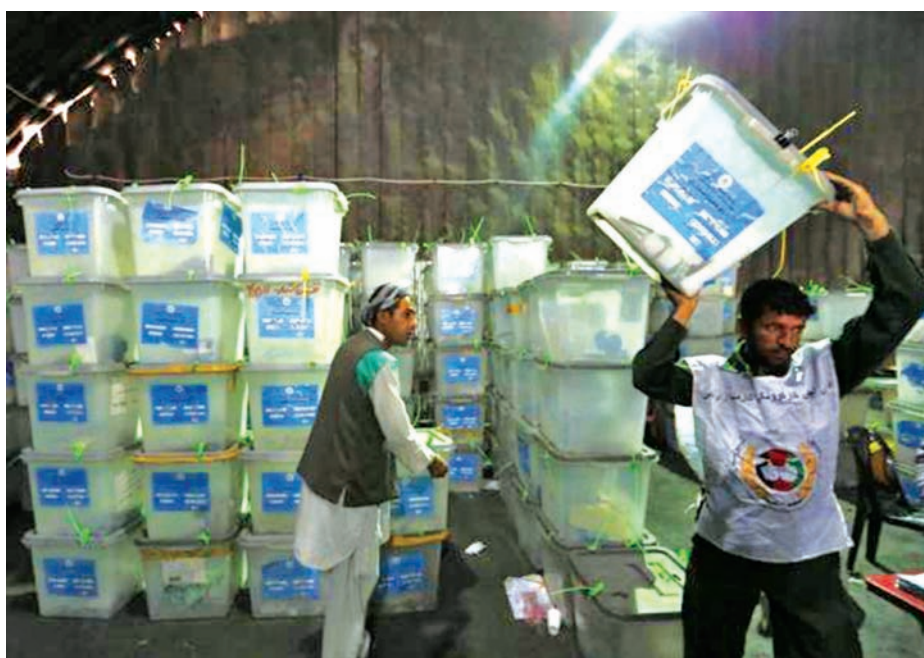
An Afghan election worker carries a ballot box to be counted for an audit of the presidential run-off in Kabul on 27 Aug, 2014.

In a previous statement, Karzai had said the inauguration of Afghanistan's new president must take place a month after the