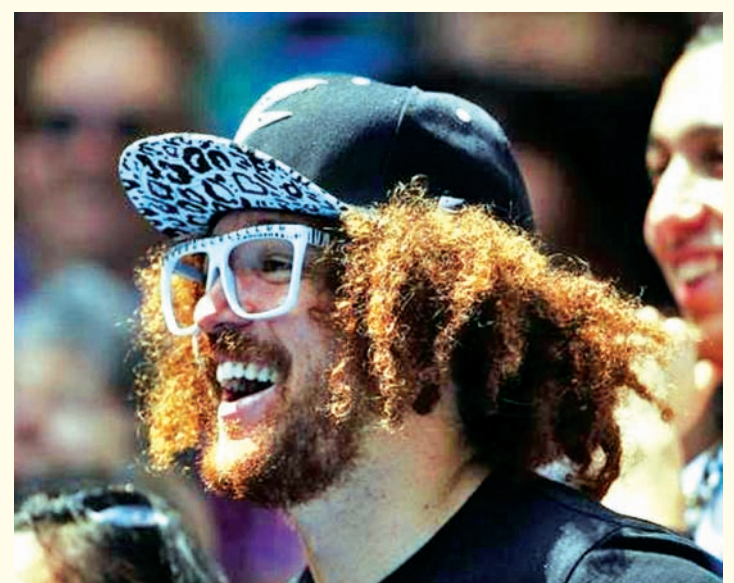
Singer Redfoo, boyfriend of Victoria Azarenka of Belarus, laughs during her women's singles match against Sloane Stephens of the US at the Australian Open 2014 tennis tournament in Melbourne on 20 Jan, 2014.

SYDNEY, 29 Aug — Redfoo, one half of LMFAO the US pop duo behind the hit single "I'm Sexy and I Know It", has been hit with a glass at a pub in an upmarket Sydney suburb and suffered a minor facial injury, Australian police said on Thursday.