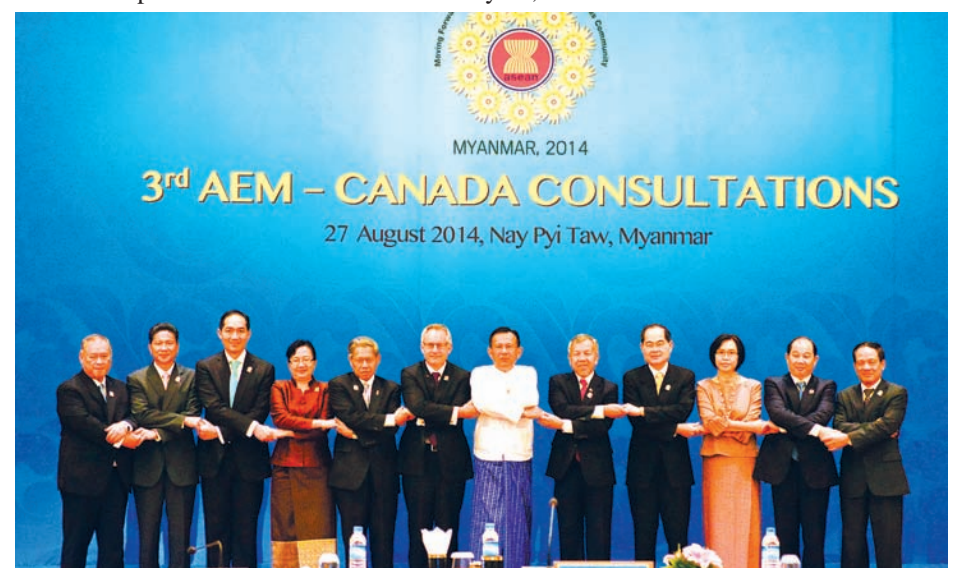
Economic ministers of 3 rd AEM-Canada Consultations joining hands in integration posture.