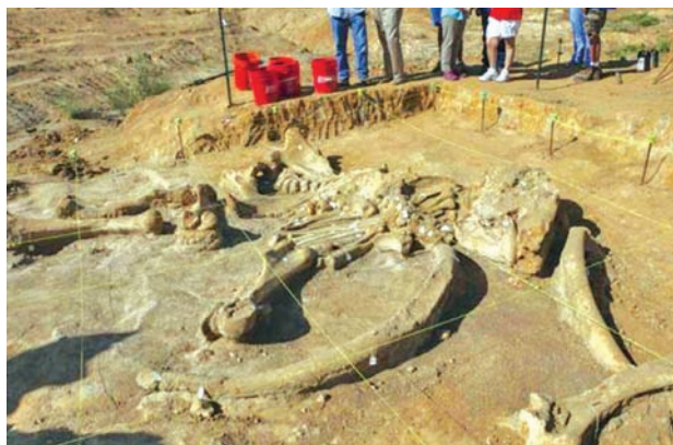
A nearly complete skeleton of a mammoth that died 20,000 to 40,000 years ago is pictured near Dallas, Texas in this undated handout photo obtained by Reuters on 26 Aug, 2014.

The rest of the near-complete skeleton was unearthed by a team from a nearby community college, who determined it was a Columbian mammoth — a slightly larger, less hairy version of the more famous woolly mam-