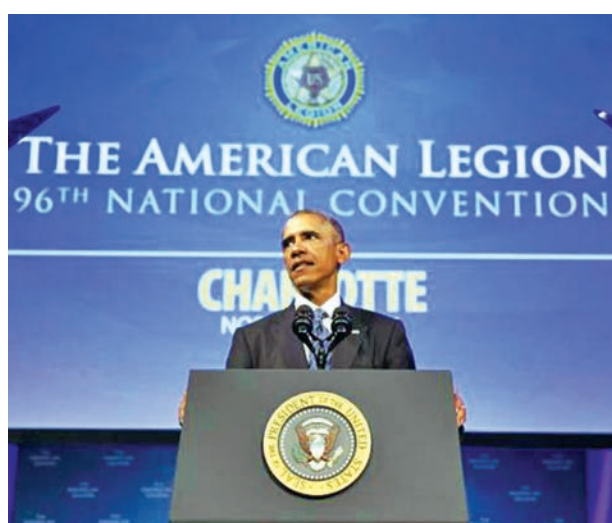
US President Barack Obama speaks at the American Legion’s 96th National Convention at the Charlotte Convention Centre in Charlotte, North Carolina, on 26 Aug, 2014.

Launching air strikes into Syria would add an unpredictable element to a