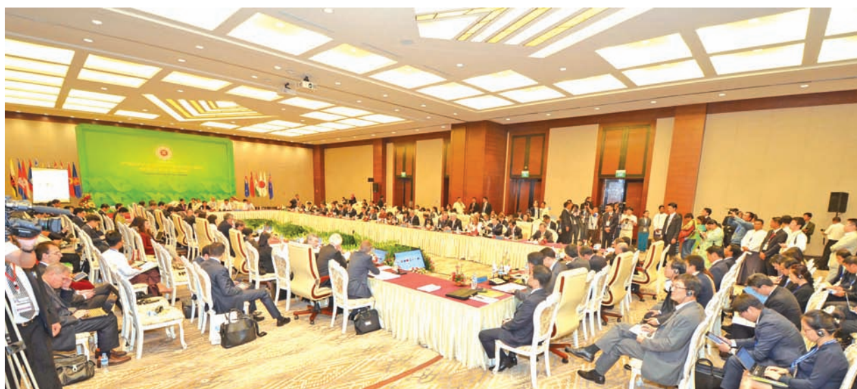
Economic ministers of ASEAN and dialogue partner countries review report on establishment of single free trade area at the 2 nd RCEP Participating Countries Ministerial Meeting.