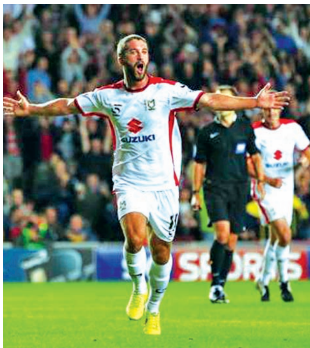
Milton Keynes Dons' Will Grigg celebrates his goal against Manchester United during their League Cup soccer match at stadiummk in Milton Keynes, north of London on 26 Aug, 2014.

Van Gaal left out several first-team regulars including captain Wayne Rooney and strike partner Robin van Persie but asked if he regretted making so many changes, he said: "No, you have to analyse the problem and I've done that."