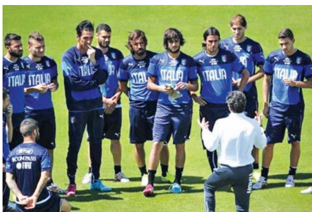
Italy's national soccer team coach Cesare Prandelli (C) talks to his players during a training session at the Maria Lamas Farache-Frasqueirao stadium in Natal on 22 June, 2014.

Once Europe's most prestigious league, Serie A has lost its glamour over the last few years as dilapidated stadiums, financial problems, racism and hooliganism have all taken their toll, not to mention two match-fixing scandals.