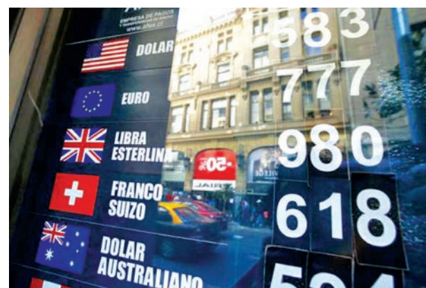
A board shows the exchange rate of several currency against the Chilean Peso at a money exchange bureau in downtown Santiago on 25 Aug, 2014.