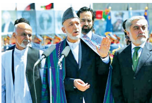
Afghan President Hamid Karzai (C) speaks during celebrations to commemorate Afghanistan’s 95th anniversary of independence as he is flanked by presidential candidates Abdullah Abdullah (R) and Ashraf Ghani in Kabul on 19 Aug, 2014.