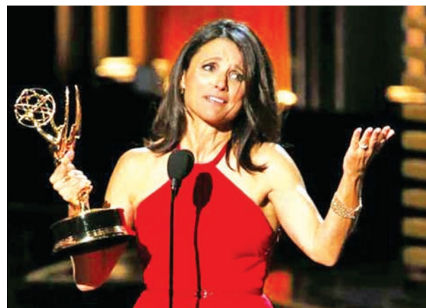
Julia Louis-Dreyfus accepts the award for Outstanding Lead Actress In A Comedy Series for her role in HBO's "Veep" onstage during the 66th Primetime Emmy Awards in Los Angeles, California on 25 Aug, 2014.