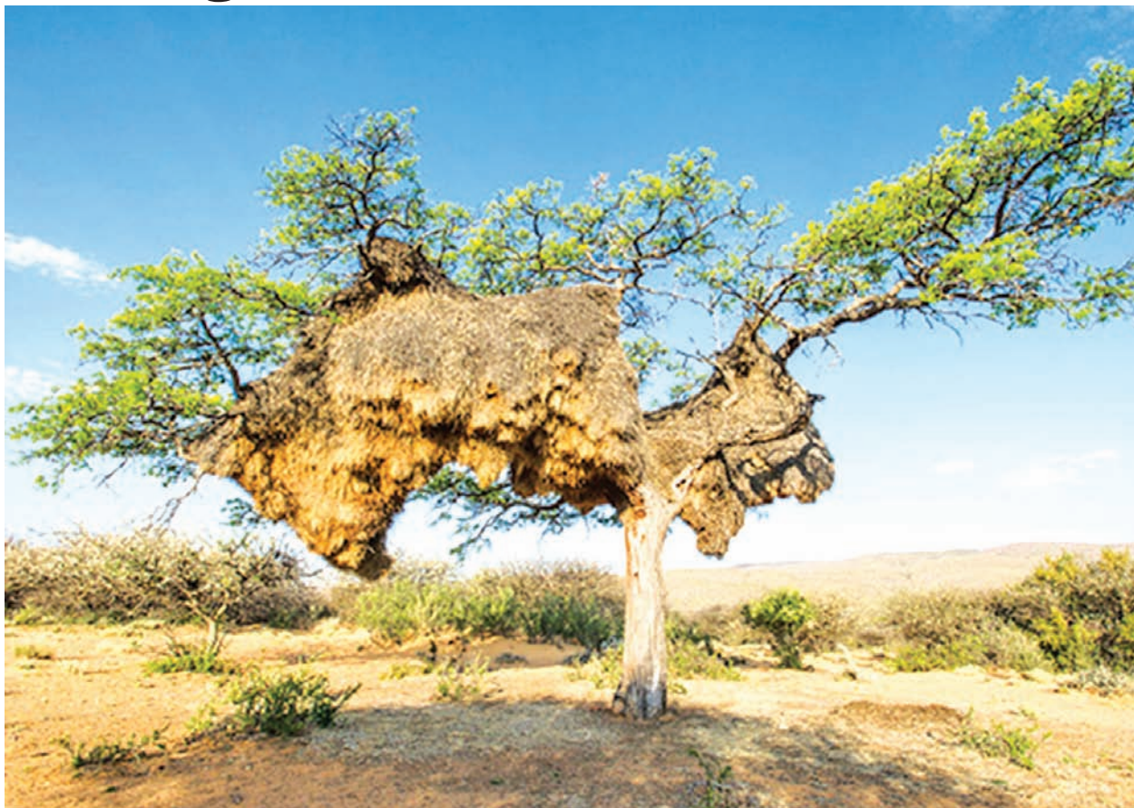
The bird nest in the African continent is believed to be the largest one in the world.

BEIJING, 27 Aug — A bird nest weighing over 2000 pounds (about 907 kilograms) — believed to be the world's largest — has crushed a tree supporting it, the UK-based Wired Magazine reported recently.