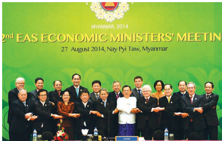
Economic ministers at the 2 nd East Asia Summit said they are concerned about abilities of WTO members in implementing Bali Package.