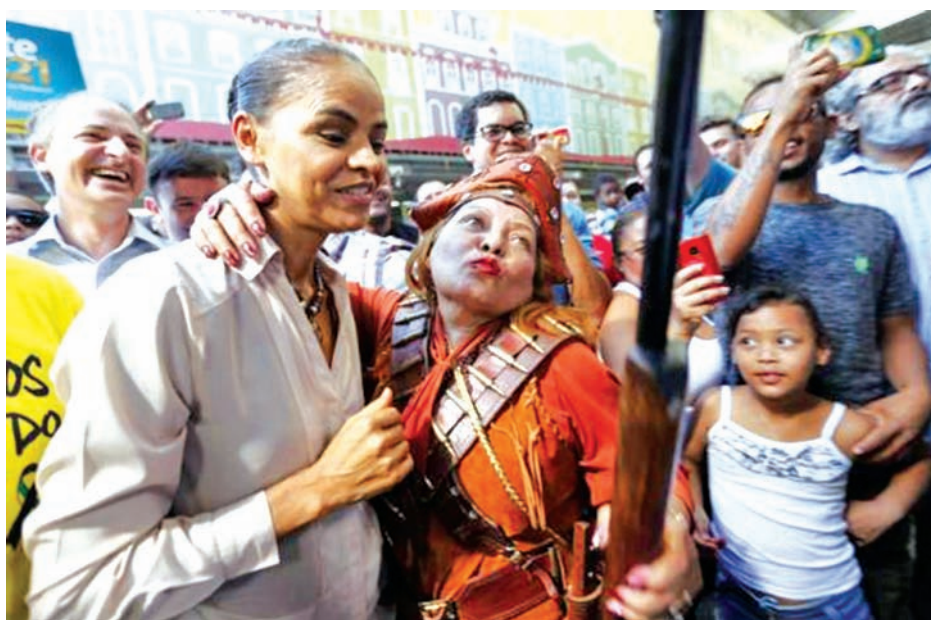
Brazil's Socialist Party presidential candidate Marina Silva (L) attends a rally campaign in Sao Paulo on 24 Aug, 2014.

A renowned defender of the Amazon rainforest who placed a strong third in the 2010 presidential elec-