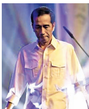
Indonesia's president-elect Joko Widodo

But the most pressing problem will be cutting big