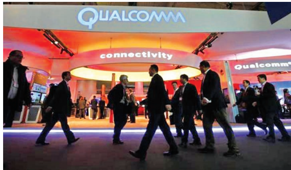
Visitors walk past the Qualcomm stand at the Mobile World Congress in Barcelona, on 24 Feb, 2014.

British cellphone chipmaker Icera, acquired by Nvidia Corp in 2011, took