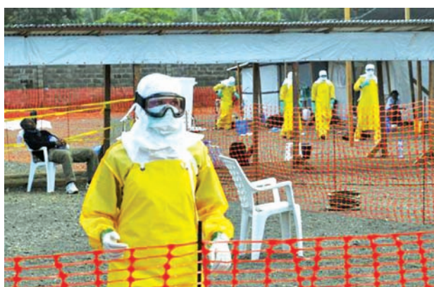
Medicins Sans Frontieres (MSF) health workers prepare at ELWA's isolation camp during the visit of Senior United Nations (UN) System Coordinator for Ebola David Nabarro, at the camp in Monrovia on 23 Aug, 2014.

FREETOWN / KINSHASA, 27 Aug — The World Health Organization (WHO) said on Tuesday it had shut a laboratory in Sierra Leone after a health worker there was infected with Ebola, a move that may hamper efforts to boost the global response to the worst-ever outbreak of the disease.