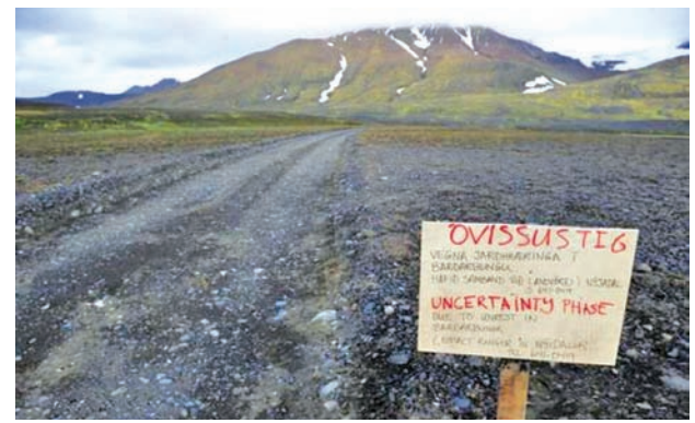
A warning sign blocks the road to Bardarbunga volcano, some 20 kilometres (12.5 miles) away, in the north-west region of the Vatnajökull glacier on 19 Aug, 2014.

But the magma could also reach the surface away from the glacier. This would probably lead to an eruption, but with limited explosive, ash-producing