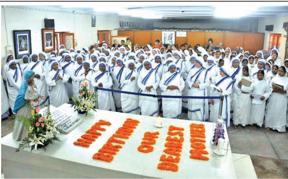
Nuns of Missionaries of Charity perform prayers during a service to commemorate Mother Teresa's 104th birth anniversary at the Missionaries of Charity house in Calcutta, eastern India, on 26 Aug, 2014. Mother Teresa, a Nobel peace prize winner, was born on 26 Aug, 1910.