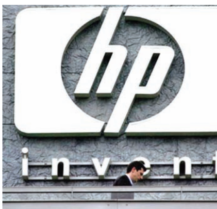
A man walks past the Hewlett-Packard logo at its French headquarters in Issy le Moulineaux, western Paris, in this on 16 Sept, 2005 file photograph.

WASHINGTON, 27 Aug — Hewlett-Packard Co (HPQ.N) is recalling about 6 million computer power cords after 29 reports of the cords melting or charring, the US Consumer Product Safety Commission said on Tuesday. The recalled item, the LS-15 AC power cord, was distributed with Hewlett-Packard and Compaq notebook and mini notebook computers and with AC adapter-powered accessories such as docking stations, the commission said in a statement.