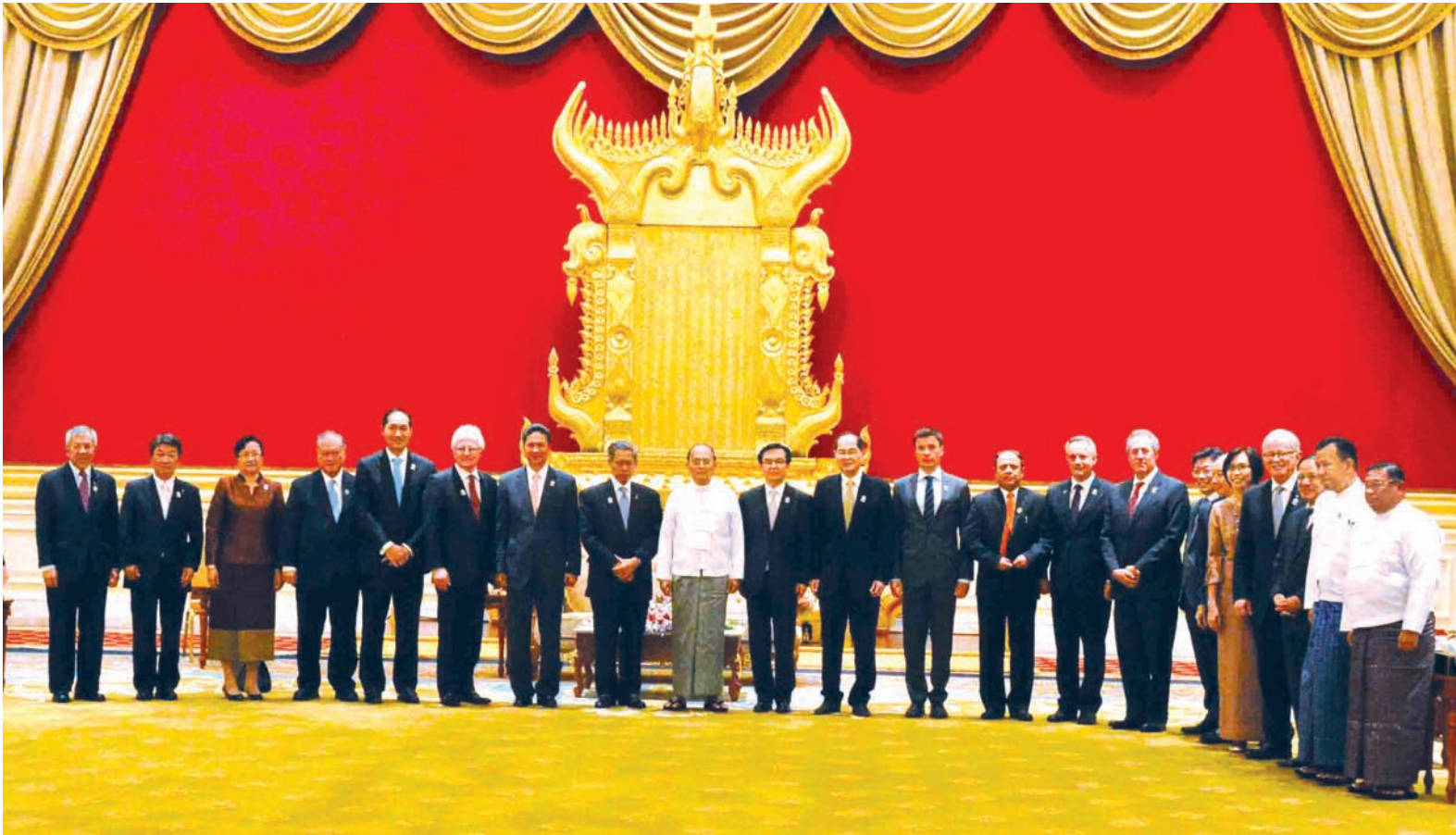
President U Thein Sein with economic ministers of East Asia and the secretary-general of the ASEAN who attended the 2 nd East Asia Summit in Nay Pyi Taw.

NAY PYI TAW, 27 Aug—President U Thein Sein received economic ministers of East Asia and the secretary-general