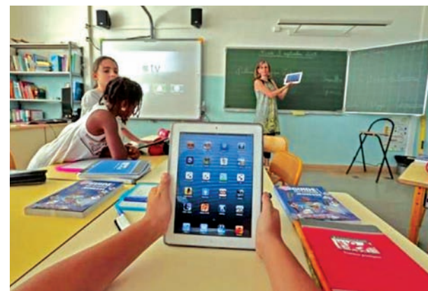
Elementary school children use electronic tablets on the first day of class in the new school year in Nice, on 3 Sept, 2013.

SAN FRANCISCO, 27 Aug — Apple Inc (AAPL.O) is preparing to roll out a larger, 12.9-inch version of its iPad for 2015, with production set to begin in the first quarter of next year, Bloomberg cited people with knowledge of the matter as saying on Tuesday.