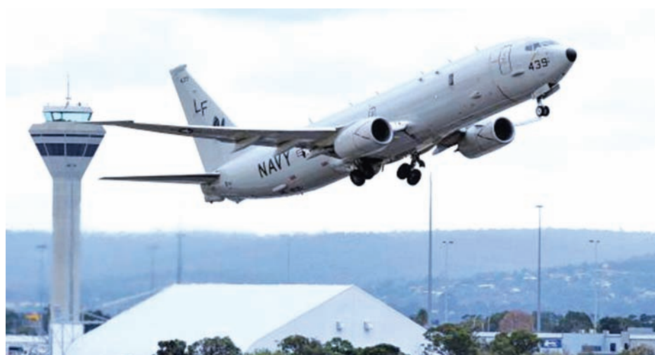
A US Navy P-8 Poseidon aircraft takes off from Perth International Airport in this 16 April, 2014 file photo.

The complaint concerned an 19 August encounter about 215 km (135 miles) east of China’s Hainan Island in which a Chinese fighter jet came within metres (yards) of a US P-8 Poseidon anti-submarine