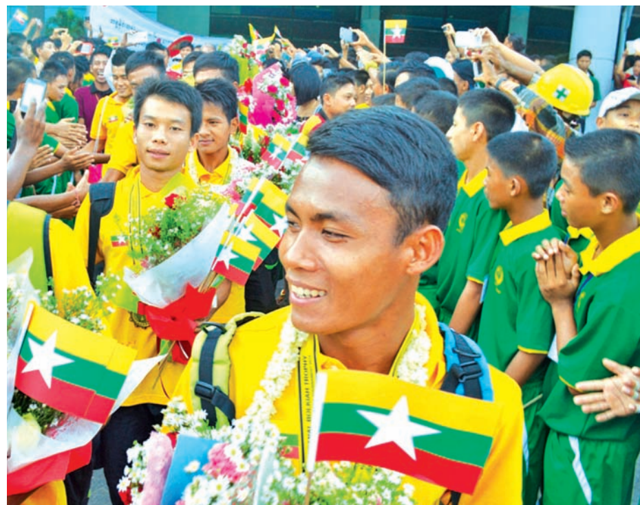
Victorious soccer players from Myanmar U-19 team being honoured by officials and fans at Yangon International Airport.