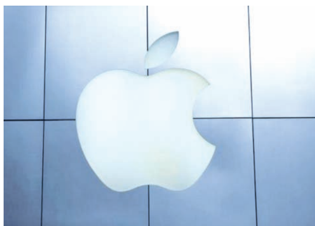
The Apple logo is pictured at its flagship retail store in San Francisco, California on 27 Jan, 2014.

Two supply chain sources said display panel production suffered a setback after the backlight that helps illuminate the screen had to be revised, putting screen assembly on hold for part of June and July. One said Apple, aiming for the thinnest phone possible, initially wanted to cut back to a single layer of backlight film, instead of the standard two layers, for the 4.7-inch screen, which went into mass production ahead of the 5.5-inch version.