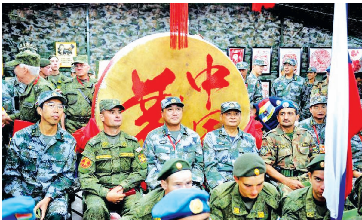
Wang Ning (3rd L), chief director of the anti-terror drill and deputy chief of the People’s Liberation Army (PLA) general staff, watch the performance of traditional Chinese art ahead of the Peace Mission-2014 anti-terror drill at the Zhurihe training base, north China’s Inner Mongolia Autonomous Region, on 23 Aug, 2014. The drill will be held from 24 Aug to 29 Aug among troops from China, Russia, Kazakhstan, Kyrgyzstan and Tajikistan. —XINHUA

In June, Iran unveiled a long-range radar system to enhance its air defence. The radar system, also dubbed Qadir , had a range of about 1,100 km and could monitor its surrounding radius round the clock and detect small three dimensional targets. —Xinhua