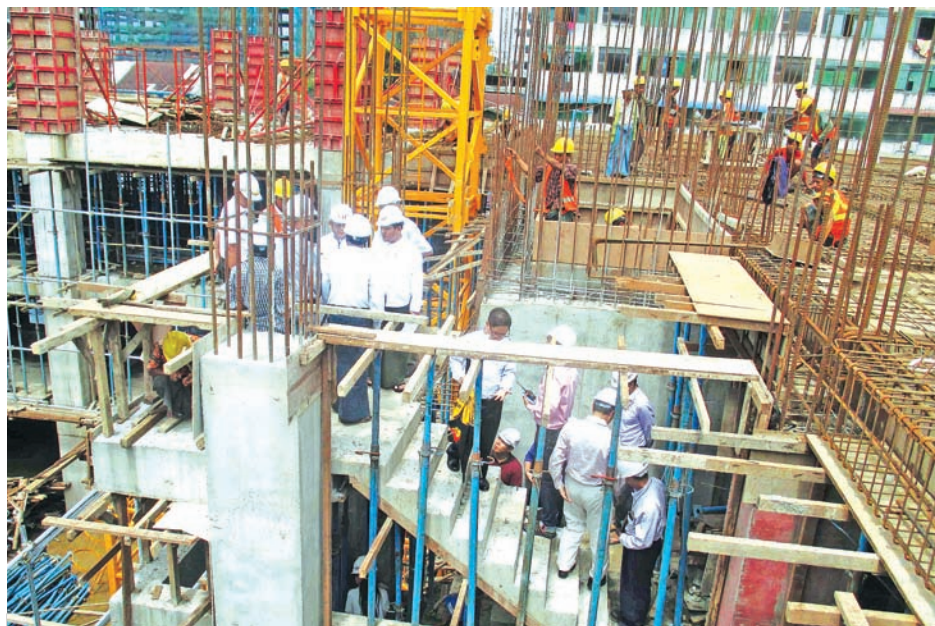
Deputy Minister for Construction Dr Win Myint inspects a housing project as Yangon demands more affordable apartments for increasing population.—MNA

also inspected construction tasks on 51st street in Botahtaung Township and Shwelon housing project in Bahan Township.—MNA