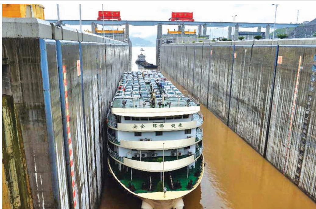
A vessel passes the five-level ship dock of the Three Gorges in Yichang, central China’s Hubei Province, on 23 Aug, 2014. The Three Gorges have risen its water level to meet with the flood season, which makes vessels to extend travel time by 40 minutes as they pass the five-level ship docks of the Three Gorges.

United declined to comment on the reports. — Reuters