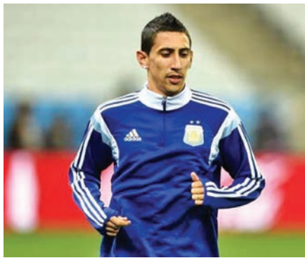
Argentina’s Angel di Maria

LONDON, 24 Aug — Manchester United are close to signing Real Madrid’s Argentina winger Angel Di Maria in a deal that is expected to smash the British transfer record, according to media reports.