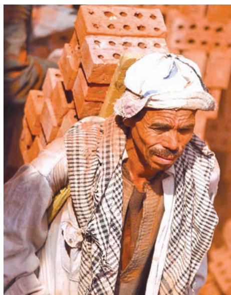
An Egyptian labourer works at a brick factory on the outskirts of Cairo, Egypt, on 8 Aug, 2014.

Shortly after the cabinet meeting, the CRC raised railway investment target for 2014 to 800 billion yuan and aimed to put over 6,600 kilometers of new lines into operation, mostly in the central and western regions.—Xinhua