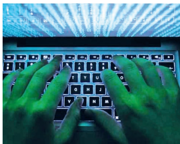
A man types on a computer keyboard in Warsaw in this on 28 Feb, 2013 illustration file picture.

BOSTON / WASHINGTON, 24 Aug — A cyber attack at a firm that performs background checks for US government employees compromised data of at least 25,000 workers, including some undercover investigators, and that number could rise, agency officials said on Friday.