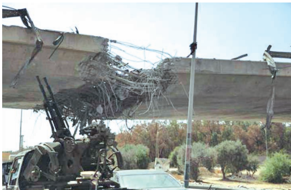
A general view of the damage of the 27th Bridge is seen along a road linking Tripoli and the western Libyan cities, near a former Libyan Army camp known as Camp 27 following clashes between rival militias in the 27 district, west of Tripoli, on 22 Aug. 2014.

Local television channel al-Nabaa said planes had attacked four Misrata positions. A Misrata