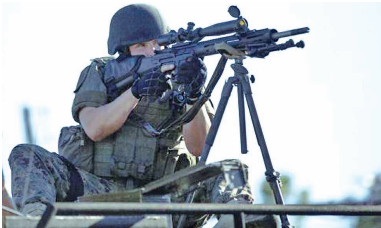
A riot police officer aims his weapon while demonstrators protest the shooting death of teenager Michael Brown, in Ferguson, Missouri in this file photo taken on 13 Aug, 2014.

EDGARTOWN MASS / WASHINGTON, 24 Aug. — US President Barack Obama has ordered a review of the distribution of military hardware to state and local police out of concern at how such equipment has been used