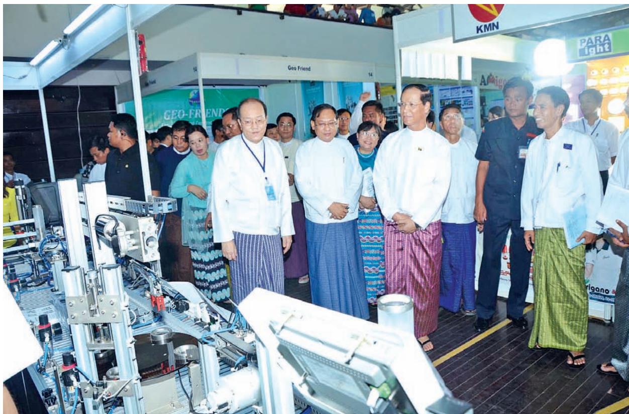
Vice President Dr Sai Mauk Kham views round machinery and equipment innovated by students and faculty members at Science Fair 2014 at Arts Hall of Yangon University.

Lectures on science and technology will be held at the Recreation Centre