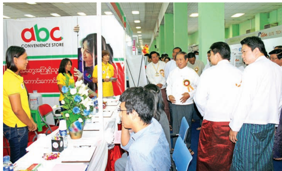
Union Minister U Aye Myint visits 5 th Myanmar Job Fair as creation of job opportunities for the people.—MNA

Yangon Mayor U Hla Myint also accepted K5 million worth water supply equipment provided by the company for development plans of YCDC in the city areas.—MNA