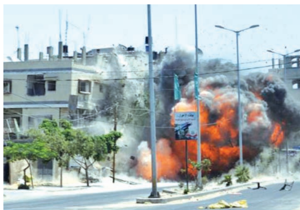
A view of what witnesses said was an explosion caused by an Israeli air strike on a house in Gaza City on 23 Aug. 2014.

GAZA / CAIRO, 24 Aug, — Egypt called on Israel and the Palestinians on Saturday to halt hostilities and resume peace talks, but both sides kept up attacks, including an Israeli air strike which destroyed a residential tower block in the centre of Gaza City.