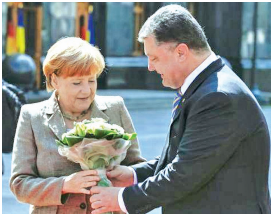
Ukraine's President Petro Poroshenko (R) greets Germany's Chancellor Angela Merkel in Kiev on 23 Aug, 2014.

KIEV, 24 Aug — German Chancellor Angela Merkel said on Saturday the standoff over Ukraine could be solved but only if control was tightened over the Ukraine-Russia border across which, the West alleges, Russia has been funnelling arms to help a separatist. Merkel was visiting Kiev as a prelude to a meeting next week between the Russian and Ukrainian leaders that diplomats say is the best chance in months of a peace deal in eastern Ukraine, where government forces are fighting pro-Moscow separatists.