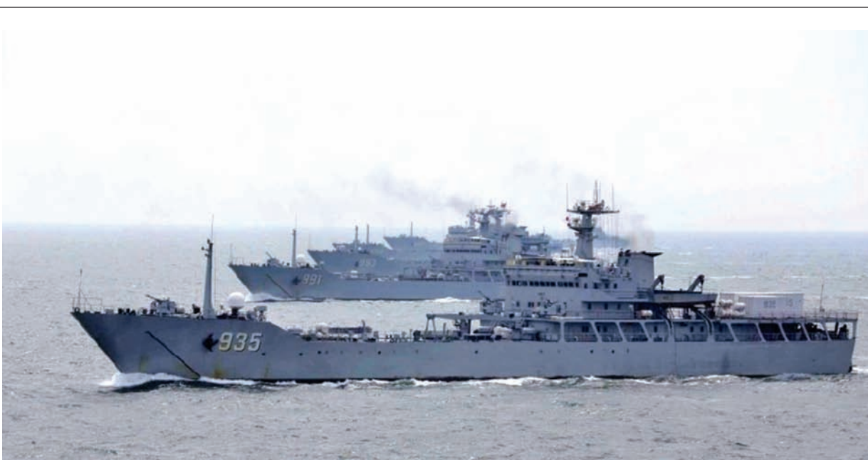
A Landing Ship Division of PLA South China Sea Fleet were conducting in full formation carrying troops for a training mission.

The second best-selling book on the list was "Love Letters" by Debbie Macomber, followed by James Rollins' "The 6th Extinction."