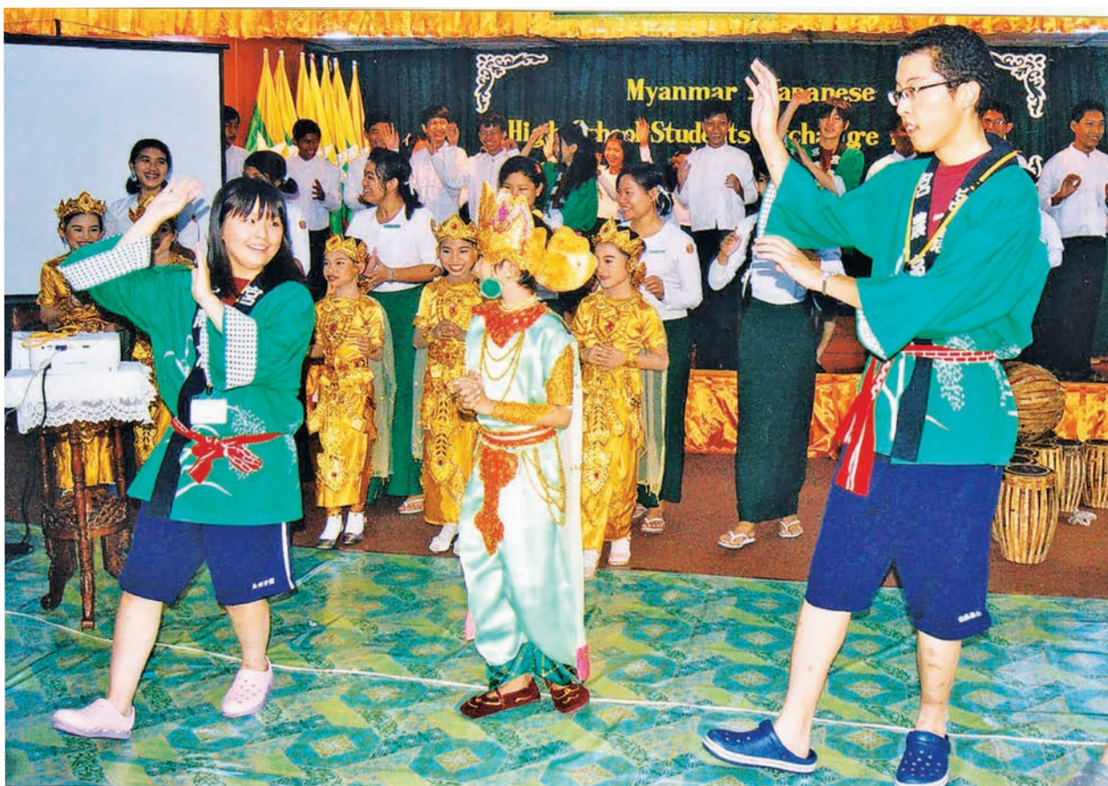
Two Japanese students dance for a Myanmar song together with Myanmar students during Myanmar-Japan High School Students Exchange Programme.