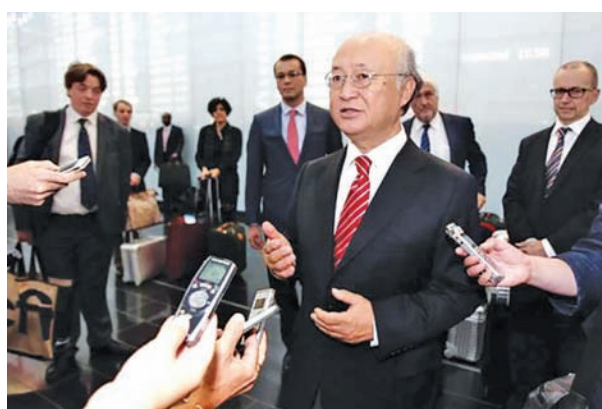
International Atomic Energy Agency (IAEA) Director General Yukiya Amano talks to the media as he arrives at Vienna’s airport on 18 Aug, 2014.

But slow-paced cooperation would tend to reinforce Western impressions that Iran is reluctant to give the IAEA the information and access to sites and peo-