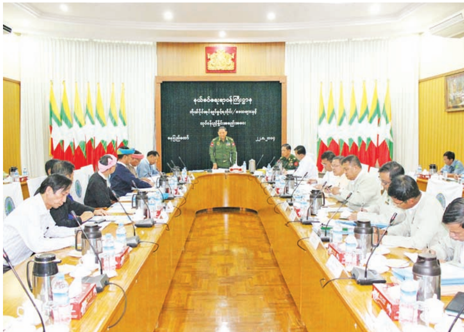
Coordination meeting held to undertake for border region development plans.—MNA