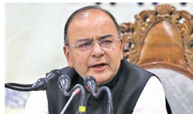
India’s new Finance and Defence Minister Arun Jaitley speaks during a news conference in Srinagar on 15 June, 2014.

“I am sensitive to these issues myself, no question of trivialising any incident,” he said after his comments sparked outrage including from the victim’s mother, who said politicians had a tendency to forget. Five men and a teenager lured the 23-year-old physiotherapist and a male friend into an unlicensed bus and repeatedly raped and tortured her. She