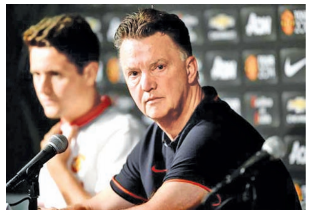
Manchester United head coach Louis Van Gaal

They have won their last three league games at Sunderland but were beaten 2-1 in last season’s League Cup semi-finals.—Reuters