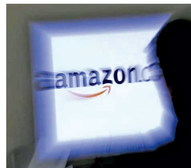
A zoomed illustration image of a man looking at a computer monitor showing the logo of Amazon is seen in Vienna on 26 Nov, 2012. — REUTERS

Amazon did not immediately respond to requests for comment. — Reuters