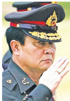
Prime Minister Prayuth Chan-ocha