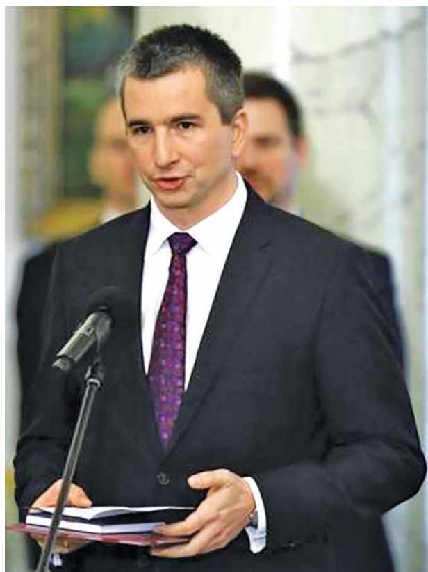
Mateusz Szczurek is being sworn in as Poland's new Finance Minister during a ceremony at the Presidential Palace in Warsaw on 17 Nov, 2013.

"If the conditions for using our strategy of 'keeping a foot in the door'