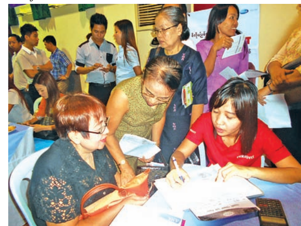
Shwe Yaung Hnin Si Cancer Foundation gives message that a healthy diet can stave off cancer.