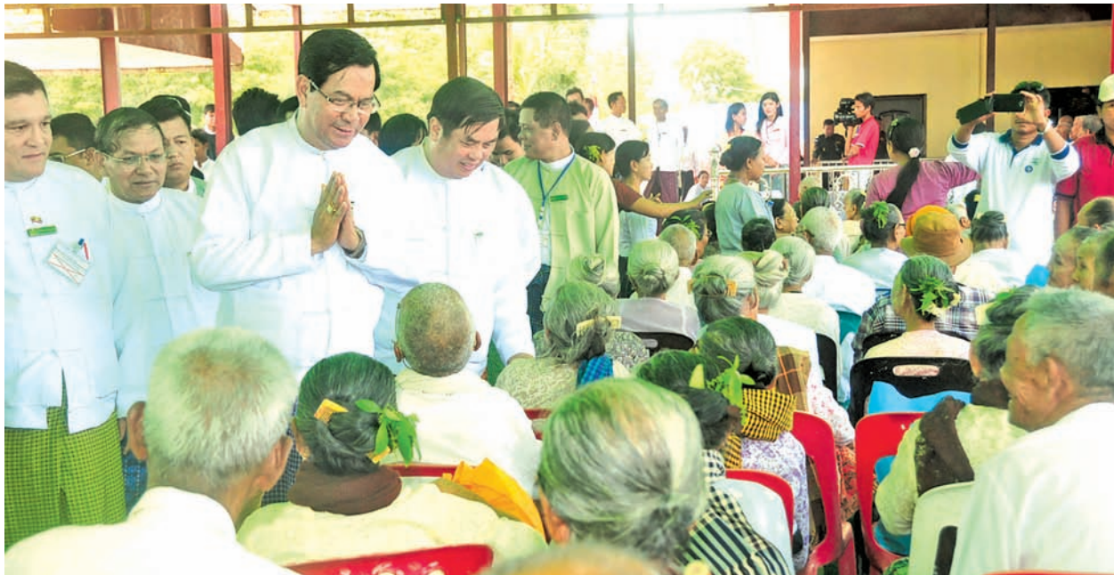
Union Minister U Hla Tun cordially greets village elders at respect-paying ceremony in Latpadaungtaung region.

NAY PYI TAW, 23 Aug — A respect-paying ceremony for the village elders aged 75 and over in nearby villages of Latpadaungtaung copper mining project was held at a hall of Latpaduang Taunggya Pagoda on Friday, attended by Union Minister at Pres-