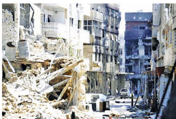
A general view shows damaged buildings in Mleiha, which lies on the edge of the eastern Ghouta region near Damascus airport on 15 August, 2014.

The report by her Geneva office was based on data from four rebel groups and the Syrian government. They were cross-checked