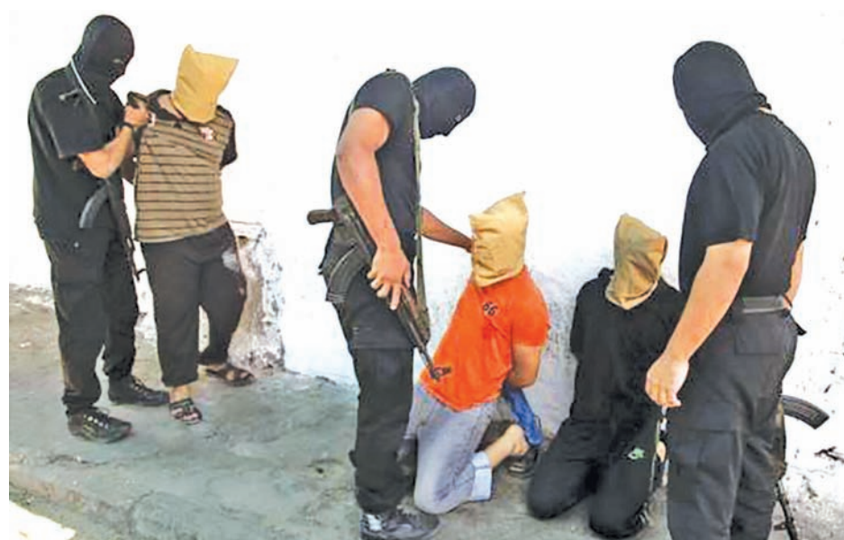
Hamas militants grab Palestinians suspected of collaborating with Israel, before executing them in Gaza City on 22 Aug, 2014.