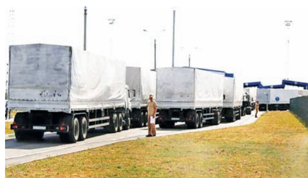
Trucks of a Russian convoy carrying humanitarian aid for Ukraine drive onto the territory of a Russia-Ukraine border crossing point "Donetsk" in Russia's Rostov Region, on 22 August, 2014.

Russian state television had earlier broadcast footage of some of the trucks being unloaded at a distribution depot in the city of Luhansk, eastern Ukraine. The city is held by separatist rebels who are encircled by Ukrain-