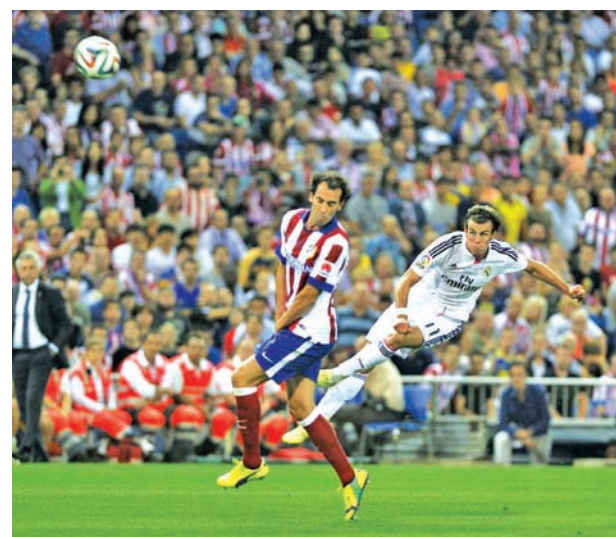
Real Madrid's Gareth Bale (R) shoots during their Spanish Super Cup match against Atletico Madrid at the Vicente Calderon Stadium in Madrid on 22 Aug, 2014.