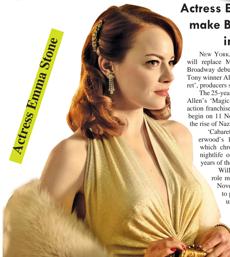
Actress Emma Stone

Williams has extended her run in the role made famous by Liza Minnelli to 9 November, and Cumming will continue to play the emcee at the Kit Kat Klub until 29 March. The revival of the 1998 Tony Award-winning production that opened on 24 April at Studio 54 has won rave reviews, with the Hollywood Reporter describing it as a "thrilling production, which is even sharper this time around."