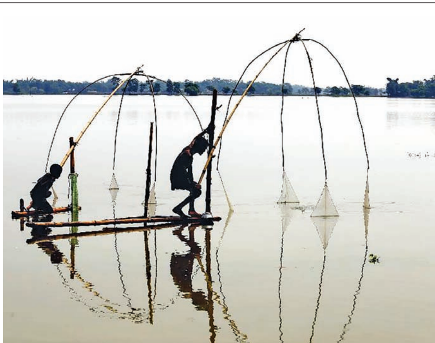
Two young boys try to catch fishes in a flooded field in the Morigaon district of India's northeastern state of Assam, India, on 22 Aug, 2014. Many parts of Assam are affected by flood.

ment and the people in Singapore. "There was an incident, there was a riot. It is unfortunate. We have investigated it. I think the causes have been established, the follow-up actions have to be taken," he said. "There are also legal consequences — the justice system has to follow up, rioters have to be brought to justice and punished. But I don't think it has changed the situation," he added. The rare riot in Little India in Singapore, involving some 300 South Asian workers, broke out in the evening after an Indian worker was killed in a traffic accident. No one else was killed but some officers were injured and vehicles burned. —Xinhua