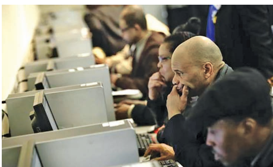
People use computers at a job fair in Detroit, Michigan on 1 March, 2014.

That is in part because as middle-skilled jobs dry up, those workers are more likely to seek lower-skilled jobs, boosting the pool of available labour and putting downward pressure on wages. "(W)hile computerization has strongly contributed to employment