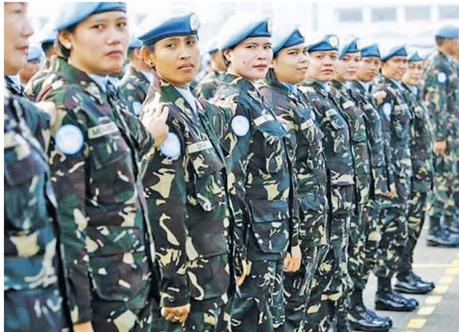
Female members of a Philippine peacekeeping force bound for Liberia stand at attention during a send-off ceremony at the military headquarters in Manila on 28 January, 2009.

MANILA, 23 Aug — The Philippines on Saturday ordered 115 troops to return home from peace-keeping operations in Liberia, spurred by a worsening Ebola epidemic in West Africa that has killed almost 1,500 people.