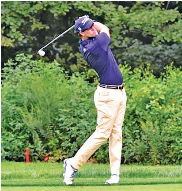
Adam Scott hits his second shot on the fourth hole during the second round of The Barclays golf tournament at Ridgewood Country Club.

PARAMUS, 23 Aug—Adam Scott used a run of four successive birdies on Friday to vault into a share of the halfway lead at The Barclays, and Rory McIlroy joined the fray at the