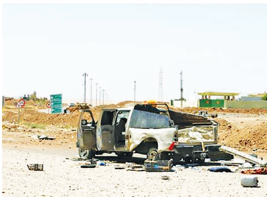
The wreckage of a car belonging to Islamic State militants lies along a road after it was targeted by a US air strike at Mosul Dam, northern Iraq on 21 Aug, 2014.

The Senate aide, who asked not to be identified, said additional funding for military operations over Iraq and Syria is likely to be one of a few unrelated spending matters Congress