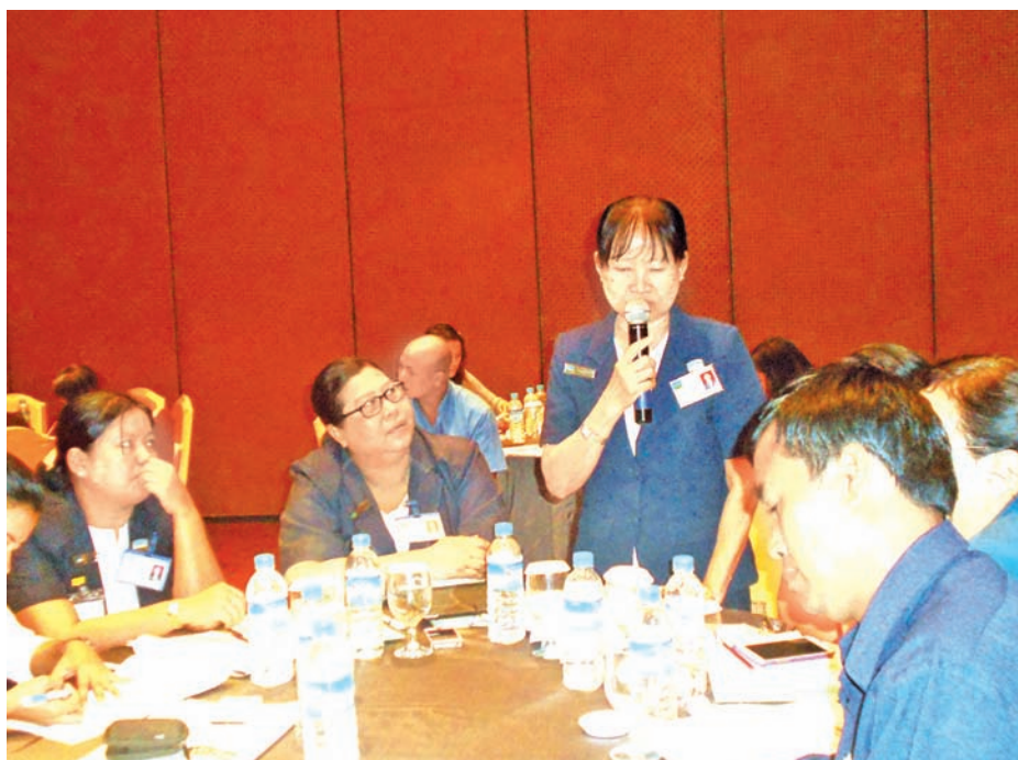
A participant from Yangon City Development Committee discusses improving health of people in sub-urban areas.