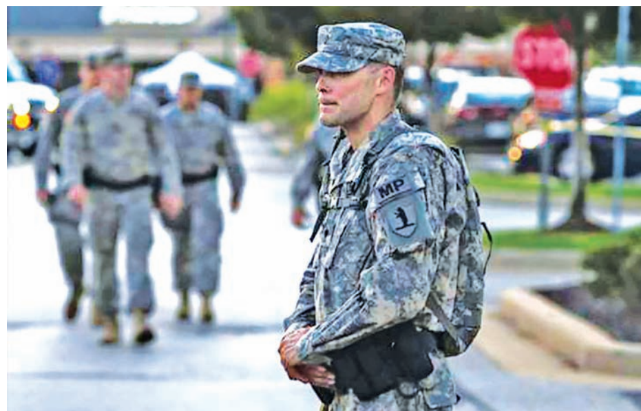
A member of the National Guard stands guard at a staging area inside a shopping centre parking lot in Ferguson, Missouri on 21 Aug, 2014.