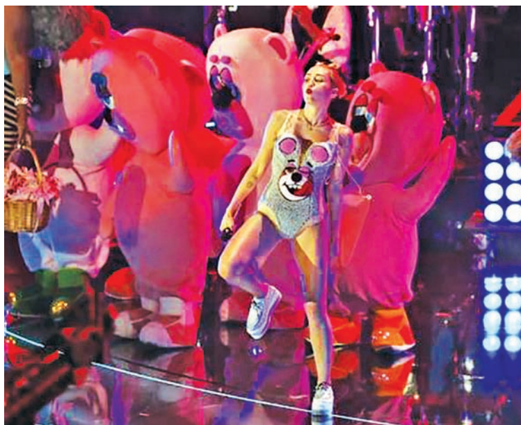
Singer Miley Cyrus performs "We Can't Stop" during the 2013 MTV Video Music Awards in New York on 25 Aug, 2013.

The actress is currently attached to the Sony pic 'Tupperware Unsealed' which revolves around the inventor of Tupperware. — PTI