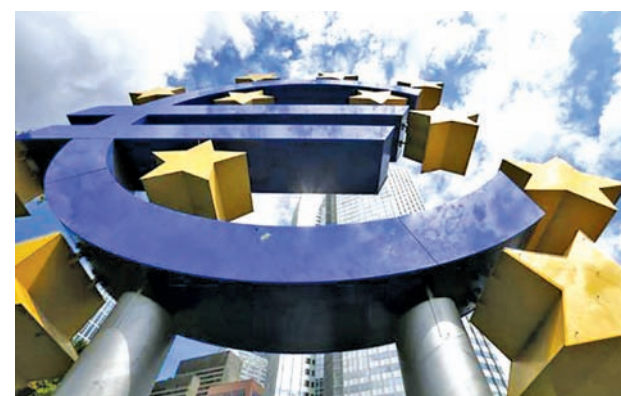
A huge euro logo is pictured next to the headquarters of the European Central Bank (ECB) before the bank’s monthly news conference in Frankfurt on 7 Aug, 2014.

These criteria could be included in the bloc’s new capital rules for insurers, and in new rules requiring banks to hold a buffer of bonds, including some debt backed by home loans, to withstand short-term shocks, it added.—Reuters