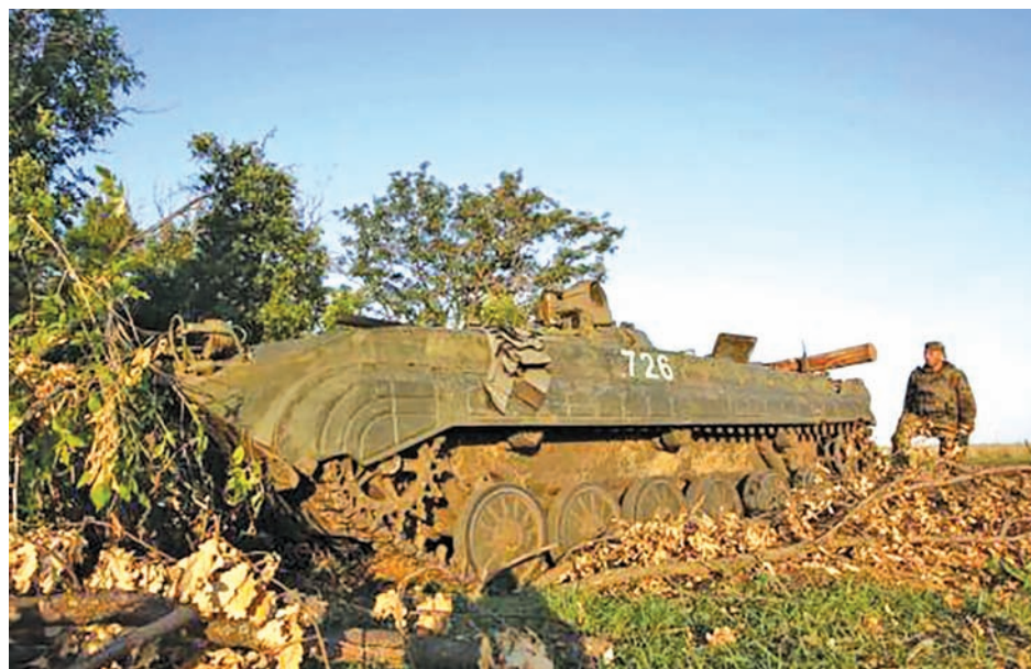
A Ukrainian serviceman stands near an armoured fighting vehicle at a military camp in Luhansk region on 21 Aug, 2014.

Angela Merkel is scheduled to visit Kiev on Saturday to show her support for Poroshenko — but diplomats say she is also bearing a message that he should consider calling a ceasefire so as not to incur a backlash from Putin.