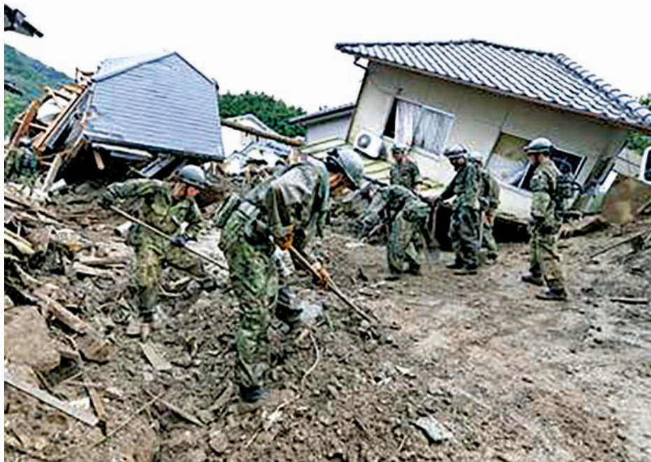
Japan's Self-Defence Forces personnel continue searching for missing people among debris in Asaminami Ward in the city of Hiroshima, western Japan, on 21 Aug, 2014, after deadly landslides hit the residential areas the previous day.

The disaster was triggered by torrential rain