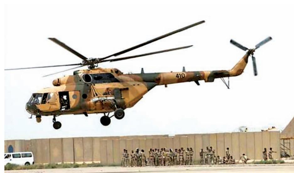
An Iraqi Air Force helicopter participates in a ceremony marking the 83rd anniversary of the founding of the Iraqi Air Force, in Nasiriyah city, south of Baghdad on 22 April, 2014.

"The F-16 s are not being delivered at this time