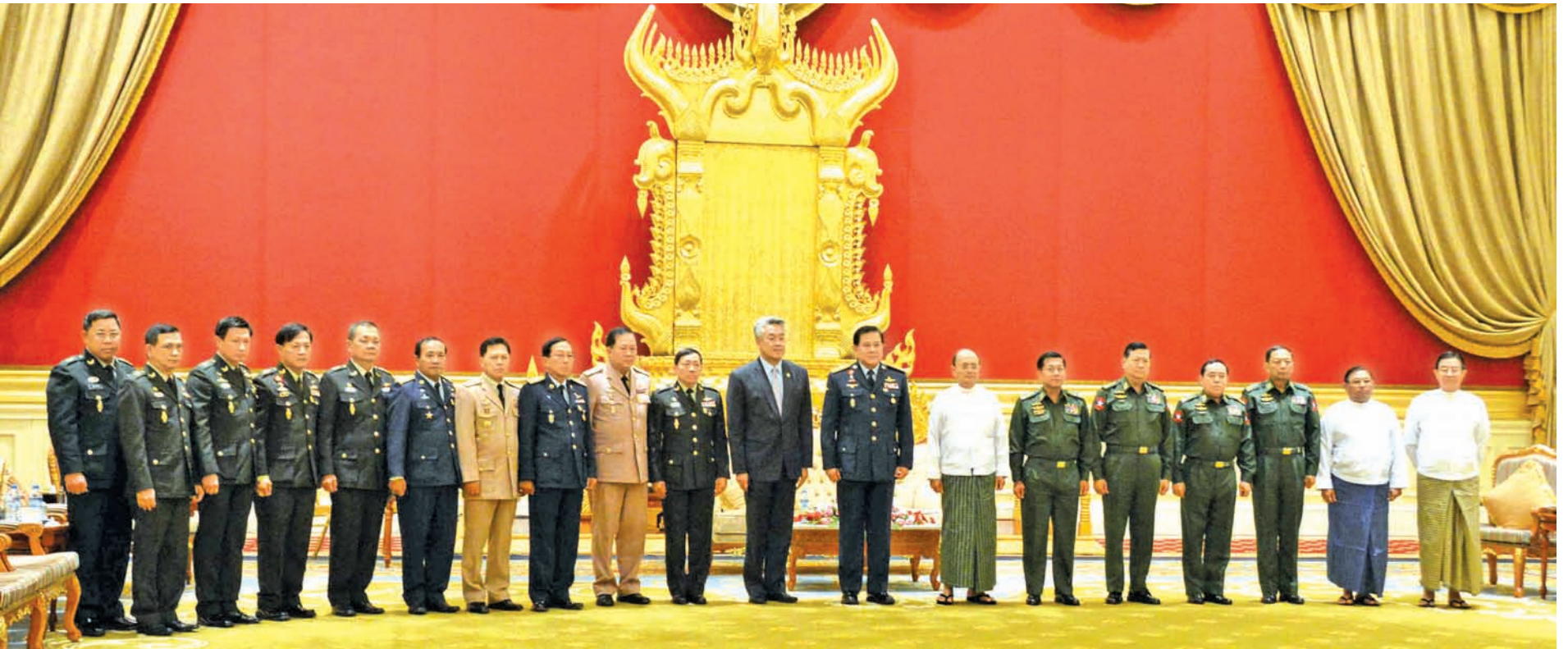
President U Thein Sein with Royal Thai Armed Forces General Tanasak Patimapragom before a meeting on cooperation in eradication of drugs and labour issues in Myanmar and Thailand aimed at maintaining bilateral relations.

NAY PYI TAW, 22 Aug—President of the Republic of the Union of Myanmar U Thein Sein held