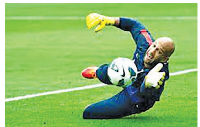
Tim Howard of the US gestures during their 2014 World Cup round of 16 game against Belgium at the Fonte Nova arena in Salvador on 1 July, 2014.

"It's the right decision at the right time. Jurgen has always been up front with all the players in saying you have to earn your place, which is something I agree with, so I look forward to