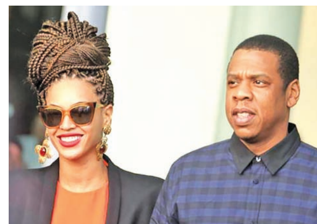
US singer Beyonce (L) and her husband rapper Jay-Z walk as they leave their hotel in Havana on 4 April, 2013.

Beyonce and Jay-Z celebrated their fifth wedding anniversary in Havana and were greeted by big crowds as they strolled through the Cuban capital. They were instantly recognized despite the past half-century of ideological conflict that