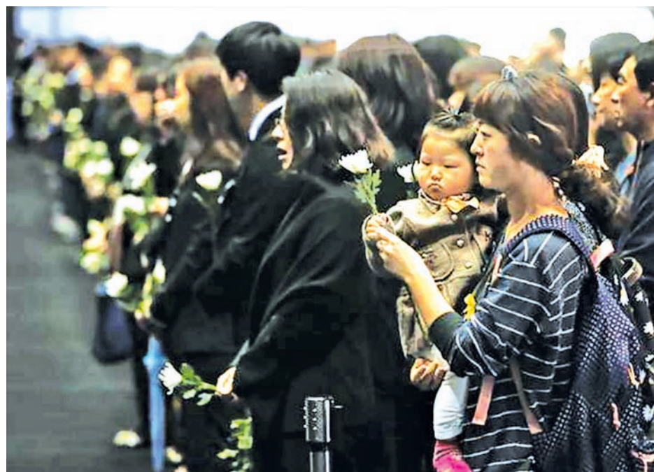
Mourners stand in line to pay tribute to victims of the sunken passenger ship Sewol , at the official memorial altar in Ansan on 30 April, 2014.

At Wednesday's meeting in Ansan, households overwhelmingly backed their initial position calling for an investigative committee, with 132 out of 176 voting to stick with that demand.