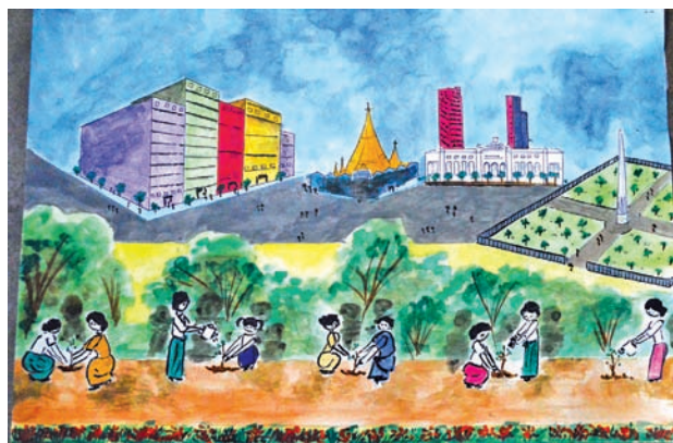
A prize-winning painting from the "Painting, Cartoon and Poster Contests 2014" organized by the Yangon City Development Committee.

YANGON, 22 Aug — The Yangon City Development Committee announced the winners of the Painting, Cartoon and Poster contests 2014.