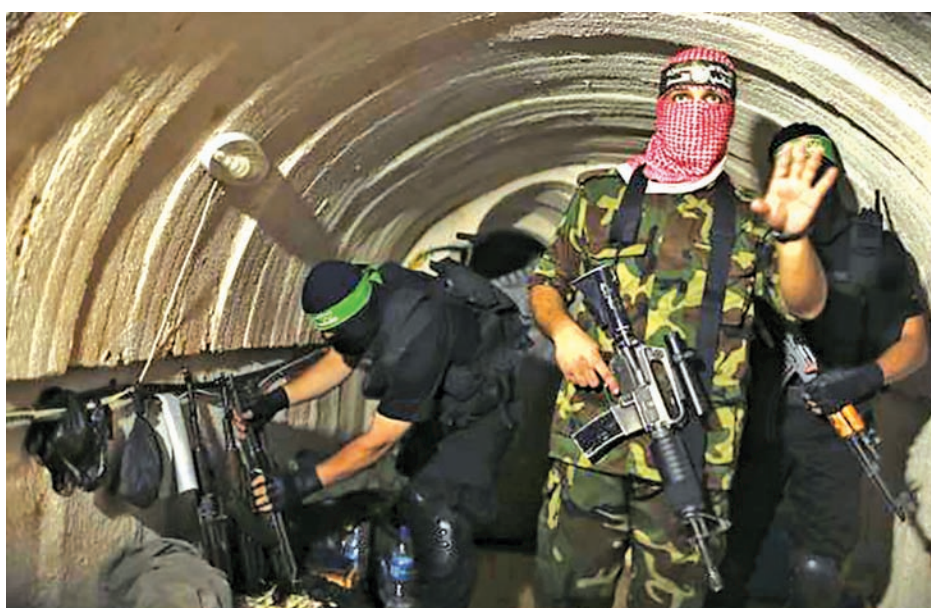
A Palestinian fighter from the Izz el-Deen al-Qassam Brigades, the armed wing of the Hamas movement, gestures inside an underground tunnel in Gaza on 18 Aug, 2014.

That has allowed transports of weapons, building materials, medicine and food to continue to and from the small, coastal territory that is subject to blockade by both Israel