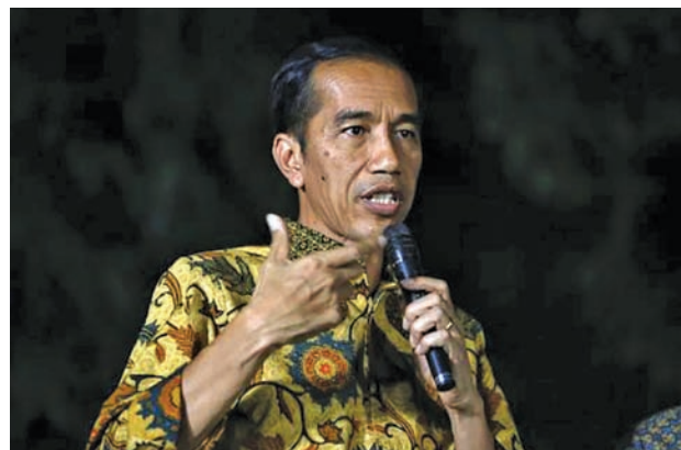
Indonesian president-elect Joko Widodo speaks to the media at a Press briefing in the garden of his home in Jakarta on 21 Aug, 2014.

The results of the election will come out next week.—Xinhua