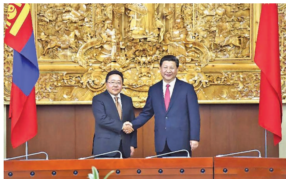
Chinese President Xi Jinping (R) holds talks with his Mongolian counterpart Tsakhiagiin Elbegdorj in Ulan Bator, Mongolia, on 21 Aug, 2014. Xi arrived in Ulan Bator Thursday for a two-day state visit to Mongolia.

Between 1990 and 2012, a total of 11,642 foreign enterprises registered