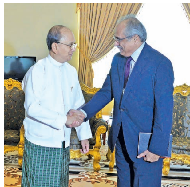
President U Thein Sein and Mr Vijay Nambiar, the United Nations Secretary-General's Special Adviser on Myanmar after discussions about the peace process, press freedom, poverty reduction and developments in Rakhine State.

NAY PYI TAW, 22 Aug — The 4-Monthly Meeting of the Union Government concluded at the Presidential Palace in Nay Pyi Taw on Friday morning after officials deliberated for three days on the country's reform process.