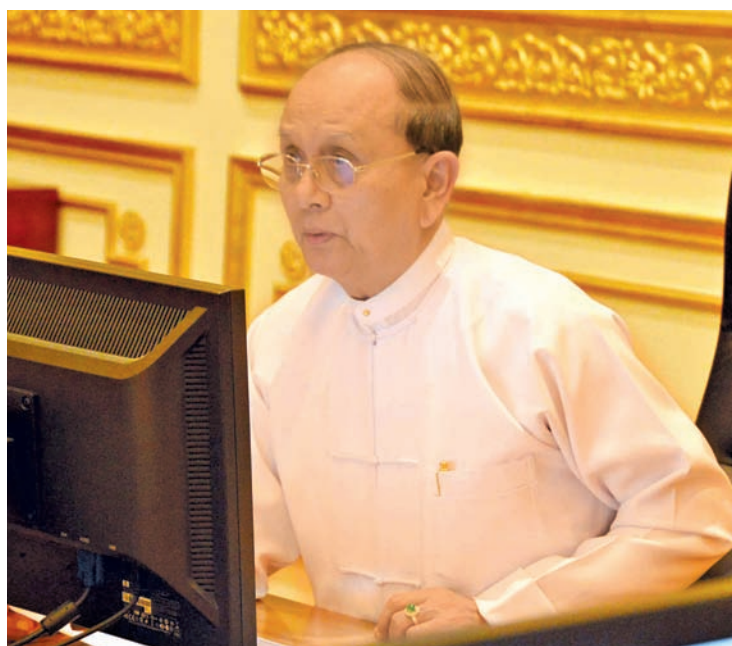
President U Thein Sein highlights reform process, narcotic drug eradication, use of farmland, affordable housing and job creation at 4-Monthly Meeting of Union Government that concluded on Friday.