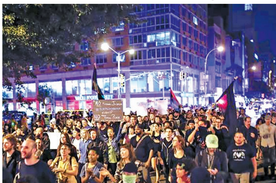
Protesters walk through the street during a march in support of the protests against the killing of unarmed black teenager Michael Brown in Ferguson, Missouri, in Manhattan, New York on 20 Aug, 2014.

Although Ferguson is predominantly African American, its political leadership, police department