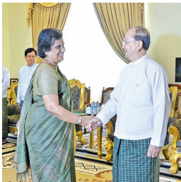
President U Thein Sein welcomes former Sri Lankan President Chandrika Kumaratunga for talks on internal developments.—MNA

(from page 1) migrant workers in Thailand and establishment of economic zones in Mae Sai and Mae Sot of Thailand, establishment of factories and workshops for development of border regions, implementation of the Dawei Special Economic Zone project, and cooperation in the eradication of drugs, among other topics.