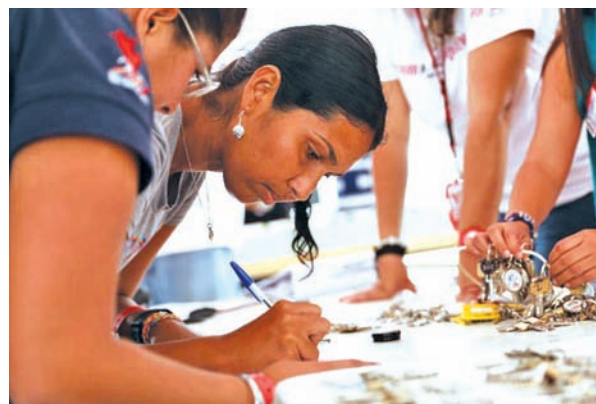
People sign a document during the key delivery of the Hugo Chavez housing complex, in Playa Grande, Vargas State, Venezuela, on 21 Aug, 2014. More than 500 families received on Thursday the keys to their new dwellings by the government's "Great Mission Housing Venezuela".

Managing Director Myanma Railways Ministry of Rail Transportation