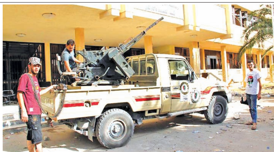
Islamist fighters are seen near Tripoli's airport highway, in Libya, on 21 Aug, 2014. The Islamist militants and pro-secular militiamen constantly pounded each other's strongholds in Libya's capital city of Tripoli since 13 July. The clashes between the rival militants have left at least 102 people dead and 452 others wounded.