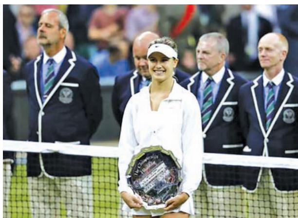
Eugenie Bouchard of Canada holds the runner-up trophy after being defeated by Petra Kvitova of the Czech Republic in their women's singles final tennis match at the Wimbledon Tennis Championships, in London on 5 July, 2014.

Those results touched off a bout of tennis fever in their hockey mad homeland and installed both as cornerstones around which the next tennis generation will be built.