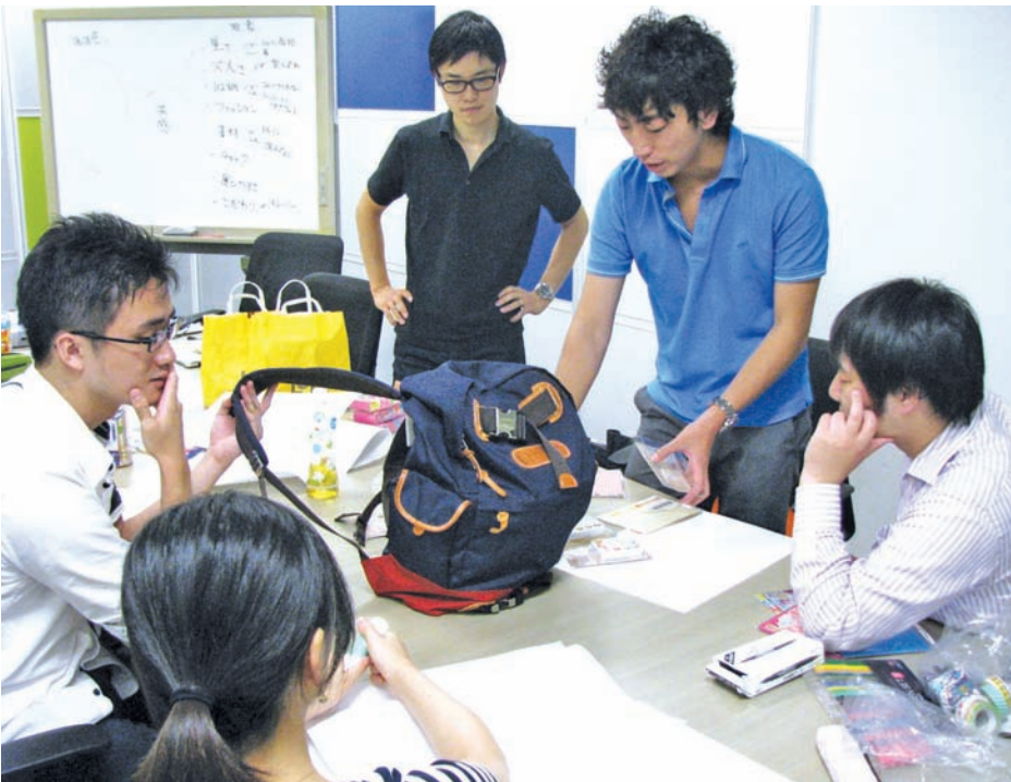
Japanese youths who will visit Myanmar in September to help create a country souvenir in collaboration with local students, take part in an orientation course in Saitama, near Tokyo, on Aug. 10, 2014. They were conducting a workshop to produce prototype bags that meet the needs of travellers.