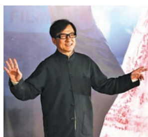
Hong Kong actor Jackie Chan poses on the red carpet during the 33rd Hong Kong Film Awards on 13 April, 2014.

BEIJING, 22 Aug — Kungfu movie star Jackie Chan offered the public a "deep bow of apology" after his son, actor, singer and socialite Jaycee, was arrested in Beijing for drug use.