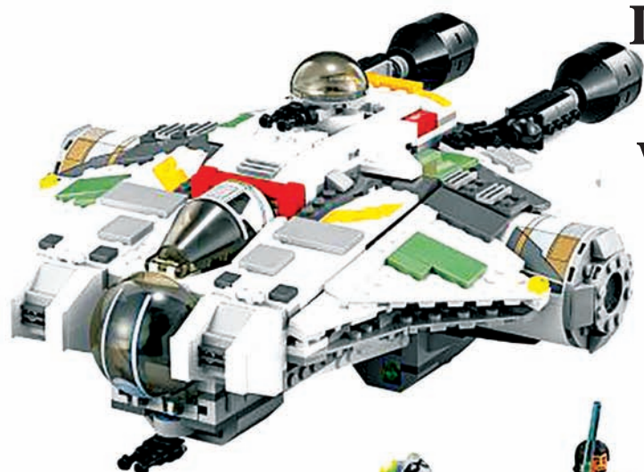
A "Star Wars" Lego set called "The Ghost" starship is shown in this publicity photo released to Reuters on 21 Aug, 2014.