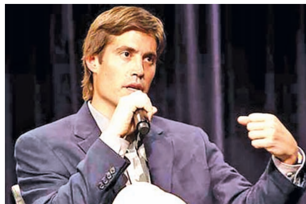
US journalist James Foley speaks at Northwestern University's Medill School of Journalism, Media, Integrated Marketing Communications in Evanston, Illinois, after being released from imprisonment in Libya, in this 2011 handout photo provided by Northwestern University.

LONDON / BAGHDAD, 22 Aug — A British Muslim leader called for action on