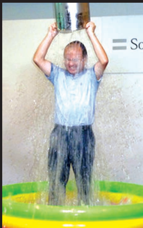
Masayoshi Son, chairman and chief executive officer of Softbank Corp, a Japanese telecommunications and Internet company, pours a bucket of iced water over himself at the company's headquarters in Tokyo's Minato Ward on 20 Aug, 2014. Son joined a charity event gaining popularity among US celebrities to increase awareness of amyotrophic lateral sclerosis, a disease known as ALS, by pouring iced water onto themselves and posting videos of it on social networking sites.