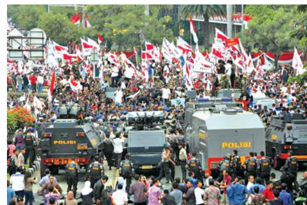
Indonesian police block supporters of presidential candidate Prabowo Subianto from reaching the Constitutional Court in Jakarta on 21 Aug, 2014.

"We will respect the court's decision because it is final and binding," Tantowi Yahya told Reuters .