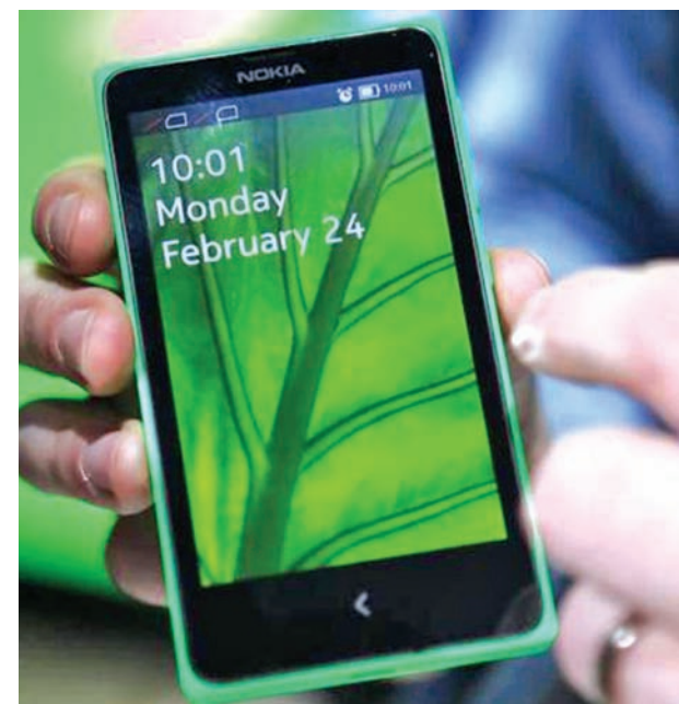
The Nokia X is seen at its unveiling at the Mobile World Congress in Barcelona, on 24 Feb, 2014.

The deal will be profitable from the start, he added. —Reuters