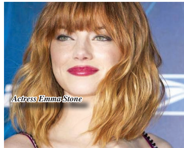
Actress Emma Stone

မြန်မာ့မီးရထား ရထားပို့ဆောင်ရေးဝန်ကြီးဌာန