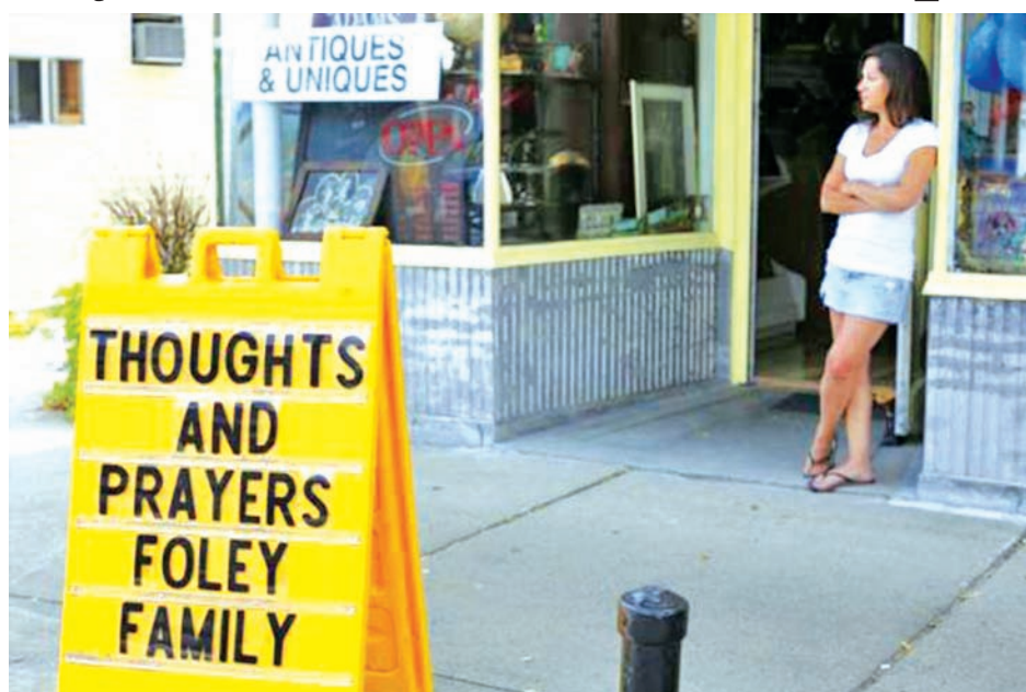
A sign outside a shop remembers James Foley in his hometown of Rochester, New Hampshire on 20 Aug, 2014.

exactly when the operation took place but said it was not in the last couple of weeks.