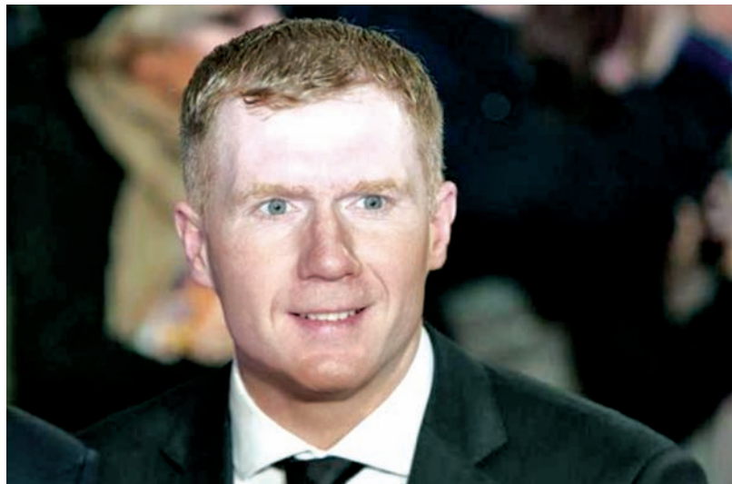
Soccer player Paul Scholes attends the world premiere of the film "The Class of 92" in London on 1 Dec, 2013.

LONDON, 21 Aug — Manchester United great Paul Scholes has said he is scared about the club's future and believes they could spiral into decline in the same way rivals Liverpool did in the 1990s.