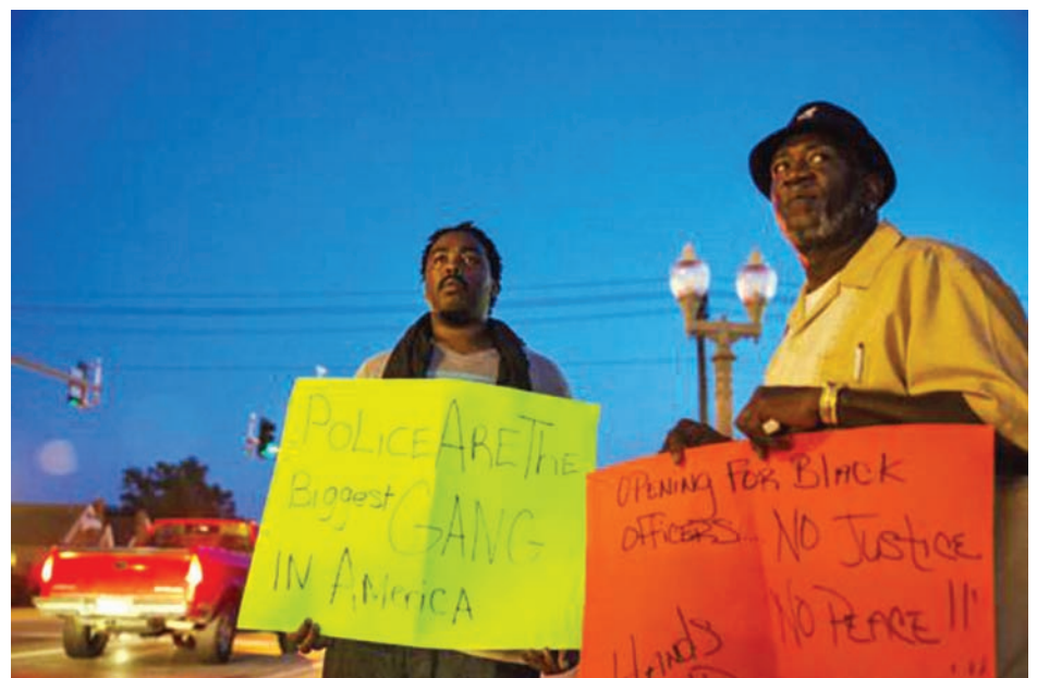
Demonstrators protesting against the shooting of Michael Brown, stand at the scene where St Louis metropolitan police shot and killed a man wielding a knife, in the St Louis area on 19 Aug, 2014.

violations of federal, criminal civil rights statutes," he said. The Justice Department is seeking specifically to determine whether federal prosecutors can bring criminal charges against Darren Wilson, the police