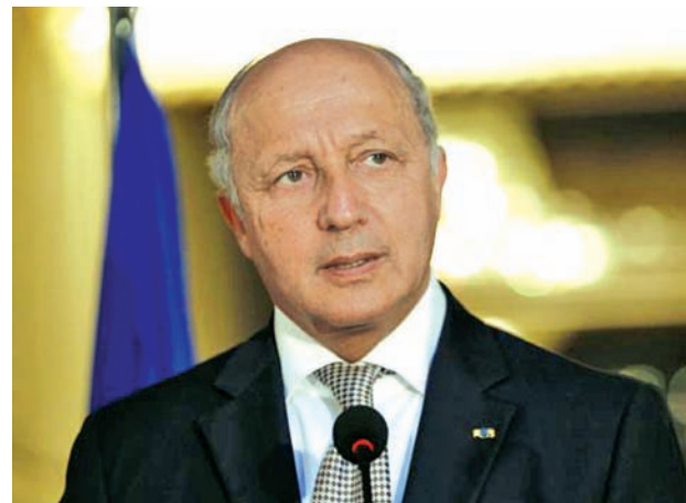
French Foreign Affairs Minister Laurent Fabius speaks during a news conference with Iraq's Deputy Prime Minister for Energy Hussain al-Shahristani in Baghdad, on 10 Aug, 2014.

France, which has close ties with Iraq's Kurdish regional government, started delivering weapons