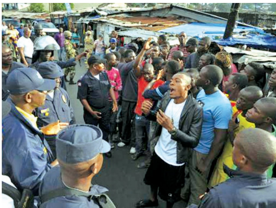
Members of Liberian security forces talk with a protester after clashes at West Point neighbourhood in Monrovia 20 Aug, 2014.

The epidemic of the hemorrhagic fever, which can kill up to 90 percent of