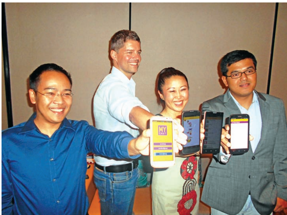
Responsible persons from MySQUAR demonstrate the new mobile messaging app.

YANGON, 21 Aug—MySQUAR, the first local-language content platform, will launch its free mobile messaging application for Myanmar on 27 August, aimed at providing better service to customer by offering world class consumer technology solutions, according to an official of the company.