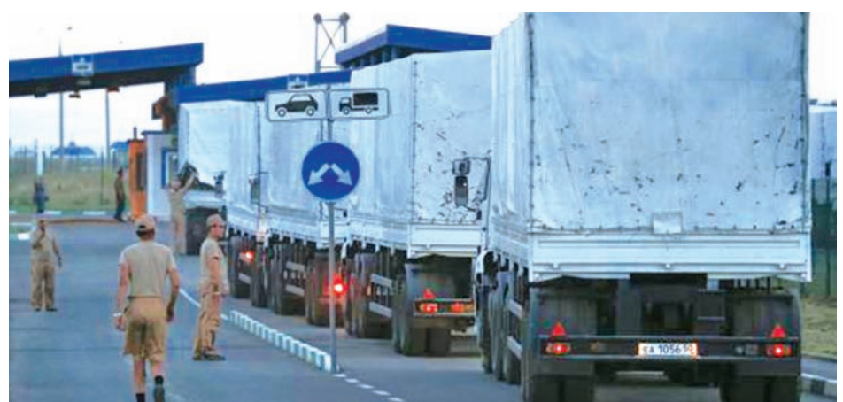
A Russian convoy carrying humanitarian aid for Ukraine enters border crossing point Donetsk for customs control, in Russia's Rostov Region, on 20 Aug, 2014.