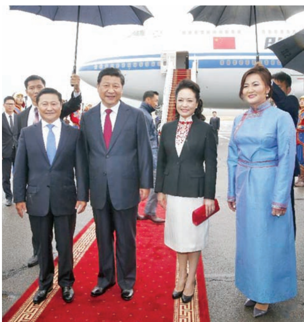
Chinese President Xi Jinping and his wife Peng Liyuan are greeted by Mongolian Prime Minister Norov Altankhuyag and his wife at the airport in Ulan Bator, Mongolia, on 21 Aug, 2014.

"I hope to take this visit as an important opportunity