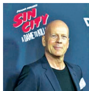
Cast member Bruce Willis poses at the premiere of "Sin City: A Dame to Kill For" in Hollywood, Cali- fornia 19 Aug, 2014.

"I like that (Dwight) is so multi-faceted," Bro-