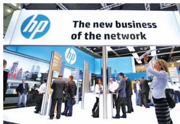
A visitor takes a photo with a tablet in front of a Hewlett-Packard (HP) stand at the Mobile World Congress in Barcelona, on 27 Feb, 2014.