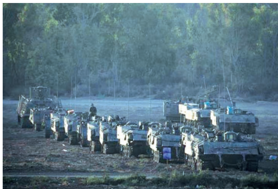
An Israeli soldier sits atop an armoured personnel carrier (APC) near the border with the Gaza Strip on 20 Aug, 2014.

Egyptian-mediated talks to end weeks of deadly fighting between Israel, Hamas and other militant groups in Gaza collapsed on Tuesday when violence broke out after ten days of relative calm.