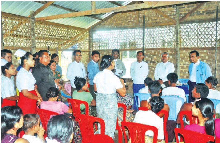
Deputy Minister for Health Dr Win Myint with staff in relief camp in Sittway, inspecting facilities and hearing reports on living standard.

NAY PYI TAW, 21 Aug—Deputy Minister for Health Dr Win Myint looked into health care services being provided to local people at the dispensary of Hsalyoekya relief camp in Sittway of Rakhine State on 14 August.