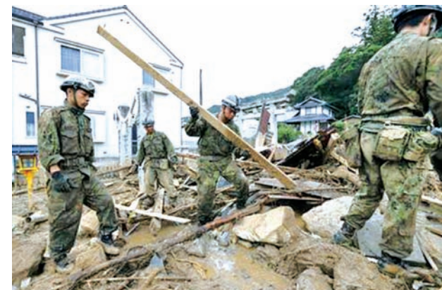
Japan's Self-Defence Forces personnel continue searching for missing people among debris in Asakami Ward in the city of Hiroshima, western Japan, on 21 Aug, 2014, after deadly landslides hit the residential areas the previous day. — KYODO NEWS

HIROSHIMA, 21 Aug — A total of 39 people were confirmed dead and seven remain missing on Wednesday after a series of landslides and flooding triggered by torrential rain overnight engulfed residential areas in Hiroshima, western Japan.