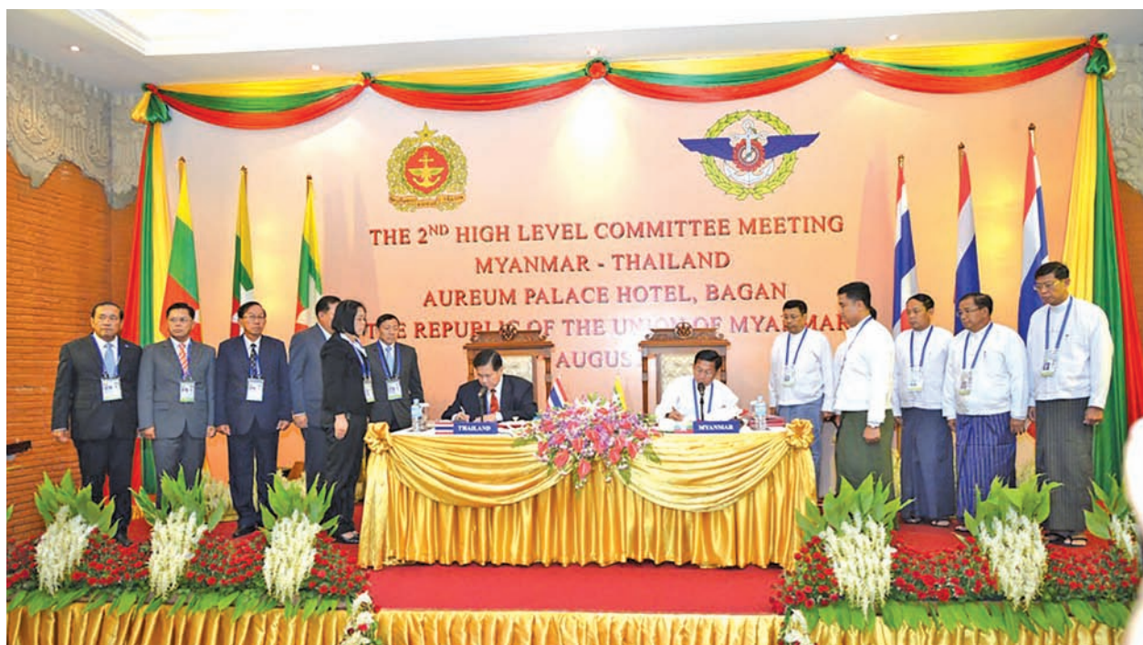
Thai General Tanasak Patimapragorn and Senior General Min Aung Hlaing sign agreement for strengthening friendly ties between Thailand and Myanmar.

NAY PYI TAW, 21 Aug — The relationship between the two armed forces of Myanmar and Thailand has improved unprecedentedly given the long tradition of relations between the two neighbours, Senior General Min Aung Hlaing told the second High Level Committee Meeting at Aureum Palace Hotel in Bagan on Thursday morning.