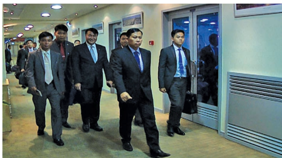
During his recent trip to Moscow, Vice-Senior General Soe Win visited a number of projects of interest for Myanmar and held talks with Myanmar students.

NAY PYI TAW, 21 Aug — During his tour of the Russian Federation, Deputy Commander-in-Chief of Defence Services and Commander-in-Chief