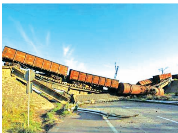
Train wagons are seen on the destroyed railway bridge which collapsed during the fighting between the Ukrainian army and pro-Russian separatists, over a main road leading to the eastern Ukrainian city of Donetsk, near the village of Novobakhmutivka, north of Donetsk city on 19 Aug, 2014.

"The Ukrainian army or whoever they are — they're bombing us again. I've lived in the apartment building my entire life and now they want to take everything I have. There is