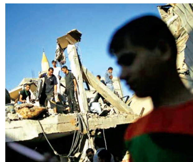
Palestinians remove belongings from a house that witnesses said was destroyed during an Israeli air strike in the northern Gaza Strip on 21 Aug, 2014.

A military spokeswoman said aircraft carried out 20 assaults in Gaza on Thursday, but gave no further details. Late on Tuesday Israel targeted Hamas’s top military commander, Mohammed Deif, but failed to kill him. Deif’s wife and seven-month-old son were killed in the air strike, Hamas said.