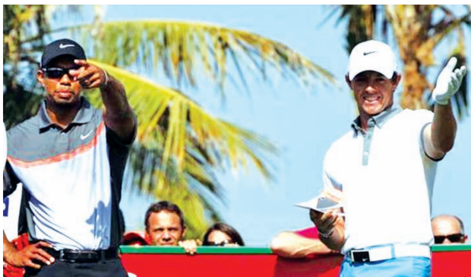
Tiger Woods of the US and Rory McIlroy of Northern Ireland gesture as they prepare to take their tee shots on 2nd hole during the first round of the 2014 Omega Dubai Desert Classic in Dubai on 30 Jan, 2014.

McIlroy said he shares the ultra-competitiveness of Woods, though he restricts it to golf and prefers