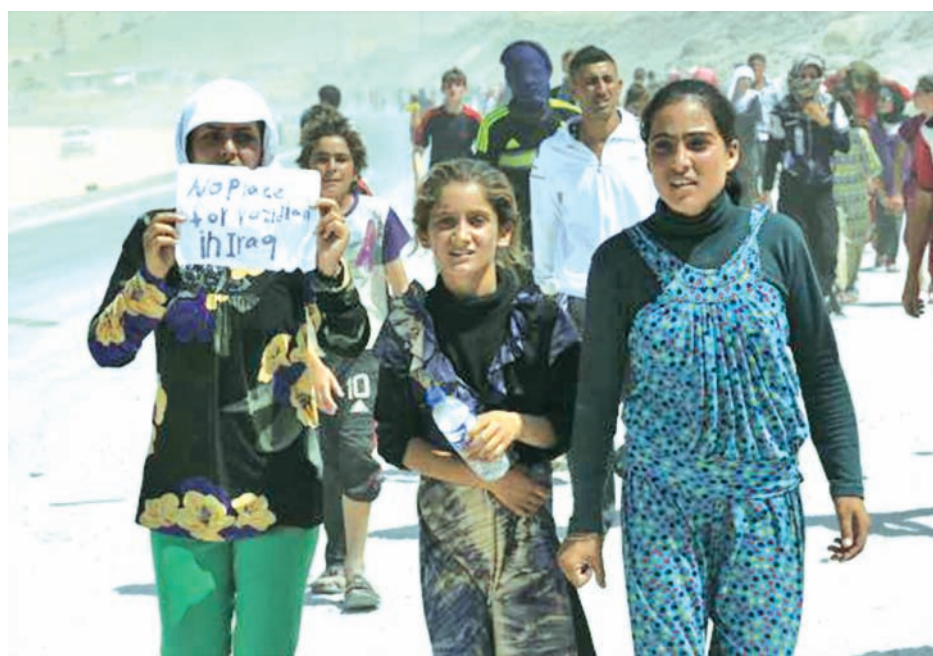
Displaced people from the minority Yazidi sect, who fled the violence in the Iraqi town of Sinjar, march in a demonstration at the Iraqi-Turkish border crossing in Zakho district of the Dohuk Governorate of the Iraqi Kurdistan Province on 17 Aug, 2014.

"The failure of the Mosul Dam could threaten