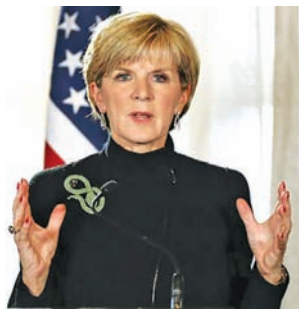
Australian Foreign Minister Julie Bishop

SYDNEY, 19 Aug — Australia and Indonesia have agreed to resume intelligence and military cooperation, officials from both countries said on Tuesday, ending a rift that erupted late last year over Australian spying.