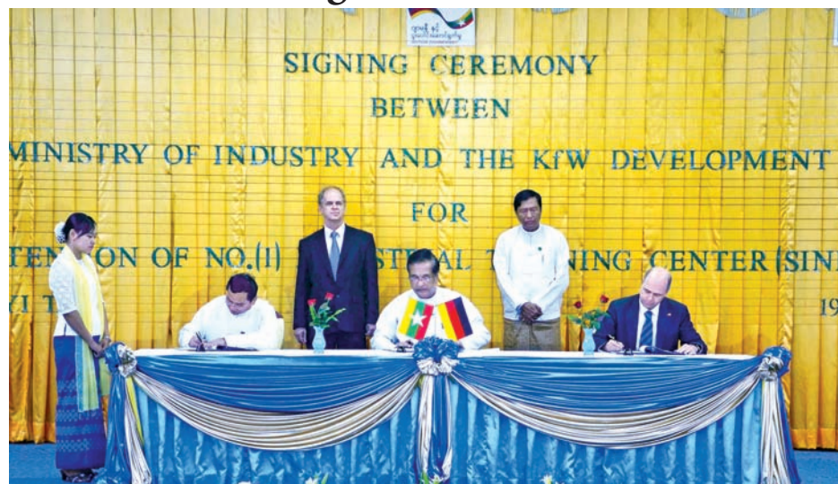
Officials sign agreement to upgrade No 1 Industrial Training School (Hsinde) and other development projects that will be implemented with the support of KfW Development Bank of Germany.—MNA

NAY PYI TAW, 19 Aug—The Ministry of Industry signed an agreement with Germany's KfW Development Bank in Nay Pyi Taw on Tuesday to upgrade No 1 Industrial Training School in Hsinde and other development projects at the school.