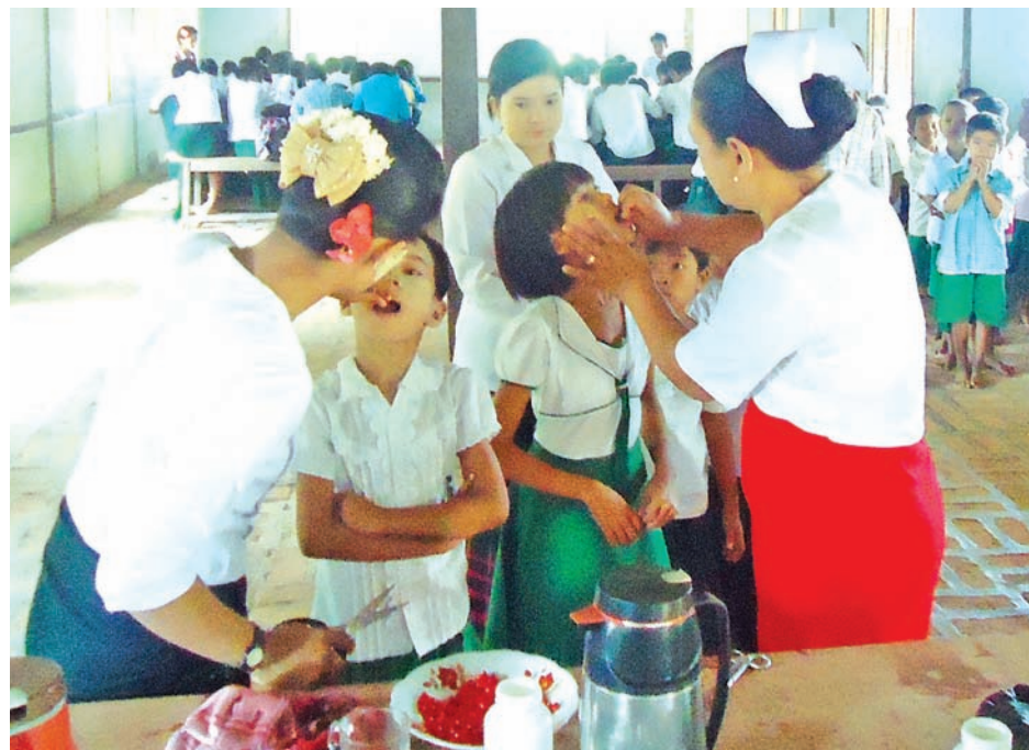
NAY PYI TAW, 19 Aug — The Nay Pyi Taw Ma-

According to officials, the construction cost K9.5 million and was mainly funded by private donors.— Hla Win (IPRD)