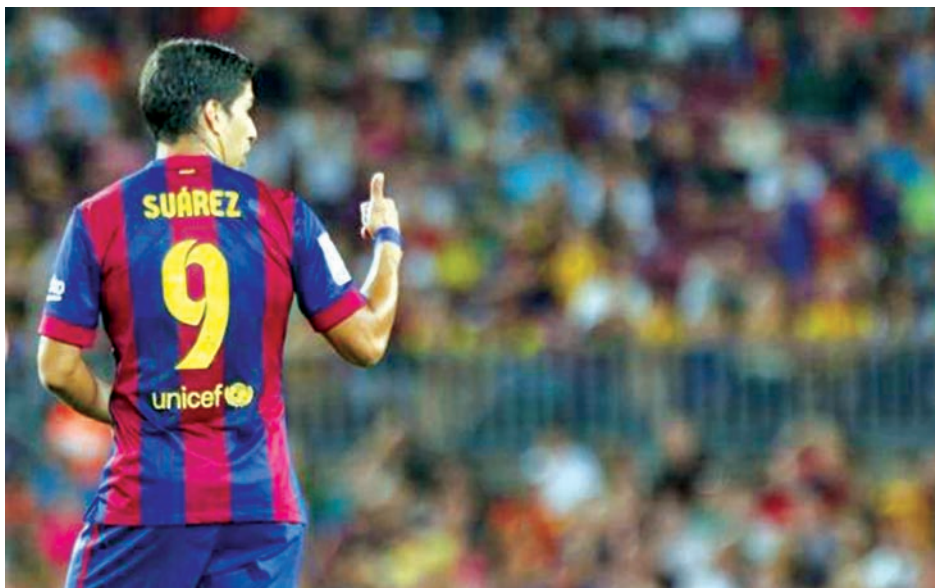
Barcelona's player Luis Suarez gestures to his coach Luis Enrique during the Joan Gamper Trophy soccer match against Mexico's Club Leon at Nou Camp stadium in Barcelona on 18 Aug, 2014.

BARCELONA, 19 Aug — Luis Suarez made his first appearance following his biting controversy for new side Barcelona and Neymar scored twice as the Spanish giants beat Mexican side Leon 6-0 in a pre-season friendly on Monday.