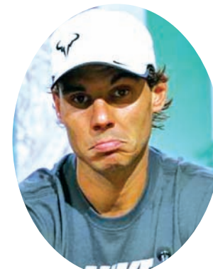
Rafael Nadal of Spain

Despite missing the entire North American hardcourt campaign, Na-