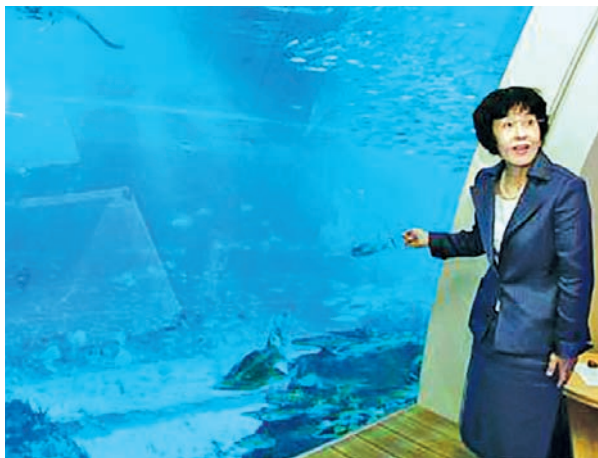
Harumi Takahashi, governor of Hokkaido, Japan’s northernmost prefecture, visits a hotel room with a view of an aquarium tank on Sentosa Island, Singapore on 18 Aug, 2014.

SINGAPORE, 19 Aug — Hokkaido Gov Harumi Takahashi toured the casino and hotels on Singapore’s Sentosa Island on Monday to learn firsthand how such a resort complex is run. Hokkaido, Japan’s northernmost prefecture, is among the local governments in Japan interested in hosting a casino once the country’s ban on them is lifted.