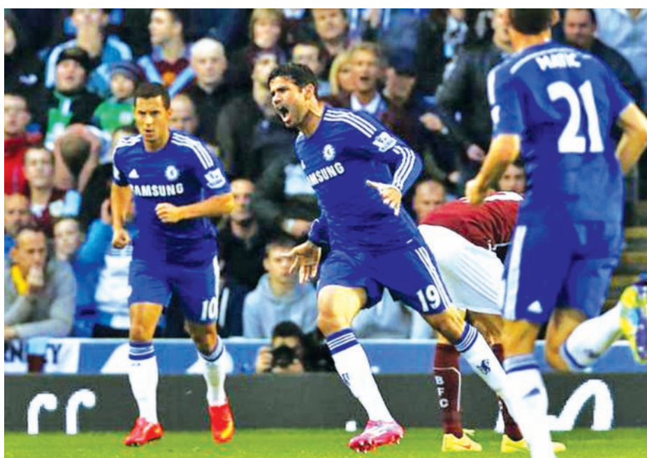
Chelsea's Diego Costa (C) celebrates his goal against Burnley during their English Premier League soccer match at Turf Moor in Burnley, northern England on 18 Aug, 2014.

In a fiery atmosphere, the home side took a surprise lead in the with a superb drive from Scott Arfield after a fine run and pull back from Matt Taylor. But any hopes the capacity home crowd at Turf Moor had of witnessing an upset were quickly dashed as Chelsea showed why