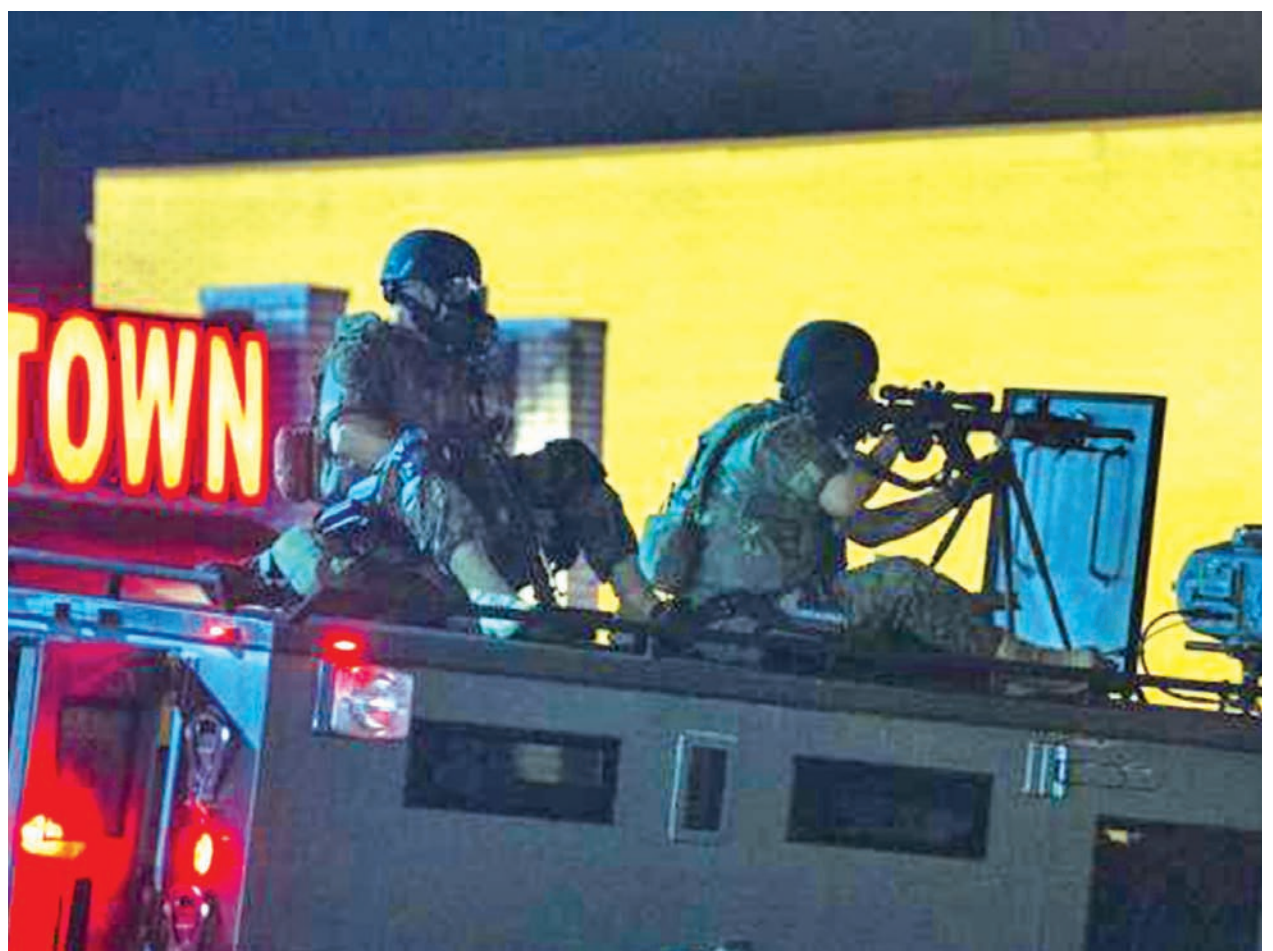
A police sharpshooter looks through his rifle as police monitor a group of rowdy demonstrators during further protests in reaction to the shooting of Michael Brown near Ferguson, Missouri on 18 Aug, 2014.