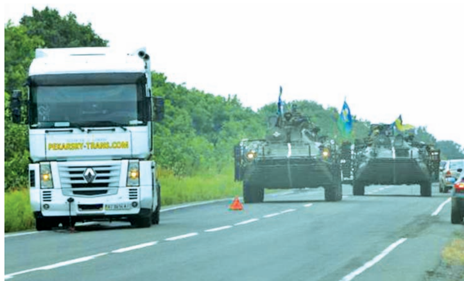
Ukrainian servicemen drive armoured vehicles along a road as they patrol the Donetsk region on 18 Aug, 2014.

KIEV, 19 Aug — Dozens of people, including women and children, were killed as they fled fighting in eastern Ukraine on Monday when their convoy of buses was hit by rocket fire, military spokesmen said.