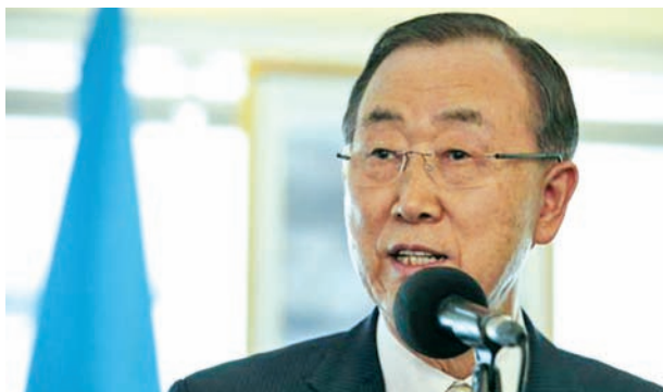
United Nations Secretary General Ban Ki-moon