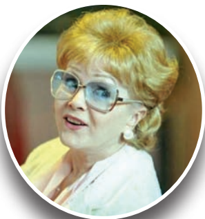
Actress Debbie Reynolds

Reynolds, 82, will be given the accolade at the acting organization’s annual awards ceremony in January for her achievement as an actor, singer, dancer and for her efforts to preserve historical film, the guild said.