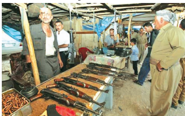
Kurdish men display weapons for sale at an arms market in Arbil, capital of the autonomous Kurdish region of northern Iraq, on 17 Aug, 2014.