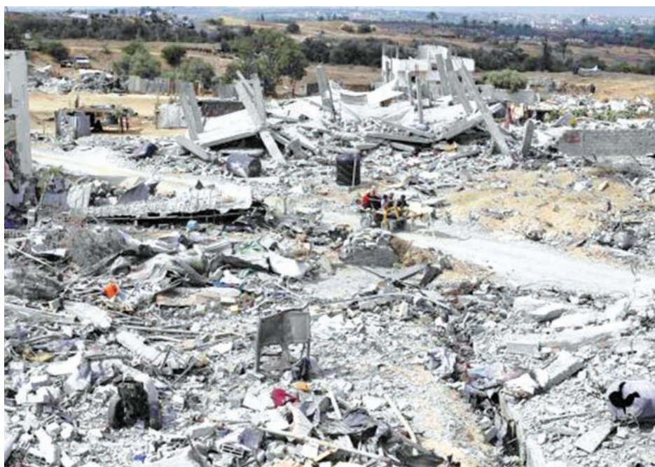
Palestinians ride a donkey cart past the ruins of houses which witnesses said was destroyed during the Israeli offensive in Johr El-Deek village near the central Gaza Strip on 17 Aug, 2014.