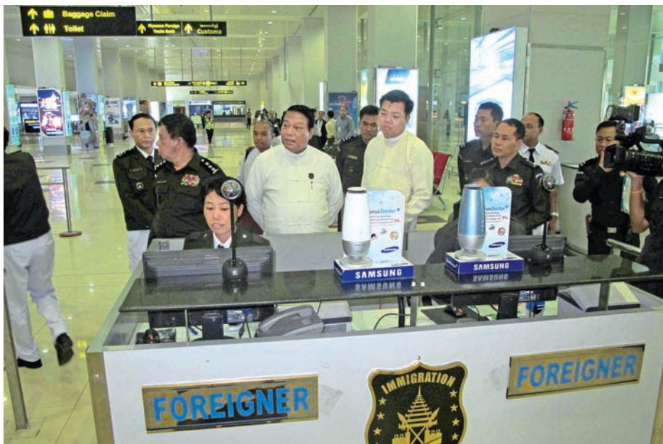
Union Minister U Khin Yi at Yangon International Airport to ensure that the start of the e-visa system on Sept. 1 will be smooth.—MNA

NAY PYI TAW, 19 Aug—Union Minister for Immigration and Population U Khin Yi arrived at Yangon International Airport on Saturday to inspect preparation for the introduction of the upcoming e-visa system for tourists.