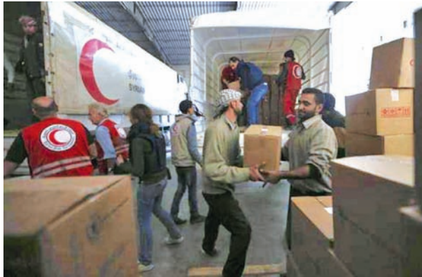
Workers unload bags of humanitarian aid inside a warehouse in the Duma neighbourhood of Damascus on 20 March, 2014.

LONDON, 19 Aug — The number of attacks on aid workers soared last year to the highest level on record, with Afghanistan the most dangerous country to be a humanitarian, a report on Tuesday said.