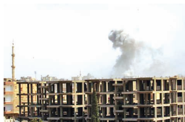
Smoke rises after what activists said was an air raid by Syrian government forces at the eastern Syrian city of Raqqa on 18 Aug, 2014.