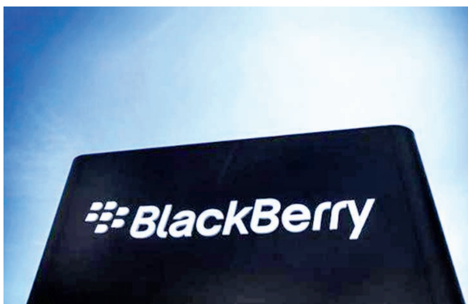
The Blackberry sign is pictured in Waterloo on 19 June, 2014.

"These are the call options for upside value that the market may not be factoring because it just looks too far away," said BGC analyst Colin Gillis.