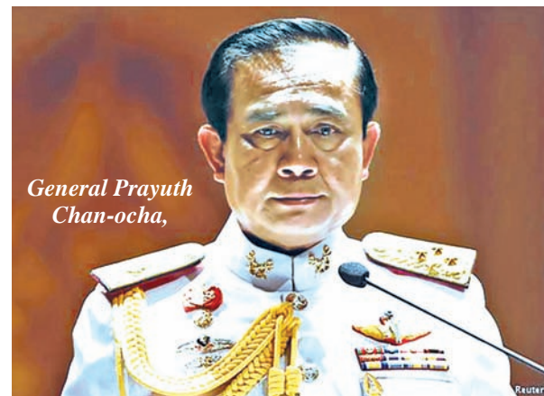
General Prayuth Chan-ocha,

BANGKOK, 19 Aug — Thailand’s military-dominated legislature will nominate a prime minister this week, members of the national assembly said on Tuesday, a move that looks set to consolidate the army’s hold on power almost 100 days since it wrested control of the country. The National Legislative Assembly (NLA) is likely to nominate General Prayuth Chan-ocha, the army chief who led the 22 May coup after months of street protests, assembly members told Reuters . NLA president Pornpetch Wichitcholchai told reporters that an interim prime minister would be appointed on Thursday.