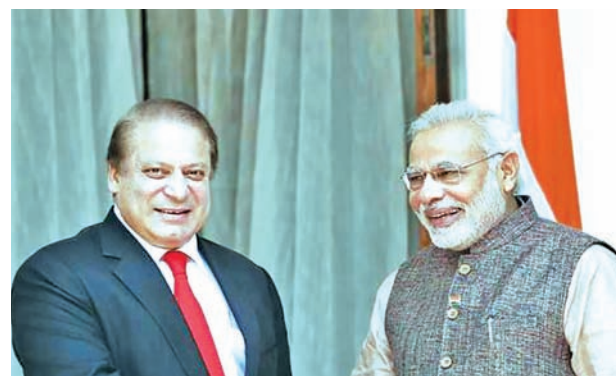
India’s Prime Minister Narendra Modi (R) and his Pakistani counterpart Nawaz Sharif smile before the start of their bilateral meeting in New Delhi on 27 May, 2014.