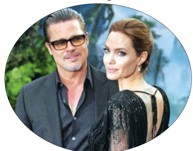
Hollywood star couple Brad Pitt and Angelina Jolie

The Malta Independent said that set construction is well under way with one structure on the beach nearing completion. The filming will run at Malta till 10 November this year. Universal picked up the worldwide rights to the film.—PTI