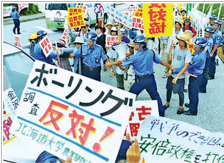
People lodge a protest on 18 Aug, 2014, in front of the gate of the US Marines' Camp Schwab in Nago, Okinawa, as the Japanese government started a drilling survey with a jack-up barge off the Henoko district of Nago to relocate the US Futenma airbase there.

Then Defence Minister Kim Kwan-jin, who now serves as the national security adviser to President Park, was found not to be notified about the case at that time, the probe result showed.