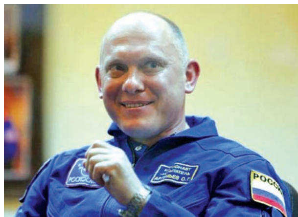
Russian cosmonaut Oleg Artemyev attends a news conference behind a glass wall at Baikonur cosmodrome on 24 March, 2014.

The solar-powered spacecraft, whose name means "messenger" in the Quechua language of the Incas, is outfitted with visible light and infrared