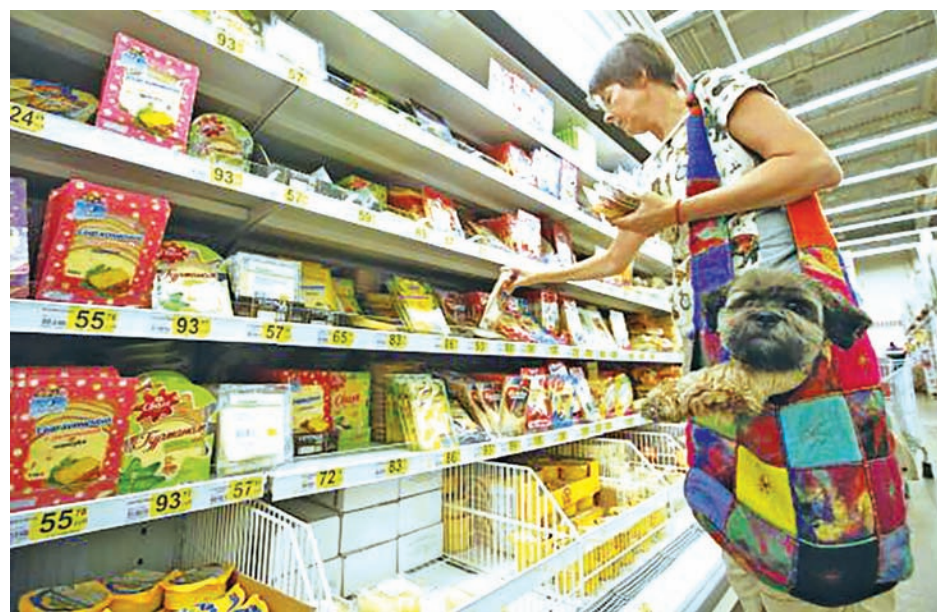
A customer picks up cheese at an Auchan grocery store, with a dog seen inside her bag, in Moscow on 18 Aug, 2014.