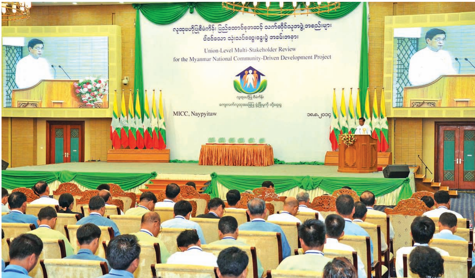
Vice President U Nyan Tun says he hopes community-driven development projects will not only reduce poverty but also enhance capacity of people in rural areas.

NAY PYI TAW, 18 Aug— Vice President U Nyan Tun said on Monday at a meeting with stakeholders of the “Myanmar National Community-Driven Development Project,” which aims at developing rural areas, that all stakeholders are required to get involved in drafting