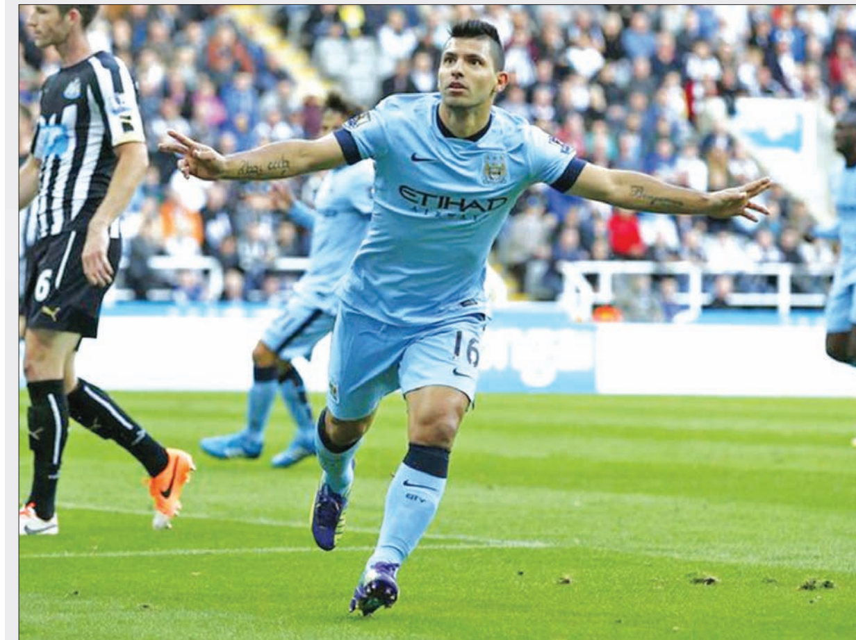
Manchester City's Sergio Aguero celebrates after scoring a goal against Newcastle United during their English Premier League soccer match at St James' Park in Newcastle upon Tyne, northern England on 17 Aug, 2014.

On Saturday Manchester United began life under Louis van Gaal with a disappointing 2-1 home defeat by Swansea City, while Arsenal needed a stoppage-time Aaron Ramsey goal to beat Crystal Palace