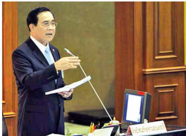
Thai Army chief General Prayuth Chan-ocha speaks during the start of a National Legislative Assembly meeting to consider urgent matters including the 2015 Budget Bill, at the parliament in Bangkok on 18 Aug, 2014.

BANGKOK, 18 Aug—Thai junta leader General Prayuth Chan-ocha, stressing that the military had a “limited time” in power before a return to civilian rule, submitted a draft fiscal 2015 budget on Monday, with defence and education receiving hefty increases.