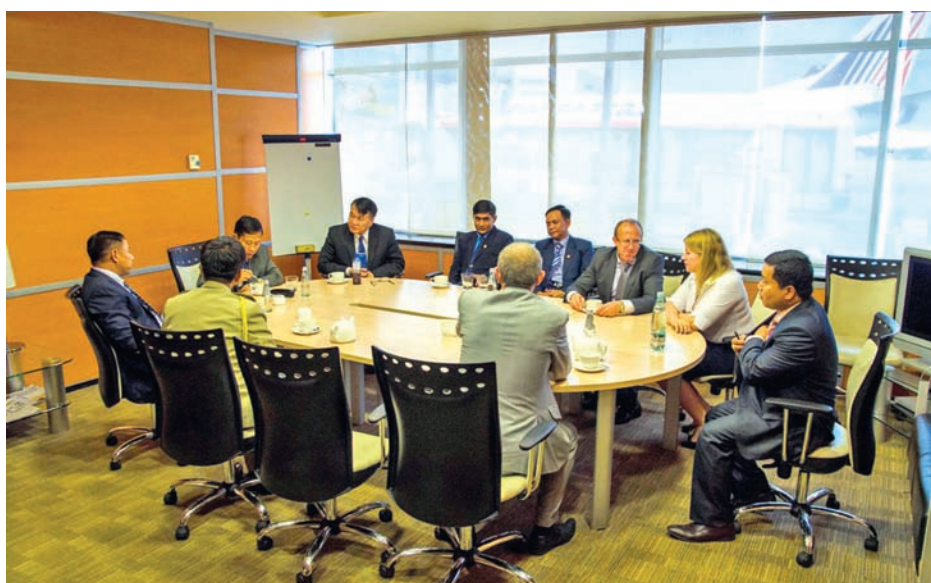
Myanmar military delegation holds discussion with officials during a visit to Russia at the invitation of the chairman of the Federal Service for Military Technical Cooperation of Russia.