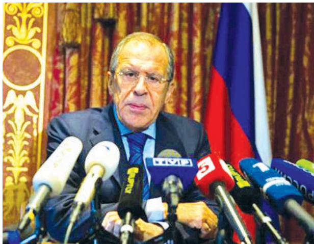
Russian Foreign Minister Sergei Lavrov speaks during a news conference in Berlin on 18 Aug, 2014.