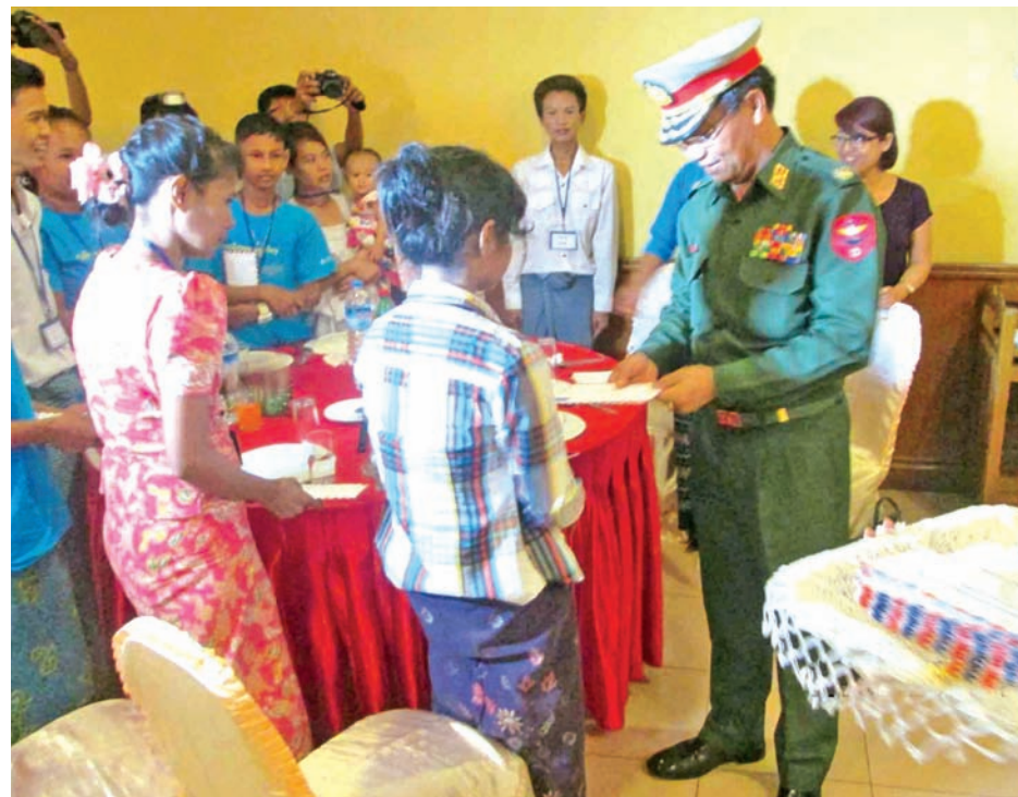
Deputy Home Affairs Minister gives cash to trafficked victims arriving back from neighbouring countries.—MNA

Also present were senior police officers and representatives from World Vision, AAPTIP and Save the Children.—MNA