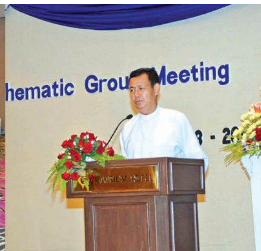
Union Minister for Information U Ye Htut talks about progress made on media reforms as the government is implementing the Third Wave process.