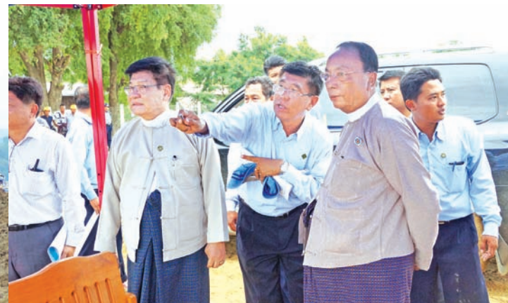
Amyotha Hluttaw Speaker U Khin Aung Myint (right) inspects improvement of transport and irrigation facilities in Mandalay Region as part of efforts to develop socio-economy of the region.

NAY PYI TAW, 18 Aug — Speaker of the Amyotha Hluttaw (Upper House) U Khin Aung Myint toured Mandalay Region on Sunday, where he inaugurated a bridge and inspected progress made on development projects.