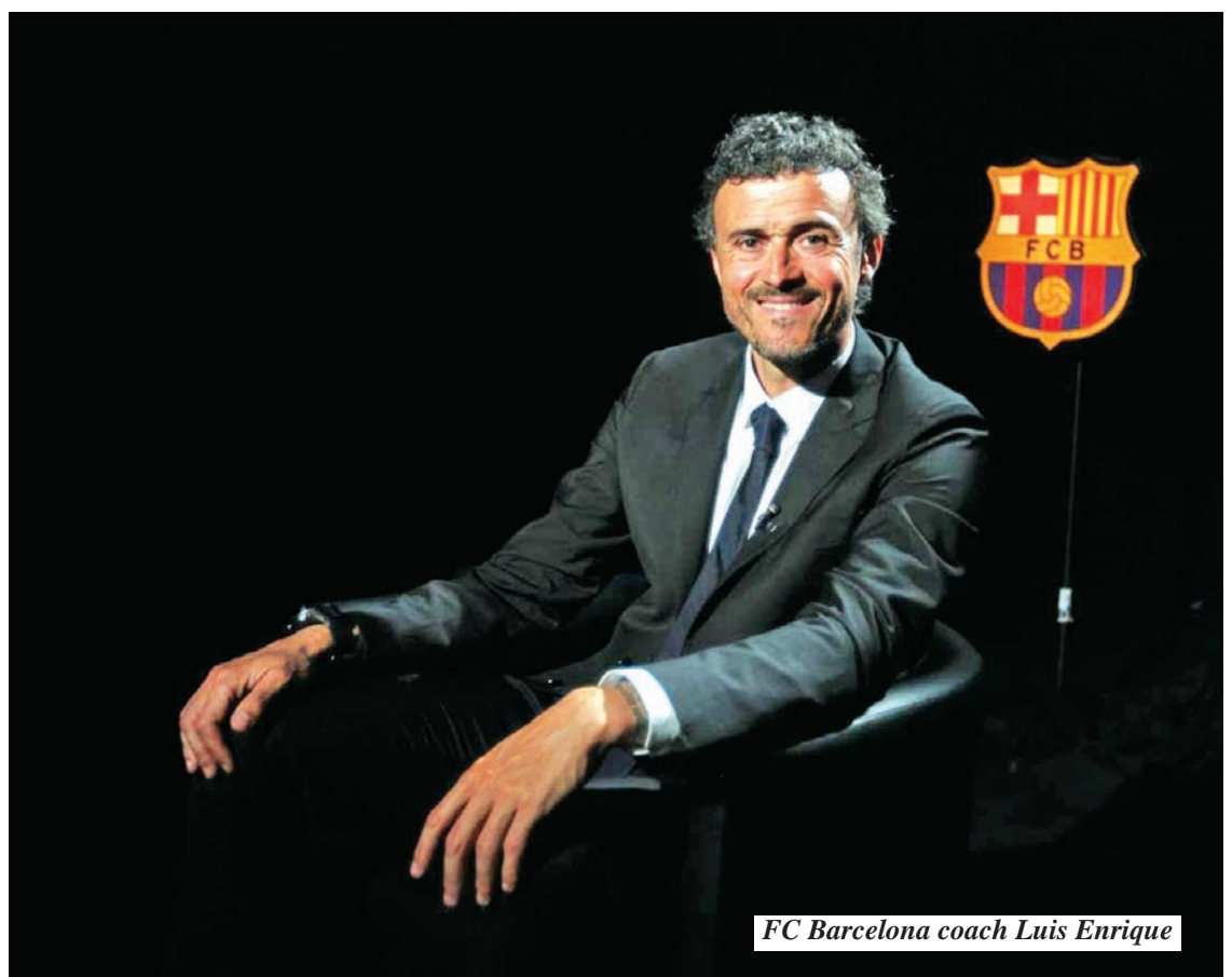
FC Barcelona coach Luis Enrique