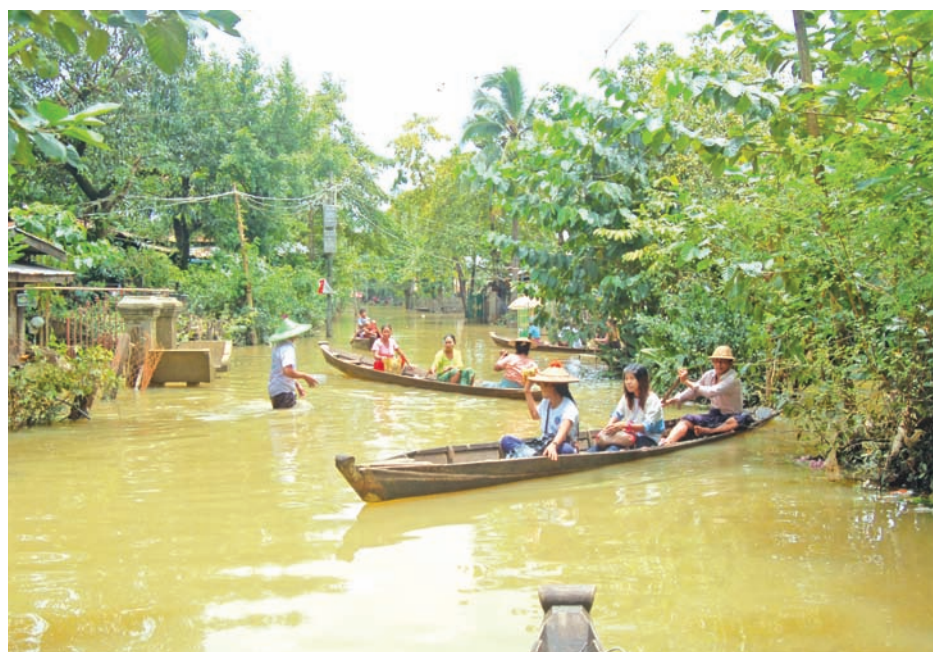
Flood victims in low-lying areas of Bago are in hardship after inundation for more than a week.

YANGON, 18 Aug — “Oil and Gas Myanmar 2014” will be held at Myanmar Convention Centre (MCC) in Yangon from 15 to 17 October, with organizers saying the fair will contribute to a “flourishing energy sector in Myanmar” with focus on upstream oil and gas activities.