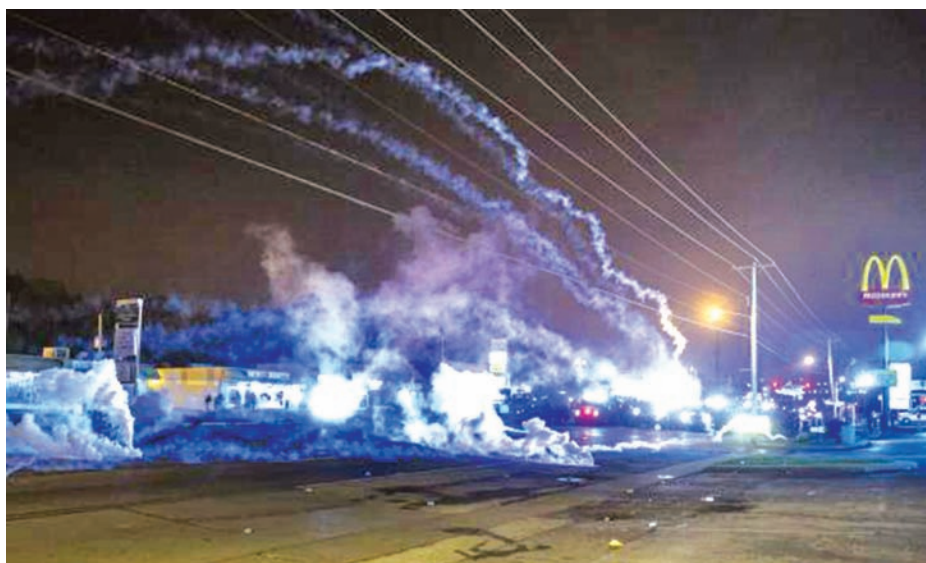
Smoke trails tear gas canisters fired into the air after protests in reaction to the shooting of Michael Brown turned violent near Ferguson, Missouri on 17 Aug, 2014.

"Tonight, a day of hope, prayers, and peaceful protests was marred by the violent criminal acts of an organized and growing number of individuals, many from outside the community and state, whose actions are putting