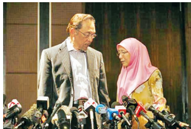
Malaysia’s opposition leader Anwar Ibrahim (L) and his wife Wan Azizah Wan Ismail leave after a news conference in Kuala Lumpur early 6 May, 2013.

The top state official, Khalid Ibrahim, refused to accept the sacking and tried to cling to power, with the backing of the ruling coalition and support from PAS, which was opposed to An-