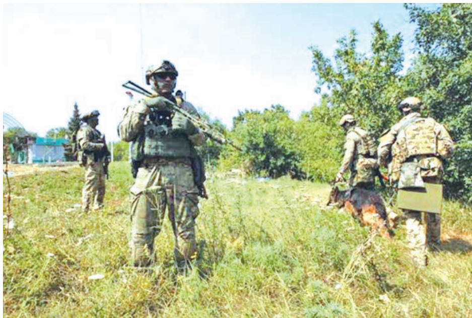
Ukrainian servicemen search for explosives with a sniffer dog around a checkpoint near the eastern Ukrainian town of Debaltseve on 16 Aug, 2014.

Russia denies helping the rebels and accuses