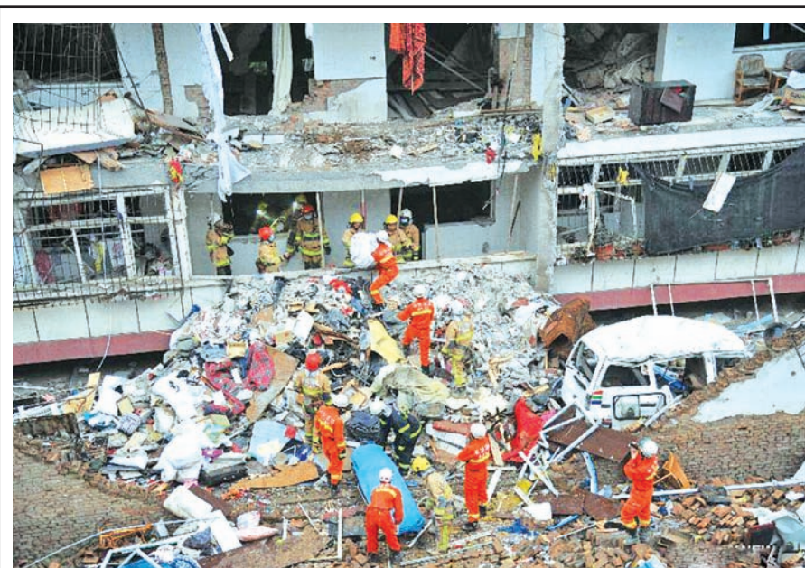
Rescuers work at the site of an explosion in Changzhi, north China's Shanxi Province on 17 Aug, 2014. Seven people died and four were injured after an explosion at an apartment in a residential compound in Changzhi City early on Sunday morning. —XINHUA

South Korean President Park Geun-hye on Friday also urged Japan to face up to the history, changing its erroneous stance on historical issues, especially on the sex slave issues, and showing its wisdom and determination for a new future with South Korea. —Xinhua