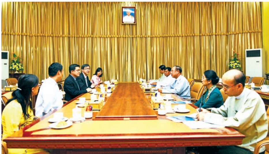
Ministry of Environmental Conservation and Forestry and Singapore-based company discuss prevention of water pollution and technology to keep track of water quality.—MNA

NAY PYI TAW, 18 Aug — Waste water treatment and technologies to monitor the impact of water quality on fish species were discussed at the Environmental Conservation and Forestry Ministry in Nay Pyi Taw on Monday.