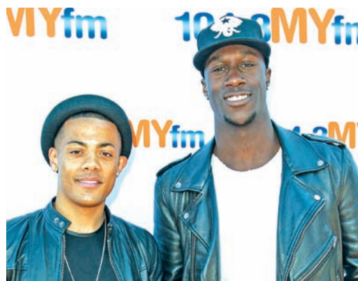
Norwegian double act Nico & Vinz

LONDON , 18 Aug — Norwegian double act Nico & Vinz held onto the top spot in Britain's music charts on Sunday for a second week with their single "Am I Wrong", the Official Charts Company said.