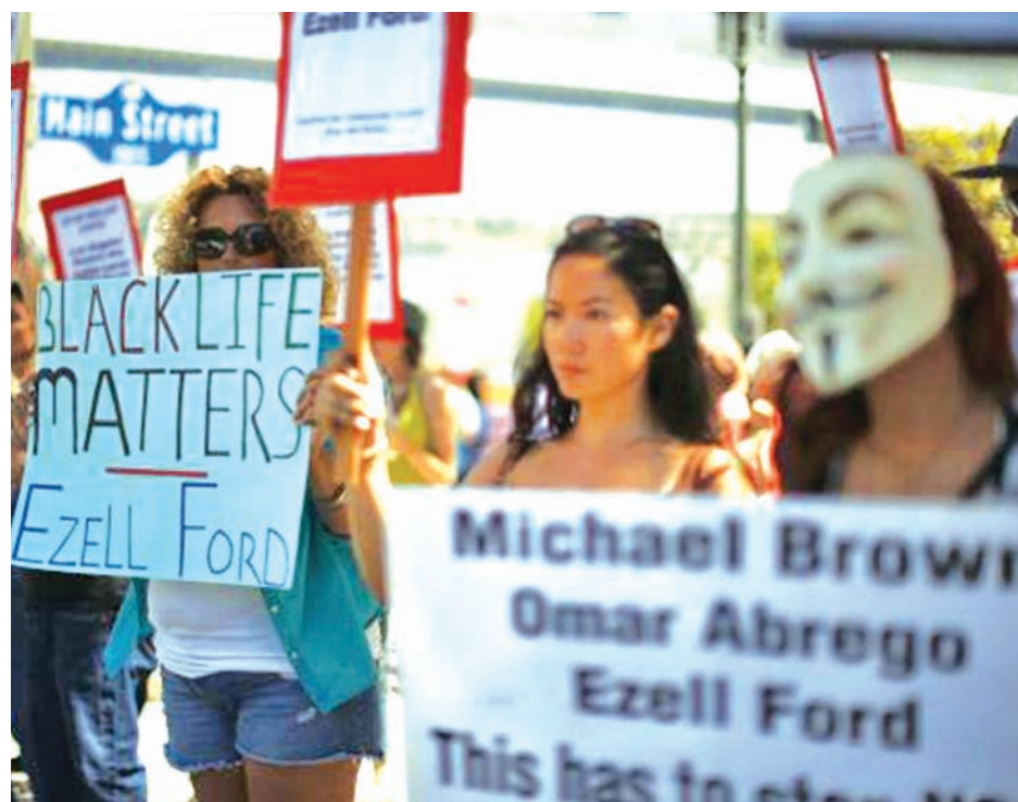
People protest the fatal police shooting of Ezell Ford in South Los Angeles, at a rally outside LAPD headquarters in Los Angeles, California on 17 Aug, 2014.