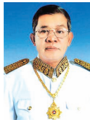
Prime Minister Hun Sen

PHNOM PENH, 18 Aug — The 123 Cambodian Members of Parliament (MPs) from the ruling and opposition parties will vote on Tuesday next week to elect their leadership, Prime Minister Hun Sen, vice president of the ruling Cambodian People’s Party (CPP), said on Monday.