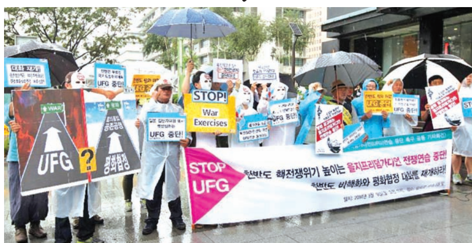
Protesters attend a demonstration against the joint military exercise "Ulchi Freedom Guardian" (UFG) in Seoul, South Korea, on 18 Aug, 2014. South Korea and the United States on Monday launched the Ulchi Freedom Guardian (UFG) joint military exercise aimed at defending South Korea from possible security threats from the Democratic People's Republic of Korea (DPRK).

The DPRK's General Staff of the Korean People's Army said on Sunday that it will launch preemptive attacks at any time against the joint military exercise, calling it a "re-