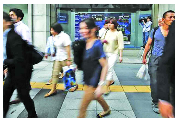
Pedestrians walk past at an electronic board showing the stock market indices of various countries outside a brokerage in Tokyo on 2 June, 2014 file photo.