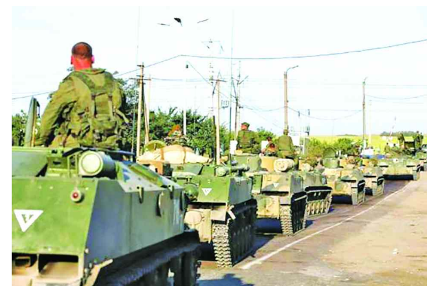
Russian military personnel sit atop armoured vehicles outside Kamensk-Shakhtinsky, Rostov Region, on 15 Aug, 2014.

The newspaper said the move was unlikely to represent a full-scale official Russian invasion, but it was clear evidence that Russian troops are active