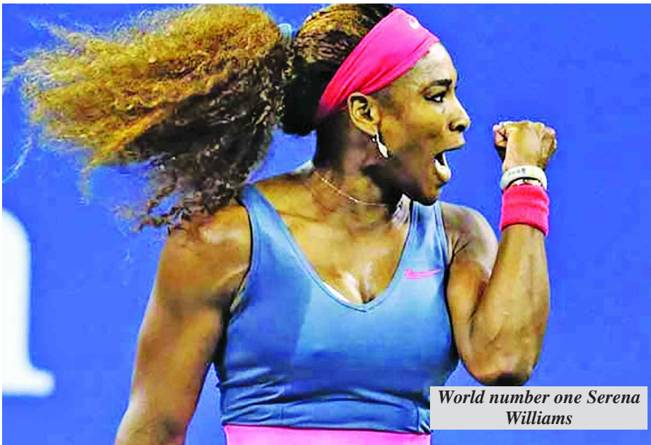
World number one Serena Williams

TORONTO, 15 Aug — World number one Serena Williams continued her march towards a first Western and Southern Open title, easing into the quarter-finals of the Cincinnati tournament with a 6-2, 6-2 demolition of 13th seeded Italian Flavia Pennetta on Thursday.