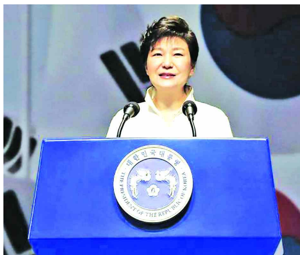
South Korean President Park Geun-hye speaks during a ceremony marking the 69th anniversary of liberation from Japan's 1910-45 colonial rule, on Liberation Day in Seoul on 15 Aug, 2014.

SEOUL, 15 Aug — South Korean President Park Geun-hye on Friday urged the creation of a nuclear safety consultative group in Northeast Asia, given the high number of nuclear power plants in the region and public concerns over safety.