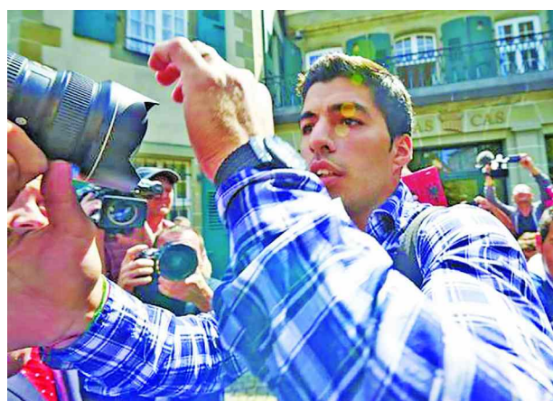
Uruguayan striker Luis Suarez leaves after his hearing at the Court of Arbitration for Sport (CAS) in Lausanne on 8 Aug, 2014.

However, a spokesman for soccer's world governing body FIFA said he could play in friendly internationals for club and country. This could allow him to make his Barcelona debut against Mexican side