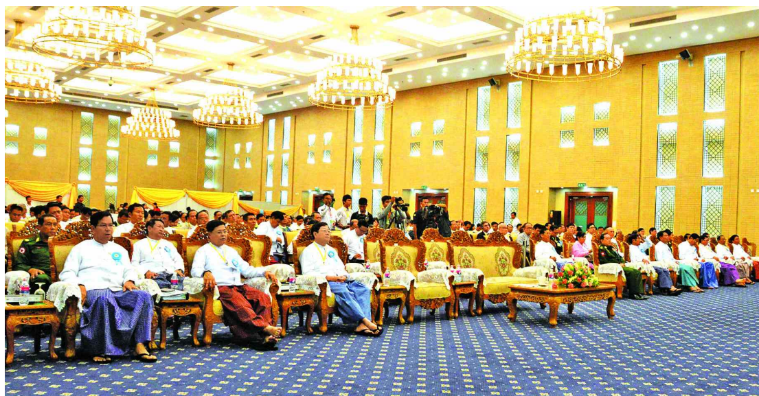
Vice President U Nyan Tun explains how important land resources management to easing the livelihood for people of rural and urban areas.

NAY PYI TAW, 15 Aug — Vice President U Nyan Tun said on Friday at a workshop in Nay Pyi Taw that land resources