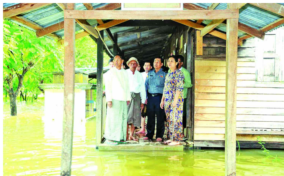
Yangon Region Chief Minister U Myint Swe visits flood-affected school, where relief works are being carried out.—MNA