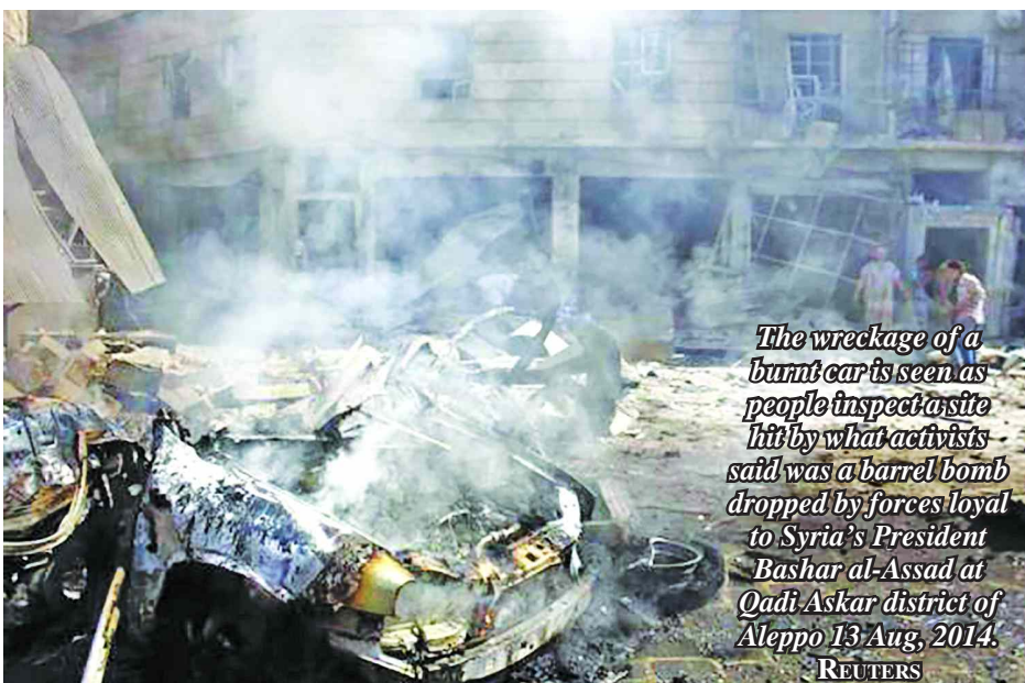
The wreckage of a burnt car is seen as people inspect a site hit by what activists said was a barrel bomb dropped by forces loyal to Syria's President Bashar al-Assad at Qadi Askar district of Aleppo 13 Aug, 2014.

BEIRUT, 15 Aug—Syrian government forces backed by Lebanon's Hezbollah took control of a town just outside Damascus from Islamist fighters on Thursday, a blow to the rebels who had held it for more than a year.