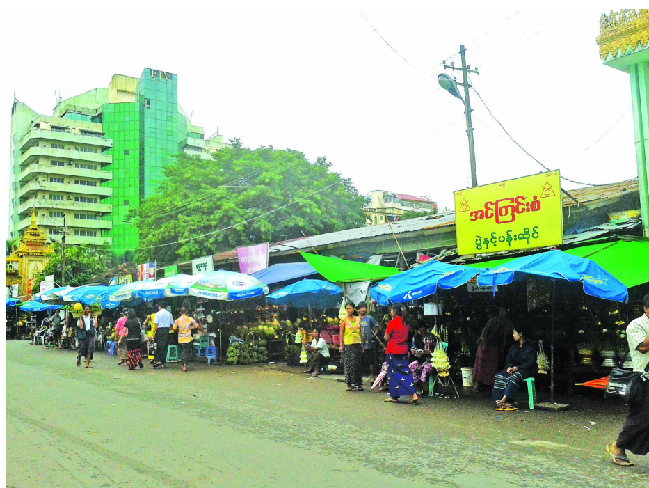
57 shops in Botataung pagoda market selling offertories in front of Botahtaung Pagoda which will be rebuilt in October 2014.

YANGON, 15 Aug — The Botahtaung Pagoda Board of Trustees will rebuild the pagoda’s one-storey market in October within three months, according to a meeting between the pagoda board of trustees and 57 vendors on Wednesday.