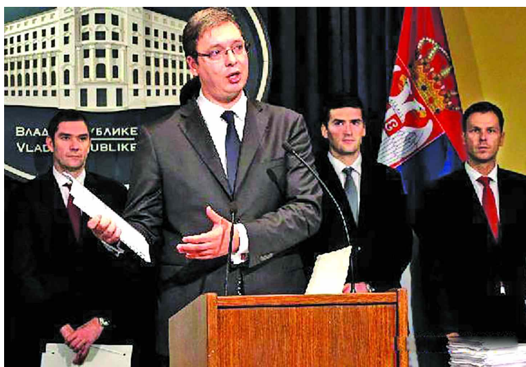
Serbian Prime Minister Aleksandar Vucic discloses previously secret agreements between the government and two companies from United Arab Emirates in Belgrade, Serbia, on 14 Aug, 2014.

BELGRADE, 15 Aug—Agreements revealed on Thursday by Serbian Prime Minister Aleksandar Vucic show that the Etihad Airways invested 100 million US dollars in the privatization of the state owned