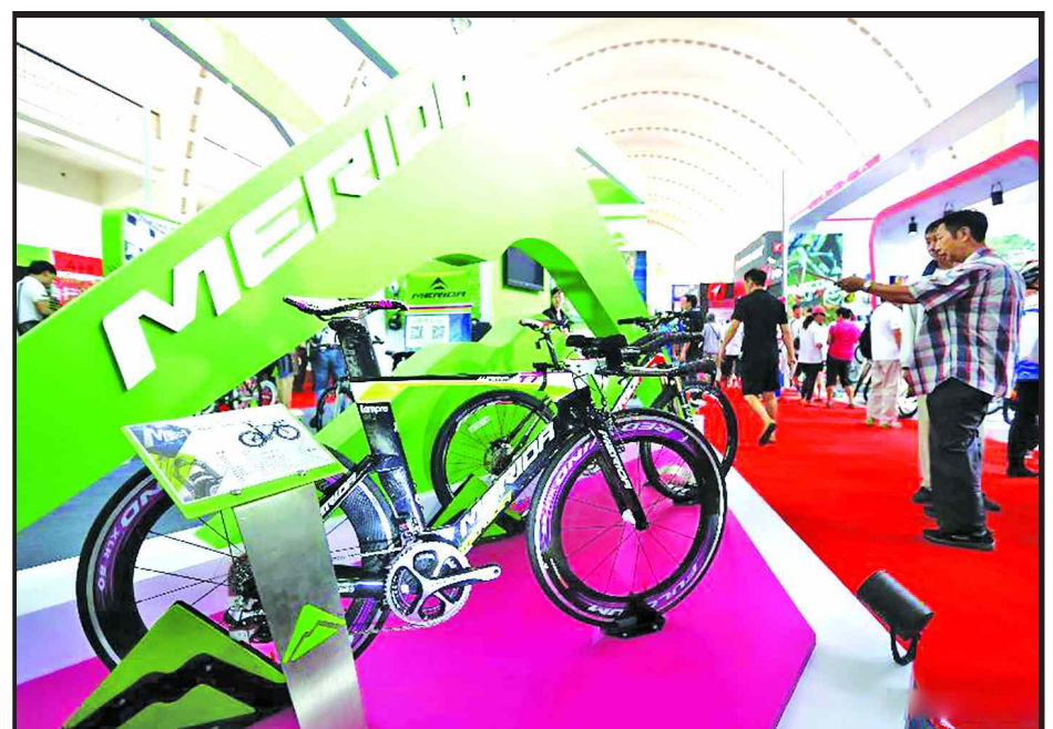
Visitors watch bicycles at Liaoning industrial museum in Shenyang, capital of northeast China’s Liaoning Province on 15 Aug, 2014. China (Shenyang) Bicycle Exhibition was opened on Friday with over 110 bicycle enterprises from both home and abroad on show.