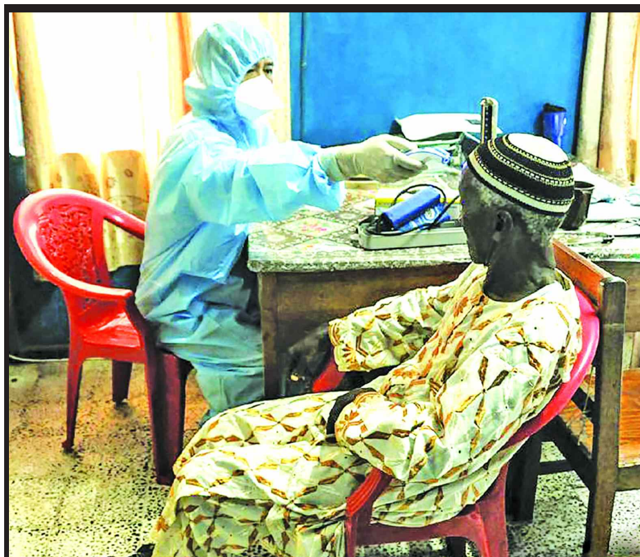
A Chinese doctor works at a clinic of the Kingharman Road Hospital in Freetown, Sierra Leone, 14 Aug, 2014. The hospital has been conducted an overall disinfection after receiving a patient with Ebola, who later died on the road to the Ebola treat centre. By far, Chinese doctors in the hospital keep on working as usual.