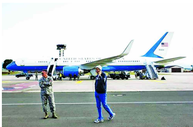
US Secretary of State John Kerry speaks on his phone while his plane refuels at Ramstein Air Base in Ramstein-Miesenbach on 1 Aug, 2014.

"Finally some frequent flyer miles!" Kerry said on