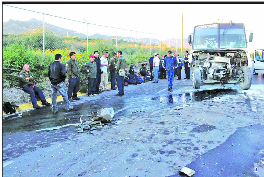
Image provided by Vanguardia newspaper of Saltillo shows people at the site of a multiple crash, in Saltillo, Coahuila, northern of Mexico on 14 Aug, 2014. At least 98 persons were reported injured in the accident involving at least four vehicles transporting employees of different corporations, according to local Press.—XINHUA

The US Geological Survey said the moderate quake was only 7.7 km deep, with its epicenter located 23 km northeast of Quito. Damage was not widespread but landslides blocked several highways and more than 60 aftershocks were registered so far.—Xinhua