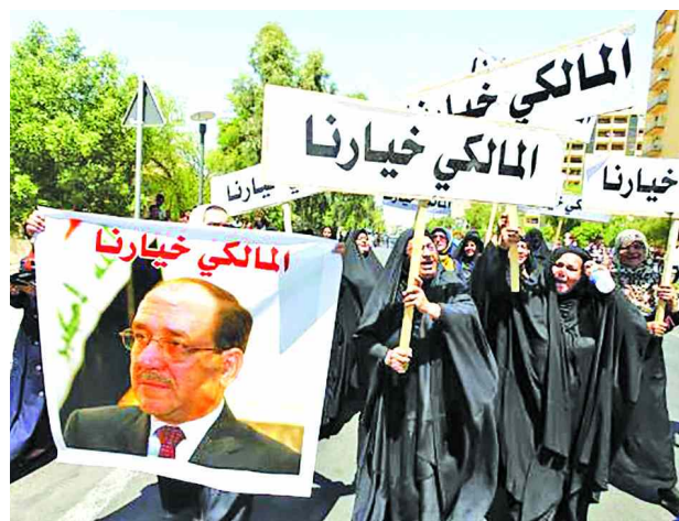
People hold a portrait of Nuri al-Maliki and signs as they gather in support of him in Baghdad on 13 Aug, 2014.

Maliki had resisted months of pressure to step down from Sunnis, Kurds, some fellow Shi'ites, Shi'ite regional power Iran and the United States. He had insisted on his right to form a new government based on the results of a