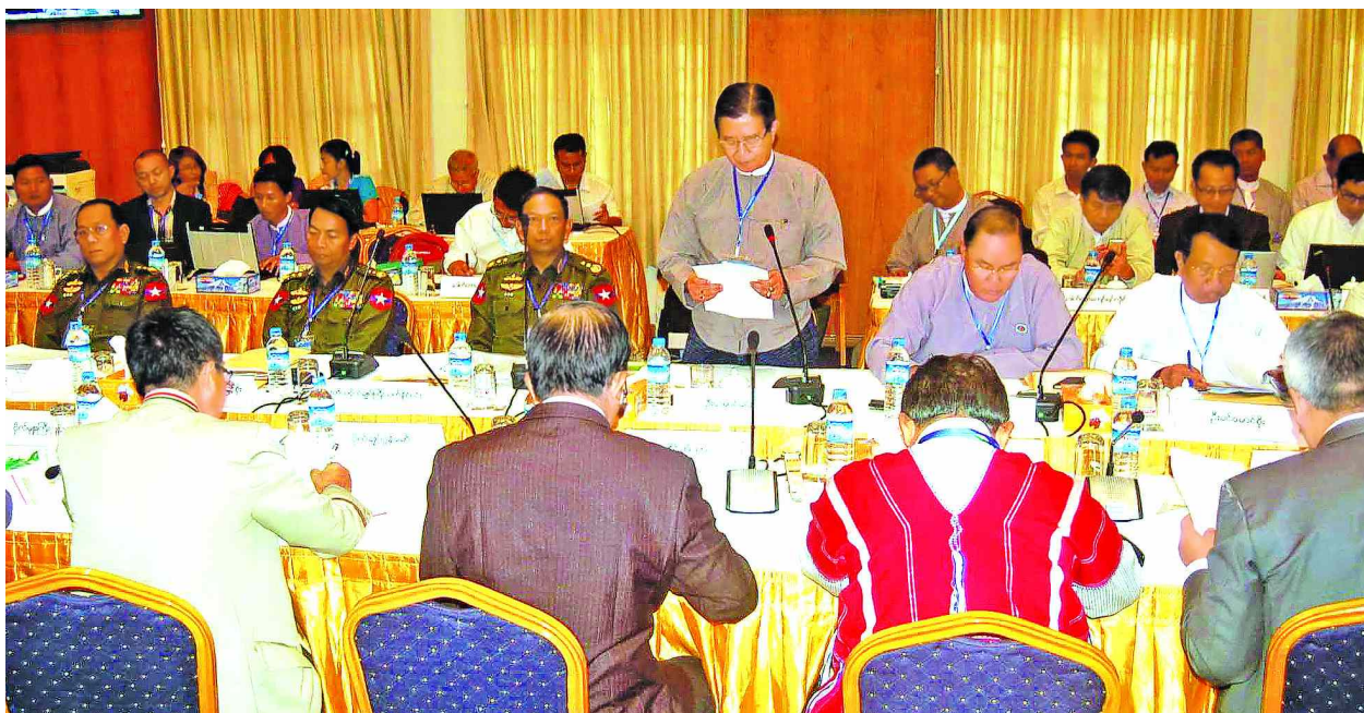
Union Peace-making Working Committee Vice Chairman Union Minister U Aung Min explains nationwide ceasefire among ethnic armed groups.