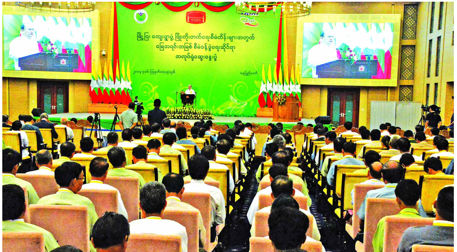
President U Thein Sein addresses a meeting that highlights land resources management for rural and urban development projects to enable people nationwide to enjoy higher living standard.—MNA

the main challenges in towns and villages, the president highlighted shortage of drinking water, lack of proper drain-