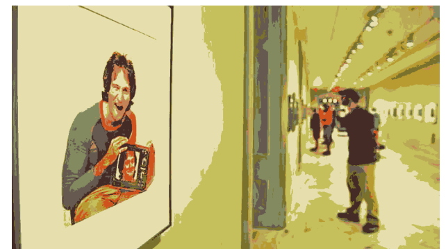
A photograph of Oscar-winning actor and renowned comedian Robin Williams is displayed at the Smithsonian's National Portrait Gallery in Washington on 12 Aug, 2014.