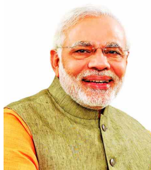
Prime Minister Narendra Modi

NEW DELHI, 15 Aug — Foreign investors should invest in India and manufacture goods here, as manufacturing is key to development and overall economic growth, Prime Minister Narendra Modi