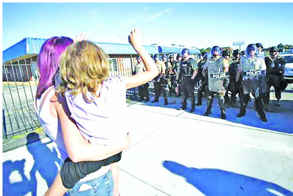
A mother and daughter raise their hands in front of riot police while protesting the shooting death of teenager Michael Brown, in Ferguson, Missouri on 13 Aug, 2014.