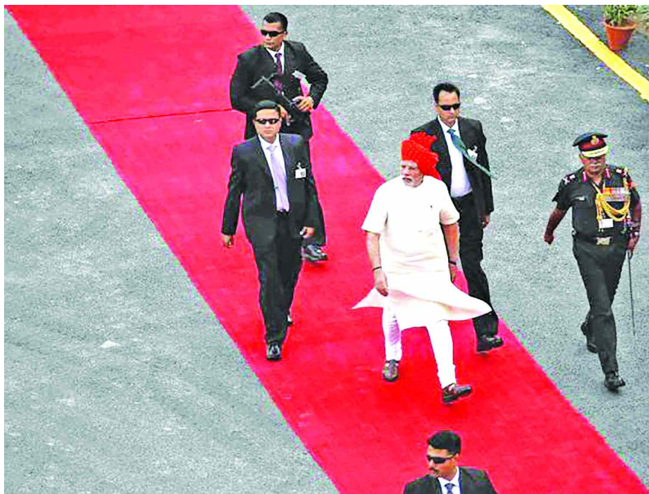
Indian Prime Minister Narendra Modi (wearing turban), surrounded by his bodyguards, arrives to address the nation from the historic Red Fort during Independence Day celebrations in Delhi on 15 Aug, 2014.

He did, however, unveil an initiative on Friday to improve access to financial services for the two-