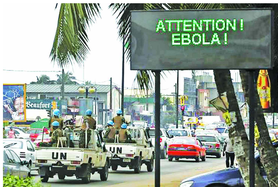
A UN convoy of soldiers passes a screen displaying a message on Ebola on a street in Abidjan on 14 Aug, 2014.

clared Ebola a national emergency as has Liberia, which is hoping that two of its doctors diagnosed with Ebola can start treatment with some of the limited supply of experimental