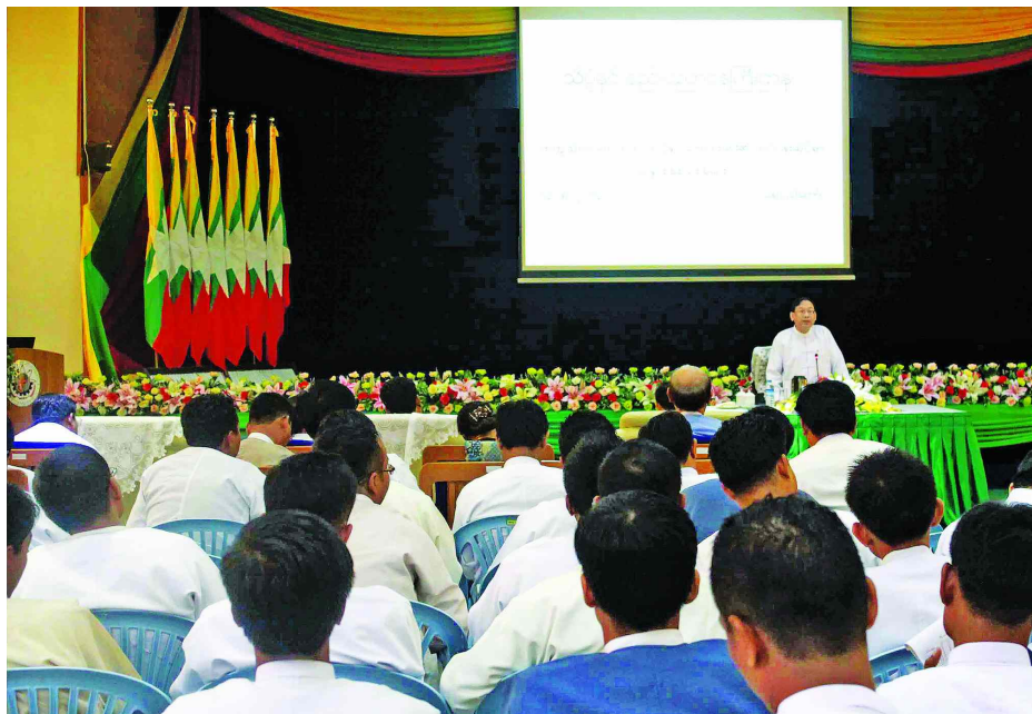
Union Minister for Science and Technology Dr Ko Ko Oo focuses on improvement of education sector at the workshop.

NAY PYI TAW, 15 Aug — Union Minister for Sci-