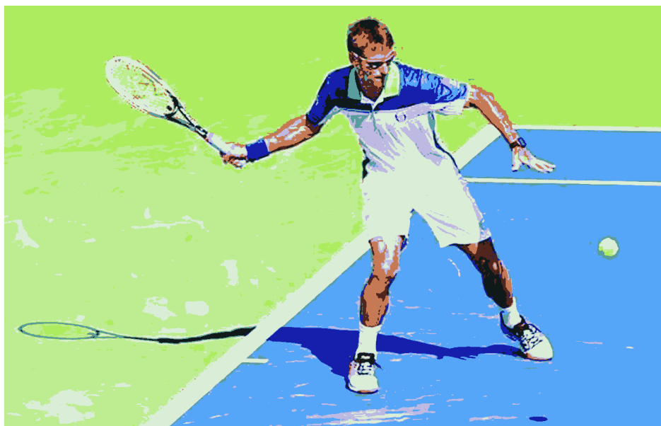
Tommy Robredo returns a shot from Novak Djokovic on day four of the Western and Southern Open tennis tournament at Linder Family Tennis Centre.

fortable. "It's disappointing that I'm finishing Cincinnati again with a tough loss but it's sport. I didn't play well in Toronto; didn't play well here.