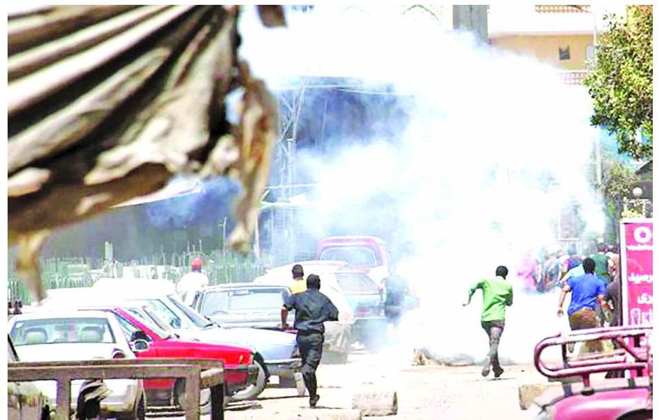
Protesters, supporters of the Muslim Brotherhood, run from tear gas thrown by police, during a protest in the Matariya area in Cairo on 14 Aug, 2014.

Militant attacks have also increased since Mursi was toppled, with Sinai Peninsula-based militants killing soldiers and police in an insurgency the government has struggled to quell. Human Rights Watch said this week that those killings were system-