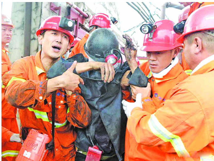
A miner (2nd L) is rescued from a flooded coal mine of privately-owned Anzhishun Coal Mine in Jixi, northeast China's Heilongjiang Province, on 15 Aug, 2014. Nine people have been rescued and 16 remained trapped in the flooded coal mine.

Jixi, (Heilongjiang), 15 Aug—Forty of 56 workers trapped in a flooded coal mine in northeast China's