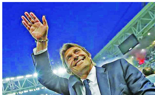
Juventus' coach Antonio Conte greets supporters before the Italian Serie A soccer match against Atalanta at the Juventus stadium in Turin on 5 May, 2014.

Conte, who is known for his fiery temperament, has always denied knowledge of match-fixing.