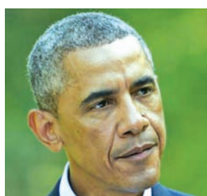
US President Barack Obama delivers a statement on the situation in Iraq from his vacation home at Martha's Vineyard, Massachusetts on 11 Aug, 2014.

EDGARTOWN, 13 Aug — President Barack Obama will have a reunion with former Secretary of State Hillary Clinton on Wednesday on Martha's Vineyard, days after the former top diplomat criticized the foreign policy vision of his administration.