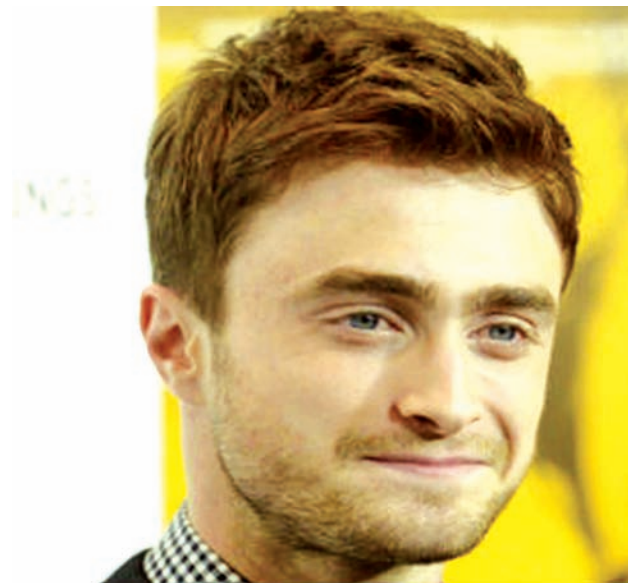
Daniel Radcliffe recently criticised his own performance in the sixth 'Harry Potter' movie.

"I never liked watching myself on film but I do make myself sit through it. I think it comes from not actually realising I didn't have to go to my own premieres and watch the film — that's something I've only just realised you don't have to do. I always went along and sat with everyone else watching the movie," he said.