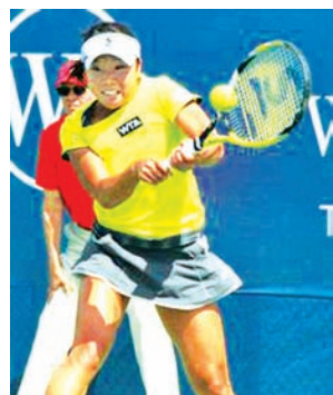
Japan's Kurumi Nara

Japan's Kimiko Date-Krumm and Czech partner Andrea Hlavackova reached the second round of the women's doubles with a 3-6, 6-1, 10-3 win over Australia's Casey Dellacqua and Croatian Mirjana Lucic-Baroni.—Kyodo News