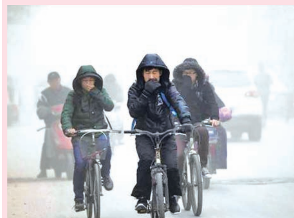
Residents cover their face from dust as they ride their bicycles along a street on a hazy day in Zhengzhou, Henan Province on 10 Dec, 2013. —REUTERS

Beijing's environmental bureau said 14.1 percent was made up of other smaller sources like food preparation, livestock rearing and vehicle repairs. — Reuters