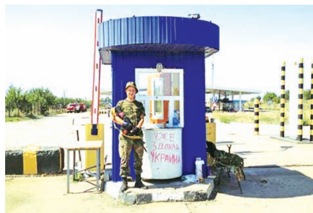
An armed pro-Russian separatist stands guard at a border checkpoint near the territory of Russia in Izvaryne, Luhansk region, on 31 July, 2014.

On the Russian side of the divide, a track leads towards the Russian town of Donetsk, 1 km away and bearing the same name as the rebel stronghold in Ukraine. The soil has the imprints of caterpillar treads, the kind used on tanks or some types of armoured personnel carriers.