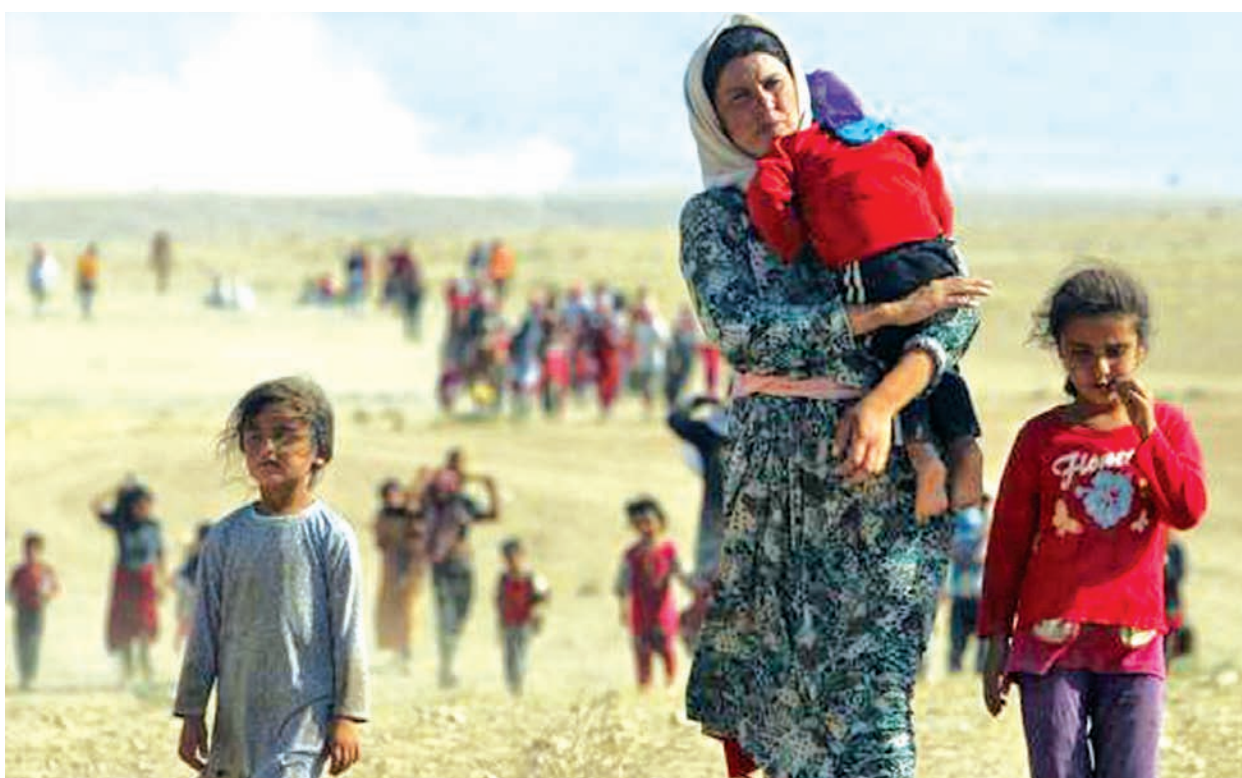
Displaced people from the minority Yazidi sect, fleeing violence from forces loyal to the Islamic State in Sinjar town, walk towards the Syrian border, on the outskirts of Sinjar mountain, near the Syrian border town of Elibeh of Al-Hasakah Governorate on 11 Aug, 2014.

A suicide bomber attacked a checkpoint near Abadi's Baghdad home on Tuesday, two police sources