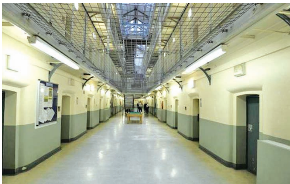
A general view shows C wing at Wormwood Scrubs prison in London on 22 Oct, 2012.

The ruling concluded a case brought to the court by a group of 10 British prisoners who argued that the ban breached their right to free elections under Eu-