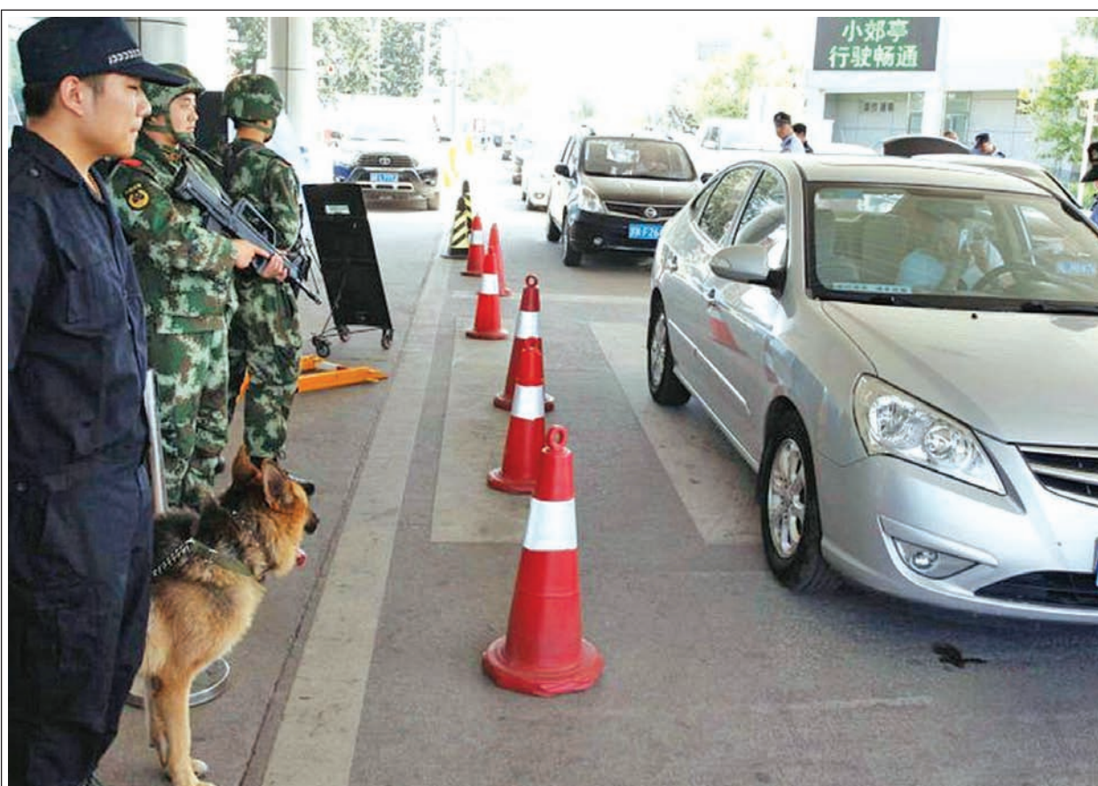
Beijing police authorities performed security checks on various vehicles entering the capital city on 12 Aug, 2014. Since 1 August, Beijing has tightened security for the Asia-Pacific Economic Cooperation (APEC) 2014 Third Senior Officials' Meeting (SOM3) and Related Meetings, which will be held in the city between 6 and 21 August.