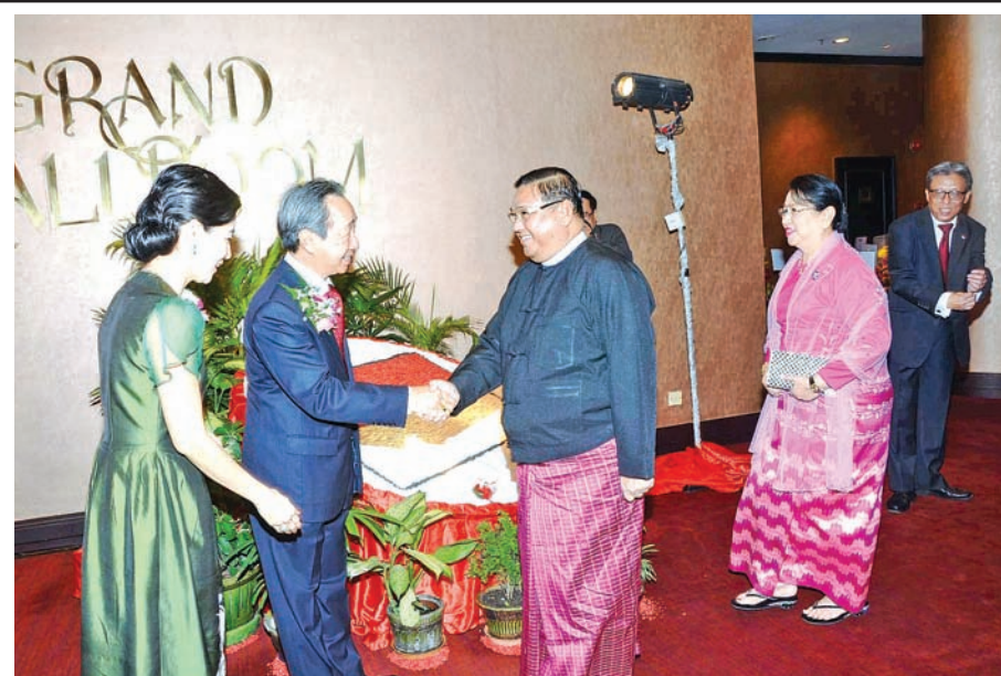
Singaporean Ambassador to Myanmar Mr Robert Chua and wife welcomed Union Minister for Foreign Affairs U Wunna Maung Lwin and wife at a reception to mark the 49 th Anniversary of the National Day of the Republic of Singapore in Yangon on 12 August, strengthening bilateral relations between Myanmar and Singapore.—MNA

Union Minister U Myint Hlaing inspects 3,000-acre seed production farmland in Dekkhinathiri Township.—MNA