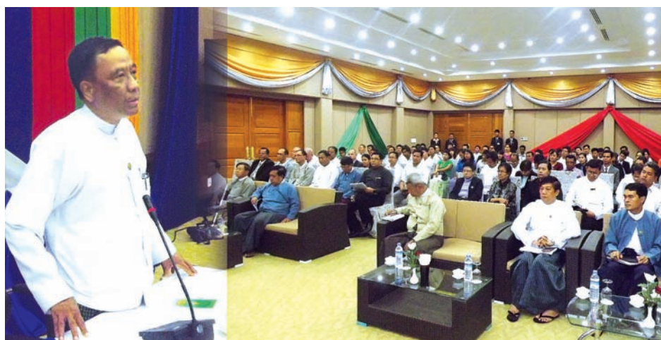
With the influx of foreign visitors and the upcoming 46 th ASEAN Economic Ministers' Meeting, hotel officials are urged to provide better services and step up efforts to maintain hotel facilities.—MNA

NAY PYI TAW, 13 Aug — Hotel staff are to be trained to provide better