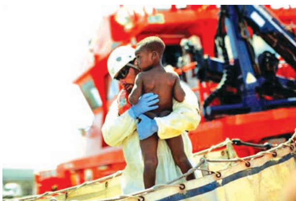
A worker carries an African child immigrant after arriving on a rescue ship at the southern Spanish port of Tarifa, near Cadiz, southern Spain on 12 Aug, 2014.

More than 75,000 have tried to cross the Mediterranean from North Africa in the first half of 2014, landing in Italy, Greece, Spain and Malta, the UNHCR agency says, with about 800 people dying in