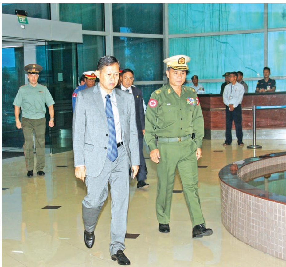
Deputy Commander-in-Chief of Defence Services Commander-in-Chief (Army) Vice-Senior General Soe Win leaves for Russia on Wednesday, accompanied by a large delegation from the Defence Services.