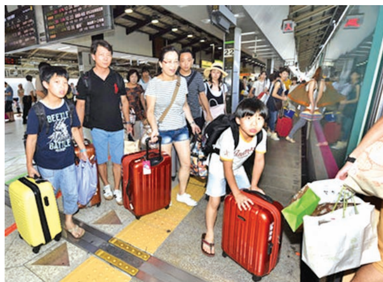
Photo taken on 13 Aug, 2014, shows a shinkansen platform at JR Tokyo station in Tokyo, Japan, crowded with travellers heading for their hometowns for the Buddhist Bon holidays. The return rush will come on 16 and 17 August.