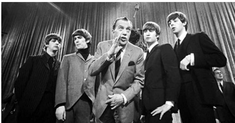
In this 8 Feb, 1964 file photo, Ed Sullivan, centre, stands with The Beatles, from left, Ringo Starr, George Harrison, John Lennon, and Paul McCartney, during a rehearsal for the British group's first American appearance, on the "Ed Sullivan Show," in New York.

ture is expected to fetch up to 1,500 pounds. All 330 items will go under