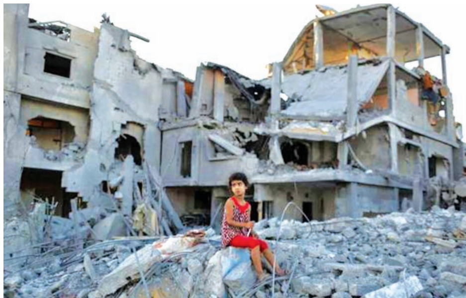
A girl sits on the ruins of her family's home that witnesses say was destroyed by Israeli airstrikes in the Beit Hanoun neighbourhood of Gaza City on 12 Aug, 2014.

GAZA/CAIRO, 13 Aug — Talks to end a month-long war between Israel and Gaza militants are “difficult”, Palestinian delegates said on Tuesday, while Israeli officials said no progress had been made so far and fighting could soon resume.