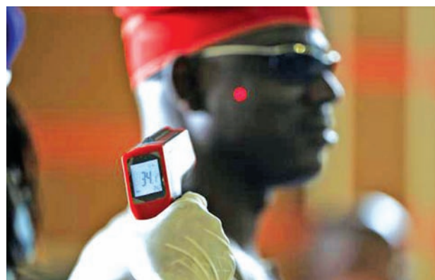
A man has his temperature taken using an infrared digital laser thermometer at the Nnamdi Azikiwe International Airport in Abuja, on 11 Aug, 2014.

drug, which has been given to a Spanish priest who later died and two US aid workers. The outbreak is the world's largest and deadliest and the UN agency last week declared it an international health emergency. The WHO has appealed for funds and medical staff to supplement health care in one of the poorest regions in the world. So far, 1,013 people have died, the vast majority in Guinea, Liberia and Sierra Leone. Three