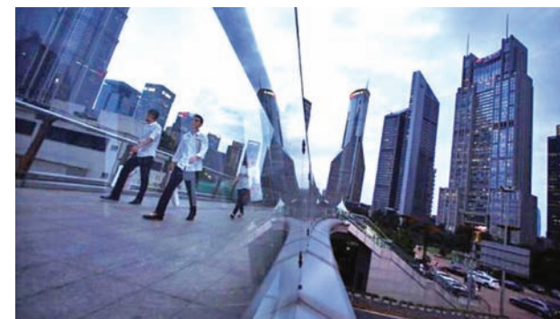
People cross a bridge at Pudong financial district in Shanghai on 11 Aug, 2014.

“I don't know if this has anything to do with disagreements between policymakers. In its recent monetary policy report, the central bank warned of continued risks in fast credit lending.”