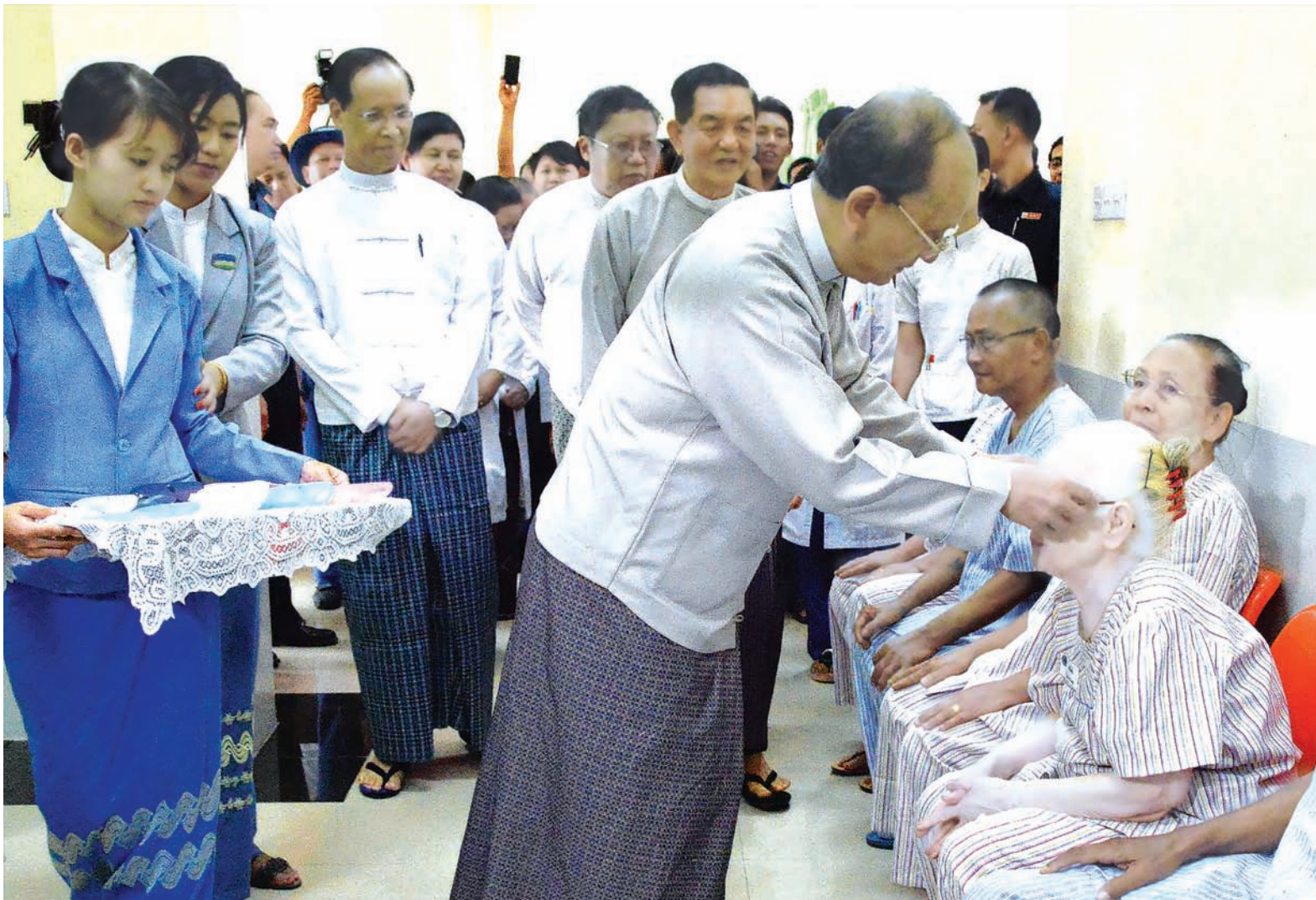
President U Thein Sein donates cash and glasses to patients at Zabu Thiri Specialist Hospital before receiving a vision diagnosis from specialists taking part in the free eye care programme of the Zabu Thiri Foundation.

NAY PYI TAW, 13 Aug—President U Thein Sein visited Zabu Thiri Specialist Hospital in Nay Pyi Taw on Wednesday where patients with eye disorders can now receive free treatment, sponsored by the Zabu Thiri Foundation.