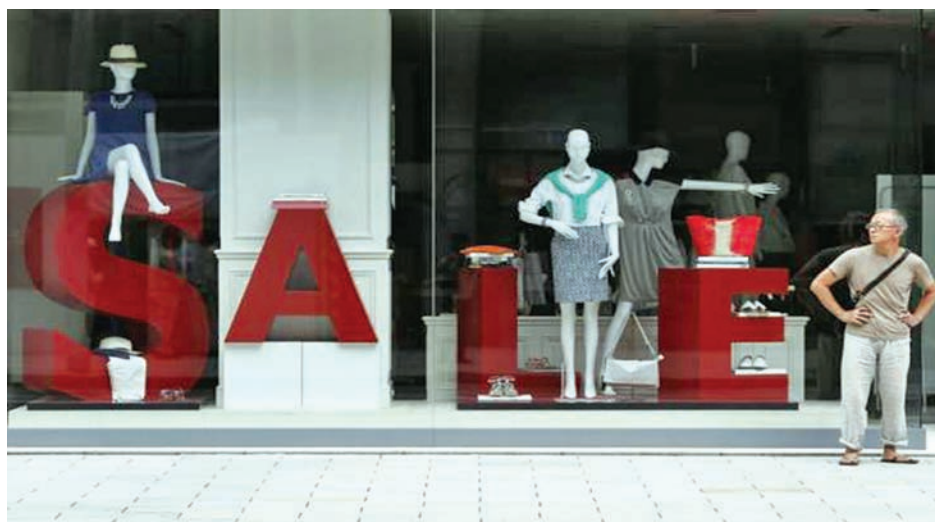
A man stands in front of a shop window at a shopping district in Tokyo on 13 Aug, 2014.

temporary, however, the Bank of Japan remains publicly convinced the economy is on course for a moderate recovery and has no plans to expand stimulus any time soon.