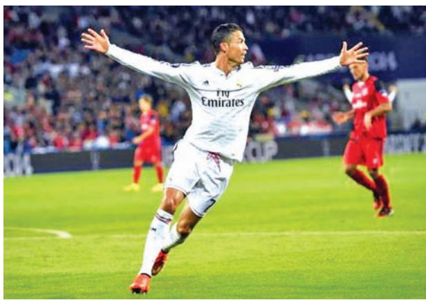
Real Madrid's Cristiano Ronaldo celebrates after scoring his second goal against Sevilla during the UEFA Super Cup final soccer match at Cardiff City stadium, Wales, on 12 Aug, 2014.

CARDIFF, 13 Aug — Cristiano Ronaldo struck twice as a rampant Real Madrid side, featuring the most expensive strike force ever assembled, powered to a 2-0 win over Sevilla in an all-Spanish UEFA Super Cup on Tuesday.