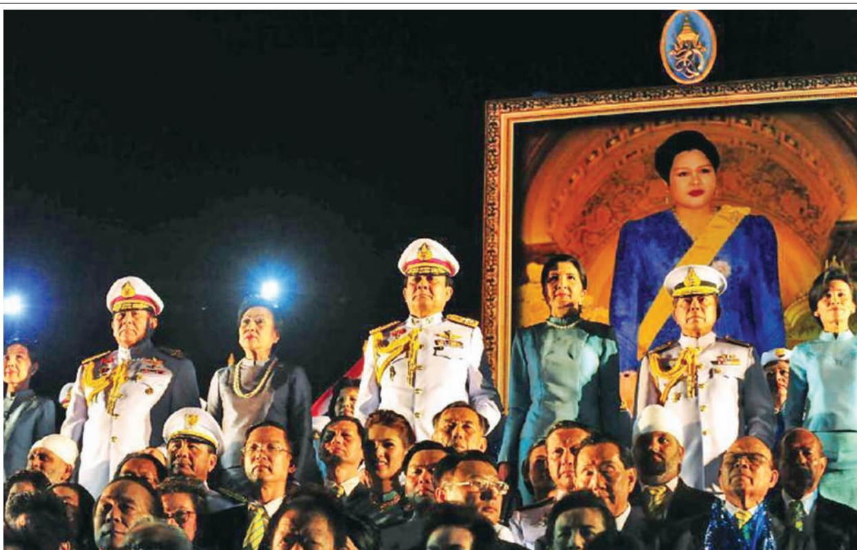
Thai Army Chief Gen Prayuth Chan-ocha (C) presides over the celebration for Thai Queen Sirikit on her 82 nd birthday in Bangkok, Thailand, on 12 Aug, 2014. Thailand celebrated Queen Sirikit's birthday on 12 August.