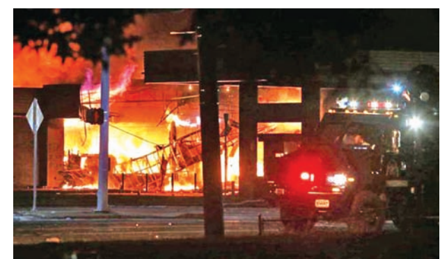
A QuikTrip convenience store burns during a night of rioting in Ferguson, Missouri on 10 Aug, 2014.