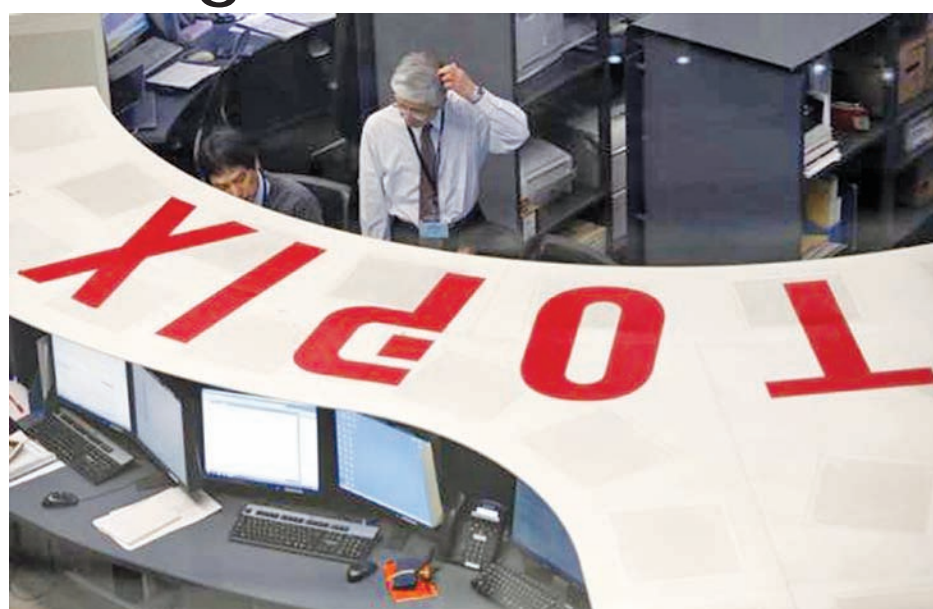
Employees of the Tokyo Stock Exchange (TSE) look at a monitor at the bourse at the TSE in Tokyo on 3 March, 2014 file photo.

Eight of the S&P’s 10 primary sector indexes ended higher. Consumer staples shares posted the highest increases as the