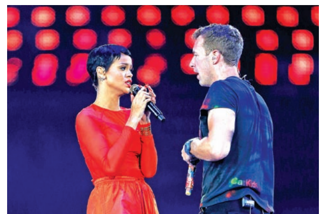
Rihanna and Chris Martin

LOS ANGELES, 12 Aug — Coldplay frontman Chris Martin hopes to work with Rihanna again after teaming up with the 'Umbrella' hitmaker for her next album recently. Martin said he composed new music for Rihanna's next album but he is not sure whether she has kept it.