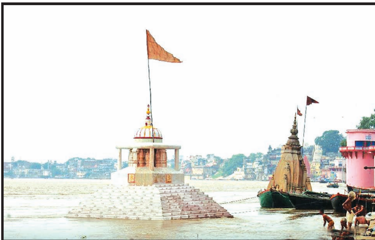
Temples are submerged in the overflowing Ganga River in Varanasi, India on 11 Aug, 2014. The Ganga water level has been rising for days due to rains.

Italy argues that the case sets dangerous and wide-ranging precedents for any country involved in anti-piracy missions overseas. Italy has said it may also seek international arbitration in the case. — Xinhua