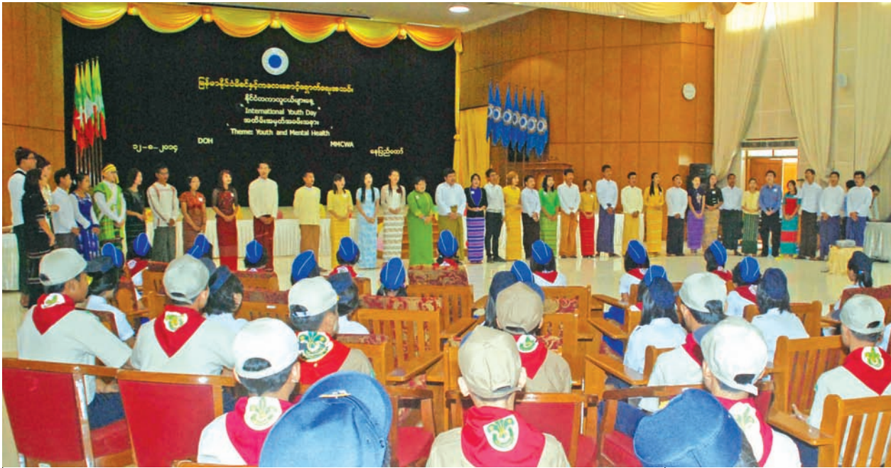
MMCWA observes International Youth Day which this year has a theme focusing on mental health of young people and the importance of maintaining it as well as helping kids with mental health issues.—MNA