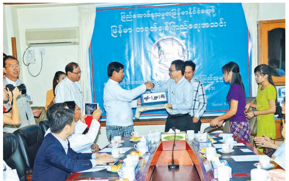
Officials of Myanmar-China friendship association donate copybooks and cash for flood victims.

YANGON, 12 Aug —The Myanmar-China Friendship Association donated copybooks and cash for rice to be provided to flood victims of Yangon Region, at Wizaya Plaza on U Wisara Road in Yangon on Tuesday morn-