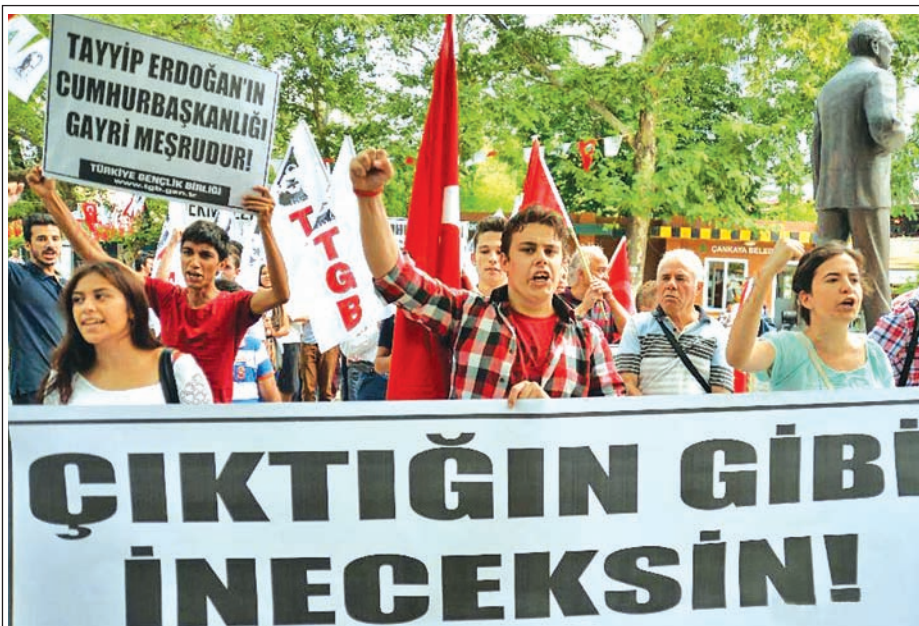
People shout slogans during a demonstration against Turkish Prime Minister Recep Tayyip Erdogan in Ankara on 11 August. Presidential hopeful and Prime Minister Recep Tayyip Erdogan is set to become Turkey's first popularly-elected president after unofficial ballot counting credited him with more than half the vote, local media said on Sunday.