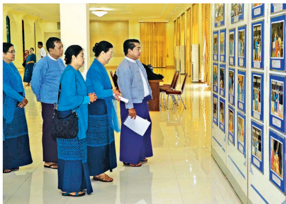
Union Minister for Health Dr Than Aung views round documentary photos on breastfeeding movements of MWAFF depicting maternal and child health.—MNA

Globally, the 2014 them was developed by the World Alliance for Breastfeeding Action (WABA), highlighting the framework of the Millennium Devel-