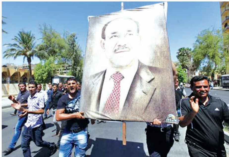
Iraqis carry a portrait of Iraqi Prime Minister Nuri al-Maliki as they march in support of him in Baghdad on 11 Aug, 2014. — REUTERS

US President Barack Obama said the naming of a new prime minister was an important stride for Iraq toward rebuffing Islamic State militants, who have overrun large swathes of northern Iraq. — Reuters