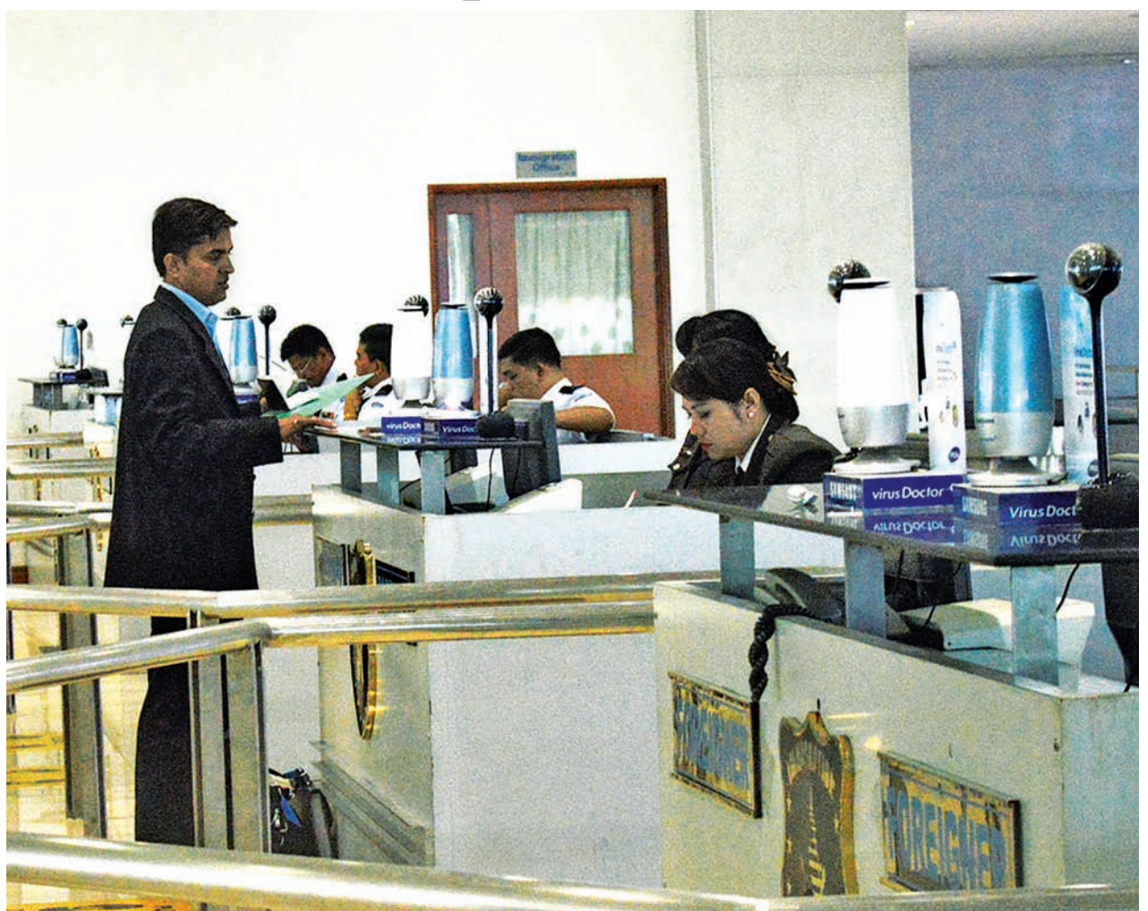
A foreign visitor at Yangon International Airport's immigration counter. Myanmar will officially launch an e-visa online system on 1 September, enabling all tourists to Myanmar to get e-visas within five days.