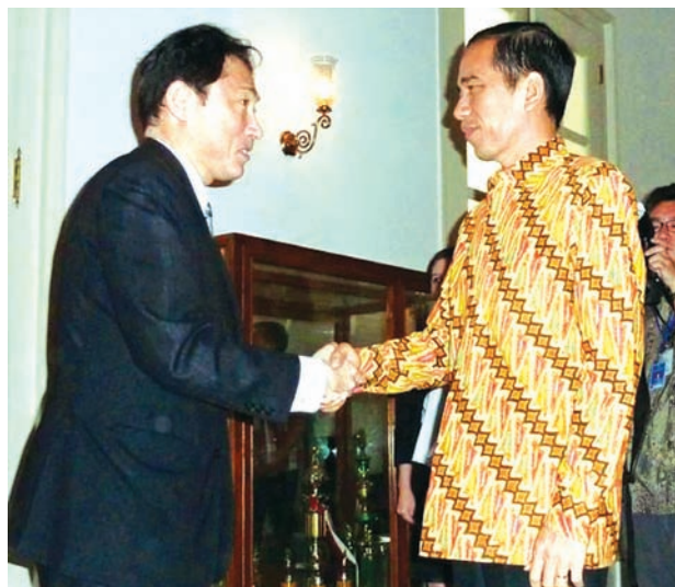
Japan's Foreign Minister Fumio Kishida (L) shakes hands with Indonesia's president-elect Joko "Jokowi" Widodo in Jakarta, Indonesia, on 12 Aug, 2014. They agreed to enhance bilateral relations in the fields of security and economy.

"Japan and Indonesia are important partners, and Japan (has already been) our largest partner," Jokowi said, citing a data on the two countries' total trade