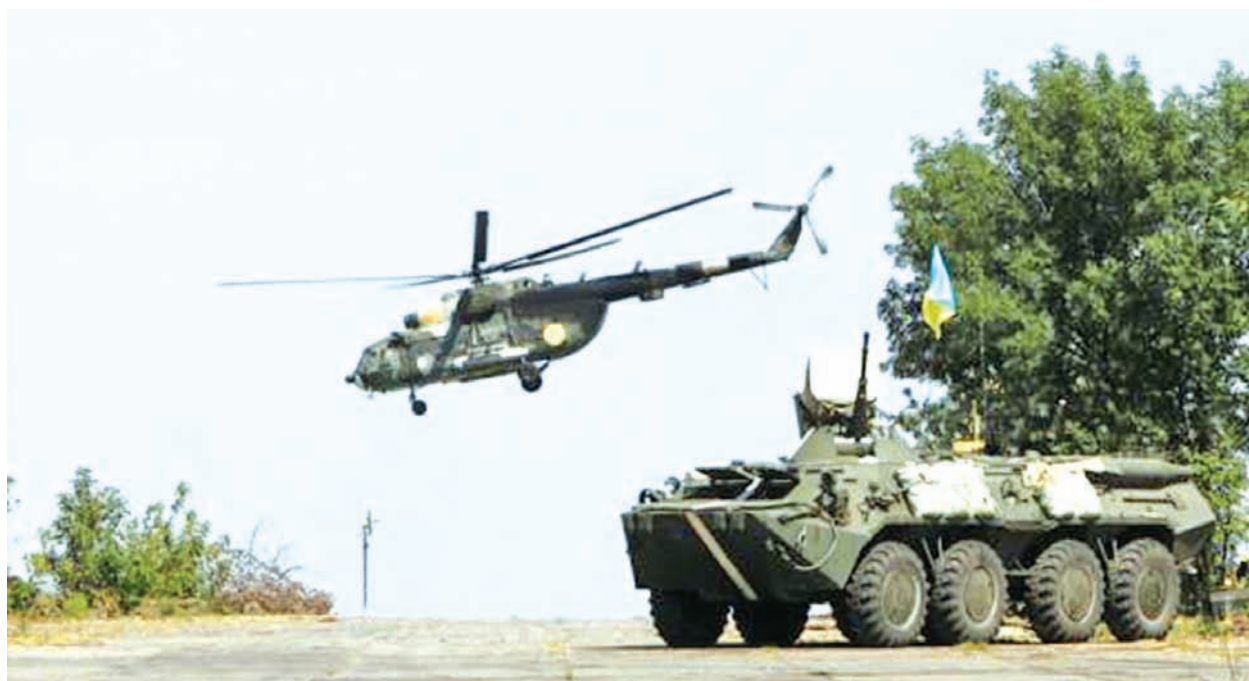
A Ukrainian army helicopter flies near an armored personnel carrier (APC) near Donetsk on 9 August, 2014.

Western countries believe that Putin — who has whipped up the passions of Russians with a nationalist campaign in state-controlled media since annexing Crimea from Ukraine in March — could now send his forces into the east to head off a humiliating rebel defeat. Thousands of people are believed to be short of water, electricity and medical aid due to the fighting, but US President Barack Obama told his Ukrainian counterpart that any Russian intervention without Kiev's consent would be unacceptable and violate international law.