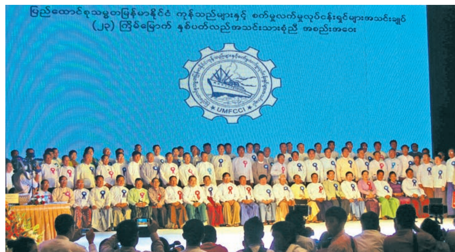
Patron, President, CEC, EC members of UMFCCI pose a documentary photo all together at 23 rd its annual meeting.

Electric Power routed Social Welfare, Relief and Resettlement 5-2 at the training ground No 3 and Agriculture and Irrigation played a 1-1 draw with Defence at the training ground No 4.—MNA