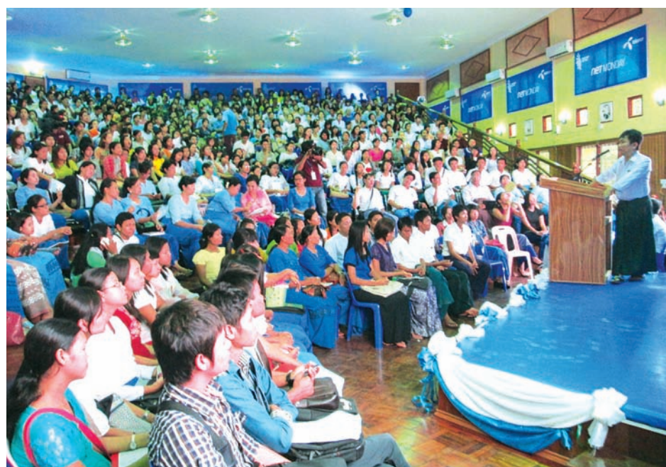
Responsible person of Telenor Myanmar Company explains communication services of the company to faculty members and students at Mandalay University.