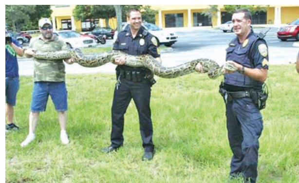
Port St Lucie police officers display a captured 12-foot Python in this 8 Aug, 2014 handout photo provided by the Port St Lucie Police Department on 11 Aug, 2014.—REUTERS

Pythons are an exotic species and growing nuisance in Florida where they