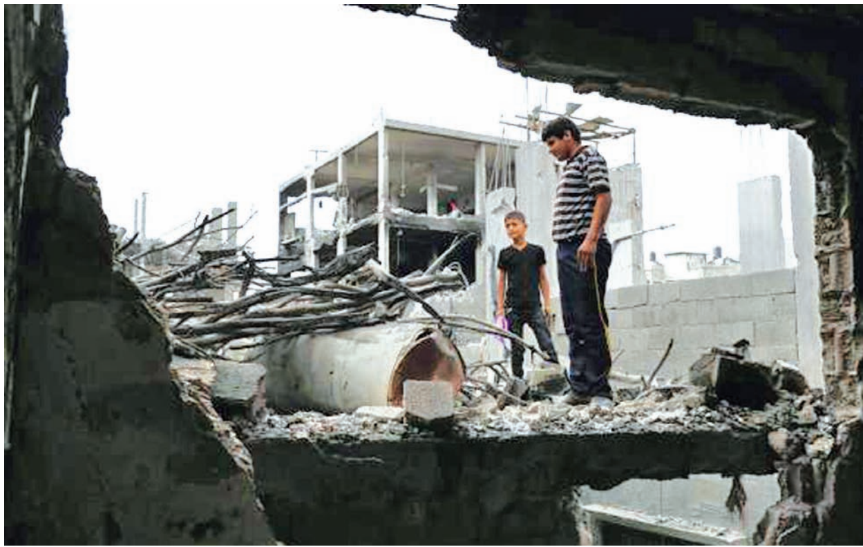
Palestinian youth who fled their neighbourhood during an Israeli offensive, inspect damages caused to their home in the Beit Hanoun area during a 72-hour ceasefire, Gaza City, on 11 Aug, 2014.—REUTERS

Sevdije Morina, from the Special Prosecution unit, said the prosecution is also investigating some imams.—Xinhua