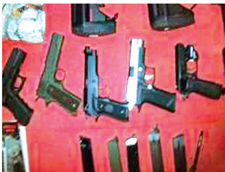
Air guns and bullets handed over by people to police stations in Yangon Region to reduce crime and ensure safety.