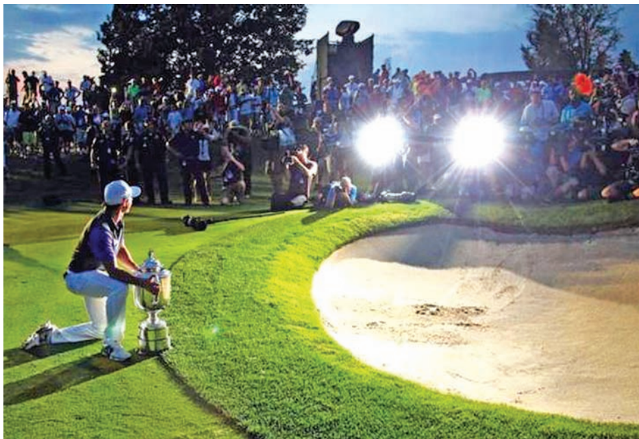
PGA golfer Rory McIlroy poses with the Wanamaker Trophy after winning the 2014 PGA Championship golf tournament at Valhalla Golf Club.

LOUISVILLE, (Kentucky), 12 Aug — Talk of the 'Tiger era' being replaced by a 'Rory era' escalated after Rory McIlroy thrust himself into golf's pantheon of greats by clinching his fourth major title at the 96th PGA Championship on Sunday.