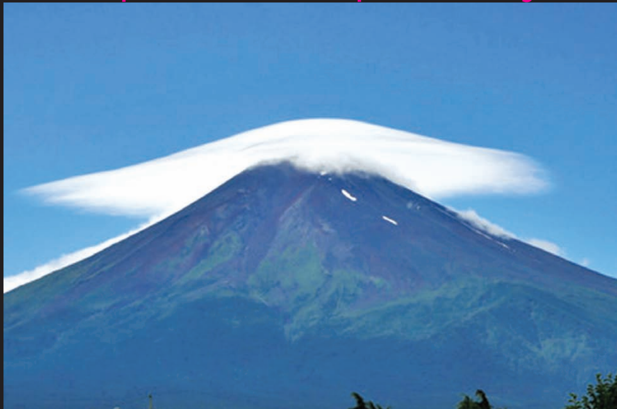
A cap cloud on top of Mt Fuji is pictured on 11 Aug, 2014, from Fujiyoshida, Yamanashi Prefecture, central Japan, in a clear sky after Typhoon Halong passed.