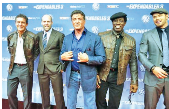
Actors (L-R) Antonio Banderas, Jason Statham, Sylvester Stallone, Wesley Snipes and Kellan Lutz pose on the red carpet for the German premiere of "The Expendables 3" in the western German city of Cologne on 6 Aug, 2014.

Lions Gate said in court filings that all the pirated copies of the film originate from a single, high-quality digital file that had been stolen.—Reuters