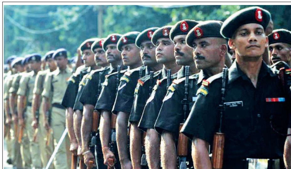
Armed Police Forces march during a rehearsal ahead of the Independence Day celebration in eastern Indian state Orissa's capital city Bhubaneswar on 11 Aug, 2014.