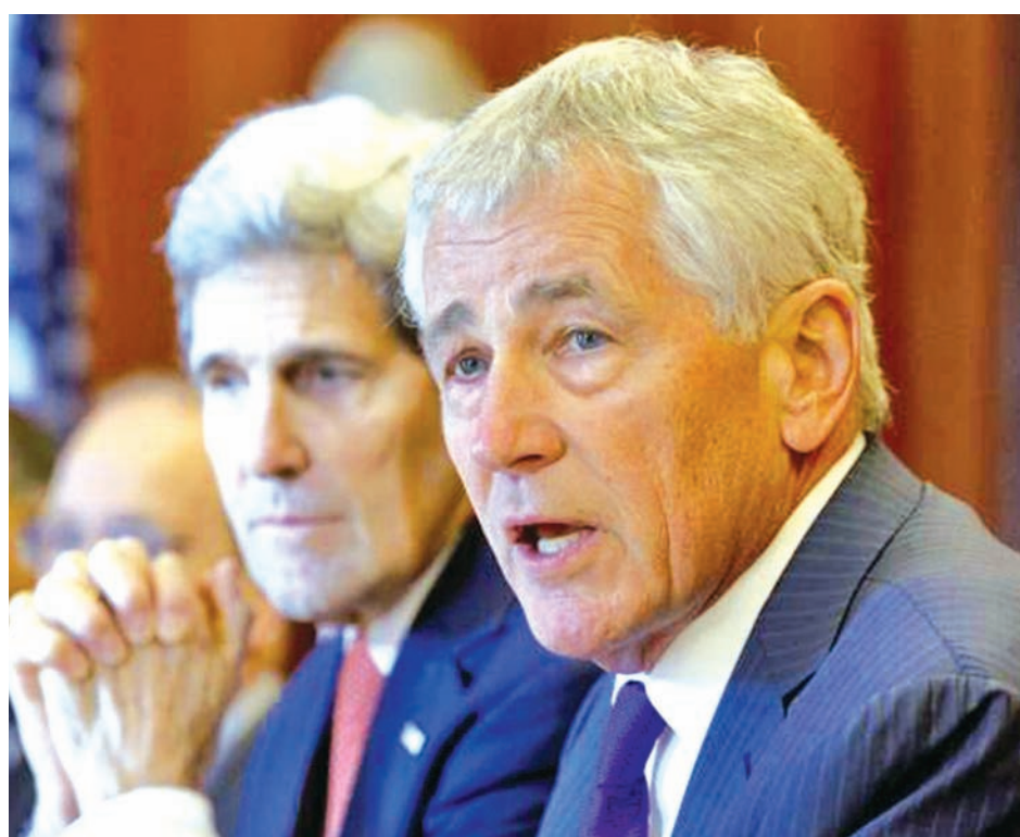
US Secretary of Defence Chuck Hagel (R) speaks alongside US Secretary of State John Kerry (2nd R) at the start of their AUSMIN meeting with Australian Defence Minister David Johnston and Australian Foreign Minister Julie Bishop at Admiralty House in Sydney, on 12 Aug, 2014.