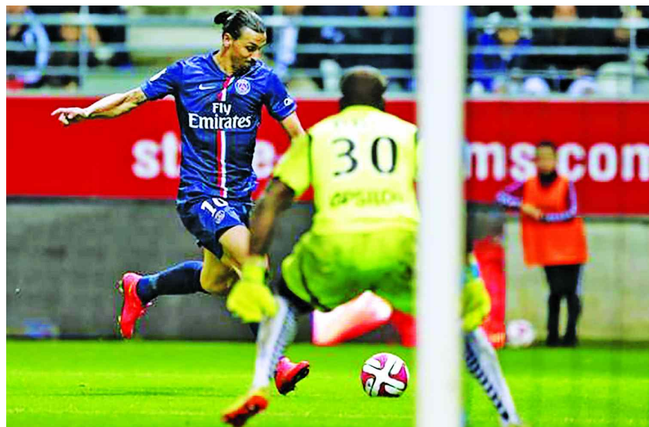
Zlatan Ibrahimovic (L) of Paris St Germain scores his second goal during their French Ligue 1 soccer match against Reims at the Gustave Delaune Stadium in Reims on 8 Aug, 2014.