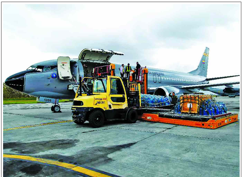
Members of the Colombian Air Force move a shipment of water at the military base of Catam, in Bogota, Colombia, on 8 Aug, 2014. A plane of the Aerial Command of Military Transport moved 20 tons of water to La Guajira department, to help mitigate the severe drought. — XINHUA

Ukrainians and Russian Ukrainians in the east are losing their lives, but the whole country is paying the price of conflict as a result of the deterioration of social services,” he said. — Xinhua