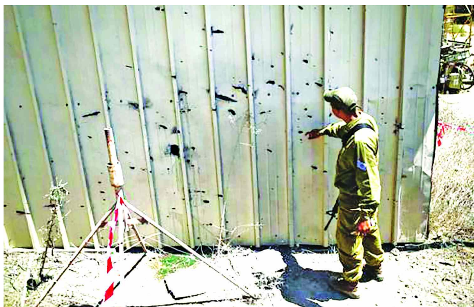
An Israeli soldier inspects the damage caused by a rocket launched from Gaza to Israel in a village near the Israeli-Gaza border on 8 Aug, 2014.

GAZA / JERUSALEM, 9 Aug — Israel launched air strikes across the Gaza Strip on Friday in response to Palestinian rockets after Egyptian-mediated talks failed to extend a 72-hour truce in a month-old war.