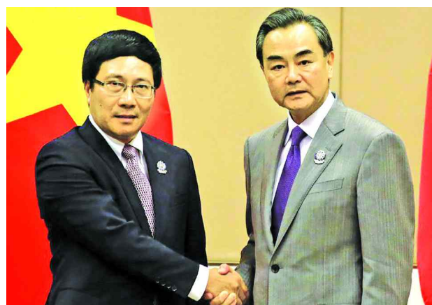
Chinese Foreign Minister Wang Yi (L) meets with Vietnamese Deputy Prime Minister and Foreign Minister Pham Binh Minh on the sidelines of the series of Foreign Ministers' Meetings on East Asia cooperation in Myanmar's capital Nay Pyi Taw, on 8 Aug, 2014.

NAY PYI TAW, 9 Aug — Chinese Foreign Minister Wang Yi met with Vietnamese Deputy Prime Minister