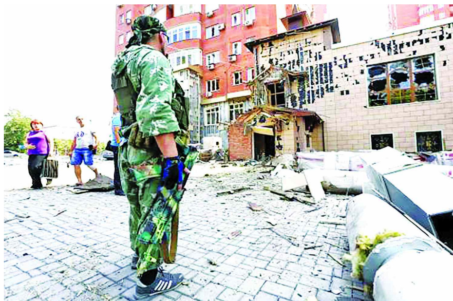
An armed pro-Russian separatist stands in front of damaged buildings following what locals say was shelling by Ukrainian forces in Donetsk on 7 Aug, 2014.

The Kiev government and its Western allies accuse Russia of seeking to