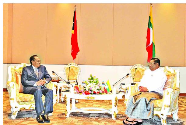
Union Minister U Wunna Maung Lwin holds talks with Dr. Jose Luis Guterres, Senior Minister and Minister of Foreign Affairs and Cooperation of Timor-Leste.