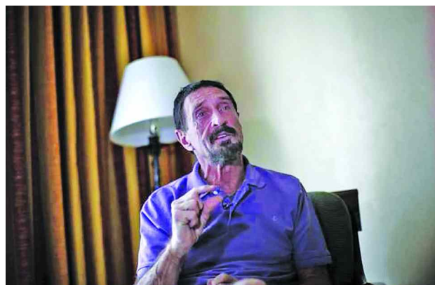
John McAfee, anti-virus software guru, speaks during an interview with Reuters in Guatemala City, on 5 Dec, 2012 file photo.

LAS VEGAS, 9 Aug — John McAfee, the flamboyant anti-virus software industry pioneer, made a surprise appearance at a computer hackers' conference on Friday evening,