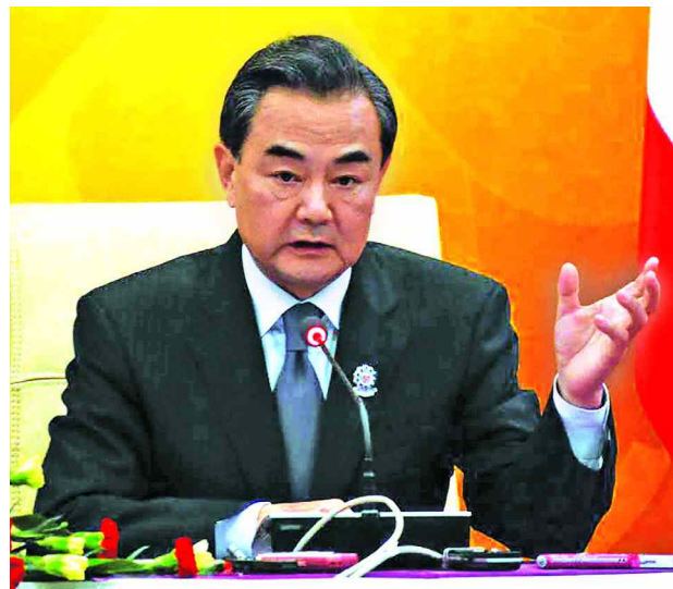
Chinese Minister of Foreign Affairs Wang Yi explains attitude of China for ASEAN+China at press conference.