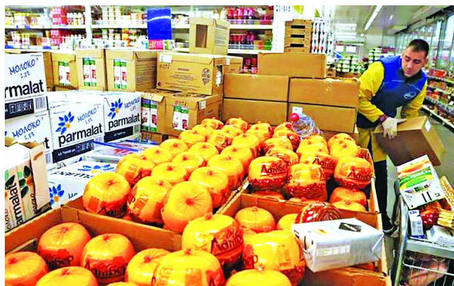
An employee sorts products at a Metro Cash and Carry store in Moscow on 8 Aug, 2014.

"I am confident that our resilient farm sector will reorient rapidly towards new markets and opportunities."