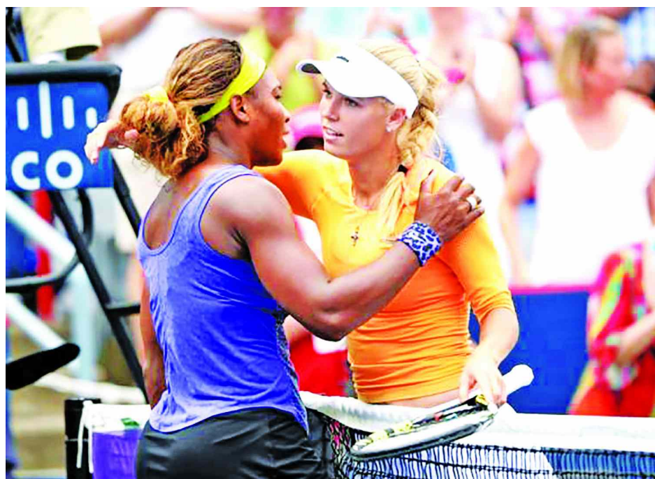
Serena Williams (USA) (Left) hugs Caroline Wozniacki (DEN) after their match on day five of the Rogers Cup tennis tournament at Uniprix Stadium. Williams won 4-6, 7-5, 7-5.

"I definitely don't like playing her," explained Serena. "I think I've lost to her more than anyone on the tour. Definitely not a fun match."