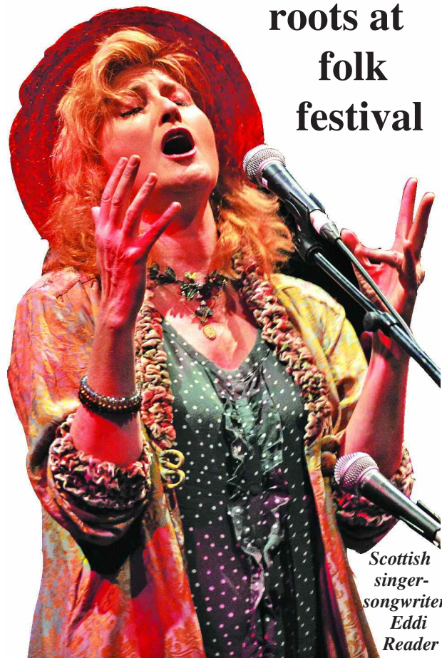
Scottish singer-songwriter Eddi Reader