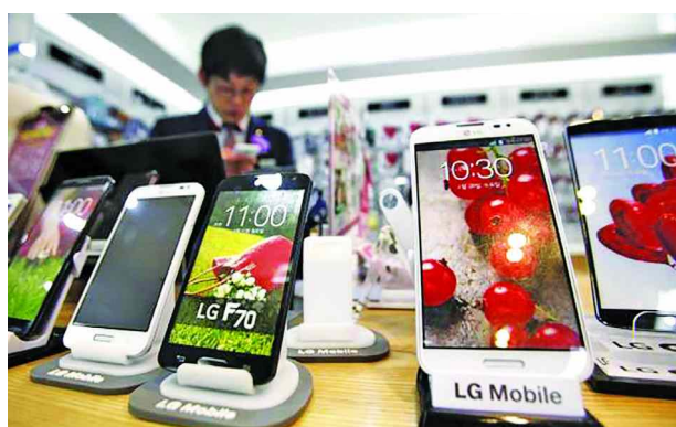
A sales assistant uses his mobile phone in front of mock LG electronics smart phones displayed at a store in Seoul on 22 July, 2014.

It could struggle to pick up meaningful early market share as it won't have local carriers pushing