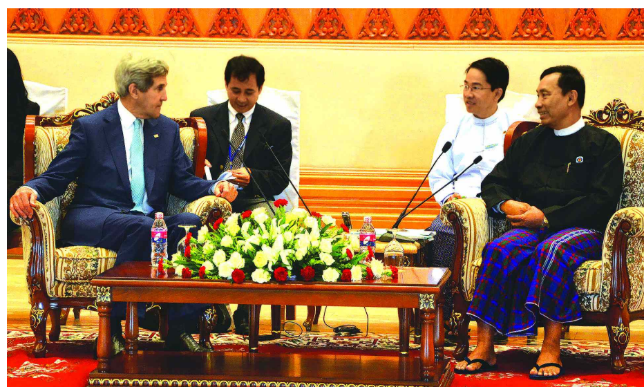
Pyidaungsu Hluttaw and Lower House Thura U Shwe Mann and U.S. Secretary of State John Kerry meet at a discussion on democratic reform process of Myanmar.

rule of law, cooperation of all organizations, including Hluttaw, in amend-