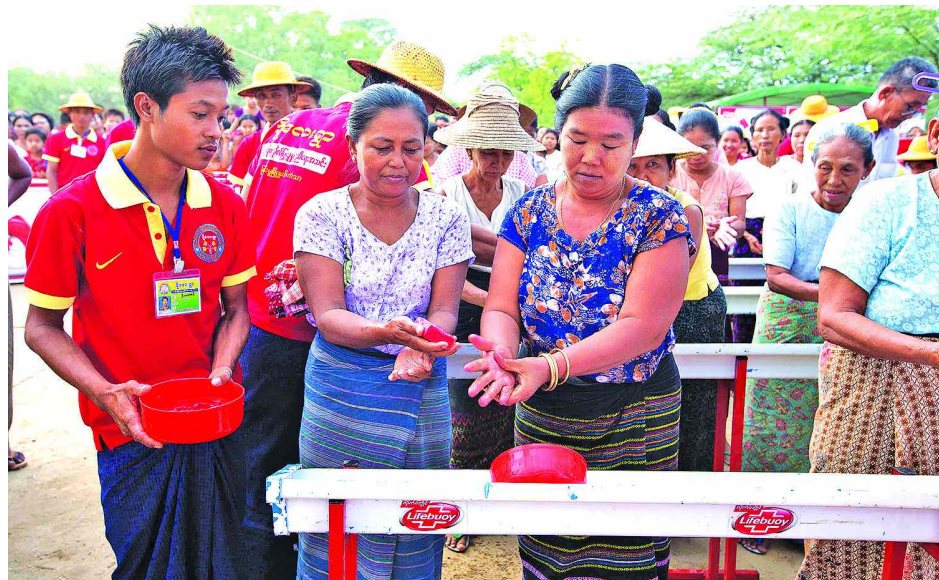
Residents from Kanthadwingyi Village take part in lifesaving handwashing activity.

dies every 15 seconds from these diseases.—NLM