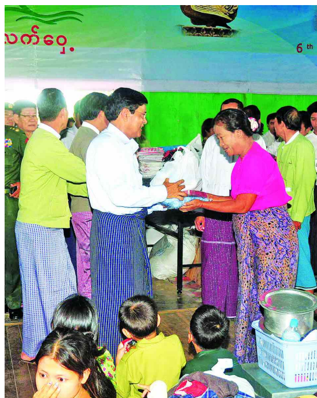
Vice President U Nyan Tun presents supplies to flood victims in Bago.

NAY PYI TAW, 9 Aug—The Bago region government has provided flood victims with food and paddy seeds.