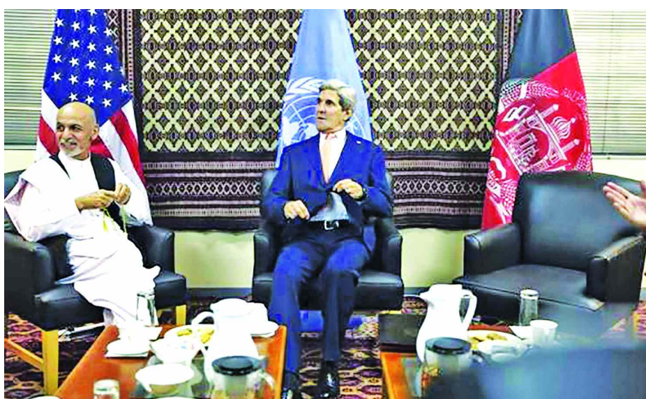
US Secretary of State John Kerry (R) speaks as Afghanistan's presidential candidate Ashraf Ghani Ahmadzai looks on during a meeting at the US embassy in Kabul on 8 Aug, 2014.

There were no fresh details of how a government of national unity