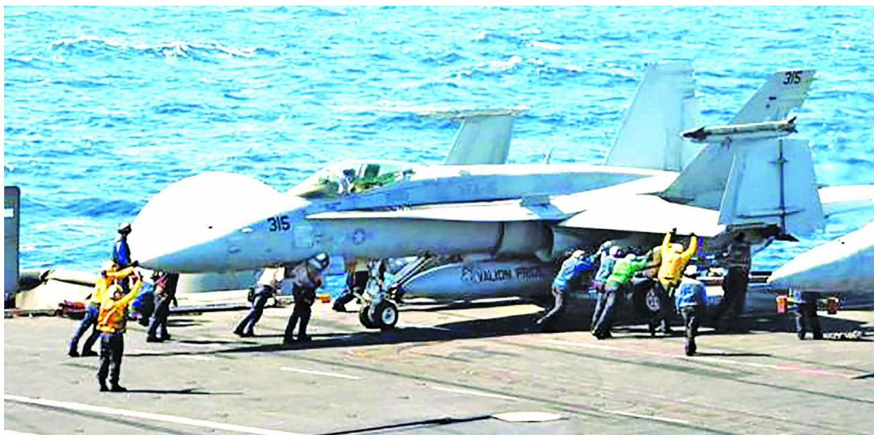
Sailors guide an F/A-18C Hornet assigned to the Valions of Strike Fighter Squadron (VFA) 15 on the flight deck of the aircraft carrier USS George HW Bush (CVN 77) in the Gulf, in this handout image taken and released on 8 Aug, 2014.

Obama authorised the first US air strikes on Iraq since he pulled all troops out in 2011, arguing action was needed to halt the