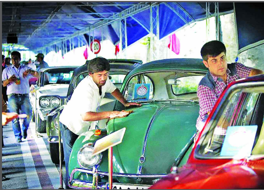
Two men clean cars during a classic car exhibition in Teheran, Iran, on 8 Aug, 2014. More than 70 classic cars are displayed during the six-day-long exhibition.