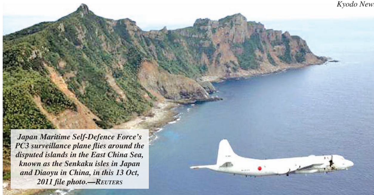
Japan Maritime Self-Defence Force's PC3 surveillance plane flies around the disputed islands in the East China Sea, known as the Senkaku isles in Japan and Diaoyu in China, in this 13 Oct, 2011 file photo.