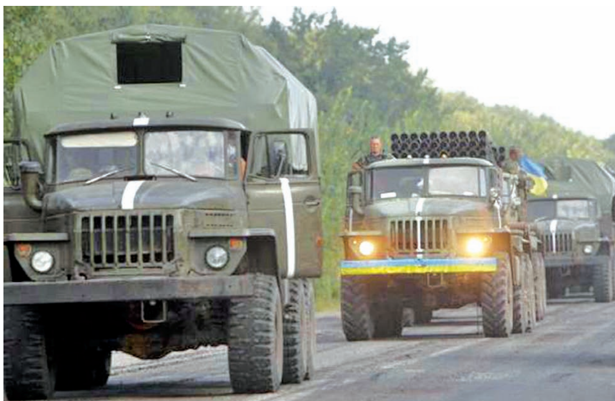
Ukrainian servicemen are seen inside army vehicles on a road in Donetsk region on 6 Aug, 2014.