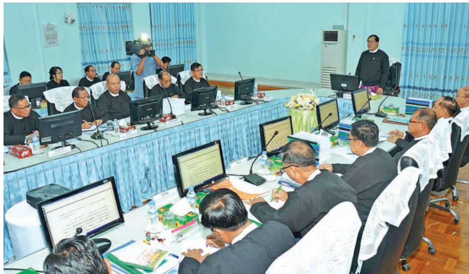
Chief Justice U Tun Tun Oo calling on judiciaries to pass judgements which are unbiased and unprejudiced at seventh work coordination meeting.—MNA

NAY PYI TAW, 7 Aug — The Supreme Court of the Union held its seventh work coordination meeting with its courts of regions and states here on