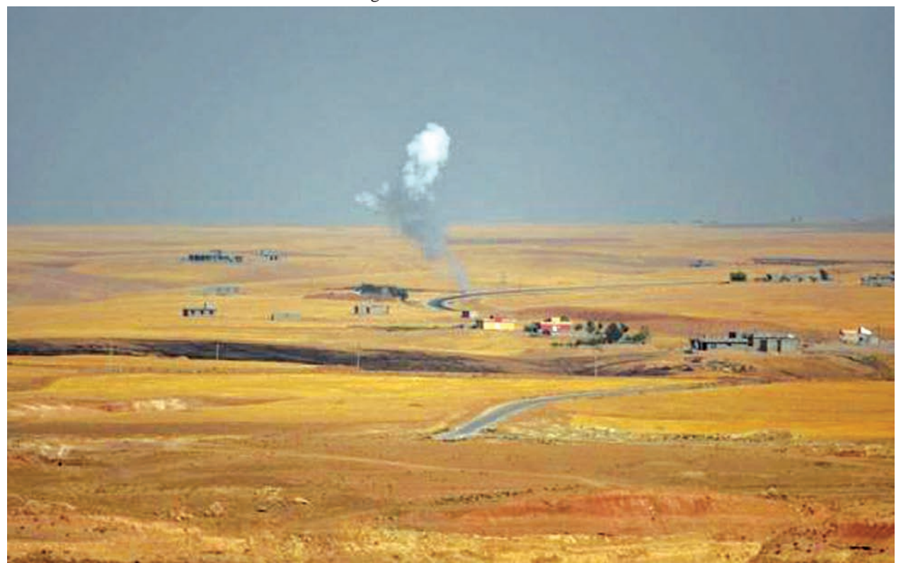
Smoke rises during clashes between Kurdish "peshmerga" troops and militants of the Islamic State, formerly known as the Islamic State in Iraq and the Levant (ISIL), on the outskirts of Sinjar, west of Mosul, on 5 Aug, 2014.—REUTERS

after the Sunni militants inflicted a humiliating defeat on Kurdish forces in a weekend sweep in the north. — Reuters