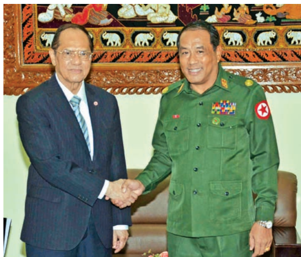
Deputy Minister for Home Affairs Brig-Gen Kyaw Kyaw Tun shaking hands with Mr Panthep Klanarogran.

NAY PYI TAW, 7 Aug — Deputy Minister for Home Affairs Brig-Gen Kyaw Kyaw Tun accepted a call by a Thai delegation led by Mr Panthep Klanarogran of the Nation-