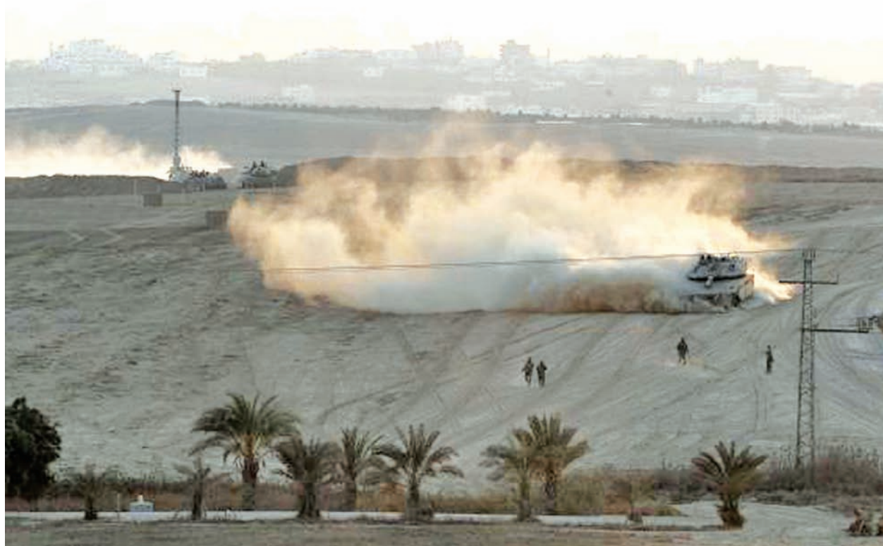
Israeli machines (top L) work on destroying a tunnel, as Israeli soldiers return to Israel from Gaza (seen in the background) on 3 Aug, 2014.

GAZA / CAIRO, 7 Aug — A 72-hour Gaza truce held through its second day on Wednesday and Israel said it was ready to extend the deal as Egyptian mediators pursued talks with Israelis and Palestinians