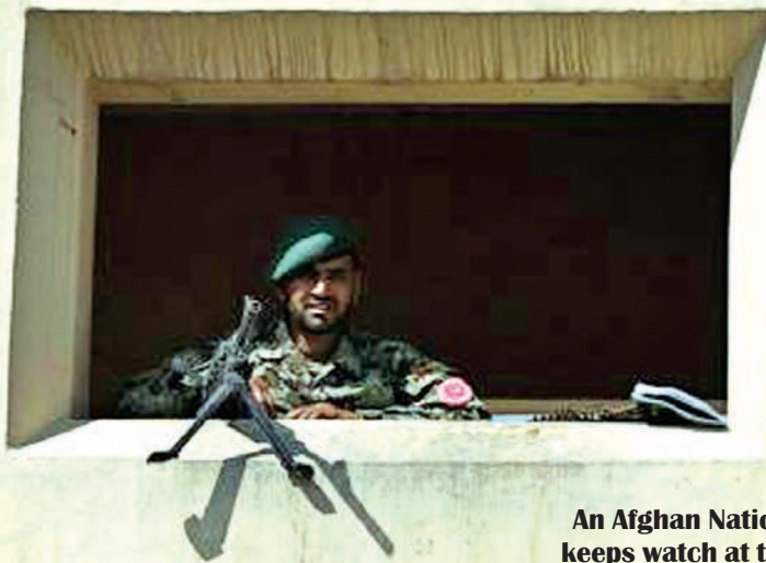
An Afghan National Army (ANA) soldier keeps watch at the gate of a British-run military training academy Camp Qargha, in Kabul on 5 Aug, 2014.