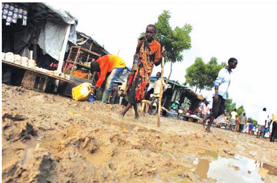
People walk through the mud in an internally displaced persons (IDP) camp inside the UN base in Malakal, on 25 July, 2014.

At least 10,000 people have been killed since fierce fighting erupted in December, pitting President Salva Kiir's government forces against supporters of Riek Machar, his former deputy and long-