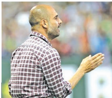
Bayern Munich head coach Josep Guardiola reacts during the 2014 MLS All Star Game at Providence Park in Portland, on 6 Aug, 2014.