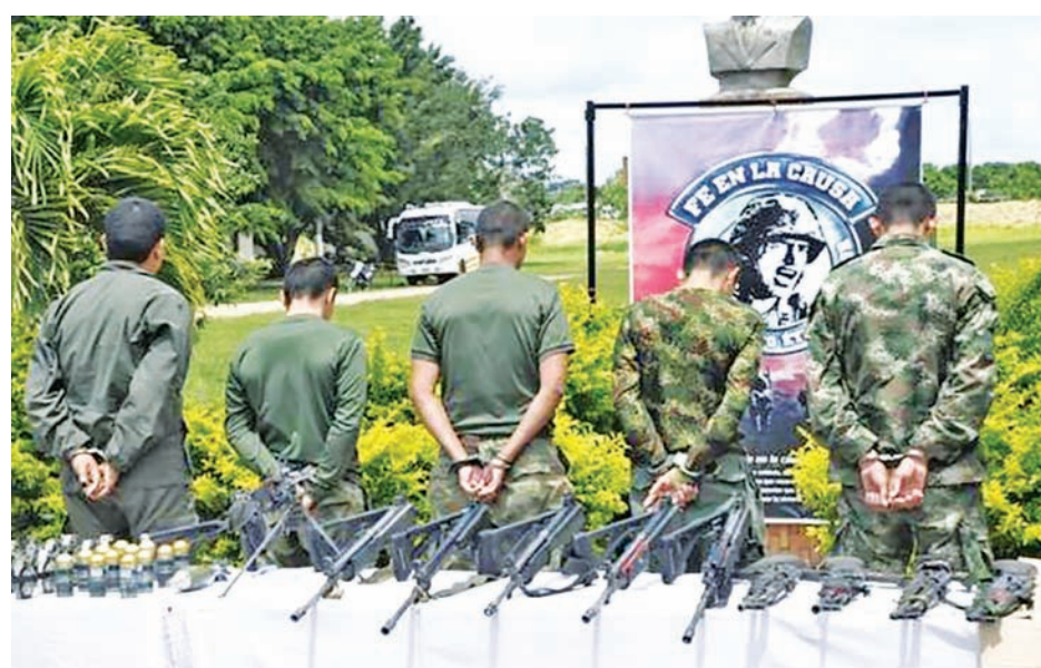
FARC rebels who were arrested by army troops in combat are pictured from behind alongside seized weapons at an army base in Tame, Arauca province on 21 July, 2013, in this handout photo provided by the Defence Ministry. —REUTERS