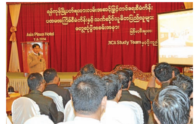
Myanmar Railways undertakes public consultation to hear voices of parties concerned over implementation of the Yangon circular rail line upgrading project.

(from page 1) legal action will be taken against squatters, adding that several lawsuits against those who built apartments on MR property in some townships are underway. For some houses, shops and other buildings that will be included in the project area, MR has a plan to relocate and resettle project-affected people through appropriate ways and means for them and will launch a compensation plan.