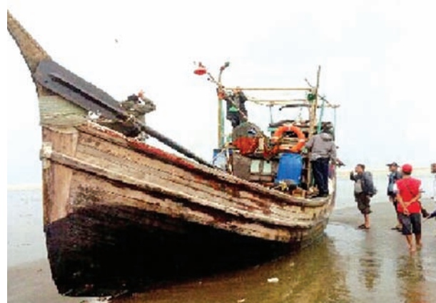
A motorized boat carrying stimulant tablets seen after being seized.

Further investigation is under way to bring smugglers to justice.—MNA