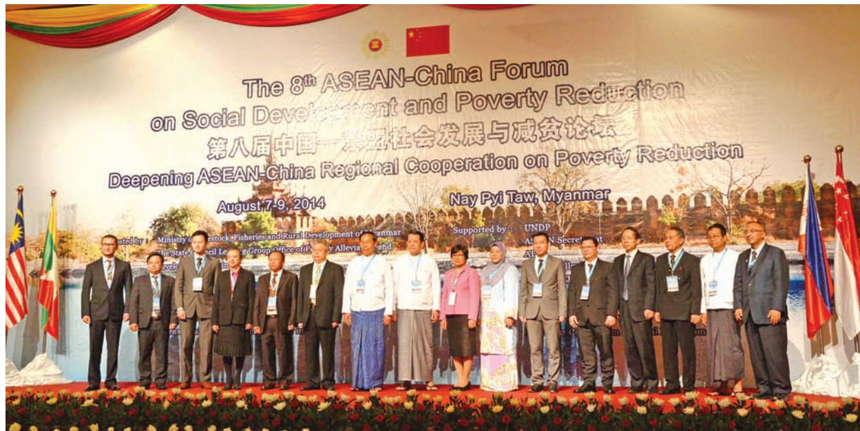
Minister for Livestock and Fishery U Ohn Myint posing for documentary photo together with delegates to 8 th ASEAN-China forum.—MNA

NAY PYI TAW, 7 Aug — 8 th ASEAN-China forum on Social Development and Poverty Reduction was held at the Grand Ballroom of the Thingaha Hotel in Nay Pyi Taw on Thursday.