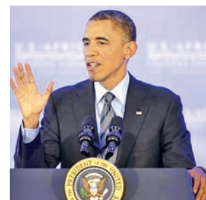
US President Barack Obama leans out to listen to a question during a news conference at the conclusion of the US-Africa Leaders Summit at the US State Department in Washington on 6 Aug, 2014.

WASHINGTON, 7 Aug — President Barack Obama on Wednesday backed Egyptian efforts to broker a durable Israel-Hamas ceasefire in Gaza but also called for a longer-term solution that provides for Israeli security while offering Gaza residents hope they will not remain "permanently closed off from the world."