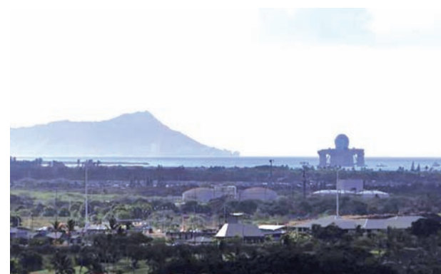
The US Navy Sea-based X-Band radar leaves Pearl Harbor as two hurricanes approach the Hawaiian islands, in Honolulu, Hawaii, on 6 Aug, 2014.

HONOLULU, 7 Aug — Hawaiians braced for a one-two punch from a pair of major storms headed their way on Wednesday, as Hurricane Iselle bore down on the islands packing high winds and heavy surf and Julio, tracking right behind, was upgraded to hurricane status. Iselle was about 620 miles (997 km) east of Hilo, on the Island of Hawaii, at 11 am Hawaiian Standard Time on Wednesday and heading west-northwest at 15 miles per hour (24 km per hour) with maximum sustained winds of 90 mph (144 kph), according to the