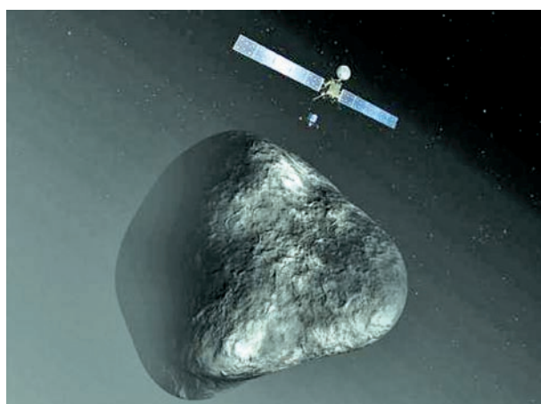
A handout image of an artist's impression, not to scale, of the Rosetta orbiter deploying the Philae lander to comet 67P/Churyumov-Gerasimenko, released by the European Space Agency (ESA) on 3 Dec, 2013.

"We know what the comet's shape is. But we haven't really measured its gravity, we don't know yet