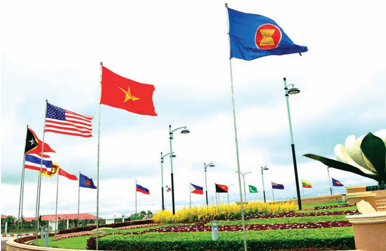
Delegates from 27 countries are attending the 47 th ASEAN Foreign Ministers' Meeting, 21 st ASEAN Regional Forum, 15 th ASEAN Plus Three FMM and 4 th East Asia Summit FMM in Nay Pyi Taw.