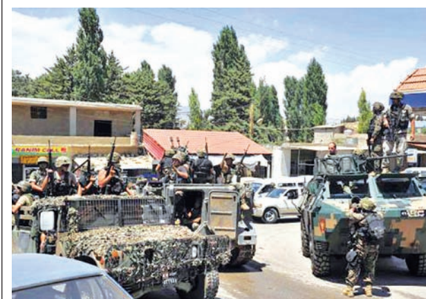
Lebanese army soldiers ride military vehicles, in Labwe in eastern Bekaa Valley on 6 Aug, 2014.

ON THE OUTSKIRTS OF ARSAL, (Lebanon), 7 Aug — Lebanon's army surrounded a border town occupied by Islamist militants on Wednesday as mediators reported progress in negotiations to end to the most serious spillover of Syria's civil war yet onto Lebanese soil. Soldiers arrested men and evacuated refugees from the hill town of Arsal on the border with Syria. One Syrian refugee said she had seen fighters' bodies lying in the streets.