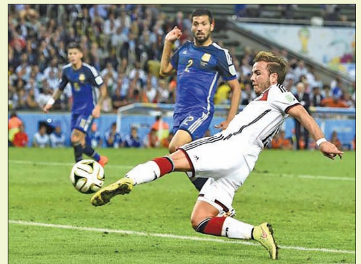
Germany's Mario Goetze shoots to score a goal against Argentina during extra time in their 2014 World Cup final at the Maracana stadium in Rio de Janeiro on 13 July, 2014.

He started Germany's first four matches but was replaced at halftime in the round of 16 match against Algeria. "Everyone wants to play as much as possible in the World Cup," said Goetze. "I think that I made a contribution to our winning the World Cup. Whenever I got my