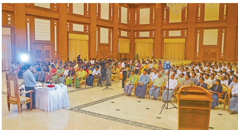
Thura U Shwe Mann in meeting with law students says main responsibility of parliament is to reflect public desires.—MNA

NAY PYI TAW, 7 Aug—Law students are responsible for striving to become legal experts who will help people see things realistically, Thura U Shwe Mann, Speaker of the Pyidaungsu Hluttaw and the Lower House, told a student delegation on its study tour of parliamentary functions on Thursday.