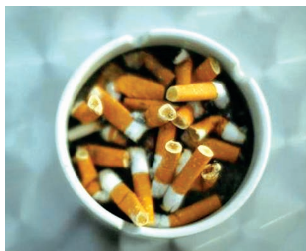
An ash tray with cigarette butts is pictured in Hinzenbach, in the Austrian province of Upper Austria, on 5 Feb, 2012.