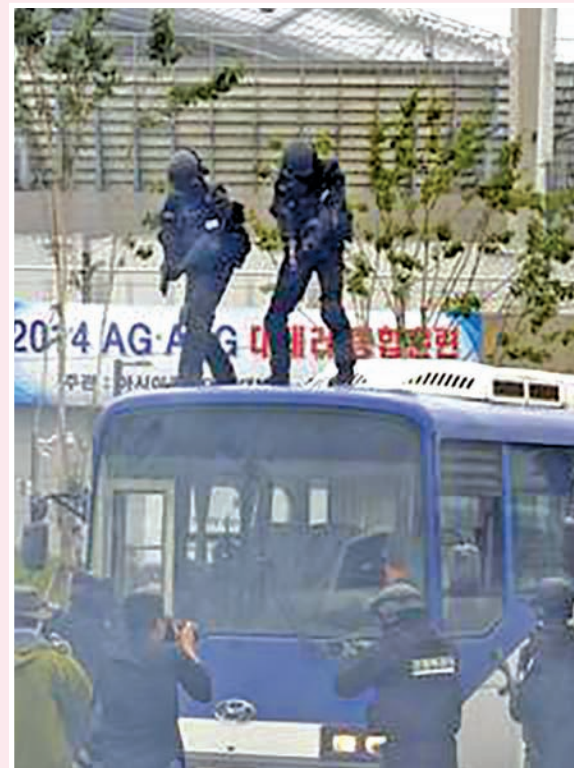
South Korean Special Weapons and Tactics (SWAT) personnel overpower a bus, which is presumed to have been hijacked, during an antiterror drill outside of Incheon Asiad Main Stadium, the main venue for the 19 Sept to 4 Oct Asian Games, in Incheon, South Korea, on 7 Aug, 2014.