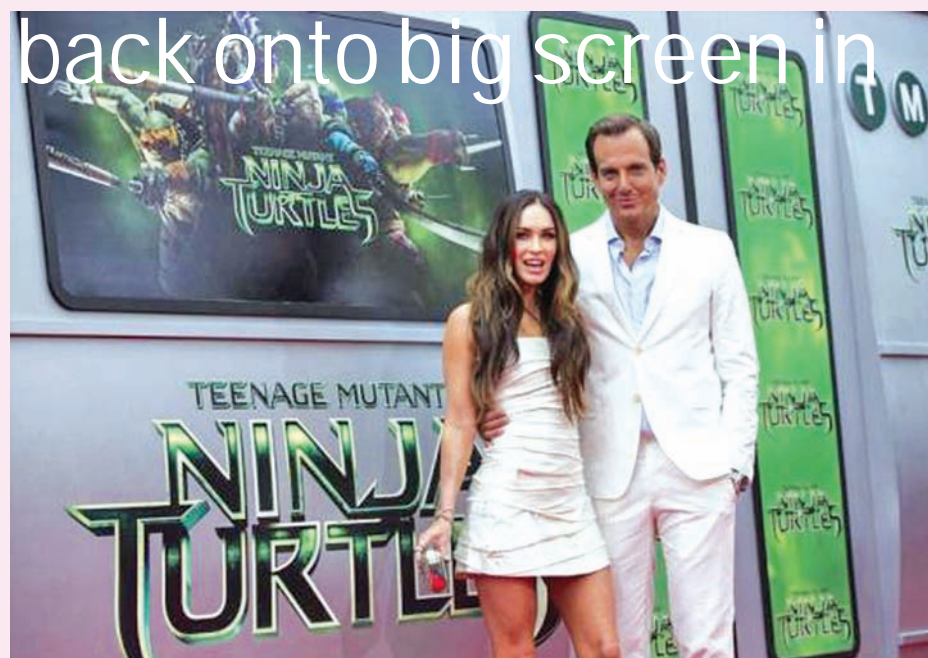
Cast members Megan Fox and Will Arnett pose at the premiere of "Teenage Mutant Ninja Turtles" in Los Angeles, California on 3 Aug, 2014.