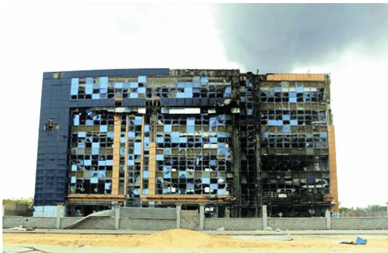
A damaged building is pictured after clashes between rival militias, in an area at Alswani road in Tripoli on 28 July, 2014.

The Netherlands, the Philippines and Austria on Monday prepared to evacuate diplomatic staff. The United States, United Nations and Turkish embassies