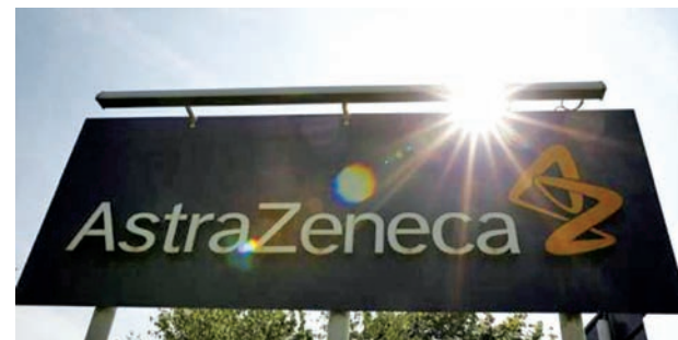
A sign is seen at an AstraZeneca site in Macclesfield, central England on 19 May, 2014.

LONDON, 29 July — AstraZeneca has signed up Roche and Qiagen to develop two separate diagnostic tests, both using simple blood samples, to identify patients who will benefit from its lung cancer drugs.