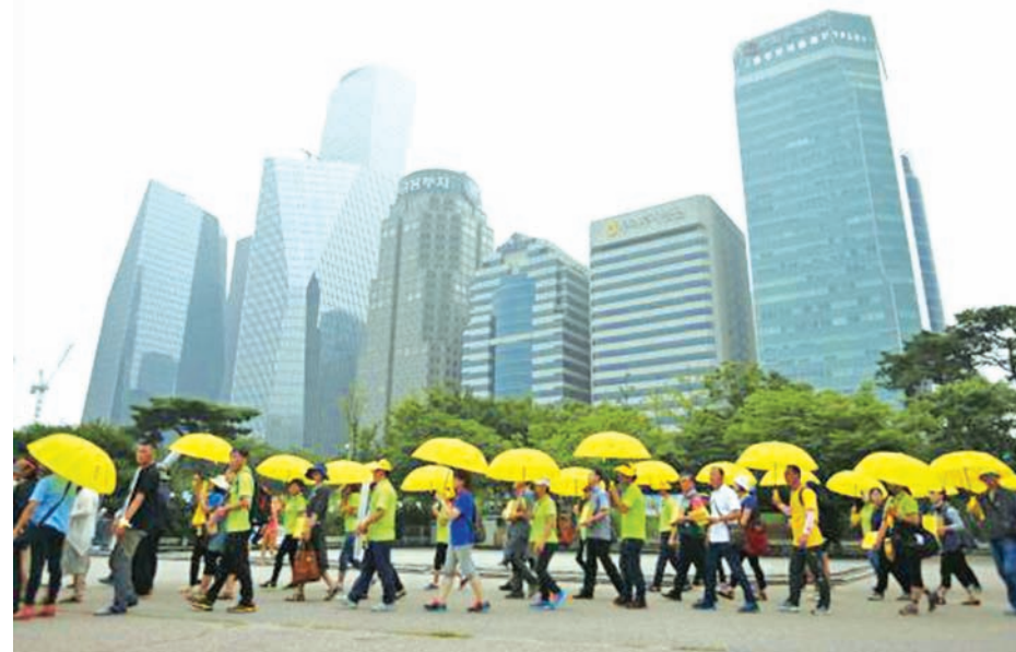
People holding yellow umbrellas in support of victims of the mid-April Sewol ferry disaster, carry boxes containing signatures of South Koreans petitioning for the enactment of a special law after the disaster, as they march towards the National Assembly at Yeouido Park in Seoul on 15 July, 2014. — REUTERS

The driver Yang was the last among a group of people close to Yoo who had been wanted for allegedly helping him elude South Korea's biggest man-hunt. — Reuters