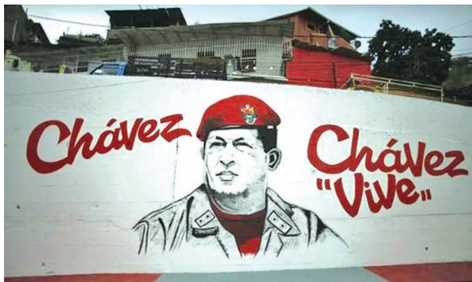
A mural of Venezuela's late President Hugo Chavez is seen at the 23 de Enero neighbourhood in Caracas on 5 March, 2014.

His signature, in red for socialist, adorns T-shirts, baseball caps and the walls of buildings around the nation. The new font can be downloaded for free from