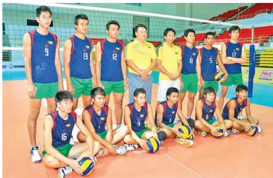
Players of Myanmar men's (A) team seen at gymnasium to take training for the volleyball championship.