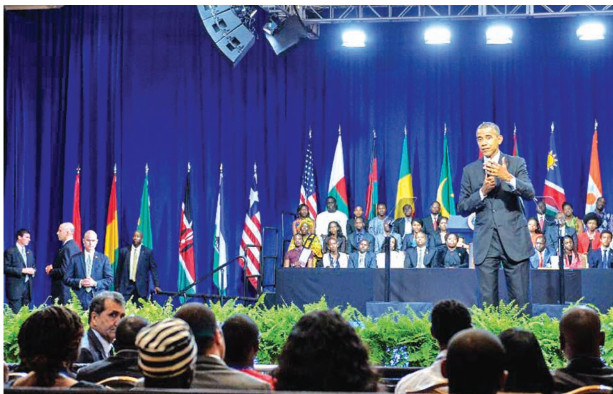
US President Barack Obama speaks during the Presidential Summit for the Washington Fellowship for Young African Leaders in Washington DC, capital of the United States, on 28 July, 2014. Around 500 young African leaders are invited to attend this summit and the number will double next year. To show respect for African Hero Nelson Mandela, the Washington Fellowship for Young African Leaders changed its name to Mandela Washington Fellowship for Young African Leaders, announced by Barack Obama during the summit.

The epicenter, with a depth of 10.0 km, was initially determined to be at 6.9048 degrees south latitude and 143.8461 degrees east longitude.— Xinhua