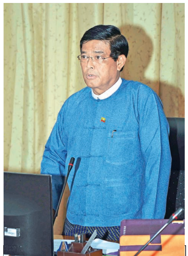
Vice President U Nyan Tun addresses second meeting on reduction plans of environmental degradation resulted from explorations of natural resources.