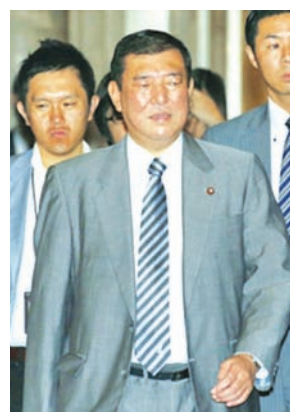
Liberal Democratic Party Secretary General Shigeru Ishiba.

After becoming head of the party, Abe picked