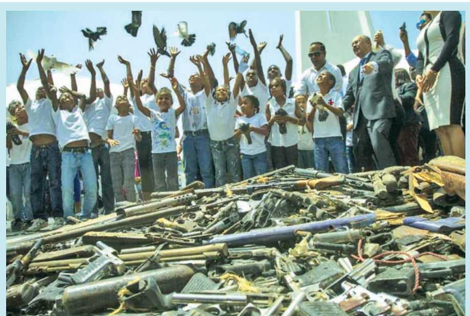
Children release doves during the destruction of weapons seized from criminals, in Santo Domingo, capital of Dominican Republic, on 28 July, 2014. The Dominican Republic's Attorney General led the destruction of more than 2,000 illegal firearms that had been seized in raids and operations in different areas of the country, according to the local Press.—XINHUA