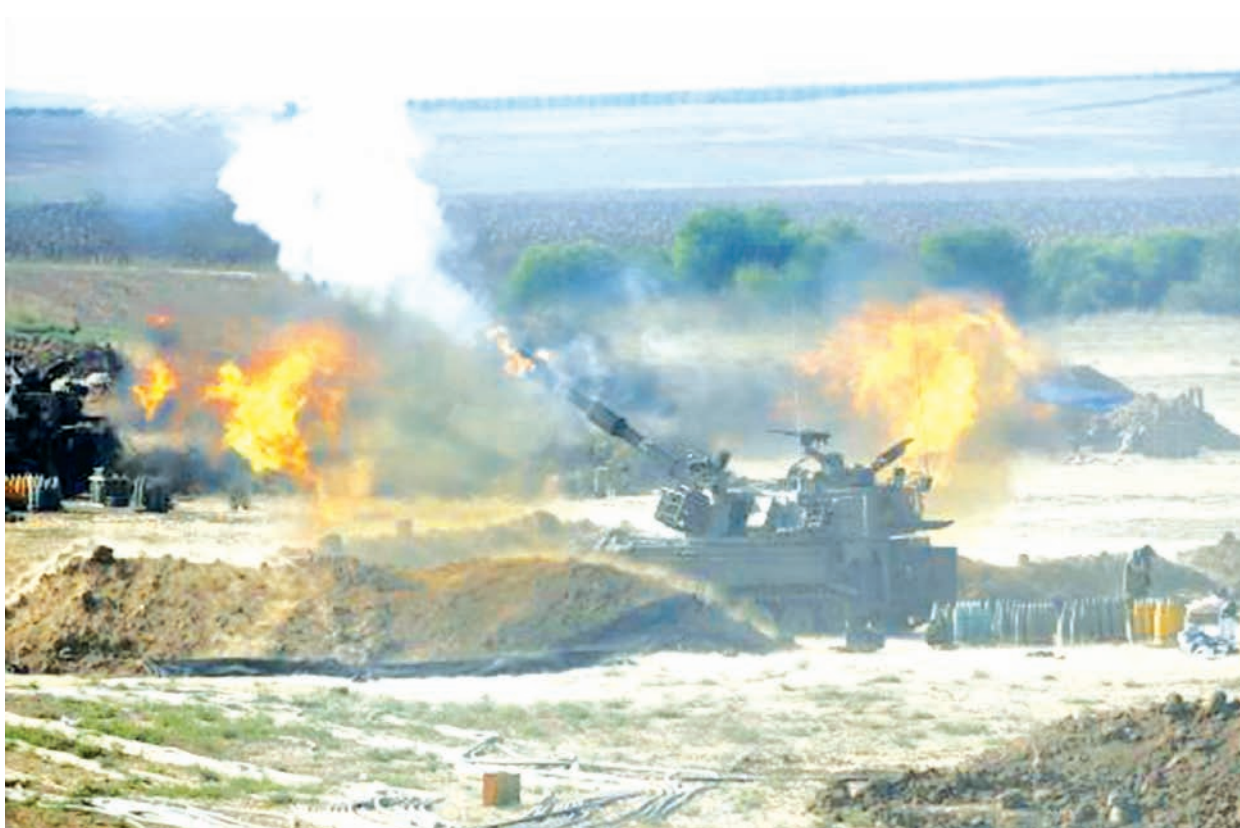
An Israeli mobile artillery unit fires towards the Gaza Strip on 28 July, 2014.

Israeli Army Radio said the Hamas gunmen fired a rocket-propelled grenade at the soldiers who were in a watchtower and then tried to drag one of the soldiers' bodies into the