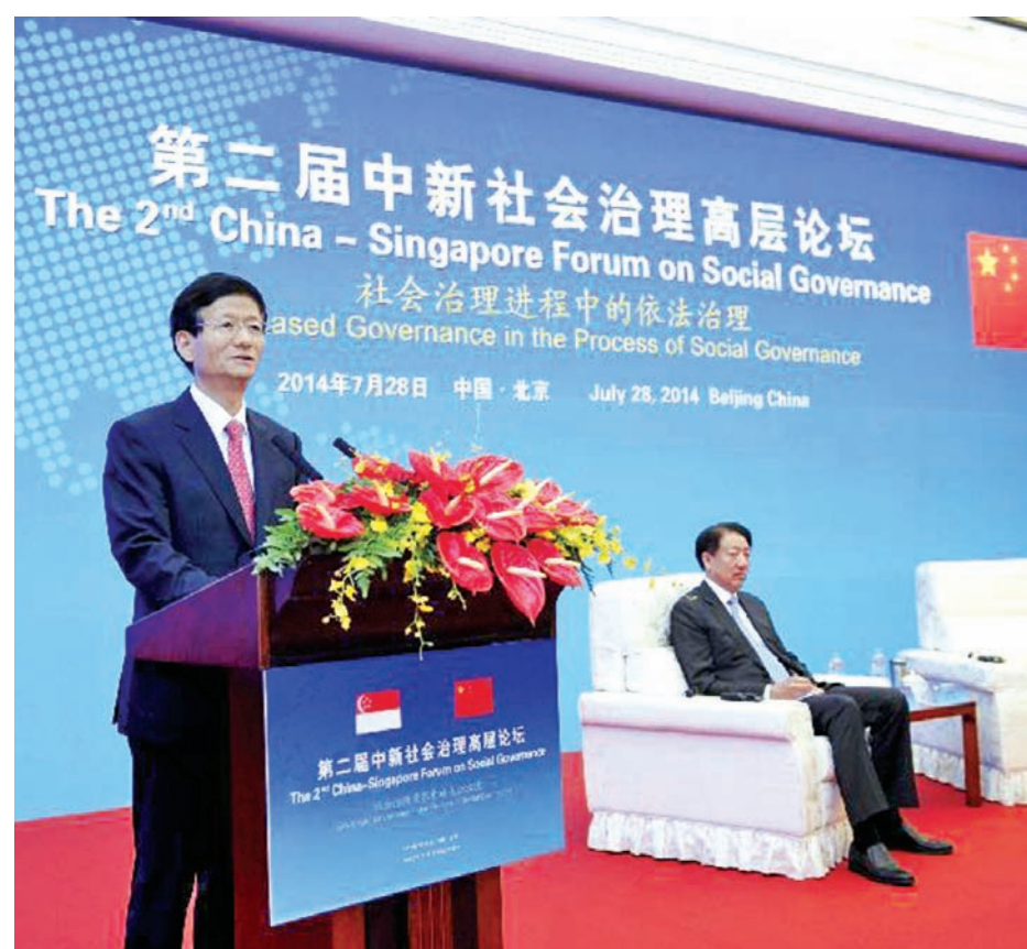
Meng Jianzhu (L), head of the Commission for Political and Legal Affairs of the Communist Party of China (CPC) Central Committee, attends the opening ceremony of the second China-Singapore Forum on Social Governance, together with Teo Chee Hean, Singapore's Deputy Prime Minister, Coordinating Minister for National Security and Home Affairs Minister, in Beijing, capital of China, on 28 July, 2014.