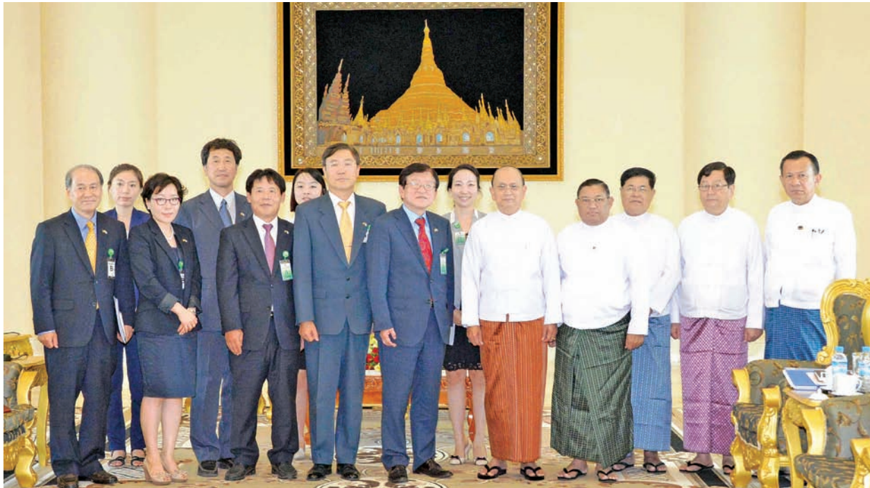
President U Thein Sein with Mr Suh Sang-mok, former minister for Health and Social Affairs and a member of parliament of the Republic of Korea and party.

NAY PYI TAW, 29 July—A Korean delegation led by Mr Suh Sang-mok, a former minister for Health and Social Affairs and a member of parliament, called on U Thein Sein, President of the Republic of