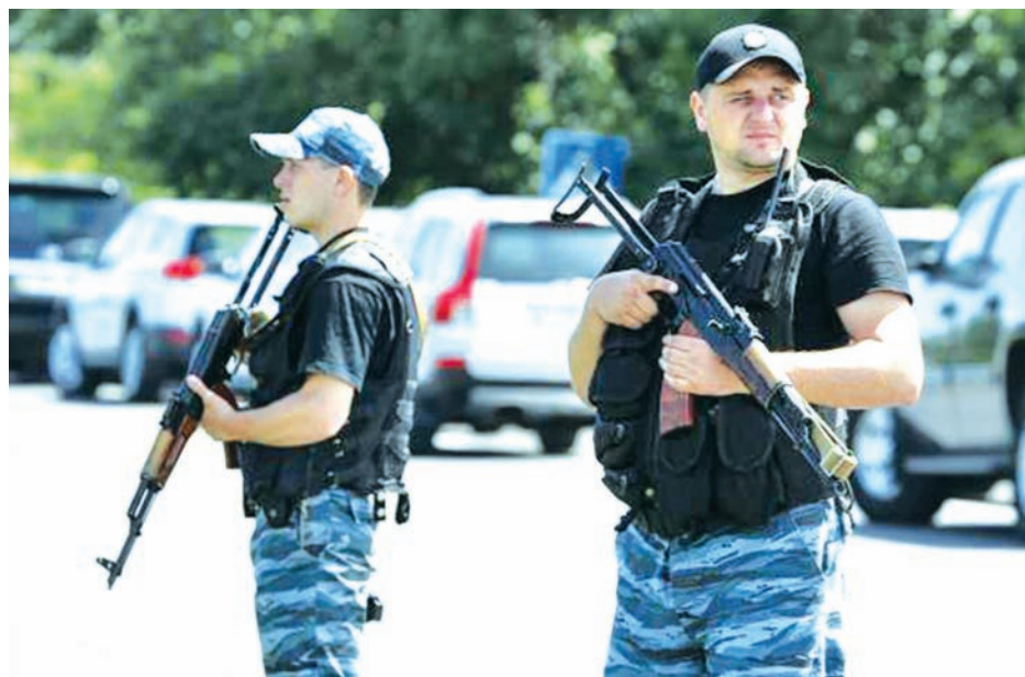
Armed pro-Russian separatists stand guard on the outskirts of Shakhtarsk, Donetsk region on 28 July, 2014.

"It's precisely because we've not yet seen a strategic turn from Putin that we believe it's absolutely essential to take additional measures and that's what the Europeans and the United States intend to do this week," said Tony Blinken, a national security