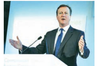
Britain's Prime Minister David Cameron

LONDON, 29 July — British Prime Minister David Cameron on Tuesday set out new welfare rules to cut European migrants' access to social security payments, marking the latest in a string of British measures aimed at addressing voters' concerns over immigration.