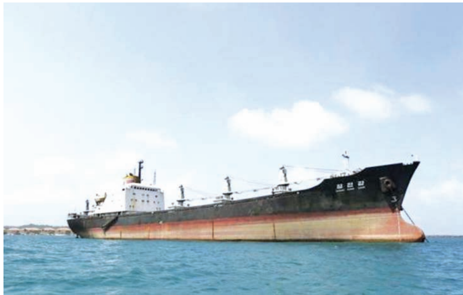
The North Korean-flagged cargo ship Chong Chon Gang is pictured in Fort Sherman Bay, a former US base, on the outskirts of Colon city on 12 Feb, 2014.