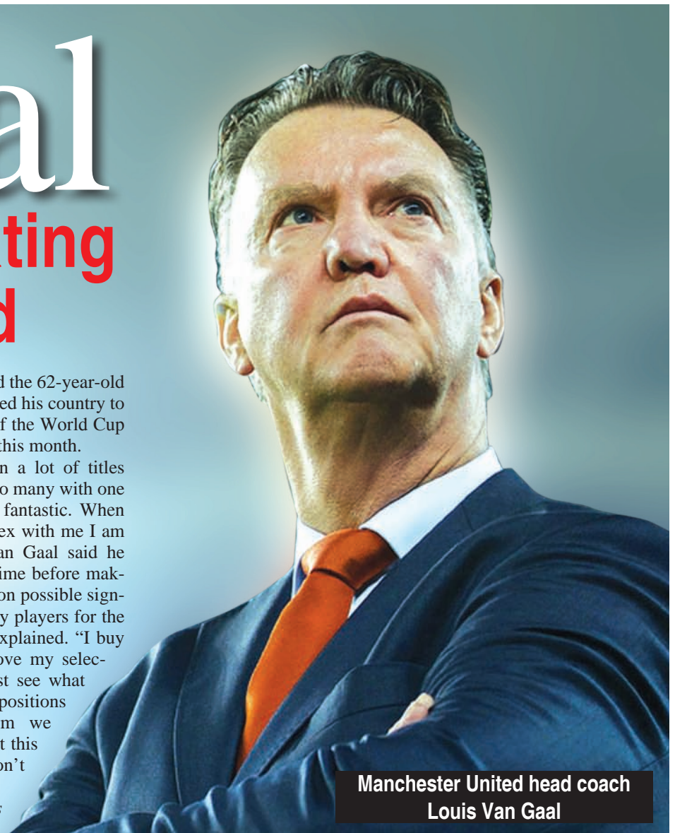
Manchester United head coach Louis Van Gaal