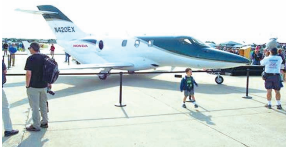
Photo taken on 28 July, 2014, shows Honda Aircraft Co.'s first production model of the HondaJet unveiled at an air show in Oshkosh, the United States. The roughly 13-metre-long plane powered by two engines installed over the main wings has a spacious interior.

OSHKOSH, (Wisconsin), 29 July — Honda Aircraft Co aims to expand its market for the HondaJet to Latin America within a few years, before moving into China and Southeast Asia, the company's chief Michimasa Fujino said on Monday. Fujino, president and CEO of the aviation arm of Honda Motor Co, suggested the company could also eventually move into Japan as the country gears up to host the Olympic Games.