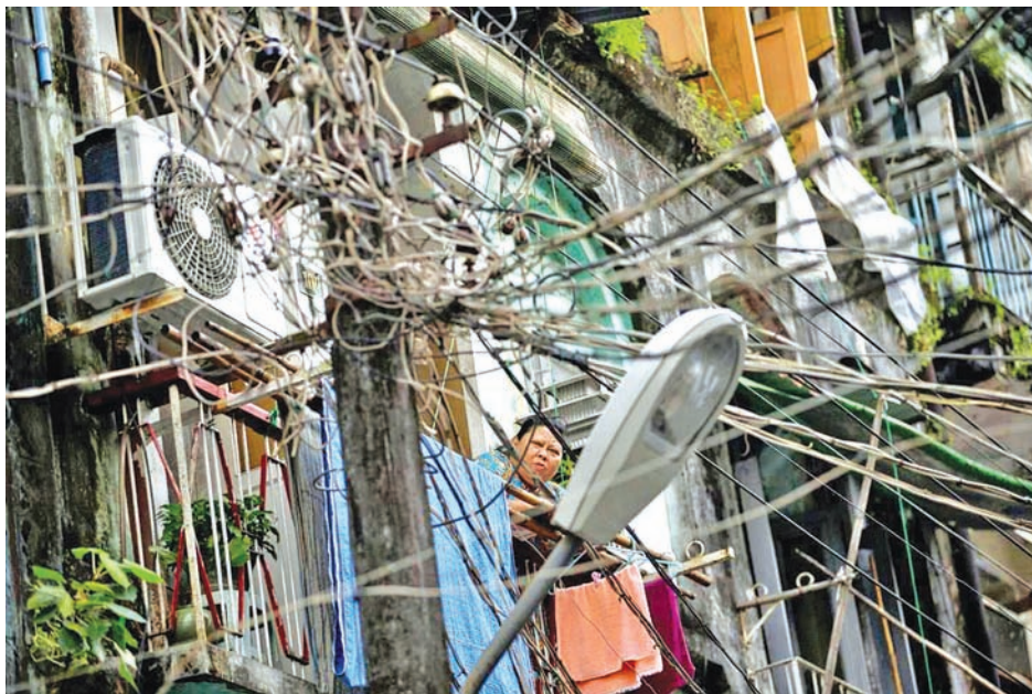
Old power cables in Yangon need replacement with new ones to prevent electrocution and power losses.