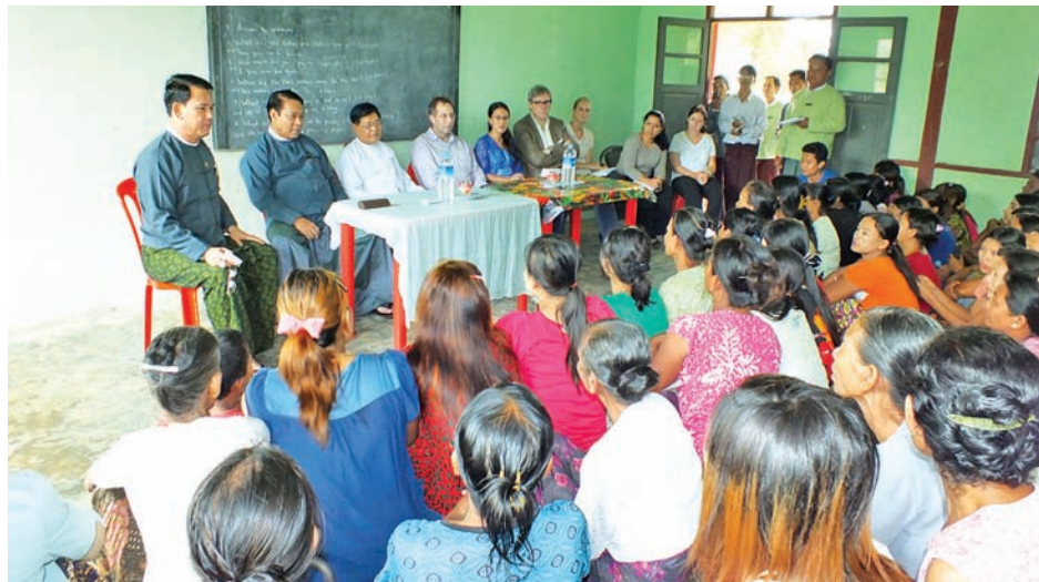
Union Ministers and officials meet locals in Sittway for fulfilling requirements.—MNA

NAY PYI TAW, 29 July — Union Minister at the President Office U Soe Thane supplicated to Buddhist monks on construction of Ponnagyun industrial zone and main power station for electrification in Ponnagyun and Sittway, supply of fresh