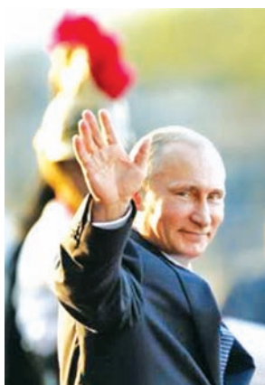
Russia's President Vladimir Putin

WASHINGTON, 29 July — In another sign of deteriorating relations between the United States and Russia, the US government said on Monday that Moscow had violated the Intermediate Range Nuclear