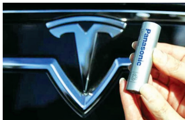
A Panasonic Corp's lithium-ion battery, which is part of Tesla Motor Inc's Model S and Model X battery packs, is pictured with Tesla Motors logo during a photo opportunity at the Panasonic Centre in Tokyo, ahead of the 2013 Tokyo Motor Show, on 19 Nov, 2013 file photo.