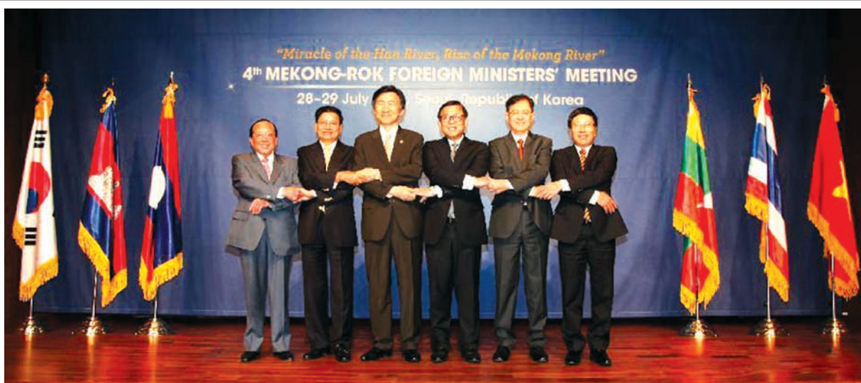
(L-R) Cambodia's Foreign Minister Hor Namhong, Laos's Foreign Minister Thongloun Sisoulith, South Korea's Foreign Minister Yun Byung-Se, Thailand's Foreign Minister Sihasak Phuangketkeow, Myanmar's Deputy Foreign Minister U Thant Kyaw and Vietnam's Foreign Minister Pham Binh Minh attend the 4th Mekong-ROK Foreign Ministers' Meeting in Seoul, South Korea, on 29 July, 2014.