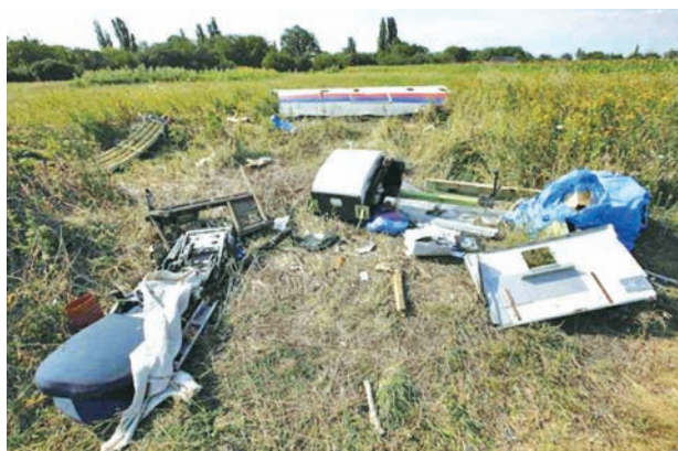
Pieces of the wreckage are seen at a crash site of the Malaysia Airlines Flight MH17 near the village of Petropavlivka (Petropavlovka), Donetsk region on 24 July, 2014.

Airlines, represented by International Air Transport Association, will tell the meeting they urgently