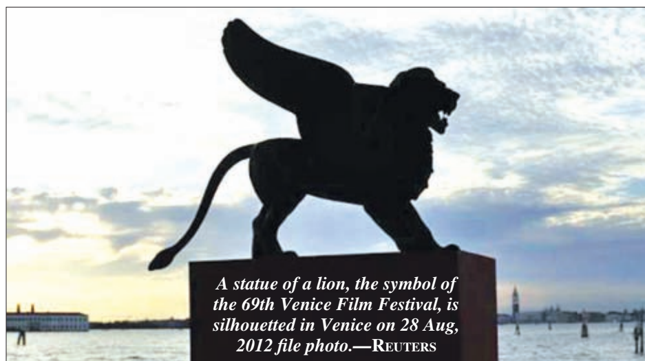
A statue of a lion, the symbol of the 69th Venice Film Festival, is silhouetted in Venice on 28 Aug, 2012 file photo.