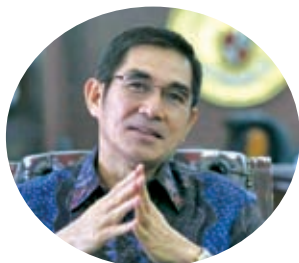
The head of Indonesia's Constitutional Court Hamdan Zoelva speaks with Reuters during an interview in his office in Jakarta on 24 July, 2014.

JAKARTA, 25 July — Indonesia's top court is prepared to hear a case challenging the result of this month's presidential election, well aware that its reputation is on the line after its top judge was jailed for corruption, his successor said. The losing presidential candidate, Prabowo Subianto, has alleged mass cheating in the closely fought 9 July election and has said he will challenge the result in the Constitutional Court. A member of his team said the complaint would be lodged later on Friday.