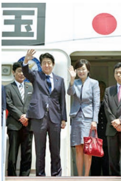
Japan's Prime Minister Shinzo Abe and his wife Akie wave to people before leaving for a five-nation tour of Latin America from Tokyo's Haneda airport on 25 July, 2014.

Positioning Latin America as a promising "market of 600 million" people, the government aims to help Japanese companies win orders for