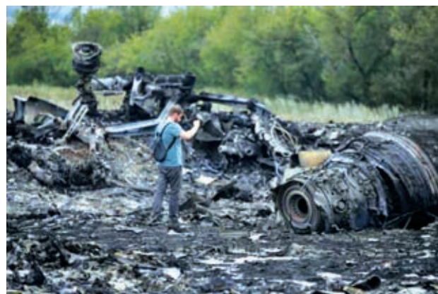
A journalist takes photographs at the site of Thursday's Malaysia Airlines Boeing 777 plane crash near the settlement of Grabovo, in the Donetsk region on 18 July, 2014.

KUALA LUMPUR, 25 July — Russia will cooperate with the investigation into the downing of a Malaysian airliner a week ago and is satisfied that the Netherlands, rather than Ukraine, is leading the effort, the country's ambassador to Malaysia said on Thursday.