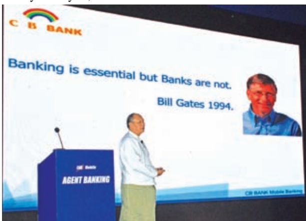
CB Bank CEO U Kyaw Lynn delivers presentation on EASi mobile agent banking service that allows customers to make fast and secure withdrawals and transfers through the bank’s agents.