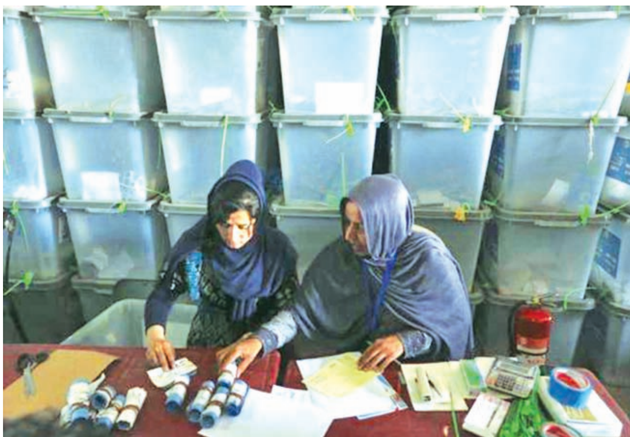
Afghan election workers count ballot papers for an audit of the presidential run-off in Kabul on 18 July, 2014.