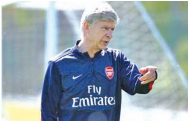
Arsenal manager Arsene Wenger leads a training session at London Colney near London on 14 May, 2014.

NEW YORK, 25 July — Arsenal manager Arsene Wenger has echoed the sentiments of new Manchester United boss Louis van Gaal in criticising the demands of their pre-season tour. Wenger said it was “impossible” to prepare his squad properly for the upcoming Premier League campaign, which begins on 16 August, given the demands of their pre-season schedule and players returning later than normal after World Cup duty.