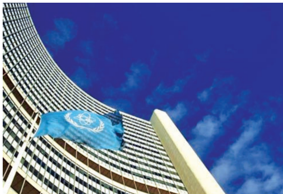
The flag of the International Atomic Energy Agency (IAEA) flies in front of its headquarters during a board of governors meeting in Vienna on 28 Nov, 2013.

The FAA initially instituted the flight prohibition on Tuesday, in response to a rocket strike that landed approximately one mile from the airport. Then the agency extended the flight restrictions for additional 24 hours. The US State Department has been warning citizens to defer nonessential travel to Israel since early February this year because of safety concerns in Gaza. Long-range rockets launched from Gaza since early this month have reached many locations in Israel, resulting in negative impacts on the safety of aviation there.—Xinhua