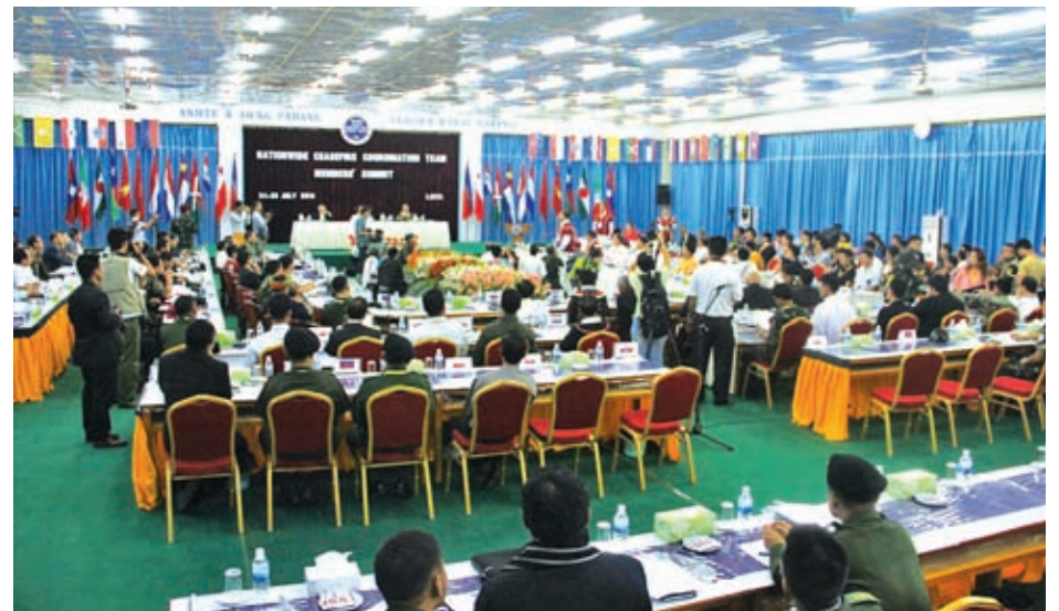
Nationwide Ceasefire Coordination Team Members’ Summit in progress in Laiza of Kachin State.