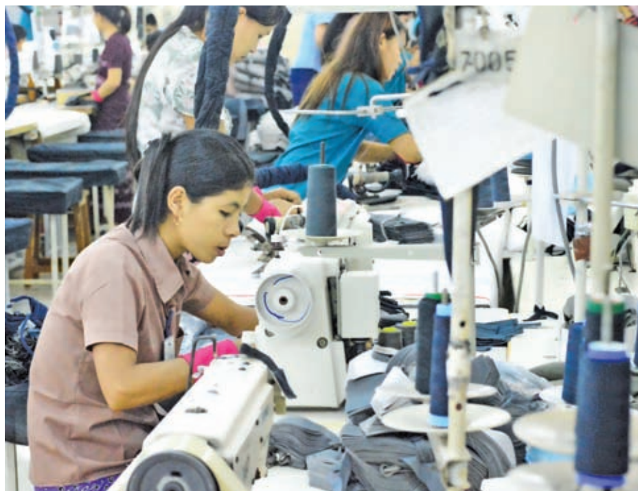
Some of the workers affected by the Master Sports Factory closure will be employed by other factories in the Hlinethaya Industrial Zone, officials have promised.