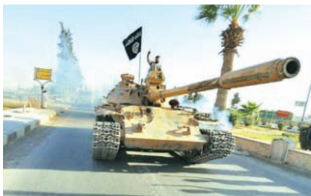
Militant Islamist fighters on a tank take part in a military parade along the streets of northern Raqqa province on 30 June, 2014.

BEIRUT, 25 July — The growing power of the ultra-hardline Islamic State means the Syrian army is now having to confront a group it has until now been reluctant to attack for political reasons.