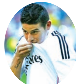
Colombia's soccer player James Rodriguez

“The pressure will be the same as it always is at Real Madrid. There won’t be as much as there was for La Decima (their 10th European title), which was