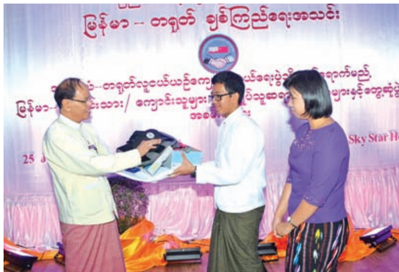
An official presents a gift to a youth of the Myanmar delegation that will attend the second ASEAN-China Youth Cultural Exchange Festival.—MNA

Last year, a Myanmar delegation comprising eight students participated in the first ASEAN-China Youth Cultural Exchange Festival, and ten students will join the festival this year.—MNA