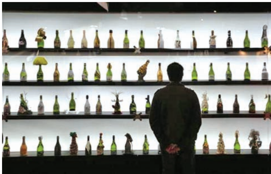
A visitor looks bottles of cava (sparkling wine) on a display at the Alimentaria trade show in Barcelona on 2 April, 2014.

Prosecutors accused Kurniawan of operating