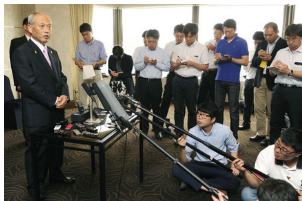
Tokyo Gov Yoichi Masuzoe meets with the Press in Seoul, South Korea, on 25 July, 2014, after meeting with South Korean President Park Geun-hye. Bilateral relations have nosedived to the worst level in years over differing views on wartime history and over the ownership of islets in the Sea of Japan.