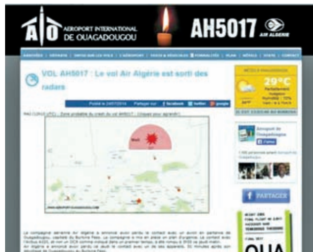
A screengrab of the homepage of the Ouagadougou airport's Internet site ( http://www.aeroport-ouagadougou.com ) shows a candle next to the flight number AH5017 and a map displaying the plane's last contact zone, on 24 July, 2014. —REUTERS

Burkina Faso authorities said the passenger list included 51 French, 27 Burkinabe, eight Lebanese, six Algerians, five Canadians, four Germans, two from Luxembourg, one Cameroonian, one Belgian, one Egyptian, one Ukrainian, one Swiss, one Nigerian and one Malian. Crash site investigators saw no survivors. —Reuters