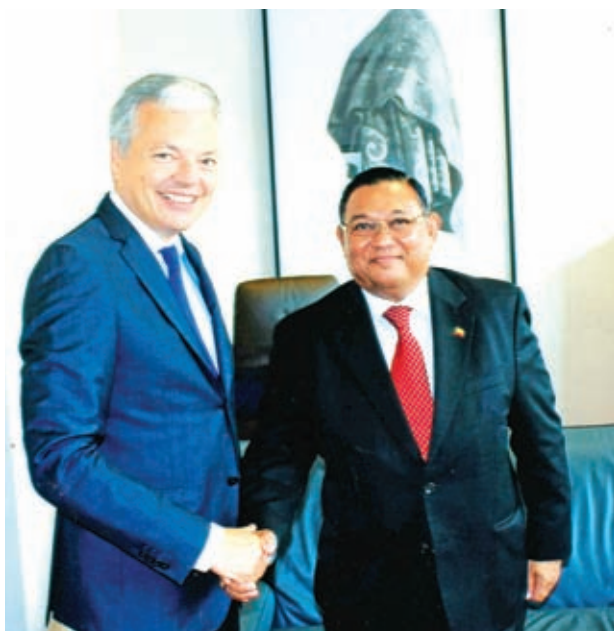
Belgium Deputy Prime Minister and Minister of Foreign Affairs Mr Didier Reynders shakes hands with Union Minister U Wunna Maung Lwin.

YANGON, 25 July—Union Minister for Foreign Affairs U Wunna Maung Lwin attended the 20 th ASEAN-EU Ministerial Meeting in Brussels, capital of Belgium from 22 to 25 July 2014.