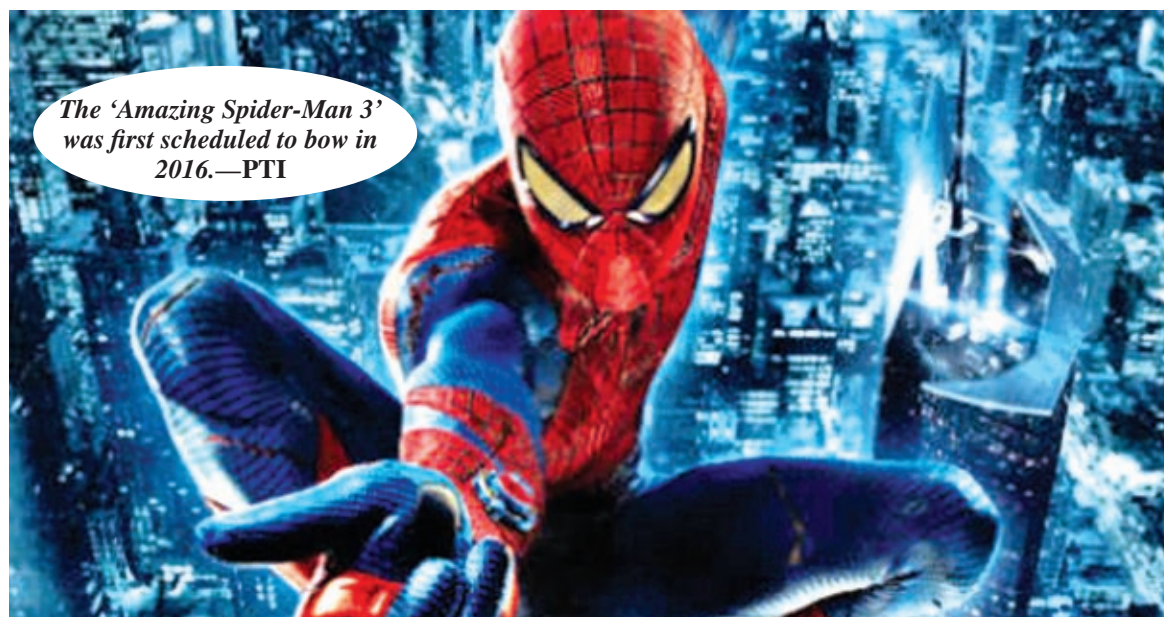
The 'Amazing Spider-Man 3' was first scheduled to bow in 2016.

LOS ANGELES, 25 July — The fans of 'The Amazing Spider-Man 3' will have to wait longer as the web-casting superhero's arrival in theatre has been delayed by almost two years. Sony announced the reshuffle in release dates at San Diego Comic-Con.