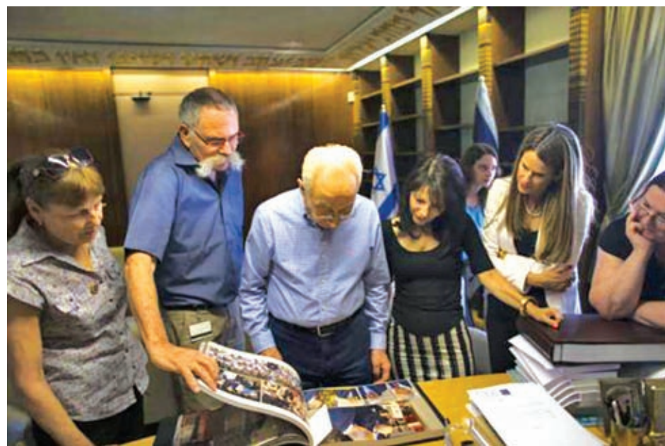
Israel's President Shimon Peres (C) looks at a book with pictures from his years in office, at the presidential residence in Jerusalem, on his last day in office, on 24 July, 2014.

Unlike Peres, Rivlin, a former parliamentary speaker, is opposed to the creation of a Palestinian state. A champion of Jewish settlements built on