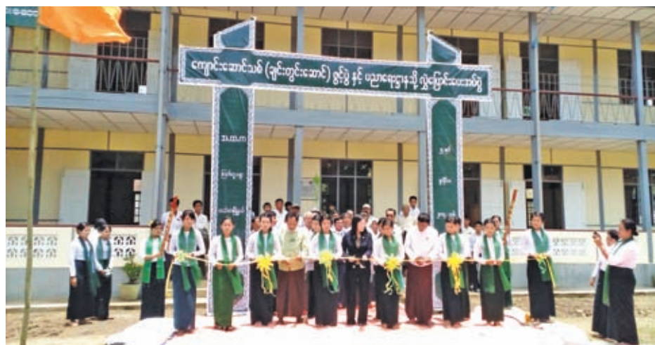
Officials of Grant Assistance for Grass-roots Human Security Projects (GGP) Scheme formally open a school building at Kyet Tu Yway Village in Hinthada Township.