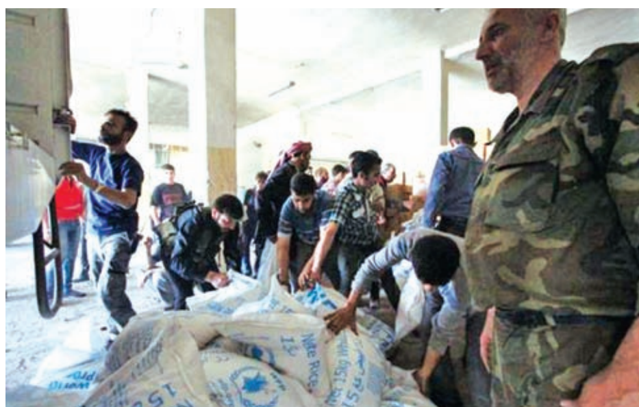
People unpack humanitarian aid inside a warehouse in Ghouta, eastern Damascus on 24 May, 2014.

No further details were available on whether the trucks had reached the people it was intended for. In a report to the Security Coun-