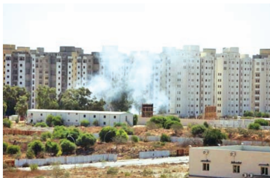
Smoke rises near buildings after heavy fighting between rival militias broke out near the airport in Tripoli on 23 July, 2014.

Fighting in the capital and the eastern city of Benghazi, its heaviest since the 2011 war that ousted Muammar Gaddafi, has led most international flights to Libya to be canceled and has prompted the United States to pull out embassy staff. A Health Ministry official in Tripoli was unable to provide details of Thursday's casualties because he could not contact hospital staff in the area. One local