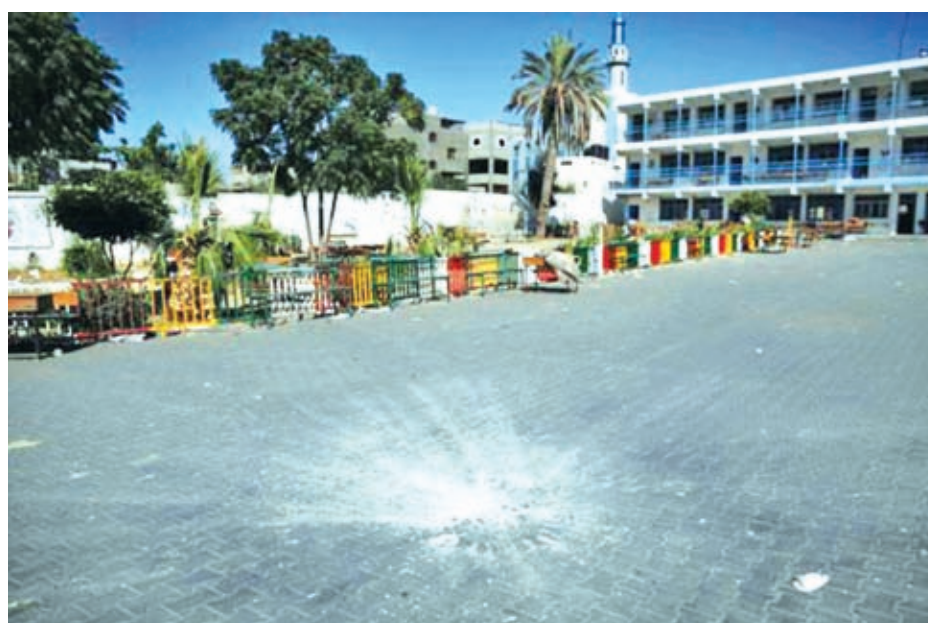
A crater marks the centre of a courtyard at a United Nations-run school sheltering Palestinians displaced by an Israeli ground offensive, that police said was hit by an Israeli shell, in Beit Hanoun in the northern Gaza Strip on 24 July, 2014.

Pools of blood lay on the ground and on students’ desks in the courtyard of the school near the apparent impact mark of the shell, according to a Reuters photographer at the scene.