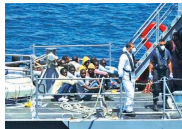
African migrants sit on the deck of an Armed Forces of Malta (AFM) patrol boat as it arrives at the AFM Maritime Squadron base in Valletta’s Marsamxett Harbour on 20 July, 2014.