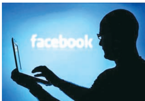
A man is silhouetted against a video screen with an Facebook logo as he poses with an Dell laptop in this photo illustration taken in the central Bosnian town of Zenica, on 14 Aug, 2013.