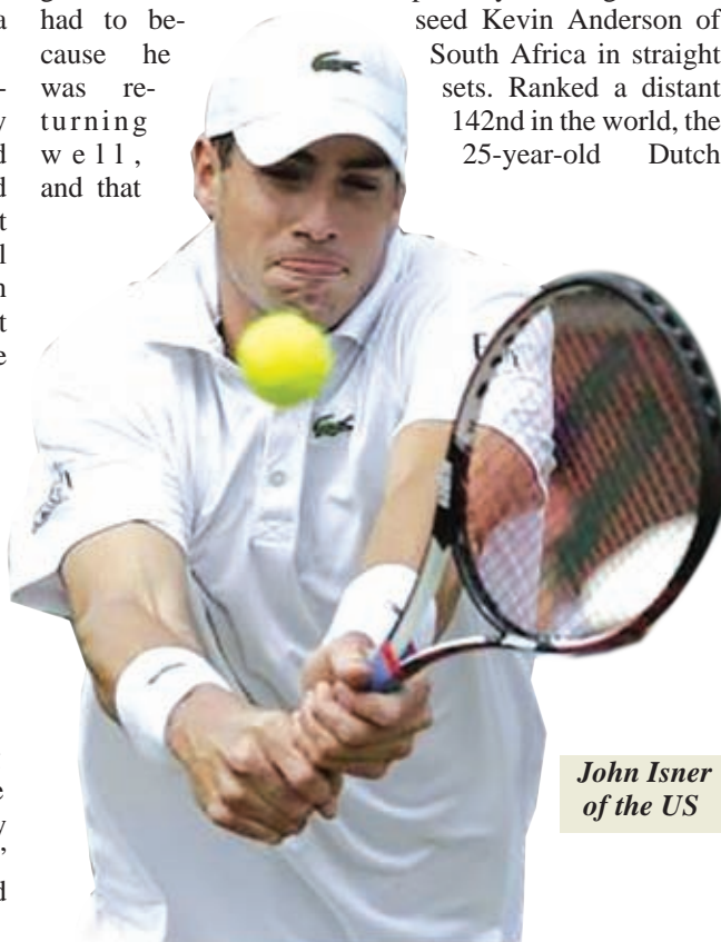
John Isner of the US