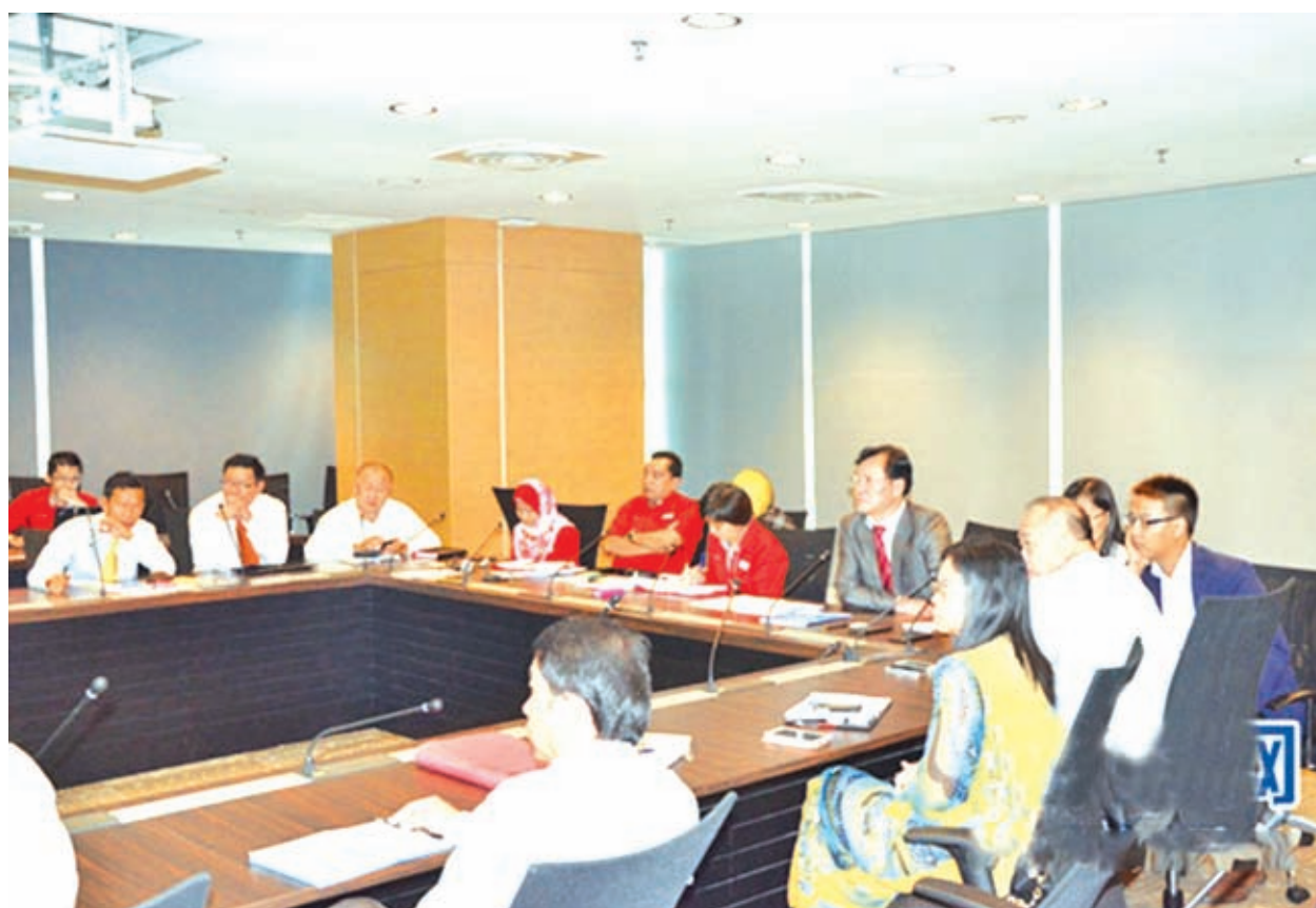
Port Klang free trade zone projects operation seminars is held in Malaysia Industrial Development Authority.

She said, “as such a large project, its operation needs all parties’ co-operation and supports. We realized the problems it would face. Therefore, we plan to hold special meetings with Malaysia Halal Industry Development Corporation, customs office and immigration to