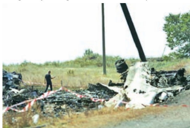
A Malaysian air crash investigator works at a crash site of the Malaysia Airlines Flight MH17 near the village of Hrabove (Grabovo), Donetsk region on 24 July, 2014.

Dutch-led international security force to secure the Malaysia Airlines Flight MH17 crash site, Prime Minister Tony Abbott said