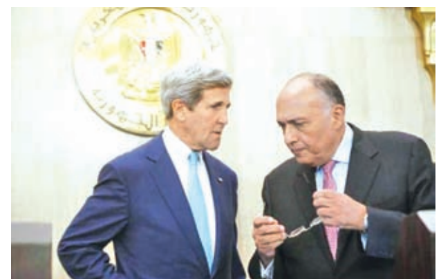
US Secretary of State John Kerry (L) and Egypt's Foreign Minister Sameh Shukri talk before making statements to reporters after Kerry met with Shukri and Egyptian President Abdel Fattah al-Sisi at the presidential palace in Cairo on 22 July, 2014.

CAIRO, 23 July — US Secretary of State John Kerry urged Hamas on Tuesday to pursue a negotiated end to its conflict with Israel after what he said were constructive talks with Egyptian officials about their ceasefire proposal.