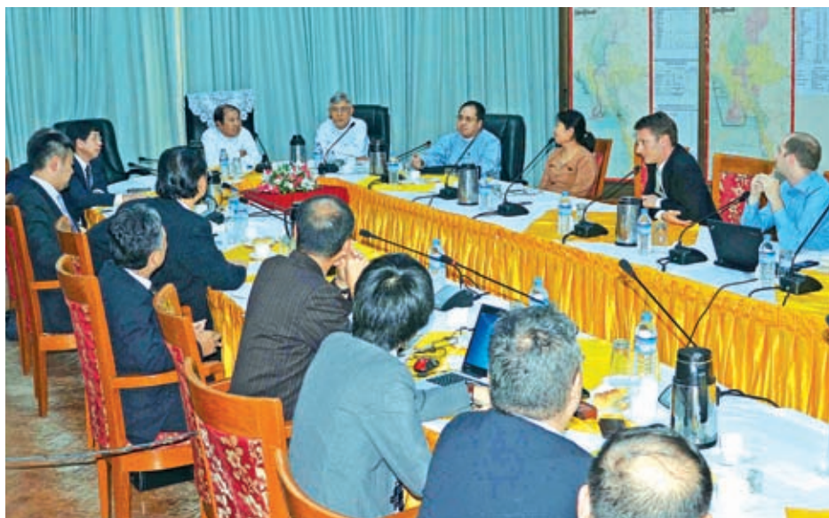
Union Minister U Aye Myint holds discussion on the Dawei Special Economic Zone with responsible persons of Italian-Thai Company.—MNA

Officials explained the costs of the Italian-Thai Company for the project and plans for the implementation of the pilot project. The Japanese company presented a documentary video on the Kashima maritime industrial estate (Deep Seaport) and discussed in-