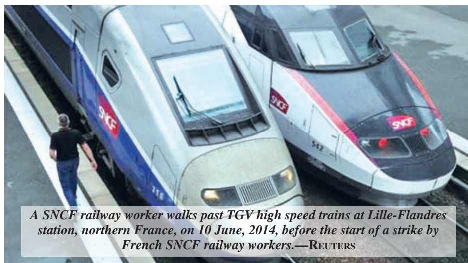
A SNCF railway worker walks past TGV high speed trains at Lille-Flandres station, northern France, on 10 June, 2014, before the start of a strike by French SNCF railway workers.