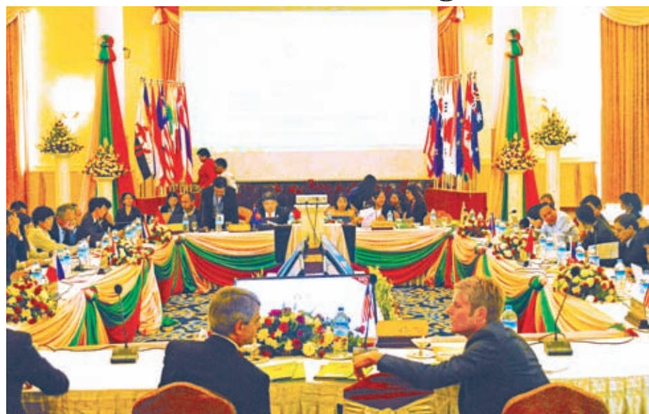
Delegates hold discussions at the 21st Senior Economic Officials Meeting in Yangon.

YANGON, 23 July—The Senior Economic Officials Meeting concluded at the Inya Lake Hotel in Yangon on Wednesday.