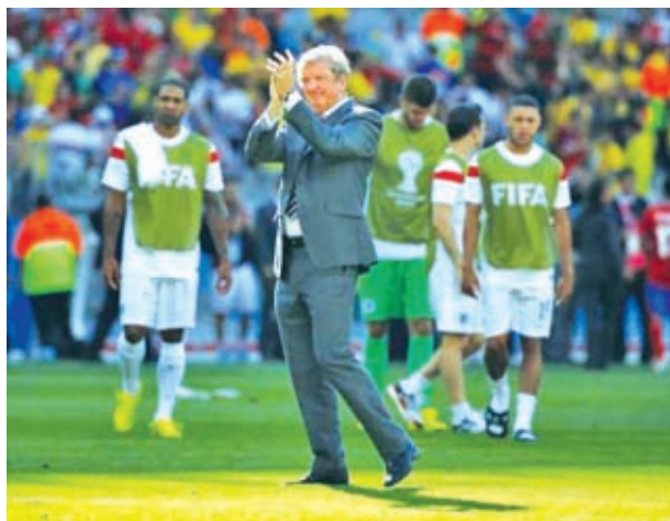
England's coach Roy Hodgson applauds at the end of their 2014 World Cup Group D soccer match against Costa Rica at the Mineirao stadium in Belo Horizonte on 24 June, 2014.