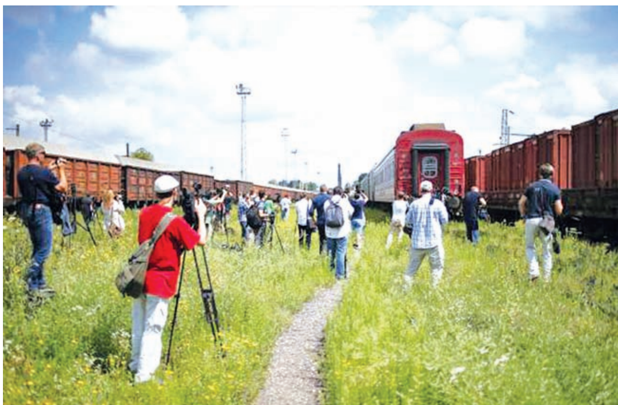
Journalists work after a train carrying the remains of victims of Malaysia Airlines MH17 downed over rebel-held territory in eastern Ukraine arrived in the city of Kharkiv, eastern Ukraine on 22 July, 2014.

The downing of flight MH-17 deepened the Ukrainian crisis and prompted international outrage. Separatists in the Russian-speaking east have been fighting the Ukrainian military since pro-Western protesters in Kiev forced out the Moscow-allied president earlier this year.