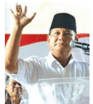
Indonesian presidential candidate Prabowo Subianto