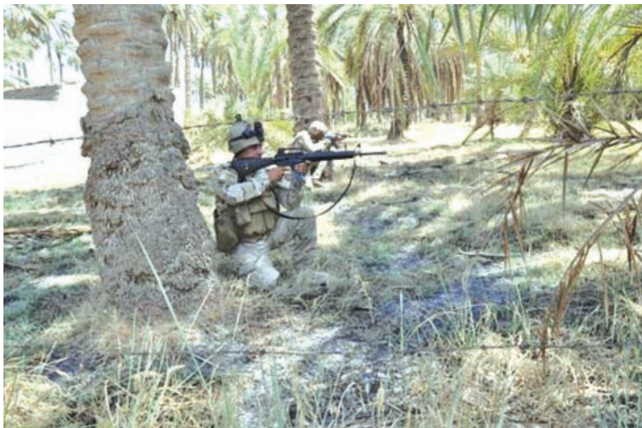
Members of the Iraqi security forces take their positions during a patrol in the town of Jurf al-Sakhar, south of Baghdad, on 16 July, 2014.

FALLUJA, (Iraq) 23 July — Iraqi government air strikes killed 19 people, including children, in Falluja on Monday and on Tuesday, a health official in the militant-held city said.