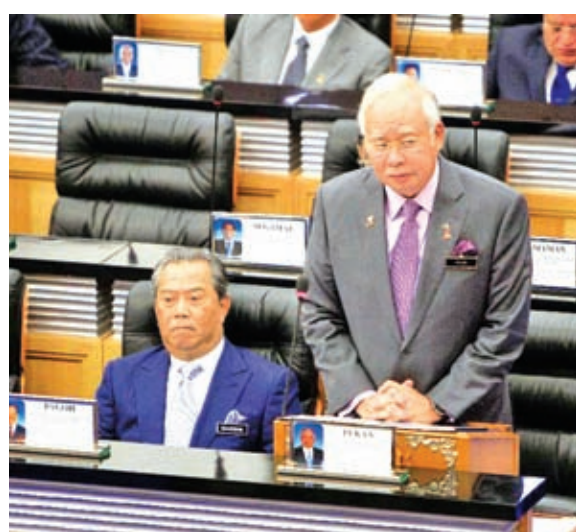
Malaysian Prime Minister Najib Razak attends a specially convened session of Parliament in Kuala Lumpur on 23 July, 2014. Najib Razak on Wednesday condemned the shutdown of MH17, calling on all parties to work together to ensure investigations were completed immediately.