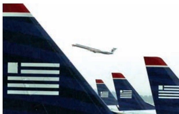
An American Eagle Embraer ERJ-140LR jet takes off as US Airways jets are lined up at Reagan National Airport in Washington on 12 July, 2013.

WASHINGTON, 23 July — Air carriers in the United States and Europe on Tuesday halted flights to Tel Aviv after warnings from governmental agencies in an effort to ensure passenger safety as turmoil in Israel and the region intensified.