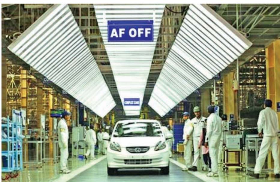
Employees stand beside the Honda Amaze after giving it the final touches near the assembly line of the company's manufacturing plant in Tapukara, in Rajasthan, on 24 Feb, 2014.

NEW DELHI, 23 July — The India unit of Honda Motor Co Ltd (7267.T) will account for 25 percent of the Japanese carmaker's Asia Pacific sales target of 1.2 million units by March 2017, Managing Officer Yoshiyuki Matsumoto said on Wednesday. Honda plans to raise the number of dealers in India to 230 by March 2015 from 179 now, said Hironori Kanayama, presi-