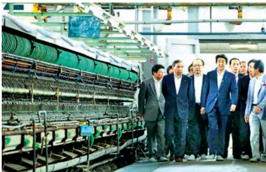
Prime Minister Shinzo Abe (2nd from R, front row) tours a silk-reeling plant at the Tomioka Silk Mill, a newly added UNESCO World Heritage site built in 1872, on 23 July, 2014.

The silk complex was originally a government-run factory built to serve as a model for other mills in Japan, which came to play a leading role in the global silk industry during its period of industrialization. The prime minister also tried silk reeling at the site with a historic machine using the production meth-