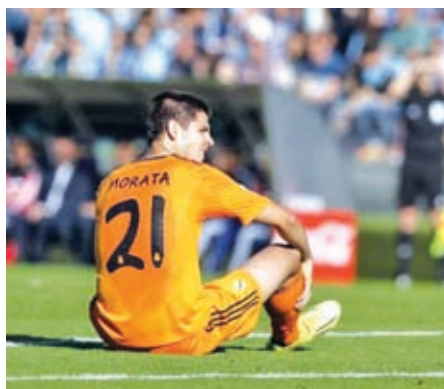
Real Madrid's Alvaro Morata reacts during their Spanish first division soccer match against Celta Vigo at the Balaidos stadium in Vigo on 11 May, 2014.