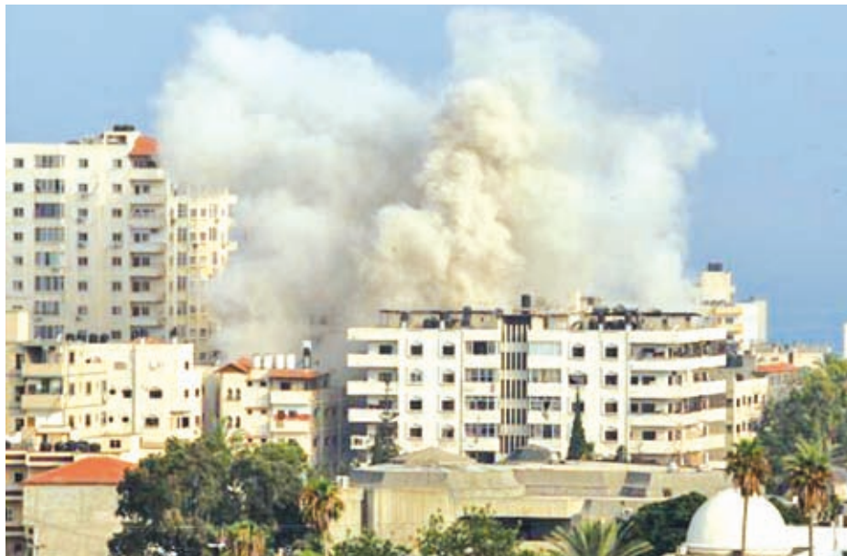
Smoke rises following what witnesses said was an Israeli air strike in Gaza City on 22 July, 2014.

Israel launched its offensive on 8 July to halt missile salvos by Hamas Islamists, which was angered by a crackdown on its supporters in the nearby