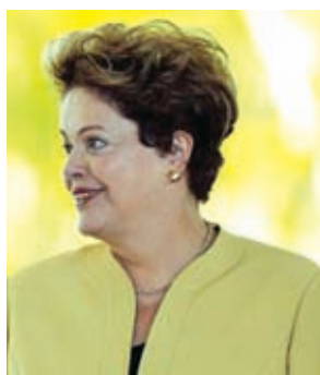
Brazil's President Dilma Rousseff

The approval rating of her government remained at 31 percent, unchanged from a month ago when Brazil was starting to host the month-long soccer World Cup. Her personal approval rating was also