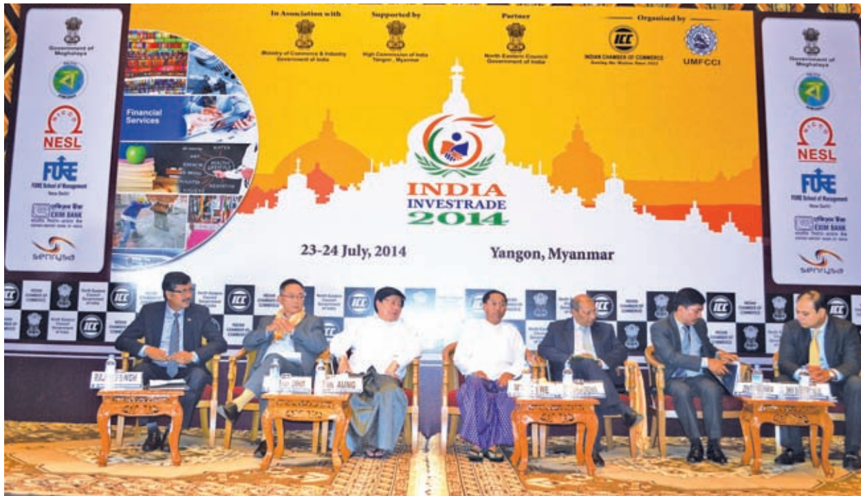
India INVESTRADE 2014 in progress at Sedona Hotel in Yangon, with officials emphasizing the need to build synergies for trade and investment between Myanmar and India.

Boosting investment and trade will be focused at the business sessions, said