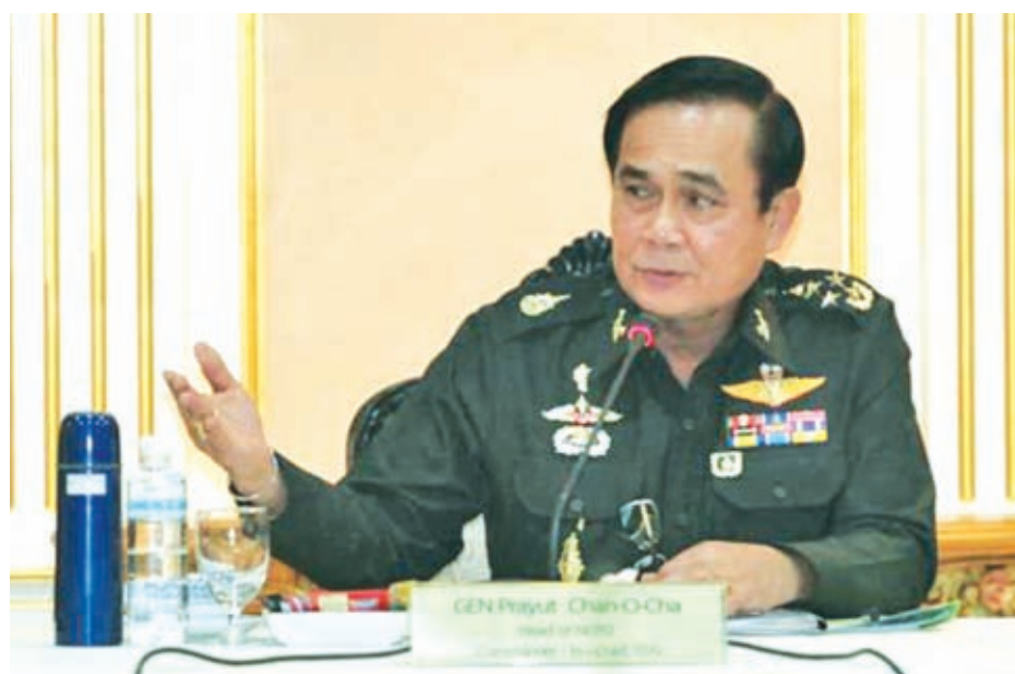
Thai Army chief General Prayuth Chan-ocha speaks during a meeting with members of the International Chamber of Commerce at the Royal Thai Army Headquarters in Bangkok on 19 June, 2014.

The upheaval is the latest chapter in almost a decade of conflict pitting Thailand's royalist establishment and Bangkok's middle class against Yin-