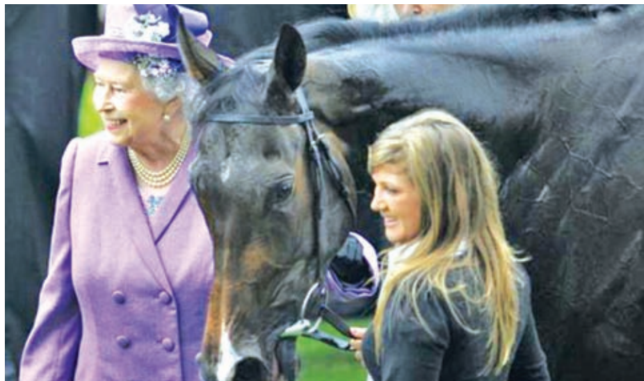
Britain's Queen Elizabeth (L) smiles as she stands with her horse Estimate after it won the Gold Cup during Ladies' Day at the Royal Ascot horse racing festival at Ascot, southern England, on 20 June, 2013.

"Initial indications are that the positive test resulted