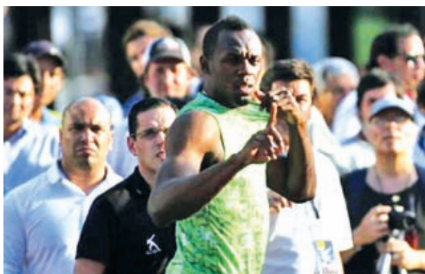
Jamaican sprinter Usain Bolt gestures before competing in a race against a public bus during a demonstration event in Buenos Aires on 14 Dec, 2013.

KINGSTON, 23 July — Usain Bolt believes anti-doping officials have sent a "bad message to the sport", after American sprinter Tyson Gay received only a one-year ban following a positive test for an anabolic steroid.