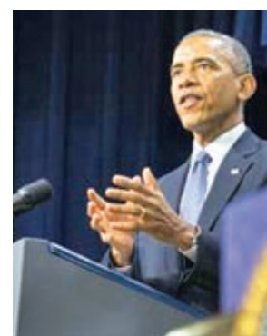
US President Barack Obama

Congress members pushed for tougher action. The Democratic leaders of the US Senate’s national