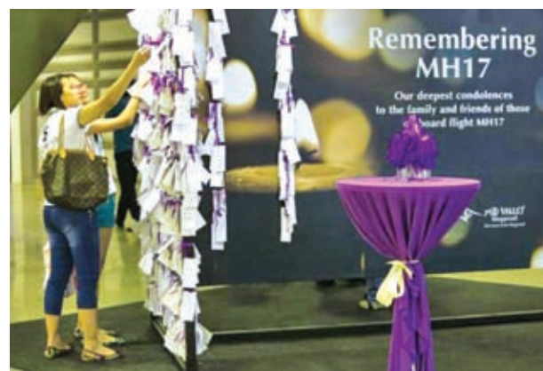
Women look at messages on a dedication board for the victims of downed Malaysia Airlines Flight MH17 in Kuala Lumpur on 23 July, 2014.

The intelligence officials said they had reports that as many as a dozen aircraft had been fired on from separatist-controlled areas during two months of fighting between the