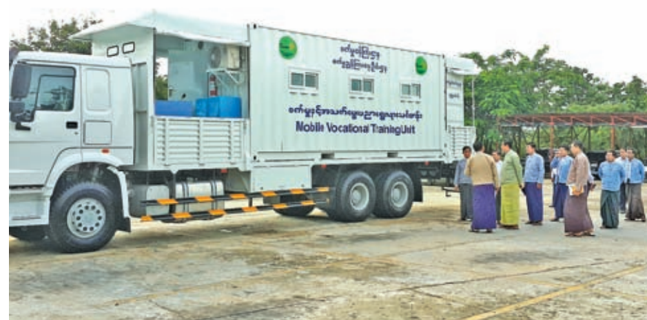
Union Minister U Maung Myint views mobile vocational training vehicle.—MNA

NAY PYI TAW, 23 July — As part of efforts to implement the Third Wave process, the Ministry of Industry is conducting mobile vocational training to rural people.