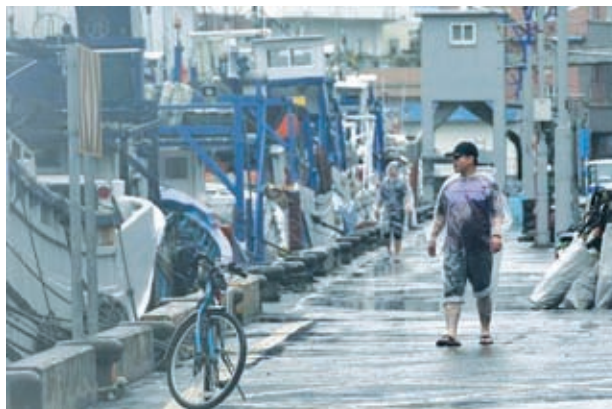
Fishermen in raincoats walk past fishing boats as Typhoon Matmo approaches the northeastern coastal town of Nanfanggao in Ilan county, northern Taiwan, on 22 July, 2014.

TAIPEI, 23 July — Typhoon Matmo slammed into Taiwan on Wednesday with heavy rains and strong winds, shutting financial markets and schools, with at least one person killed and some damage reported.