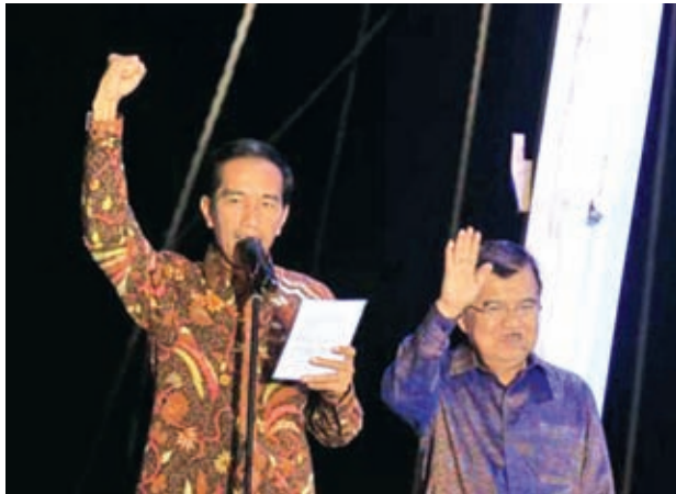
Indonesian presidential candidate Joko "Jokowi" Widodo (L) gestures as delivers a speech, beside his running mate Jusuf Kalla, on a phinisi boat, a traditional Indonesian ship, at Sunda Kelapa port after he was declared the winner of the presidential election in Jakarta on 22 July, 2014.

JAKARTA, 23 July — Joko "Jokowi" Widodo was declared the winner of Indonesia's presidential election on Tuesday, bringing the promise of major reforms to the world's third largest democracy.