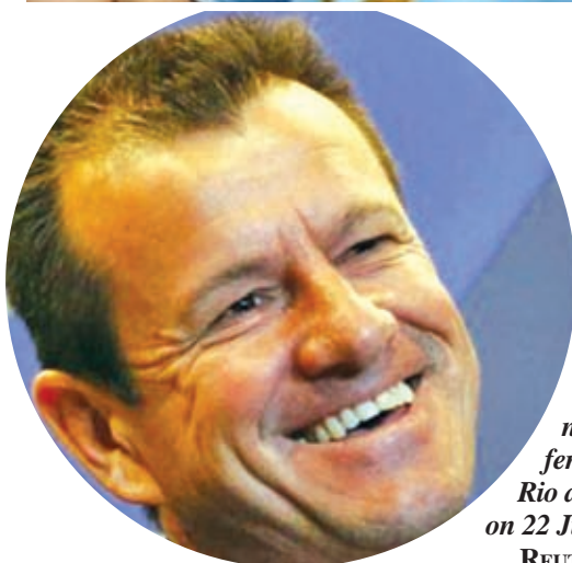
Brazil's new manager Dunga smiles during a news conference in Rio de Janeiro on 22 July, 2014.

City will face AC Milan, Liverpool and Olympiakos Piraeus on the US tour before returning for the English curtain raiser, the Community Shield, against FA Cup winners Arsenal on 10 August.—Reuters