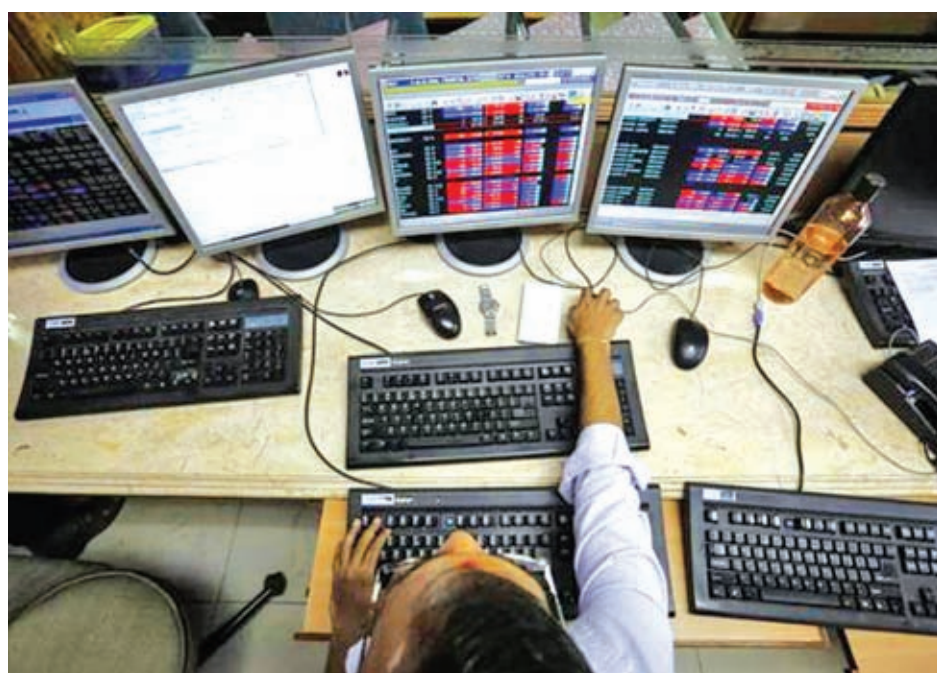
A broker monitors share prices while trading at a brokerage firm in Mumbai on 13 May, 2014.