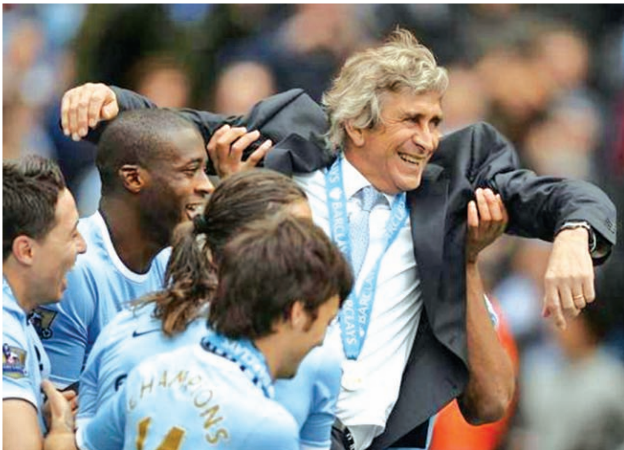
Manchester City's manager Manuel Pellegrini is thrown into the air by his team as they celebrate winning the English Premier League trophy following their football match against West Ham United at the Etihad Stadium in Manchester, northern England on 11 May, 2014.