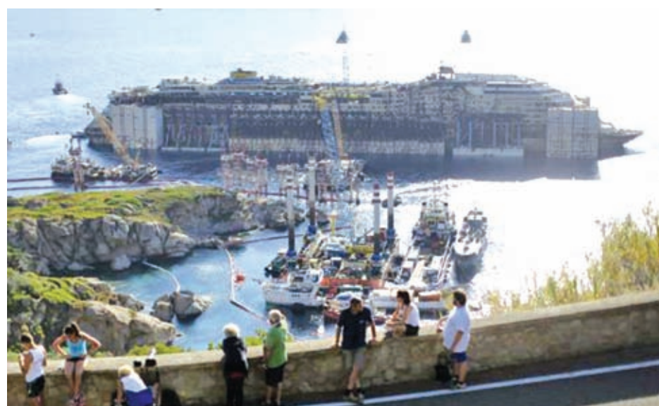
The Costa Concordia cruise liner is seen during its refloat operation at Giglio harbour on 23 July, 2014. — REUTERS

Bad weather delayed the process by two days, and salvage master Nick Sloane said on Wednesday that "forecasts are good" and "today is a big day for Giglio". — Reuters