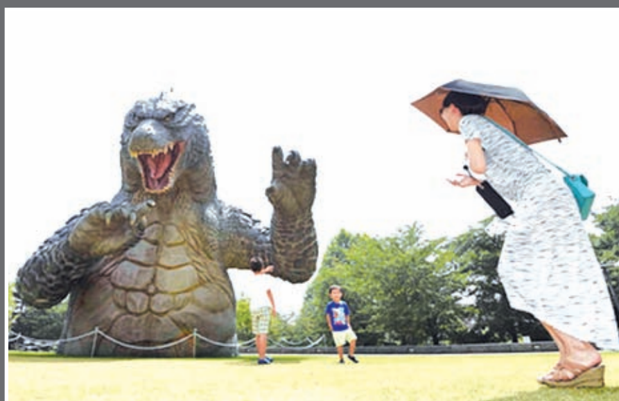
Photo taken on 23 July, 2014, shows a statue of Godzilla, the popular Japanese monster character, that has been set up in the premises of the Tokyo Midtown commercial complex in Tokyo's Minato Ward ahead of the release in Japan of the US film "Godzilla" two days later.