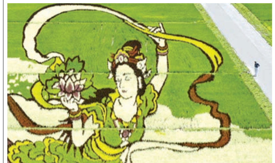
A flying nymph is seen depicted on a rice field in Inakadate Village, Aomori Prefecture, northeastern Japan, on 20 July, 2014. The picture was created using 10 kinds of rice plant in seven colours.

MANILA, 23 July — An infant and a three-year-old boy died in a landslide in the northern Philippine province of Rizal which experienced heavy rains due to typhoon Matmo (local name: Henry) on Wednesday, a local disaster relief