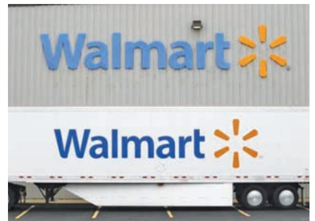
The Wal-Mart company logo is seen outside a Wal-Mart Stores Inc company distribution centre in Bentonville, Arkansas on 6 June, 2013.