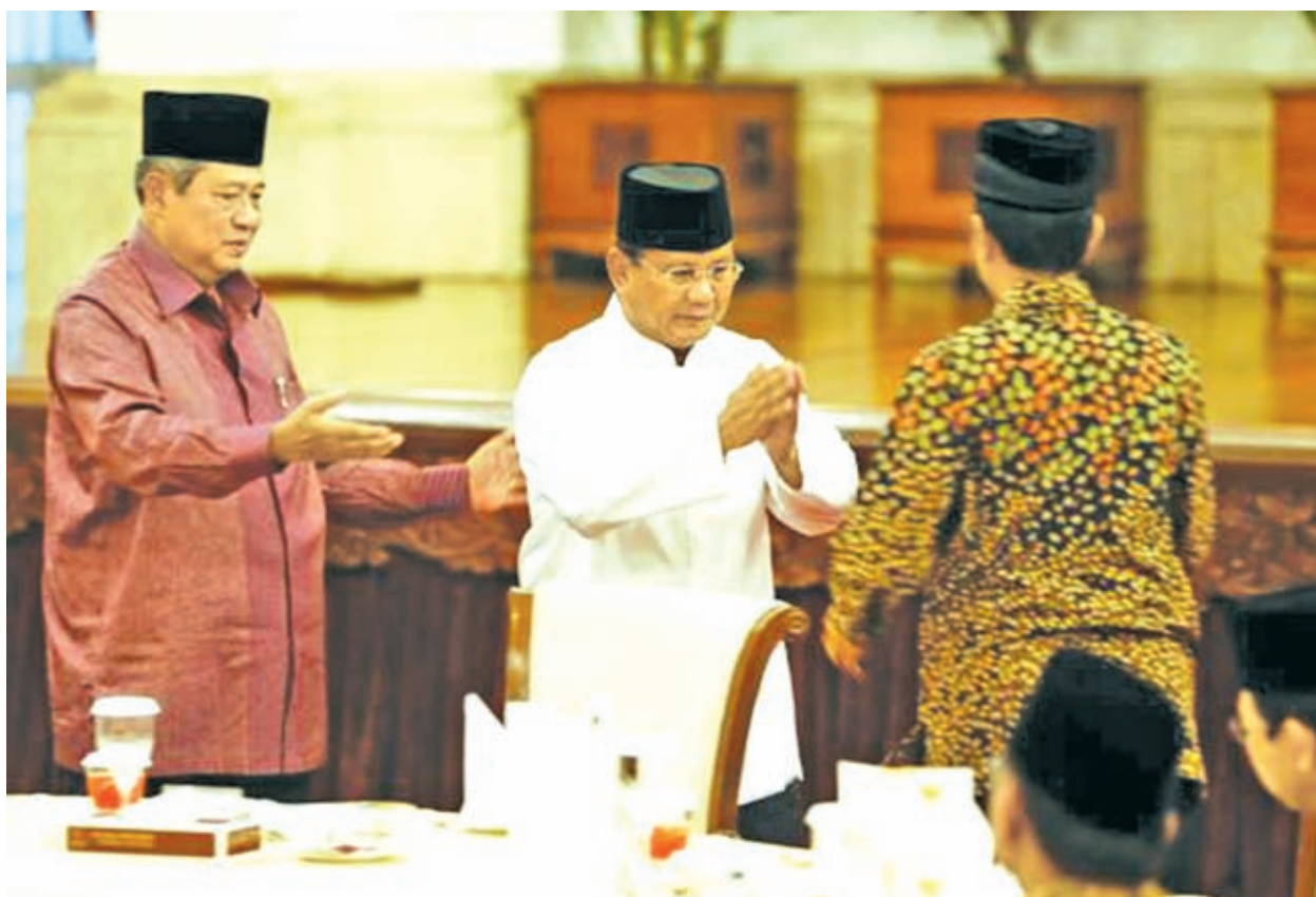
(From L to R) Indonesia President Susilo Bambang Yudhoyono gestures to presidential candidate Prabowo Subianto to shake hands with fellow candidate Joko "Jokowi" Widodo during a meeting at the presidential palace in Jakarta on 20 July, 2014.

The national police and military have deployed nearly 300,000 personnel across the vast archipelago of 240 million people.