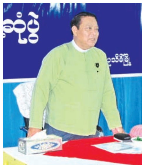
Union Minister U Khin Ye speaks to immigration staff in Patheingyi.—MNA

NAY PYI TAW, 21 July — Union Minister U Khin Ye for Ministry of Immigration and Population on Monday urged the staff of his ministry in Patheingyi, Ayeyawaddy Region, to try hard for the implementation of 'Third Wave Reform'.