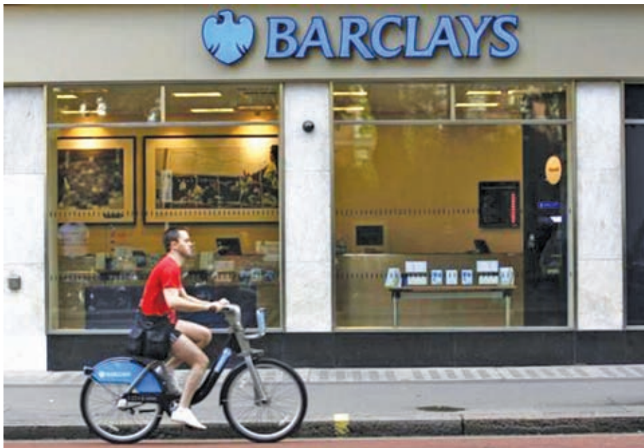
A man rides a bicycle past a Barclays bank in London on 5 Aug, 2010 file photo.