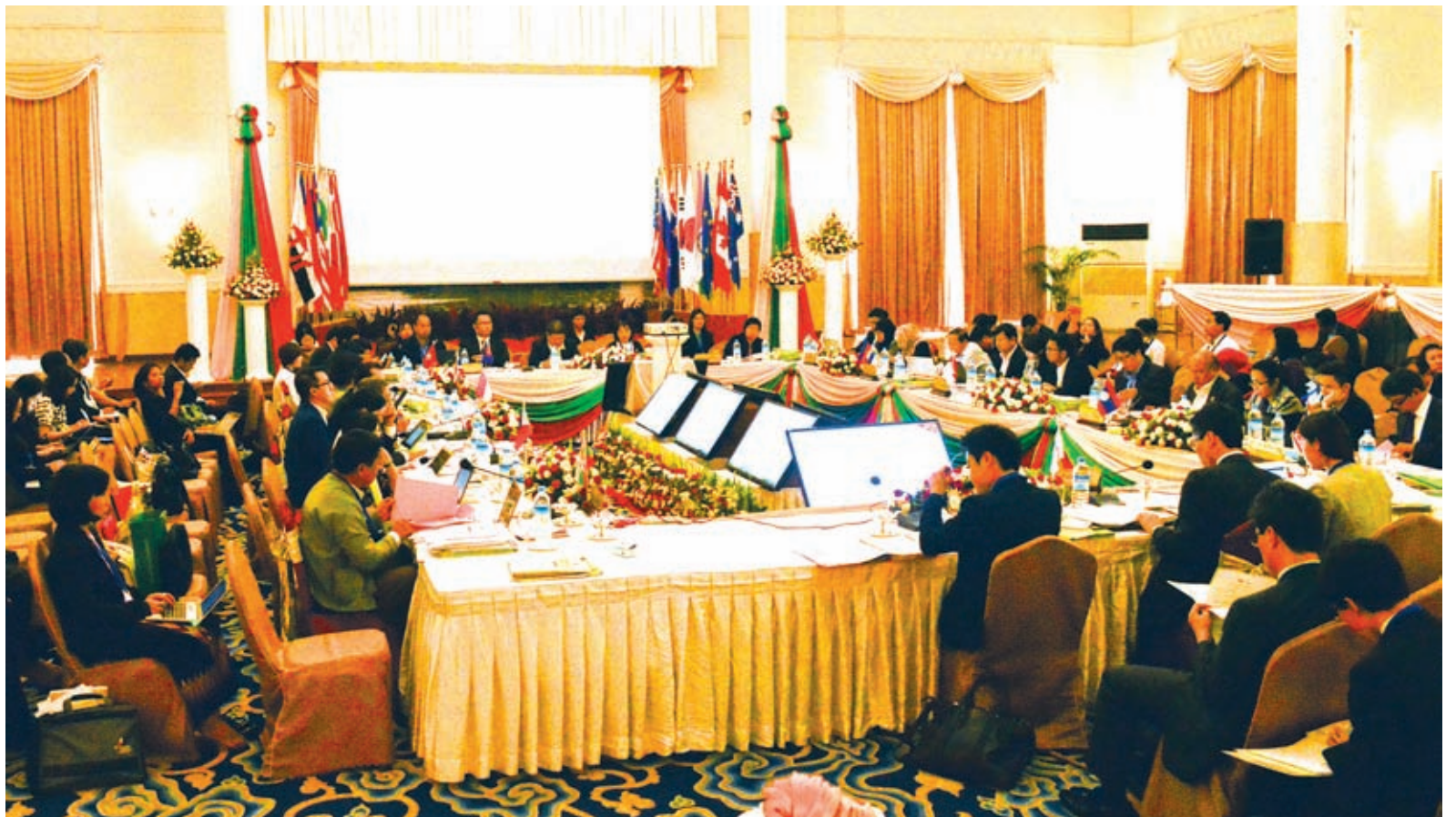
Senior Economic Officials from ASEAN had consultations with officials from dialogue countries China, Japan and Korean, on free trade agreement and economic cooperation after SEOM 3/45.