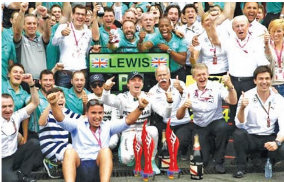
Mercedes Formula One driver Nico Rosberg of Germany (front C) his team mate Lewis Hamilton of Britain (centre L) and Daimler CEO Dieter Zetsche (centre R) pose with the members of the Mercedes team after winning the German F1 Grand Prix at the Hockenheim racing circuit on 20 July, 2014.

HOCKENHEIM, (Germany), 21 July — Nico Rosberg gave Germany another win to celebrate after their