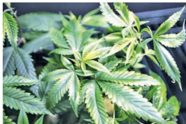
Marijuana plants for sale are displayed at the medical marijuana farmers market at the California Heritage Market in Los Angeles, California on 11 July, 2014.

The Illinois law, which takes effect in January, would allow children