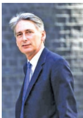
Britain's new Foreign Secretary Philip Hammond leaves 10 Downing Street in central London, on 15 July, 2015.

"If there is no change at all in the way Europe is governed, no change in the balance of competences between the nation states and the European Union, no resolution of the challenge of how the Eurozone can succeed and coexist with the non-Eurozone — that is not a Europe that can work for Britain in the future, so there must be change, there must be renegotiation."