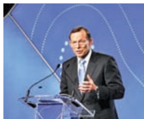
Australian Prime Minister Tony Abbott delivers his keynote speech during the B20 Summit in Sydney, on 17 July, 2014.

Prime Minister Tony Abbott, speaking on a breakfast radio show, said he had spoken "overnight" to Russian President Vladimir Putin for the first time about the disaster, amid mounting horror over