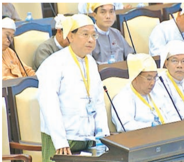
Union Minister for Science and Technology Dr Ko Ko Oo answers question on the plan to build nuclear reactors for research purposes.