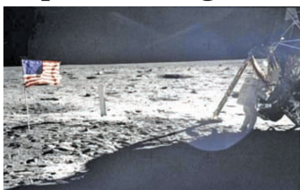
This NASA file image shows US astronaut Neil Armstrong, the Apollo 11 Mission Commander, standing next to the Lunar Module “Eagle” on the moon on 20 July, 1969.

This path, however, is fraught with technological cul-de-sacs that do not