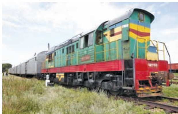
General view of a train of refrigerator wagons, which according to employees and local residents contain bodies of passengers of the crashed Malaysia Airlines Boeing 777 plane, at a railway station in the town of Torez, Donetsk region on 20 July, 2014. — REUTERS

"But there's still a hell of a long way to go before anyone could be satisfied with the way that site is being treated," Abbott said. "It's more like a garden cleanup than a forensic investigation. This is completely unacceptable." — Reuters