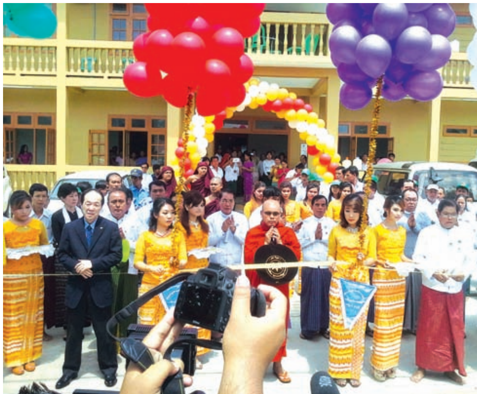
The handover and opening ceremony of the eye special clinic at Tipitaka Paleyaung Shein Monastery in Yangon Region in progress.

YANGON, 21 July — The Government of Japan, under its Grant Assistance for Grassroots Human Security Projects (GGP) Scheme, has extended the assistance of US$ 123,228 under a humanitarian assistance program entitled “The Project for Construction of Eye Special Clinic in the Tipitaka Paleyaung Shein Monastery in Mingaladon Township, Yangon Region”.