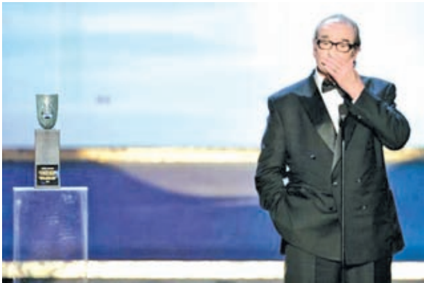
Actor James Garner covers his mouth at the 11th annual Screen Actors Guild awards at the Shrine Auditorium in Los Angeles in this 5 Feb, 2005 file photo.

LOS ANGELES, 21 July — Actor James Garner, best known for his prime-time television roles as the wisecracking frontier gambler on "Maverick" and as an ex-con turned private eye on "The Rockford Files," has died at age 86, Los Angeles police confirmed early on Sunday.