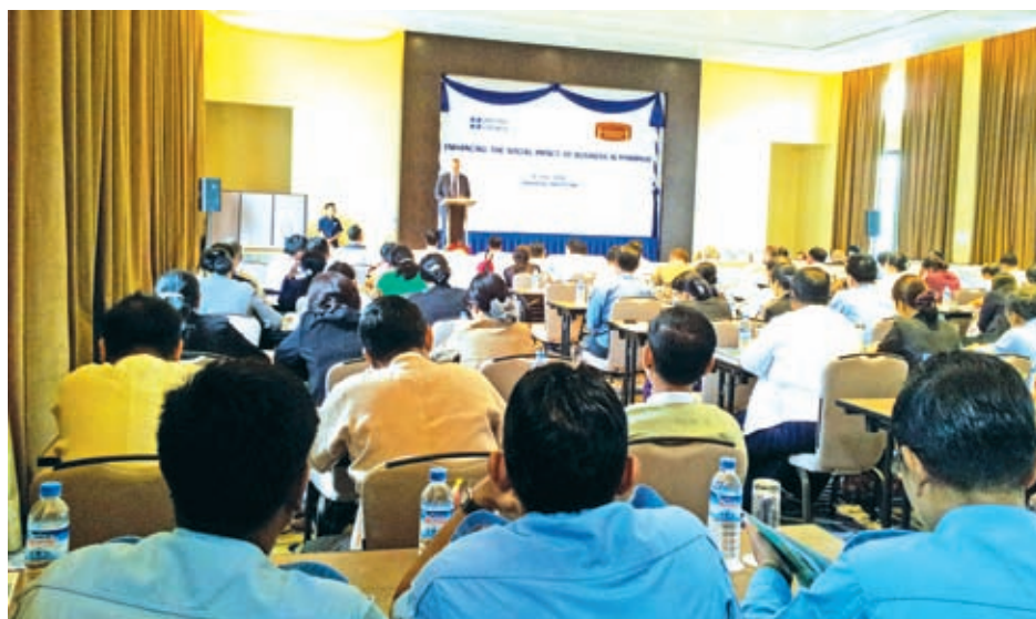
'Enhancing the Social Impact of Business in Myanmar' dialogue in progress at Parkroyal Hotel in Nay Pyi Taw.

NAY PYI TAW, 21 July —The 'Enhancing the Social Impact of Business in Myanmar' dialogue jointly organized by Ministry of National Planning and Economic Development, Directorate of Investment and Company Administration, and British Council Myanmar was held here on Monday.