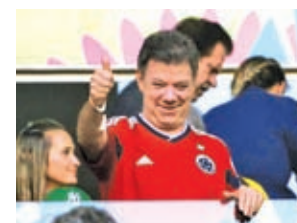
Colombia President Juan Manuel Santos

Santos will face fierce opposition in Congress, not