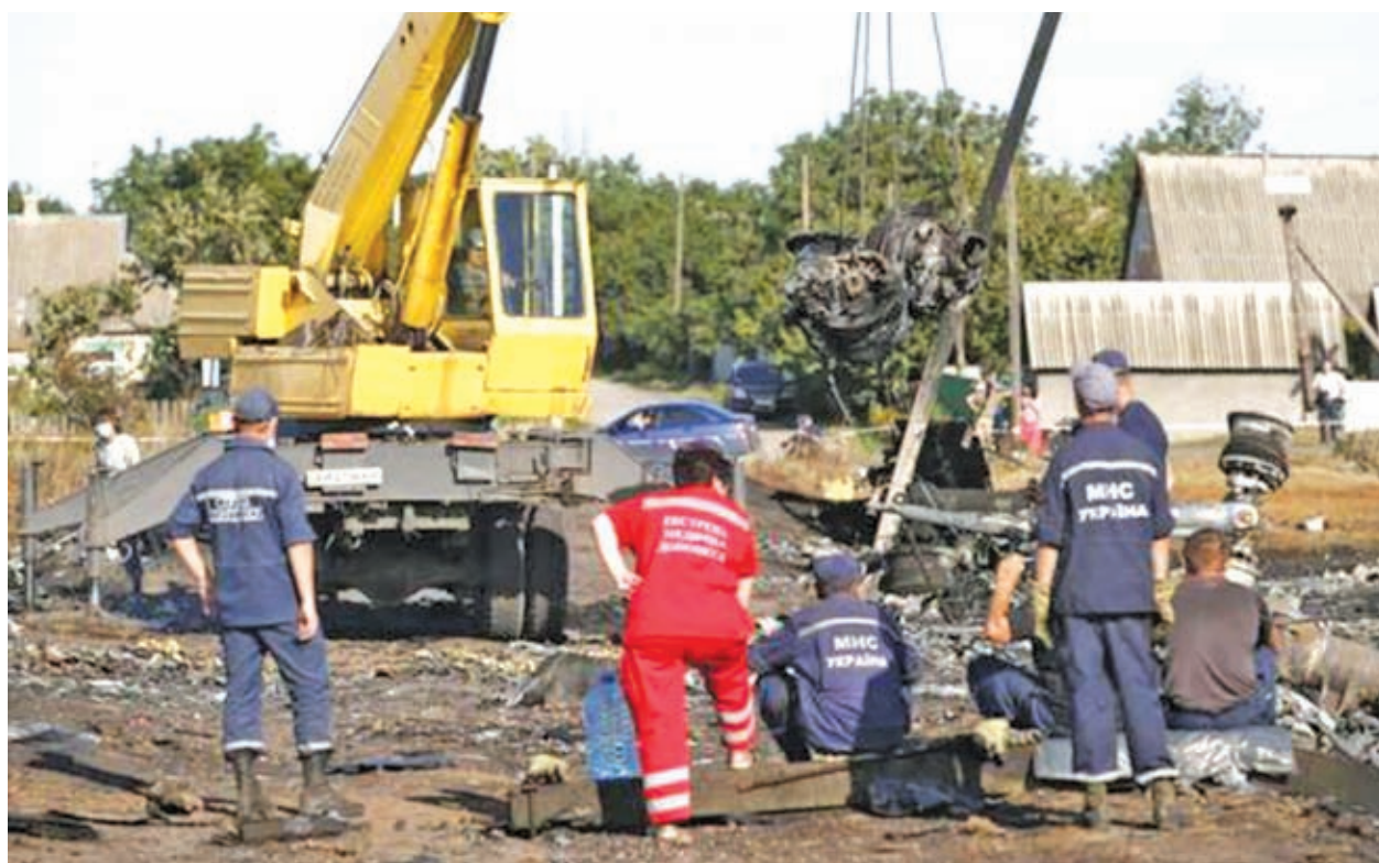
Members of the Ukrainian Emergency Ministry, medical personnel and a crane operator work at the crash site of Malaysia Airlines Flight MH17, near the village of Hrabove, Donetsk region, on 20 July, 2014.

The UN Security Council is scheduled to vote on Monday on a resolution that would condemn the downing of the plane and demands that those responsible be held accountable and that armed groups not compromise the