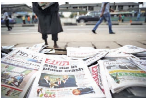
Newspapers are seen at a vendor's stand along a road in Ikoyi district in Lagos on 18 July, 2014.

For Femi Adesina, now editor-in-chief of Nigeria's