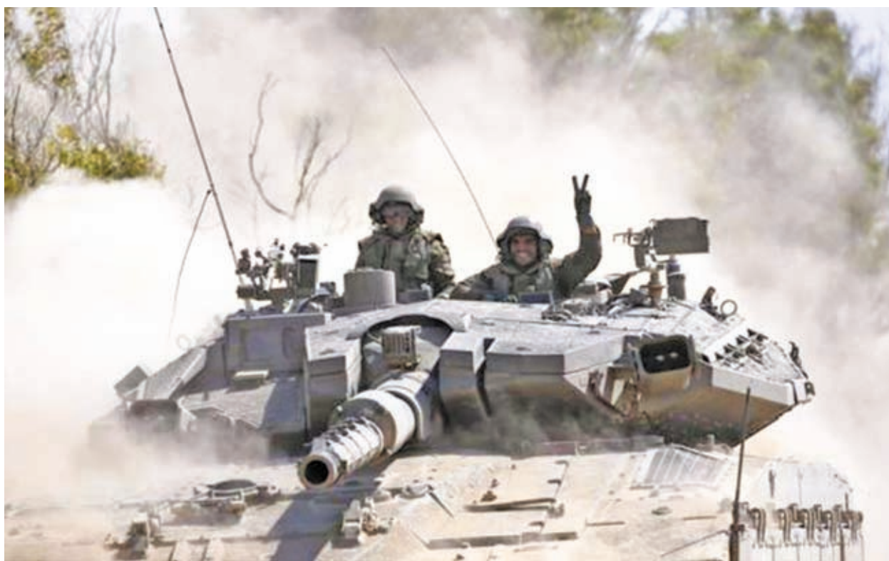
An Israeli soldier gestures from a tank near the border with Gaza on 20 July, 2014.

In New York, the Security Council called for a truce after an emergency meeting on Sunday. The 15-member Council "expressed serious concern about the growing number of casualties (and)... called for an immediate cessation of hostilities," Rwanda's UN Ambassador Eugene Gasana told reporters. Two groups of Palestin-