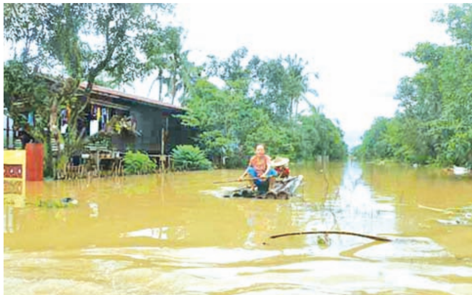
A neighbourhood in Hlaingbwe flooded by heavy rains on 19 July.