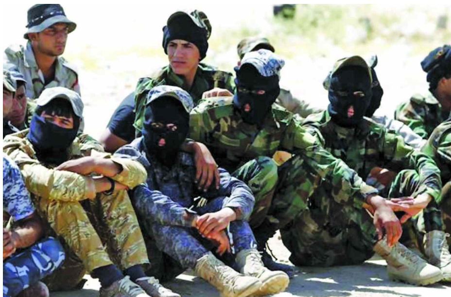
Shi'ite volunteers, who have joined the Iraqi army to fight against militants of the Islamic State, formerly known as the Islamic State of Iraq and the Levant (ISIL), sit together during training in Baghdad, on 9 July, 2014.—REUTERS

fellow Shi'ites from the Islamic State, a Sunni group that says all Shi'ites are heretics who must repent or die.—Reuters