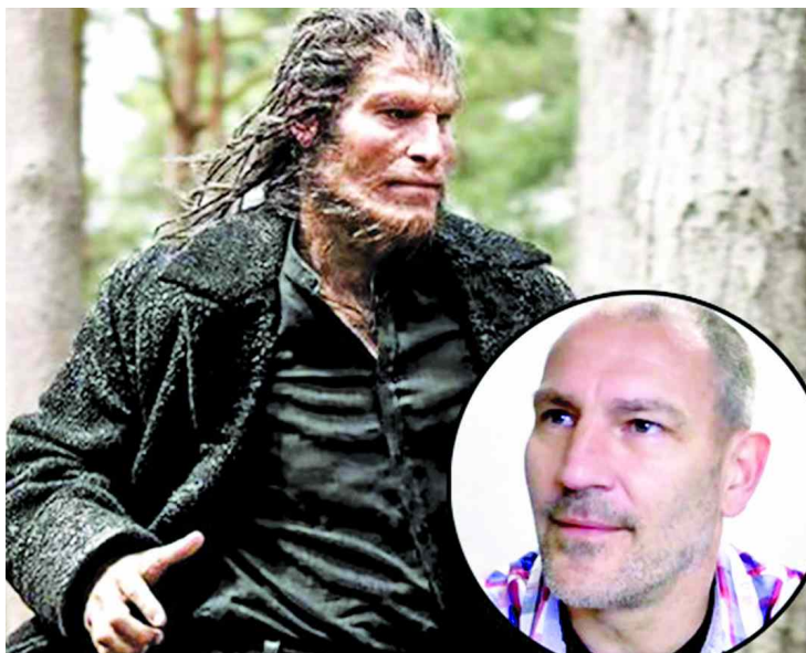
British 'Harry Potter' actor David Legeno

NEW YORK, 12 July — British actor David Legeno, who appeared as a werewolf in the "Harry Potter" films, was found dead by hikers in a remote area of Death Valley, California police said on Friday.