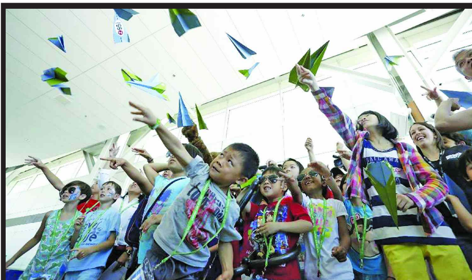
Young participants fly their paper airplanes during the paper airplane flying competition at the Vancouver International Airport in Vancouver, Canada, on 11 July, 2014. Residents and tourists participated in the 2nd annual paper airplane workshop and competition. This is a part of the program of the Vancouver International Airport's summer promotion campaign to promote local retail businesses.

7. Late inquiries or inquiries via telephone will not be answered.