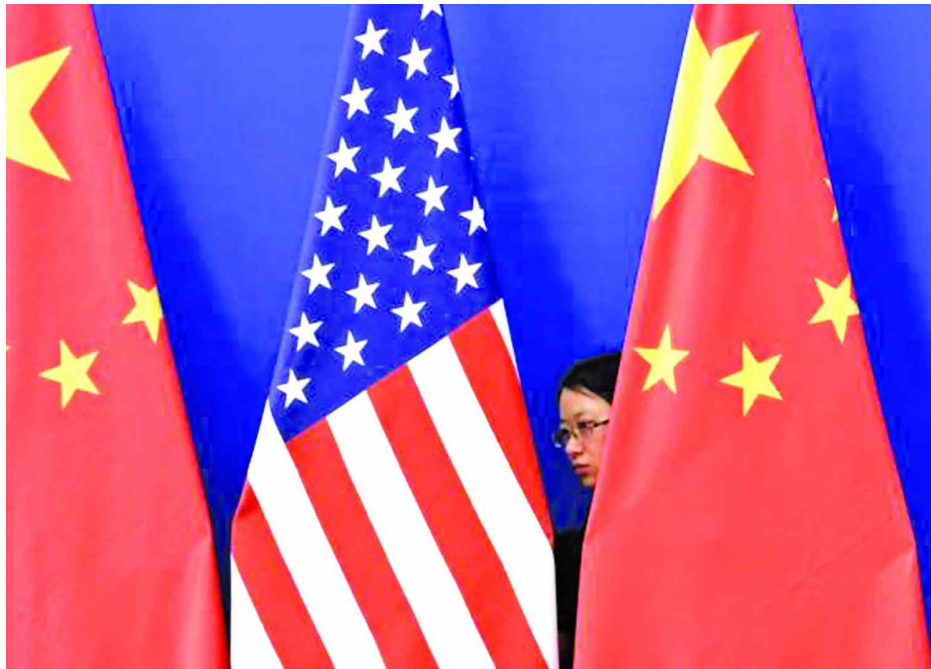
A member of staff from Chinese government adjusts US and Chinese national flags before a news conference for the 6th round of US-China Strategic and Economic Dialogue at the Great Hall of the People in Beijing, on 10 July, 2014.

under the pen name “Zhong Sheng”, meaning “Voice of China”, often used to give views on foreign policy.