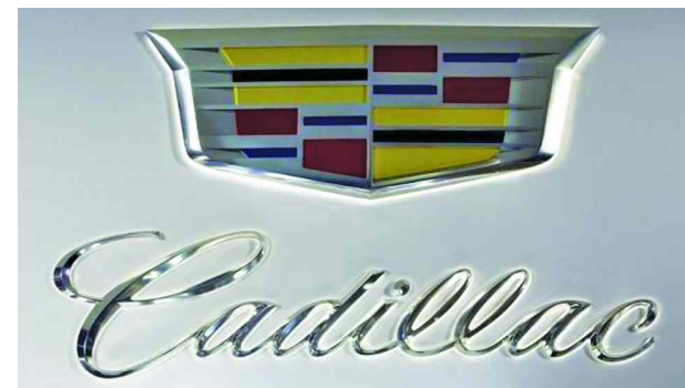
A Cadillac logo is pictured at the Jacob Javits Convention Center during the New York International Auto Show in New York on 16 April, 2014.

Cadillac dealers on Friday said the brand needs two things to succeed: