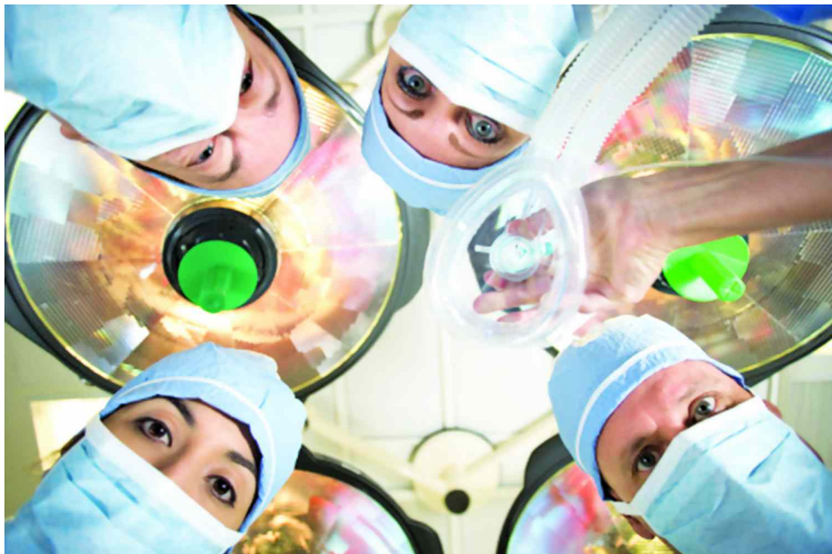
Facial hair increases the risk of burns for people who use home oxygen therapy, a new study warns.

NEW YORK, 12 July — A new case report from US doctors suggests that men who use home oxygen therapy should consider a clean-shaven look to reduce their risk of serious facial burns.