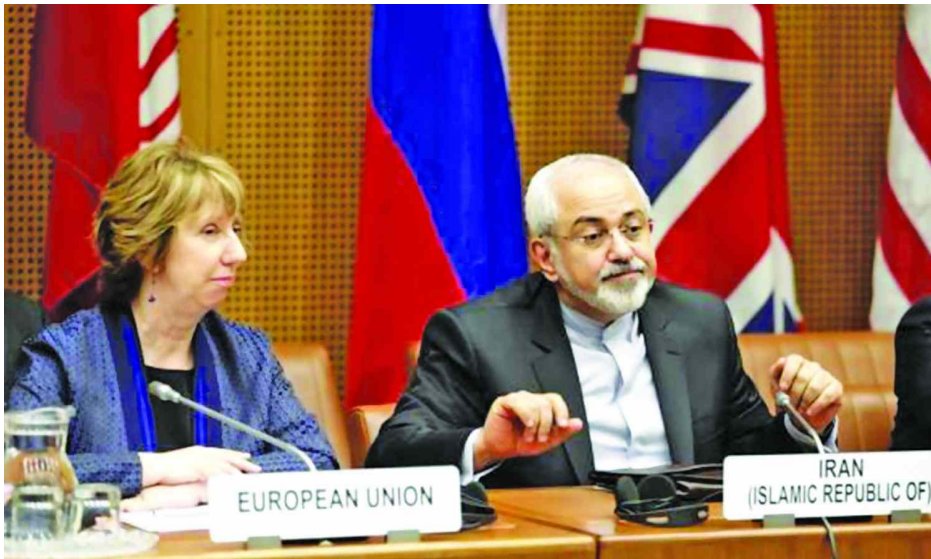
European Union Foreign Policy Chief Catherine Ashton (L) and Iranian Foreign Minister Mohammad Javad Zarif wait for the begin of talks in Vienna on 17 June, 2014.

The major powers want Iran to significantly scale back its nuclear programme to deny it any capability to quickly produce atomic bombs. Iran says its activities are entirely peaceful and want crippling sanctions lifted as soon as possible.