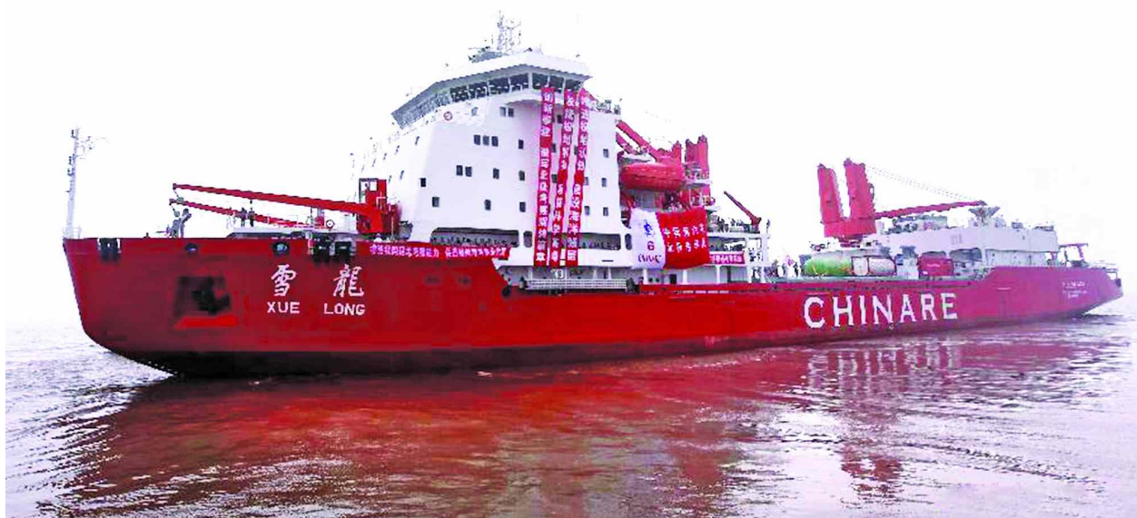
China's icebreaker Xuelong , or "Snow Dragon," leaves the dock in east China's Shanghai, on 11 July, 2014. The icebreaker kicked off the sixth Arctic expedition on Friday. It is estimated that the vessel will travel over 11,057 nautical miles during its 76-day voyage.

In mid-April, Xuelong docked in Shanghai, wrapping up the country's 30th scientific expedition to Antarctica.