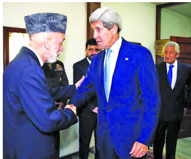
US Secretary of State John Kerry is greeted by Afghanistan's President Hamid Karzai (L) as he arrives for a dinner at the presidential palace in Kabul, on 11 July, 2014.