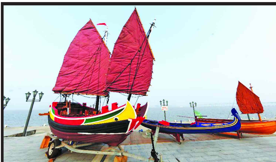
Classical boats are displayed during the 2014 China (Zhoushan Archipelago) International Boat Show in Zhoushan, east China's Zhejiang Province, on 11 July, 2014.