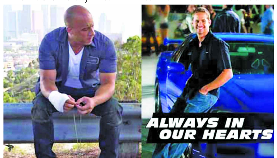
The producers took to Facebook to share their journey of 15 years which began with the first movie in the action drama.

month hiatus after Walker’s death. The actor had completed most of his scenes but not all. “There was a time when we didn’t