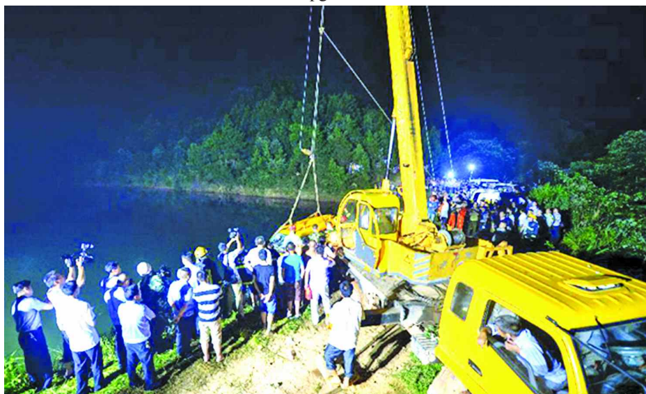
A kindergarten bus is hauled out of a pond at the mountainous Ganzi Village in the Yuelu District of Changsha, capital of central China's Hunan Province, on 11 July, 2014.—XINHUA

In July 2011, a nine-seat minivan carrying 64 kindergarten students and teachers from Zhengning county, Gansu Province, crashed with a truck. Twenty-two passengers were killed. Five months later, a modified bus tumbled into ditch, killing 15 of 47 students from Shouxian Primary School in Xuzhou, Jiangsu Province. Both accidents happened in rural areas.—Xinhua