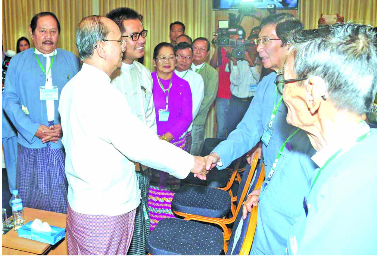
President U Thein Sein friendly greets Myanmar artistes from music, dancing and acting in Yangon.—MNA

The president also pledged that loans will be