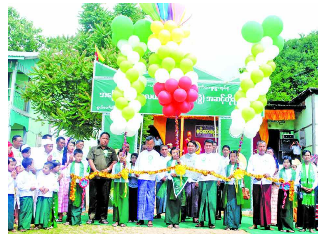
A primary school in Swetaw village is promoted to a middle school.

BAGO, 12 July — Primary schools in Pantaung Township of Pyay District, Bago Region were promoted to middle schools on Thursday.