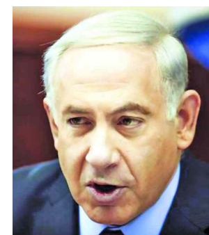
Israel's Prime Minister Benjamin Netanyahu

Netanyahu says more than 1,000 targets hit in Gaza, sees "more to go"