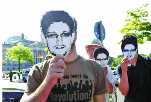
Protesters hold masks depicting former US National Security Agency contractor Edward Snowden during a demonstration in Berlin on 22 May, 2014.