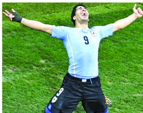
The Catalan club will bolster their attack by signing Suarez on a five-year contract for a transfer fee that media reports put at 81 million euros ($111 million).

BARCELONA, 12 June — Barcelona who already have Lionel Messi and Neymar up front, will boast an even more fearsome strike force next season after agreeing to buy disgraced Uruguayan Luis Suarez from Liverpool on Friday. After enduring a first campaign without major silverware in six years, the Catalan club will bolster their attack by signing Suarez on a five-year contract for a transfer fee that media reports put at 81 million euros ($111 million).