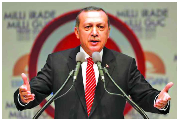
Turkey's Prime Minister and presidential candidate Tayyip Erdogan makes a speech during a meeting to launch his election campaign in Istanbul on 11 July, 2014.

ISTANBUL, 12 July — Tayyip Erdogan outlined his vision for a "pioneering new Turkey" on Friday, pledging to re-write the constitution, forge a