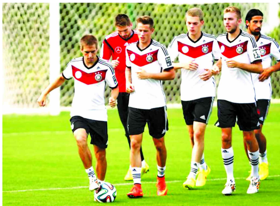
Germany's national soccer team player Philipp Lahm (L) and his teammates run during a training session in the village of Santo Andre north of Porto Seguro on 10 July, 2014. The picture shows from L to R: Philipp Lahm, goalkeeper Ron-Robert Zieler, Erik Durm, Matthias Ginter, Christoph Kramer and Sami Khedira.