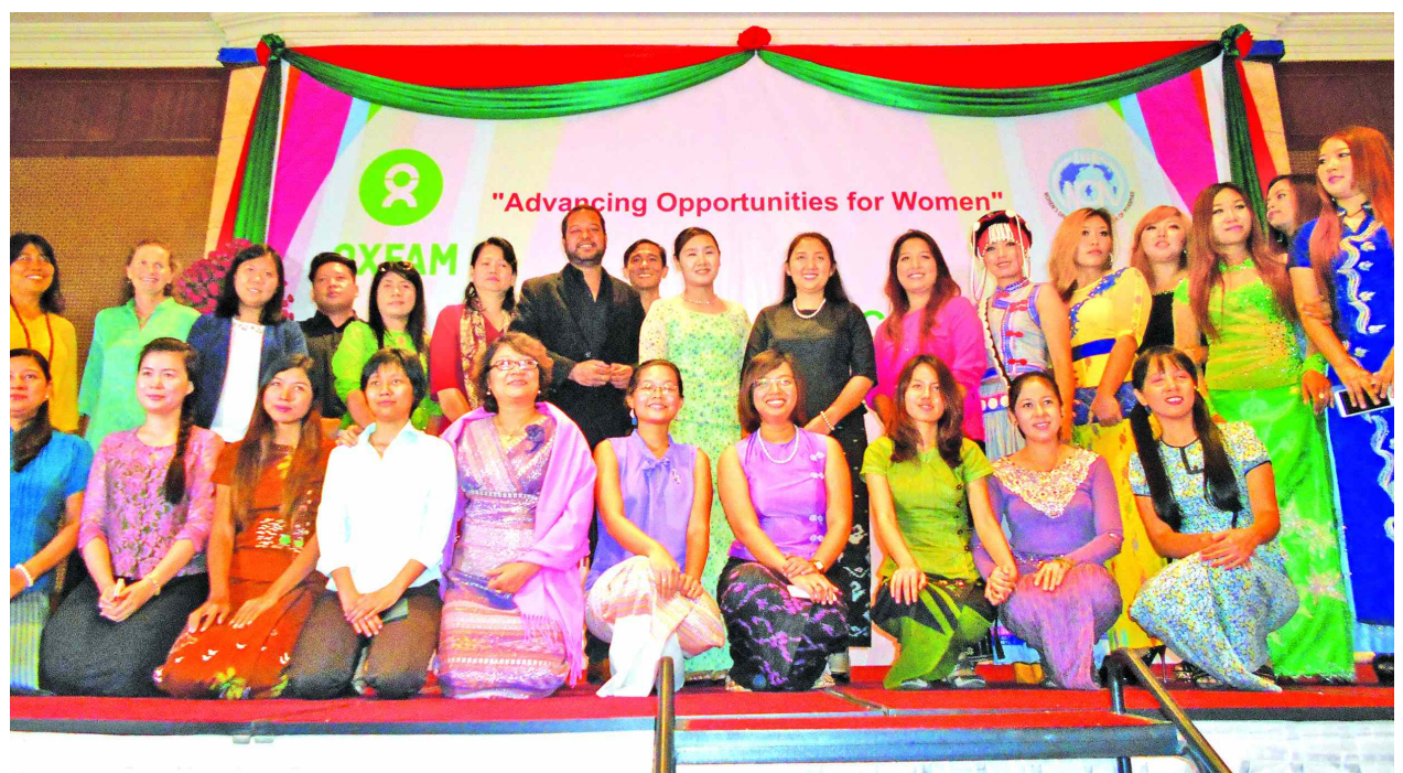
Award-winning Myanmar women pose for a group photo together with representatives of Oxfam Myanmar and Women's Organizations Network.