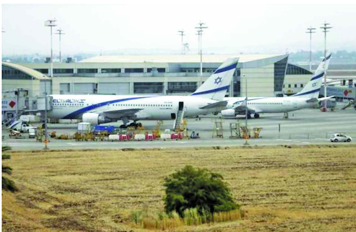
El Al planes are seen parked at Israel's Ben-Gurion International Airport near Tel Aviv, during a strike by airline workers, on 21 April, 2013.

it had issued the warning to airlines so that injury to their passengers could be avoided, announced earlier that it had already fired at least one rocket towards the airport on Friday.