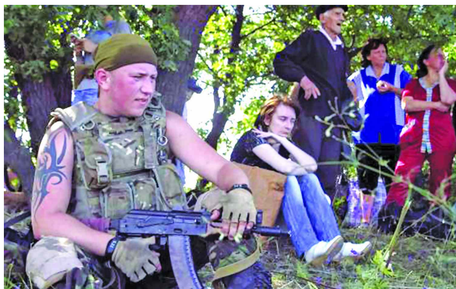
Ukrainian army soldier from battalion ‘Aydar’ guards local residents as they leave the village of Metalist near the eastern Ukrainian city of Luhansk on 11 July, 2014.