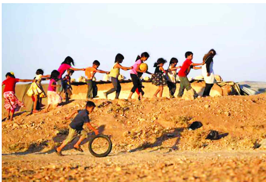
Children, who are internally displaced due to the fighting between rebels and the forces of Syrian President Bashar al-Assad, play inside Al-Tah camp in the southern Idlib countryside on 4 July, 2014.

In more than 3 years of war, very few Syrians have made it to continental Europe. There have been 123,600 asylum requests, mostly in Sweden and Germany, but that figure includes double counting, since some have asked for