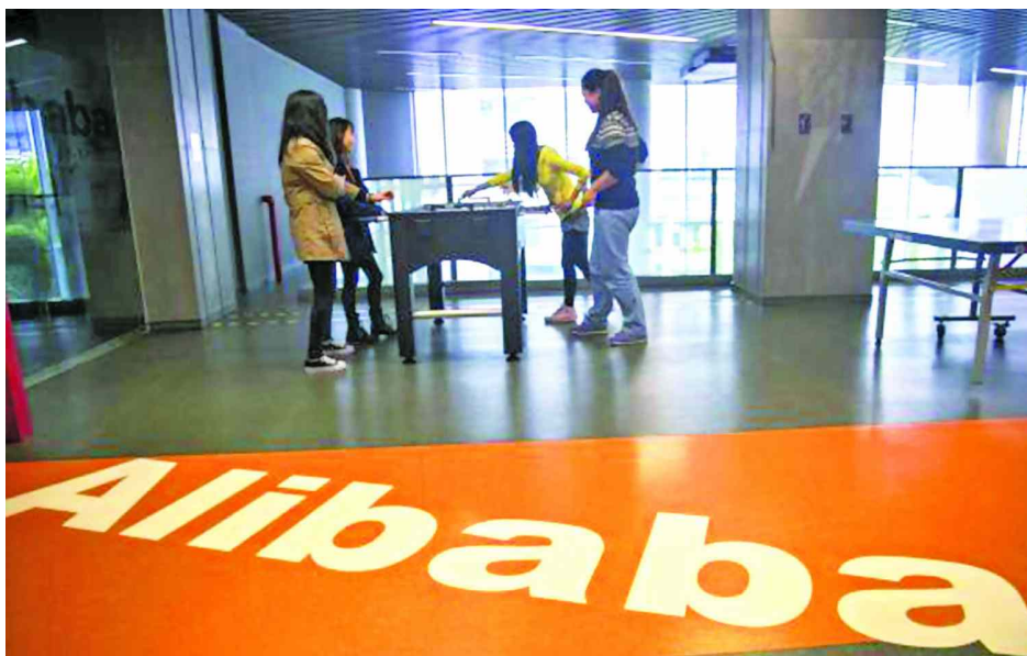
People play in a hall inside Alibaba's headquarters in Hangzhou, Zhejiang Province, on 23 April, 2014.