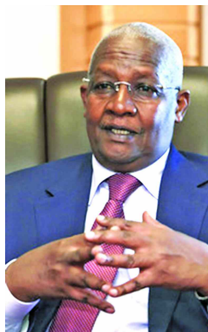
Sam Kutesa, Uganda's foreign minister and incoming president of the UN General Assembly, is interviewed by Kyodo News in Tokyo on 11 July, 2014. In the interview, Kutesa expressed his desire to attend the ceremony in 2015 to mark the 70th anniversary of the atomic bombing of Hiroshima.