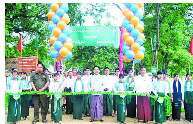
A primary school in Nga Sal Pay village is opened as a middle school after being promoted.—MNA