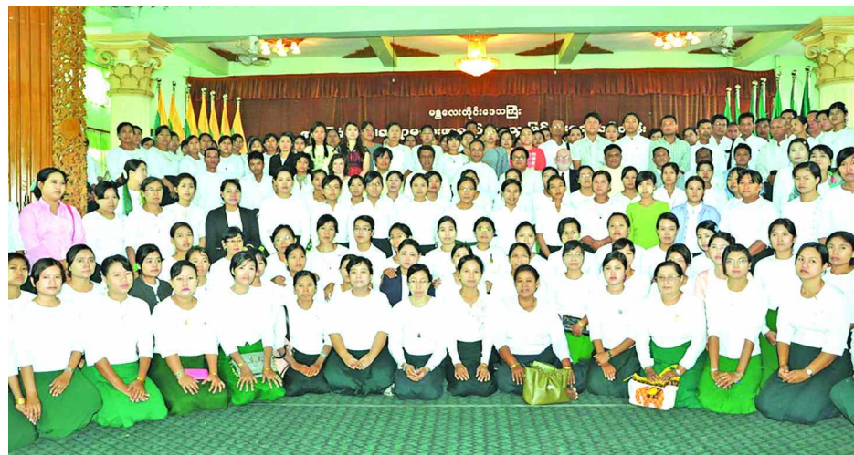
Mandalay Region Chief Minister U Ye Myint and teachers gather for a group photo at the opening of English Language Proficiency Course.—MNA

U Ye Myint also urged the teachers to develop modern teaching methods