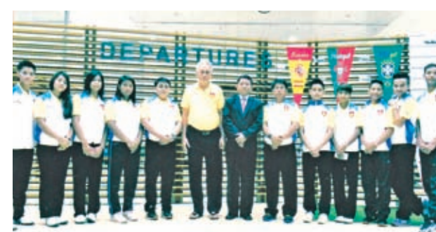
Myanmar Taekwondo team at Yangon International Airport before their departure for South Korea where they will train with pros.—NLM

The team comprised four team officials and seven players. The players of Myanmar team will undergo a joint training in the Republic of Korea and take part in the 17 th Asian Games 2014.—NLM