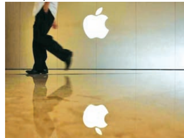
A man walks past the logo at an Apple store in the southern Chinese city of Shenzhen, neighbouring Hong Kong on 9 Sept, 2013.

After the verdict, Apple said it intended to take the case to the Beijing Higher People's Court, according to the People's Daily . "Unfortunately, we were not aware of Zhizhen's patent before we introduced Siri (speech recognition technology) and we do not believe we are using this patent," said a Beijing-based Apple spokeswoman in an emailed statement to Reuters . "While a separate court considers this question, we remain open to reasonable discussions with Zhizhen," the spokeswoman said. — Reuters .