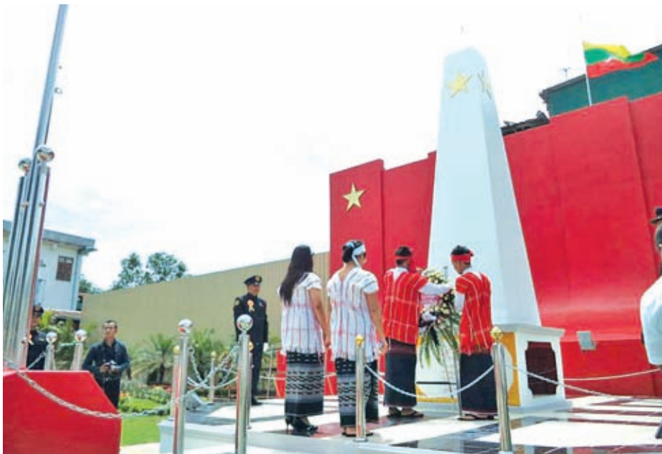
A file photo shows the ceremony to mark the 2013 Martyrs' Day at the monument in Myawady.

MYAWADY, 9 July—Preparations are being made for holding a ceremony to mark Martyrs' Day at the Monument Ground in Myawady of Kayin State. The monument ground for the martyrs is the second largest in the nation