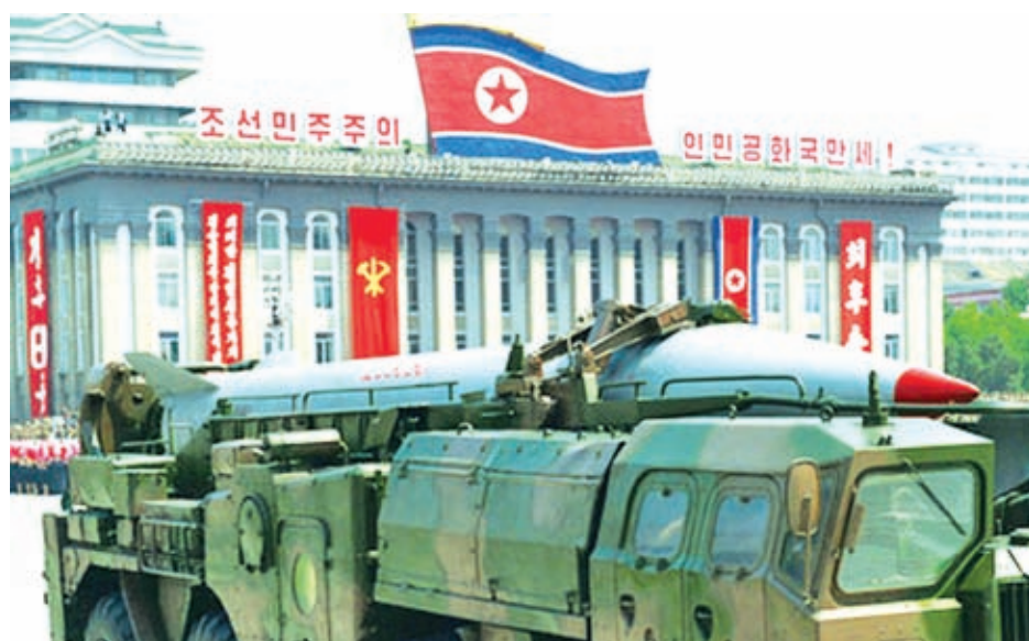
File photo taken in July 2013 shows a Scud short-range ballistic missile in a military parade at Pyongyang's Kim Il Sung Square.