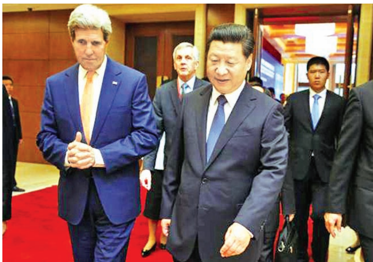
US Secretary of State John Kerry (L) talks with China's President Xi Jinping after the Joint Opening Session of the US-China Strategic and Economic Dialogue known as the "S&ED" at the Diaoyutai State Guesthouse in Beijing on 9 July, 2014.

"We should mutually respect and treat each other