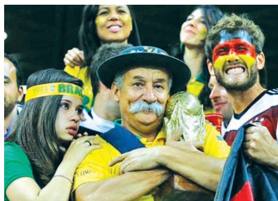
A Brazil fan (C) clutches a replica of the World Cup trophy as a Germany fan (R) celebrates after their 2014 World Cup semi-finals at the Mineirao stadium in Belo Horizonte on 8 July, 2014.