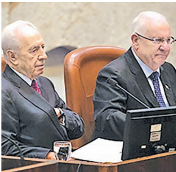
By Shimon Peres, Reuven Rivlin,

Exclusive: Israel's outgoing president and president-elect call on Jews and Arabs to end violence and incitement, and have faith in ability to live together.