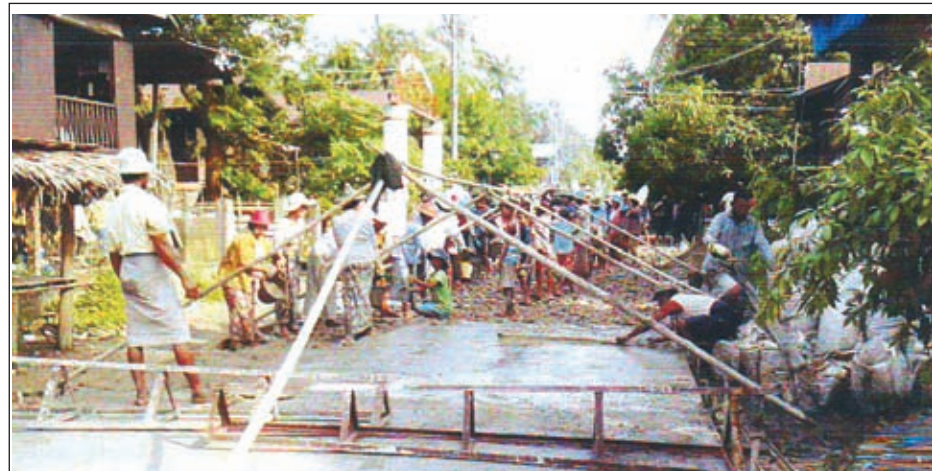
VILLAGE ROAD CONSTRUCTED: Villagers of Thegon Village in Paung Township of Mon State participated in construction of a 2,100-feet long and 15-feet wide concrete road that began in May 2014 and was completed in the second week of July. A photo shows local people working on the concrete road.—KHIN MAUNG WAI

The YCDC law 2013 was enacted to take action against the buildings without permissions by abolishing them. There are 2,021 cases prosecuted over illegal construction of buildings in Yangon Region and over 800 cases in Yangon North and East Districts, according to officials of YCDC.—NLM