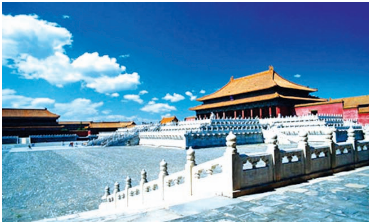
The Palace Museum

BEIJING, 9 July — The curator of Beijing's Palace Museum said at a forum in Hubei Province that the landmark palace grosses 160 million yuan (US$25.61 million) a year.