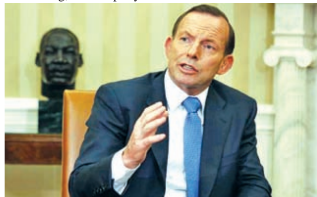
Australian Prime Minister Tony Abbott speaks in the Oval Office of the White House in Washington on 12 June, 2014.