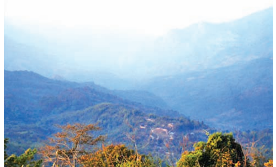
Forests of the Naga Hills under conservation with help of local ethnic youths.