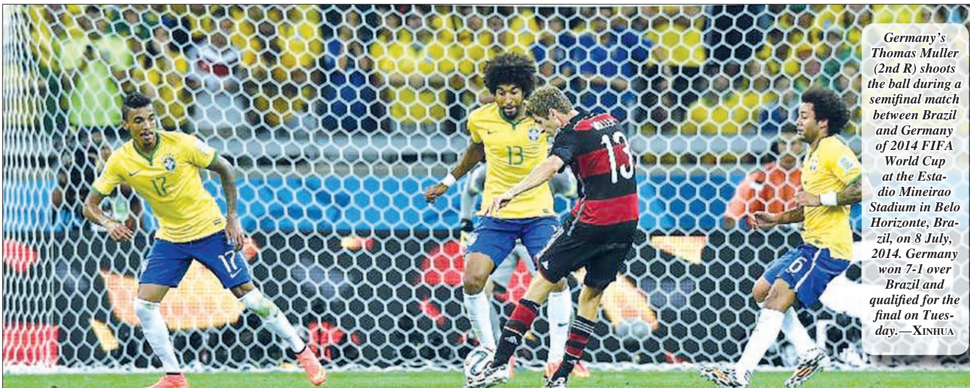
Germany's Thomas Müller (2nd R) shoots the ball during a semifinal match between Brazil and Germany of 2014 FIFA World Cup at the Estadio Mineirao Stadium in Belo Horizonte, Brazil, on 8 July, 2014. Germany won 7-1 over Brazil and qualified for the final on Tuesday.