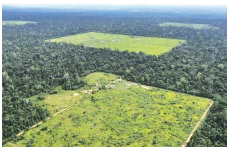
An aerial view shows a tract of Amazon rainforest which has been cleared by loggers and farmers for agriculture near the city of Santarem, Para State, on 20 April, 2013.

OSLO, 9 July — Swathes of the Amazon may have been grassland until a natural shift to a wetter climate about 2,000 years ago let the rainforests form, according to a study that challenges common belief that the world's biggest tropical forest is far older.