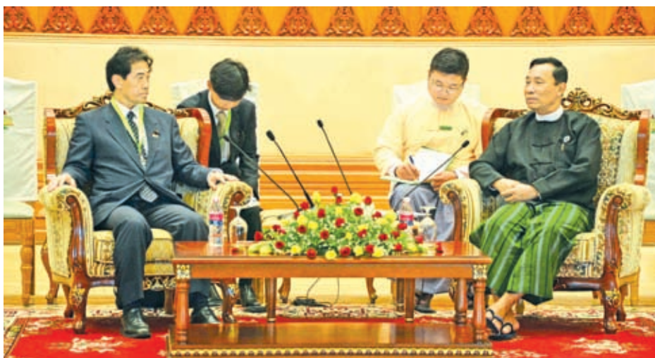
Speaker of Pyidaungsu Hluttaw and Lower House Thura U Shwe Mann holds talks with Mr Ichiro AISAWA, Chairman of the Japan-Myanmar Parliamentarian Friendship League.