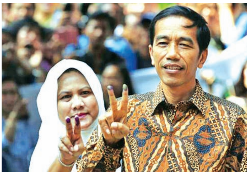
Indonesian presidential candidate Joko “Jokowi” Widodo and his wife Iriana pose for pictures as they cast their vote in Jakarta on 9 July, 2014.

Voters cast ballots at 478,685 polling stations set up across the sprawling archipelago of some