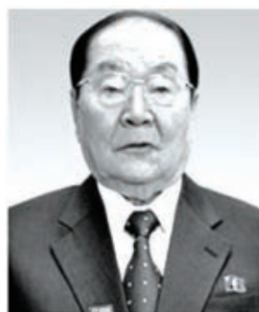
Jon Pyong Ho

BEIJING, 9 July— Jon Pyong Ho, a senior North Korean official who had played a major role in developing the country’s nuclear and missile programmes, died of acute myocardial infarction on