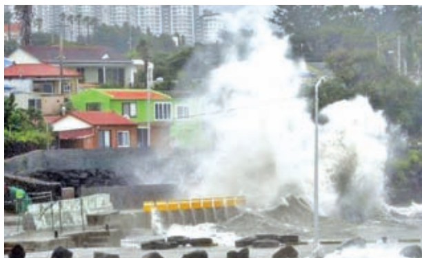
Waves crash as Typhoon Neoguri approaches the village in Seogwipo on Jeju Island on 9 July, 2014.