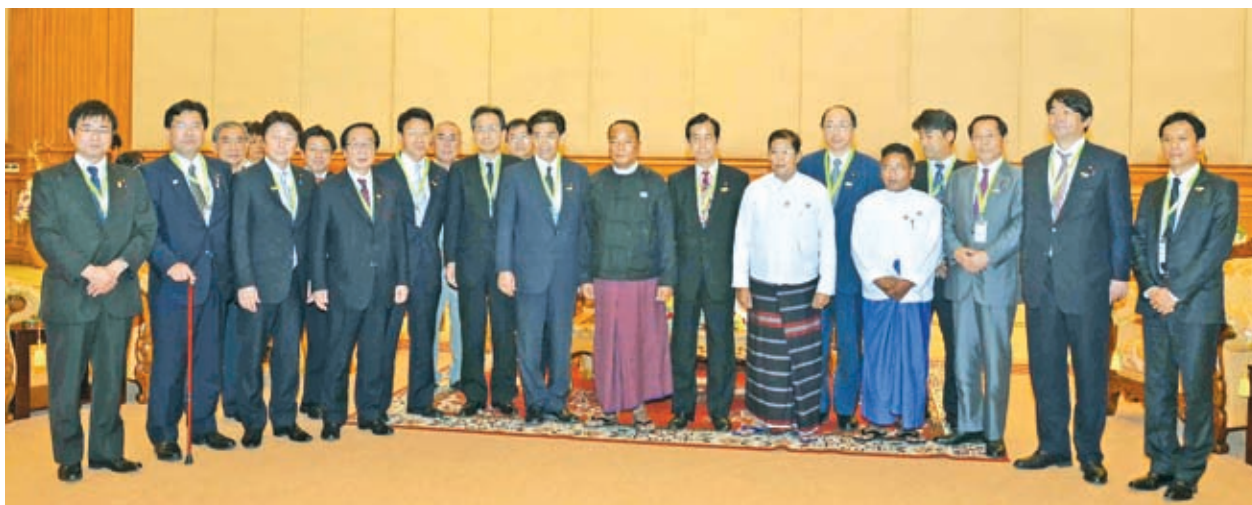
Speaker of Upper House U Khin Aung Myint together with Mr Eiichiro Arisawa, Chairman of the Japan-Myanmar Parliamentarian Friendship League.

NAY PYI TAW, 9 July—Speaker of the Upper House U Khin Aung Myint re-