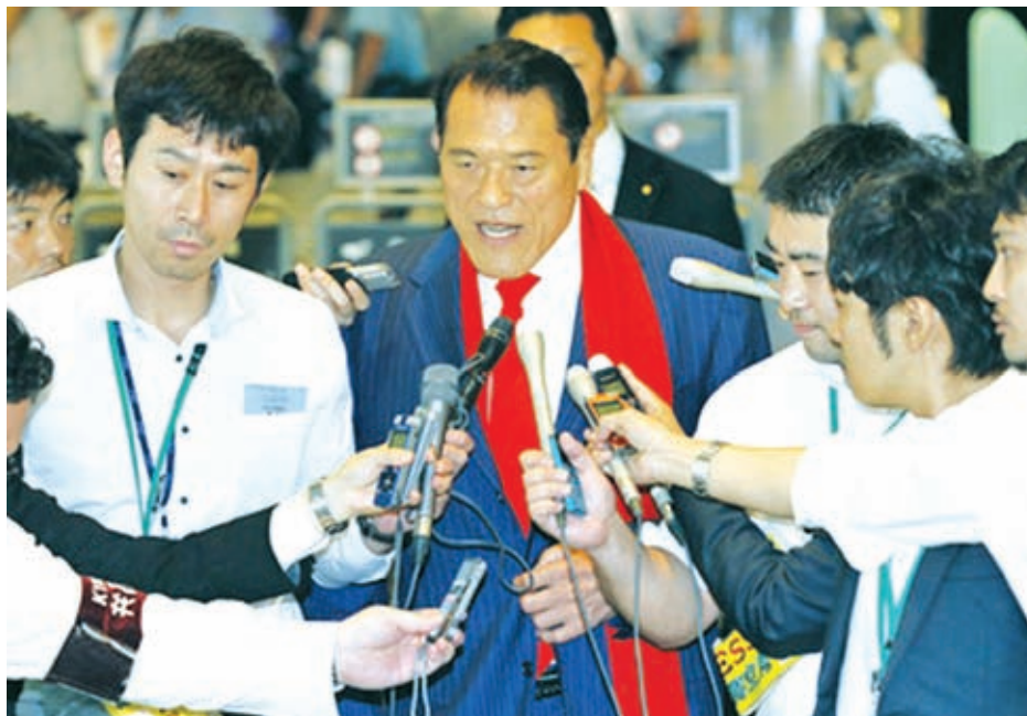
Antonio Inoki, a House of Councillors member, answers reporters' questions at Tokyo's Haneda Airport on 9 July, 2014, before leaving for Pyongyang along with five other opposition lawmakers.

Tokyo, 9 July — Six Japanese opposition lawmakers, including House of Councillors member Antonio Inoki, left Wednesday for Pyongyang to visit sports facilities and hold talks with senior officials of the Workers' Party of