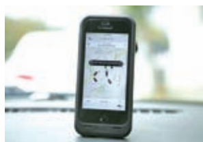
An Uber app is seen on an iPhone in Beverly Hills, California, on 9 Dec 19, 2013.

NEW YORK, 9 July — Uber Technologies Inc, a car service that allows users to summon a ride on their smartphone, has agreed to cap prices during emergencies and natural disasters in New York state to prevent price gouging, New York Attorney General Eric Schneiderman announced on Tuesday.