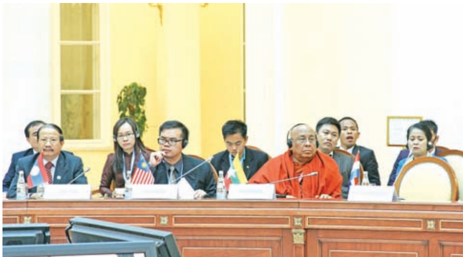
Venerable Sitagu Sayadaw Dr Ashin Nyanissara attends the Asia-Europe Forum on intercultural and interreligious dialogue.

NAY PYI TAW, 9 July—Venerable Sitagu Sayadaw Dr Ashin Nyanissara attended the Asia-Europe Forum on an intercultural and interreligious dialogue held at the Boris Yeltsin Presidential Library at St. Petersburg in Russia Federation on 3 and 4 July.