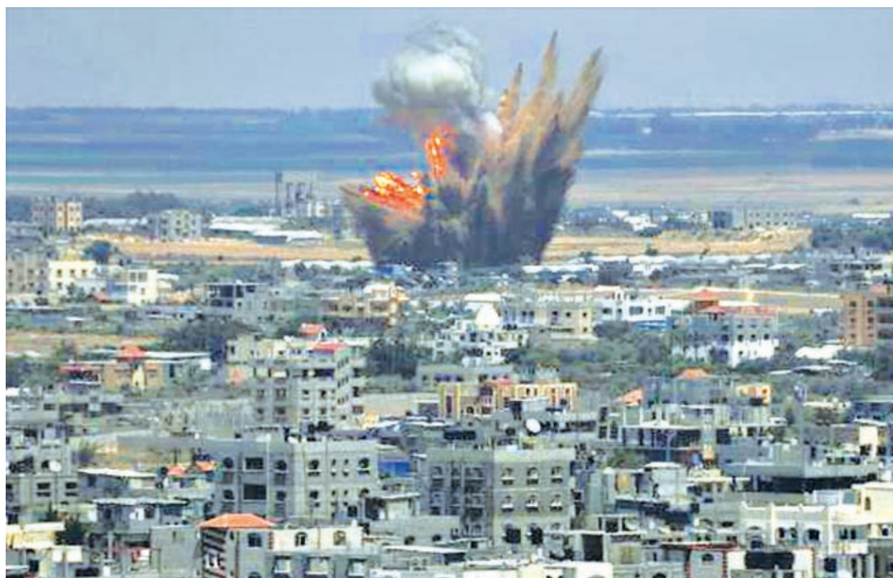
Smoke and flames are seen following what police said was an Israeli air strike in Rafah in the southern Gaza Strip on 8 July, 2014.

GAZA / JERUSALEM, 9 July — At least 23 people were killed across Gaza, Palestinian officials said on Wednesday, by a bombardment Israel said may be just the start of a lengthy offensive against Islamist militants whose rockets struck deeper than ever before into Israel.