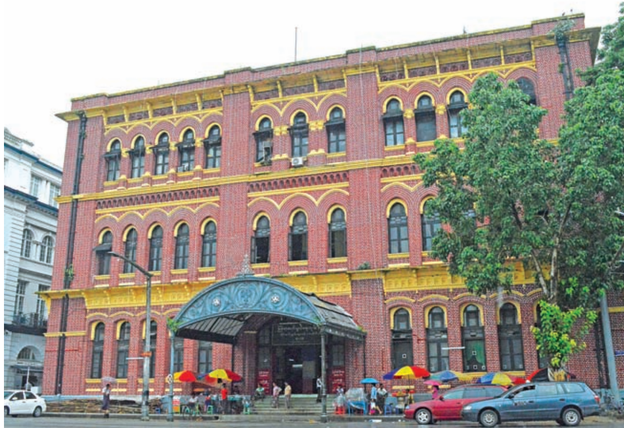
Yangon General Post Office erected in 1908 provides postal services, including domestic express mail services, with deliveries of postal items and parcels available for 26 townships in the country.

Following the signing of MoC between the two ministries in April, Japan's MIC started providing technical support to Myanmar Posts and Telecommunications, with implementation of the scope of cooperation