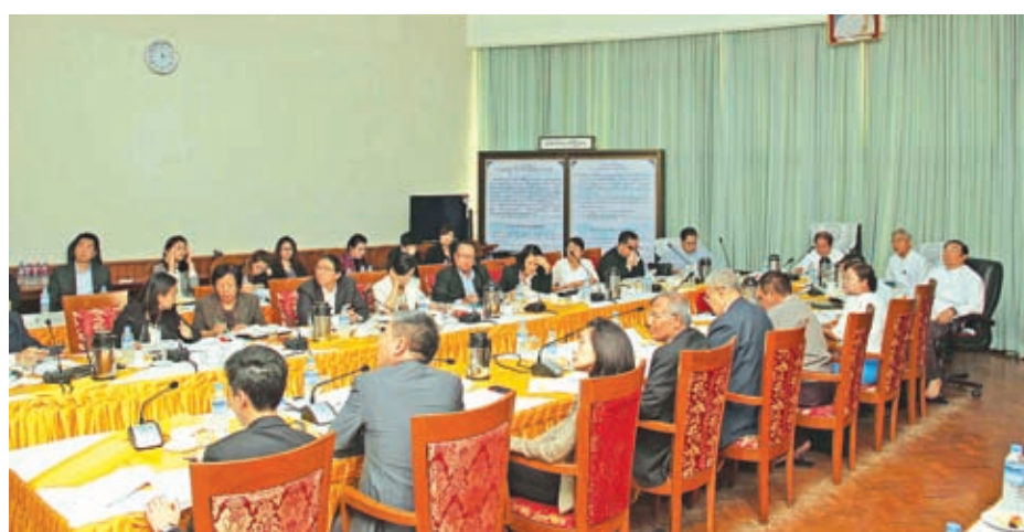
Union Minister U Aye Myint at the ninth meeting of the Work Committee for the Implementation of the Dawei SEZ and related projects.—MNA