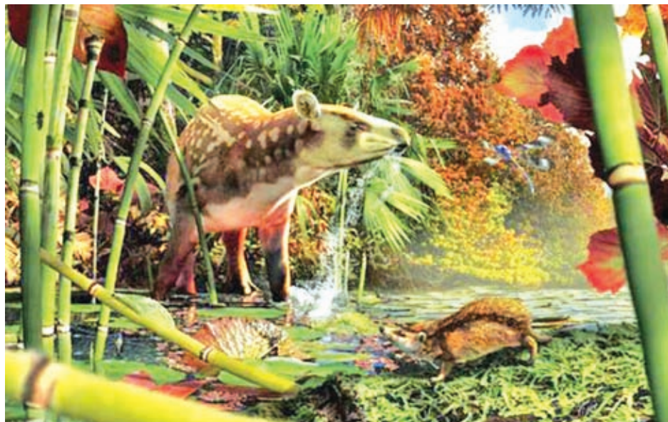
An artist's rendering shows Silvacola acares , an ancient relative of modern tapirs known as Heptodon which resembles a small rhino with no horn and a short trunk, in this image released by the Canadian Museum of Nature on 8 July, 2014.