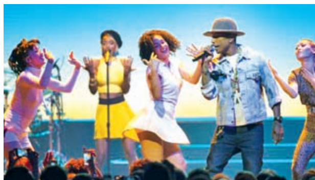
US singer Pharrell Williams (R) performs on the Stravinski Hall stage at the 48th Montreux Jazz Festival in Montreux on 7 July, 2014.