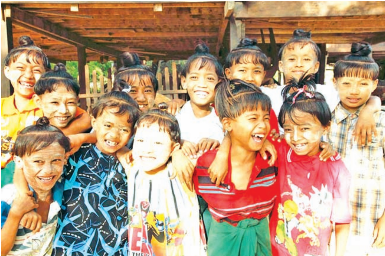
Myanmar launches Early Childhood Care and Development policy to give Myanmar children a better start in life, with a pledge to increase budgets for kindergarten and pre-school education.