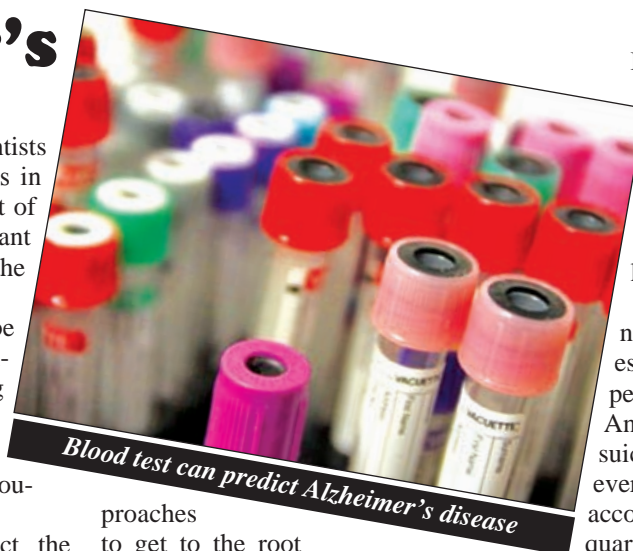
Blood test can predict Alzheimer's disease

Several big pharma firms including Roche, Eli Lilly, Merck & Co and Johnson & Johnson, are pursuing various ap-