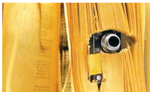
A small photo camera placed in a book and used by the US Central Intelligence Agency (CIA), is displayed at the ‘Top Secret’ Spy Museum in Oberhausen, on 10 July, 2013.

The office of Germany’s Federal Prosecutor, based in the western city of Karlsruhe, late last week issued a