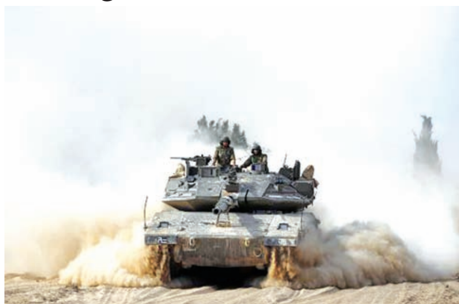
Israeli soldiers ride atop a tank outside the southern Gaza Strip on 7 July, 2014.