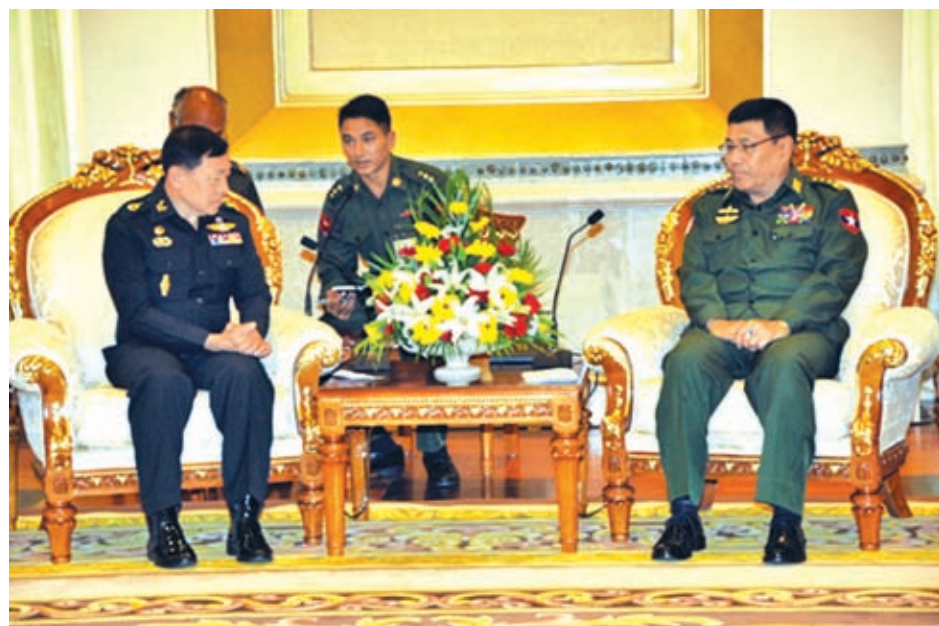
General Hla Htay Win holds talks with General Suravach Butrwong of the Royal Thai Army.