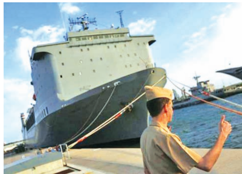
A US Navy personnel gestures in front of the US MV Cape Ray ship docked at the naval airbase in Rota, near Cadiz, southern Spain on 10 April, 2014.

Warren said it is expected that the ship will