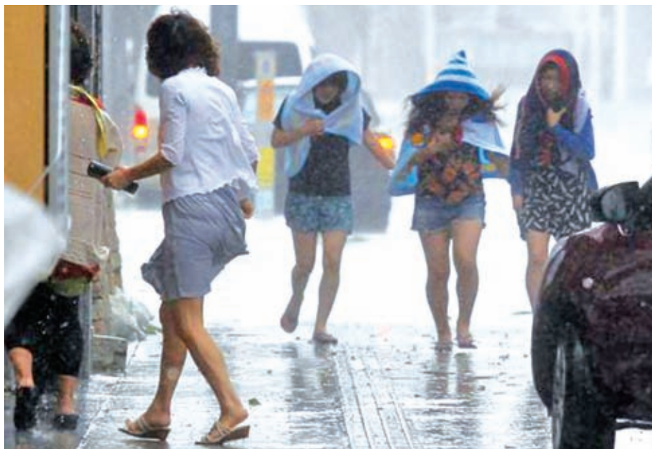
Women walk in strong winds caused by typhoon Neoguri at Kokusai street, a shopping and amusement district in Naha, on Japan's southern island of Okinawa, in this photo taken by Kyodo on 8 July, 2014.—REUTERS

More than 50,000 households in Okinawa lost power and an oil refinery halted operations.