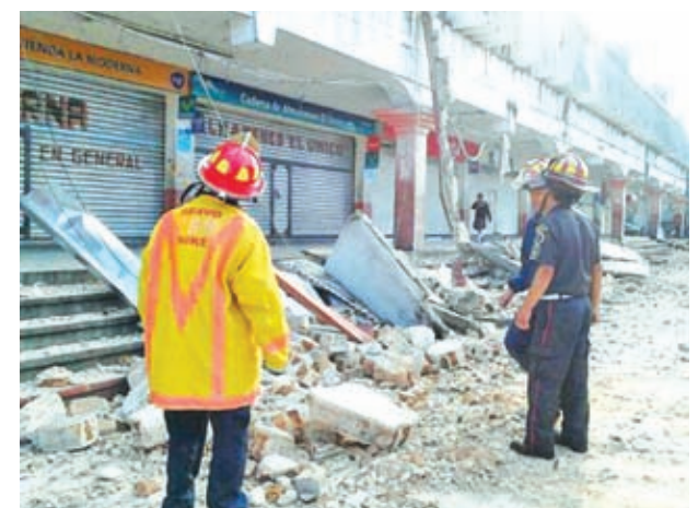
Municipal firefighters stand outside a damaged building in the San Marcos region, in the northwest of Guatemala, in this on 7 July, 2014 handout picture by Guatemala's municipal fire department.—REUTERS