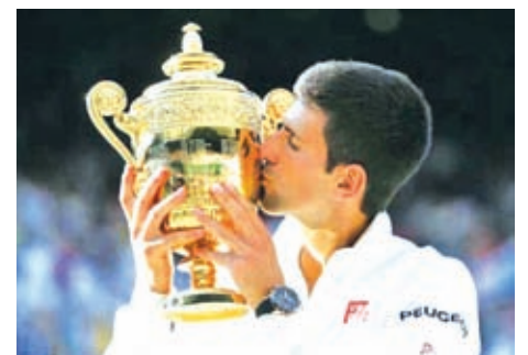
Novak Djokovic of Serbia kisses the winners trophy after defeating Roger Federer of Switzerland in their men's singles final tennis match at the Wimbledon Tennis Championships, in London on 6 July, 2014.

Despite the joyous scenes that unfolded in the players' box, with the Serb clambering up to hug his German mentor, many were left wondering what ex-