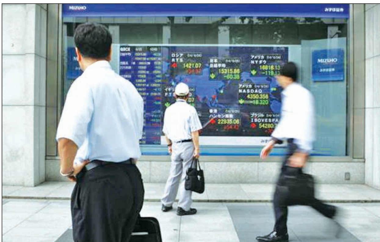
Pedestrians look at an electronic board showing the stock market indices of various countries outside a brokerage in Tokyo on 25 June, 2014.

Samsung Electronics Co Ltd (005930.KS) said its operating profit probably fell 24.5 percent in April-June to 7.2 trillion won ($7.12 billion), under the 8.3 trillion mean estimate from 38 analysts polled by Thomson Reuters. Its shares, however, still managed to bounce 0.6 percent, perhaps because