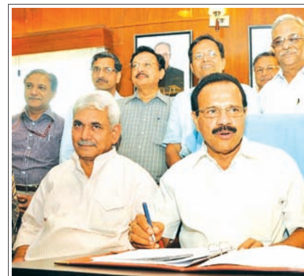
India's Railway Minister D V Sadanand Gowda (R, front) gives a final touch to the rail budget 2014-15 on the eve of its presentation at Parliament House in New Delhi, India, on 7 July, 2014.