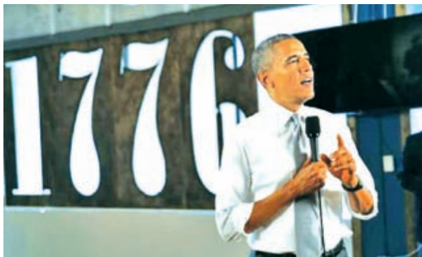
US President Barack Obama

WASHINGTON, 8 July — President Barack Obama and French President Francois Hollande decided on Monday that Europe should impose further costs on Russia if Moscow does not immediately take steps to de-escalate tensions in eastern Ukraine, the White House said. The two leaders spoke by phone.