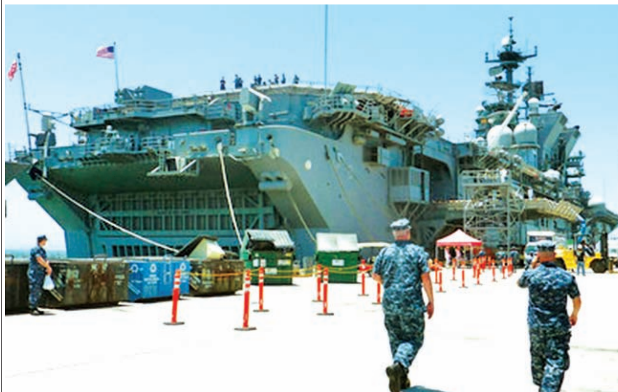
Photo shows USS Makin Island, an amphibious assault ship of the US Navy, at a Navy facility in San Diego, on 7 July, 2014.