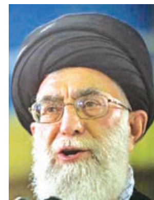
Iran's Supreme Leader Ayatollah Ali Khamenei

DUBAI, 8 July — Iran's supreme leader Ayatollah Ali Khamenei said the United States and Israel were playing "good cop, bad cop" to intimidate his country into making concessions on the nuclear dispute with the West.