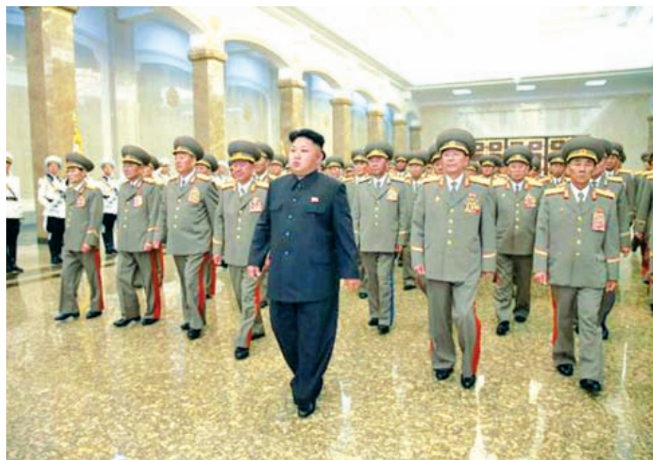
North Korean leader Kim Jong Un (C) visits the Kumsusan Palace of the Sun at midnight on Tuesday on the occasion of the 20th anniversary of the demise of President Kim Il Sung in this photo released by North Korea's Korean Central News Agency (KCNA) in Pyongyang on 8 July, 2014.

SEOUL, 8 July — North Korean leader Kim Jong Un limped on to the stage on the anniversary of his grandfather's death, footage broadcast by state media on Tuesday showed, in a rare display of weakness in a country where leaders are portrayed as semi-divine.