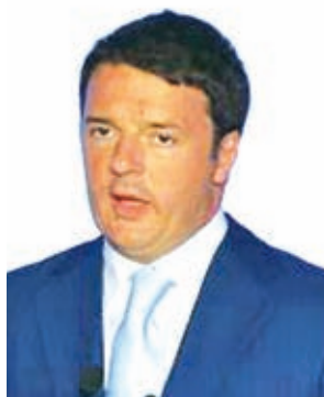
Italian Prime Minister Matteo Renzi

One of the M5S's most prominent members, vice president of the chamber