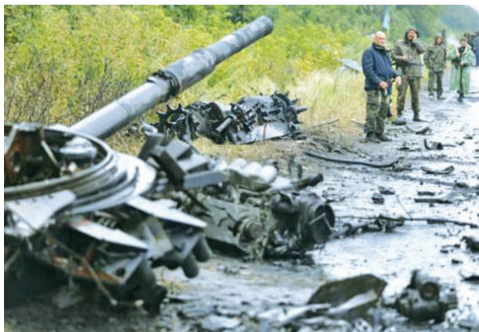
Ukrainian troops stand near destroyed military vehicles just outside the eastern Ukrainian town of Slaviansk on 7 July, 2014.

DONETSK, (Ukraine) 8 July — Pro-Russian rebels erected new barricades on the streets of Donetsk on Monday, preparing to make a stand in the city of a million people after losing their bastion in the town of Slaviansk in the worst defeat of their three-month uprising. Occasional bursts of gunfire could be heard in the distance from the centre of Donetsk, where residents said they were living in fear of a potential battle between government forces and the separatist gunmen now out in force.