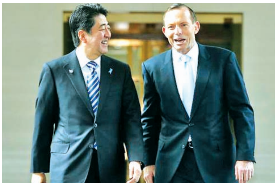
Japan's Prime Minister Shinzo Abe (L) and his Australian counterpart Tony Abbott depart the House of Representatives after Abe's address to a joint sitting at Parliament House in Canberra on 8 July, 2014.

"Today I stand in front of you, who represent the people of Australia, and state solemnly that now Japan and Australia will finally use our relationship of trust," Abe told a joint session, the first such speech by a Japanese