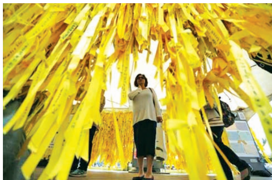
A woman reads messages on yellow ribbons dedicated to dead and missing passengers of the sunken ferry Sewol, at Seoul City Hall Plaza in Seoul on 19 May, 2014.

"Do not end up forever lost in the nether world after being torn to pieces by the children who wait for