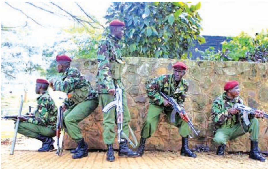
Policemen from the General Service Unit (GSU) take cover from stone throwing youths during the "Saba Saba Day" rally at the Uhuru park grounds in the capital Nairobi on 7 July, 2014.

Somali Islamist group al Shabaab said it carried out those and other attacks, vowing to drive Kenyan and other African Union forces out of Somalia. The government has blamed local politicians instead, drawing angry denials from the opposition. "Time for talks is over," opposition leader and veteran politi-