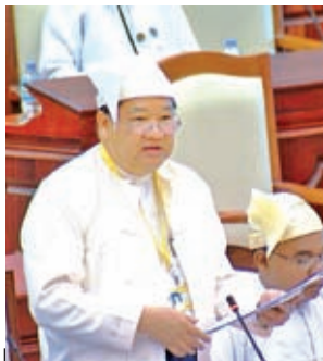
Union Minister for Health Dr Pe Thet Khin replies to question at Lower House session.

NAY PYI TAW, 8 July— Union Minister for Health Dr Pe Thet Khin said on Tuesday that more X-ray machines are needed for the huge number of patients.