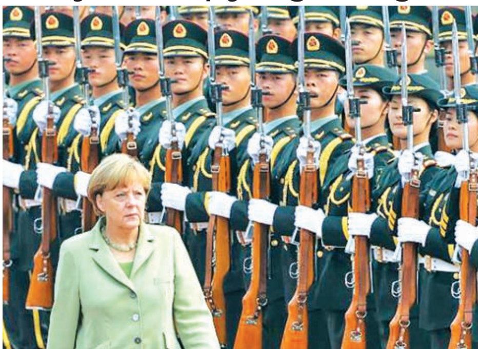
Germany's Chancellor Angela Merkel reviews an honour guard during a welcoming ceremony outside the Great Hall of the People in Beijing on 7 July, 2014.

“If the allegations are true, it would be for me a clear contradiction as to what I consider to be trusting cooperation between