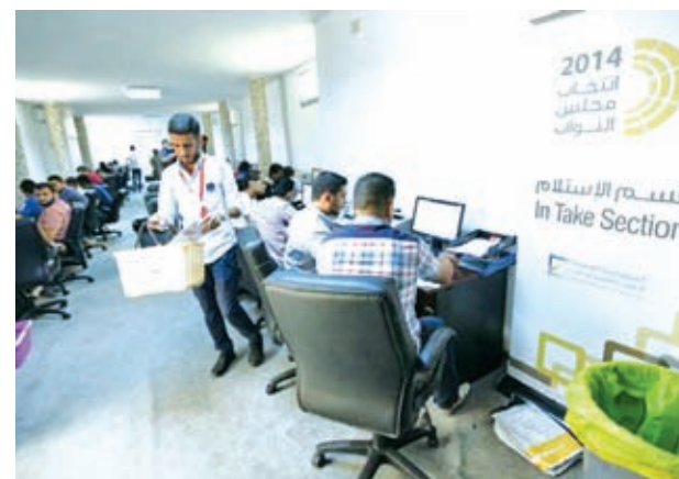
Election officials work in the operations rooms of the High National Elections Commission after elections yesterday in Tripoli, on 26 June, 2014.

TRIPOLI, 7 July — Libya will announce results of last month's parliamentary elections on 20 July, the head of the elections commission said on Sunday, pushing back the results another week.