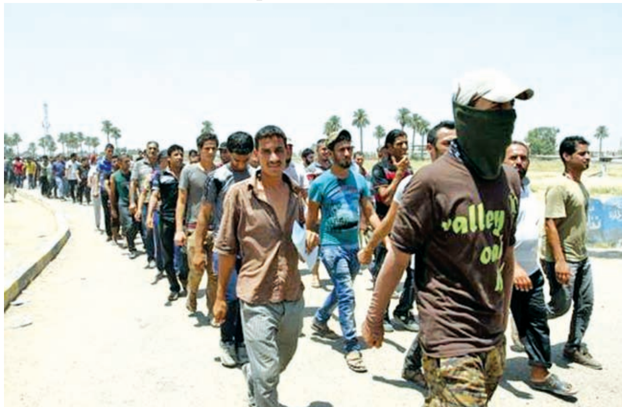
Shi'ite volunteers from Hezbollah Iraq, who have joined the Iraqi army to fight against militants of the Islamic State, formerly known as the Islamic State in Iraq and the Levant (ISIL), gather together in Baghdad, on 6 July, 2014.

"I remain convinced that the brothers in the State of Law coalition must pres-