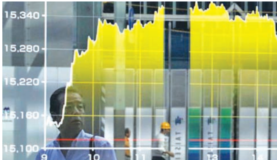
A pedestrian is reflected on an electronic board showing the graph of the recent fluctuations of Japan's Nikkei average outside a brokerage in Tokyo on 19 June, 2014.

The two-year US yield stood at 0.528 percent on Monday, after having risen to 0.532 percent on Thursday.— Reuters