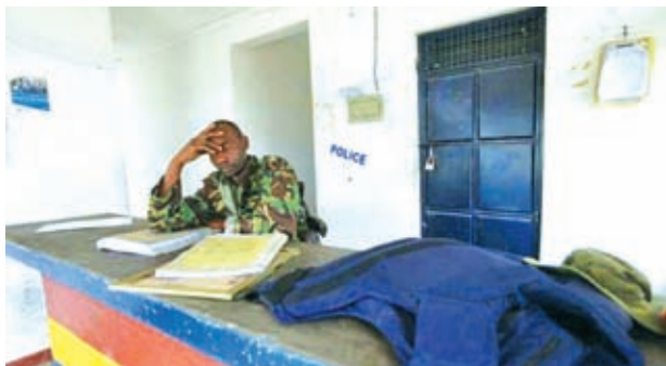
A policeman sits near the scene where his colleague was killed during an attack by gunmen who raided Gamba police station, on 6 July, 2014.

Another was further south in the Gamba area, where 20 died. “They went