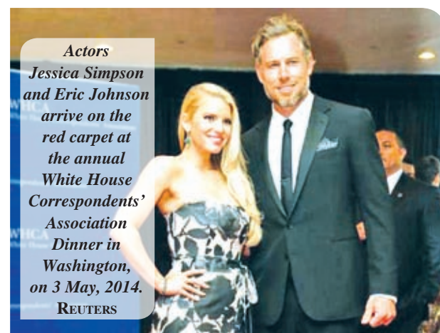
Actors Jessica Simpson and Eric Johnson arrive on the red carpet at the annual White House Correspondents' Association Dinner in Washington, on 3 May, 2014.

Last month, Rihanna was named the Most Desirable Woman at the 2014 Guys Choice Awards. She also recently made headlines for the custom sheer Adam Selman gown she wore at the 2014 CFDA Fashion Awards.