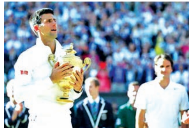
Novak Djokovic of Serbia holds the winner's trophy after defeating Roger Federer (R) of Switzerland in their men's singles tennis match on Centre Court at the Wimbledon Tennis Championships in London on 6 July, 2014.

The technology that had left Federer seething in the 2007 final, when he yelled "God it's killing me", came to his rescue at match point down by ruling the Swiss's serve had in fact kissed the line after the line judge had called it out. What should have led to a second serve from Federer had now turned into an ace, producing another twist in the gripping drama that had 15,000 people sitting on the edge of their seats and Djokovic tied up in knots.