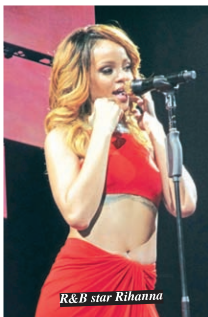
R&amp;B star Rihanna