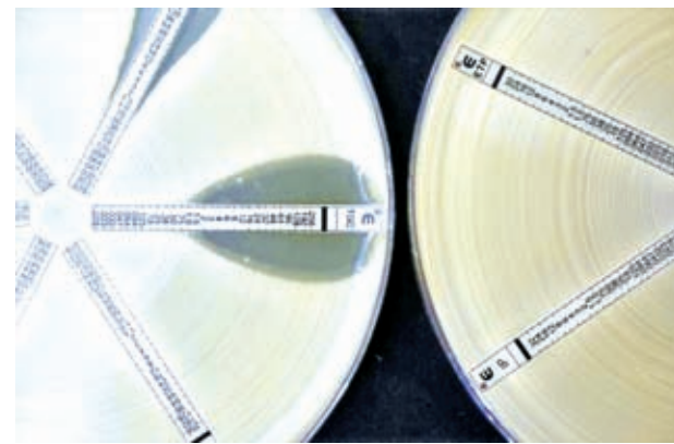
Two plates which were coated with an antibiotic-resistant bacteria called Klebsiella with a mutation called NDM 1 and then exposed to various antibiotics are seen at the Health Protection Agency in north London in this 9 March, 2011 file photo.

Just over a year ago, Johnson & Johnson won approval for the first drug in 40 years that provides a new way to treat TB, yet sales of Sirturo are forecast by analysts to total just $75 million this year.