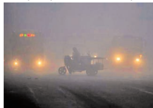
A tricycle travels past a crossroad on a hazy day in Hefei, Anhui Province on 30 March, 2014.