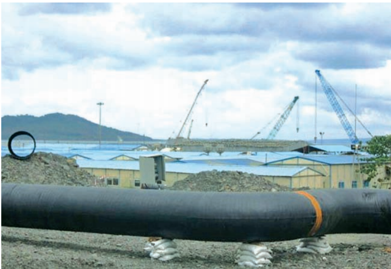
A natural gas pipeline laid in Kyaukpyu Special Economic Zone in Rakhine State of western Myanmar.