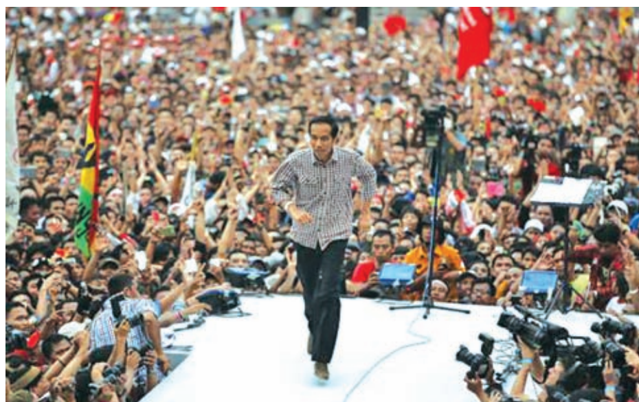
Indonesian presidential candidate Joko "Jokowi" Widodo runs on the stage after delivering a speech in front of his supporters at Gelora Bung Karno stadium in Jakarta on 5 July, 2014.

province of West Java, an area the size of the Netherlands but with a population nearly three times larger.