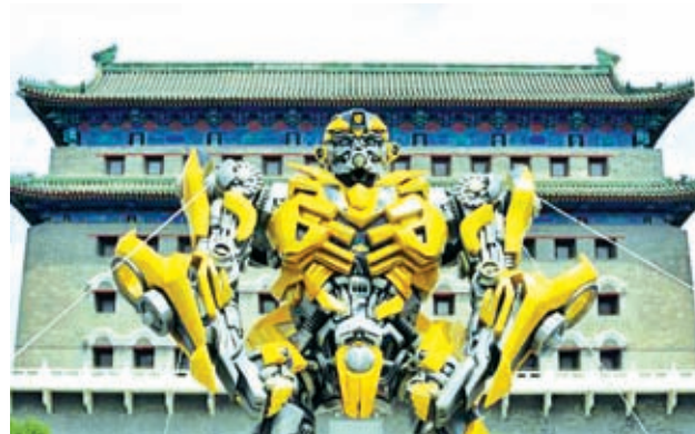
A model of the Transformers character Bumblebee is displayed in front of Qianmen Gate in central Beijing, on 20 June, 2014.

When they're not playing computer games, Helena says her family love to get creative together, with her partner Tim Burton being a gifted artist.