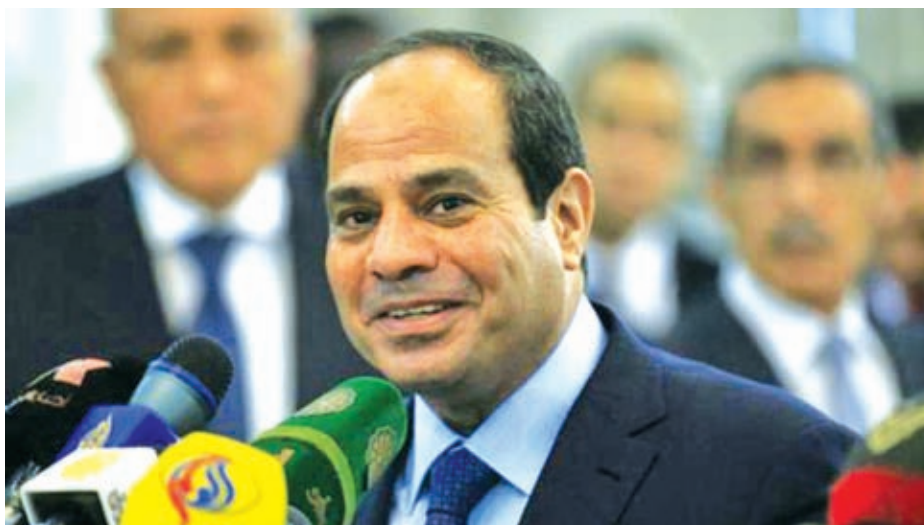
Egypt's President Abdel Fattah al-Sisi speaks during joint news conference with Sudan's President Omar al-Bashir (not seen) in Khartoum on 27 June, 2014.

“I wished they were deported right after they were arrested instead of getting put on trial,” Sisi added during a meeting with local journalists on Sunday. Sisi's initial reaction to the ruling was that he would not interfere in court ver-