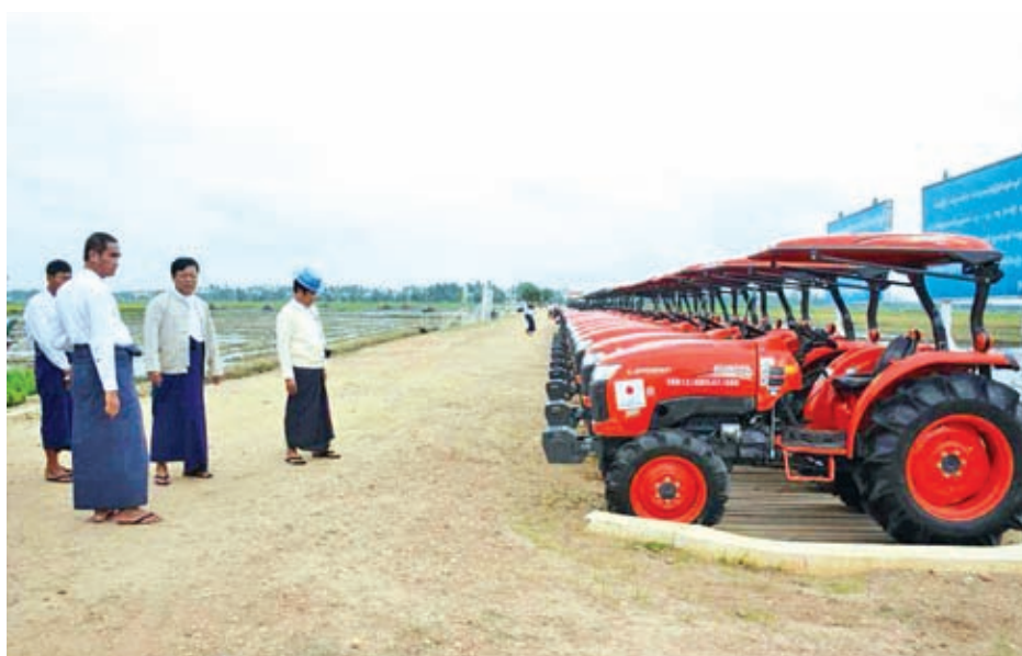
Union Minister for Agriculture and Irrigation U Myint Hlaing views delivery of tractors at 3,000-acre mechanized farm near Nay Pyi Taw Hotel Zone.

The Union minister visited the 120-ton rice processing plant and 220-ton rice mill construction project in Alyinlo Village of Pynmana Township and inspected progress of construction tasks. He viewed construction of the concrete road, installation of