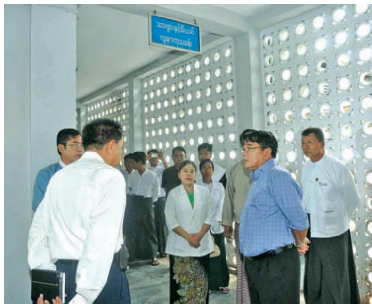
Deputy Minister for Health Dr Than Aung views round patient awards at Yamethin District General Hospital.