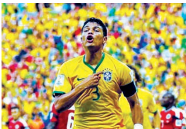
Brazil's Thiago Silva celebrates after scoring against Colombia during their 2014 World Cup quarter-finals at the Castelao arena in Fortaleza on 4 July, 2014.

The central defender was cautioned for needlessly blocking keeper David Ospina as he was taking a kick and FIFA said they