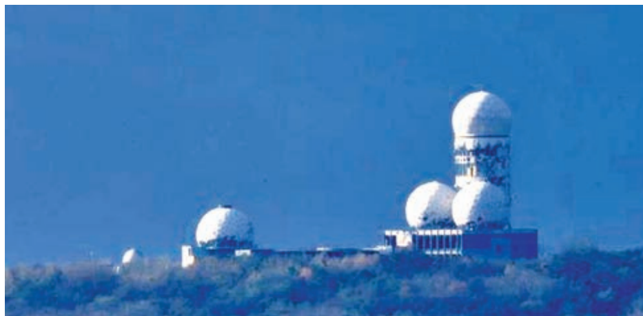
Antennas of the former National Security Agency (NSA) listening station are seen at the Teufelsberg hill, or Devil's Mountain in Berlin, on 5 Nov, 2013.