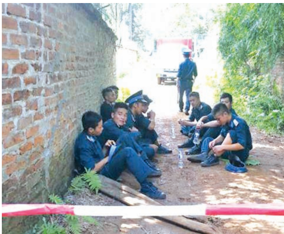
Airforce personnel guard the area outside the site of a military helicopter crash, outside Hanoi on 7 July, 2014.

HANOI, 7 July — A military helicopter crashed into a residential area on the fringes of Vietnam's capital Hanoi on Monday, killing more than 10