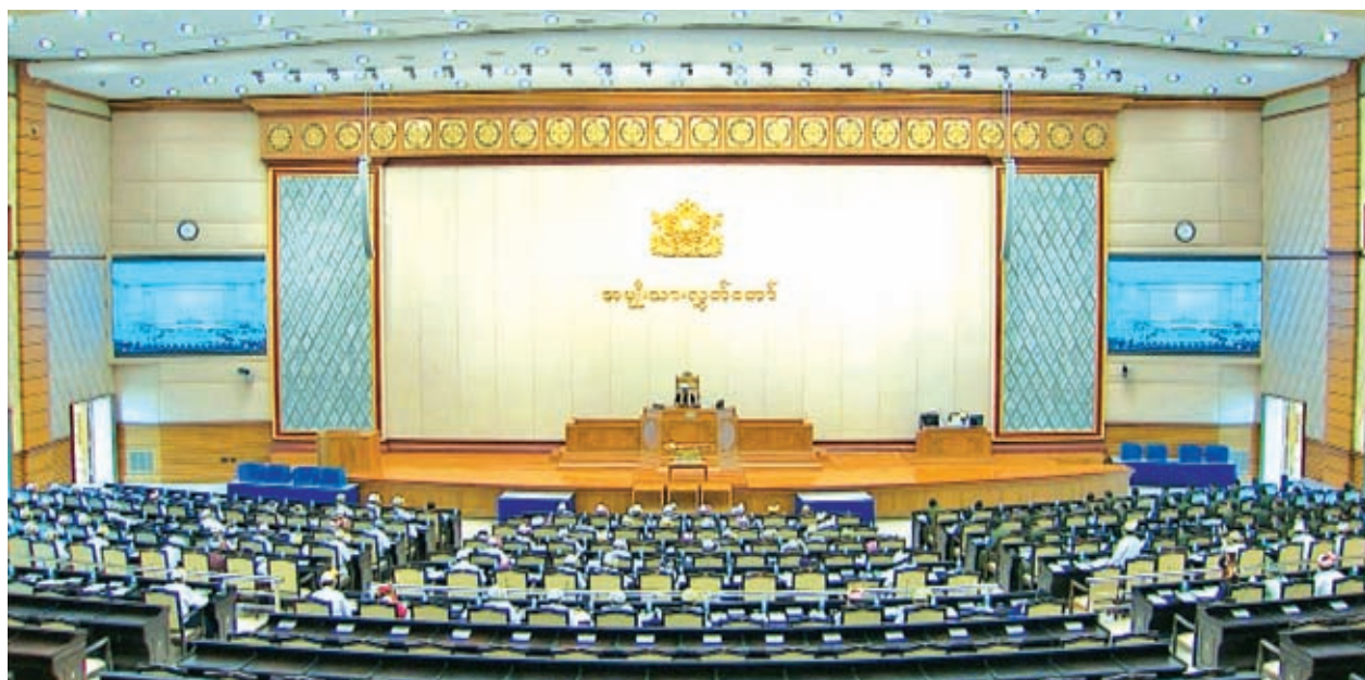
Representatives holding discussions at Upper House in Nay Pyi Taw.