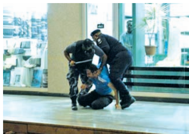
A shopkeeper watches from inside his shop as Kuwaiti Special Forces detain a Kuwaiti protester in Kuwait City on 6 July, 2014.

Al-Barrak has been detained for questioning over allegations that he insulted the judiciary. A court hearing for the former lawmak-