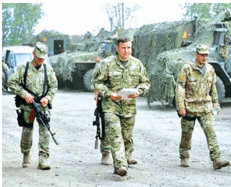
Newly-appointed Ukrainian Defence Minister Valery Heletey (C) walks with troops at a temporary base near the city of Sloviansk on 6 July, 2014.

“Everything is different now. Tonight is the first night with no shelling,” said Mikhail Martynenko, 58, a guard at a local market near Sloviansk. “People are in a better mood and there are more people on the streets. Everyone was afraid. They had no idea when another mortar would come flying,” he said. Under rebel commander Igor Strelkov, a Muscovite declared defence