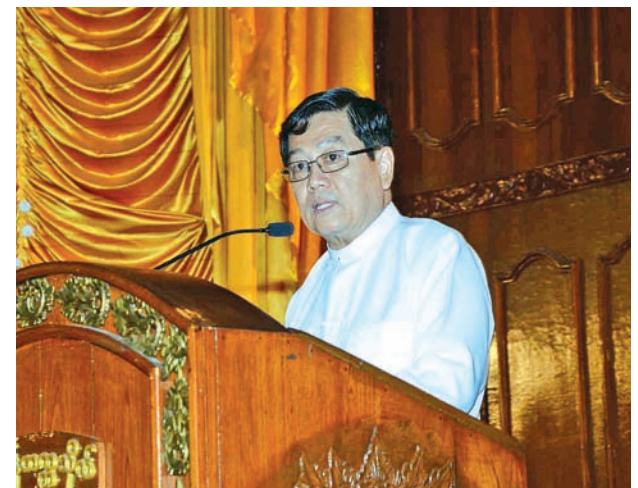
Union Minister U Tin Naing Thein addresses seminar aimed at promoting the basic education sector.

YANGON, 6 July—The Ministry of Education conducted a seminar aimed at promoting the basic education sector at the Diamond Jubilee Hall of Yangon University here on Sunday, sources said.