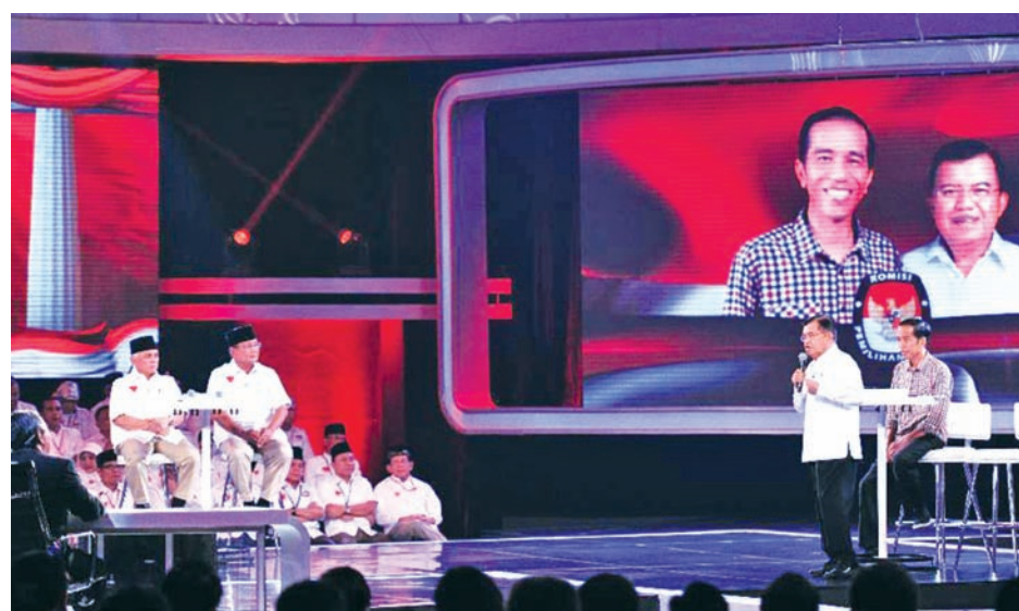
Indonesian presidential candidates and their running mates attend the presidential debate in Jakarta, Indonesia, on 5 July, 2014.

Food, energy, and the environment were the topics under discussion in the debate, and both presidential candidates looked to win over undecided voters, which one survey estimated at around 20 percent.