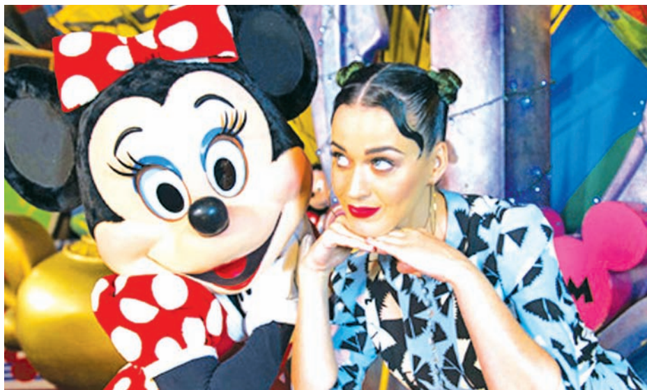
Katy Perry says many of her stage costumes reflect her taste from when she was a teenager.

"When I'm on tour, the exercise routine is vigorous. I'll work out every day, and I don't have time for a full hour of exercise, I'll run on the treadmill for 30 minutes. I actually love having that uninterrupted time to listen to new music or my favourite albums, and it feels great to get the blood circulating, too," she said.