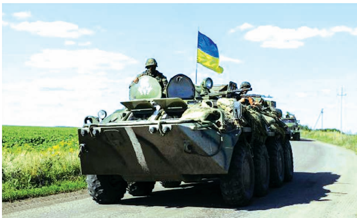
Ukrainian soldiers drive a military vehicle with a Ukrainian flag at a checkpoint near Slaviansk in eastern Ukraine on 3 July, 2014.

Newly-appointed Defence Minister Valery Heletey appeared confident in reporting to Ukrainian President Petro Poroshenko.