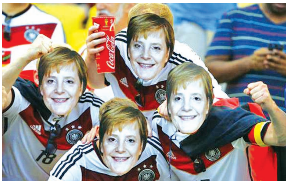
Fans of Germany wear masks of German Chancellor Angela Merkel as they pose before the 2014 World Cup quarter-finals soccer match between Germany and France at the Maracana stadium in Rio de Janeiro on 4 July, 2014.

BERLIN, 6 July — A German intelligence chief warned, as Chancellor Angela Merkel embarks on her latest visit to China, that some firms in Europe's biggest economy face a growing threat from industrial espionage by Chinese