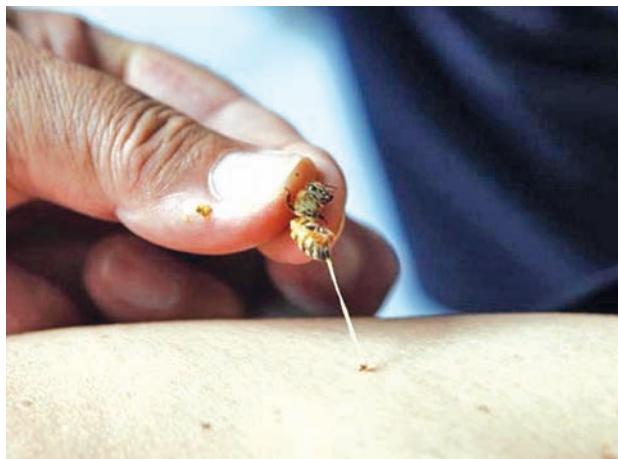
A bee sting therapist holds a bee to sting the arm of a patient in a bee farm in Silang, Cavite south of Manila on 6 June, 2012.

NEW YORK, 6 July — Most adults have a tough time telling hornets, wasps and bees apart, which could spell trouble if a sting causes a severe allergic reaction, according to a new study.