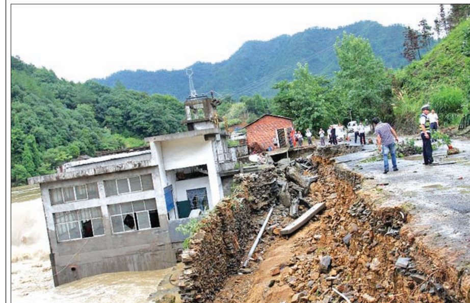
A road is destroyed by flood water in Xiushui County of Jiujiang City, east China's Jiangxi Province, on 4 July, 2014. Heavy rainfall hit parts of Jiangxi in last two days.

"The suicide car bomb was targeting the parliament entrance but it was fired on from all sides as it