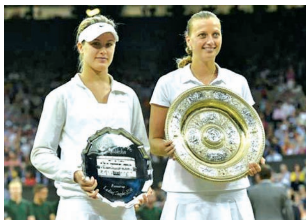
Eugenie Bouchard (L) of Canada holds the runner up trophy after being defeated by Petra Kvitova (R) of Czech Republic, holding the winner's trophy, the Venus Rosewater Dish, at their women's singles final tennis match at the Wimbledon Tennis Championships in London on 5 July, 2014.

The final point encapsulated the contest — a