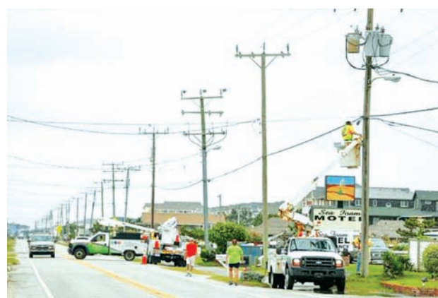
A worker from the local cable company works on the utility lines after Hurricane Arthur in Nags Head, North Carolina on 4 July, 2014.

BOSTON, 6 July — Arthur weakened from hurricane force on Saturday and pelted parts of southeast Canada with heavy rain and strong winds, as the storm swept away from New England. Arthur weakened to a tropical storm on Saturday morning after having reached landfall on North Carolina's Outer Banks late on Thursday as a Category 2 hurricane, snarling plans for tourists at the start of the Fourth of July holiday weekend.