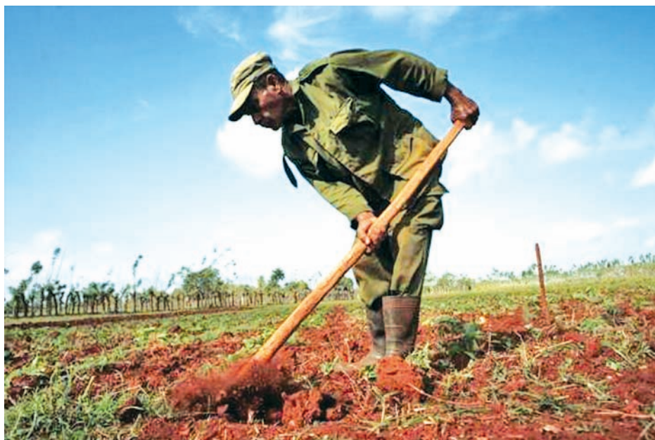
A farmer works the land in La Lisa on the outskirts of Havana on 28 March, 2014.

The reforms have created a new class of wealthy Cubans, but a large majority still lives on $20 a month and overall Cuban productivity has stagnated. Low