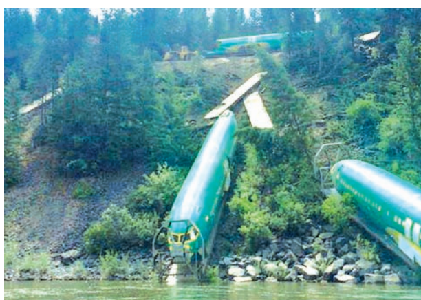
Three Boeing 737 fuselages lie on an embankment on the Clark Fork River after a BNSF Railway Co train derailed on Thursday near Rivulet, Montana in this picture taken on 4 July, 2014.

Spirit Aerosystems, based in Wichita, Kansas, builds all of Boeing's 737 fuselages and Boeing currently produces 42 fin-