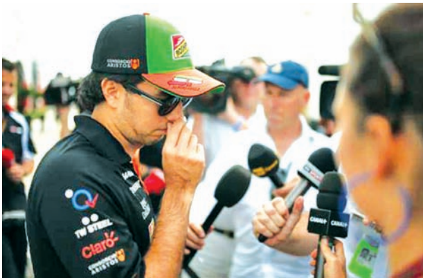
Force India Formula One driver Sergio Perez of Mexico talks to members of the media ahead of the British Grand Prix at the Silverstone Race Circuit, central England, on 3 July, 2014.

SILVERSTONE, (England), 6 July — Mexican Formula One driver Sergio Perez has apologized to Williams test driver Susie Wolff after a joke about women racers backfired on him. Wolff, who in Friday practice with Williams at the British Grand Prix became the first woman in 22 years to take part in a Formula One weekend, made clear there were no hard feelings.