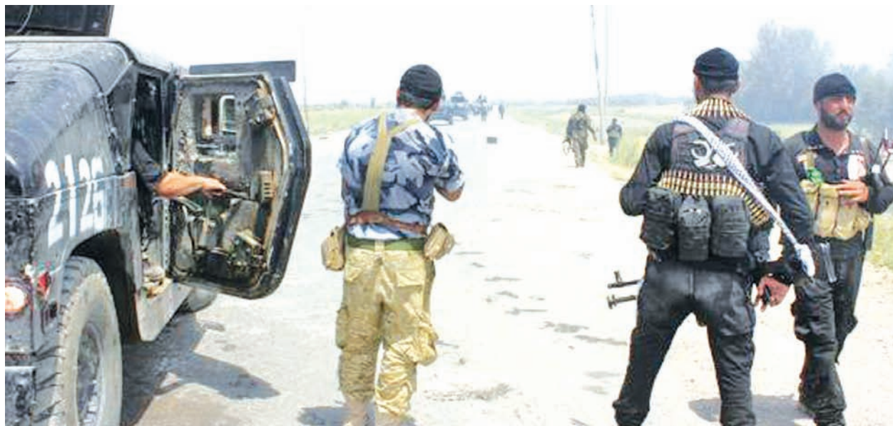
Iraqi security forces and armed volunteers move with military vehicles during clashes with militants of the Islamic State, formerly known as the Islamic State in Iraq and the Levant (ISIL), in the town of Dalli Abbas in Diyala Province on 3 July, 2014.

DUBAI, 6 July—A man purported to be the reclusive leader of the militant Islamic State has made what would be his first public appearance at a mosque in the centre of Iraq's second city, Mosul, according to a video recording posted on the Internet on Saturday.