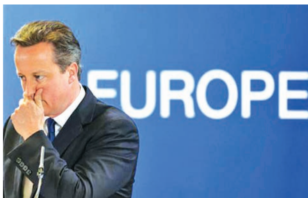
Britain’s Prime Minister David Cameron holds a news conference during an European Union leaders summit in Brussels on 27 June, 2014.

Member states differ on how far to go in