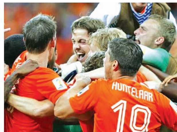
Goalkeeper Tim Krul (C) of the Netherlands celebrates with team mates after winning their penalty shootout in their 2014 World Cup quarter-finals at the Fonte Nova arena in Salvador on 5 July, 2014.

Higuain grazed the crossbar with another powerful strike in the second half while Lionel Messi, who teased and tormented the Belgians with his wizardry, blasted the ball straight at Belgium goalkeeper Thibaut Courtois when he broke free in stoppage time. Argentina, World Cup champions in 1978 and 1986, spent much of the game defending as a frustrated Belgium struggled to cut out clear chances though Kevin Mirallas and Marouane Fellaini both went close with headers.