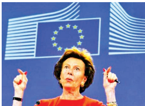
Vice-President of the European Commission Neelie Kroes

According to the EU, the European telecom industry, representing more than 1.7 million direct and indirect jobs in Europe, has been historically in the forefront of mobile technology. — Xinhua