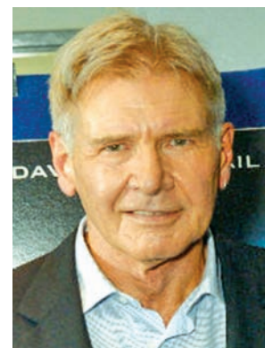
Harrison Ford's representative has said he was doing well.