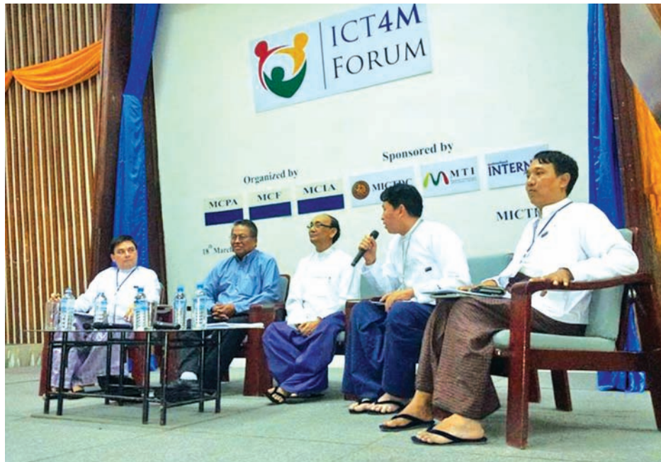
MCF President U Khun Oo speaking at the wrap-up session of the ICT for Myanmar Forum 2014.

ICT infrastructure in Myanmar include Fiber link between major cities as national backbone; cross border Fiber link between Myanmar-India, Myanmar-China, and Myanmar-Thailand; Sea-Me-We (3) Cable and Satellite for international link.