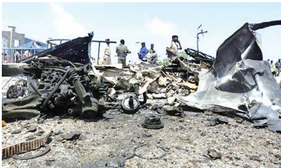
Somali government soldiers gather near the wreckage after a suicide car explosion near the Somali parliament building in Mogadishu on 5 July, 2014.

MOGADISHU, 6 July — Five soldiers and police were killed in the Somali capital on Saturday and a dozen others were wounded in bomb and gun attacks by Islamist militants, police and witnesses said.