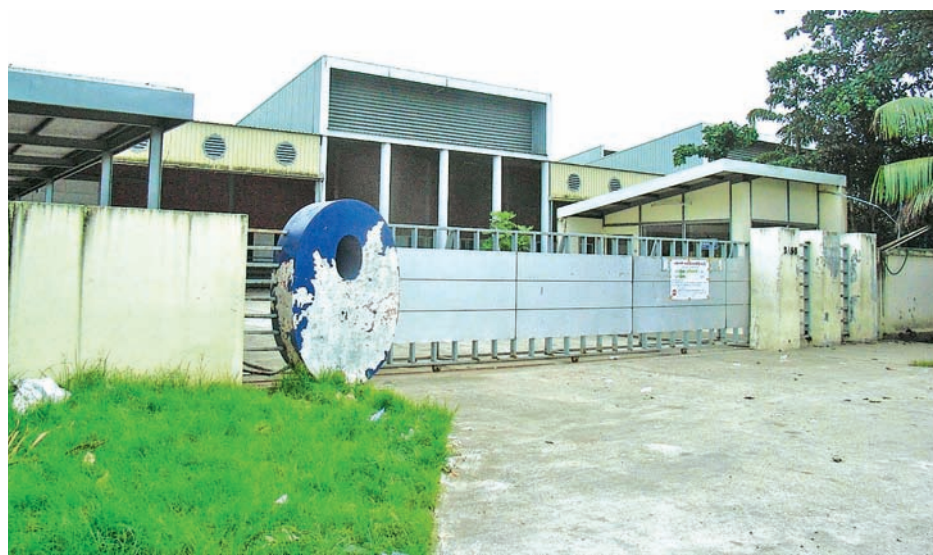
The closure of Master Sports factory in Hlinethaya Industrial Zone has left 755 workers jobless.