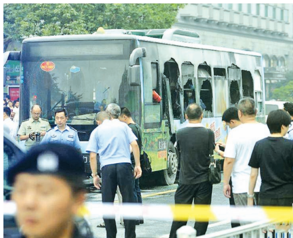
Police cordon off the site where a bus was in flames in Hangzhou, capital of east China's Zhejiang Province on 5 July, 2014. Thirty-two injured people were sent to hospitals after a bus caught fire on Saturday afternoon in downtown Hangzhou. No death case has been reported. The cause of the blaze is being investigated.

Police also ascertained through the footage that the man, wearing shorts and slippers, got on the bus at the terminal station of Lingyin Temple at 4:09 pm. Police are still