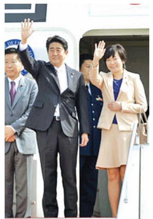
Japan’s Prime Minister Shinzo Abe (C) and his wife Akie wave before boarding a plane at Haneda airport in Tokyo on 6 July, 2014.

“This trip is intended to demonstrate a new type of proactive pacifism. I want to strengthen cooperation not only through diplomatic ties but also defence and security ties,” he told reporters just prior to his departure from Tokyo’s Haneda airport. In Canberra on Tuesday, Abe will become the first Japanese prime minister to deliver a speech at the Australian parliament, according to the Japanese government. He is scheduled to return home on Saturday.—Kyodo News