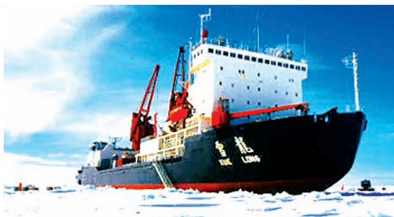
China's icebreaker “Xuelong” (Snow Dragon)

BEIJING, 6 July — China's icebreaker “Xuelong” (Snow Dragon) is all set to leave its Shanghai base next Friday to embark on a sixth expedition to the North Pole.