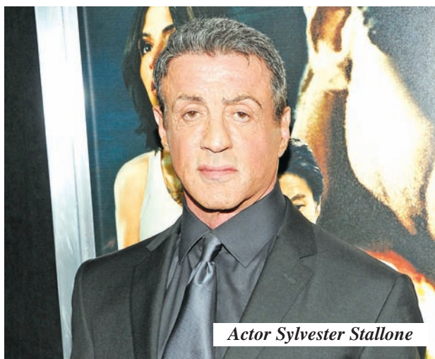
Actor Sylvester Stallone