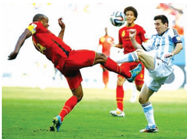
Belgium's Vincent Kompany fights for the ball with Argentina's Lionel Messi during their 2014 World Cup quarter-finals at the Brasilia national stadium in Brasilia on 5 July, 2014.