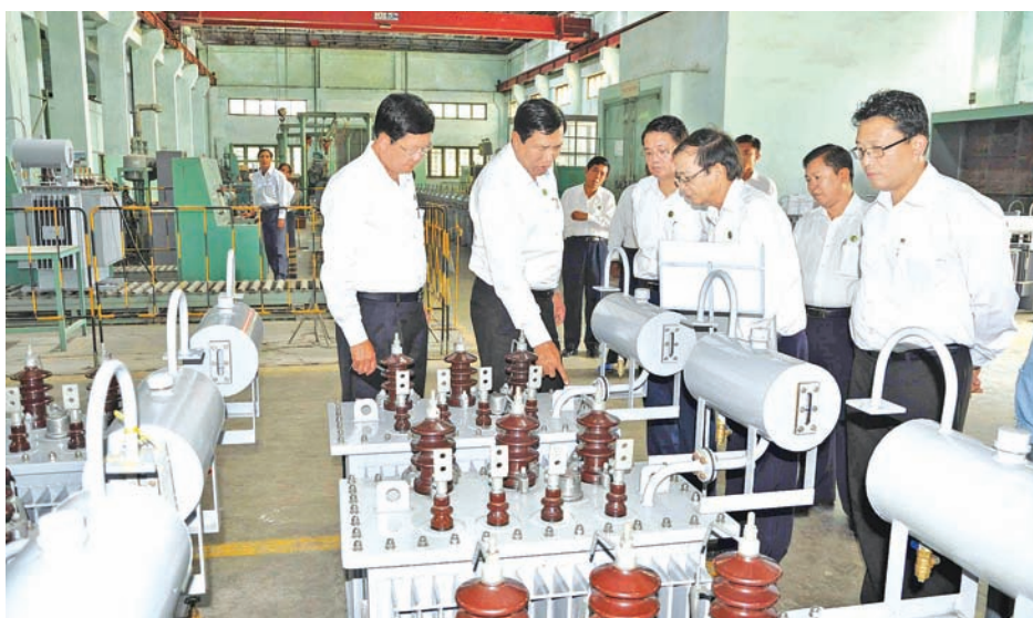
Union Minister U Maung Myint on inspection tour of No 23 Heavy Industry (Nyaungchaydaik).—MNA

NAY PYI TAW, 6 July—Addressing the aftermath of the riots in Mandalay, members of the Interfaith Organization met at the Sky Star Hotel in Tamway Township in Yangon and issued an eight-page statement on Friday.