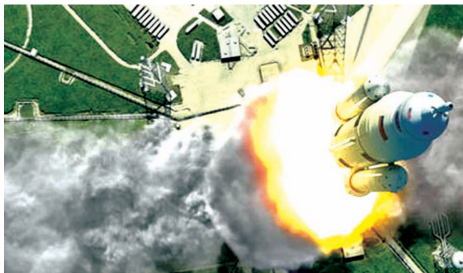
Space Launch System, a NASA rocket designed by Boeing that will be intended for deep-space exploration.