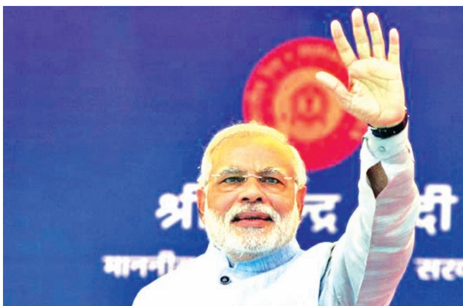
Indian Prime Minister Narendra Modi waves to a crowd at a gathering after inaugurating a train on a new stretch of railway to the town of Katra, northwest of Jammu on 4 July, 2014.

But his government has been plagued too by the economic ills that brought down its predecessor: weak growth and high inflation caused by spending too much and investing too