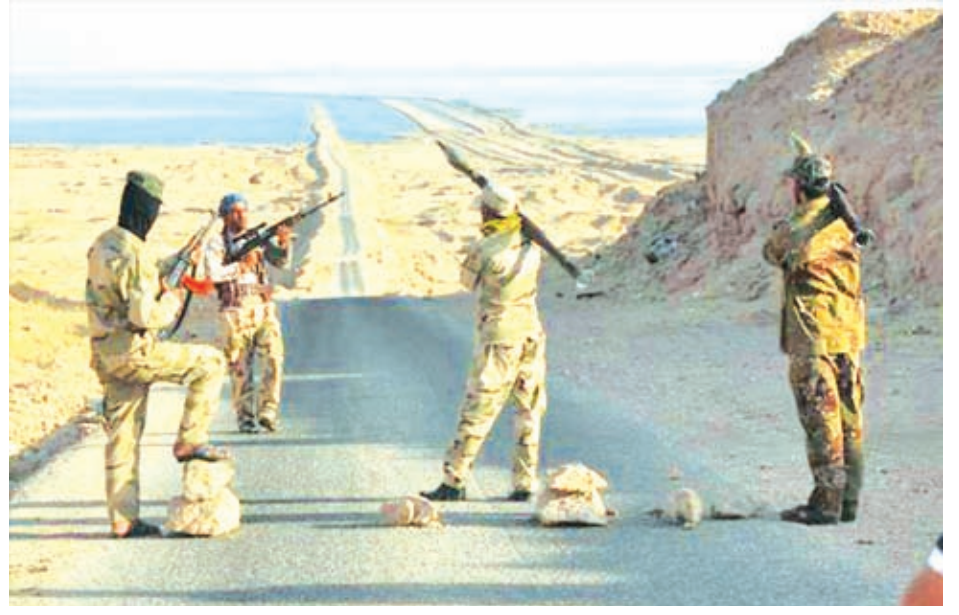
Shi'ite volunteers secure the area from predominantly Sunni militants from the Islamic State, previously called the Islamic State in Iraq and the Levant (ISIL), in the desert region between Kerbala and Najaf, south of Baghdad, on 3 July, 2014.

Iraqi army retook Saddam Hussein's home village overnight, a symbolic