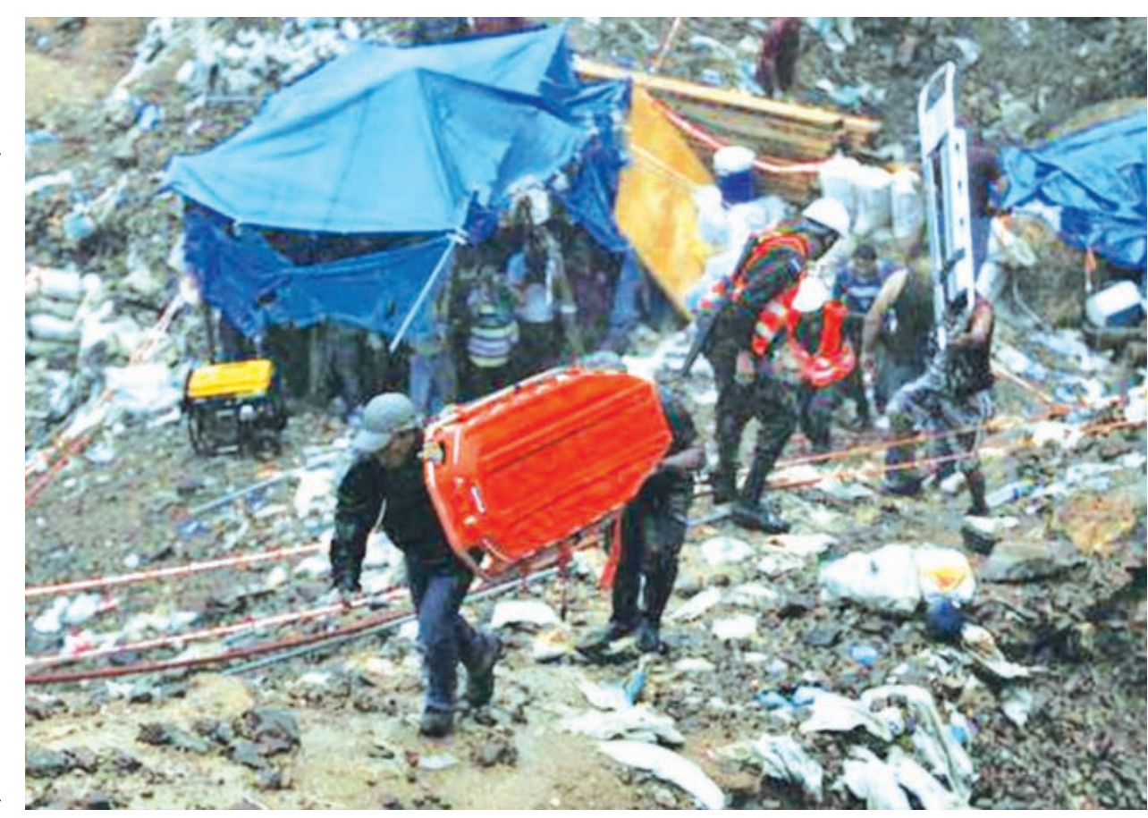
Miners carry stretchers as other take cover from rain in a makeshift tent at the site of a landslide at a gold mine in San Juan Arriba, outskirts of Tegucigalpa on 3 July, 2014.

The collapse occurred in a drought-stricken region of Honduras that had been a gold mining center for Spanish colonists. The rise in gold prices in recent years had spurred dozens of small mines to open in the area.—Reuters