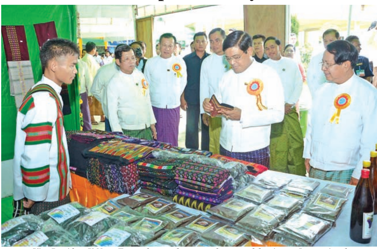
Vice President U Nyan Tun and party observe products at celebration on International Co-operative Day 2014.

NAY PYI TAW, 5 July—Vice President U Nyan Tun took part in celebration on International Co-operative Day 2014 held here on Saturday, with the theme of "Co-operative enterprises achieve sustainable development for all".