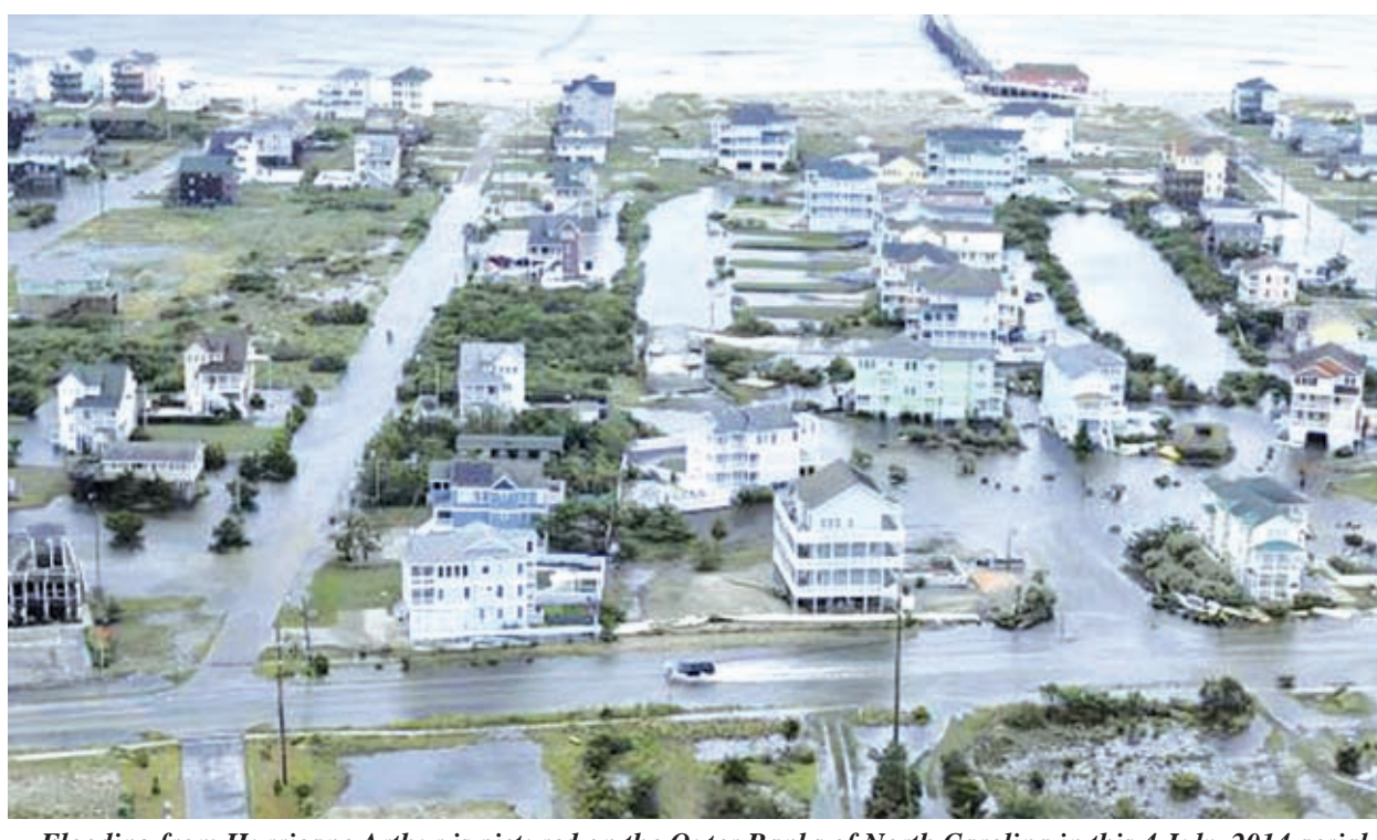
Flooding from Hurricane Arthur is pictured on the Outer Banks of North Carolina in this 4 July, 2014 aerial handout photo provided by the US Coast Guard. —REUTERS

"The storm is weakening as it moves over cold water," said Beven. "The