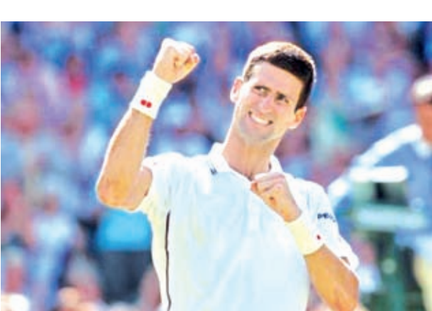
Novak Djokovic (SRB) celebrates recording match point in his match against Grigor Dimitrov (BUL) on day 11 of the 2014 Wimbledon Championships at the All England Lawn and Tennis Club.