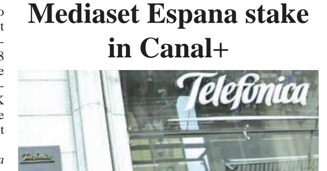
A man talks on a mobile phone as he walks past Spanish telecom group Telefonica flagship store in central Madrid on 8 Nov, 2013.

Madrid , 5 July — Telefonica (TEF.MC) said on Friday it had agreed to buy the 22 percent stake held by Mediaset Espana (TL5.MC) in pay-TV firm Distribuidora de Television (DTS), giving full ownership of the TV firm to the telecoms group.