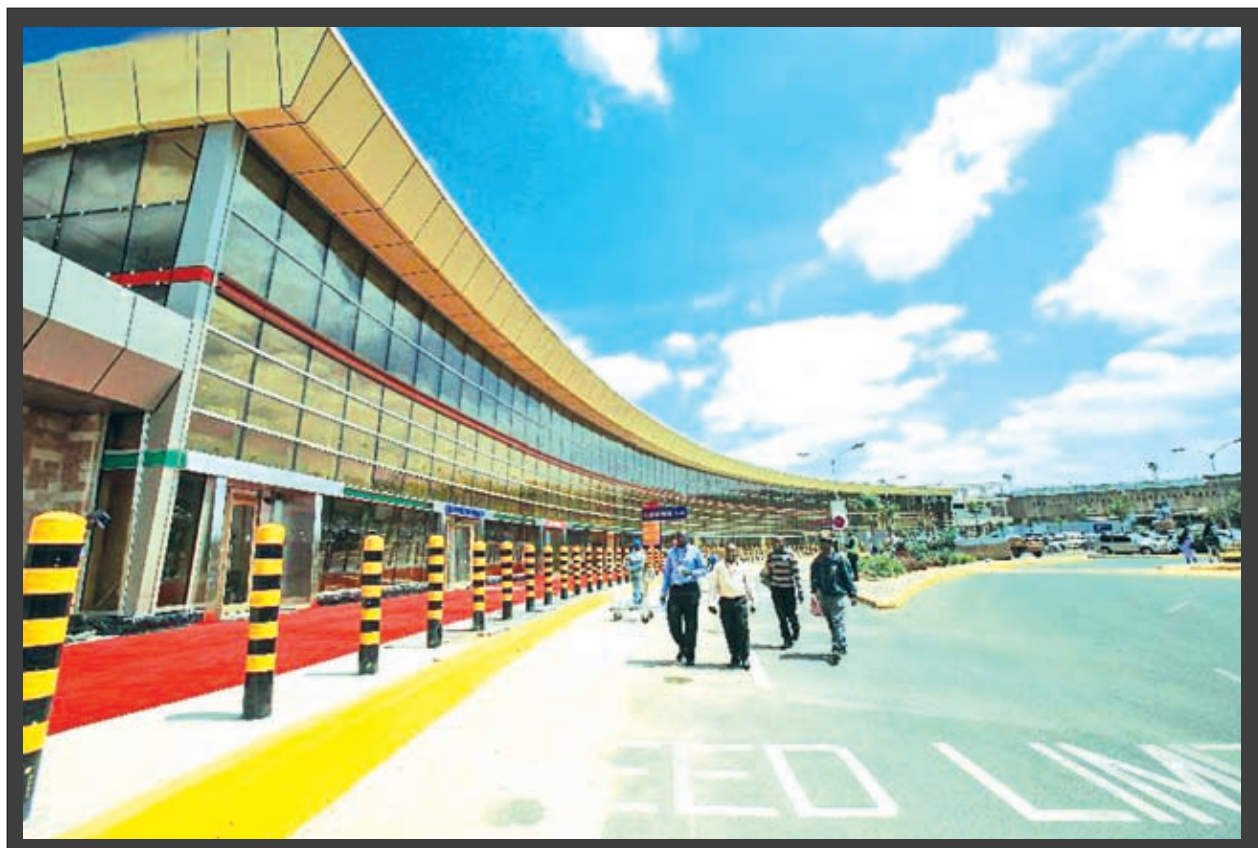
Photo taken on 4 July, 2014 shows the exterior scene of the new terminal of Jomo Kenyatta International Airport (JKIA) in Nairobi, capital of Kenya. The JKIA new terminal building, which was built by Aviation Industry Corporation of China (AVIC) International Holding Corporation, started a test on Friday. The building, with a construction area of 25,000 square meters, will start a three-week trial operation on 8 July.