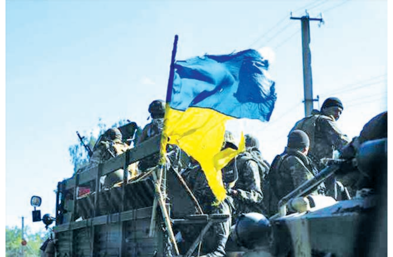
Ukrainian soldiers drive a military vehicle with a torn Ukrainian flag at a checkpoint near Slaviansk in eastern Ukraine on 3 July, 2014.

The statement on Poroshenko's website said he had informed European Union foreign policy chief Catherine Ashton that Kiev had proposed a time and a place for Saturday's talks. Separatist officials have suggested the venue could be a problem since rebel leaders could be subject to arrest by Ukrainian authorities if they move out of their strongholds.—Xinhua