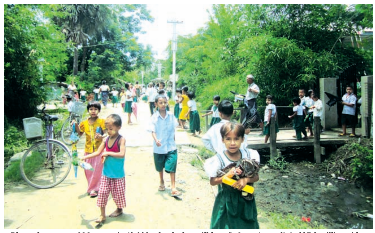
Photo shows one of Myanmar's 43,000 schools that will benefit from Australia's $27.8 million aid to help students get a quality education.