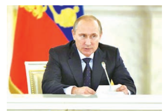
Russian President Vladimir Putin

"Vladimir Putin also highlighted that Russia and the United States, as countries carrying exceptional responsibility for safeguarding international stability and security, should cooperate not only in the interests of their own nations