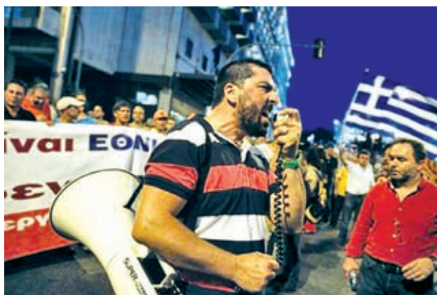
An employee of the Power Public Corporation (PPC) shouts slogans through a loudspeaker during a rally in Athens on 3 July, 2014.

ATHENS, 5 July — A Greek court ruled on Friday that a strike by electricity workers which caused brief power outages across the country was illegal, in a verdict that will bring relief to the government as the summer tourist season kicks off.