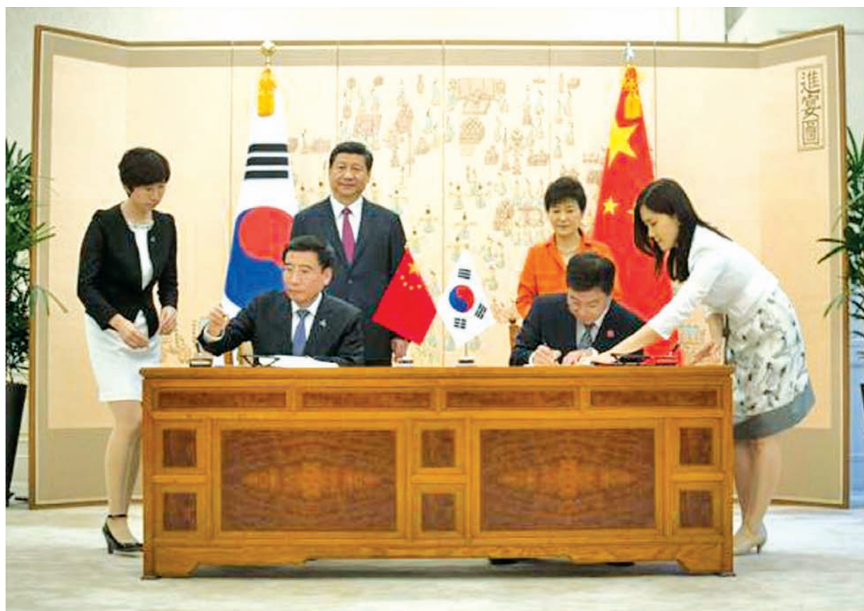
China's President Xi Jinping (back L) and his South Korean counterpart Park Geun-hye (back R) attend a signing ceremony after a summit meeting at the Blue House in Seoul on 3 July, 2014.

Western countries, led by the United States, have pressed China to exert more pressure on North Korea to halt the nuclear and missile tests which have prompted the United Nations to impose sanctions.