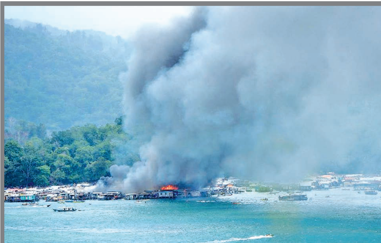
Heavy smoke rises at the sea view villas where a fire broke out at an island in Kota Kinabalu, the capital of Malaysia’s state of Sabah, on 3 July, 2014. Some 50 cabins at the sea view villas were damaged in the fire. —XINHUA