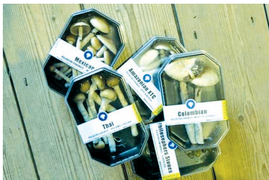
Boxes containing magic mushrooms are displayed at a coffee and smart shop in Rotterdam on 28 Nov, 2008.

The volunteers were scanned under the influence of psilocybin and when they had been in-