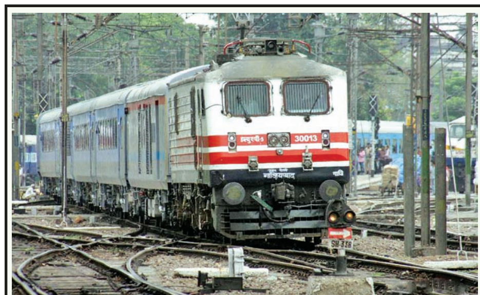
A high speed train sets off during a trial run from New Delhi to Agra, India, on 3 July, 2014. The "semi-bullet" train sets an Indian national speed record of 160 km/h in its trial run.

The release came just three days after Cambodian King Norodom Sihamoni granted a royal pardon to a convicted Thai yellow-shirt activist Veera Somkwamkid during a visit from acting Thai Foreign Minister Sihasak Phuangketkeow. During a meeting with Sihasak at Phnom Penh's Peace Palace on Tuesday, Cambodian Prime Minister Hun Sen requested the Thai junta to consider the release of the 14 workers.—Xinhua