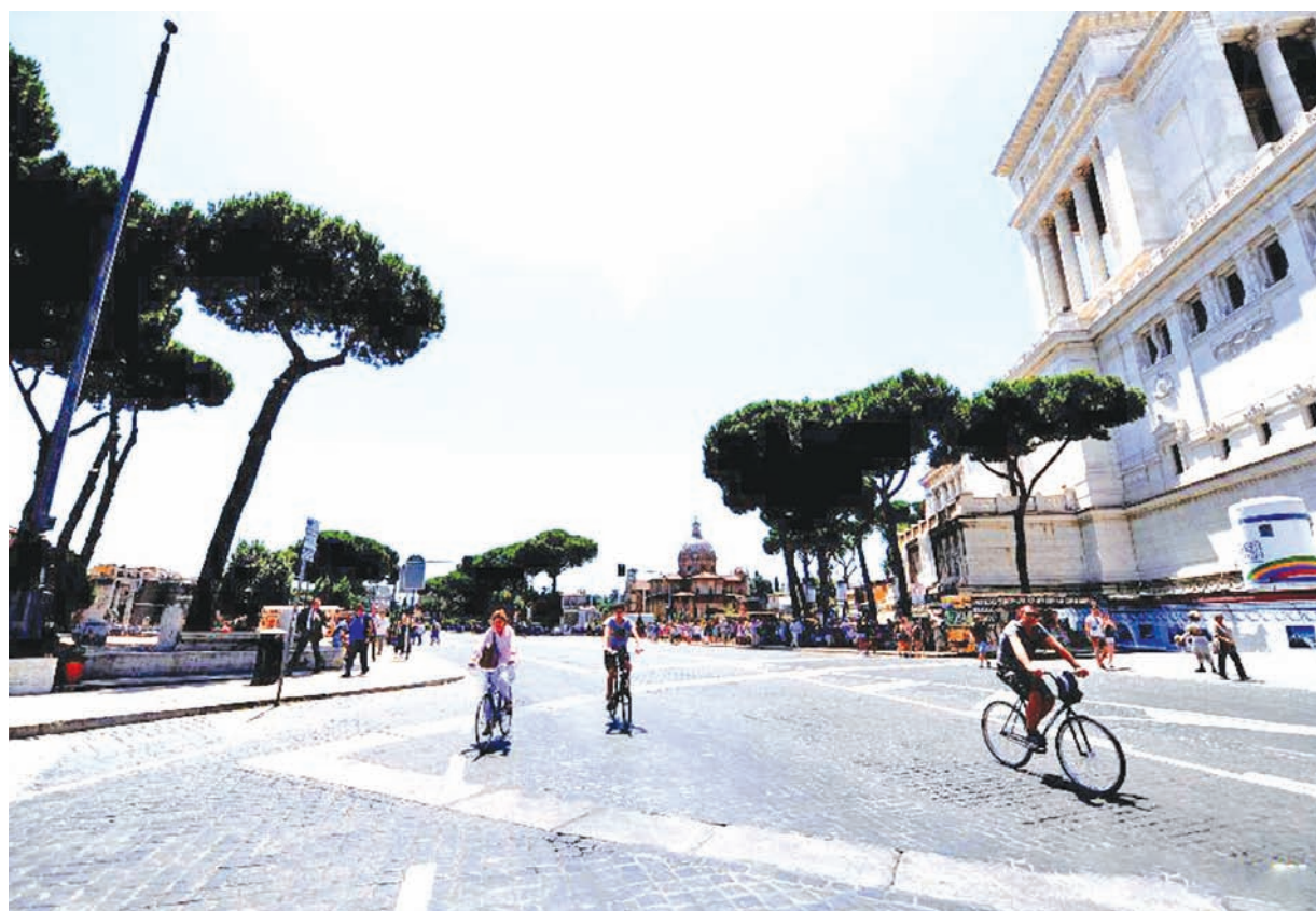
Cyclers ride on Via dei Fori Imperiali, a pedestrian road in Rome, Italy, on 3 July, 2014. In a bid to protect its ancient glories from modern perils, Rome will ban motorized vehicles from the area around the iconic Spanish Steps, Rome's mayor Ignazio Marino announced on Tuesday. The bike enthusiast mayor wants Rome to become a more pedestrian-friendly city.