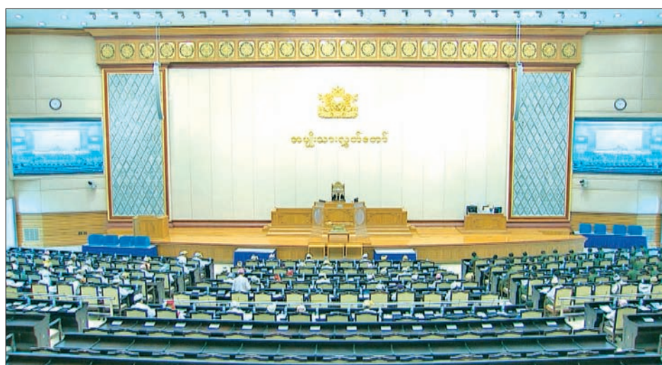
Representatives attending Friday's session of Upper House in Nay Pyi Taw.