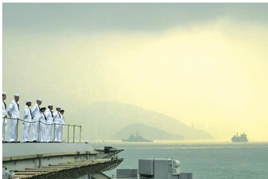
Sailors aboard the aircraft carrier USS George Washington man the rails as the ship pulls out of Hong Kong after a five-day port visit, in this US Navy handout file photo from 14 Nov, 2011.