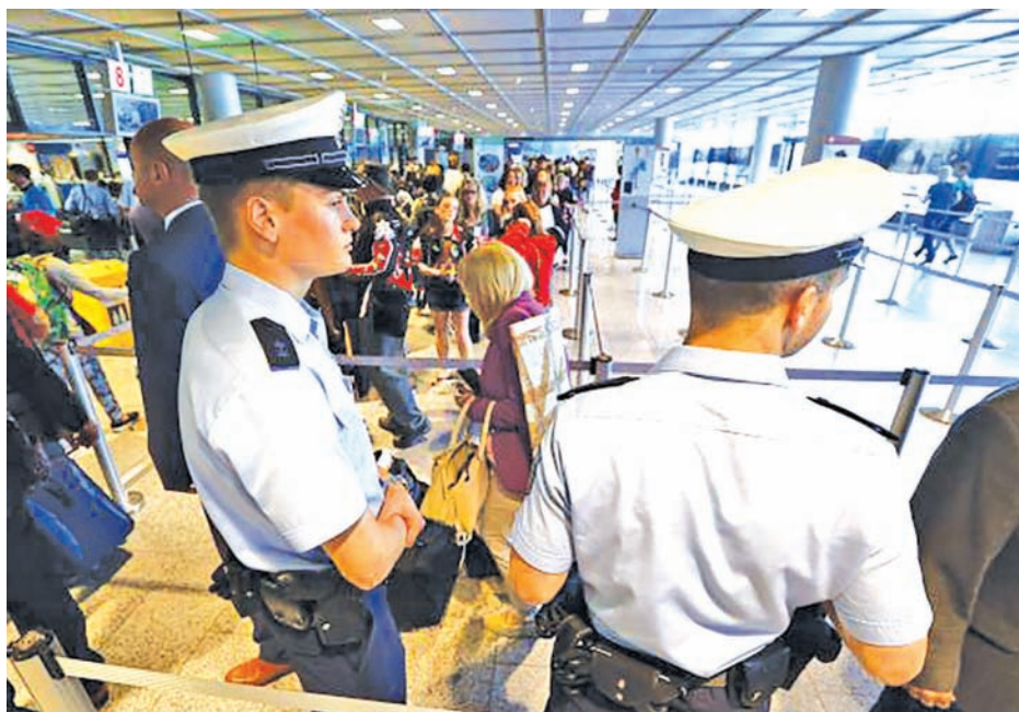
Police officers patrol at a security gate inside the main terminal of Frankfurt Airport on 3 July, 2014.

Security Department announced on Wednesday plans to step up security checks, but they offered few details on how airlines and airports will implement them.