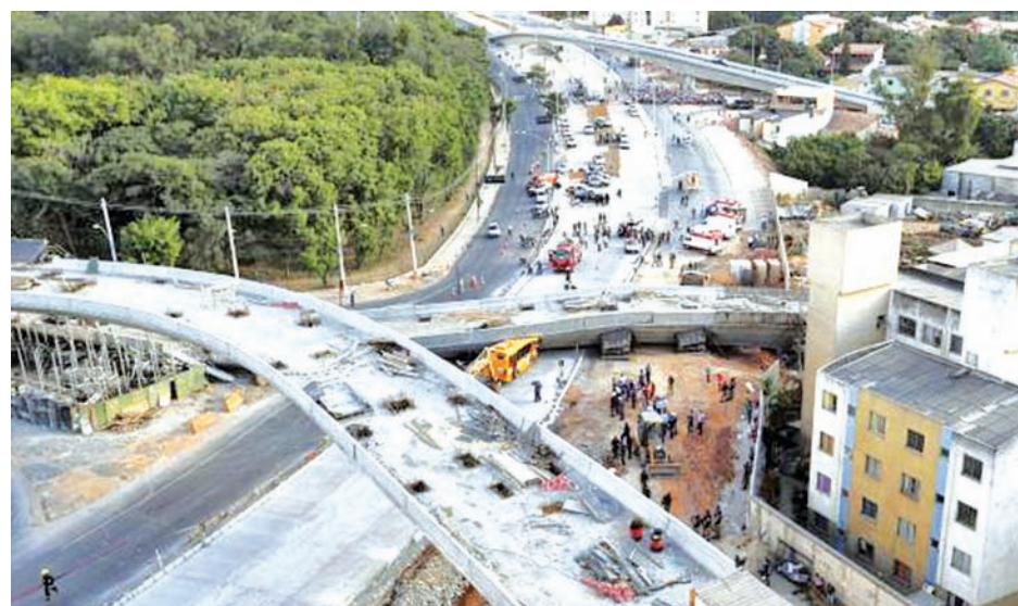
Rescue workers try to reach vehicles trapped underneath a bridge that collapsed while under construction in Belo Horizonte on 3 July, 2014.

"In this moment of pain, I offer my solidarity to the families of the victims," she said. There were conflicting reports over the casualties of the accident in Belo Horizonte, which has already hosted five World Cup games and has the semi-final match on Tuesday.— Reuters