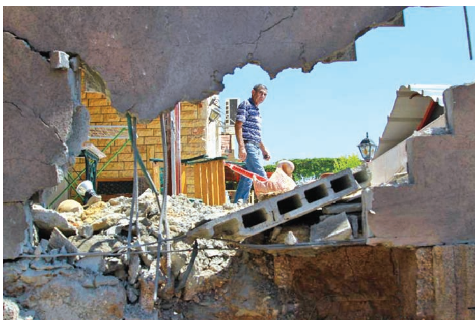
An Israeli man inspects the damage of a house following a projectile attack by militants from Gaza in Sderot, Israel, on 3 July, 2014.

Israeli Prime Minister Benjamin Netanyahu said if Gaza rocket fire stopped then Israel would also halt