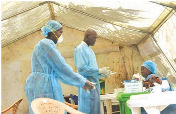
Health workers take blood samples for Ebola virus testing at a screening tent in the local government hospital in Kenema, Sierra Leone, on 30 June, 2014.

ACCRA, 4 July — West African countries and international health organizations adopted a fresh strategy on Thursday to fight the world's deadliest Ebola epidemic, which has killed hundreds of people in Guinea, Sierra Leone and Liberia.