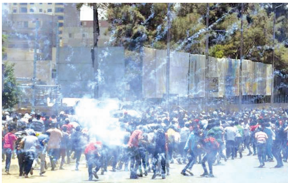
Supporters of Egypt's former president Mohamed Mursi run from tear gas during clashes with police in Cairo, on 3 July, 2014.—REUTERS

Protests have petered out in Egypt in recent months as the crackdown has escalated, particularly since the government passed a law banning protests without prior police permission.—Reuters