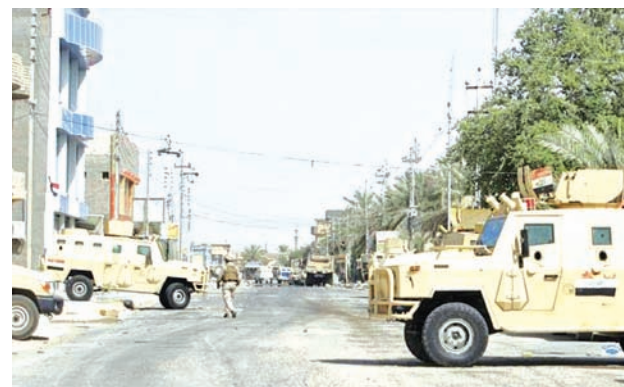
Iraqi security forces military vehicles are seen during an intensive security deployment after clashes with followers of Iraq's Shi'ite cleric Mahmoud al-Sarkhi, in Kerbala, southwest of Baghdad, on 3 July, 2014.—REUTERS

Many Kurds have long wanted to declare independence and now sense a golden opportunity, with Baghdad weak and Sunni armed groups in control of northern cities such as Mosul and Tikrit.—Reuters