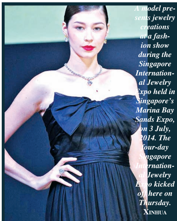
A model presents jewelry creations at a fashion show during the Singapore International Jewelry Expo held in Singapore's Marina Bay Sands Expo, on 3 July, 2014. The four-day Singapore International Jewelry Expo kicked off here on Thursday.

MEXICO CITY, 4 July — At least one person was killed and several were injured on Thursday when Mexico's notorious cargo train "La Bestia" (The Beast) derailed, an official source said.