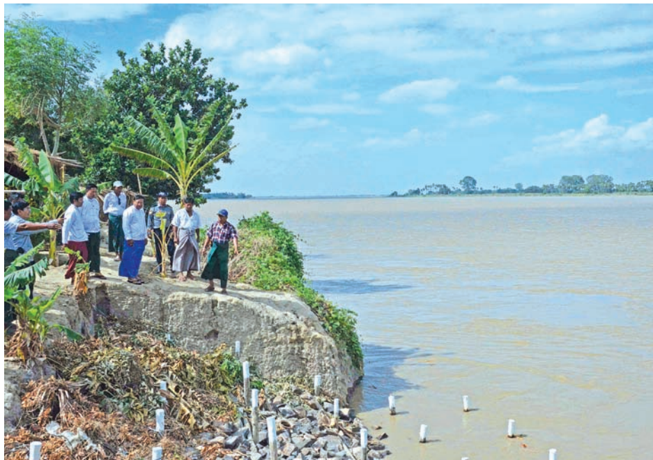
Union Minister U Soe Maung views preparations for building retaining walls for prevention against bank erosion.

NAY PYI TAW, 4 June. July—Union Minister at the President Office U Soe Maung and wife Daw Nan Phyu Phyu Aye donated medicines and copy books to regiments and units of No 101 Light Infantry Division in Pakokku on 30