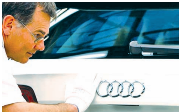
A worker cleans an Audi A3 in the final check area at the production line of the German car manufacturer’s plant in the Bavarian city of Ingolstadt, in this file picture taken on 11 March, 2013.

MILAN, 4 July — Italian auto parts maker Sogefi and Volkswagen’s (VOW-G_p.DE) Audi have jointly developed new suspension spring technology which will result in more precise driving and lighter parts, Sogefi said on Thursday.