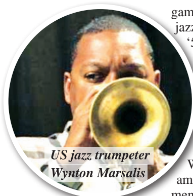
US jazz trumpeter Wynton Marsalis

LONDON, 4 July — The solo played by US jazzman Wynton Marsalis to close his now-annual residency at London's Barbican this week was a rare personal moment in what was otherwise a master class in sharing the limelight.