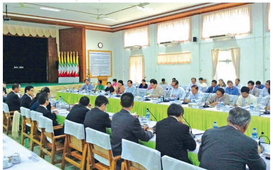
4 th Meeting of Myanmar-Japan Joint Initiative in progress in Nay Pyi Taw.