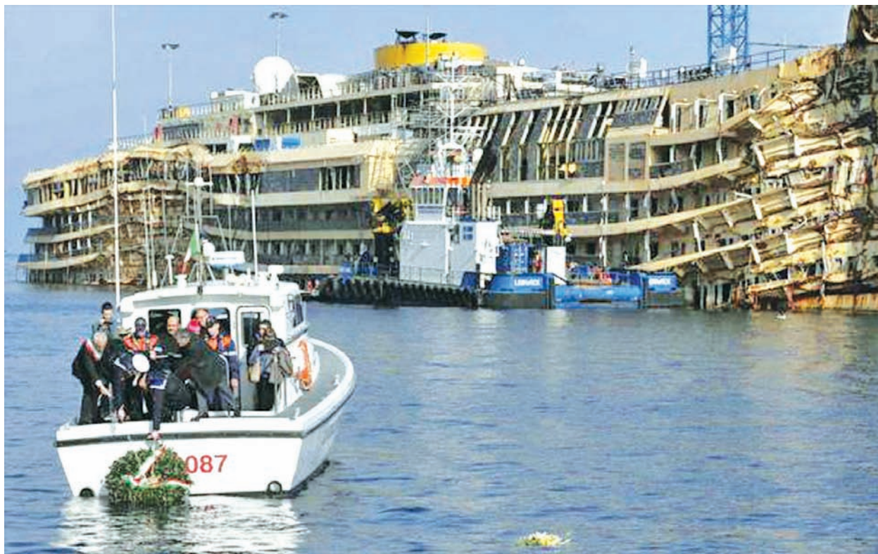
Navy officials release a wreath in front of the Costa Concordia liner to mark the second anniversary of the tragedy outside Giglio harbour in this on 13 Jan, 2014 file photo.

The last of 30 stabilizing devices or “sponsons” was attached to the wreck on Thursday and technicians will now start to test all the systems for the final refloating, the Concordia Wreck Removal Project said in a statement.