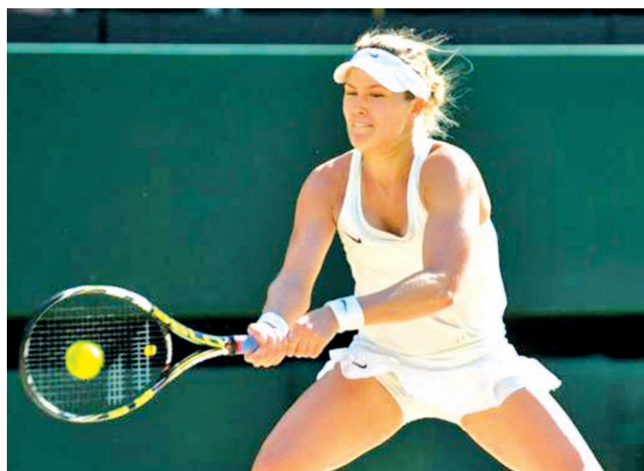
Eugenie Bouchard (CAN) in action during her match against Simona Halep (ROU) on day 10 of the 2014 Wimbledon Championships at the All England Lawn and Tennis Club.

What Kvitova cared about was that she was now two sets away from shedding her one-hit wonder tag.