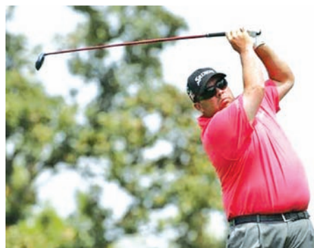
US golfer Kevin Stadler hits his tee shot on the 10th hole during the second round of the Masters golf tournament at the Augusta National Golf Club in Augusta, Georgia on 11 April, 2014.

PARIS, 4 July — Kevin Stadler, son of 1982 US Masters champion Craig, showered praise on the 2018 Ryder Cup venue of Le Golf National after sprinting clear of the field in the first round of the French Open on Thursday.