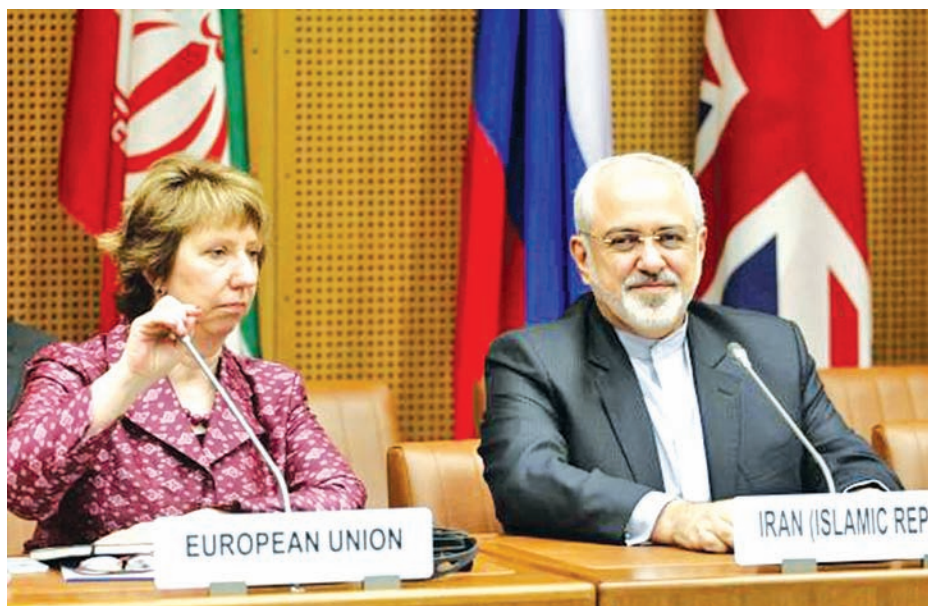
European Union Foreign Policy Chief Catherine Ashton (L) and Iranian Foreign Minister Mohammad Javad Zarif wait to begin talks in Vienna on 3 July, 2014.