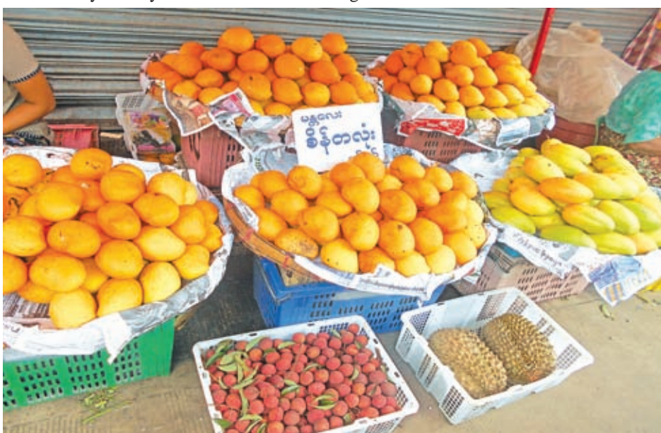
Mandalay diamond (Sein Ta Lone) mangoes at a road-side vendor on Maha Bandoola Road in Latha Township in Yangon.

According to a research, mango has a substantial levels of potassium, provitamin A and vitamin C and is low in fat and sodium.