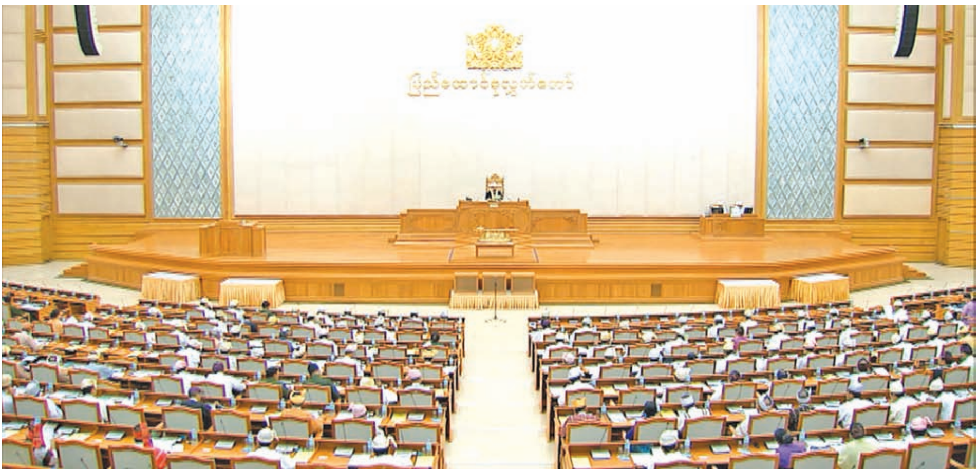
Discussion on a US$100-million loan from the World Bank and a US$36-million loan from International Fund for Agricultural Development among the topics discussed at Pyidaungsu Hluttaw session on Wednesday.

NAY PYI TAW, loan from the World Bank for Agricultural Develop-