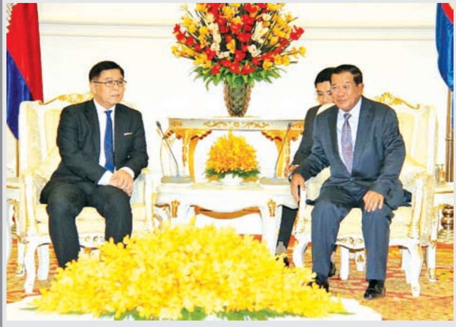
Cambodian Prime Minister Hun Sen (R) meets with visiting Thai foreign affairs ministry permanent secretary Sihasak Phuangketkeow, in Phnom Penh, Cambodia, on 1 July, 2014. Hun Sen met on Tuesday with Sihasak Phuangketkeow to discuss current situation in Thailand and cooperation over migrant workers.—XINHUA

"Our purpose is first universal suffrage and second to let the government respond to Hong Kong citizens' voice for democracy," said Frank Chio, a representative of the Hong Kong Federation of Students. "This is only step one. There will be other steps."—Reuters