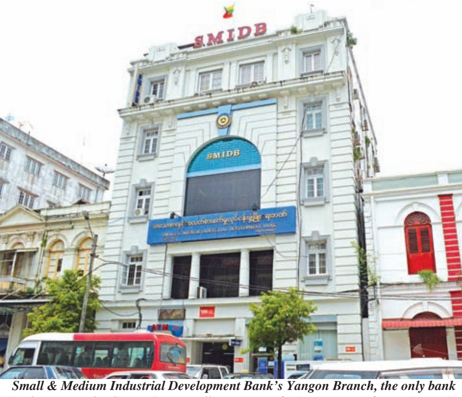
in the country lending to SMEs, will get support for its IT system from Vietnam's BIDV.

Following a deal the two banks signed on 6 June, SMIDB and BIDV had principally agreed on cooperation to upgrade the IT system and make greater use of IT applications in the banking services of the Myanmar bank and provi-