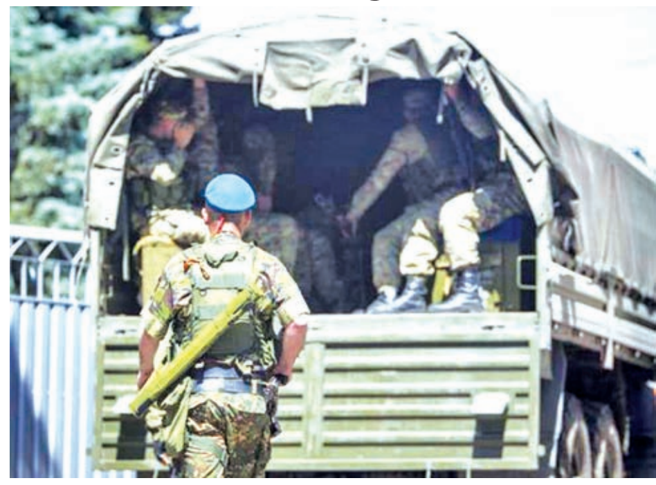
Armed pro-Russian separatists enter a captured Ukrainian National Guard compound at the city of Donetsk, on 28 June, 2014 file photo.

The rebels, who oppose the pro-Western authorities in Kiev, count on the local population for support but some residents and local businesses are angry that the power vacuum is allowing criminals to thrive. German wholesaler