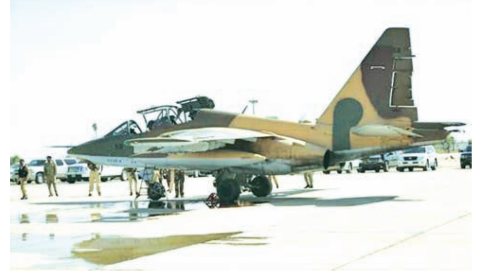
A Russian Sukhoi Su-25 fighter plane arrives at Iraq's al-Muthanna military airbase at Baghdad airport, in Baghdad, on 1 July, 2014.

Shi'ite lawmakers sought to shift blame to the Sunni and Kurdish blocs, saying the premiership was the last position to be named in the constitutionallydefined process.