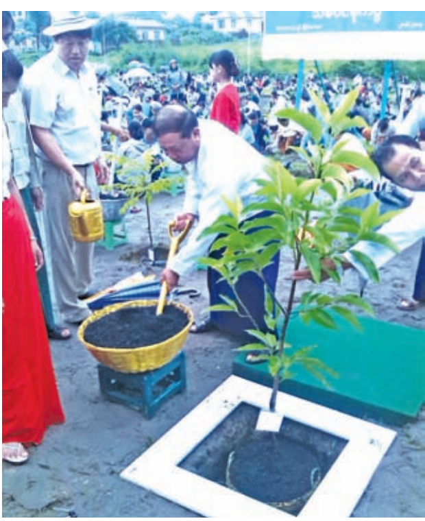
Chief Minister of Mon State U Ohn Myint plants a sapling in Mawlamyine of Mon State to mark Myanmar Women's Day which falls on 3 July 2014.