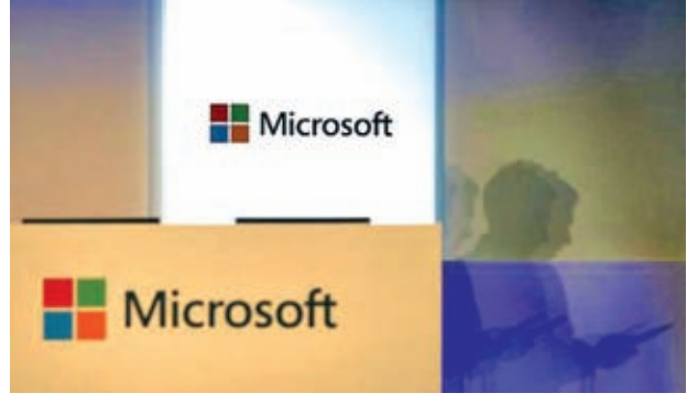
A shadow of a man using his mobile phone is cast near Microsoft logo at the 2014 Computex exhibition in Taipei on 4 June, 2014.

Microsoft on Tuesday joined 50 other members in the AllSeen Alliance, including major consumer electronics players Panasonic Corp, LG Electronics Inc and Sharp Corp, the group said. But chipmakers that compete with Qualcomm plan to launch a rival standards consortium as early as next week, an industry source who was familiar with the plans but not authorized to discuss