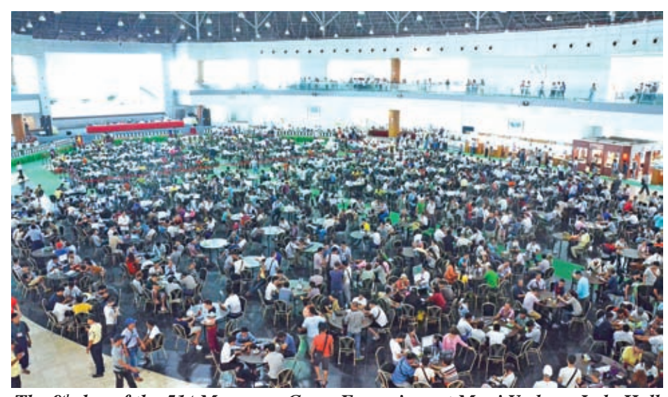
The 9th day of the 51st Myanmar Gems Emporium at Mani Yadana Jade Hall in Nay Pyi Taw in progress.—MNA

NAY PYI TAW, 2 July— The 51<sup>st</sup> Myanmar Gems Emporium continues on its ninth day at Mani Yadana Jade Hall in Nay Pyi Taw, with 1,200 lots of jade selling each day through a tender bidding system, officials said.