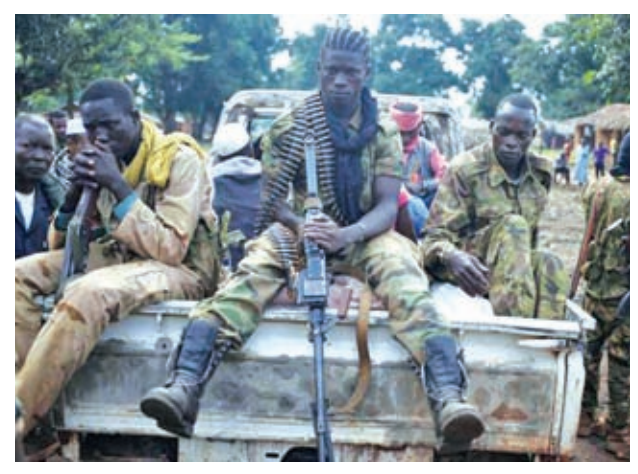
Seleka fighters take a break as they sit on a pick-up truck in the town of Goya on 11 June, 2014.

KAMPALA, 2 July — Uganda's army said on Tuesday the mainly Muslim Seleka group in Central African Republic was now its enemy as the fighters were "in bed" with the Lord's Resistance Army (LRA) rebels they are hunting there.