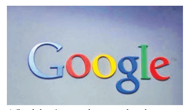
A Google logo is seen at the garage where the company was founded on Google's 15th anniversary in Menlo Park, California on 26 Sept, 2013.

Google would not say how many employees Songza had but it said the company would continue to work from its base in New York.— Reuters