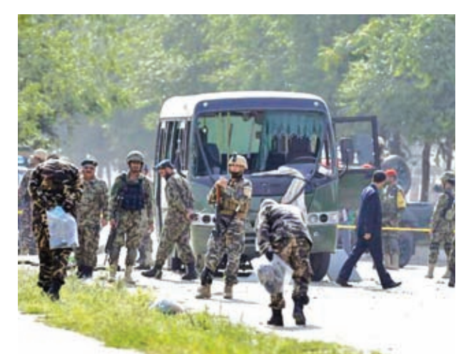
Officials investigate at the site of a suicide attack in Kabul on 2 July, 2014.