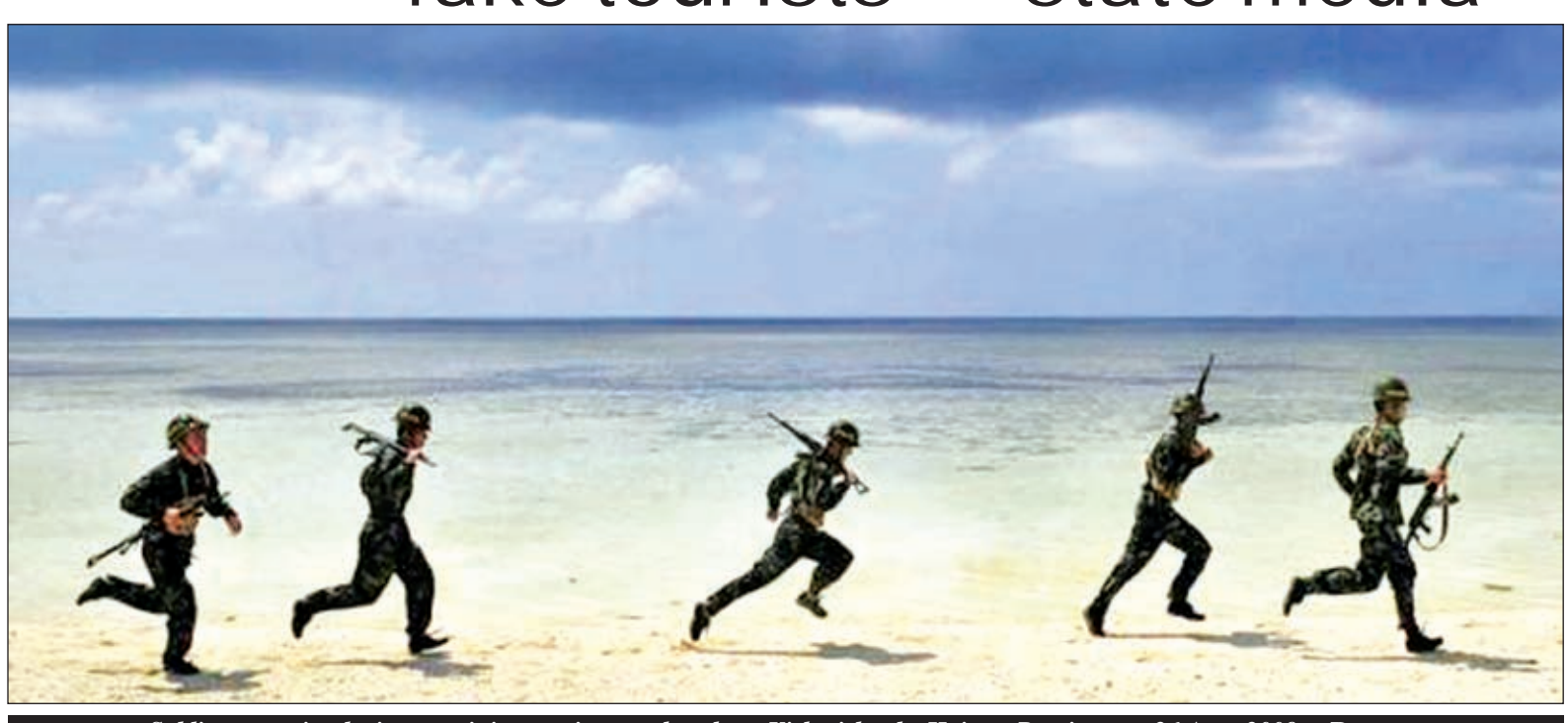
Soldiers exercise during a training session at a beach on Xisha islands, Hainan Province on 26 Aug, 2009.—Reuters

Beijing, 2 July — The security of Chinese military bases is being threatened by illegally built high-rise buildings, and in one case villas built inside a base,