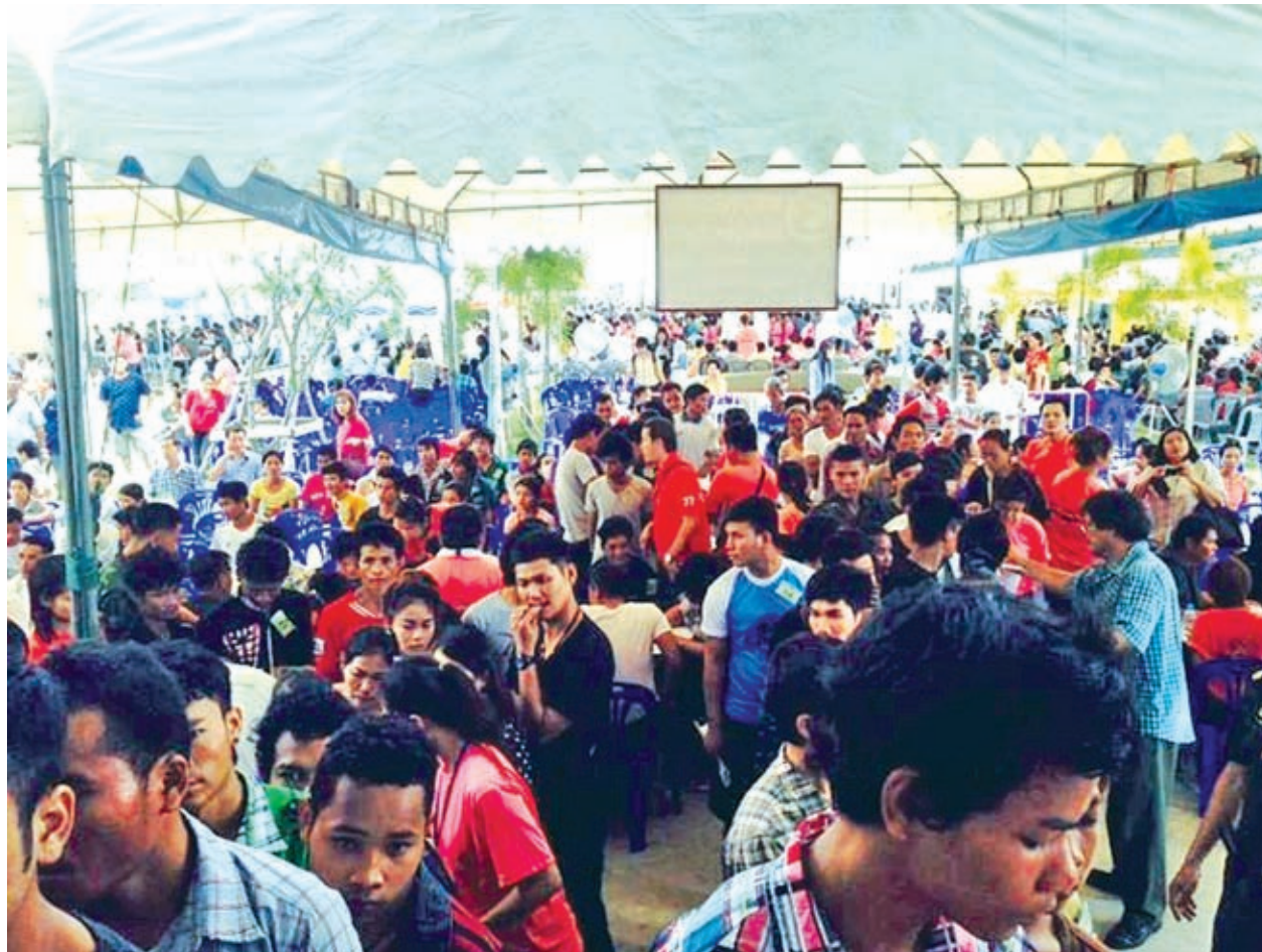
Migrant workers seen at one-stop-service centre in in Samut Sakhon for registration on 30 June.

As the businesses in Samut Sakhon are relying on the bulk of migrant workers, Thai authorities reduced restrictions on im-