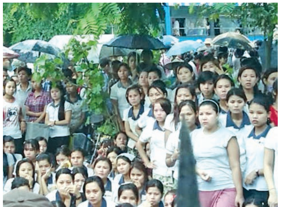
Workers from a garment factory in Shwe Paukkan Industrial Zone gathering to protest the dismissal of trade union activists.

Some of the twelve sacked workers were (See page 2)