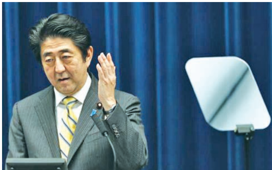
Japan's Prime Minister Shinzo Abe speaks next to a teleprompter during a news conference at his official residence in Tokyo on 24 June, 2014.

TOKYO, 30 June — Half of Japanese voters oppose dropping a ban that has kept the military from fighting abroad since World War Two, a survey showed on Monday, as Prime Minister Shinzo Abe readied a landmark shift in security policy that would ease the constraints of the pacifist constitution on the armed forces.