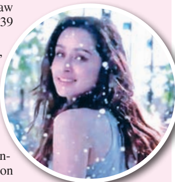
A still from the movie Ek Villain

Celebrities like Karan Johar, Alia Bhatt, Parineeti Chopra and Genelia D'Souza also praised the movie. — PTI