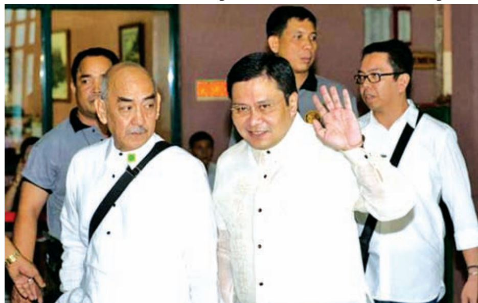
Senator Jose 'Jinggoy' Estrada (C), son of former Philippine President Joseph Estrada, waves as he arrives at the graft court for his arraignment in Manila on 30 June, 2014.