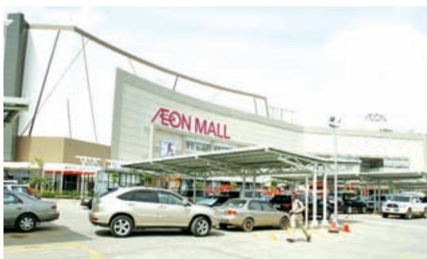
AEON Mall opens in Phnom Penh, Cambodia, on 30 June, 2014.

PHNOM PENH, 30 June — A giant Japanese shopping mall officially opened on Monday in Phnom Penh in the presence of Cambodia's leader and Japan's foreign minister. At the inauguration of AEON Mall Phnom Penh, Prime Minister Hun Sen noted it is the first modern mall of international standard to be built in Cambodia.