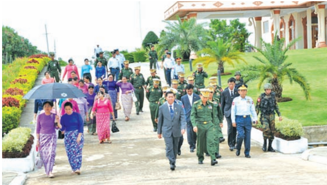
Senior General Min Aung Hlaing being seen off at Nay Pyi Taw Airport by officials.