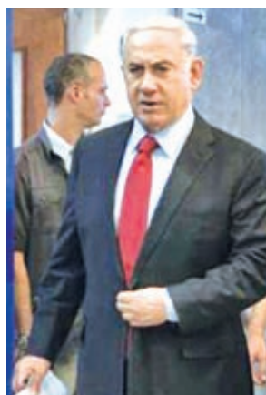
Israel's Prime Minister Benjamin Netanyahu

JERUSALEM, 30 June — Israeli Prime Minister Benjamin Netanyahu voiced support for Kurdish statehood on Sunday, taking a position that appeared to clash with the US preference to keep sectarian war-torn Iraq united.