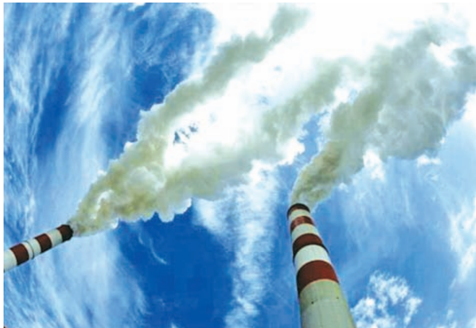
Smoke bellow from the chimneys of Belchatow Power Station, Europe's largest biggest coal-fired power plant, in this 7 May, 2009 file photo.

CAPE CANAVERAL, (Florida), 30 June — A NASA satellite being prepared for launch early on Tuesday is expected to reveal details about where carbon dioxide, a greenhouse gas tied to climate change, is being released into Earth's atmosphere on a global scale.