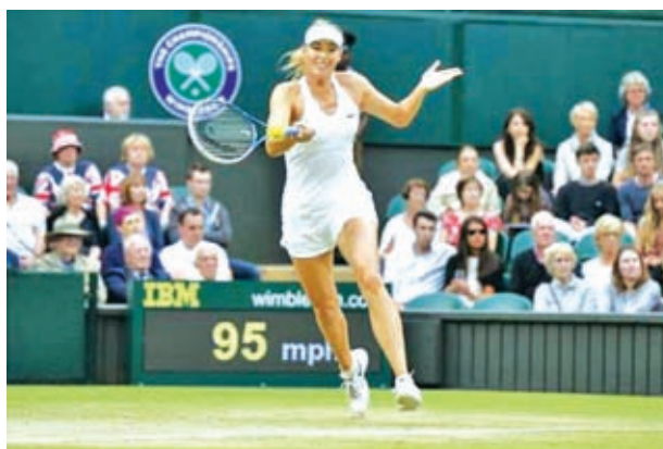
Maria Sharapova of Russia hits a return to Alison Riske of the US during their women’s singles tennis match at the Wimbledon Tennis Championships, in London on 28 June, 2014.

LONDON, 30 June — The shock losses suffered by top two seeds Serena Williams and Li Na have left Maria Sharapova with a smooth passage and the Russian is primed to win her second Wimbledon title, 10 years after winning her first as a 17-year-old.