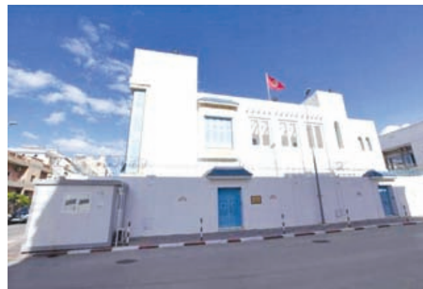
An exterior view of the Tunisian embassy is seen in Tripoli on 17 April, 2014.

Kidnappers freed the Jordanian envoy in May after a handover of a Libyan Islamist militant who had been serving a life sentence for a bombing plot in Jordan. Three years after the fall of Muammar Gaddafi Libya is still struggling with insecurity and chaos with brigades of former rebels and militias refusing to disarm and often challenging the state with political demands.