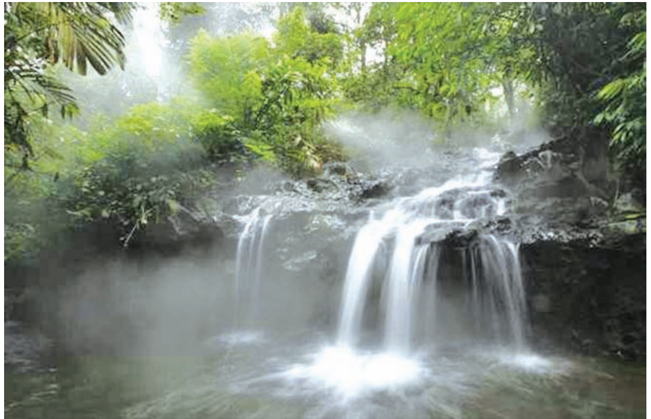
A view of a waterfall in the protected forest at the Welirang mountain in Malang, East Java Province, on 10 Feb, 2010.

Other studies have also found large forests