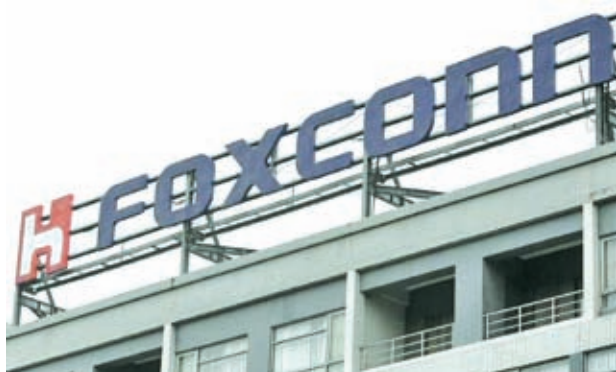
The logo of Foxconn, the trading name of Hon Hai Precision Industry, is seen on top of the company's headquarters in Tucheng, New Taipei city, on 24 Dec, 2013.

This knocks down Chey's stake from 38 percent to 33.1 percent in SK C&C, through which he controls SK Holdings and other units including the world's second-biggest