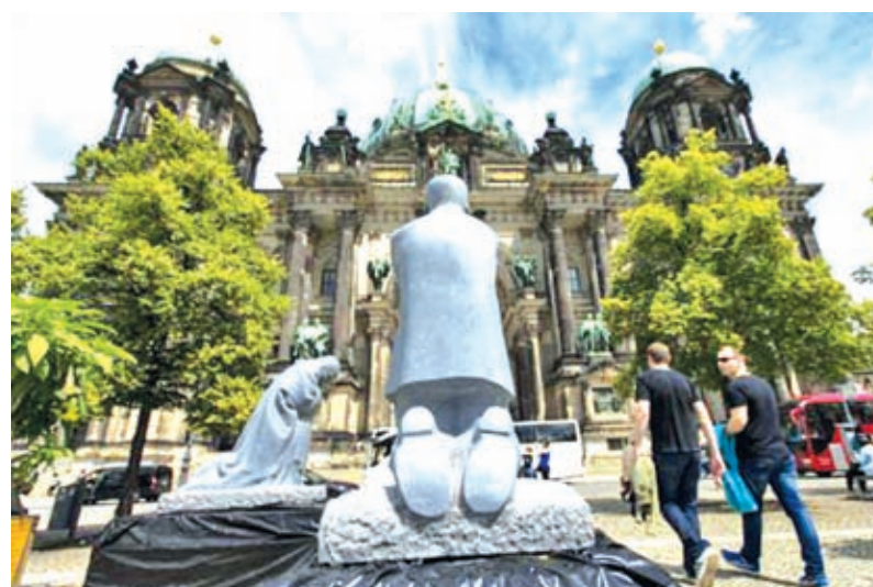
Replicas of Kaethe Kollwitz’s statues ‘Grieving Parents’ are displayed in front of the Berlin Cathedral in Lustgarten park in Berlin on 26 June, 2014.

The centenary of the outbreak of World War One has been marked with major events in Britain, France, and Belgium, but today’s Germans shudder when recalling the milita-