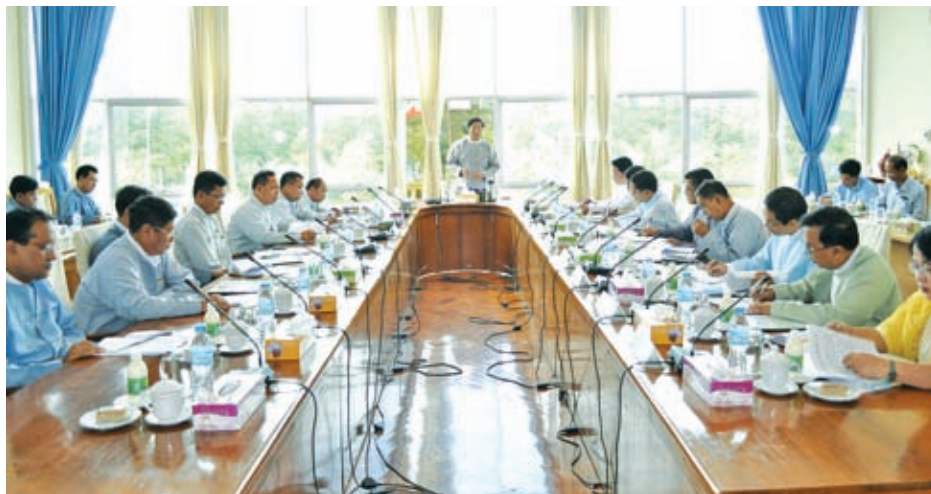
Union Minister U Ohn Myint speaking at a meeting on rural development and poverty alleviation.

discussions on progress poverty alleviation. of rural development and