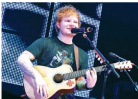
Singer/songwriter Ed Sheeran

LONDON, 30 June — Singer/songwriter Ed Sheeran entered the British charts at number one on Sunday after his new re-