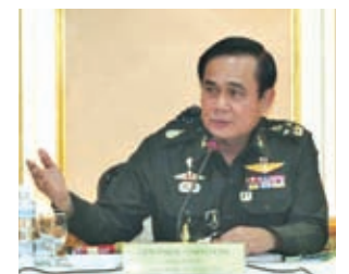
Thai Army chief General Prayuth Chan-ocha