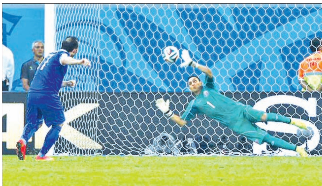
Costa Rica's goalkeeper Keilor Navas makes a save against Greece's Theofanis Gekas (L) during the penalty shootout in their 2014 World Cup round of 16 game against Greece at the Pernambuco arena in Recife on 29 June, 2014.

The goal prompted another exuberant fist-pumping celebration from coach Miguel Herrera, whose