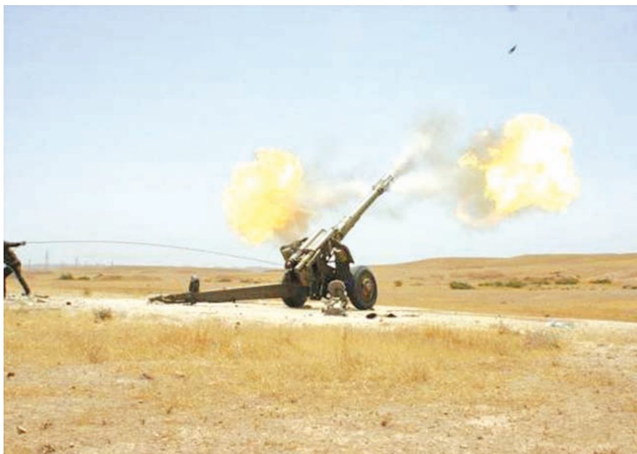
A member of the Kurdish Peshmerga troops fire a cannon during clashes with militants of the Islamic State in Iraq and the Levant (ISIL) in Jalawla, Diyala Province on 29 June, 2014.

Troops backed by helicopter gunships began an assault on Tikrit, the birthplace of former President