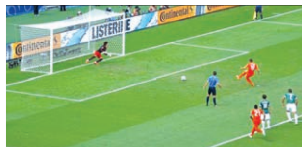
Klaas-Jan Huntelaar of the Netherlands scores a penalty goal past Mexico's goalkeeper Guillermo Ochoa during their 2014 World Cup round of 16 game at the Castelao arena in Fortaleza on 29 June, 2014.

Costa Rica looked broken but, after surviving extra time, they gave a lesson in penalty-taking as they converted all five attempts in the shootout while Navas saved Gekas's fourth shot for Greece.—Reuters