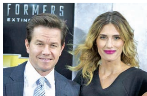
Actor Mark Wahlberg and wife Rhea Durham arrive for the premiere of the movie "Transformers: Age of Extinction" in New York on 25 June, 2014.

The nearly three-hour movie garnered mostly poor reviews, with only 17 percent of 121 critics giving it a "fresh" rating, according to the site Rotten Tomatoes, but ticket buyers gave the film an A-rating according to polling service CinemaScore. — Reuters