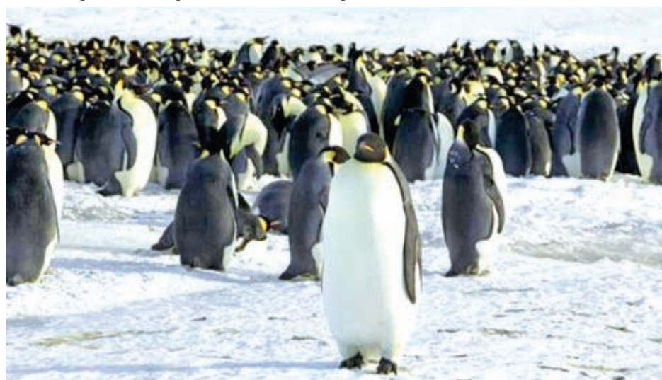
Emperor penguins are seen in Dumont d'Urville, Antarctica on 10 April, 2012.—REUTERS

More sea ice around a continent the size of the United States and Mexico combined tends to mean more shrimp-like krill, on which penguins feed. Krill eat algae that grow under ice.—Reuters