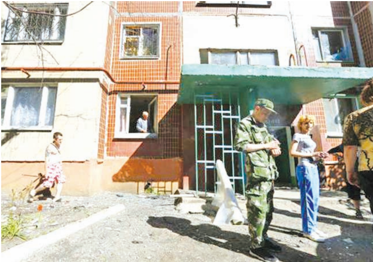
Local residents and a pro-Russian fighter stand near the entrance to an apartment block damaged by shelling in Slaviansk in eastern Ukraine on 29 June, 2014.

KIEV, 30 June — Ukrainian President Petro Poroshenko urged President Vladimir Putin on Sunday to strengthen Russian control over its borders to prevent militants and arms entering Ukraine