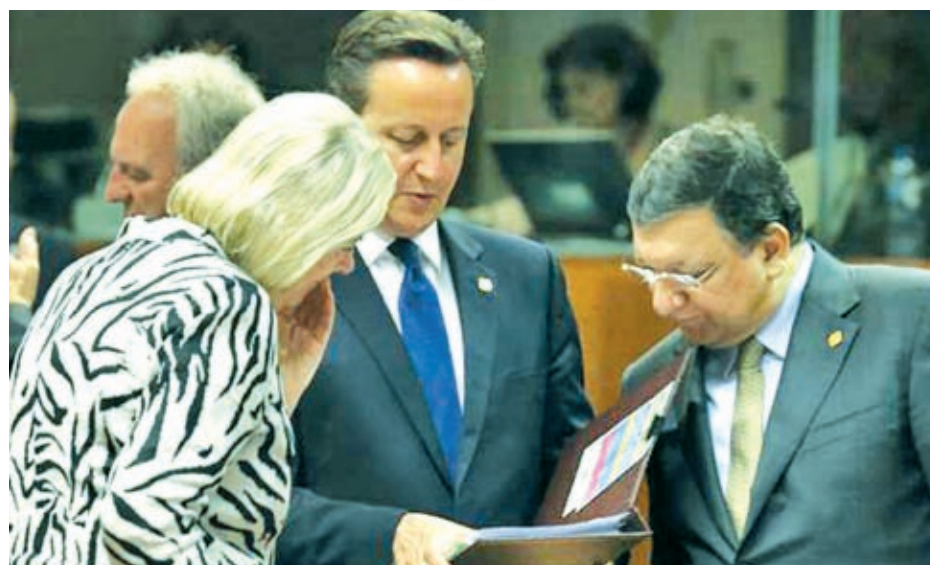
Britain's Prime Minister David Cameron (C) talks to European Commission President Jose Manuel Barroso (R) during a European Union leaders summit in Brussels on 27 June, 2014.

LONDON, 30 June — Public support for Britain to leave the EU is growing again after falling to a multi-year low, according to the first survey published since EU leaders nominated Jean-Claude Juncker to become the next president of the European Commission.