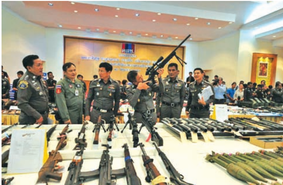
Thai police officers examine weapons seized during raids from 22 May to 25 June at a news conference in Bangkok, Thailand, on 29 June, 2014.

BANGKOK, 30 June — Thailand's military government said on Monday it had begun an overhaul of the electoral system following an announcement by junta leader General Prayuth Chan-ocha that polls could take place by late 2015.