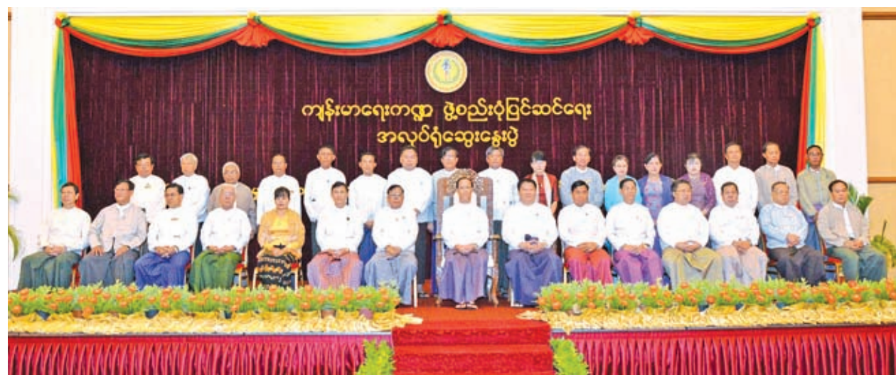
Vice President Dr Sai Mauk Kham seen in group photo together with participants of a workshop on structural reform of the health sector.

NAY PYI TAW, 30 June—The overall services of the Ministry of Health have improved a lot during the term of the current