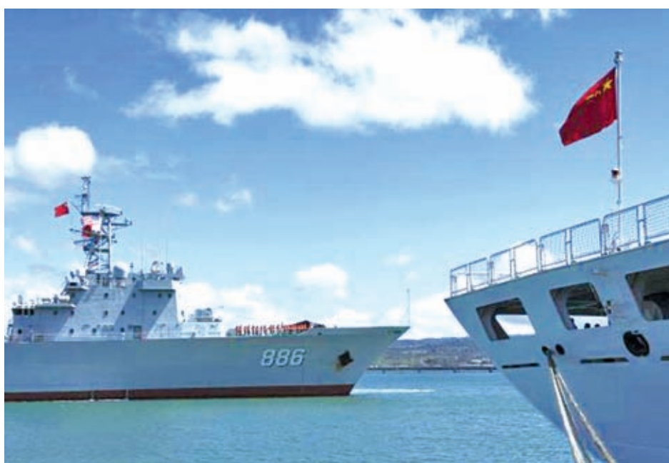
The Chinese People's Liberation Army (PLA) Navy replenishment ship Qiandaohu (866) (L) sails past the PLA Navy hospital ship, Peace Ark, as it docks at the Joint Base Pearl Harbor Hickam to participate in the multi-national military exercise RIMPAC 2014, in Honolulu, Hawaii, on 24 June, 2014.

Twenty-three nations had been expected to participate in RIMPAC this year. But Thailand will not