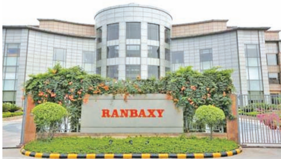
A general view of the office of Ranbaxy Laboratories is pictured at Gurgaon, on the outskirts of New Delhi, on 13 June, 2013.

MUMBAI, 27 June — India's Ranbaxy Laboratories rose 5.8 percent in early trading after the US