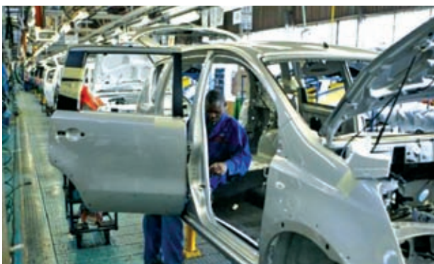
A worker assembles a car at a Nissan's manufacturing plant in Rosslyn, outside Pretoria, on 11 Sept, 2009.