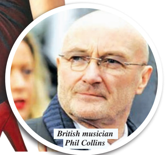
British musician Phil Collins

Collins, 63, said he became fascinated with the Alamo story when he was growing up in the 1950s watching the television series "Davy Crockett, King of the Wild Frontier" starring Fess Parker. The series chronicled the frontier legend of Crockett, who eventually died as one of the defenders of the Alamo. Collins went on to amass the largest known private collection of memorabilia from the Texas Revolution and the Battle of the Alamo. "Some people would buy Ferraris, some people would buy houses, I bought old bits of metal and old bits of paper," the former Genesis drummer and vocalist for hits including "Against All Odds" and "Another Day in Paradise" told reporters in front of the famed structure in San Antonio, Texas. He kept the items at his home in Switzerland.— Reuters