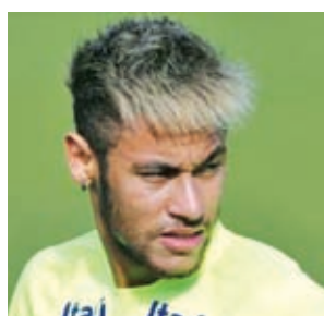
Brazil's Neymar attends a training session in Teresopolis near Rio de Janeiro on 26 June, 2014.