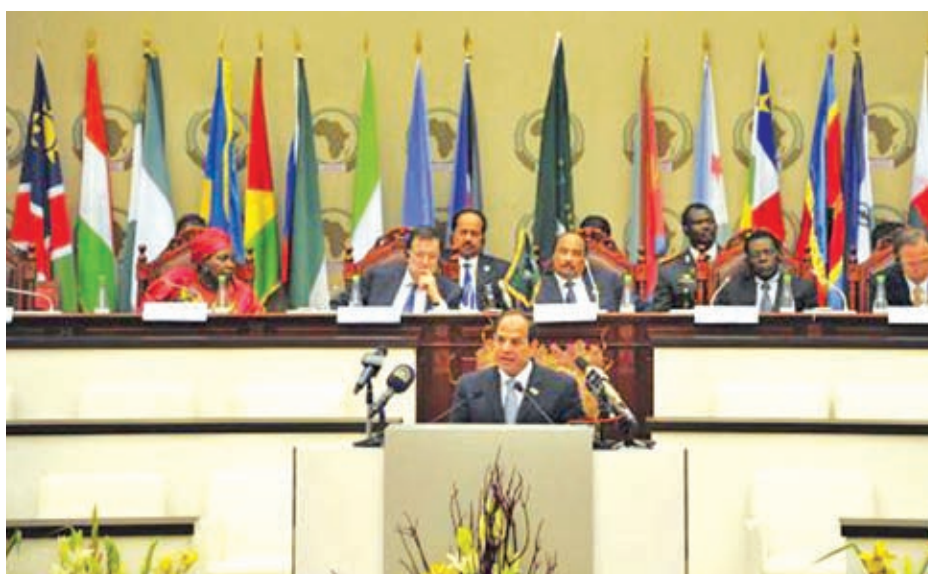
Egypt President Abdel Fattah al-Sisi talks during the 23rd African Union Summit (AUS) in Malabo in this 26 June, 2014 handout.

The force has been under discussion for more than a decade but its establishment has been ham-