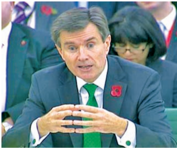
John Sawers the head of MI6

Sawers, who argued that al-Qaeda and its affili-