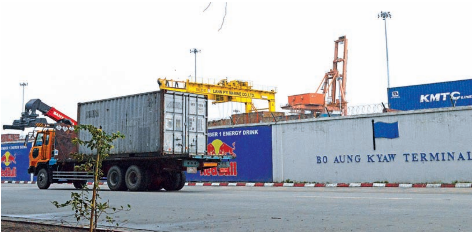
Photo shows Bo Aung Kyaw Terminal in which mobile team operation will be launched on 2 July to increase legal trade volume and improve consumer protection.