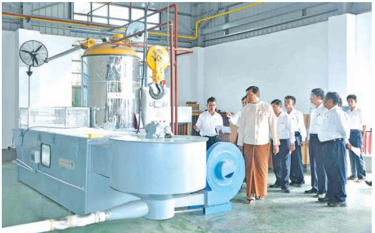
Union Minister for Industry U Maung Myint looks round installation of machinery at No 25 Heavy Industries of No 2 Heavy Industries Enterprise in Myaung.

Young women pose for photo in front of the signboard of Myanmar women's traditional costume show.