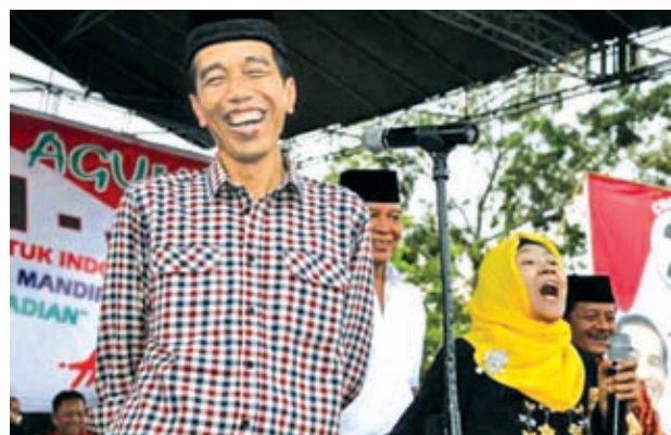
Indonesia's presidential candidate Joko Widodo (L) reacts as he listens to an elder woman's speech to support him during a campaign rally in Majalengka, West Java Province on 18 June, 2014.

JAKARTA, 27 June — "Jokowi" Widodo has a Jakarta Governor Joko nine percentage point lead