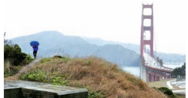
An umbrella toting tourist visits the Golden Gate Bridge during a rainfall in San Francisco, California, on 26 Feb, 2014.

SAN FRANCISCO, 27 June — San Francisco's Golden Gate Bridge may soon be less of a magnet for people trying to commit suicide, as regional officials consider a plan to install mesh barriers beneath the historic orange span to catch jumpers before they hit the water.