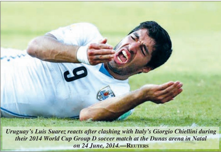
Uruguay's Luis Suarez reacts after clashing with Italy's Giorgio Chiellini during their 2014 World Cup Group D soccer match at the Dunas arena in Natal on 24 June, 2014.

"We didn't choose him to be a philosopher, or a mechanic, or to have good