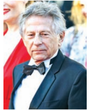
Polish-French film director

After World War Two he returned to Krakow, and