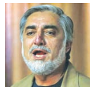
Afghan presidential candidate Abdullah Abdullah speaks during a news conference in Kabul on 23 June, 2014.

The United Nations' top representative in Afghan-