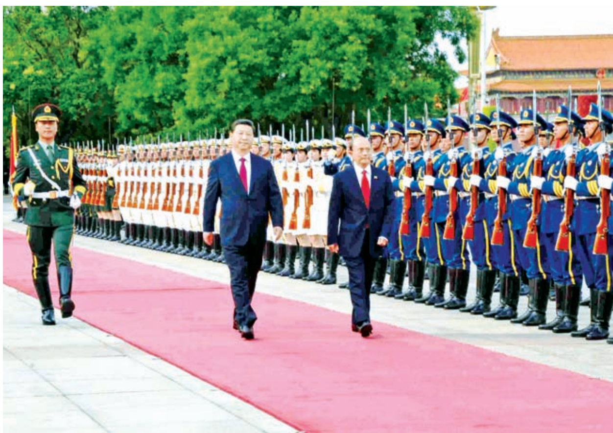
President U Thein Sein and Chinese President Xi Jinping being paid respect by the Guard of Honour in Beijing.

In Beijing, the president met Chairman of National People's Congress of China Mr Zhang Dejiang at 4 pm local standard time and discussed cooperation in political, economic and legal sectors and promotion between the peoples of two countries.