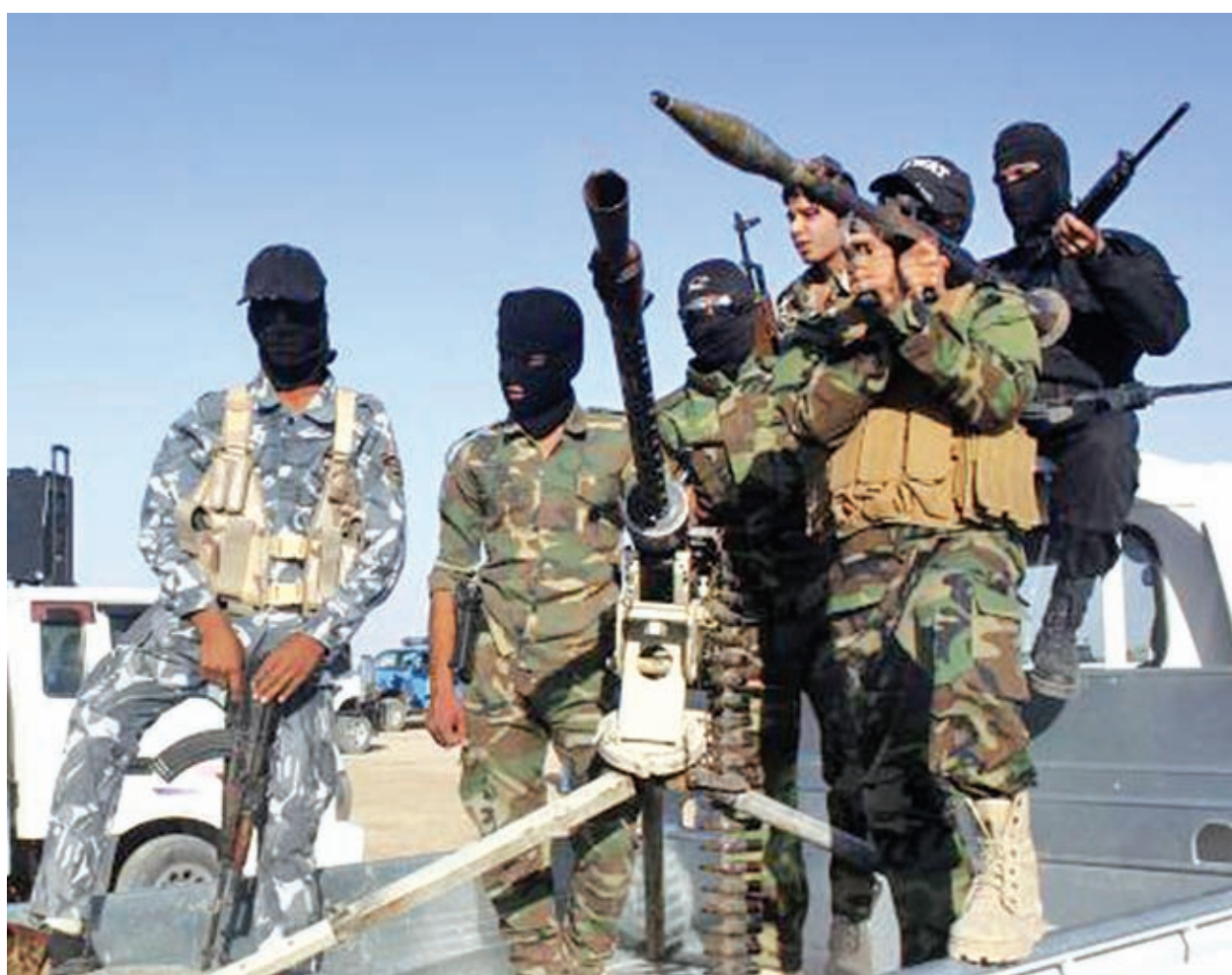
Shi'ite volunteers, who have joined the Iraqi army to fight against the predominantly Sunni militants from the radical Islamic State of Iraq and the Levant (ISIL), take part in a parade on a street in Kanaan, Diyala Province, on 26 June, 2014.