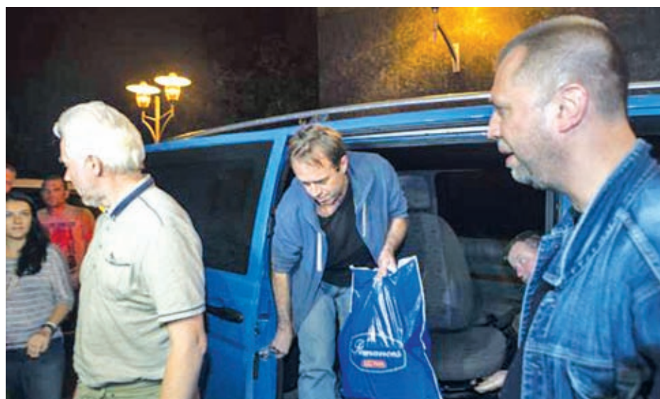
Unidentified members of OSCE Special Monitoring Mission in Ukraine get out of a vehicle next to Alexander Borodai (R), Prime Minister of the self-proclaimed "Donetsk People's Republic", on arrival at the city of Donetsk after being released from captivity, on 27 June, 2014.

The ceasefire between the rebels and the govern-