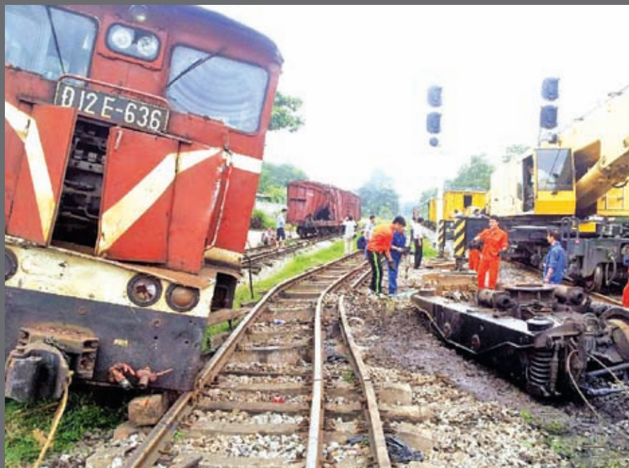
People work at the site of a train accident in Vietnam's northern Thai Nguyen Province, on 26 June, 2014. The accident happened on Wednesday evening when a cargo train rammed into a truck at the intersection between railway and road in Thai Nguyen. No casualties have been reported. This is the third railway accident happened at the intersection in 2014, Vietnamese state-owned news agency VNA reported.