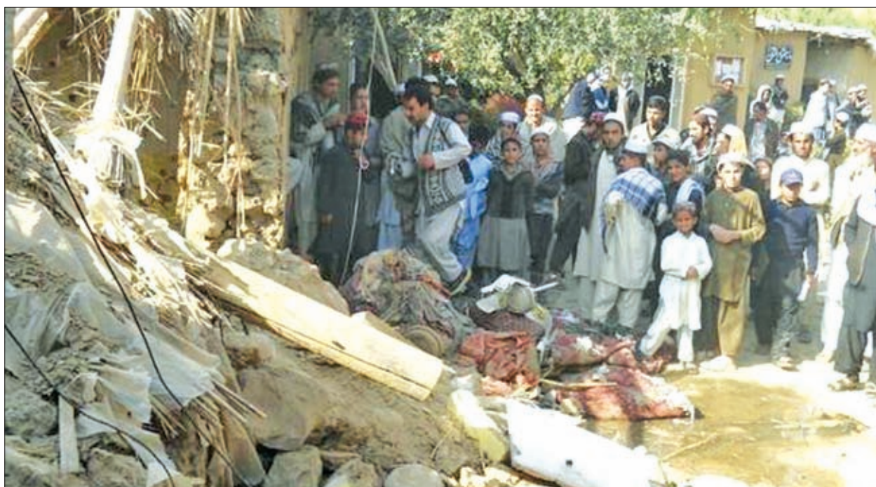
People gather at the site of a suspected US drone strike on an Islamic seminary in Hangu district, bordering North Waziristan, on 21 Nov, 2013.

“We are concerned that the administration’s heavy reliance on targeted killings as a pillar of US counter terrorism strategy rests on questionable assumptions