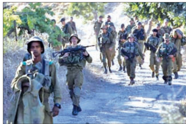
Israeli soldiers take part in an operation to locate three Israeli teens in valley of Haska near the West Bank City of Hebron on 24 June, 2014.