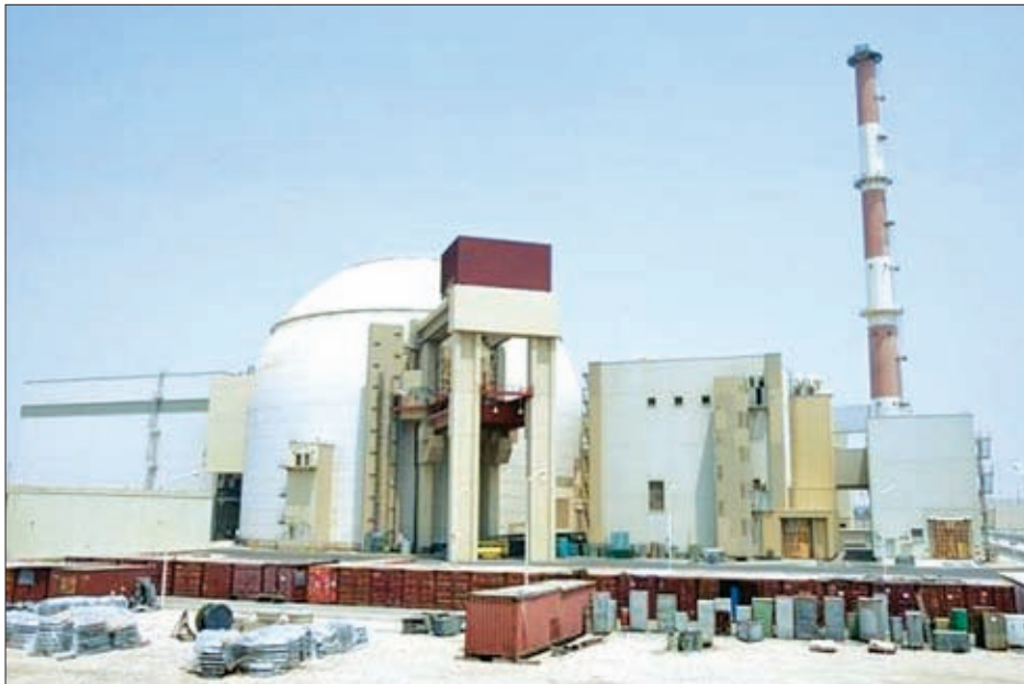
A general view of the Bushehr main nuclear reactor, 1,200 km (746 miles) south of Teheran, on 21 Aug, 2010.

BRUSSELS, 27 June — Senior diplomats from six world powers met in Brussels on Thursday to search for ways to resuscitate negotiations with Iran over its contested nuclear programme, with less than four weeks left until a late-July deadline to strike an accord.