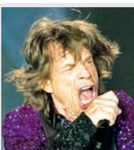
Italy was the most recent victim of what local press in Brazil have taken to calling Jagger's "pe frio" or "cold foot" a term used to describe the bad luck he seems to bring for teams he supports, according to the Hollywood Reporter . PTI

In the beginning of the tournament, the rocker cheered for his home country, England, in their match against Uruguay.—PTI