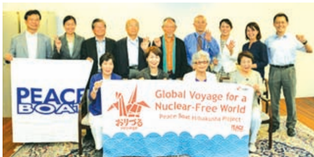
Atomic bomb survivors from Hiroshima and Nagasaki participating in the Peace Boat Orizuru Project pose for photos in Yokohama, Kanagawa Prefecture, on 24 June, 2014, after returning from a 104-day journey visiting 18 countries to campaign against what they consider the inhumanity of nuclear weapons.