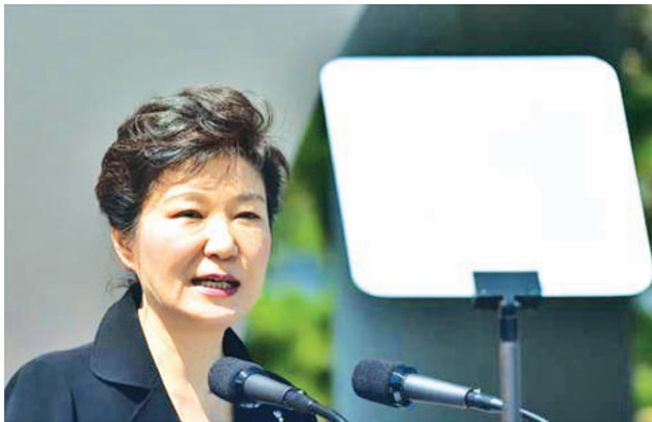
South Korean President Park Geun-hye

Park has suffered a sharp drop in public support since the 16 April ferry tragedy that killed more than 300 people, many of them children on a school