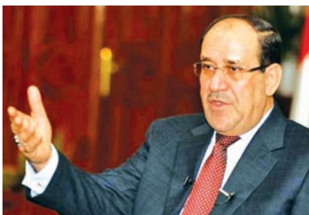
Iraq's Prime Minister Nuri al-Maliki

Three months after elections, a chorus of Iraqi and international voices have called for the government formation process to be started.—Reuters