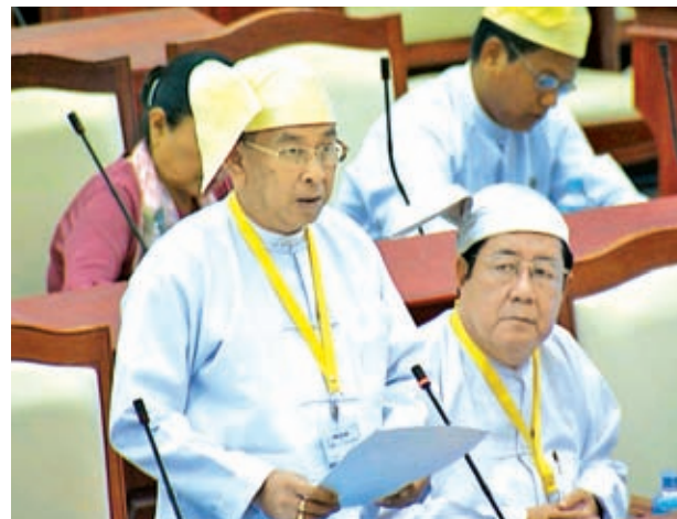
Union Deputy Minister for Labour, Employment and Social Security U Htin Kyaw responds to a question at the lower house.