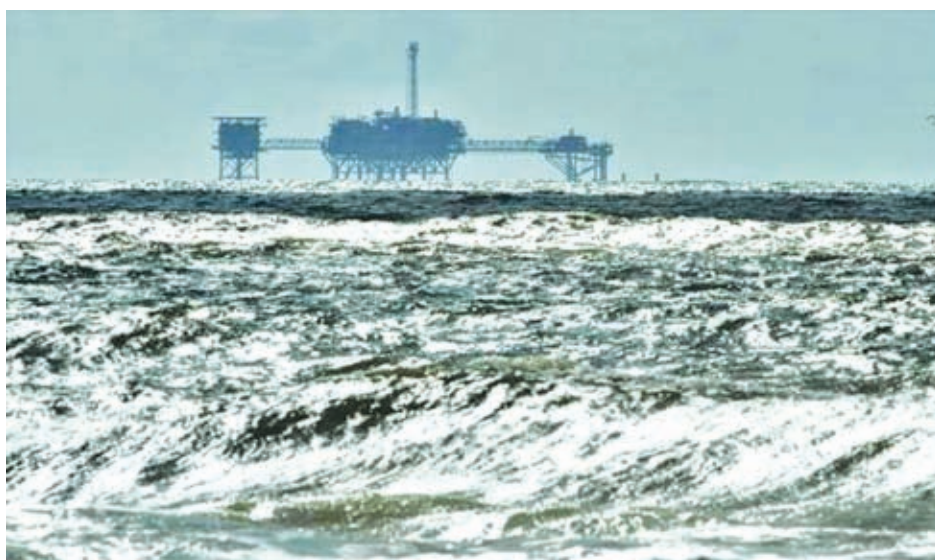
An oil and gas drilling platform stands offshore as waves churned from Tropical Storm Karen come ashore in Dauphin Island, Alabama, on 5 Oct, 2013.

In theory it should take just weeks for Washington