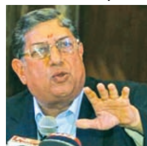
Indian cricket board (BCCI) President N Srinivasan

MELBOURNE, 26 June — India's N Srinivasan was confirmed as the new chairman of the International Cricket Council (ICC) after the governing body approved constitutional change in Melbourne on Thursday. Often described as the most powerful man in cricket, the 69-year-old