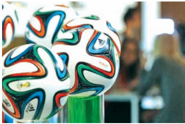
Footballs from Adidas, the world's second largest sports apparel firm, are displayed before the company annual general meeting in the northern Bavarian town of Fuerth near Nuremberg on 8 May, 2014.

"Germany was fantastic ... Argentina will get better and better. Messi is Messi. He is a genius," he said, referring to Argentina's Lionel Messi, the player leading the Adidas