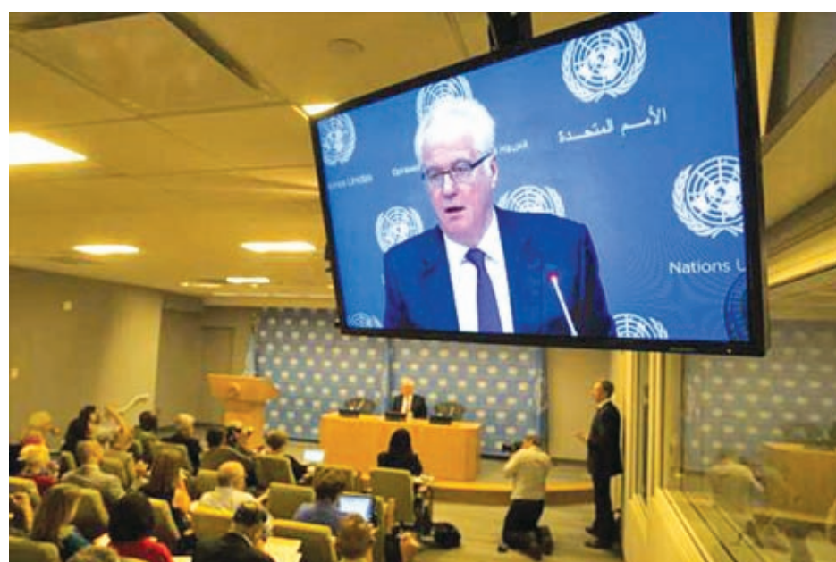
Russia's United Nations Ambassador Vitaly Churkin is shown on a television as he speaks during a news conference marking the start of his month-long term as president of the UN Security Council at the UN headquarters in New York on 3 June, 2014.

The stakes are high in the talks resuming on 2 July, as the powers seek a negotiated solution to a more-than-decade-long