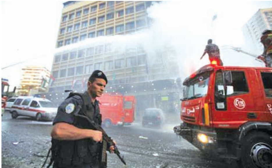
A policeman secures the area as firefighters put out a fire at Duroy hotel following a bomb attack in Raouche, in western Beirut on 25 June, 2014.

BEIRUT, 26 June — A suicide bomber killed himself and wounded at least four security officers at a hotel in Beirut close to the Saudi Arabian embassy