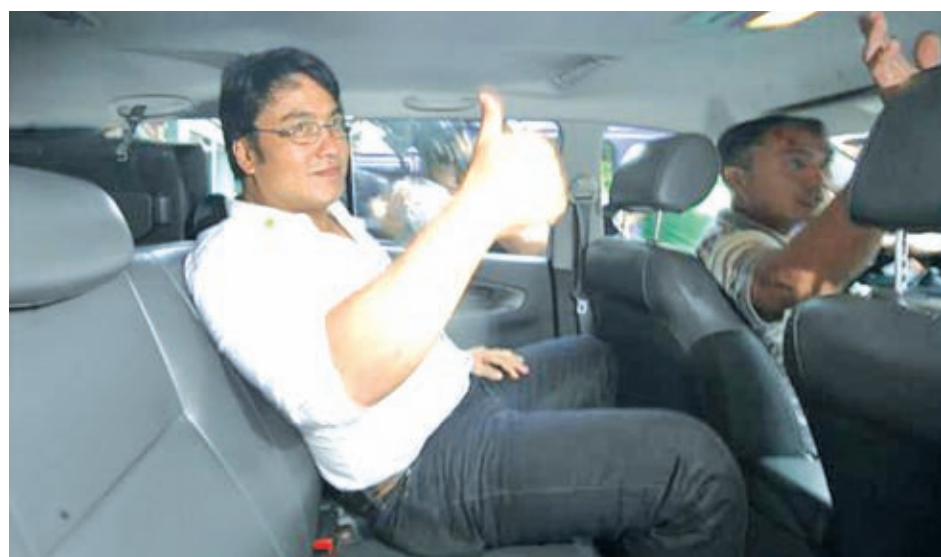
Ramon “Bong” Revilla, a Philippine action movie hero-turned senator, gives a thumbs-up sign inside a police van after his voluntary surrender at the Sandiganbayan anti-graft court in Manila on 20 June, 2014.

MANILA, 26 June — A popular Philippine action movie hero-turned senator pleaded not guilty to plunder on Thursday in a case seen as landmark test of the government’s ability to tackle entrenched corruption in the poor