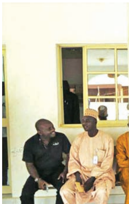
A poster advertising the search for Boko Haram leader Abubakar Shekau and other fighters is pasted on a wall in Baga village on the outskirts of Maiduguri, in the northeastern state of Borno in this on 13 May, 2013 file photo.

UNITED NATIONS, 26 June —The United Nations Security Council sanctioned the leader of Nigeria’s Boko Haram and a splinter group on Wednesday, the first individual and entity to be designated by the world body since the Islamist militant group was blacklisted, diplomats said.