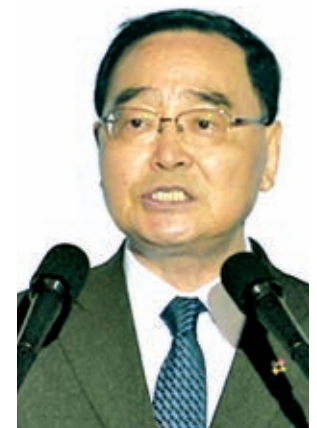
Photo taken on 25 June, 2014, shows South Korean Prime Minister Chung Hong-won in Seoul. President Park Geun-hye retained Chung, who tendered his resignation about two months ago, after a second nominee for the post withdrew his nomination, a senior presidential secretary for Park said on 26 June.