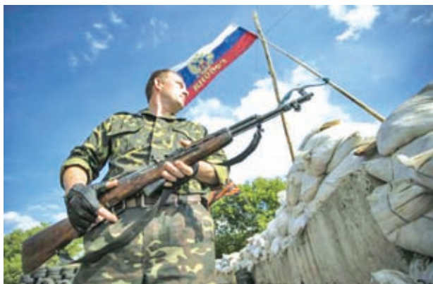
A pro-Russian separatist guards a road checkpoint outside the town of Lysychansk in the Luhansk region of eastern Ukraine, on 24 June, 2014.