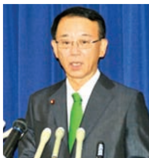
Justice Minister Sadakazu Tanigaki tells a Press conference at the ministry in Tokyo on 26 June, 2014, that he ordered the execution earlier that day of a male death-row inmate, Masanori Kawasaki, at the Osaka Detention House.

The Kawasaki case was "extremely cruel, and the