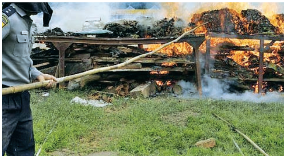
A policeman burns seized narcotic drugs during a drug destruction operation in Yangon, Myanmar, 26 June, 2014.

It also said that migrant workers are exempted from the implementation the Immigration Act 2522 (1979) on three articles which mention that the unskilled labour seeking job and work in Thailand are not allowed to enter to Thailand; the illegal immigrants, those whose duration of stays expired or permission to stay was revoked, will be deported; and the illegal immigrants, those whose duration of stays expired or permission to stay was revoked, will be imprisoned for not more than 2 years, or 20,000 Baht fine or both imprisonment and fine.—NLM