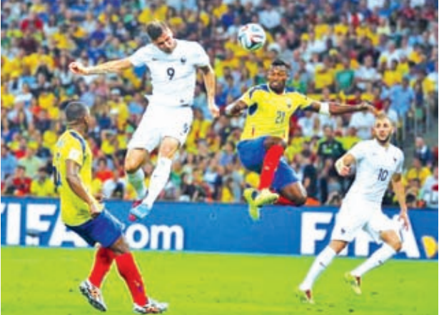
Ecuador's Gabriel Achilier (2nd R) jumps for the ball with France's Olivier Giroud during their 2014 World Cup Group E soccer match at the Maracana stadium in Rio de Janeiro on 25 June, 2014.

goal back for Iran in the 82nd minute and Avdija Vrsajevic restored Bosnia's two-goal cushion with a fine strike a minute later. Switzerland defied 88 percent humidity in steamy Manaus as they went through from Group E. Shaqiri fired Switzerland ahead in the sixth minute with a long-range effort similar to Messi's match-winning goal against Iran. He struck again on the half hour with a clinical finish and rolled in Josip Drmic's pass in the second half to complete the tournament's second hat-trick following Thomas Mueller's effort against Portugal. It was also the 50th hat-trick in World Cup history. The Swiss (6 points) took second place in Group E behind France (7) who could not break down 10-man Ecuador, the only one of the sixth South American teams to fall at the first hurdle. Ecuador had Antonio Valencia sent off for a challenge on Lucas Digne which left the France left back needing treatment in the second half. Reuters