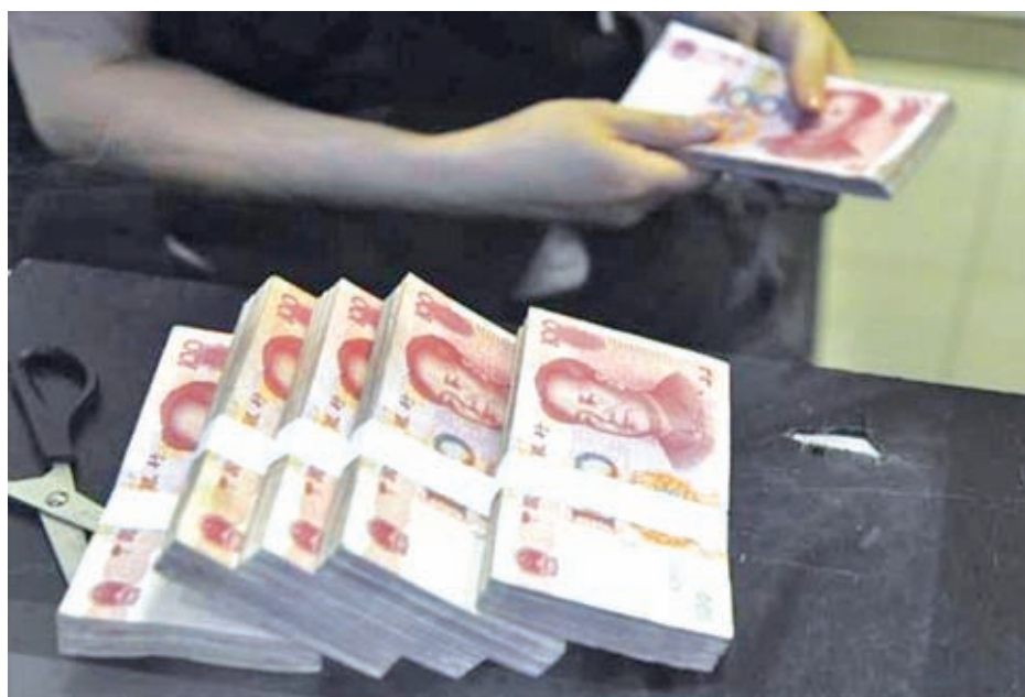
An employee counts Chinese 100 yuan banknotes at a branch of China Merchants Bank in Hefei, Anhui Province on 21 June, 2013.

SINGAPORE, 26 June — An unusual parallel rally in Asian bonds and equities, powered for the last five years by cheap global funds, could give out soon with debt becoming a casualty of the increasing confidence in the outlook for global growth. Bonds are now pricing in an extremely bleak economic outlook, making them susceptible to any spike in long-term rates. The rise in equities has been less pronounced, leaving room for further gains as a pick up in global demand boosts corporate earnings.