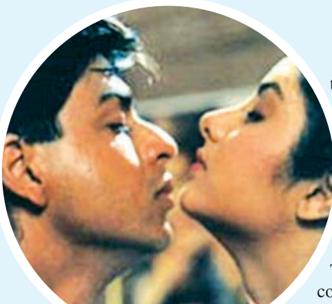
Shah Rukh Khan is yet to watch his 1992 movie debut 'Deewana'.

MUMBAI, 26 June — It was 22 years ago on 25 June that Shah Rukh Khan's debut movie "Deewana" hit the silver screen. The actor says he has not seen the movie yet — and he has his special reason.