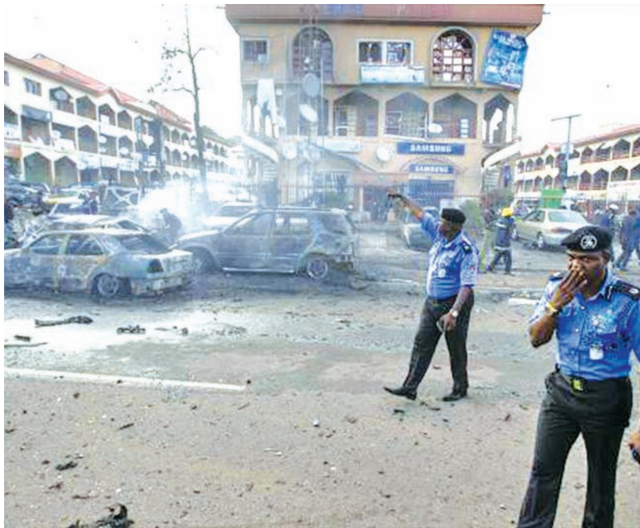
Policemen walk towards burnt vehicles at the scene of a blast at a business district in Abuja on 25 June, 2014.

Another suspect was killed by soldiers as he tried to escape on a motorcycle, the spokesman for Nigeria's National Infor-