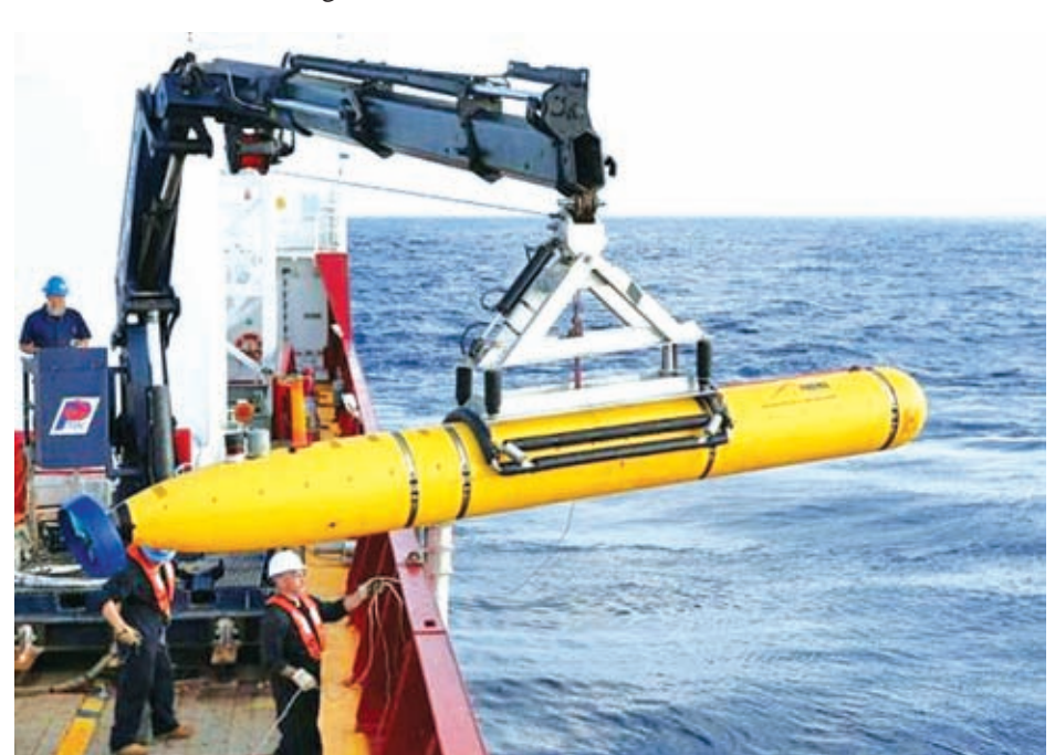
Crew aboard the Australian Defence Vessel Ocean Shield move the US Navy's Bluefin-21 autonomous underwater vehicle into position for deployment in the southern Indian Ocean to look for the missing Malaysia Airlines flight MH370, on 14 April, 2014 in this handout picture released by the US Navy.