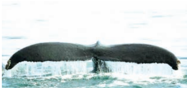
A humpback whale dives in the waters of Prince William Sound near the town of Valdez, Alaska on 9 August, 2008.

JUNEAU, (Alaska), 26 June — Alaska's humpback whales swam a little closer on Wednesday to losing their status as an endangered species after being federally protected for more than 40 years, a US agency said.