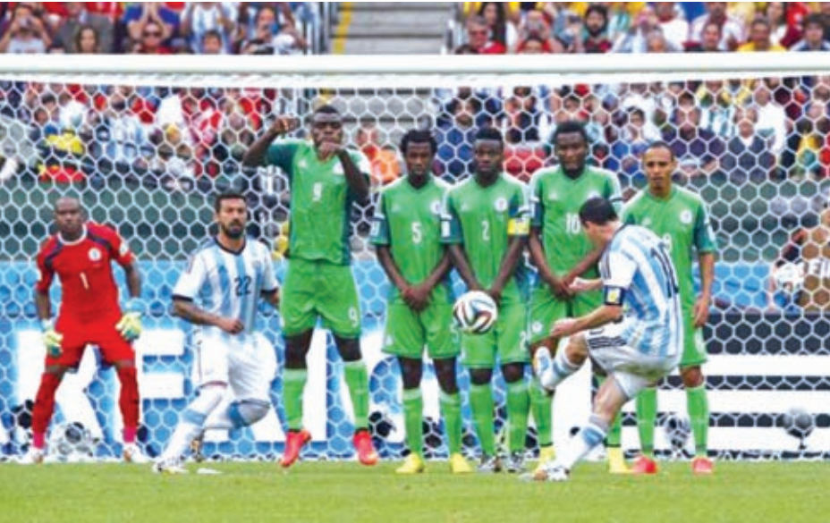
Argentina's Lionel Messi scores on a free kick during the 2014 World Cup Group F soccer match against Nigeria at the Beira Rio stadium in Porto Alegre on 25 June, 2014.

BRASILIA, 26 June — Argentina's Lionel Messi continued his World Cup duel with Neymar by scoring twice in a 3-2 win over Nigeria while Switzerland's Xherdan Shaqiri got in on the act with a magnificent hat-trick in a 3-0 win over Honduras on Wednesday. Nigeria scraped through behind already-qualified Argentina, becoming the first African team to reach the last 16 at this tournament, while Swit-