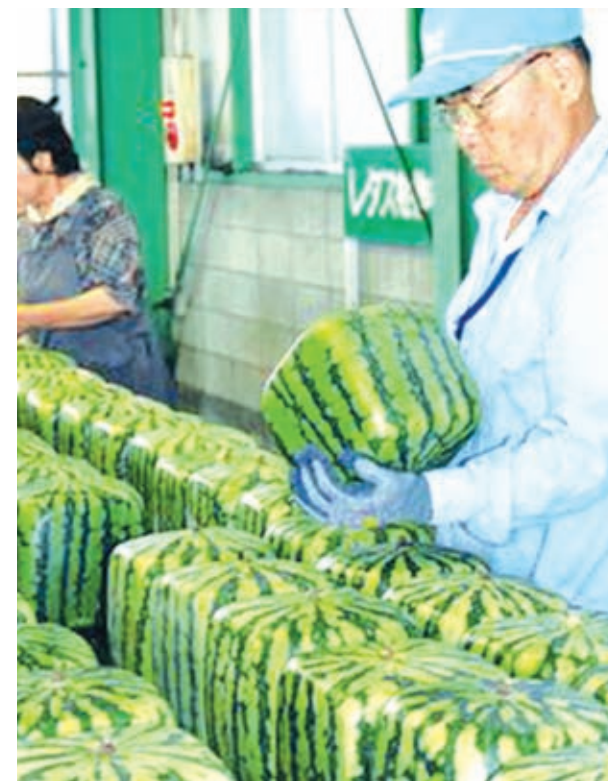
Ornamental watermelons known for their unusual square shape are inspected before being shipped on 25 June, 2014, in Zentsuji in western Japan's Kagawa Prefecture. The watermelons, which gain their cube shape from being grown in plastic containers, are priced at about 10,000 yen a piece at department stores and fruit stores.

A total of about 400 square watermelons produced by six farmers are scheduled to be distributed by mid-July. Production of the item began about 40 years ago.—Kyodo News