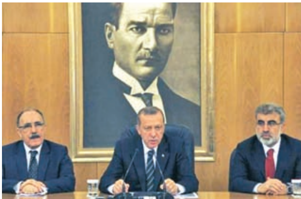
Turkey's Prime Minister Tayyip Erdogan, flanked by his deputy Besir Atalay (L) and Energy Minister Taner Yildiz (R), speaks during a news conference at Ataturk International airport in Istanbul on 4 April, 2014.

Erdogan initiated peace talks with jailed militant leader Abdullah Ocalan in 2012 to end a three-decade insurgency by his Kurdistan Workers Party (PKK) which has killed 40,000 people. Increased militant activity and street protests in re-