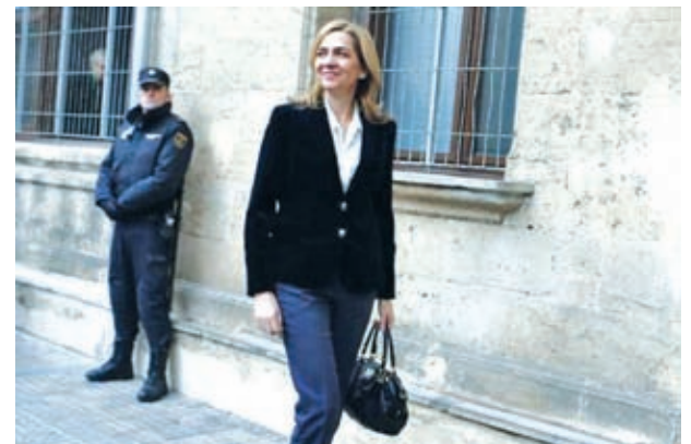
Spain's Princess Cristina, daughter of King Juan Carlos

MADRID, 25 June — A Spanish court said on Wednesday it had formalised charges against Cristina de Borbon, sister of newly-crowned King Felipe VI, and her husband in a corruption investigation, paving the way for a trial that could further damage the royal family.