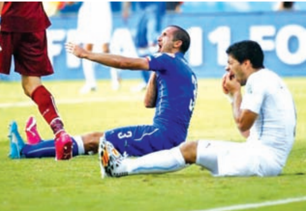
Uruguay's Luis Suarez (R) reacts after clashing with Italy's Giorgio Chiellini on 24 June, 2014.

SAO PAULO, 25 June — Uruguay forward Luis Suarez faces a lengthy ban after Italy defender Giorgio Chiellini accused him of biting during the South Americans' 1-0 Group D victory on Tuesday, overshadowing a day of emotional extremes at the World Cup.