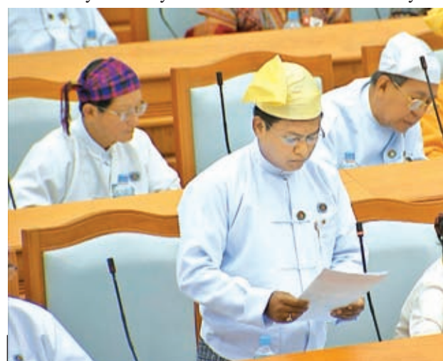
Fifth day session of 10 th Pyidaungsu Hluttaw in progress.