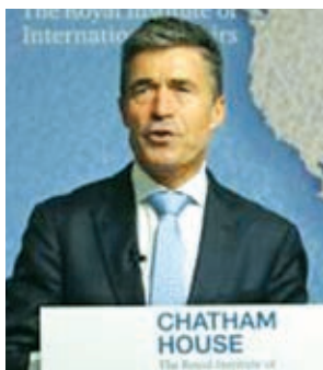
NATO Secretary-General Anders Fogh Rasmussen speaks at Chatham House in London on 19 June, 2014.

BRUSSELS, 25 June — NATO will draw up a "substantive package" of coop-