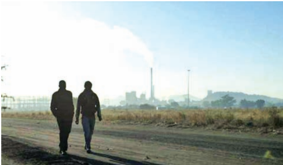
Workers walk past a Lonmin's Marikana platinum mine, on 24 June, 2014.

MARIKANA, (S Africa), 25 June — Thousands of South African mine workers returned to the Marikana operations of platinum producer Lonmin on Wednesday after wage deals were signed on Tuesday to end a five-month strike, the longest and most damaging in