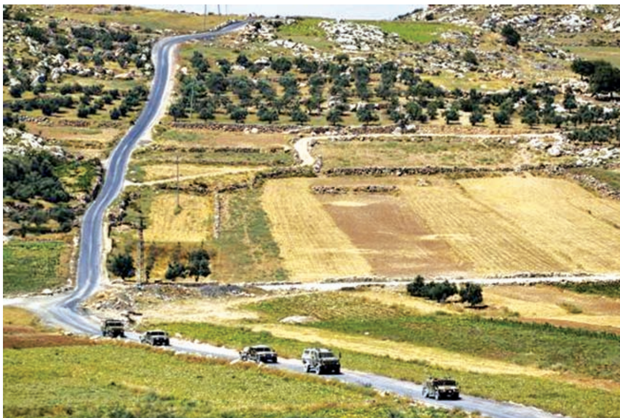
A convoy of Israeli military vehicles drives during an ongoing operation to locate three Israeli teens outside the West Bank City of Hebron on 17 June, 2014.

A Gaza hospital official said two policemen were wounded in one of the air strikes. Two militant rockets were shot down by Israel's Iron Dome interceptor system, another fell in an open area and two fell short and landed in Gaza, the army said.