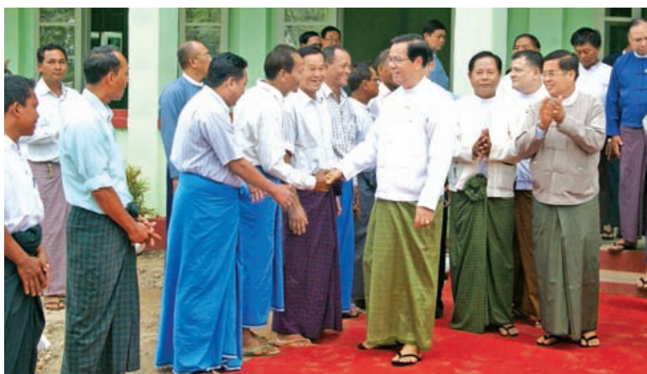
Union Minister U Hla Tun on his tour of Sagaing region where he said that locals living in the copper mine area must be given opportunities to improve their lives.

Union Minister U Hla Tun, Chairman of the Working Committee which is under the Investigation Commission for the controversial copper mine project, also visited No.6 Garment Factory in Salingyi which was established to create job opportunities in the project area. He said that the towns and villages in the Letpadaungtaung copper mine project area lacked