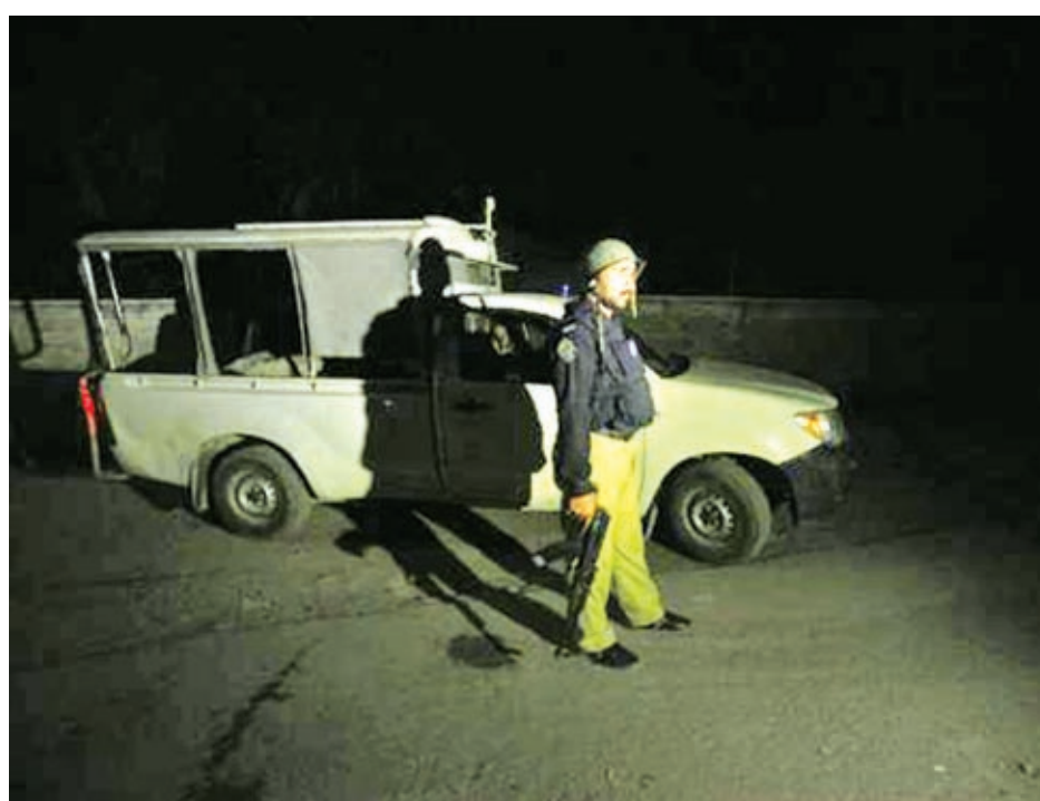
A policeman stands near Bacha Khan Airport in Peshawar early on 25 June, 2014.

"All the passengers were panicked. Some of