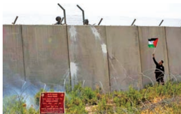
A protestor waves a Palestinian flag as Israeli border policemen watch over a section of the controversial Israeli barrier, during a protest in solidarity with hunger-striking Palestinian prisoners held by Israel, in the West Bank village of Bilin near Ramallah on 13 June, 2014.

The Israeli official said there was no change to the administrative detention policy, under which Palestinians suspected of security offences are jailed without trial to avoid any court proceedings that could expose sensitive intelligence information. The practice has drawn international criticism. Previous hunger strikes ended with some of the protesting inmates securing release from Israeli detention.