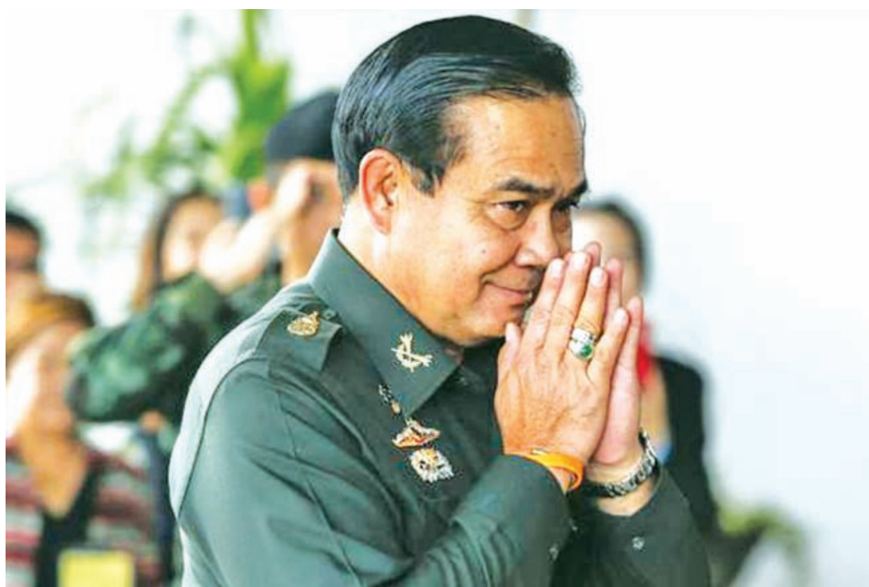
Thai Army chief General Prayuth Chan-ocha makes a gesture of greeting as he arrives ahead of a meeting to discuss the 2015 national budget at the Army Club in Bangkok on 13 June, 2014.