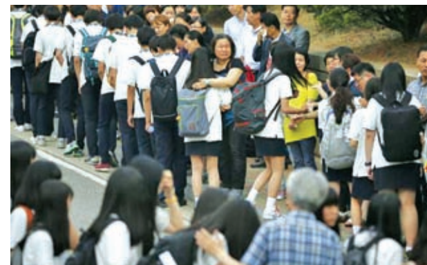
Relatives of the 16 April ferry disaster victims comfort students who survived the accident as they make their way back to school in Ansan on 25 June, 2014.

A massive manhunt has failed to capture the man seen as the effective owner of the company that operated the ferry. Yoo Byung-un is wanted on charges of embezzlement