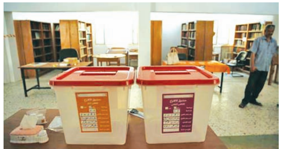
Ballot boxes wait for voters inside a school, ahead of elections tomorrow in Tripoli, on 24 June, 2014.

Western powers also worry that conflicts between