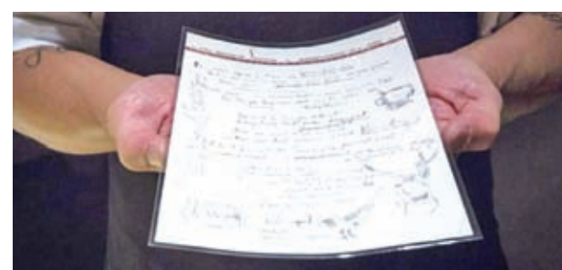
A Sotheby's employee shows the handwritten lyrics for Bob Dylan's 'Like a Rolling Stone' song that is part part of a collection from; 'A Rock and Roll History: Presley to Punk' at Sotheby's auction house in New York, 20 June, 2014.