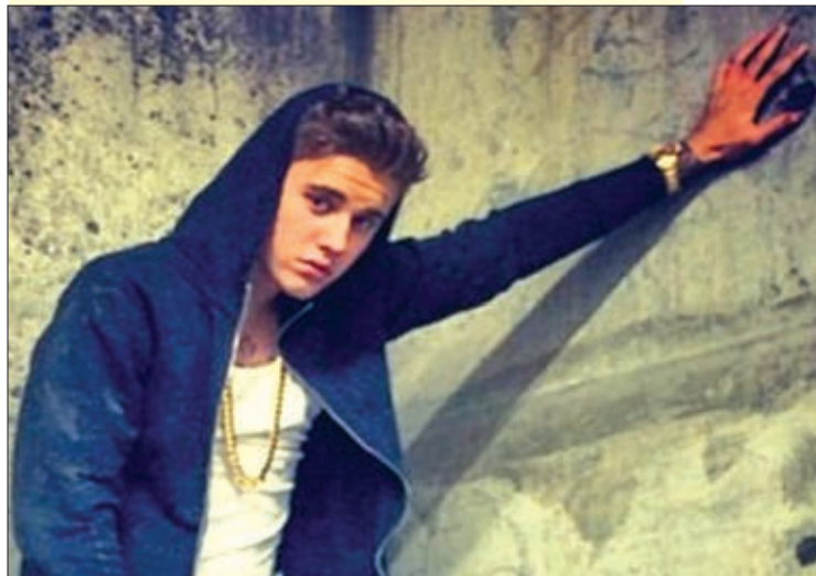
Justin Bieber moved in to the place earlier this month.

Bieber moved in to the place earlier this month. Since he moved in, police reportedly have been called twice due to the alleged problems with the neighbours.