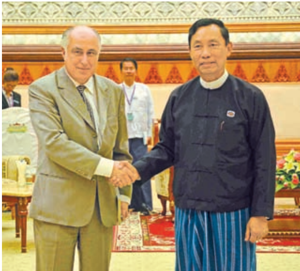
Speaker of Lower House Thura U Shwe Mann meets Brazilian Ambassador to Myanmar at Zabuthiri Hall of the Parliament.