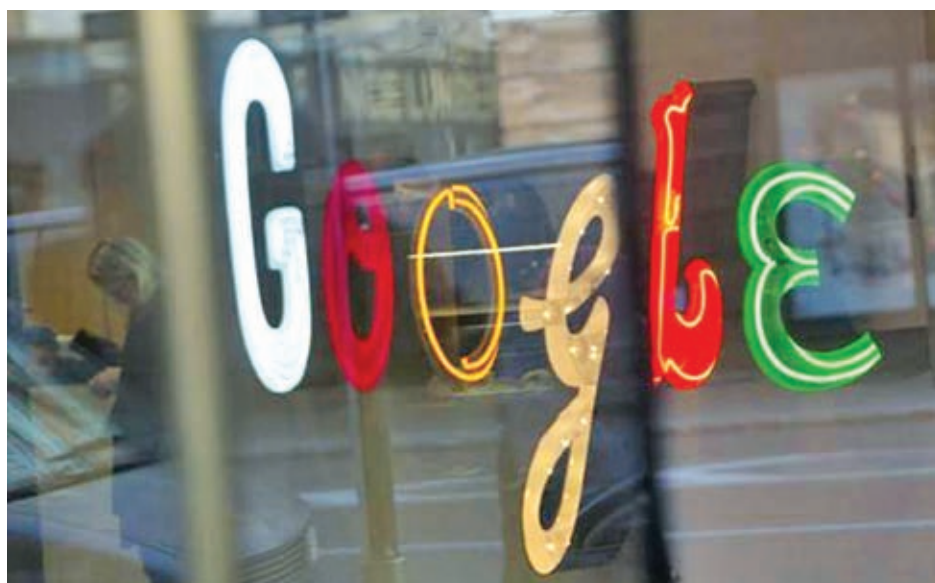
The Google signage is seen at the company's offices in New York on 8 Jan, 2013.