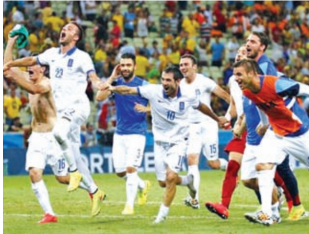
Greece's national soccer team players celebrate after their win over Ivory Coast during their 2014 World Cup Group C soccer match at the Castelao arena in Fortaleza on 24 June, 2014.