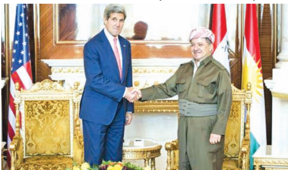
Kurdistan Regional Government President Massoud Barzani (R) greets US Secretary of State John Kerry at the presidential palace in Arbil, the capital of northern Iraq's Kurdistan autonomous region, on 24 June, 2014.

The figure includes unarmed government troops machine-gunned in mass graves by insurgents, as well as several reported incidents of prisoners killed in their cells by retreating