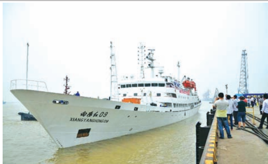
Xiangyanghong 09, carrier of Jiaolong, China's first manned deep-sea submersible, leaves for a voyage in the northwest Pacific Ocean at a port in Jiangyin City, east China's Jiangsu Province, on 25 June, 2014. During the 40-day voyage, Jiaolong will conduct research on cobalt-rich crusts in the ocean and is expected to return in August.

Tender Document shall be available during office hours commencing from 25 th June, 2014 at the Finance Department, Myanma Oil and Gas Enterprise, No (44) Complex, Nay Pyi Taw, Myanmar. Myanma Oil and Gas Enterprise Ph: +95 67 - 411097/411206