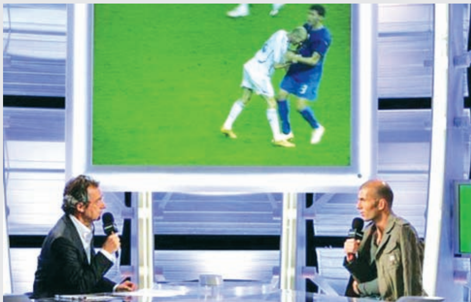
France's soccer team captain Zinedine Zidane (R) takes part in a television interview with journalist Michel Denisot (L) in Paris, on 12 July, 2006, in which he explained his head-butt on Italy defender Marco Materazzi during the on 9 July, 2006 final of the soccer World Cup.

in only one World Cup, in the United States in 1994, but he left an indelible mark on it. Tassotti elbowed Luis Enrique in the face during their quarter-final, breaking the Spaniard's nose. No penalty was given at the time and Italy won 2-1 but Tassotti was banned for eight matches after the incident was reviewed.