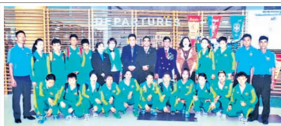
Myanmar women's hockey team seen off at Yangon International Airport on 19 June before departure for Singapore to take part in FIH World League Round 1 from 21 to 26 June.