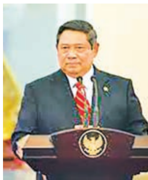
Indonesian President Susilo Bambang Yudhoyono

For sustainable growth, the Indonesian president said, it is also important to make appropriate choice of science and technology, tap