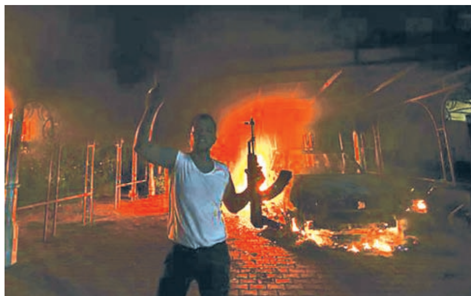
A protester reacts as the US Consulate in Benghazi is seen in flames during a protest by an armed group said to have been protesting a film being produced in the United States on 11 Sept, 2012.

TRIPOLI, 19 June — Libya condemned the United States on Wednesday for snatching a man suspected of masterminding the deadly 2012 attack on the US consulate in Benghazi, describing the arrest as a violation of Libyan sovereignty.