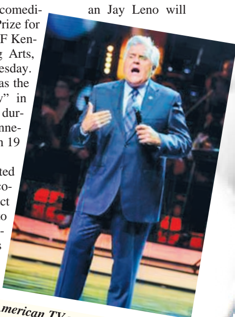
American TV personality Jay Leno hosts the Genesis Prize award-giving ceremony in Jerusalem on 22 May, 2014.

64, said in a statement in which he jokingly pretended to confuse Twain with the British novelist Charles Dickens. “I’m a big fan of Mark Twain’s. In fact, ‘A Tale of Two Cities’ is one of my favorite books!” Previous winners of the award include Billy Crystal, Tina Fey, Whoopi Goldberg and Lily Tomlin. Leno, who lives in Los Angeles, began his career touring clubs as a stand-up comedian, and continued to hit the road even after he helped make the “Tonight Show” the highest-rated late-night show on television for nearly two decades. The show is now hosted by Jimmy Fallon.—PTI