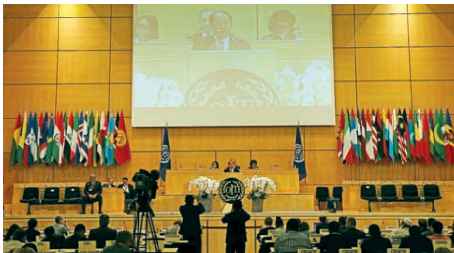
Union Minister U Aye Myint delivers a speech at 103 rd Session of International Labour Conference. —MNA

The union minister also attended the Asia-Pacific Labour Ministers' Meeting.