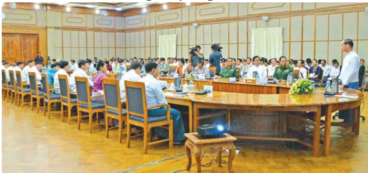
Vice President Dr Sai Mauk Kham speaking at the meeting on enhancement of health sector.