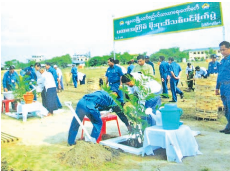
Monsoon tree growing ceremony in progress in Mandalay.