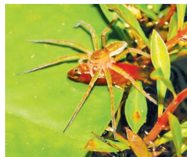
A fishing spider ( Dolomedes facetus ) is pictured with a captured fish (genus Xiphophorus ) in a garden pond in Brisbane, Australia in this undated handout photograph.

These so called semi-aquatic spiders typically dwell at the fringes of shallow freshwater