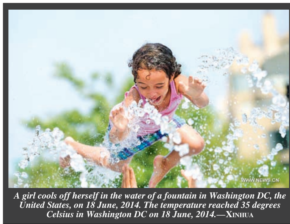
A girl cools off herself in the water of a fountain in Washington DC, the United States, on 18 June, 2014. The temperature reached 35 degrees Celsius in Washington DC on 18 June, 2014.