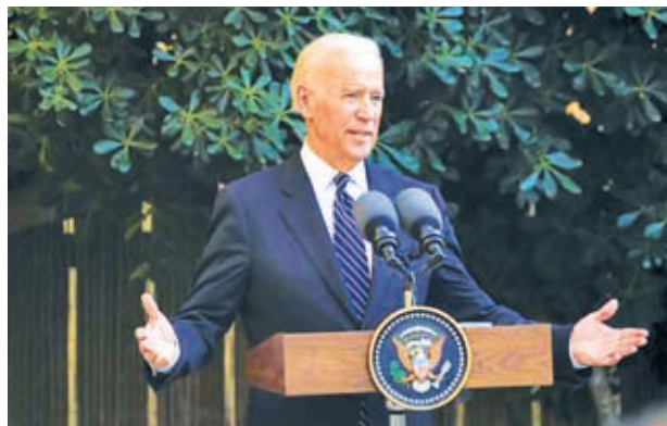
US Vice President Joe Biden delivers a speech at the UN-controlled buffer zone splitting Cyprus and its capital Nicosia on 22 May, 2014.

WASHINGTON, 19 June — US Vice President Joe Biden told Ukrainian President Petro Poroshenko on Wednesday the United States would work with its allies to “impose further costs on Russia” if Moscow failed to use its influence to stop separatist violence in eastern Ukraine, the White House said.