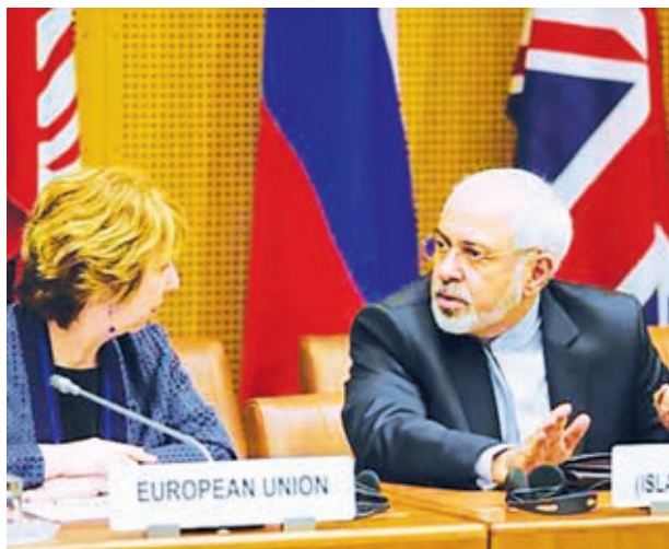
European Union Foreign Policy Chief Catherine Ashton (L) and Iranian Foreign Minister Mohammad Javad Zarif wait for the begin of talks in Vienna on 17 June, 2014.

The West demands that Iran dramatically lower its