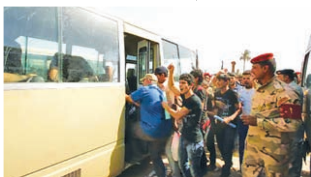
Volunteers, who have joined the Iraqi army to fight against the predominantly Sunni militants from the radical Islamic State of Iraq and the Levant (ISIL) who have taken over Mosul and other northern provinces, prepare to board a bus in Baghdad, on 19 June, 2014.