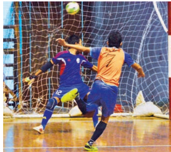
Players of YVC and Joker clubs power in attacking each other to kick the ball into the net.

The MFF Ooredoo Cup Futsal tournament reached the quarterfinals at the National Indoor Stadium-1 in Thuwunna of Yangon on Thursday.