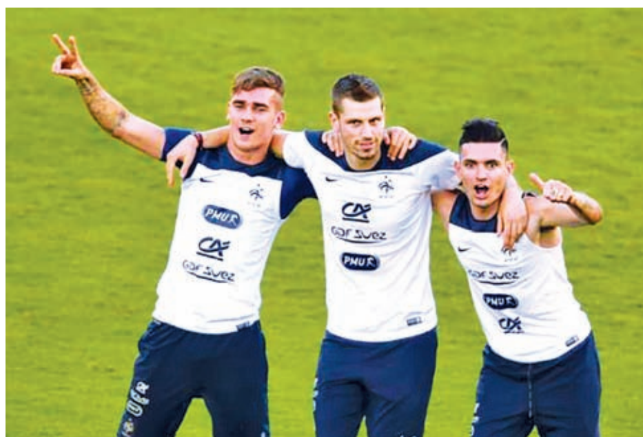
France's national soccer team players Antoine Griezmann (L) Morgan Schneiderlin (C) and Remy Cabella react during a training session at the Botafogo soccer club's Santa Cruz stadium in Ribeirao Preto, 336 km (208 miles) northwest of Sao Paulo, on 17 June, 2014.

With World Cup goals flying in across Brazil and Benzema looking in fine fettle, fans descending on Salvador's Fonte Nova arena might well expect another goal fest, although a quick look at recent encounters suggests otherwise.