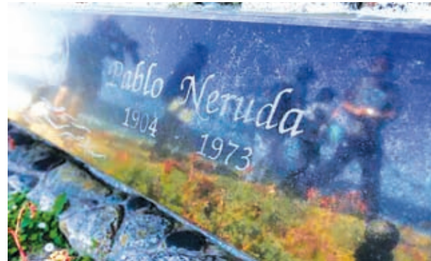
A view of the tombstone of Chilean poet and Nobel laureate Pablo Neruda inside the grounds of his house-museum before the exhumation of his remains in the coastal town of Isla Negra, about 106 km (66 miles) northwest of Santiago on 7 April, 2013.