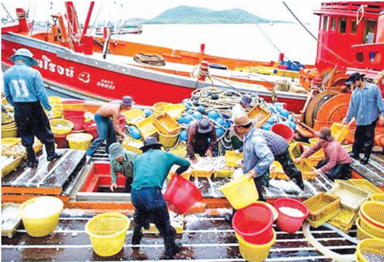
Myanmar workers in Thailand are to seek employment legally and to learn rights and responsibilities for them so as to ensure safe and secure working environment.

According to Myanmar's Foreign Affairs Ministry, Myanmar's ambassador to Thailand held talks with high ranking officials from the Thai junta, which calls itself the National Council for Peace and Order, on 6 and 14 June over recent reports of crack-