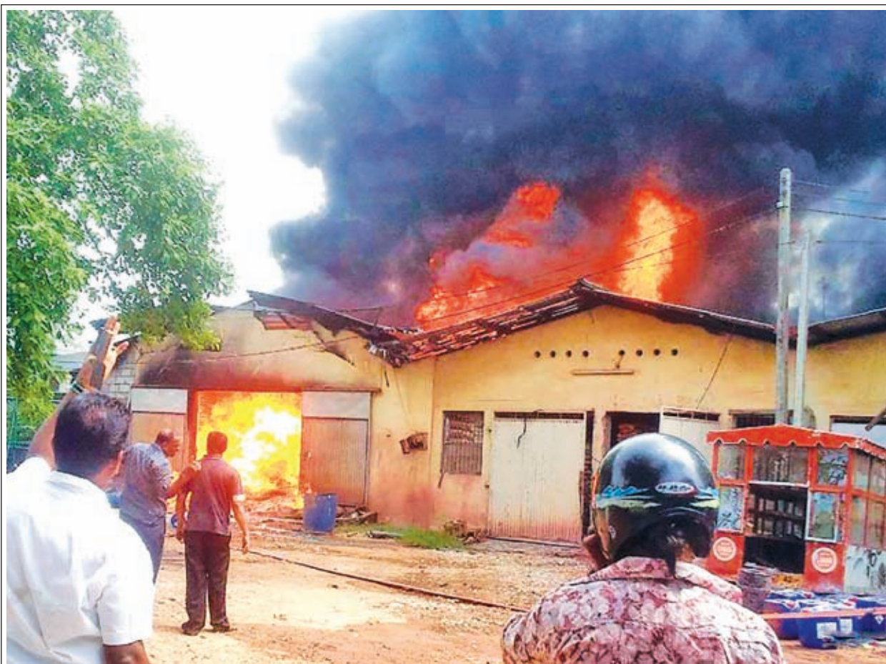
Firemen try to put out the fire at a chemical storage facility in Colombo, capital of Sri Lanka, on 18 June, 2014.