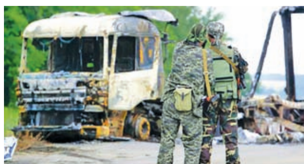
Pro-Russian separatists stand guard at a checkpoint near a burnt truck outside Luhansk, on 18 June, 2014.

said heavy fighting broke out at around 4 am near the town of Krasny Liman, which has been under government control since early this month, and that separatists in the area appeared to have tried to break through a cordon of government troops.