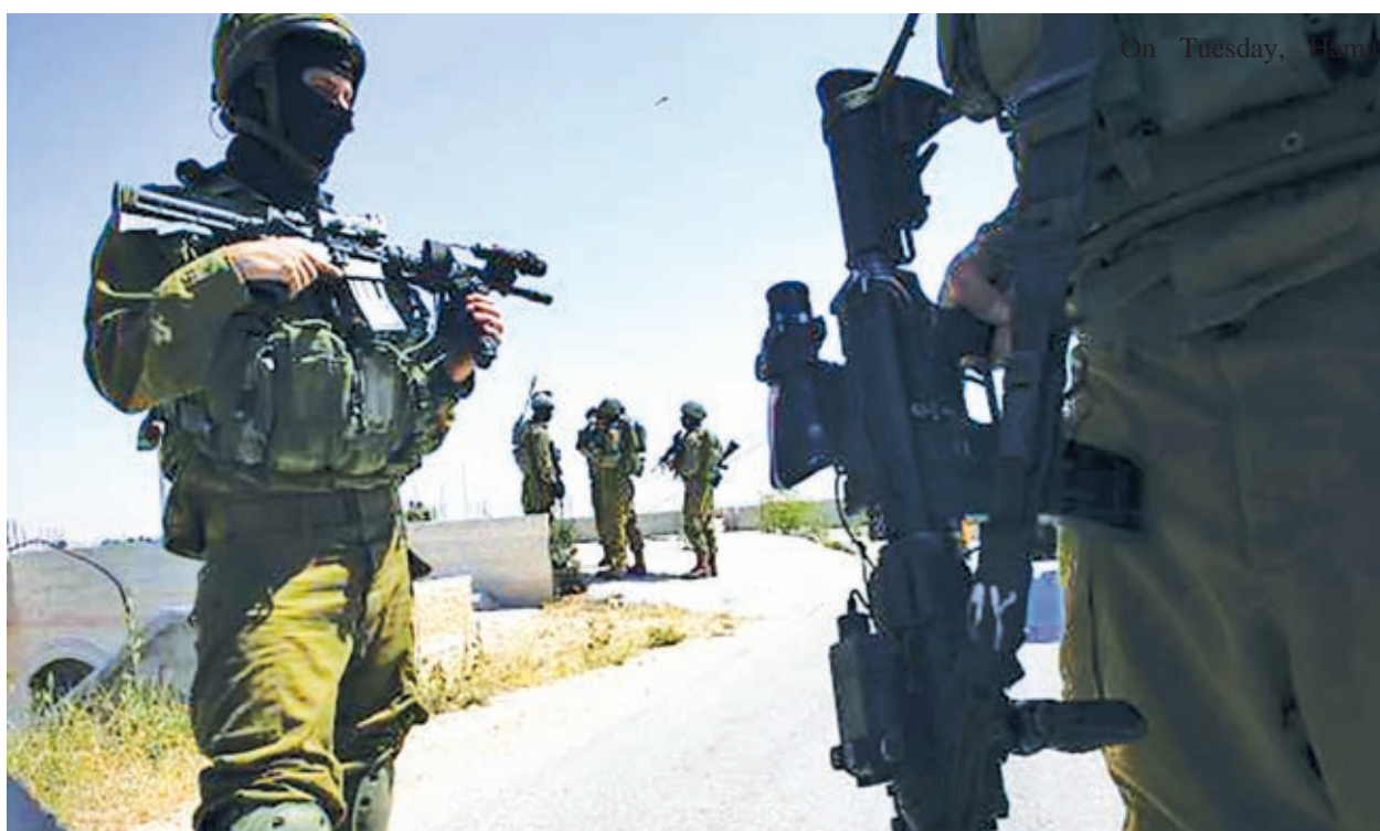
Israeli soldiers patrol during operation to locate three missing teenagers, in the West Bank city of Hebron on 18 June, 2014.

Western-backed Palestinian President Mahmoud Abbas roundly condemned the kidnappers on Wednesday and promised to hold to account those responsible. His words in turn were denounced by Hamas and other factions, who accused him of betraying the national cause.—Reuters