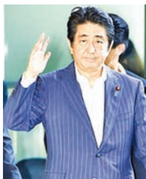
Prime Minister Shinzo Abe enters the premier’s office in Tokyo on 19 June, 2014, for talks with the New Komeito party leader Natsuo Yamaguchi to break the stalemate over talks related to Japan’s use of the right to collective self-defence.

The leaders of the two ruling parties, meeting at the prime minister’s office, agreed that the Liberal Democratic Party and its junior coalition partner after the Diet session will continue talks on exercising the right, which would enable the Self-Defence Forces to come to the defence of Japan’s allies un-