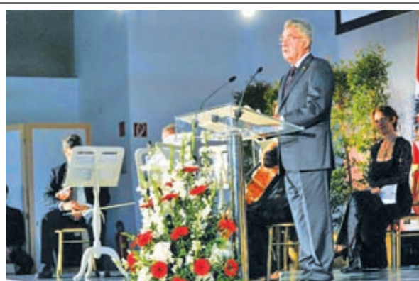
Austrian President Heinz Fischer addresses an commemoration ceremony to mark the 100th anniversary of the World War I at National Library in Vienna on 18 June, 2014.

Later that month and in 2013, a military team dedicated to recovering the bodies of service members missing in action conducted recovery operations at the site.—Reuters