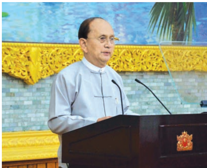
President U Thein Sein delivers speech at the meeting on health promotion at Union Government Office. MNA

NAY PYI TAW, 19 June—It is necessary to speed up the momentum in the health care sector in tandem with a rapid acceleration in political,