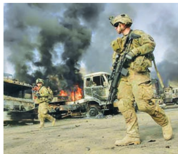
NATO troops walk near burning NATO supply trucks after, what police officials say, was an attack by militants in the Torkham area near the Pakistani-Afghan in Nangarhar Province on 19 June, 2014.