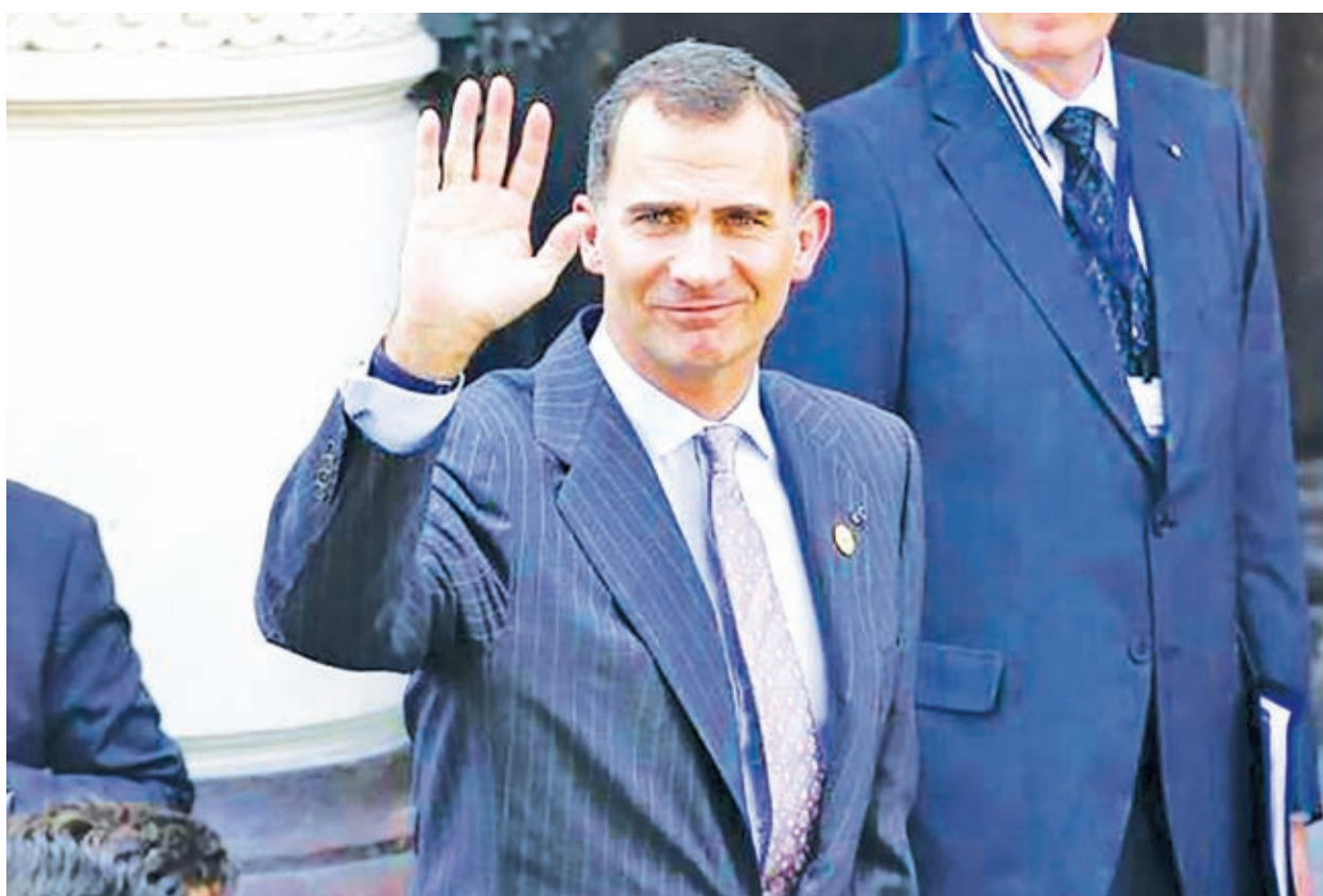
Spain's Crown Prince Felipe waves to the media before a meeting with Chile's President-elect Michelle Bachelet (not pictured) in Santiago, on 10 March, 2014. Bachelet will take office as Chile's president on Tuesday.

Hopes for the new king are high, and some believe that, despite his role being mainly symbolic as head of state, he will use his position to push dialogue over the challenge of a separatist movement in wealthy