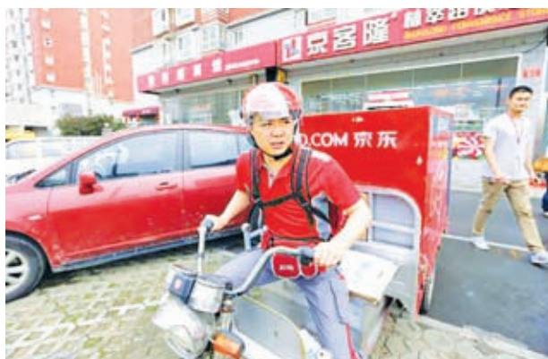
Richard Liu, CEO and founder of China's e-commerce company JD.com, rides an electric tricycle as he leaves a delivery station to deliver goods for customers to celebrate the anniversary of the founding of the company, in Beijing, on 16 June, 2014.

That sets it apart from Alibaba, which still depends on China's often unreliable postal infrastructure to get goods to its customers' doors as it accounts for about 80 percent of all e-commerce in China.