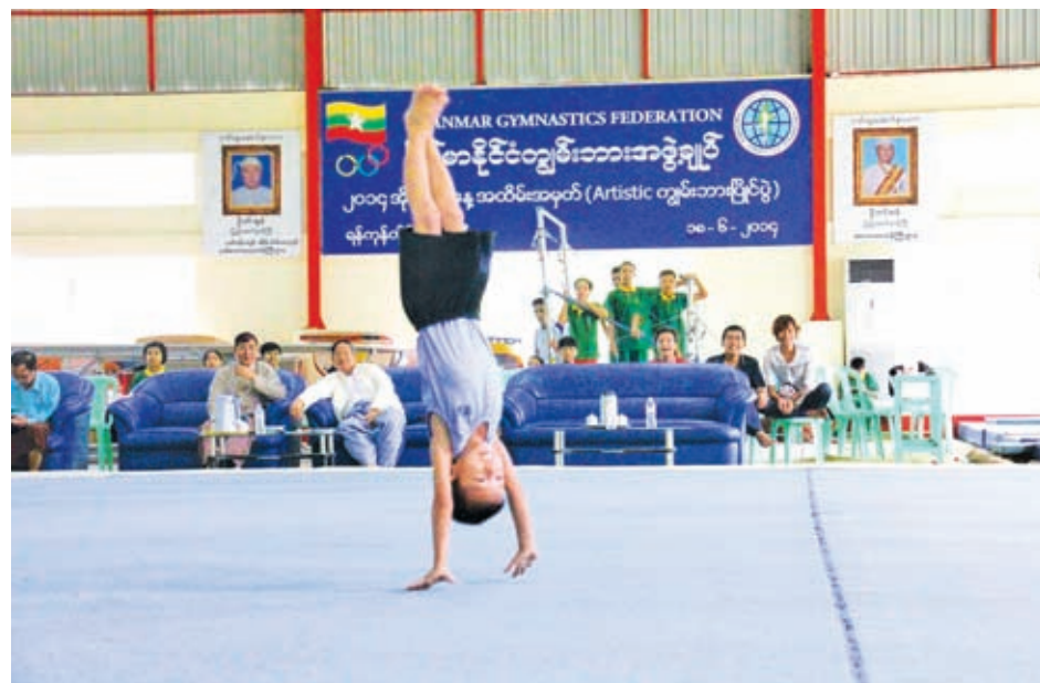
A child athlete show his skills in gymnastics in Artistic gymnastic contest.

The contest was categorized as the floor exercises, pommel horse and vault events for the men's youth selected players, the balance beam, vault and floor exercise events for the women's youth selected players, the floor exercises and pommel horse events