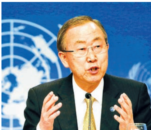
UN Secretary-General Ban Ki-moon

GENEVA, 19 June — UN Secretary-General Ban Ki-moon on Wednesday said that the global youth unemployment situation is intolerable, particularly for young women. “Employment and decent work show up in every discussion and every poll as critical to successful and sustainable development, yet we are facing a great test of our time — an epidemic of youth unemployment,” Ban said in a speech at the 103rd International Labour Conference held