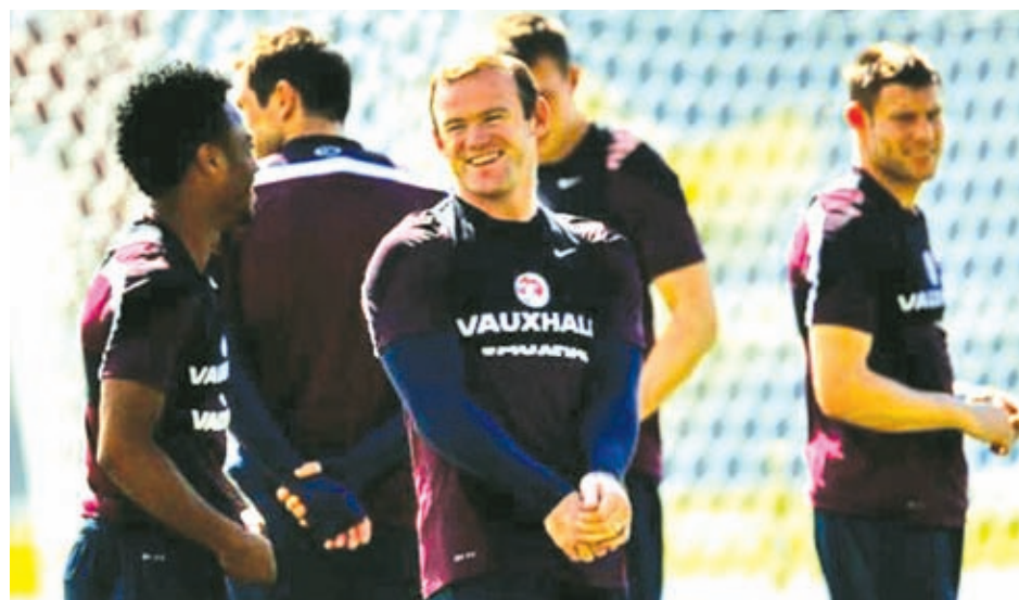
England's Wayne Rooney (C) talks with Raheem Sterling (L) during a training session at the 2014 World Cup in Rio de Janeiro on 16 June, 2014.

Like England, Uruguay must recover from an opening loss but there were few