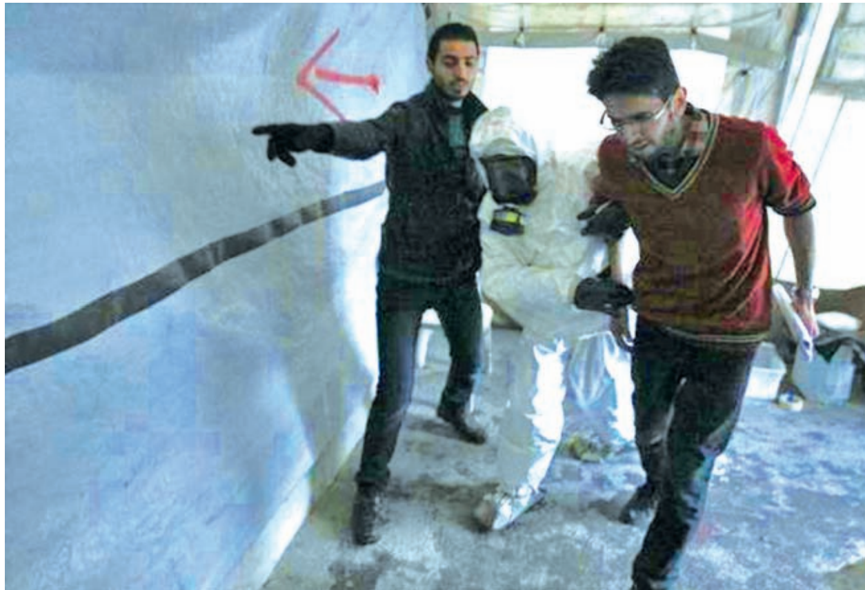
A Free Syrian Army medical group conducts a training on how to cope with chemical weapons attacks in Aleppo on 25 Dec, 2013.

"The information that was available to the fact-finding mission lends credence to the view that toxic chemicals — most likely pulmonary irritating agents, such as chlorine —