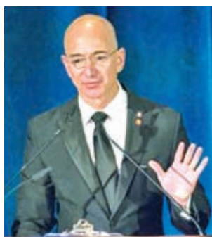
Amazon CEO and Chairman Jeff Bezos

But its introduction reflects how smartphones and tablets are fast becoming how many consumers