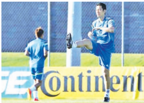
Japan's national soccer team player Maya Yoshida takes part in the training session at Japan's team base camp in the town of Itu north-west of Sao Paulo on 17 June, 2014.

NATAL, (Brazil), 18 June — After losing their Group C openers, Japan and Greece will be looking to rediscover the qualities which got them to Brazil as they bid to keep their campaigns alive at the Dunas arena on Thursday.