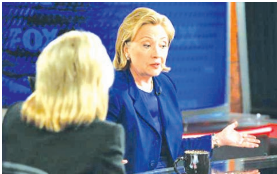
Former US Secretary of State Hillary Clinton (R) sits for an interview with Greta Van Susteren (L) at the FOX News Channel studio in Washington on 17 June, 2014.

Clinton said it was not clear whether arming moderates in Syria would have prevented the rise of the al-Qaeda splinter group, the Islamic State of Iraq and the Levant, which has swept toward Baghdad