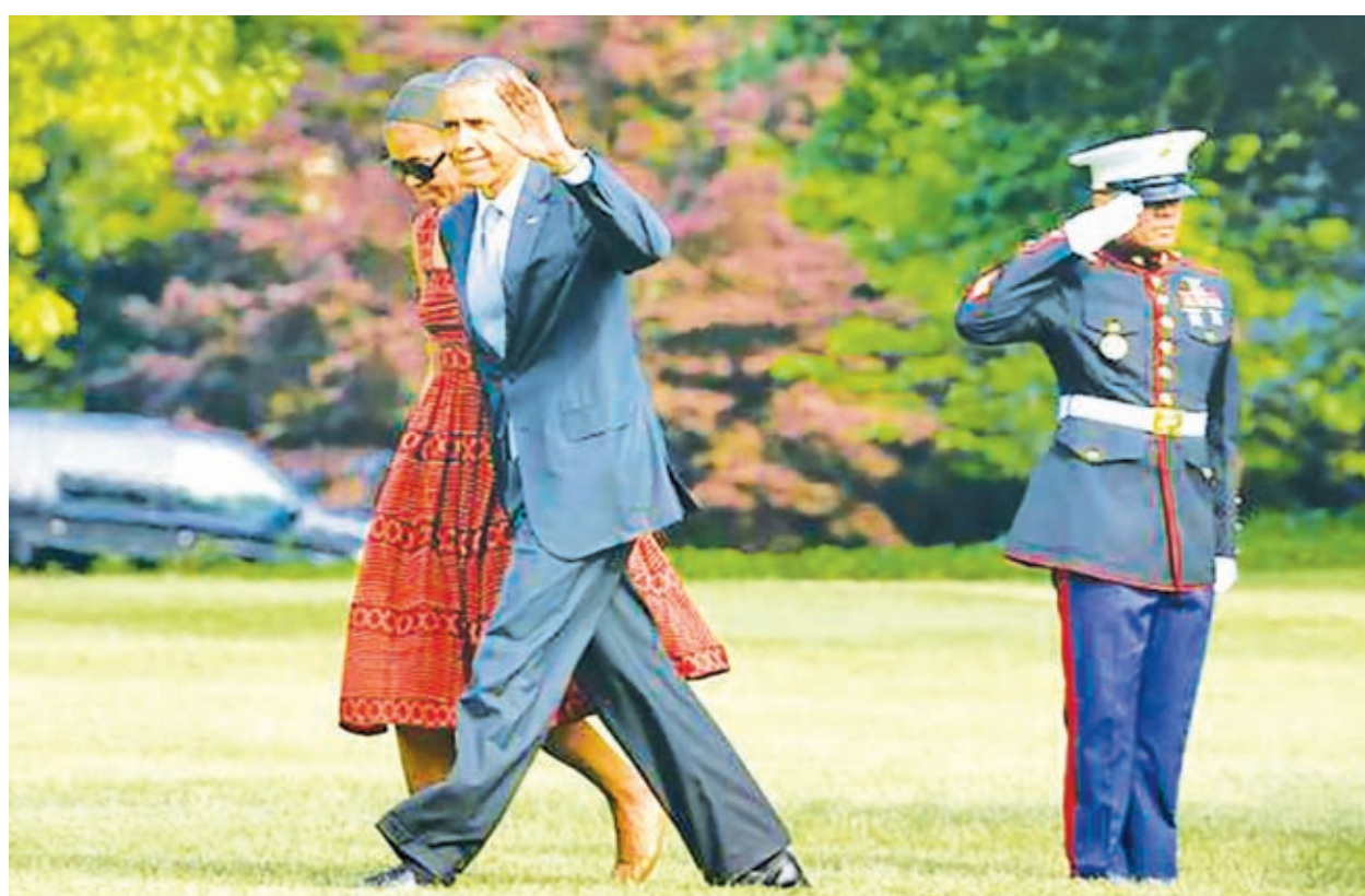
US President Barack Obama and first lady Michelle Obama arrive via Marine One helicopter at the White House in Washington on 16 June, 2014.

The president's plan would expand the Pacific Remote Islands Marine National Monument from its current area of 87,000 square miles and would affect seven islands and atolls controlled by the United States.