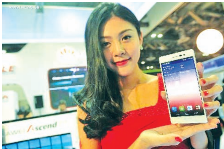
A model poses for photos with the latest mobile phone Ascend P7 from Huawei at the CommunicAsia exhibition held in Singapore's Marina Bay Sands Expo, on 17 June, 2014. The CommunicAsia and BroadcastAsia kicked off at the Marina Bay Sands Expo on Tuesday.

SINGAPORE, 18 June — China-based telecommunications giant Huawei is expecting better sales for its latest flagship smart phone Ascend P7, compared with its precursor Ascend P6, senior executives of the company said here on Tuesday.