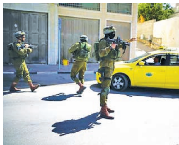
Israeli soldiers take part in an operation to locate three Israeli teens in the West Bank City of Hebron on 17 June, 2014.

But the official, who spoke to Reuters on condition of anonymity, denied Israeli and Palestinian me-