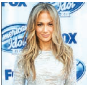
Jennifer Lopez recently split up from boyfriend Casper Smart.

LOS ANGELES, 18 June — Pop star Jennifer Lopez, who recently split up from boyfriend Casper Smart, says she feels refreshed and has a new-found confidence about her career. The 44-year-old singer, a mother of two, broke up with Smart after two and a half years of dating, but she is coping very well, reported Billboard magazine. "I don't feel like I have anything to prove anymore. Things have changed so much for me. I had to really do some soul searching and just realise a lot of things about love, and now I feel like I come from a place where I'm stronger and, I think, better," Lopez said.