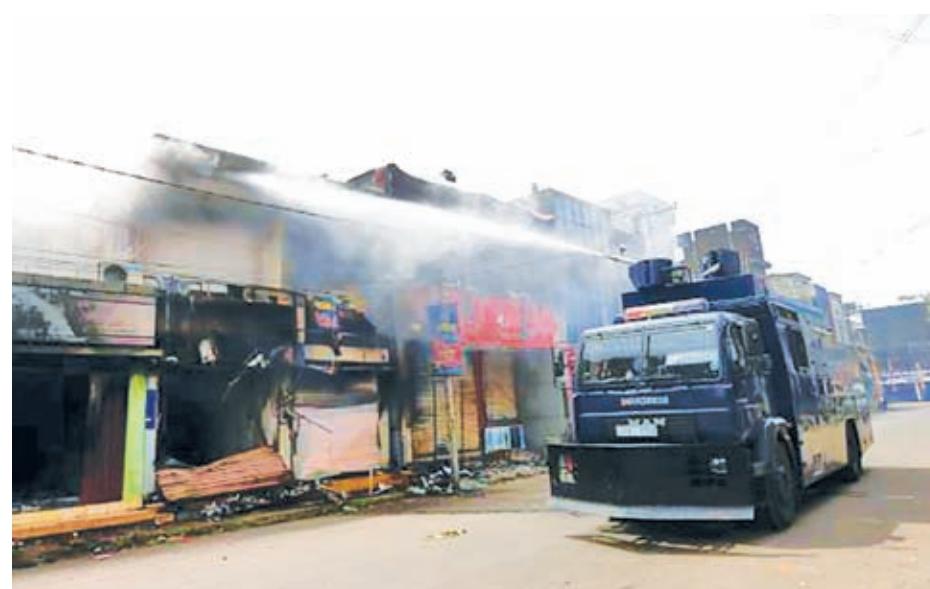
A police vehicle sprays water from a water cannon on a burnt shop after a clash between Buddhists and Muslims in Aluthgama on 16 June, 2014.

"Security forces have a duty to protect the right