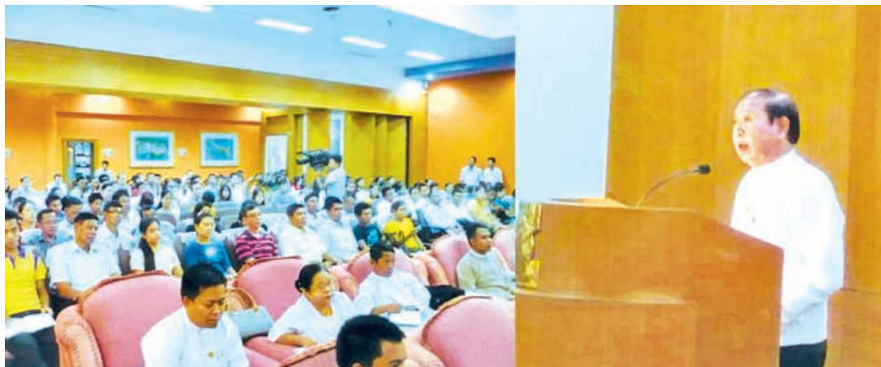
employees from Mingaladon, Yangon and Pynmabin industrial zones.—MNA