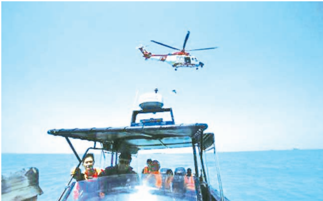
A Malaysia Maritime helicopter is seen in the air during a search and rescue for the suspected illegal Indonesian immigrants, off Malaysia's western coast, outside Kuala Lumpur on 18 June, 2014.

KUALA LANGAT, (Malaysia), 18 June — An overloaded boat carrying suspected illegal Indonesian immigrants sank as it left Malaysia's west coast early on Wednesday, and at least three passengers drowned and 34 were missing.