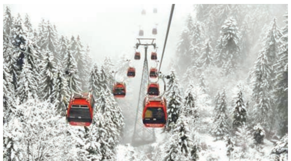
Gondolas travel through the snow covered woods along the Streif, the men’s Alpine skiing downhill course at the Hahnenkamm mountain of the Austrian Alpine skiing resort of Kitzbuehel on 22 Jan, 2014.