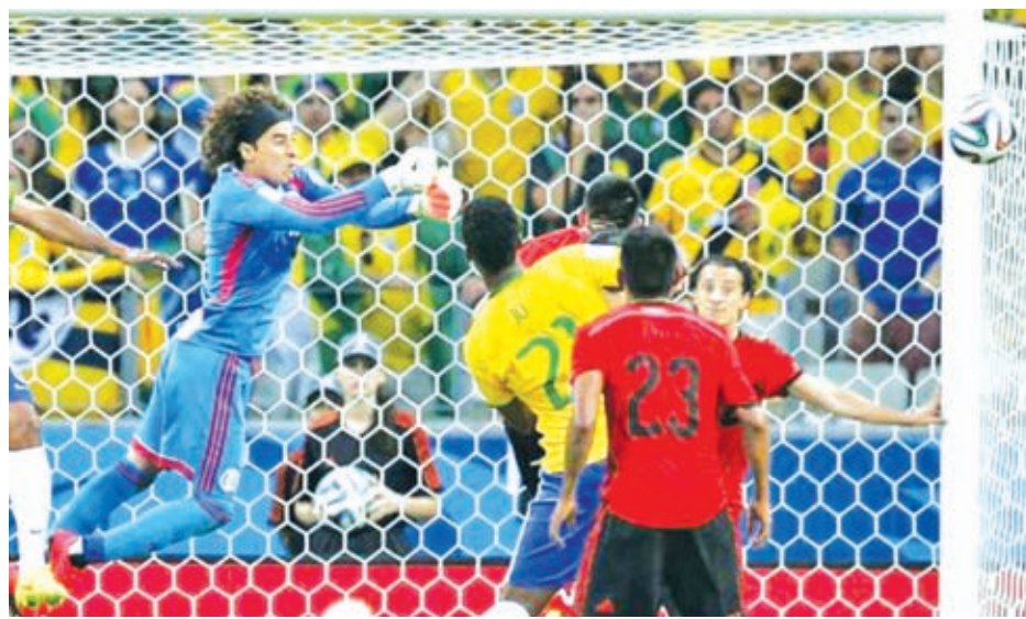
Mexico's goalkeeper Guillermo Ochoa makes a save during the 2014 World Cup Group A soccer match between Brazil and Mexico at the Castelao arena in Fortaleza on 17 June, 2014.

In the Group H clash in Cuiaba, Akinfeev's blushes on 68 minutes were spared when veteran Alexander Kerzhakov pounced to equalise for Russia after more scrappy goalkeeping by Jung Sung-ryong six minutes later. Much-fancied Belgium were made to work hard for a 2-1 win over Algeria in Belo Horizonte after the North Africans took a shock lead with a Sofiane Feghouli penalty in the 25th minute.—Reuters