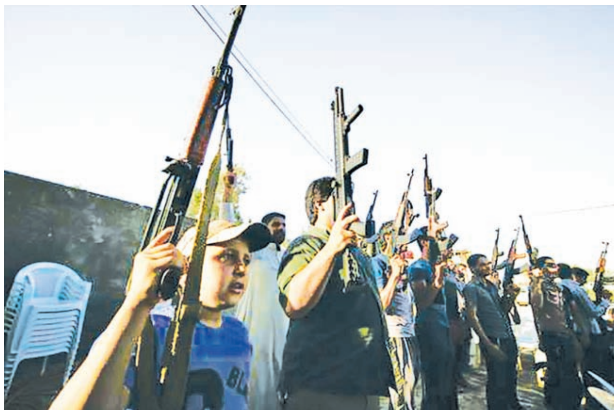
Tribal fighters hold up their weapons as they shout slogans in support of Iraqi security forces in Kerbala on 17 June, 2014.

represent any sect or religion," Jaafari said in the address, which included a broad promise of "reviewing the previous course" of Iraqi politics. Afterwards, most of the leaders, including Maliki and Usama al-Nujaifi, the leading Sunni present, walked away from each other in silence.