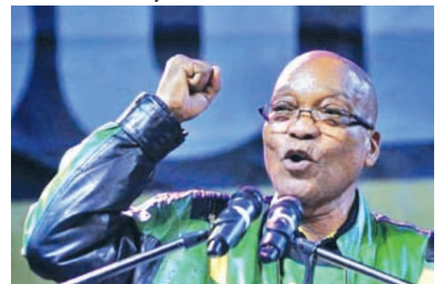
President Jacob Zuma

been further strained by a cold snap at the start of the southern hemisphere winter and outages at some power generation units, which led to temporary rolling blackouts to prevent the already stretched national grid from collapsing. "Much of the debate wants to hear an address that does not 'waffle' about policy but promises to 'get things done'. But if that is all we hear, we are likely to remain stuck where we are," said Friedman. Zuma's address to parliament in Cape Town is due to start at 1700 GMT.—Reuters