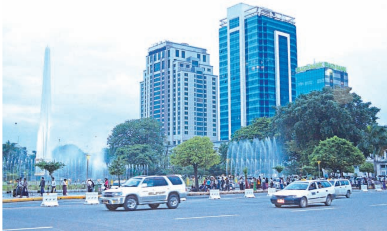
Traffic going around Maha Bandoola Park in downtown Yangon of Myanmar where economic growth can be seen at 8.5 per cent in the current fiscal year, according to IMF statement.