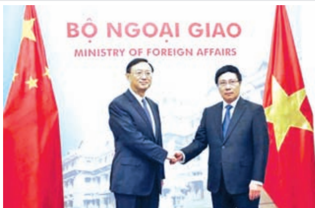
Chinese State Councilor Yang Jiechi (L) shakes hands with Vietnamese Foreign Minister Pham Binh Minh at the Government’s Guesthouse, in Hanoi on 18 June, 2014.

Among the challenges likely to come up in talks: The continued pres-