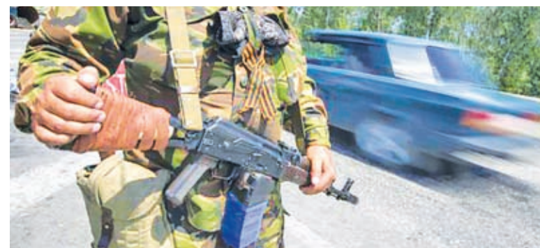
An armed pro-Russian separatist with attached orange ribbon of St George, a symbol widely associated with pro-Russian protests in Ukraine, stands guard at a road check point outside the eastern Ukrainian city of Luhansk on 8 June, 2014.

Moscow, 18 June — Russian President Vladimir Putin and his Ukrainian counterpart, Petro Poroshenko, discussed a possible ceasefire in eastern Ukraine and the deaths of two Russian journalists there in a late night telephone conversation, the Kremlin said. The conversation "touched on the theme of a possible ceasefire in the area of military action in southeastern Ukraine", the Kremlin said in a statement.