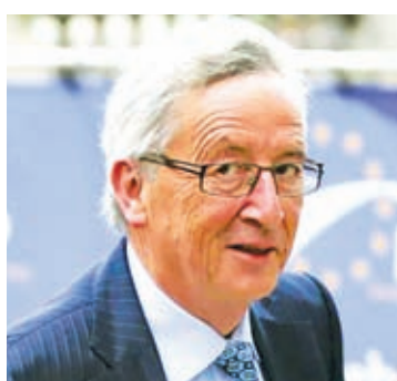
Candidate for the European Commission presidency Jean-Claude Juncker arrives at an European People's Party (EPP) meeting in Brussels, ahead of an informal dinner of EU leaders on 27 May, 2014.

"I do not think he is the right candidate but it is conceivable, for the wrong reasons, that Europe might elect the wrong