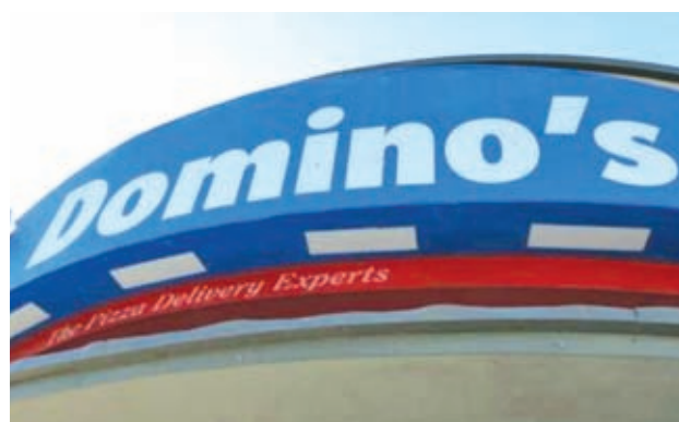
Signage at a Domino's pizza restaurant is pictured in Burbank, California on 16 Oct, 2012.