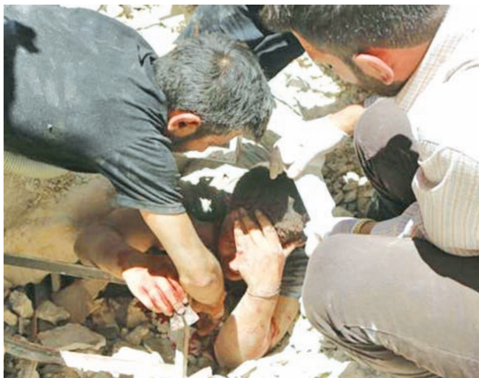
A man tries to pull a casualty from under the rubble of collapsed buildings at a site hit by what activists said was a barrel bomb dropped by forces loyal to Syria's President Bashar al-Assad in Aleppo's district of al-Sukari on 16 June, 2014.

BEIRUT, 17 June — At least 25 people were killed in barrel bomb attacks