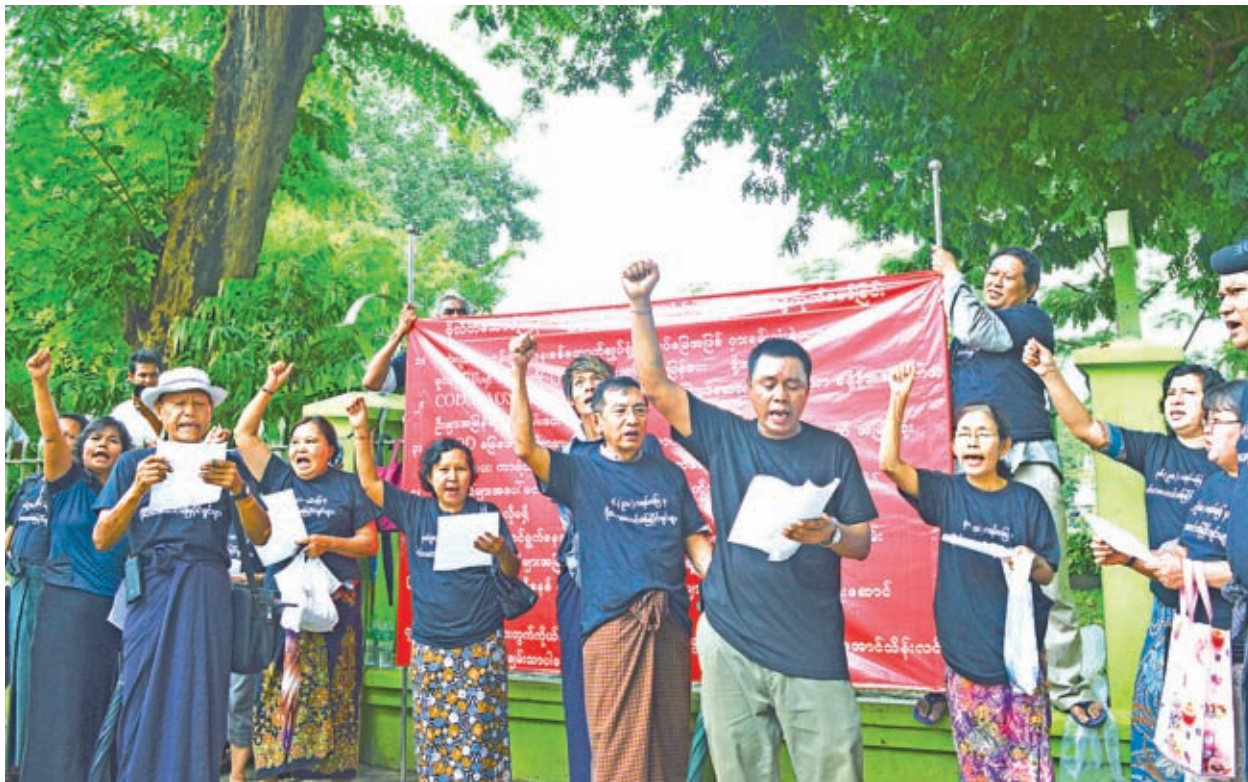
Protestors have demanded of Development Human Settlement and Housing Department to give their land back or to pay cost for their land at street value.