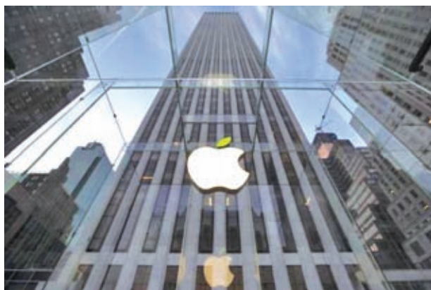
The leaf on the Apple symbol is tinted green at the Apple flagship store on 5th Ave in New York on 22 April, 2014.

The Cupertino, California-based maker of the iPhone, the world's biggest public company by market capitalization, has adopted a slew of green policies such as expanded product recycling and using solar power at its data centers. For managers who have made it a favorite of the largest "green"