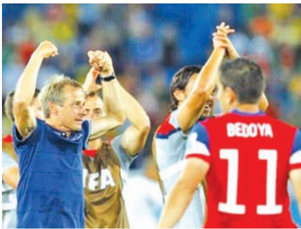
US coach Juergen Klinsmann (L) celebrates their win against Ghana after their 2014 World Cup Group G soccer match at the Dunas arena in Natal on 16 June, 2014.