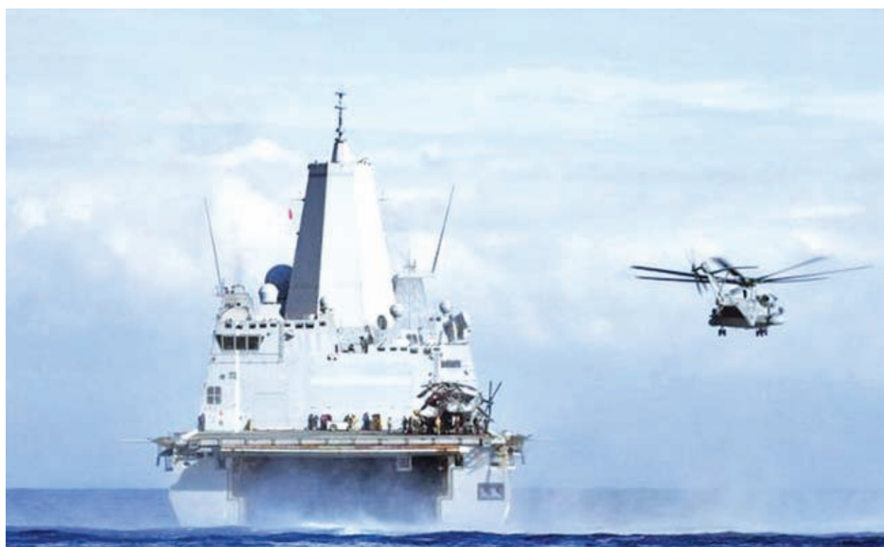
A CH-53 Sea Stallion helicopter launches from the amphibious transport dock ship USS Mesa Verde during preparations for a field exercise in the Mediterranean Sea in this US Navy picture taken on 24 Oct, 2011.

The fighters have been joined by other armed Sunni groups that oppose what they say is oppression by Maliki. The UN human rights chief said forces allied with ISIL had almost certainly committed war