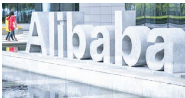
People walk at the headquarters of Alibaba in Hangzhou, Zhejiang Province, on 23 April, 2014.

BEIJING, 17 June — Alibaba Group Holding IPO-ALIB.N revealed the members of its powerful 27-person partnership and board on Monday, while disclosing that the Chinese e-commerce giant's growth has slowed from the red-hot pace of recent quarters.