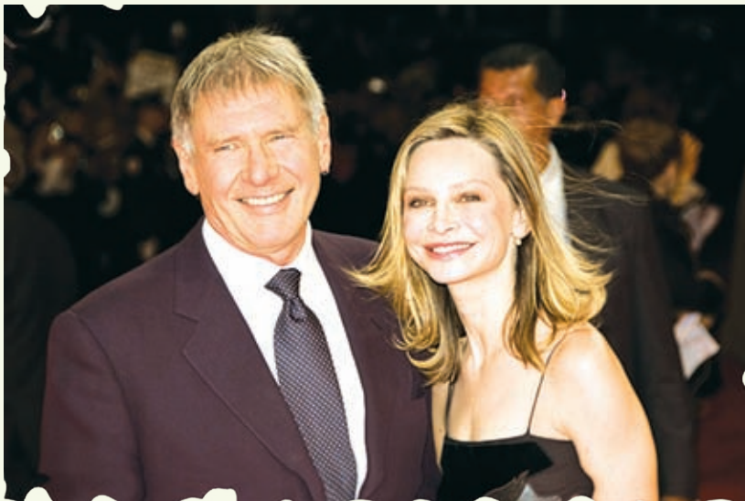
Actor and producer Harrison Ford and actress Calista Flockhart