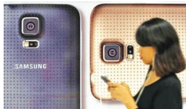
A commuter uses her mobile phone as she walks past a Samsung Galaxy mobile phone advertisement at a train station in Singapore on 23 May, 2014.

Europe had led the competition in GSM technology — the original standard for mobile networks — in the 1990s, but fell behind the Unit-