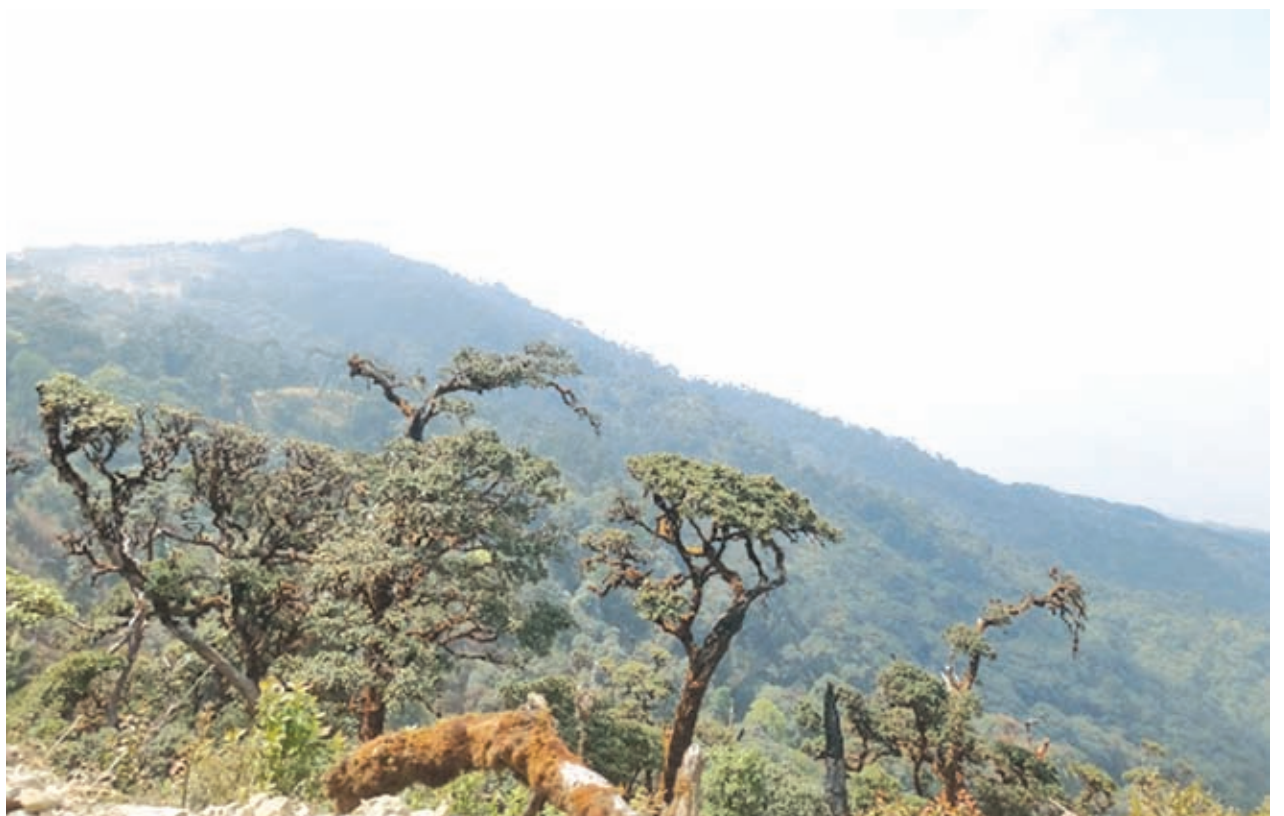
A scenic beauty of Natma Taung National Park in Kanpetlet Township in Chin State.