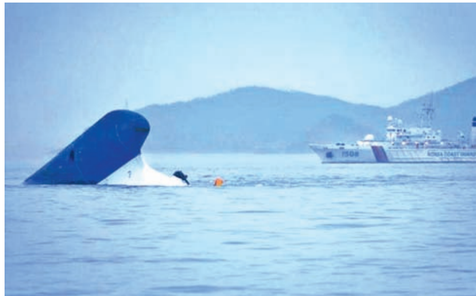
A Coast Guard ship passes near the upturned South Korean ferry “Sewol” in the sea off Jindo on 16 April, 2014.

However, the Kenyan government has on various occasions credited ATPU with thwarting dozens of terrorist plots and arresting suspects in an ostensibly robust counter-terrorism response.