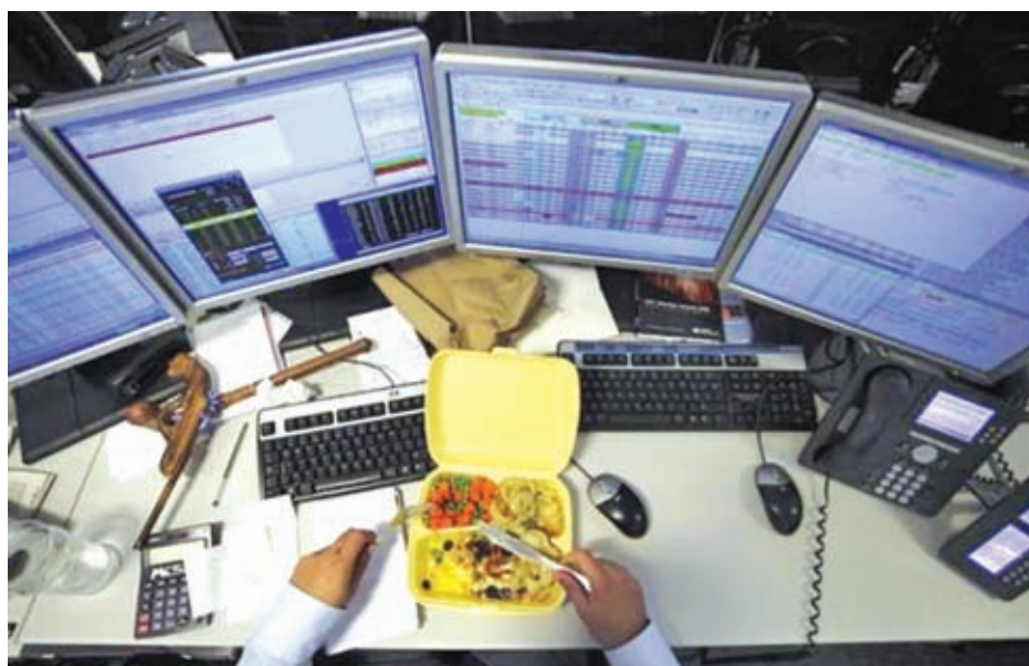
A dealer eats his lunch as he monitors his screens on the trading floor of IG Index in London on 6 May, 2010.

People staring at screens also tend to open