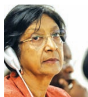
UN High Commissioner for Human Rights Navi Pillay looks on after her address to the 26th session of the Human Rights Council at the United Nations in Geneva on 10 June, 2014.

GENEVA, 17 June — Forces allied with the Islamic State of Iraq and the Levant (ISIL) have almost certainly committed war crimes by executing hundreds of non-combatant men in Iraq, the UN human rights chief said on Monday.