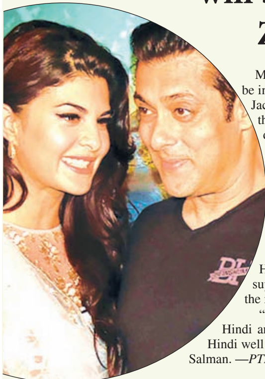
Salman and Jacqueline at the trailer launch of Kick

MUMBAI, 17 June — Salman Khan seems to be in awe of his co-star and Sri Lankan beauty Jacqueline Fernandez and says that she has the calibre to attain the same status in film-dom that 1970s glamour girl Zeenat Aman did.