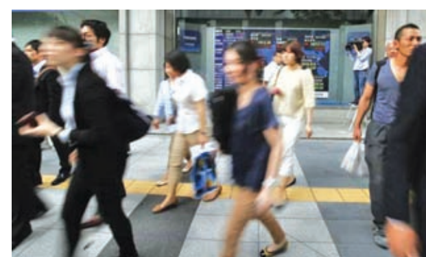
Pedestrians walk past at an electronic board showing the stock market indices of various countries outside a brokerage in Tokyo on 2 June, 2014.

Tension in Ukraine showed no sign of abating as Russia cut off gas to Ukraine on Monday in a dispute over unpaid bills that could disrupt supplies to the rest of Europe and set back hopes for peace between the former Soviet neighbours. As investor risk sentiment was hit, flight-to-quality bids underpinned US Treasuries prices despite solid US industrial output data on