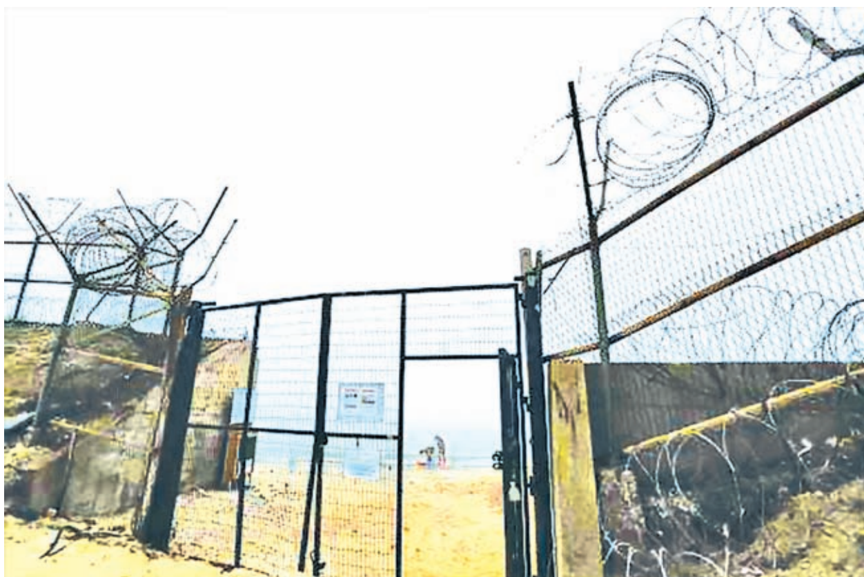
Residents wash seaweed in the sea on a beach on the island of Baengnyeong, which lies on the South Korean side of the Northern Limit Line (NLL) in the Yellow Sea in this on 13 April, 2014 file photograph.

North Korea doesn't recognize the NLL. The line is not recognized internationally, either. North Korea warships and fishing boats routinely sail over the line, which commands strategic sea lanes into the industrial heartland of both Koreas. This has led to a