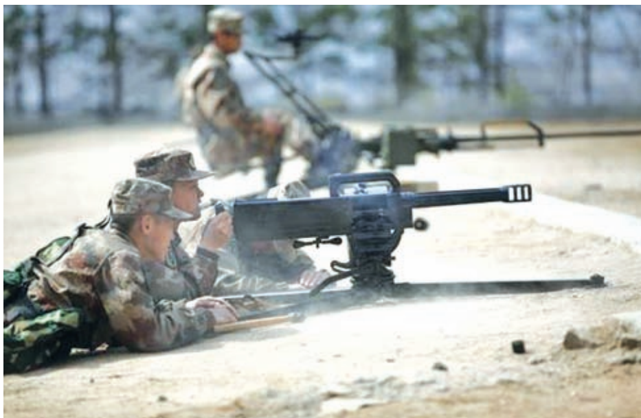
People's Liberation Army (PLA) soldiers fire weapons during training in Heihe, Heilongjiang Province, on 14 April, 2014.

After that, the two sides began talking about joint fishing areas in a “West Coast Peace Zone”, which was eventually agreed at an inter-Korean summit in October 2007. The pact unravelled, however, in a fire storm of protest by conservative lawmakers in the South and was never implemented. The election of a conservative government in the South the following year and North Korea's leadership succession have marked a steady worsening of ties. In one of the worst incidents since the Korean War, North Korea lobbed 170 shells at Yeonpyeong Island in November 2010, about half of them landing on civilian and military targets. Two civilians and two South Korean soldiers were killed. Only days before, North Korea revealed to a visiting American scholar a vast new uranium enrichment facility. Over the next three years, North Korea embarked on a series of long-range missile and nuclear tests. On 30 March of this year, Pyongyang publicly announced it would not rule out “a new form of nuclear test.” Analysts speculated that could mean a nuclear warhead capable of being carried by a ballistic missile.— Reuters