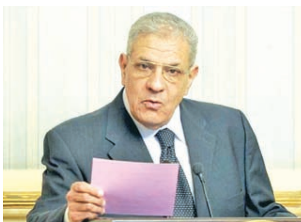
Egypt's Prime Minister Ibrahim Mahlab talks during a news conference at the presidential palace in Cairo, on 2 March, 2014.

Trying to project a sense of urgency and purpose in the new government's mission, the early-rising former military president had summoned the ministers to a palace in northern Cairo at 6 am for a ceremony that began promptly, an hour later.