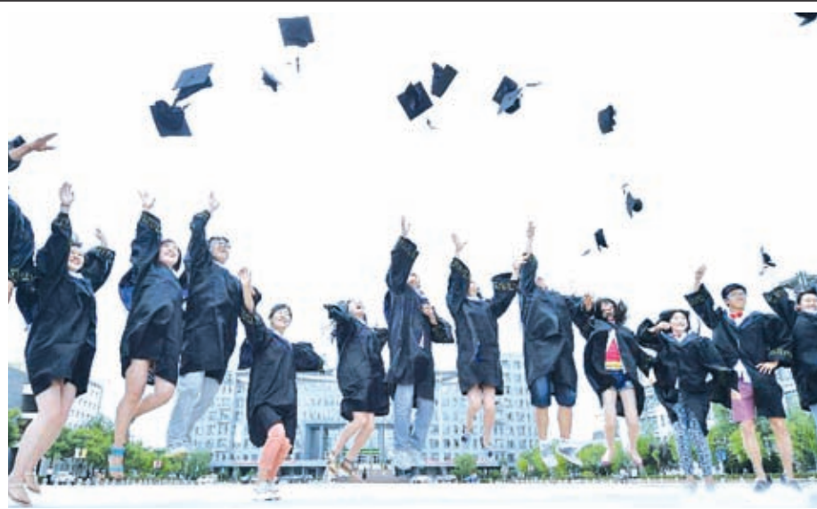
Graduates of Ningxia Medical University jump for graduation photos on the campus in Yinchuan, capital of northwest China's Ningxia Hui Autonomous Region, on 16 June, 2014. As annual college graduation season comes, graduates are busy with having photos taken on campus as a memento.

China may not be represented at the 2014 FIFA World Cup, but Chinese have nevertheless been burning the midnight oil to watch games broadcast from midnight to 6 am Beijing Time. — Xinhua