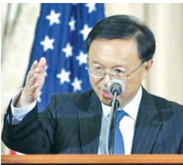
China's State Councilor Yang Jiechi makes remarks during the Ecopartnership event of the US-China Strategic and Economic Dialogue (S&ED) at the State Department in Washington on 11 July 2013.—REUTERS

BEIJING, 17 June — China's top diplomat will visit Vietnam this week, China's Foreign Ministry said on Tuesday, amid an increasingly ugly spat over a Chinese oil rig in the disputed South China Sea.