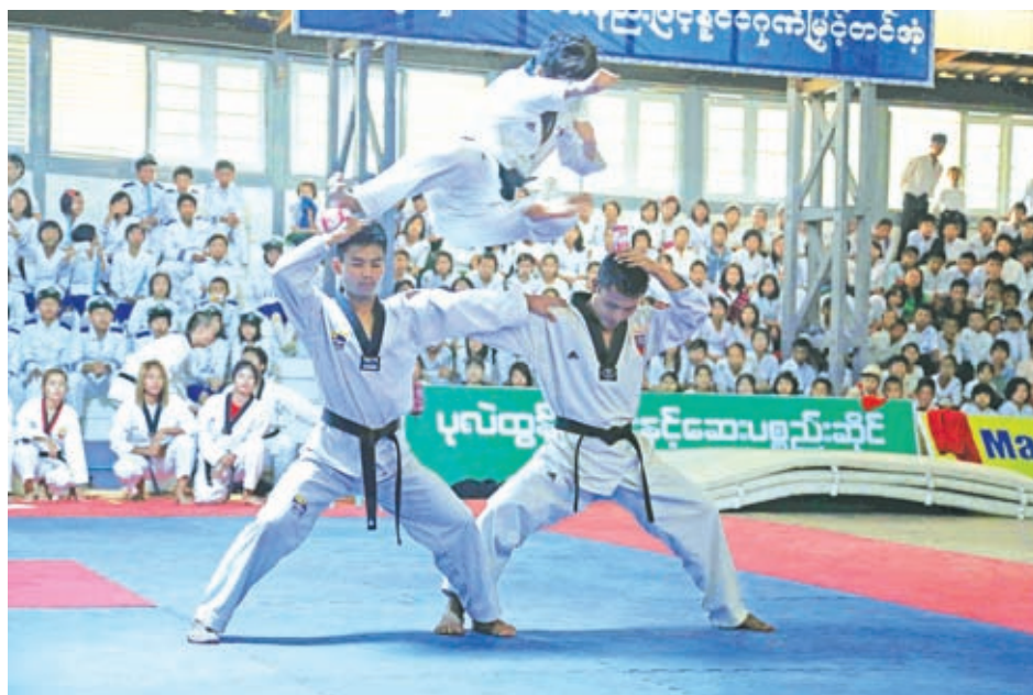
Athletes show off their skills in Kayah State Chief Minister's Cup Inter-State/Region Taekwondo Tournament.