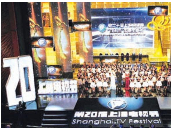
The 20th Shanghai TV Festival ended in Shanghai, China on 13 June, 2014.