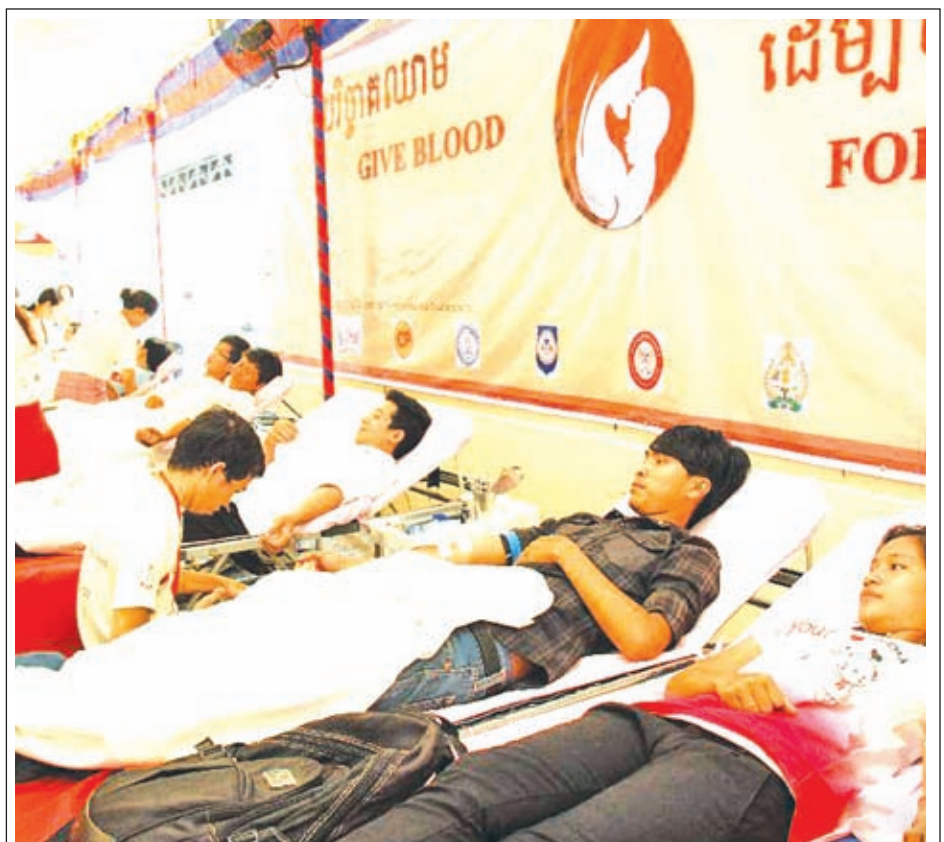
People donate blood in Phnom Penh, Cambodia, on 14 June, 2014. The World Blood Donor Day is observed on 14 June every year in Cambodia to raise the awareness about safe blood and to thank the voluntary blood donors.

Tender Document shall be available during office hours commencing from 13 th June, 2014 at the Finance Department, Myanma Oil and Gas Enterprise, No (44) Complex, Nay Pyi Taw, Myanmar. Myanma Oil and Gas Enterprise Ph: +95 67 - 411097/411206