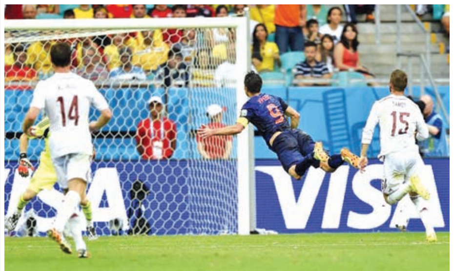
Paced by their talismen Arjen Robben and Robin van Persie, Netherlands notched a stunning 5-1 victory against Spain in the Group B opener here on Friday in what was a rematch of the 2010 World Cup final in South Africa.