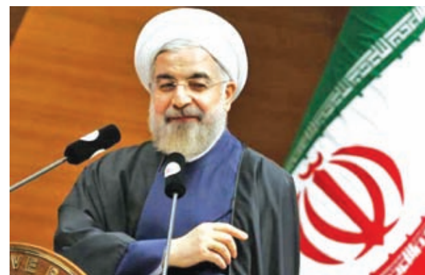
Iran's President Hassan Rouhani addresses the audience during a meeting in Ankara on 10 June, 2014.

ANKARA, 14 June — Iran stands ready to help Iraq's government in its fight against Sunni Muslim insurgents within the framework of international law, although Baghdad has so far not requested assistance, President Hassan Rouhani said on Saturday.