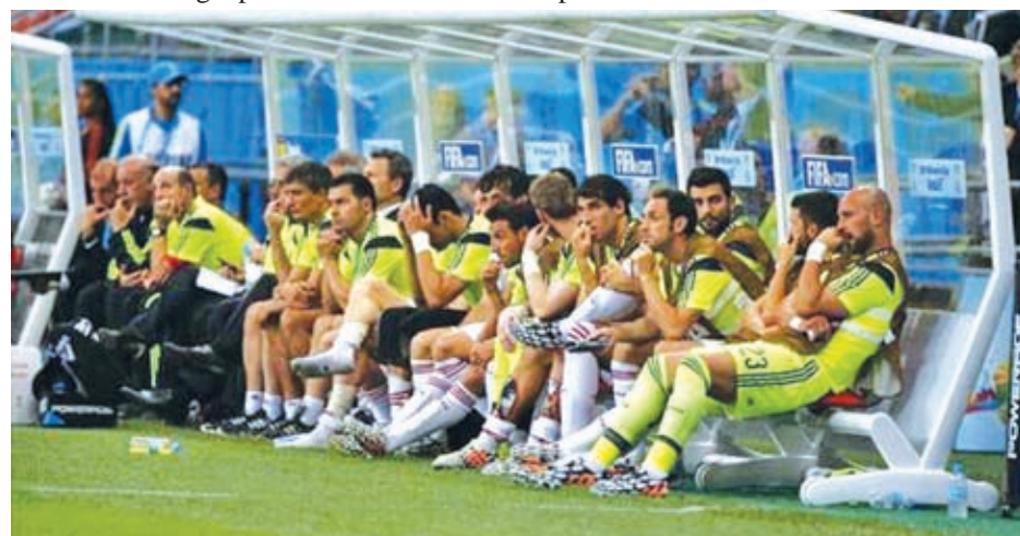
Spain's players react on the bench during their 2014 World Cup Group B soccer match against the Netherlands at the Fonte Nova arena in Salvador on 13 June, 2014.