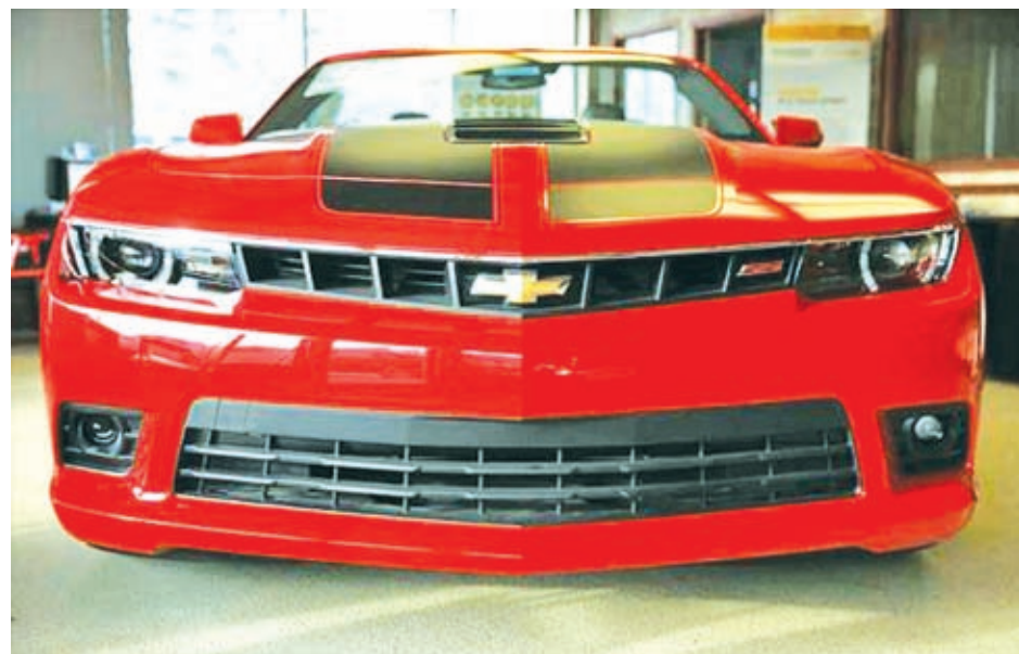
A 2014 Chevrolet Camaro is pictured in Thurmont, Maryland on 6 Feb, 2014.