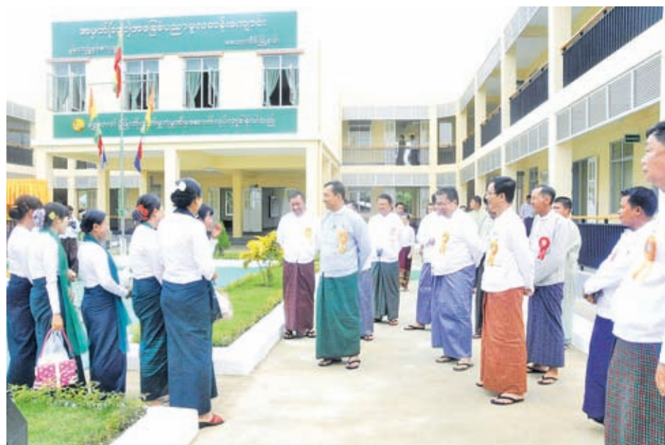
Speaker of Pyidaungsu Hluttaw Thura U Shwe Mann meets teachers at Zeyathiri BEPS No 131.

NAY PYI TAW, 14 June—Outstanding students and teachers were honoured with a ceremony in Zeyathiri township here on Saturday morning, with an address by Thura U Shwe Mann, Speaker of the Pyidaungsu Hluttaw and the Lower House, officials said.