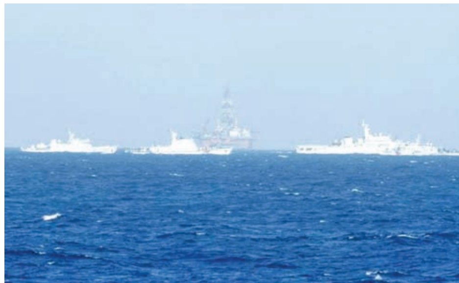
Chinese oil rig Haiyang Shi You 981 is seen surrounded by ships of China Coast Guard in the South China Sea, about 210 km (130 miles) off shore of Vietnam on 14 May, 2014.