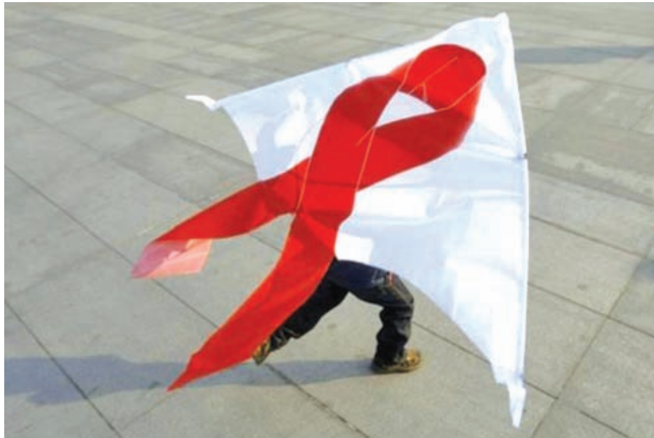
A child flies a kite with a red ribbon during a World AIDS Day event in Beijing on 30 Nov, 2008.

De Paula expected the programme to conduct