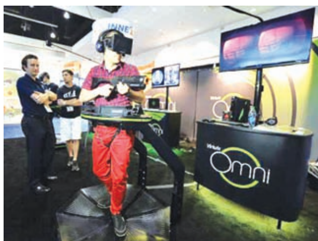
An attendee tries out the Virtuix Oculus Rift and Omni Treadmill game at the 2014 Electronic Entertainment Expo, known as E3, in Los Angeles, on 11 June, 2014.

LOS ANGELES, 14 June — In 2013, Oculus VR's booth at Electronic Entertainment Expo, the gaming industry's biggest annual convention, was relegated to a far corner of the show-floor near the restrooms.