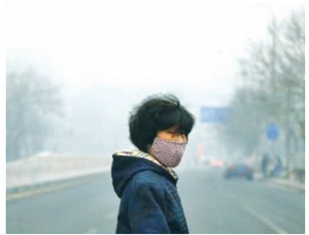
A woman wearing mask walks across a street during a hazy day in Beijing, on 27 March, 2014. —REUTERS

It said the firms were ordered to pay a total of 2.45 million yuan ($394,600) in fines. —Reuters