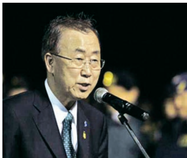
United Nations Secretary-General Ban Ki-moon

UNITED NATIONS, 14 June — UN peacekeepers should expand further into the volatile north of Mali, beyond cities and towns, amid fears that militants will step up their attacks against international and Malian troops and threats to civilians, UN chief Ban Ki-moon said on Friday.