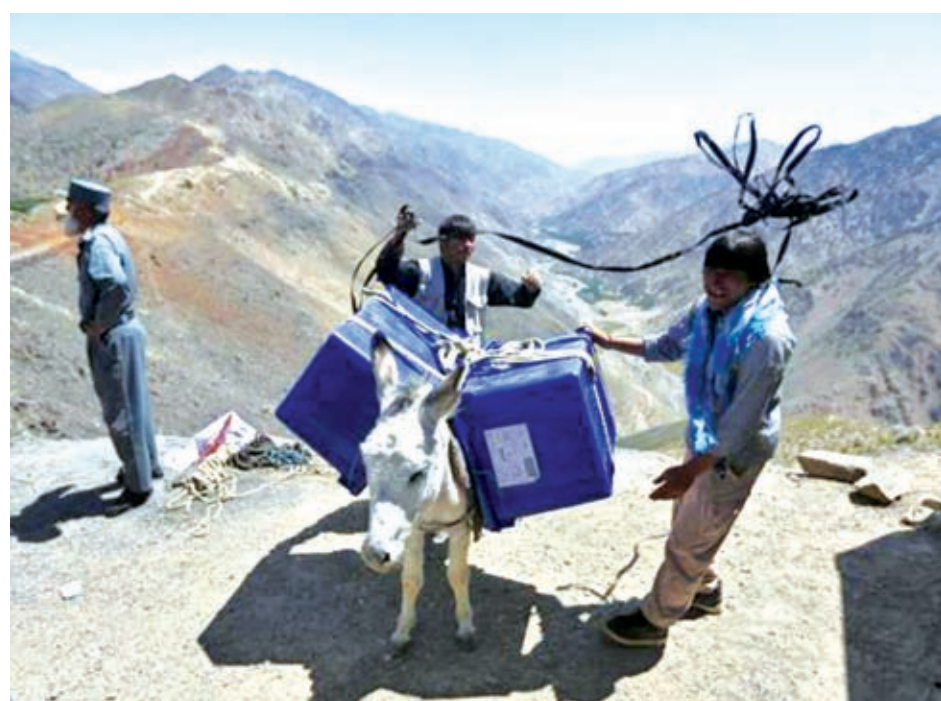
Afghan men lead a donkey, loaded with ballot boxes and other election material to be transported to polling stations which are not accessible by road, in Shutul, Panjshir Province, on 13 June, 2014.

On 6 June, Abdullah survived an assassination attempt when two bombs exploded outside a Kabul hotel where he had just held a rally. Twelve people