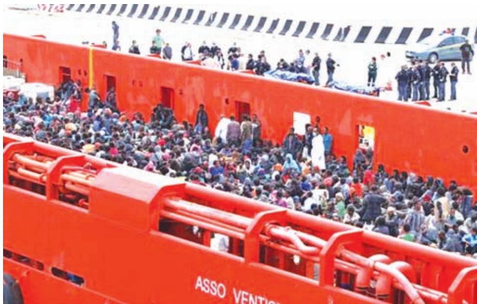
Migrants are seen aboard a navy ship before being disembarked in the Sicilian harbour of Augusta on 1 June, 2014.

But those rescued in international waters could be taken in by any EU country, perhaps according to a negotiated quota system, said Carlotta Sami, southern Europe's spokeswoman for the UN High