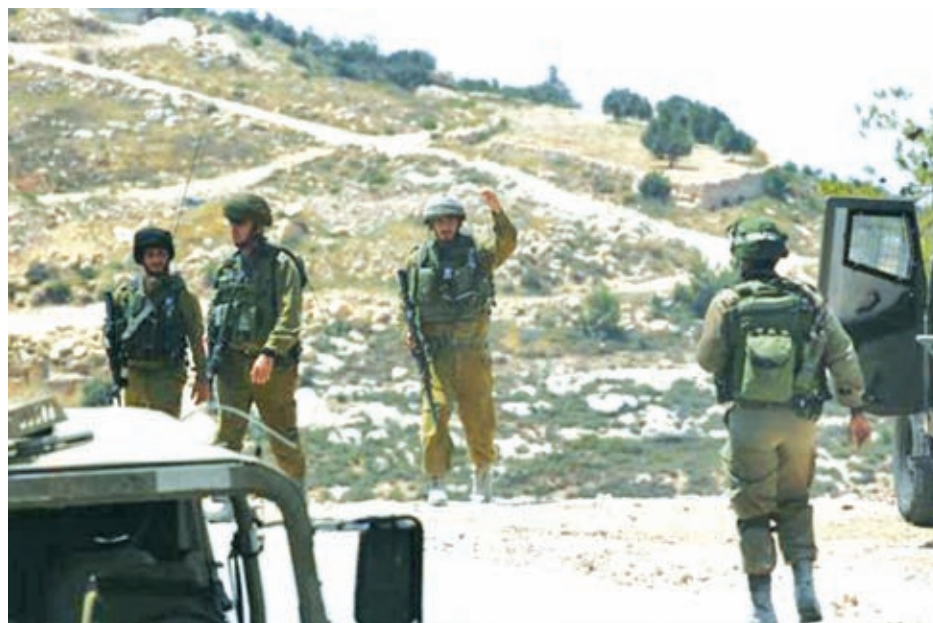
Israeli soldiers patrol near the West Bank city of Hebron on 13 June, 2014.

The military did not name the teenagers. The newspaper Haaretz said