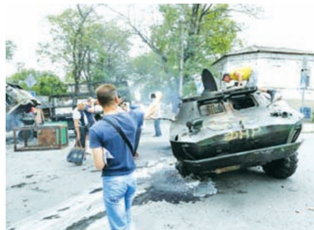
Local residents look at destroyed vehicles at the site of fighting in the eastern Ukrainian port city of Mariupol on 13 June, 2014.

MARIUPOL, (Ukraine), 14 June —The Ukrainian flag fluttered over the regional headquarters of Mariupol on Friday after government forces reclaimed the port city from pro-Russian separatists in heavy fighting and said they had regained control of a long stretch of the border with Russia.