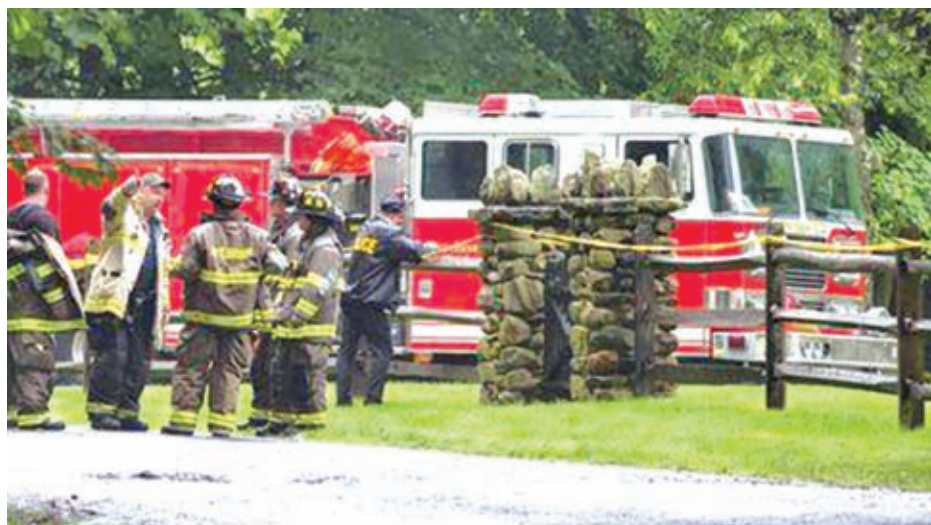
Police and firefighters stand near the site of a small plane crash in the town of Harrison, Westchester County, New York on 13 June, 2014.