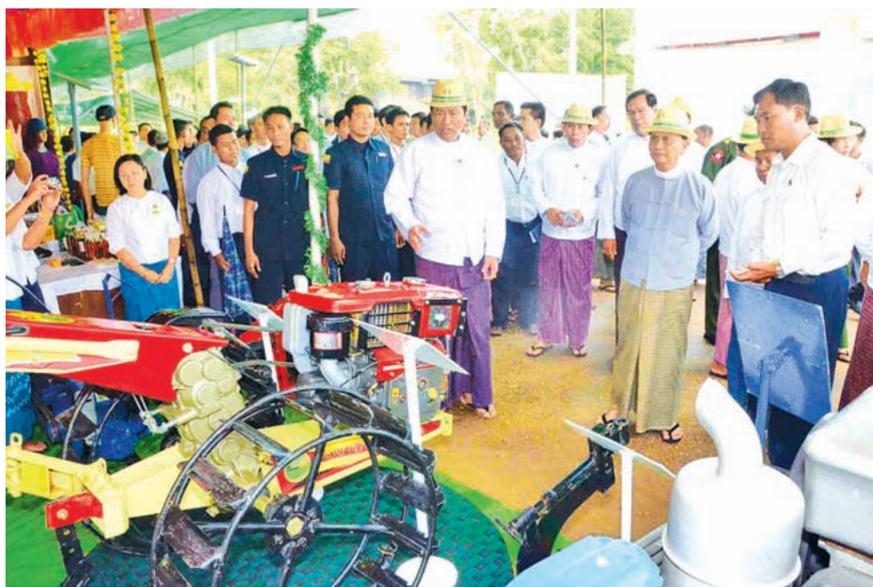
President U Thein Sein views round agricultural machinery displayed at Naung Yoe Hall in Myaungmya.—MNA

He said, “I am still taking pride in my leading role for rehabilitation works as a prime minister at that time. The poverty resulting from Cyclone Nargis is a chronic problem in this region. Although this problem cannot be wiped out totally, the Ministry of Co-operatives is now supporting the locals with rehabilitation plans.” The president said that the poverty rate of the country was 26 percent when his government took office in 2011. He also reaffirmed that the new government is making efforts in speeding up poverty alleviation