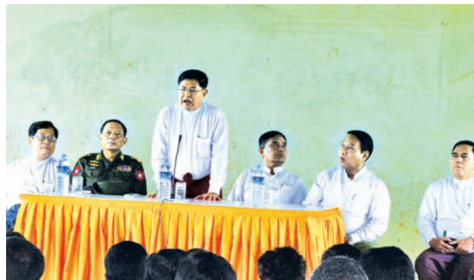
Union Minister U Soe Thane speaking at a meeting with locals at Thetkebyin relief camp in Sittway Township.—MNA