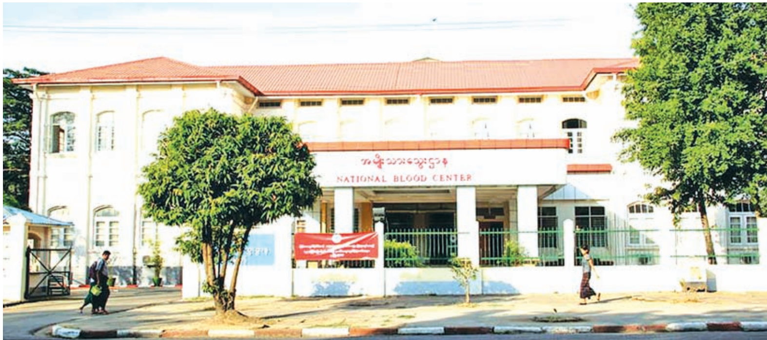
National Blood Centre at Yangon General Hospital on Bogyoke Aung San Street in Latha Township, Yangon.