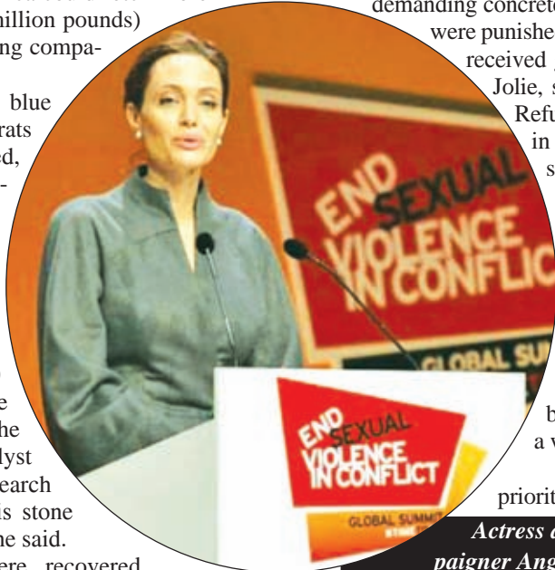
Actress and campaigner Angelina Jolie speaks at a global summit on ending sexual violence in conflict, at the ExCel Centre in London on 13 June, 2014.

Up to 1,200 government ministers and officials, lawyers, activists and survivors from over 120 countries attended the summit, which agreed a new set of international guidelines on how to investigate sex crimes, collect evidence and prosecute.—Reuters