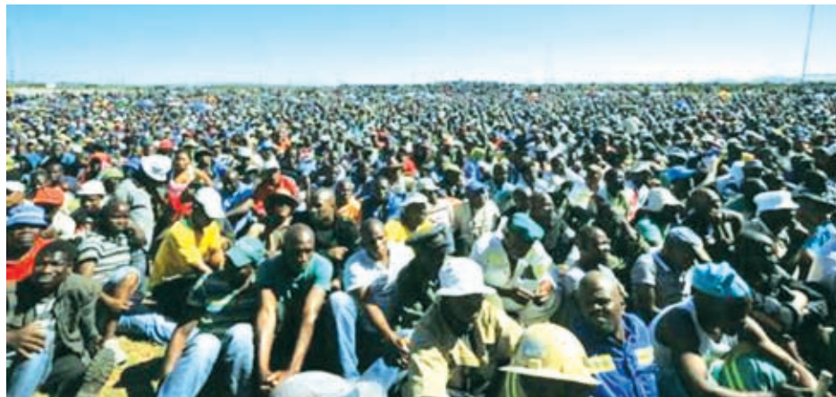
Striking platinum miners attend a rally near Lonmin's Marikana mine on 29 April, 2014.

"We are in quite a sensitive stage of trying to resolve this and reach an agreement. We won't do things haphazardly," he said. — Reuters