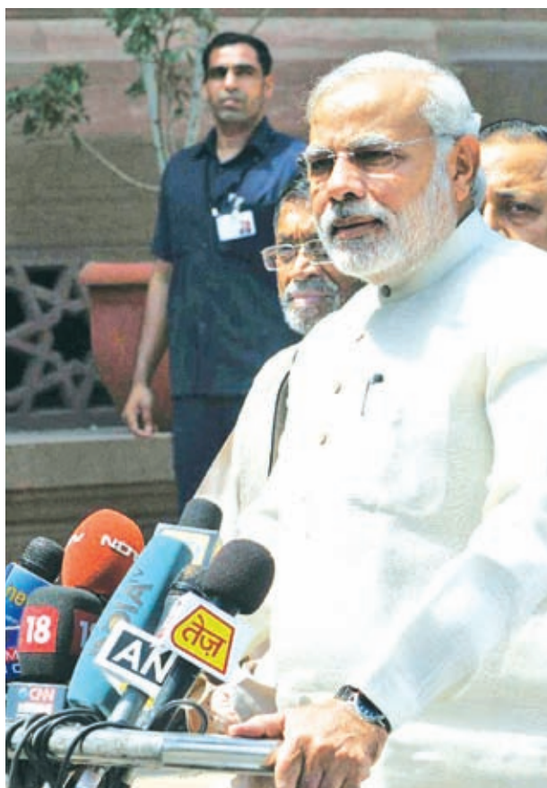
Indian Prime Minister Narendra Modi