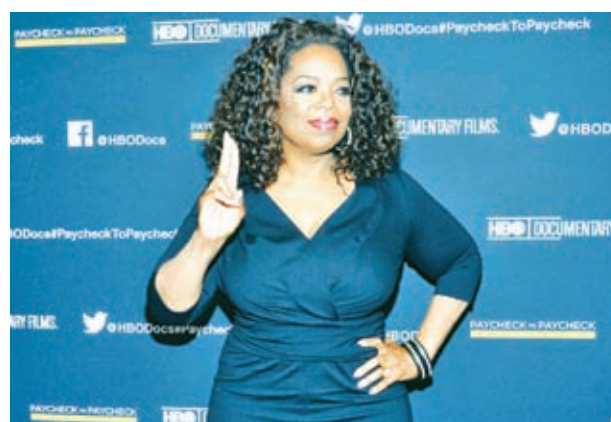
Oprah is also co-producing the biopic along with actor Brad Pitt.

reunite the 60-year-old with her Lee Daniels’ The Butler co-star David Oyelowo, who will play Martin Luther, while Cuba Gooding Jr will star as American civil rights lawyer Fred Gray.