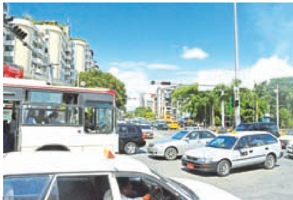
Photo shows Myaynigon junction, one of traffic-congested spots in Yangon.

With the aim of reducing heavy traffic congestions in Yangon, the government has carried out several projects, including new bridges at Hledan, Bayintnaung and Shwegondine junctions.