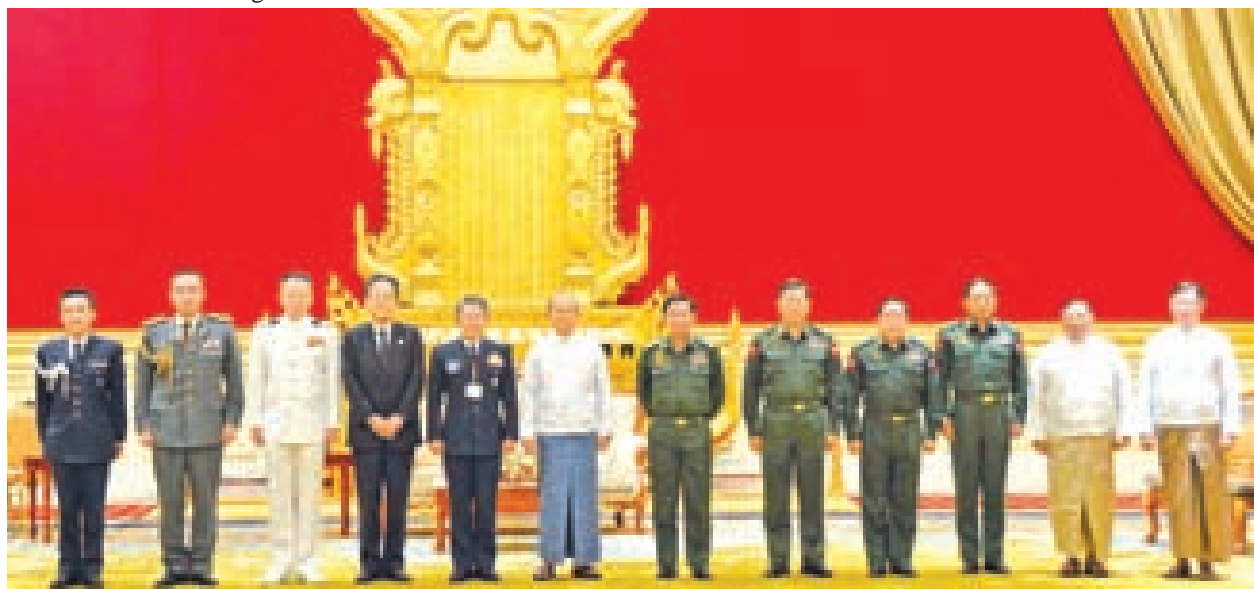
President U Thein Sein poses for documentary photo with Japanese military delegation led by Chief of Staff General Shigeru Iwasaki.