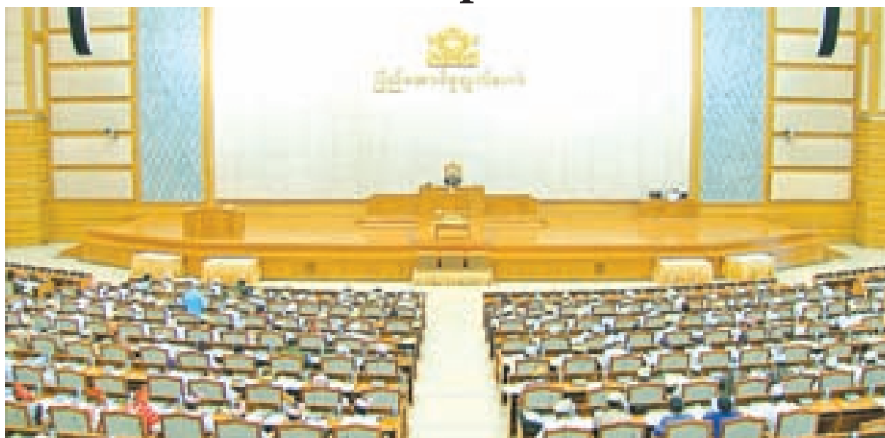
Pyidaungsu Hluttaw Speaker Thura U Shwe Mann extends greetings at tenth regular session of Pyidaungsu Hluttaw.

During Wednesday's session, Pyidaungsu Hluttaw decided to give the green light to plans to borrow an agriculture loan of