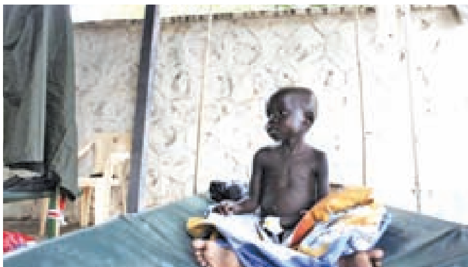
A South Sudanese child suffering from cholera sits on a bed in Juba Teaching Hospital in Juba, on 27 May, 2014.

The US-drafted resolution, unanimously adopted by the 15-member council, "emphasizes that protection of civilians ... must be given priority in decisions about the use of available capacity and resources within the mission." Fighting erupted in South Sudan in December after months of tensions sparked by President Salva Kiir's decision to fire