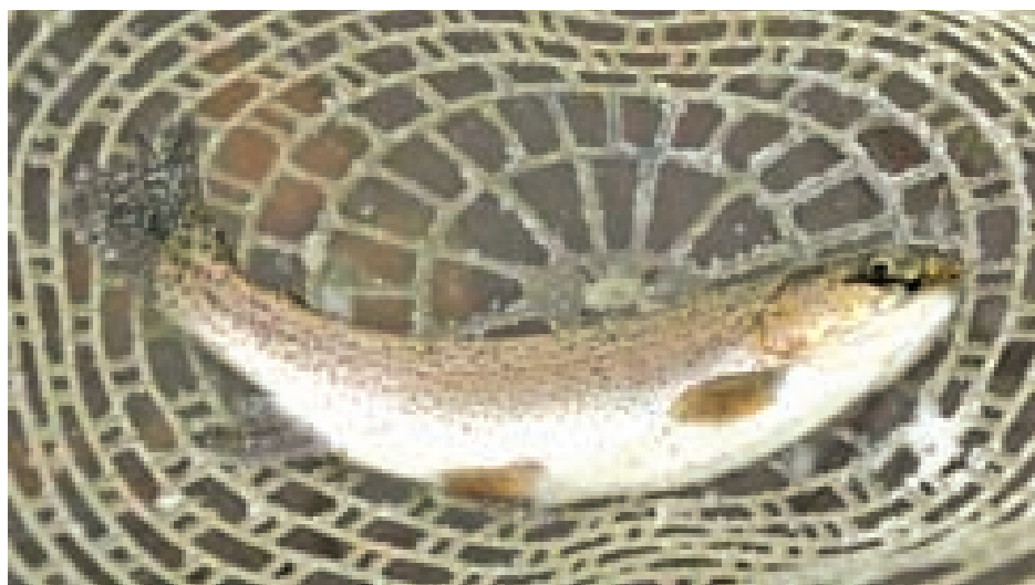
A catch and release rainbow trout is seen in a net during a winter blizzard at the Project Healing Waters third annual Fall FlyFest in Hopeville Canyon, West Virginia on 8 Dec, 2013.

NEW YORK, 28 May—Climate changes that have made Montana streams much warmer over the last 30 years are helping inva-