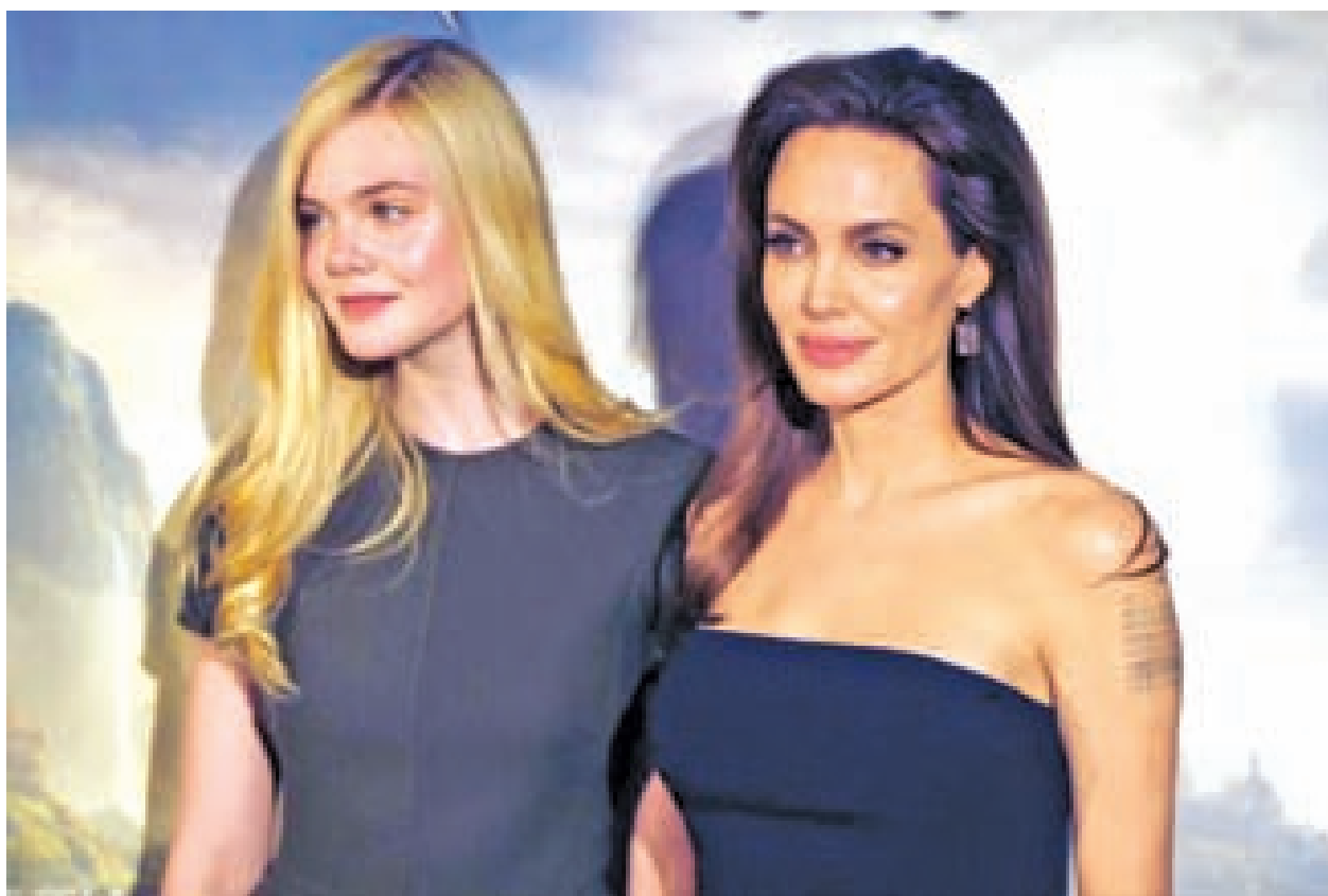
Actresses Angelina Jolie (R) and Elle Fanning pose during a photocall for the film “Maleficent” (Malefique) in Paris on 6 May, 2014.

“There are people today, especially kids, that have been bullied and felt like they are outsiders or felt different,” said Jolie of her character, who sports black horns and sharp