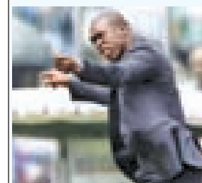
AC Milan's coach Clarence Seedorf gestures during their Italian Serie A soccer match against Atalanta at Atleti Azzurri d'Italia stadium in Bergamo on 11 May, 2014.

Club president Silvio Berlusconi met chief ex-