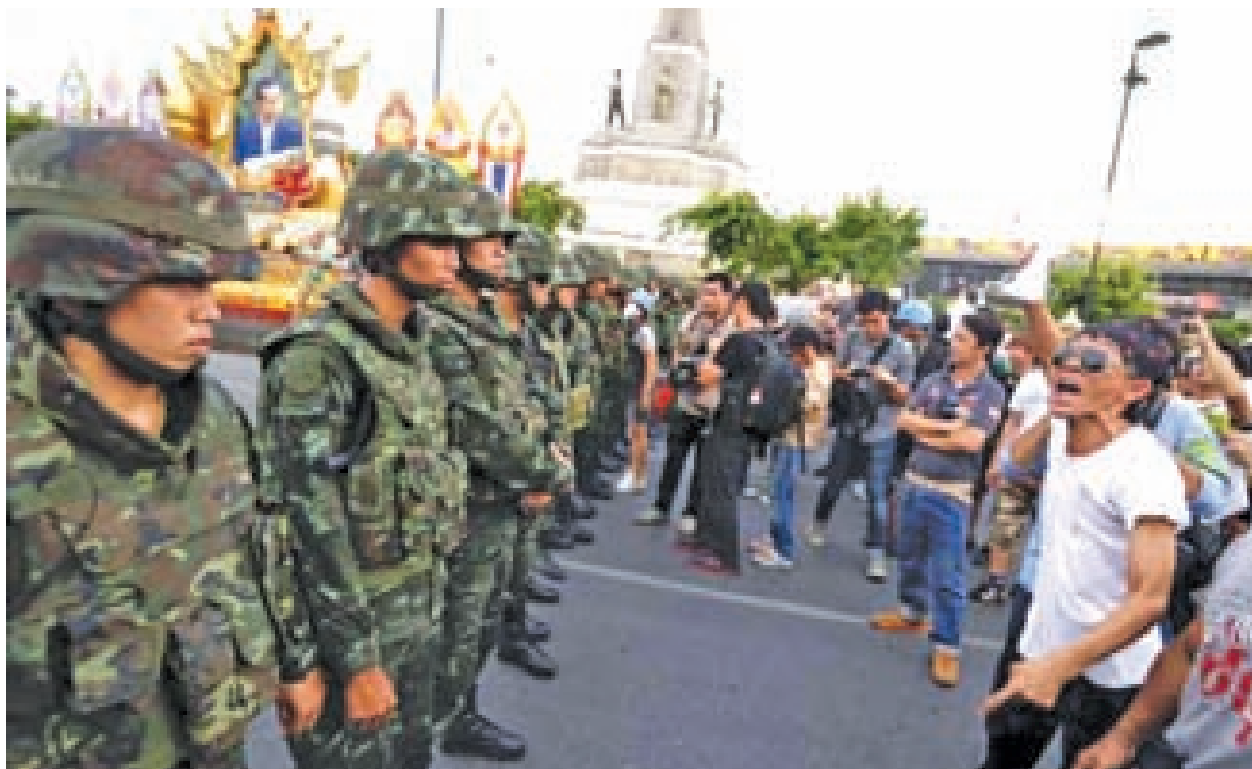
Protesters against military rule face soldiers at the Victory monument in Bangkok on 26 May, 2014.

Data on Wednesday showed factory output fell 3.9 percent in April from a year earlier, the 13th monthly drop in a row.