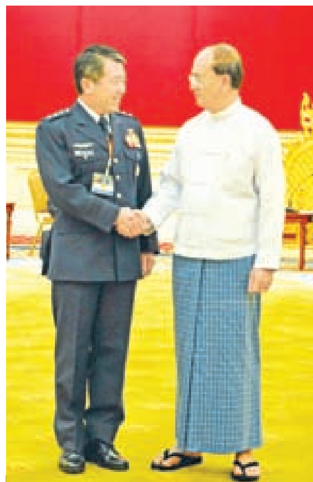
President U Thein Sein shakes hands with Chief of Staff of Japanese Self-Defense Forces General Shigeru Iwasaki.—MNA

The former colonial country cut military relations with Myanmar under the rule of the military government.—MNA