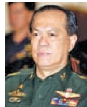
Former General Anupong Paochinda

"We're going to have to continue to calibrate how we'll work with the government and military when they don't show any pathway back to civilian rule," a senior US official told Reuters in Washington.