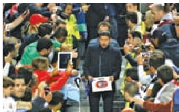
Atletico Madrid's coach Diego Simeone (C) walks off the pitch after losing to Real Madrid in their Champions League final soccer match at Luz stadium in Lisbon, May 24, 2014 file photo.

NYON (Switzerland), 28 May — Real Madrid and Atletico Madrid are facing disciplinary action over their behaviour during the Champions League final in Lisbon, UEFA said on Tuesday. Atletico coach Diego Simeone