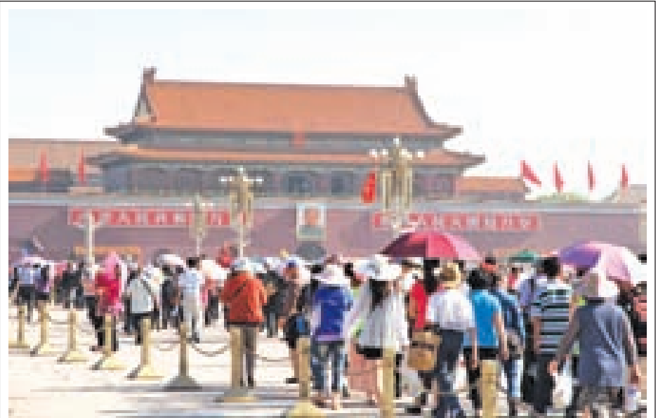
People use their sunshades and hats to block the sun when visiting the Tian'anmen Square in Beijing, capital of China, on 28 May, 2014. The city's meteorological department issued this year's first yellow alert for heat on Tuesday.