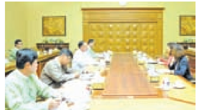
Union Minister for Environmental Conservation and Forestry U Win Tun discusses matters related to cooperation in forestry sector with Mrs Isabel Faria de Alneida.—MNA

climate change alliance, forest law enforcement, governance, trade and land utilization plans, capacity building programmes, assistance for satellite photos and cooperation in community forestry, reducing emissions from deforestation and forest degradation and mangrove rehabilitation.—MNA