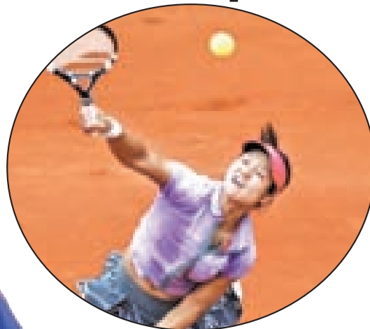
Li Na of China serves during the Women's Singles first round match against Kristina Mladenovic of France on day 3 of the French Open at Roland Garros in Paris on on 27 May, 2014. Li lost 1-2.

errors to lose the match. Chinese player. missing