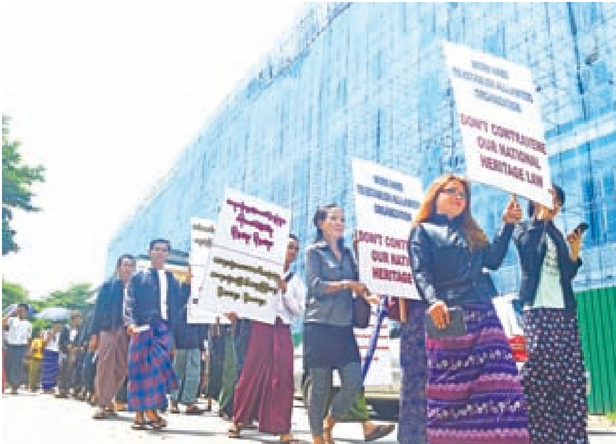
Lawyers marching past the Yangon Divisional Court building which is currently under renovation to be turned into a hotel by a private company.