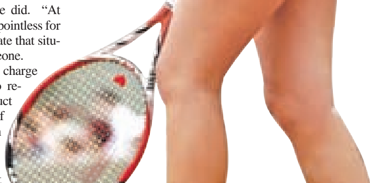
Kristina Mladenovic of France celebrates during the Women's Singles first round match against Li Na of China on day 3 of the French Open at Roland Garros in Paris on 27 May, 2014. Li lost 1-2.