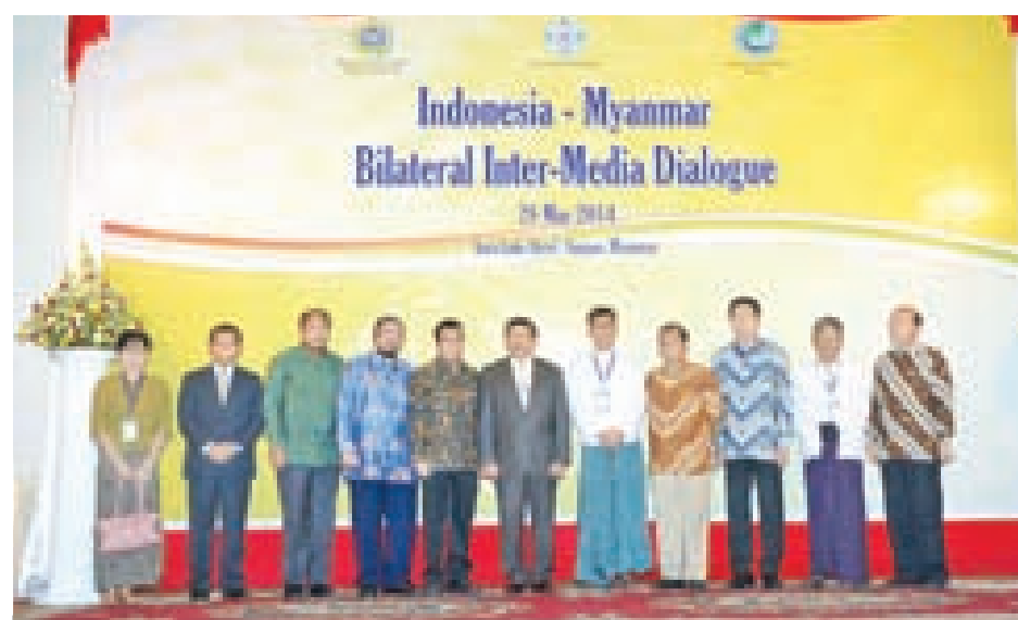
Participants of Indonesia-Myanmar Bilateral Inter-Media Dialogue pose for photo.—MNA

He also said media reforms cannot be carried out overnight or by simply adopting a law, promising to overcome the challenges of Myanmar's media reform. The dialogue is going on until 29 May. —MNA