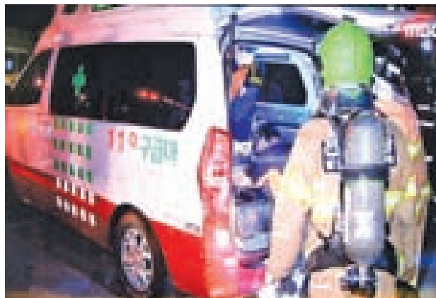
Photo released by Newsis shows policemen carrying the injured to a hospital in southern South Korea, early morning on 28 May, 2014 (local time). Twenty-one people were killed and seven others injured in a fire at a hospital in southern South Korea early on Wednesday. —XINHUA

The hospital held patients who required long-term care, many with dementia or disability as a result of a stroke, local media reports said.