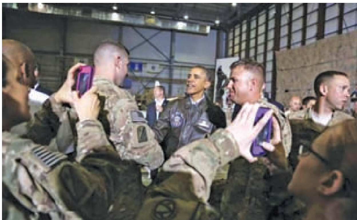
Soldiers take photos as US President Barack Obama (C) shakes hands with troops after delivering remarks at Bagram Air Base in Kabul, on 25 May, 2014.

Obama's tendency to rely on diplomacy and steer clear of foreign entanglements has drawn fire from opposition Republicans in