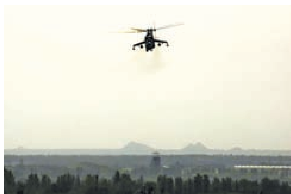
A Ukrainian Mi-24 gunship manoeuvres over a residential area near Donetsk international airport on 26 May, 2014.

Reuters journalists counted 20 bodies in combat fatalities in one room of a city morgue in Donetsk. Some of the bodies were missing limbs, a sign that the government had brought to bear heavy firepower against the rebels for