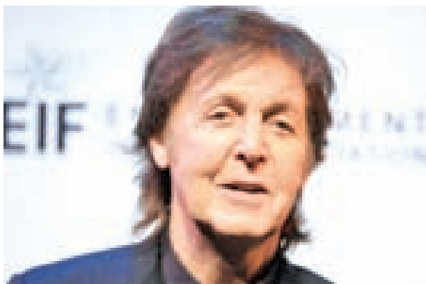
Musician Paul McCartney attends The Shakespeare Center of Los Angeles 23rd Annual Simply Shakespeare benefit reading of “The Two Gentlemen of Verona” in Santa Monica, California on 25 Sept, 2013.

TOKYO, 28 May — his Asian concert tour and Former Beatle Paul McCartney, who cancel led