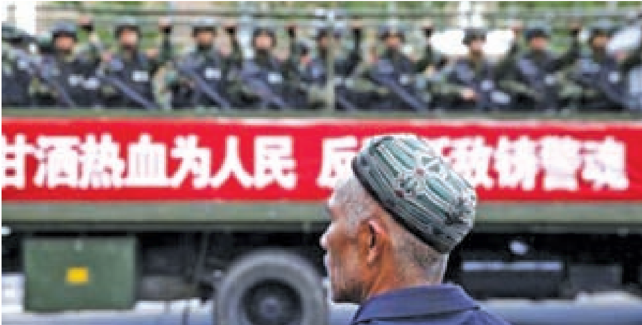
A Uighur man looks on as a truck carrying paramilitary policemen travel along a street during an anti-terrorism oath-taking rally in Urumqi, Xinjiang Uighur Autonomous Region on 23 May, 2014.

BEIJING, 28 May — Local officials in China's western Xinjiang region held a public rally for the mass sentencing of criminals on Tuesday, handing out judgements for 55 people and at least three death sentences for crimes such as "violent terrorism", state media said.