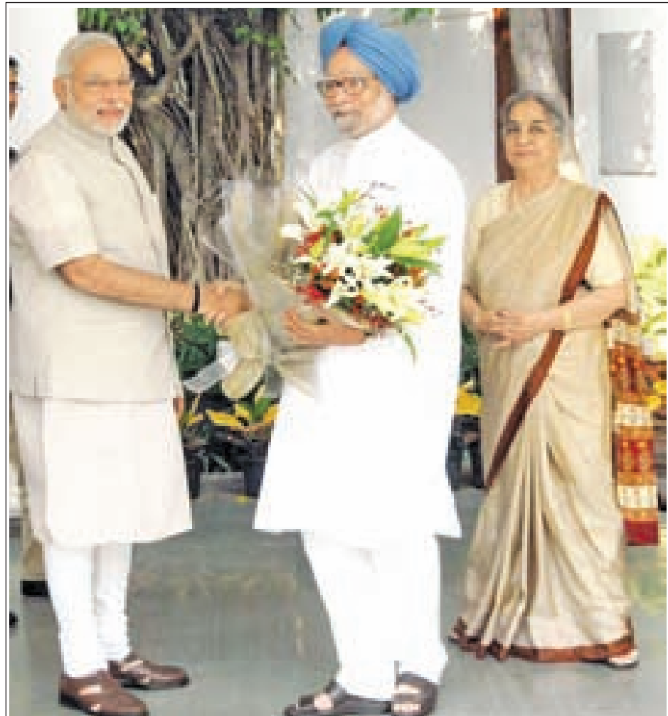
Indian Prime Minister Narendra Modi (L) meets with former Prime Minister Manmohan Singh (C) and his wife Gursharan Kaur at Singh's residence in New Delhi on 27 May, 2014. India's Bharatiya Janata Party leader Narendra Modi was sworn in as the 15th prime minister of India on Monday.

Japan's current position is that it has the right under international law but cannot exercise it due to the limits imposed by the war-renouncing Constitution that bans the use of force to settle international disputes. — Kyodo News