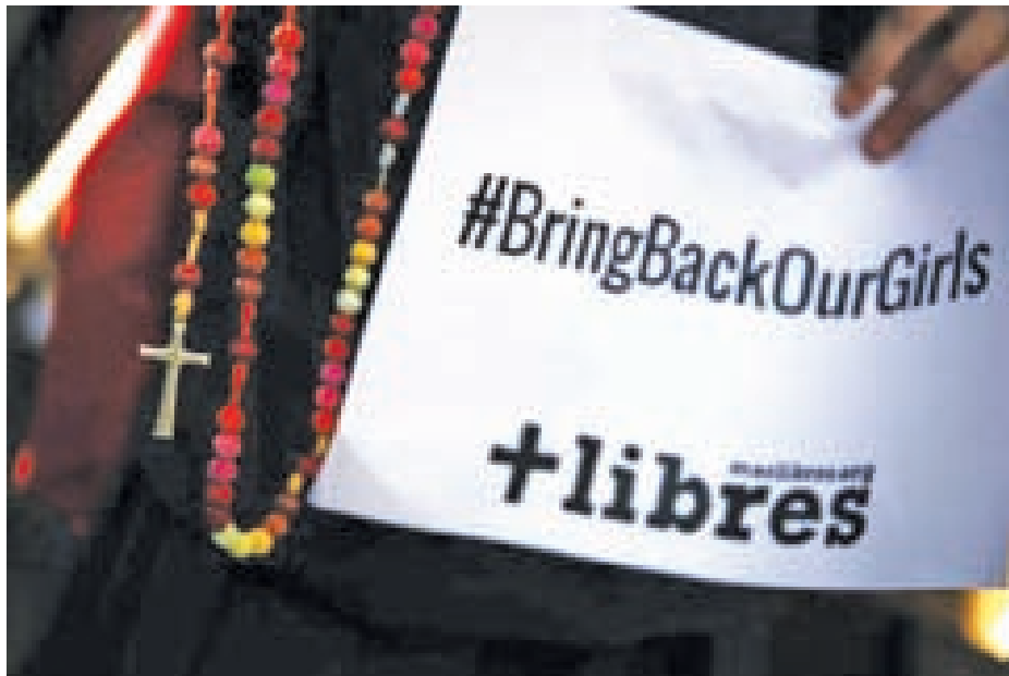
A poster with the Twitter campaign hashtag #BringBackOurGirls is seen during a prayer vigil showing support for Nigerian schoolgirls abducted by militant group Boko Haram, outside the Nigerian Embassy in Madrid on 22 May, 2014.