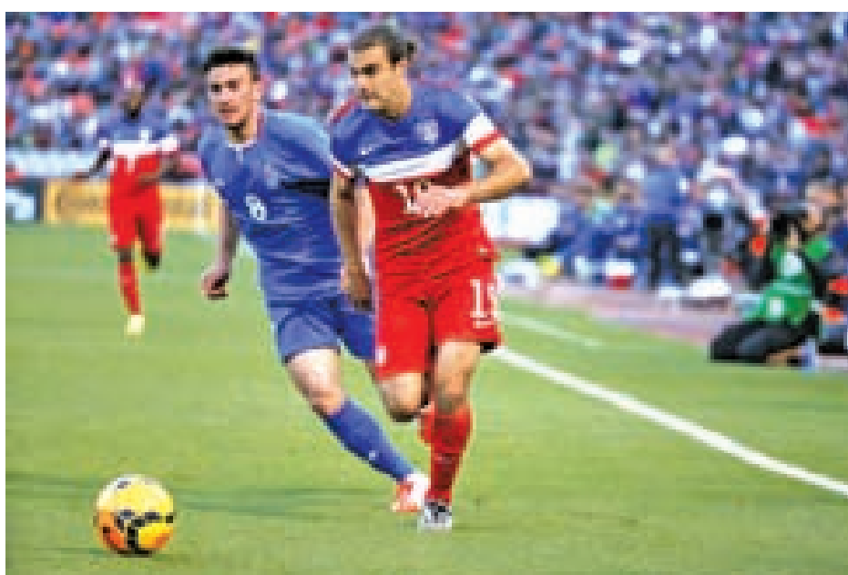
Graham Zusi (R) of the US drives the ball as Azerbaijan's Gara Garayev defends during an international friendly soccer match in San Francisco, California on 27 May, 2014.

their World Cup preparations off to a positive start with a comfortable 2-0 friendly win over a well-disciplined Azerbaijan at Candlestick Park in San Francisco on Tuesday.