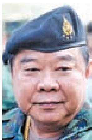
Former General Prawit Wongsuwan

BANGKOK, 28 May — Thailand's junta has appointed as advisers two retired generals with palace connections, putting powerful establishment figures hostile towards former Prime Minister Thaksin Shinawatra firmly in the ascendant in the country's long-running power struggle.