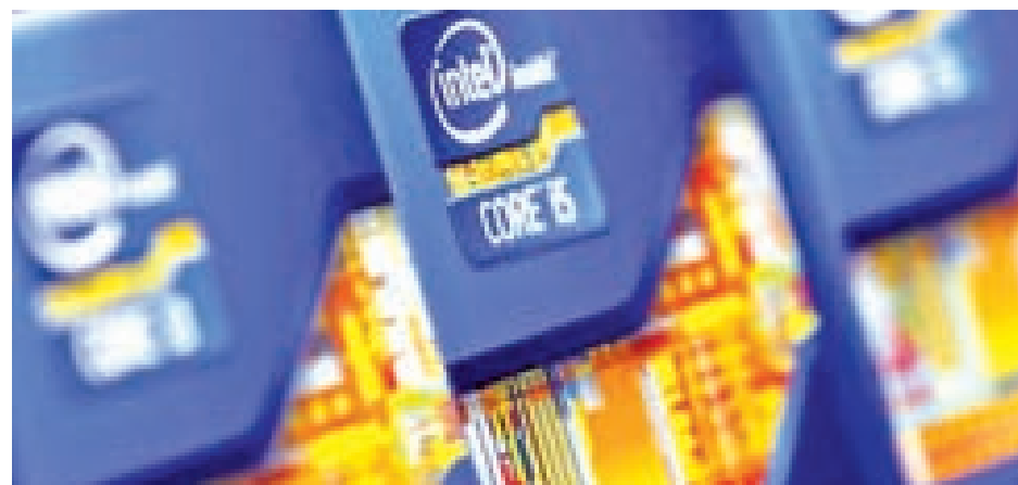
Intel processors are displayed at a store in Seoul on 21 June, 2012.