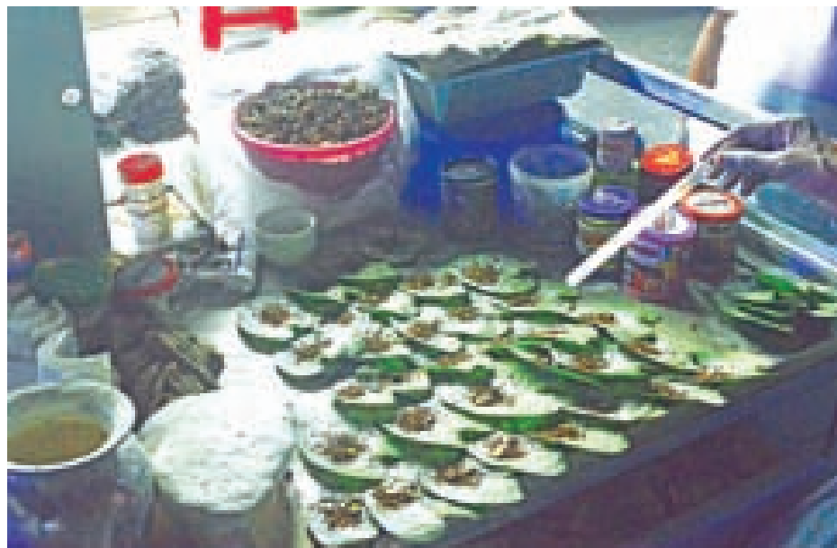
Betel-quid-with-tobacco costs K50, making it affordable to low income people who are getting increasingly addicted, with Myanmar people the top consumers in SE Asia.