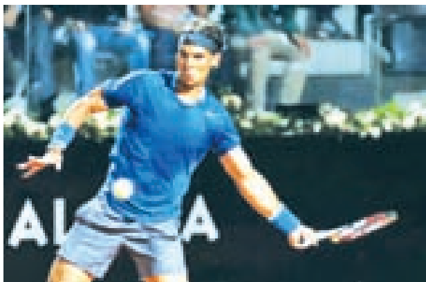
Rafael Nadal of Spain

PARIS, 24 May — Two fellow Spaniards who have already beaten him on his