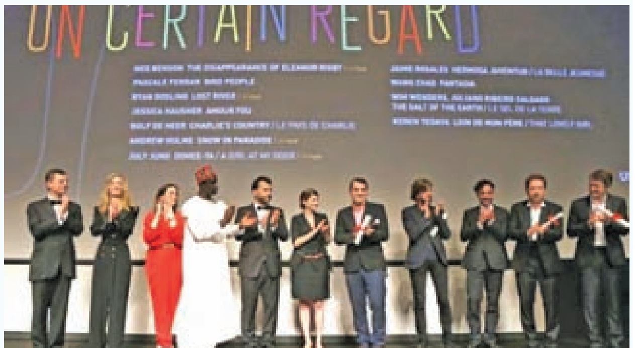
Director Kornel Mundruczo (5thR), winner of the Prize Un Certain Regard for his film "Feher isten" (White God), poses on stage surrounded by jury members and laureates during the 67th Cannes Film Festival in Cannes on 23 May, 2014.

on Saturday. Other films competing for the prize were the directorial debut of Hollywood A-list actor Ryan Gosling, "Lost River", the only Indian film in the competition, "Titli", by Kanu Behl, and "Jauja" starring Viggo Mortensen from Argentina's Lisandro Alonso.—Reuters