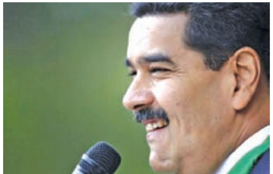
Venezuela’s President Nicolas Maduro speaks to media after a meeting with his Palestinian counterpart President Mahmoud Abbas at Miraflores Palace in Caracas on 16 May, 2014.