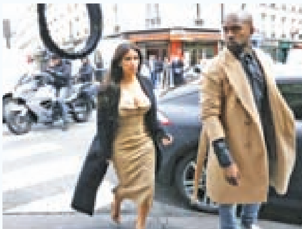
TV personality Kim Kardashian and rapper Kanye West arrive at a fashion designer workshop in Paris on 21 May, 2014.

However, as the castle is not an authorised site for weddings, there was some question about whether the event will be an officially recognised marriage ceremony or a celebration with some looser status.—Reuters