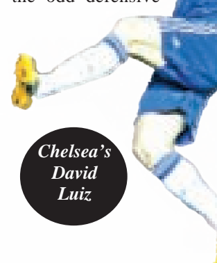
Chelsea's David Luiz

Strong, energetic and armed with a powerful shot, Luiz likes to venture forward but can be somewhat erratic and prone to the odd defensive