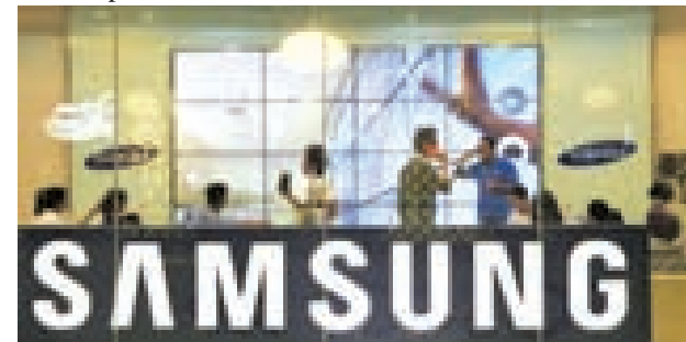
Customers attend a workshop about the Samsung Galaxy S5 in Jakarta, on 11 April, 2014.—REUTERS

But the proposed watch-phone, which will run on Samsung's Tizen operating software, can take photos and handle email independently and will come equipped with a heart monitor, the newspaper reported. Samsung declined to comment. Major technology companies such as Apple Inc, Google Inc and Samsung are expected to be in a race to market wearable computing devices, like watches, to consumers this year. It is unclear how much demand there is for gadgets such as smart glasses or watches, but industry insiders consider them to be the next phase in an increasingly saturated mobile device market.—Reuters