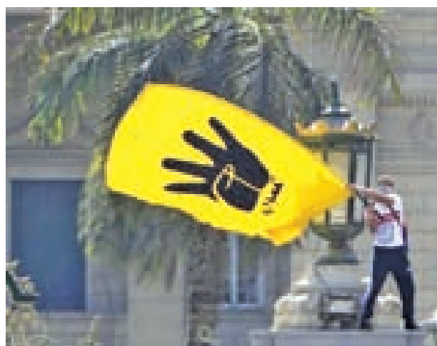
A student supporter of the Muslim Brotherhood and ousted Egyptian President Mohamed Mursi waves the yellow flag bearing the four-fingered Rabaa sign during a demonstration outside Cairo University on 14 May, 2014.

The senior figures keep busy, shuttling between London, Doha and Istanbul