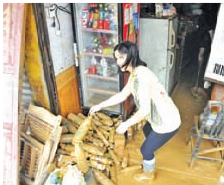
A resident clears sludge brought by a flood in Shitan Town of Qingyuan, south China's Guangdong Province, on 24 May, 2014. Four people have died and one is still missing in a rain-triggered flood in Qingyuan, local authorities said on Saturday.