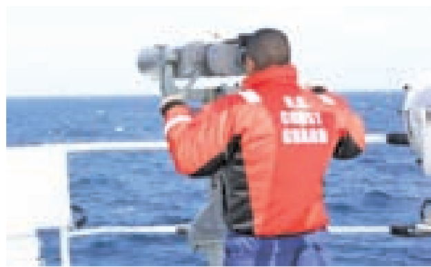
A crew member of the US Coast Guard Cutter Vigorous searches for crew members of the sailing vessel Cheeki Rafiki, about 1000 miles (1600 km) off Cape Cod, Massachusetts, in this US Coast Guard handout photo taken on 22 May, 2014.

NEW YORK, 24 May — A renewed search for four British sailors who vanished with their yacht a week ago in the Atlantic was called off late on Friday, hours after the overturned vessel was spotted at sea with no sign of its crew, the US Coast Guard said.