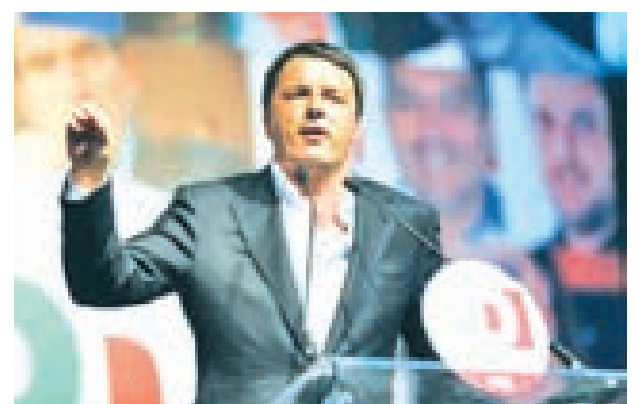
Italian Prime Minister and leader of the Democratic Party Matteo Renzi gestures as he talks during an election campaign for European Elections in Rome on 22 May, 2014.

"In Italy corruption is above all a cultural problem," says Raffaele Cantone, a magistrate who heads Italy's anti-bribery authority and who was put in charge of the Expo 2015 organization after the recent arrests. "Those who have been involved in corruption cases, once they have served their sentence, are welcomed back with open arms by the business world,