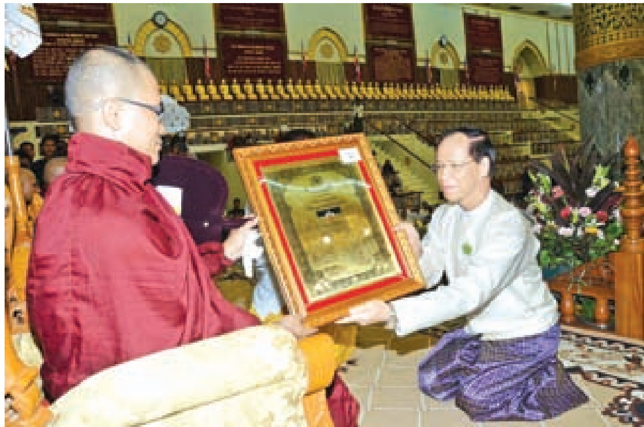
Vice President Dr Sai Mauk Kham offers certificate of title to Tipitakadhara Tipitakakovida monk.