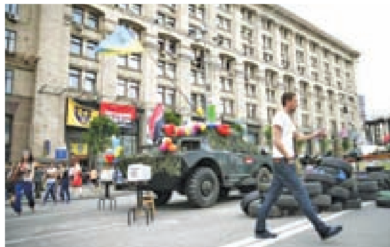
People walk next to an armoured vehicle left as a monument at the Independence Square, or the "Maidan", in Kiev on 23 May, 2014.