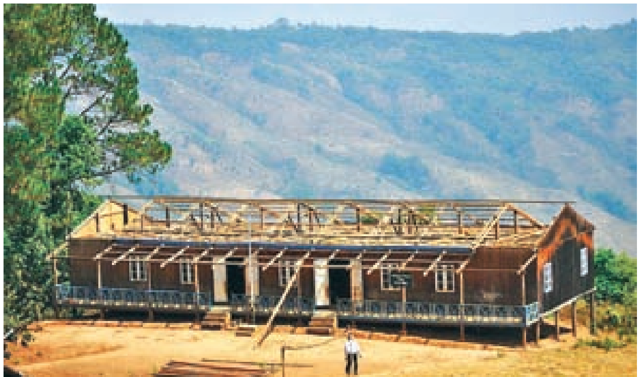
Photo shows a school under reconstruction at a rural village in Chin State in which MNCDD project operates.

Regarding the final stage of the selection process, she told the NLM that a report with the Chief Minister's recommendations on the three priority townships will be submitted to the Foreign Aid Management Working Committee.