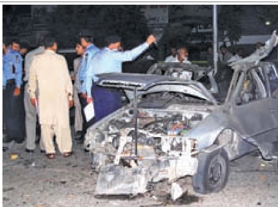
Policemen examine the blast site in Islamabad, capital of Pakistan, on 24 May, 2014. At least one person was killed and another injured as a suicide blast hit Pakistan's capital Islamabad in the wee hours of Saturday morning, reported local Urdu TV channel Geo.

The loans have helped females set up businesses or get a job, boosting the economy in the underdeveloped western and rural regions. By the end of March, over 3.6 million Chinese women had received micro-financing loans worth 180 billion yuan (about 28.8 billion U.S. dollars), the federation said. Central and local government subsidies contributed 11.3 billion yuan to the financing.—Xinhua