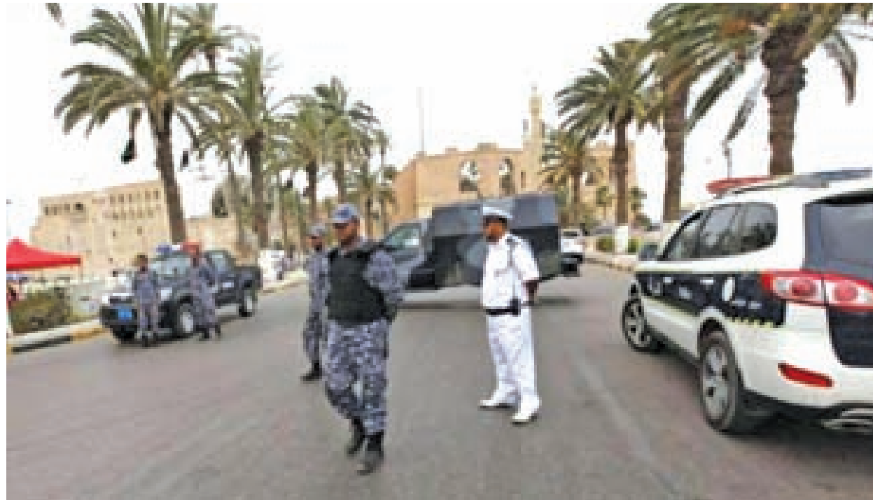
Police provide security in Tripoli on 23 May, 2014.

On Sunday, gunmen shelled Libya’s General