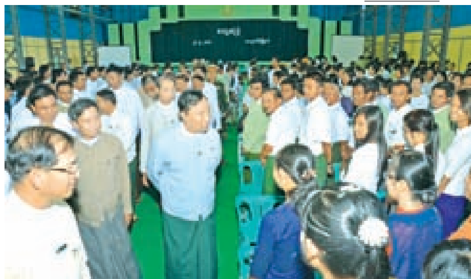
Speaker of Pyidaungsu Hluttaw Thura U Shwe Mann meets local people and personnel in Zeyathiri Township.—MNA

Regarding differences in ideology among ethnic and religious groups, he also pointed out that mutual respect can conquer all these differences.—MNA