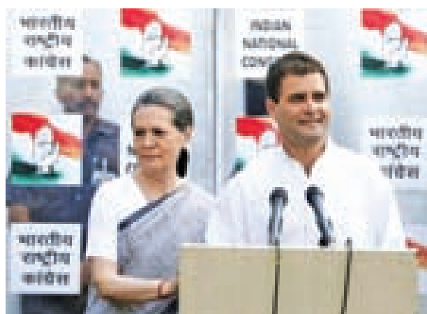
Congress party vice-president Rahul Gandhi speaks to the media as his mother and chief of Congress Sonia Gandhi (L) stands next to him during a news conference in New Delhi on 16 May, 2014.

The family has given the country three prime ministers, along with Sonia Gandhi, the power behind the throne in the outgoing government of Prime Minister Manmohan Singh. On Monday, Congress’s top leadership instinctively closed ranks around Rahul and his mother, party president Sonia, and rejected their offer to resign. But anger at the dismal performance has since begun to bubble over, amid concerns the party, and the dynasty, may never recover.