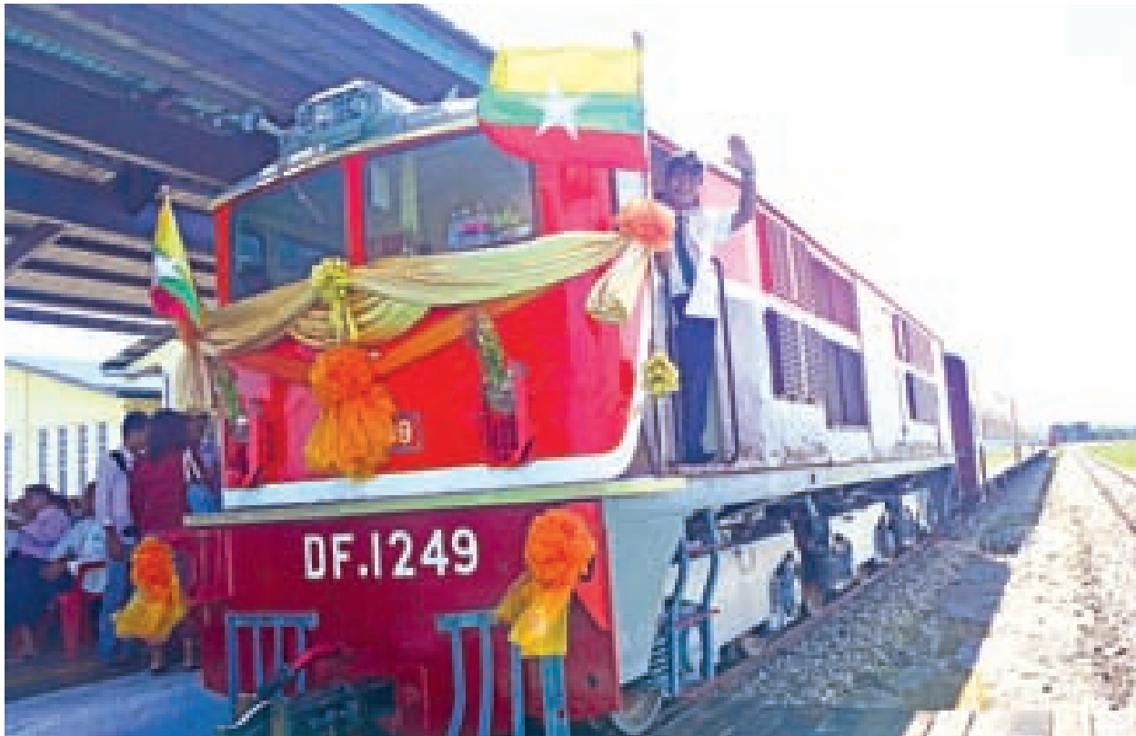
Hundreds of passengers boarding the French-made train which is about to embark on its maiden journey of the newly-launched Yangon-Hinthada link.

made locomotive will pull three ordinary and two upper class carriages with about 280-seat capacity in total, shuttling between Hlinethaya station on the western outskirts of Yangon and Hinthada in Ayeyawady Region.