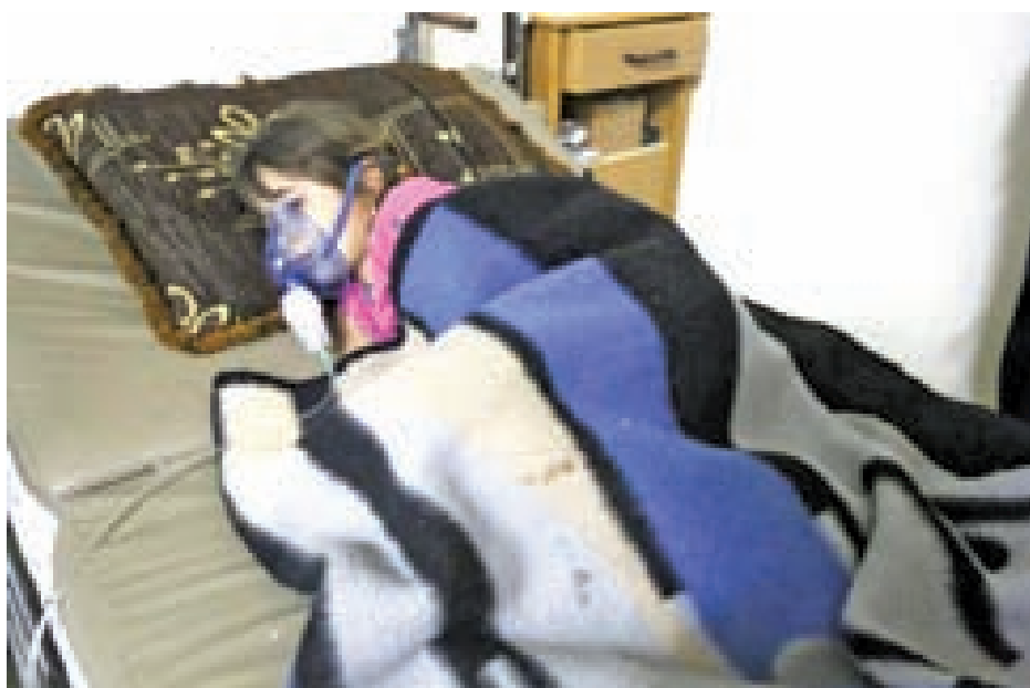
A girl, affected by what activists say was a gas attack, receives treatment inside a makeshift hospital in Kfar Zeita village in the central province of Hama on 22 May, 2014.

The Organization for the Prevention of Chemical Weapons (OPCW) has opened an investigation into the alleged chlorine attacks, more than a dozen of which have been reported since 11 April in several areas. "Inspectors for the fact-finding mission ar-