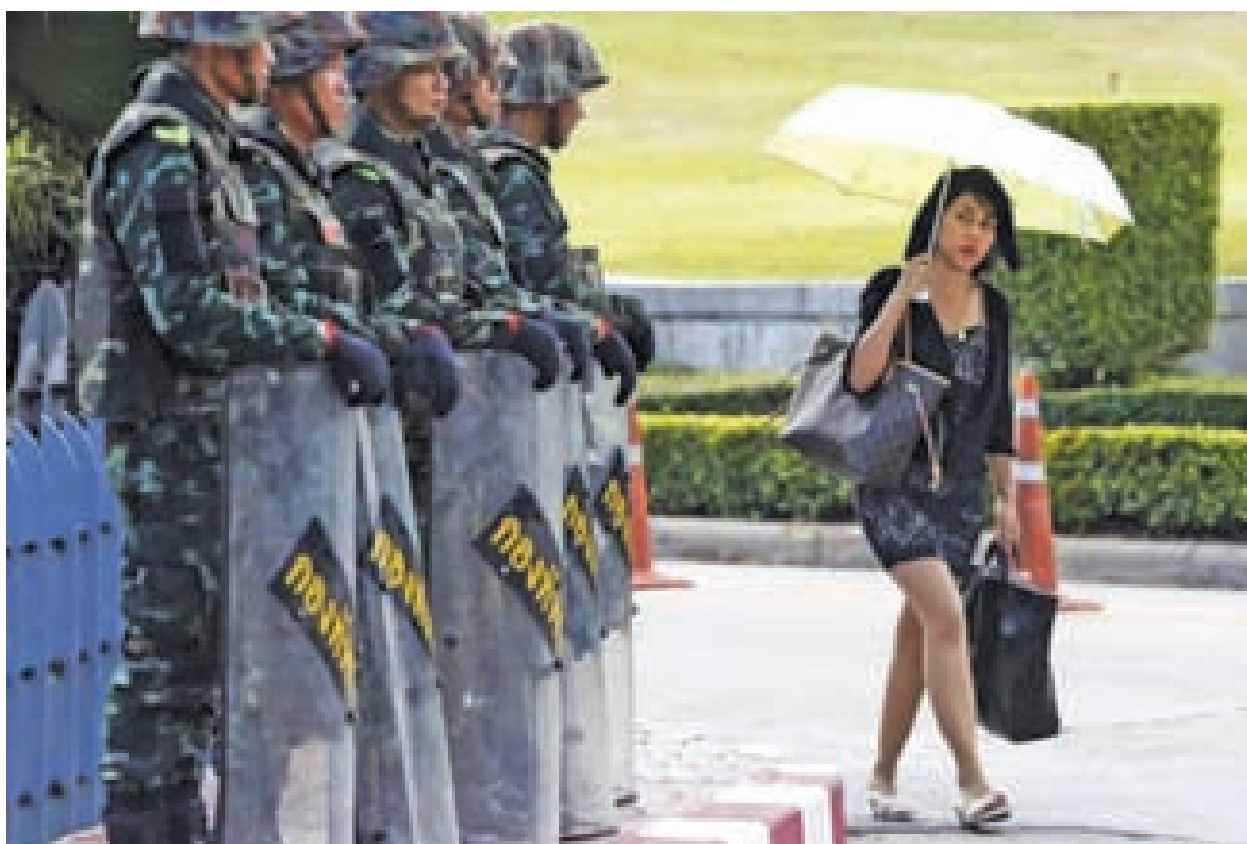
A woman walks past soldiers providing security to the Army Club where senior army officials meet foreign diplomats in Bangkok on 23 May, 2014.

place ... She has not been detained in any military camp. That’s all I can say at this moment,” the aide said, declining to be iden-