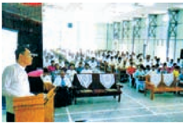
Sagaing on Friday morning.