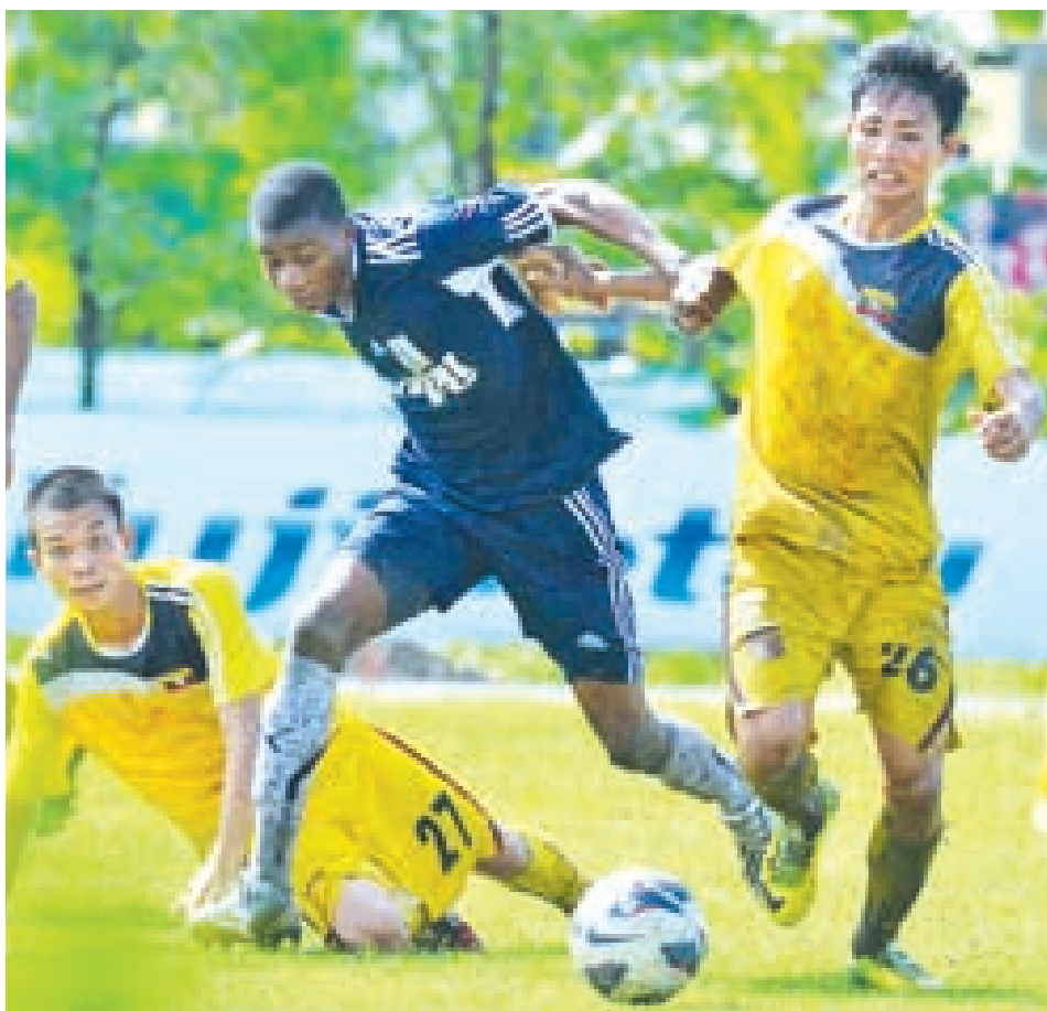
Youth players of Myanmar and Arafat FC trying to controlling the ball in tune-up match.