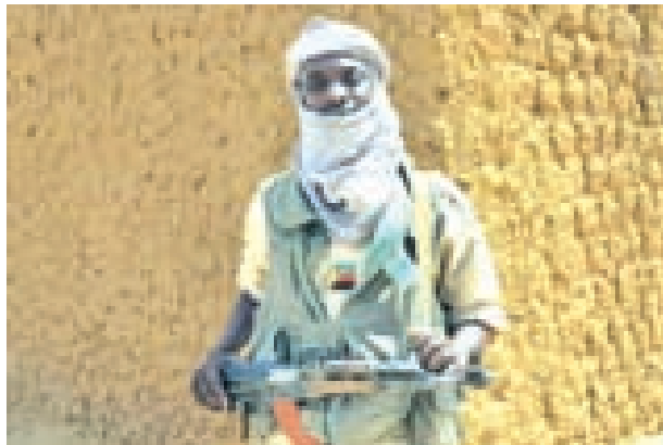
A fighter with the Tuareg separatist group MNLA (National Movement for the Liberation of Azawad) stands guard outside the local regional assembly in Kidal on 23 June, 2013.

The Malian army launched an assault on Kidal on Wednesday after clashes broke out last weekend during a visit to the northern town by new Prime Minister Moussa Mara. The action threatened to sink struggling the peace negotiations between the government and the rebels. Mahamadou