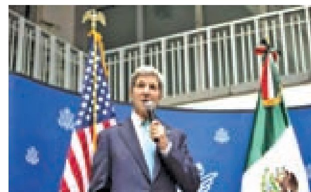
US Secretary of State John Kerry speaks to US embassy employees during a reception in Mexico City on 21 May, 2014.