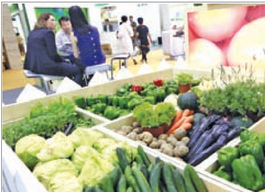
Photo taken on 23 May, 2014 shows the displayed organic vegetables at the 8th International Organic Trade Fair and Conference (BioFach China) in Shanghai, east China. The organic trade fair, which kicked off on Thursday, attracted more than 300 exhibitors from 16 countries and regions.