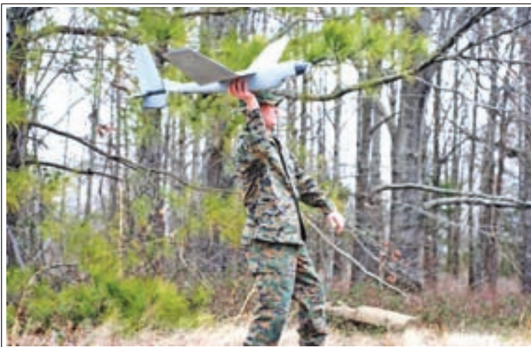
File photo taken on 17 March, 2014 shows a man launching Arrowlite by hand. Israel Aerospace Industries (IAI) on 13 May, 2014 unveiled a micro sized-unmanned aerial system developed for American Special Operations forces and counterterrorism units. Hand-launched by a single operator, Arrowlite is a tactical drone that provides small teams with aerial surveillance and reconnaissance of targets. It can be assembled and launched in 60 to 90 seconds after removal from a carry case, and features a payload of day/night thermal cameras, a laser illuminator and encrypted data-link, according to a statement from IAI.—XINHUA

He did not name any country but questions over cyber-espionage have long cast a shadow over China-US ties, with each side accusing the other of spying. The Defence Ministry said in March China would beef up its Internet security after the New York Times and Der Spiegel reported that documents leaked by Snowden said the US National Security Agency accessed servers at China's Huawei Technologies to obtain sensitive data and monitor executives' communications.—Reuters