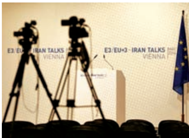
Video cameras are set up for the start of a news conference at the United Nations headquarters building (Vienna International Centre) in Vienna on 14 May, 2014.

Teheran says its nuclear programme is for peace-