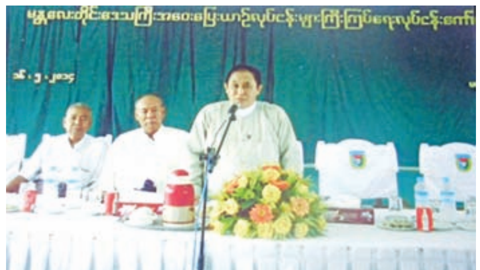
An official explains services of Myanmar Insurance for travellers.