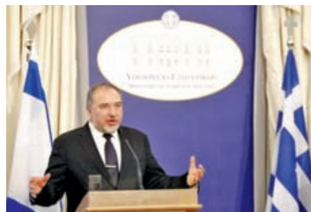
Israeli Foreign Minister Avigdor Lieberman

Lieberman insisted it had been "a private meet-