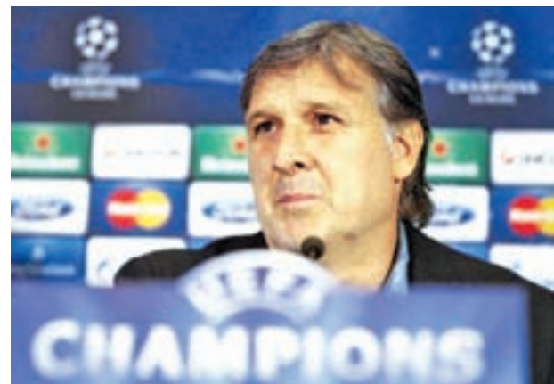
Barcelona's coach Gerardo "Tata" Martino

Martino had said earlier in the campaign that it would be difficult for him as he was not from the Barcelona or closely-linked Dutch school of football and there were constant debates about his more direct style.—Reuters