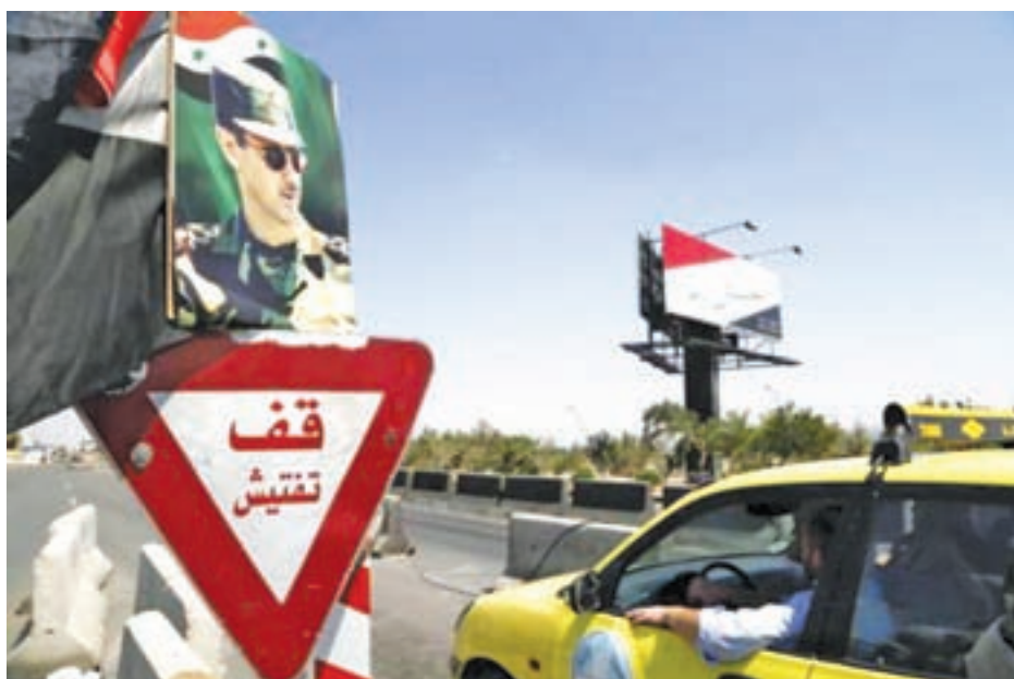
A picture of Syria's President Bashar al-Assad is seen along the Mezzeh highway in Damascus on 12 May, 2014.

The culmination of that slow, grinding military turnaround came last week with the final withdrawal of rebel fighters from Homs city, a month before the presidential election in which Assad faces no seri-