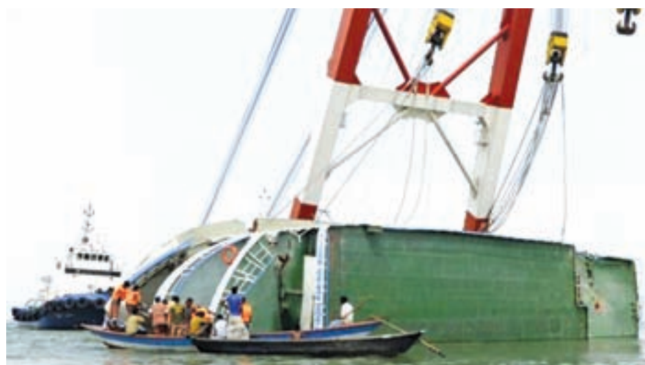
Rescue members inspect the capsized MV Miraj 4 ferry during a salvage operation at the Meghna river at Rasulpur in Munshiganj district on 17 May, 2014.

DHAKA, 18 May — Rescue workers in Bangladesh completed the search of a stricken river ferry on Saturday, bringing the number of bodies recovered to 54 two days after the vessel capsized with around 200 people on board.