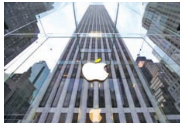
The leaf on the Apple symbol is tinted green at the Apple flagship store on 5th Ave in New York on 22 April, 2014.

"Consumers could wrongly believe that the game is entirely free and, in any case, that they would