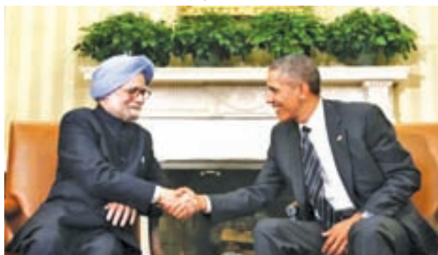
US President Barack Obama (R) shakes hands with Manmohan Singh in the Oval Office of the White House in Washington on 27 Sept, 2013.

Obama, who hosted Singh at a White House state dinner in his first term, thanked him for "his critical role in transforming and deepening the US-India strategic partnership and our cooperation on global challenges," a White House statement said. "The president conveyed his appreciation for Dr Singh's friendship, noting that he looked forward to further expanding the strong relationship between the United States and India with Prime Minister-Elect Narendra Modi," the statement said.—Reuters