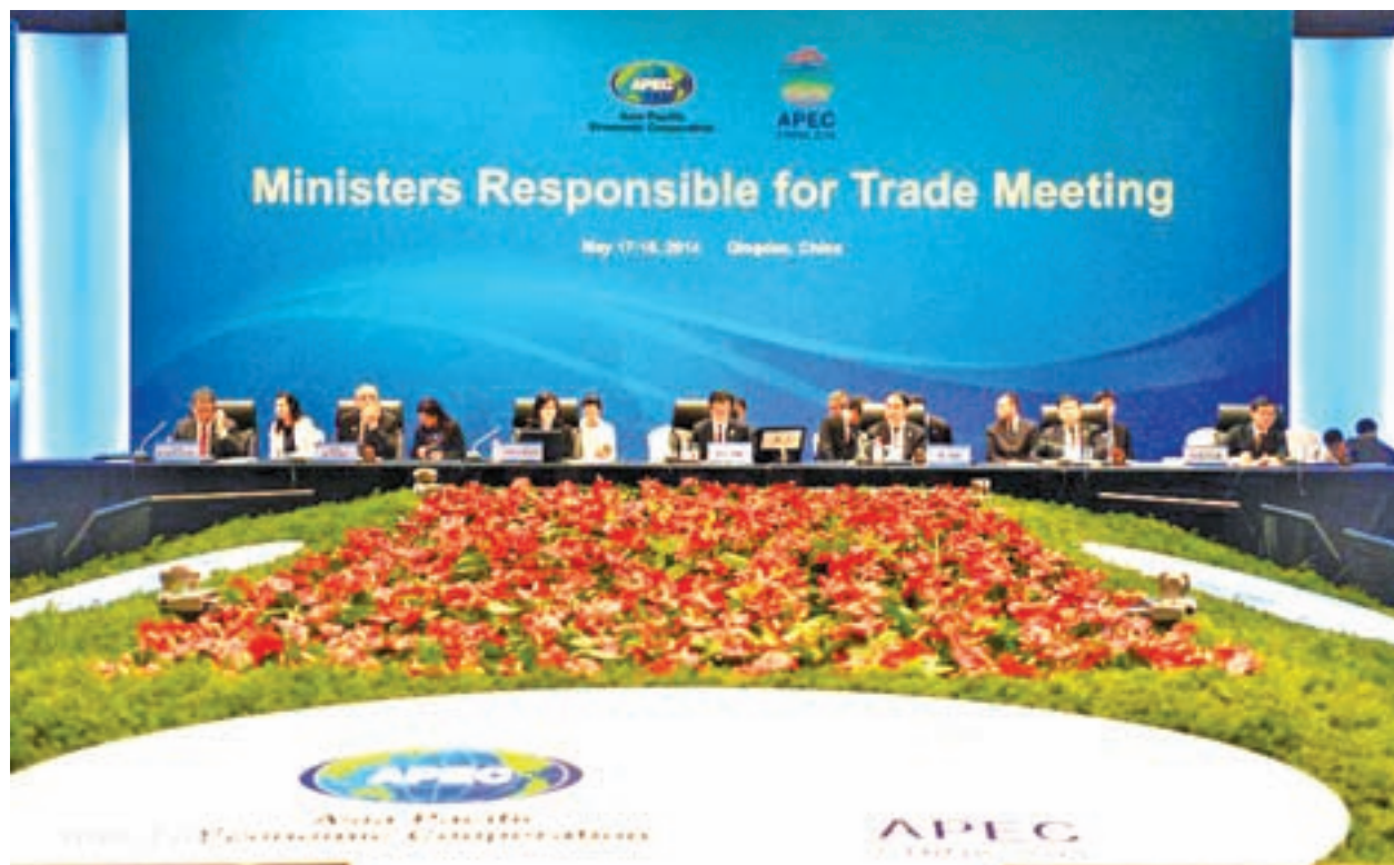
The APEC trade ministers' meeting is held in the coastal city of Qingdao, east China's Shandong Province, on 17 May, 2014. The two-day meeting of APEC trade ministers opened on Saturday.

QINGDAO, (China), 18 May — At a time when maritime tensions involving China are under the spotlight, Asia-Pacific trade ministers agreed on Sunday to promote regional economic integration and create a road map, possibly by the end of 2014, for the realization of a new free trade area.