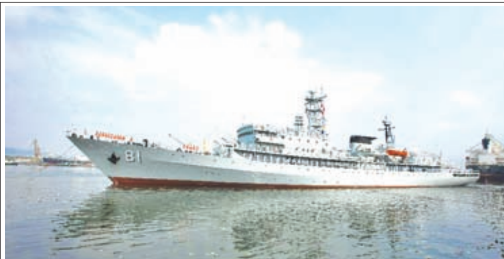
Chinese Navy training vessel Zhenghe arrives at port of Visakhapatnam in east Indian on 17 May, 2014. Chinese Navy training vessel Zhenghe and missile frigate Weifang arrived in port of Visakhapatnam in east Indian and started a 4-day visit on Saturday.