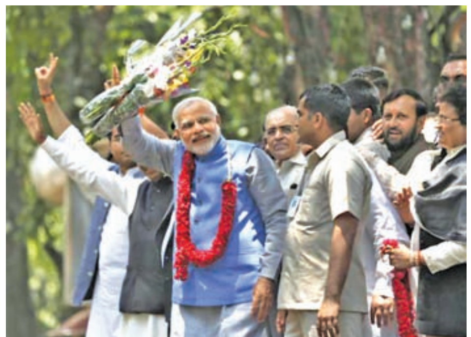
Hindu nationalist Narendra Modi (wearing a garland), the prime ministerial candidate for India's Bharatiya Janata Party (BJP), gestures to his supporters outside party's headquarters in New Delhi on 17 May, 2014.

Modi has given India its first parliamentary majority after 25 years of coalition governments, with his party winning more than six times the seats garnered by Congress. With almost all 543 seats declared by Saturday morning, Modi's BJP looked set to win 282 seats, 10 more than the majority required to rule. With its allied parties, it was heading for a comfortable tally of around 337 — the clearest result since the 1984 assassination of prime minister Indira Gandhi propelled her son Rajiv to office.— Reuters