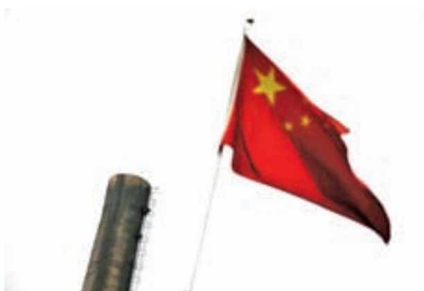
A Chinese national flag is seen in front of a chimney of a heat supply plant in Beijing on 13 May, 2014.

“Not only for reform draft planning, but also to solve the risks and problems