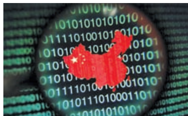
A map of China is seen through a magnifying glass on a computer screen showing binary digits in Singapore in this 2 Jan, 2014 photo illustration.

Wang's remarks coincide with a broad crackdown on online freedom of expression that has intensified since President Xi Jinping came to power last year. The crackdown has drawn criticism from rights advocates at home and abroad. "Now, overseas hostile forces are using the Internet as a main channel to penetrate and destroy (us)," Wang was quoted as saying. "Using the name of 'Internet freedom' to repeatedly attack, slander and spread rumors