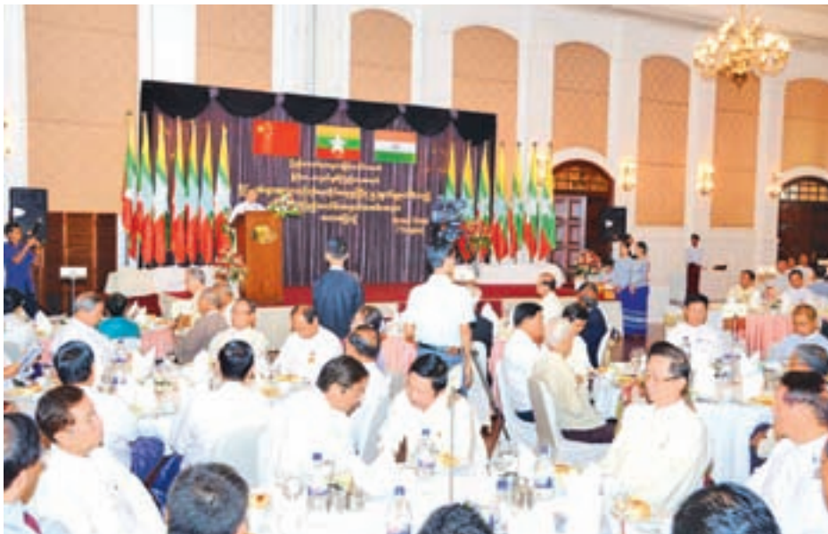
Union Minister U Wunna Maung Lwin addresses the ceremony to mark 60 th anniversary of the Five Principles of Peaceful Coexistence.