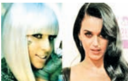
Lady Gaga seems to be suggesting that Katy is inspired by her earlier work.