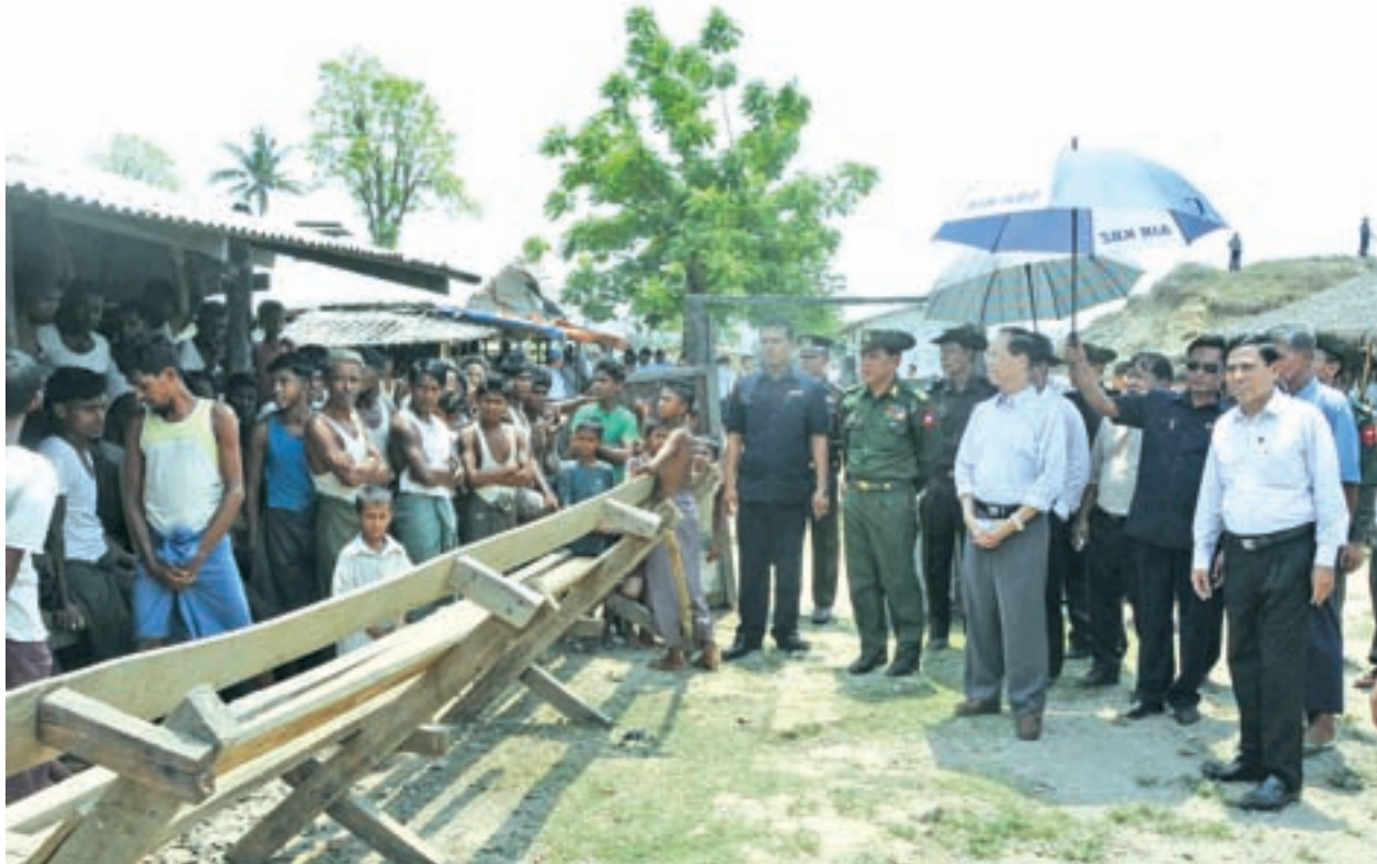
Vice-President Dr. Sai Mauk Kham in Rakhine State, discussing current security and development situation with local government officials and international aid organizations.