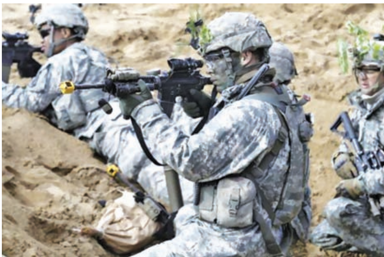
Paratroopers of the 173rd Airborne Brigade of the US Army in Europe take part in military exercise “Black Arrow” in Rukla on 14 May, 2014.

Longer term, the crisis will have a profound impact on NATO's relations