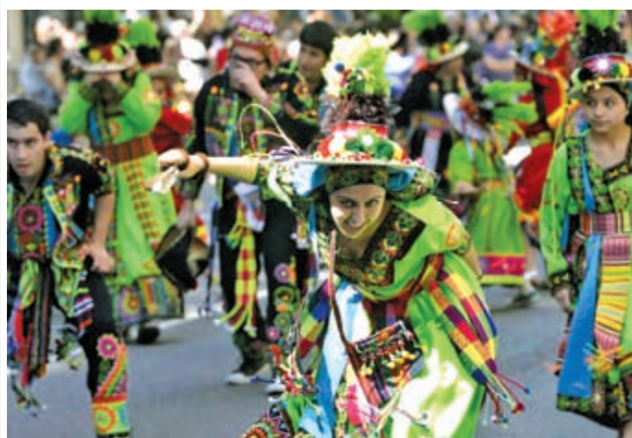
Dancers perform as they take part in the annual dance parade in New York City, the United States, on 17 May, 2014. Thousands of dancers came to Broadway in Manhattan of New York City during the dance parade on Saturday to perform over 70 types of dances that can be found around the world.