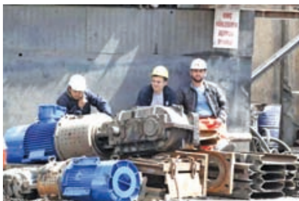
Miners rests in front of the coal mine in Soma, a district in Turkey's western province of Manisa, after a coal mine explosion on 17 May, 2014.

Hundreds of riot police patrolled the streets while others checked identity cards at three checkpoints on the approach road to Soma, a Reuters witness said. The local governor banned protests in response to clashes a day earlier between police and several