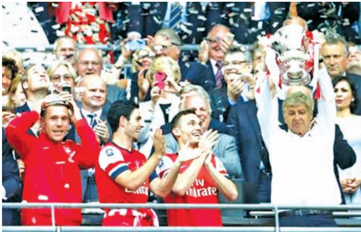
Arsenal manager Arsene Wenger (R) lifts the trophy as he celebrates with his players their victory against Hull City in their FA Cup final at Wembley Stadium in London, on 17 May, 2014.

LONDON, 18 May — Arsenal ended their nine-year wait for a major honour when they beat Hull City 3-2 after extra time in a pulsating FA Cup final on Saturday after a dreadful start when they conceded twice in the opening eight minutes.