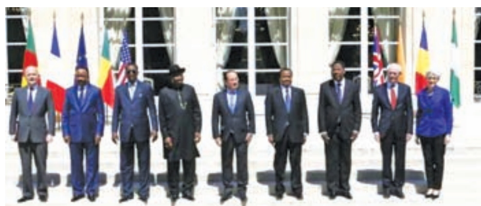
French President Francois Hollande (C) poses for a family photo with (LtoR) Britain's Foreign Secretary William Hague, Niger's President Mahamadou Issoufou, Chad's President Idriss Deby, Nigerian President Goodluck Jonathan, Cameroon's President Paul Biya, Benin's President Thomas Yayi Boni, European Council President Herman Van Rompuy and US Undersecretary of State for Political Affairs Wendy Sherman during a meeting at the Elysee Palace in Paris, on 17 May, 2014.

ter William Hague, speaking before the start of a meeting, said the Nigerian military was not organized in a way to deal effectively with the group, and offered military advisers to