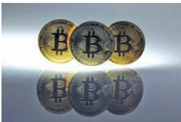
Mock Bitcoins are displayed on a table in an illustration picture taken in Berlin on 7 Jan, 2014.