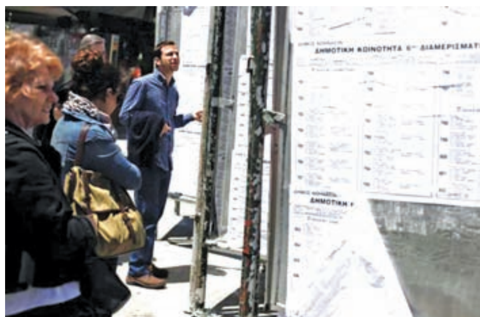
People look at billboards with voting information for the upcoming local government elections in Athens on 17 May, 2014.

A surprise second-place finish by Golden Dawn's spokesman Ilias Kasidiaris, who shot to fame after slapping a female lawmaker on live television, that allows him