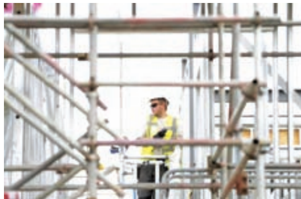
A construction worker assembles metal frames at a housing development project in south London on 6 Aug, 2013.

“We don’t want to build up another big debt overhang that is going to hurt individuals and is very much going to slow the economy in the medium