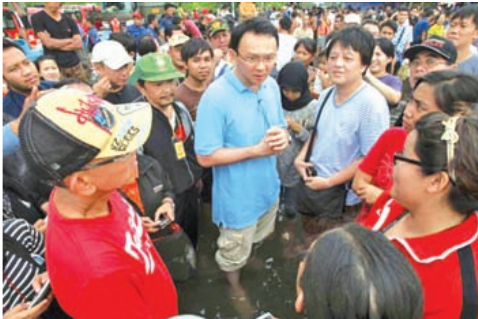
Basuki Tjahaja Purnama, Jakarta's then vice governor, talks to residents affected by floods during his visit to Jakarta on 19 Jan, 2013.

JAKARTA, 18 May — Indonesia's presidential race isn't until July. But there's already one winner.