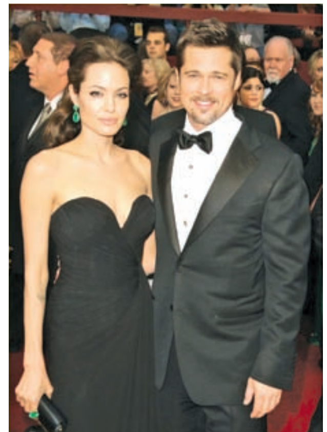
Angelina wrote the script for Brad and herself a few years ago.