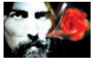
The 1971 George Harrison hit ‘My Sweet Lord’ was re-issued on 14 Jan, 2002 in aid of charity.

Harrison bought the guitar in 1963 in Mount