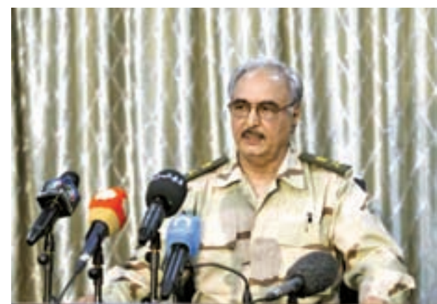
General Khalifa Haftar speaks during a news conference at a sports club in Abyar, a small town to the east of Benghazi, on 17 May, 2014.

"We'll come back with force," he told reporters at a sports club in Abyar, a small town to the east of Benghazi. "We've started