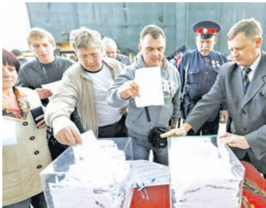
People cast ballots at a polling station during the referendum on the status of Donetsk and Luhansk regions, in Moscow on 11 May, 2014.

Ukrainian authorities and some Western countries denounced the controversial referenda as "illegal."