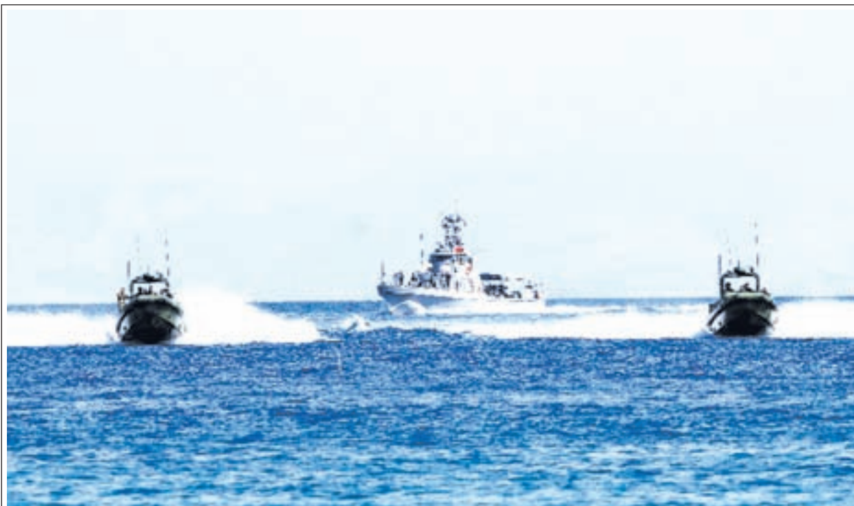
Soldiers from the Philippine Marines use a fast craft during the Amphibious Landing Training Exercise supervised by the US Marines as part of the US-Philippines military exercise dubbed as Balikatan at the Philippine Marine Base Camp in Cavite Province, the Philippines, on 11 May, 2014. The 30th annual joint military drill dubbed as Balikatan involves 3,000 Filipino soldiers and 2,500 US soldiers.