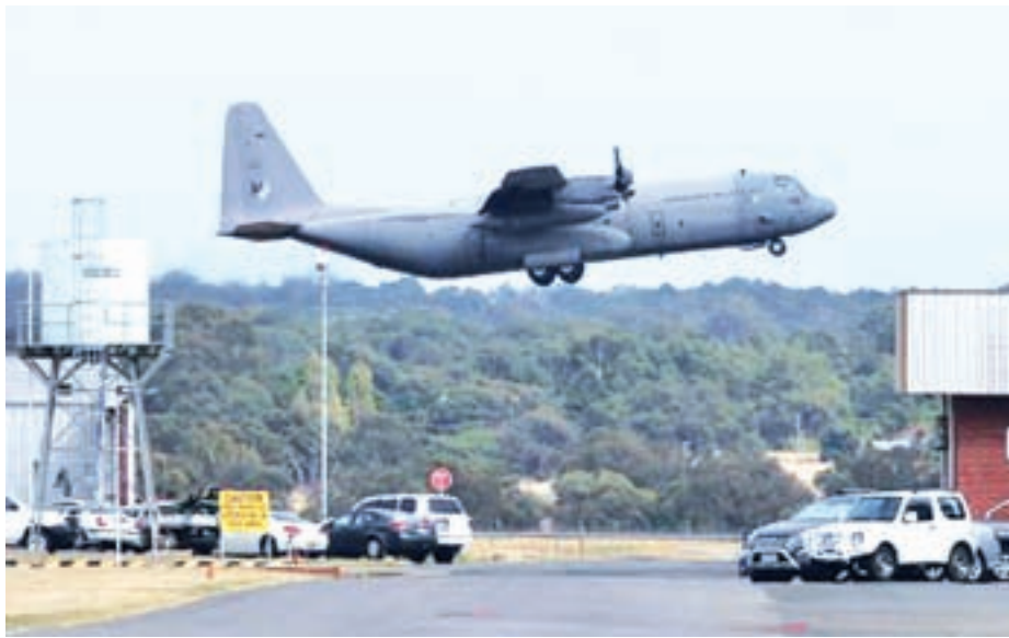
A Royal Malaysia Air Force C-130 takes off from RAAF base Pearce to help search for wreckage and debris of missing Malaysia Airlines Flight MH370, near Perth on 3 April, 2014.

pearance of a Malaysia Airlines passenger jet.