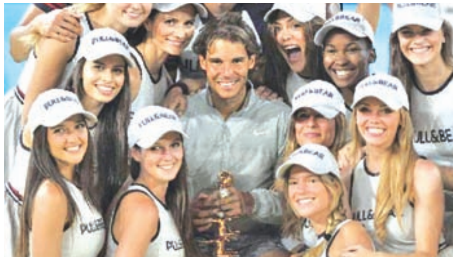
Rafael Nadal (C) of Spain poses with the ball kids during the awarding ceremony of the 2014 Madrid Tennis Open after claiming the champion of the men's singles match against Kei Nishikori of Japan in Madrid, Spain, on 11 May, 2014.