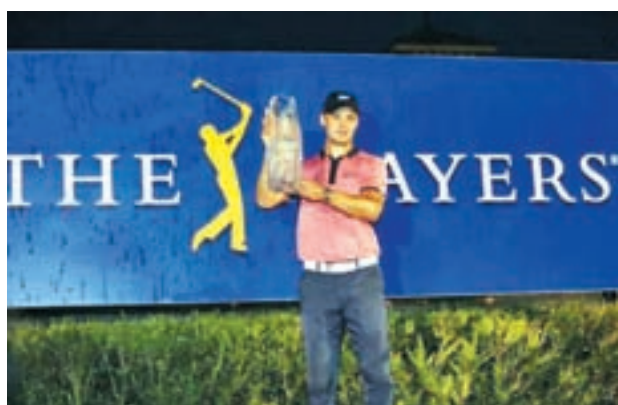
Martin Kaymer celebrates with the trophy after winning The Players Championship at TPC Sawgrass Stadium Course.

PONTE VEDRA BEACH, (Florida), 12 May — Martin Kaymer withstood an early challenge by Jordan Spieth, a weather delay and a late wobble to clinch his second PGA Tour title with a nervy one-shot victory at the Players Championship on Sunday. The German, co-leader overnight with American playing partner Spieth, produced rock-solid golf to move briefly four strokes clear, then survived a double-bogey on 15 as he closed with a one-under-par 71 at the challenging