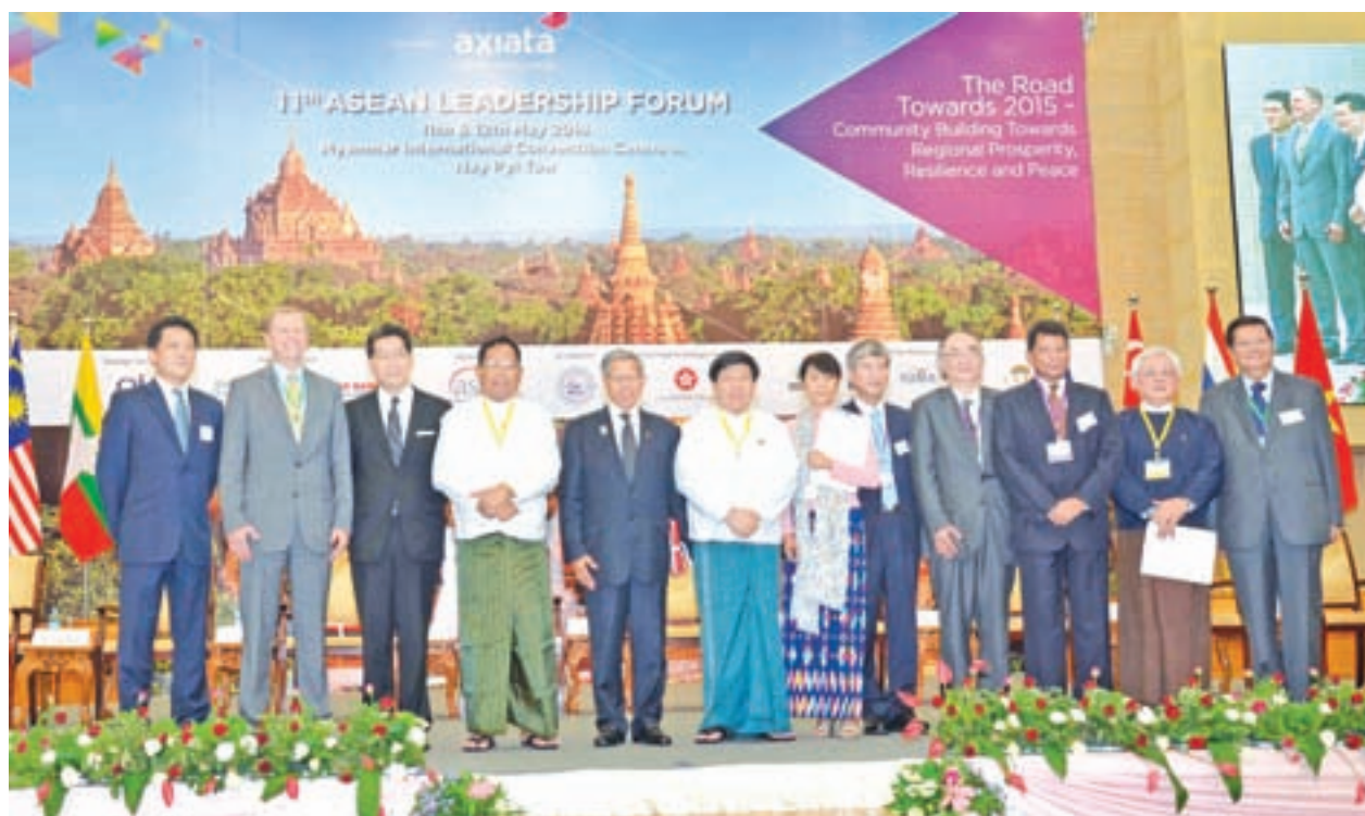
Union Minister for Commerce U Win Myint and party post for documentary photo at 11 th ASEAN Leadership Forum.—MNA

NAY PYI TAW, 12 May—The 11 th ASEAN Leadership Forum was held under the motto "The Road Towards 2015—Community Building Towards Regional Prosperity, Resilience and Peace" at the Myanmar International Convention Centre-2 in Nay Pyi Taw this morning.