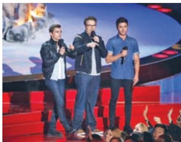
Zac Efron (R), Seth Rogen (C) and Dave Franco (L) present the award for Best Kiss at the 2014 MTV Movie Awards in Los Angeles, California on 13 April, 2014.

Rogen stars in "Neighbors" as a married former party guy transitioning into suburban parenthood with his wife, played by Rose Byrne. Rogen's character wages war with the neighboring frat house and its obnoxious president, played by "High School Musical" star Zac Efron. "Neighbors"