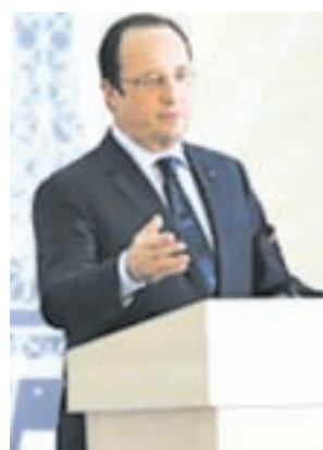
French President Francois Hollande delivers a speech as he visits a local French school under construction in Baku, on 11 May, 2014.

"With Nigerian President Goodluck Jonathan, I have proposed to hold a meeting with the countries