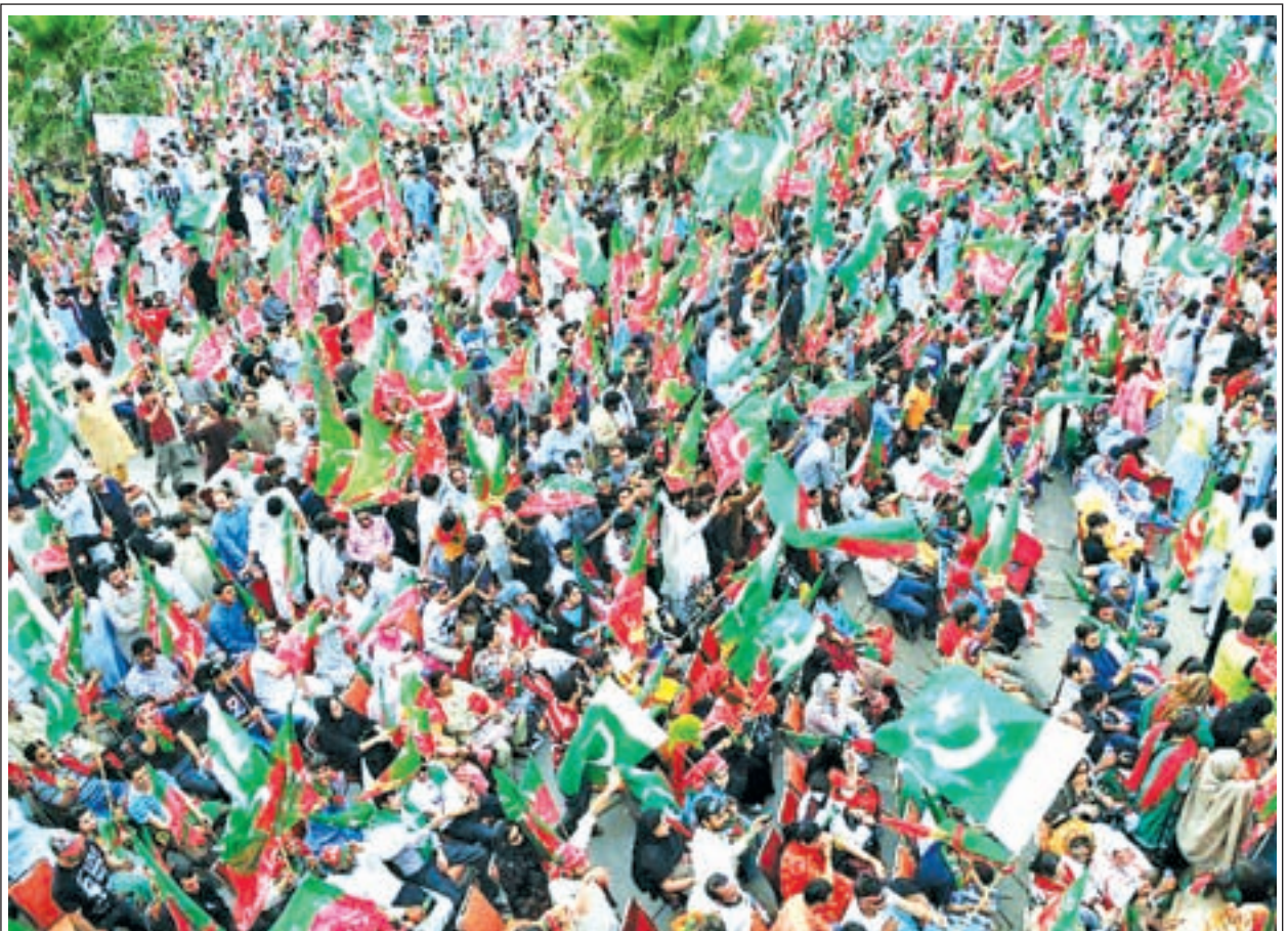
Supporters of Pakistan Tehreek-e-Insaf (PTI) wave party flags as they attend an anti-government protest rally in Islamabad, capital of Pakistan on 11 May, 2014. A senior opposition leader in Pakistan on Sunday demanded a new election chief to ensure transparent and fair election in the country.—XINHUA

The border regions are a particular concern for both countries as reports of attacks continue to surface. Last week, Iran arrested a number of “armed terrorists” in the southeastern Sistan and Baluchestan Province near the border with Pakistan, Press TV reported. Police said the suspects intended to carry out acts of “sabotage.”—Xinhua