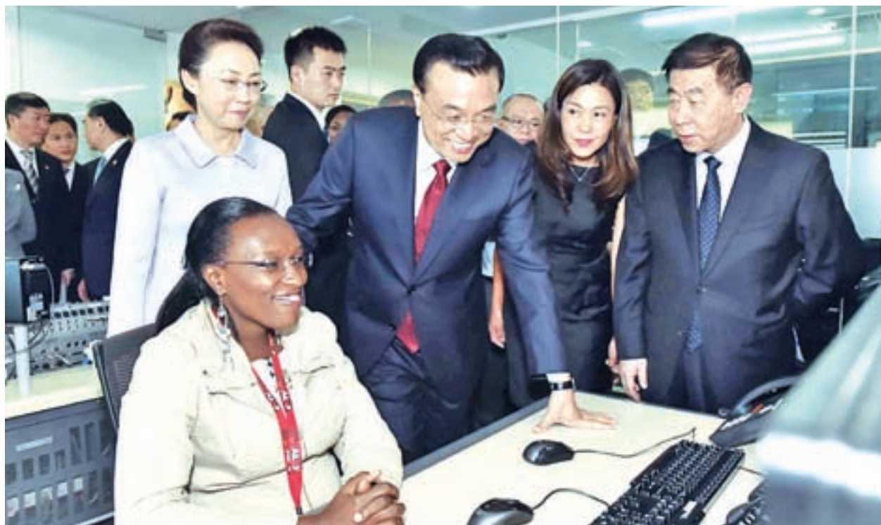
Chinese Premier Li Keqiang (C) talks with staff members during his visit to the office of the African branch of China Central Television (CCTV) in Nairobi, Kenya, on 11 May, 2014.

NAIROBI, 12 May — Chinese Premier Li Keqiang called on China and Africa to enhance media cooperation here on Sunday.