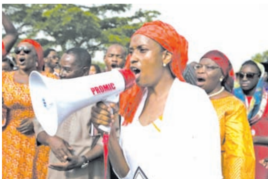
A woman demands for the release of 200 secondary school girls abducted in the remote village of Chibok, during a protest at Unity Park in Abuja on 11 May, 2014.