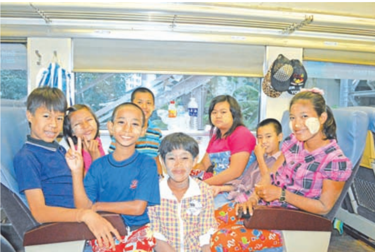
Smiling kids taking three-hour fun train ride on Yangon circle rail route.