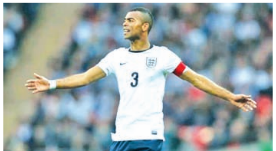
England's Ashley Cole gestures during their international friendly soccer match against Ireland at Wembley stadium in London on 29 May, 2013.

and he deserves enormous credit for the desire and brilliance which has shone through over the years he has represented his country." — Reuters