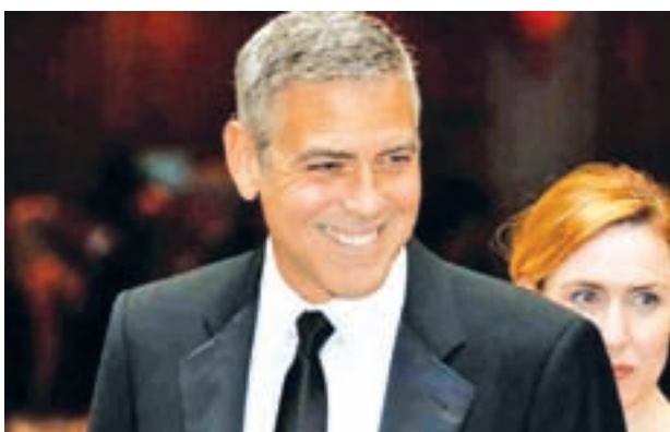
George recently got engaged to Amal Alamuddin.