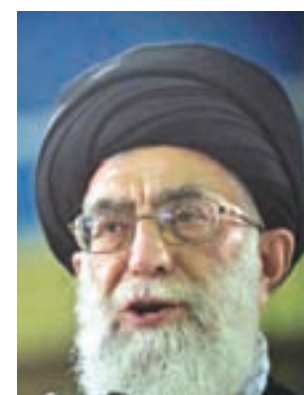
Iran's Supreme Leader Ayatollah Ali Khamenei

While missiles are not at the heart of the talks over Iran's nuclear work, which centre on the production