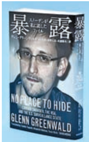
Photo shows the Japanese version of “No Place to Hide: Edward Snowden, the NSA, and the US Surveillance State,” a book written by former Guardian columnist Glenn Greenwald on CIA whistleblower Edward Snowden, which will be released in Japan on 14 May, 2014.