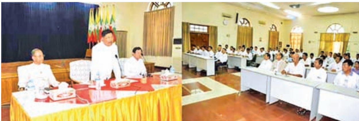
Union Ministers U Soe Thane and U Tin Naing Thein and Mandalay Region Chief Minister U Ye Myint meeting with civil society organizations in Mandalay.—MNA

The Union ministers and the chief minister made clarifications on the reports and coordinated matters related to the needs of the social associations.—MNA