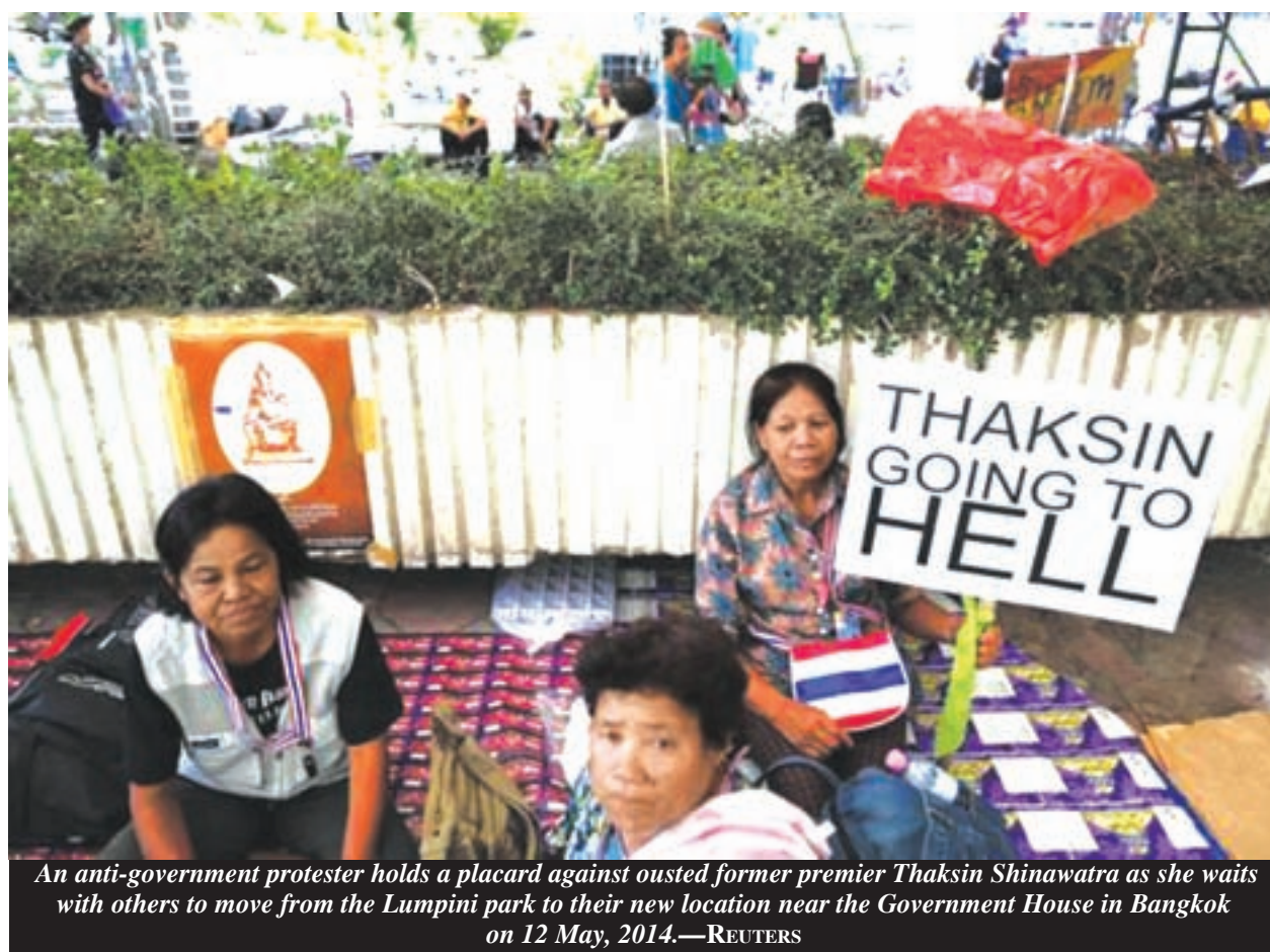
An anti-government protester holds a placard against ousted former premier Thaksin Shinawatra as she waits with others to move from the Lumpini park to their new location near the Government House in Bangkok on 12 May, 2014.

"Hopefully, we will have an election soon but it