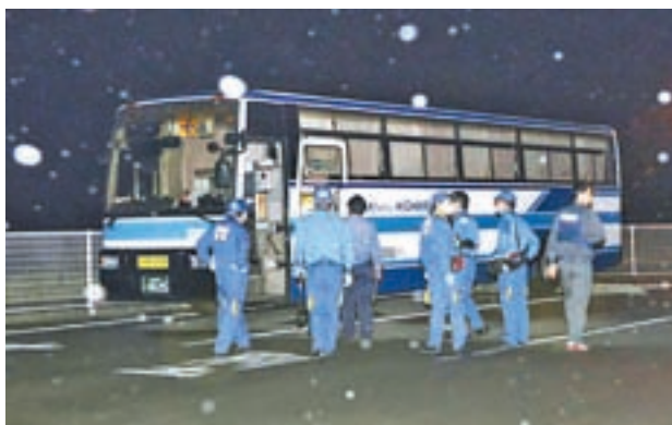
Photo taken in the early hours of 12 May, 2014, shows an intercity bus that was hijacked the previous night by a man holding scissors in Miyazaki Prefecture, southwestern Japan.

MIYAZAKI, 12 May — A man wielding a pair of scissors hijacked a bus on Sunday night on an expressway in southwestern Japan and was arrested on early Monday about three hours later, police said.