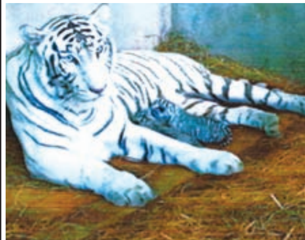
Two tiger cubs seen with their monther in Nay Pyi Taw Zoological Garden.—MNA

The two tigers from China are now kept at the Nay Pyi Taw Zoological Garden together with one tiger and one tigress which were taken from South Africa in August 2011.—NLM