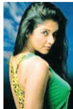
Asin, who acted as Abhishek Bachchan's sister in Bol Bachchan, will again share screen space with the actor in her upcoming movie All Is Well.