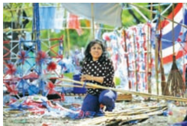
An anti-government protester collects wooden sticks as she moves with others from the Lumpini park to their new location near the Government House in Bangkok on 12 May, 2014.

targets included a shopping mall, which was set on fire, and electricity pylons. "One