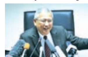
Thailand's interim PM Niwatthamrong Boonsongpaisan

The military, which has intervened frequently in politics in the past, has stayed out this time despite calls from some pro-establishment forces for it to oust the pro-Thaksin gov-