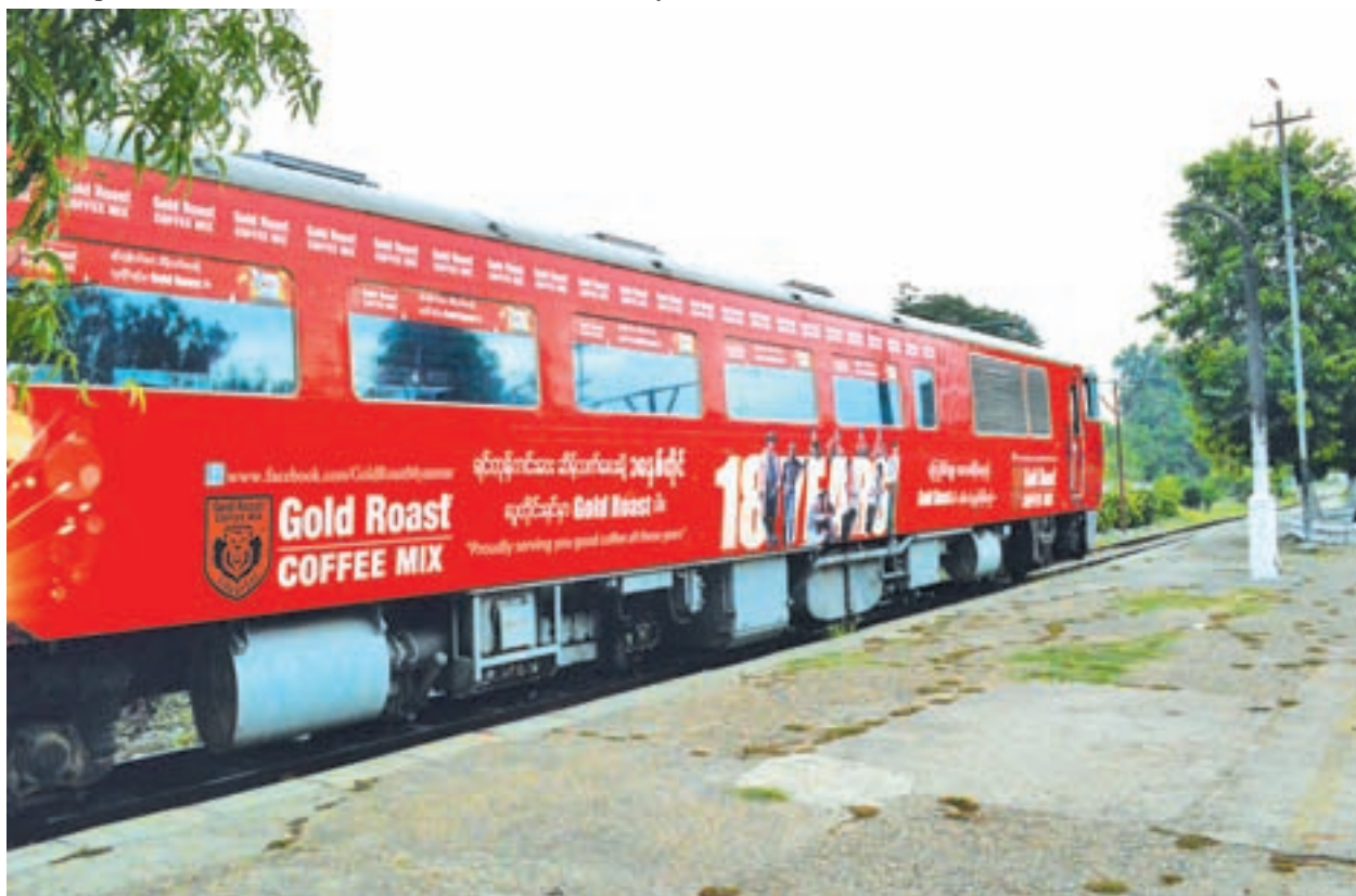
Five-cabin air-conditioned train at Insein Railway Station.

U Mya found himself at Insein Railway Station with his twin daughters and four other nieces, getting drenched with sweat. His team was in the station one-hour earlier than scheduled as they