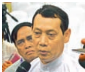
U Aung Lynn

A: Our ASEAN leaders discussed the South China Sea issue today, focusing on peace and stability in the ASEAN region. The South China Sea issue is complex.