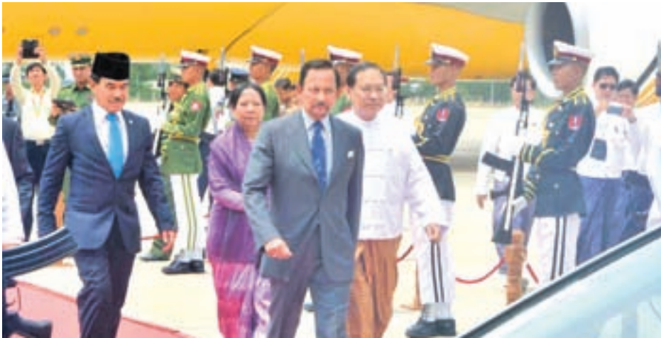
Brunei Sultan Haji Hassanah Bolkiah Mu'izzaddin Waddaulah of Brunei Darussalam on arrival at Nay Pyi Taw International Airport on 10 May.