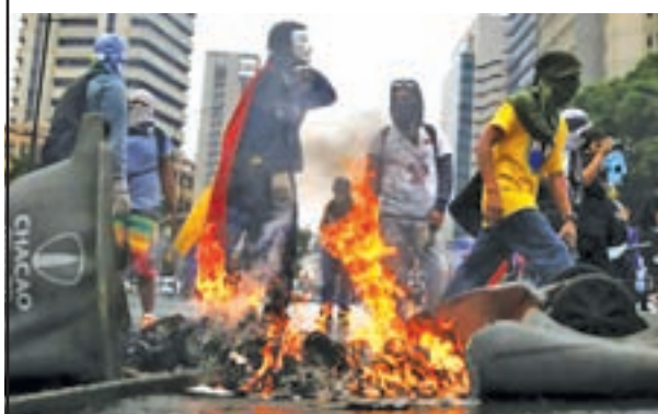
A small group of anti-government protesters block an avenue with a burning barricade after a march in Caracas on 10 May, 2014.

CARACAS, 11 May — Venezuelan President Nicolas Maduro has reacted furiously to calls in the United States for punitive measures against his government for alleged rights