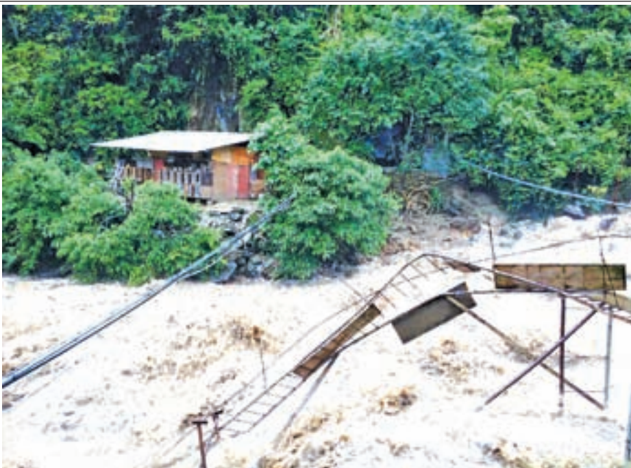
Photo taken on 10 May, 2014 shows the torrents of a river in Shangpa township, Fugong county, southwest China's Yunnan Province. Mountain torrents damaged 14 houses and severed power supply on Saturday as a heavy rain hammered the region.