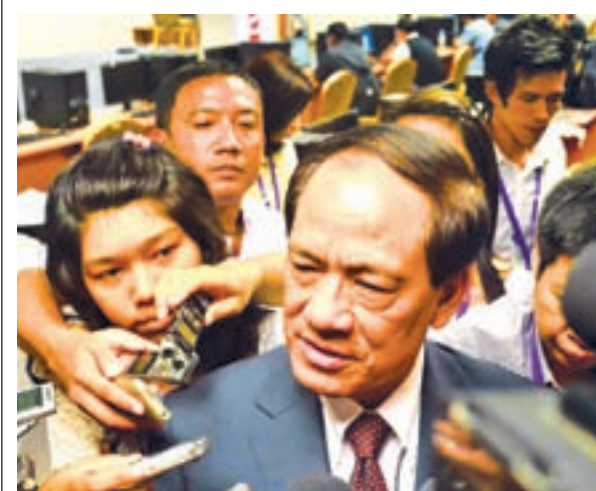
Secretary-General of ASEAN Le Luong Minh said for the bloc to be able to focus on the community building process—on the development and the striving for prosperity—ASEAN needs an environment of peace, stability and security in the South China Sea.