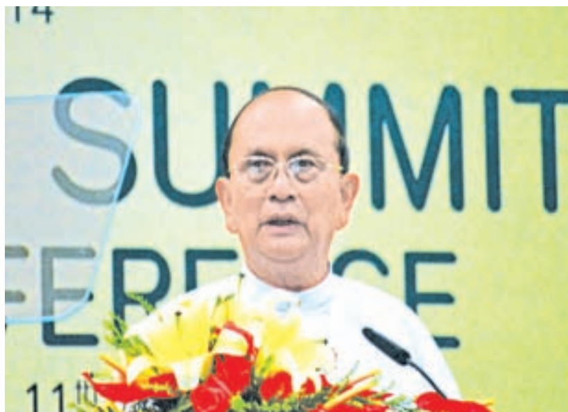
President U Thein Sein briefs the mediapersons on the 24 th ASEAN Summit.

NAY PYI TAW, 11 May—A press conference concerning the ongoing 24 th ASEAN Summit and its related meetings took place at Thanda Hall of Myanmar International Convention Centre here this evening, with a briefing by President of the Republic of the Union of Myanmar U Thein Sein, reports said.