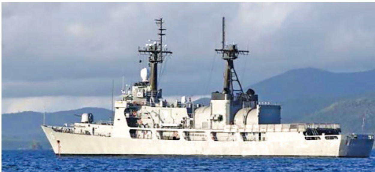
A Philippine warship BRP Ramon Alcaraz (PF 16) is pictured anchored in Ulugan Bay near a naval forces camp in Palawan Province, southwest Philippines on 31 March, 2014.

"We would not rule out a new form of nuclear test for bolstering up our nuclear deterrence," it said in March.—Reuters