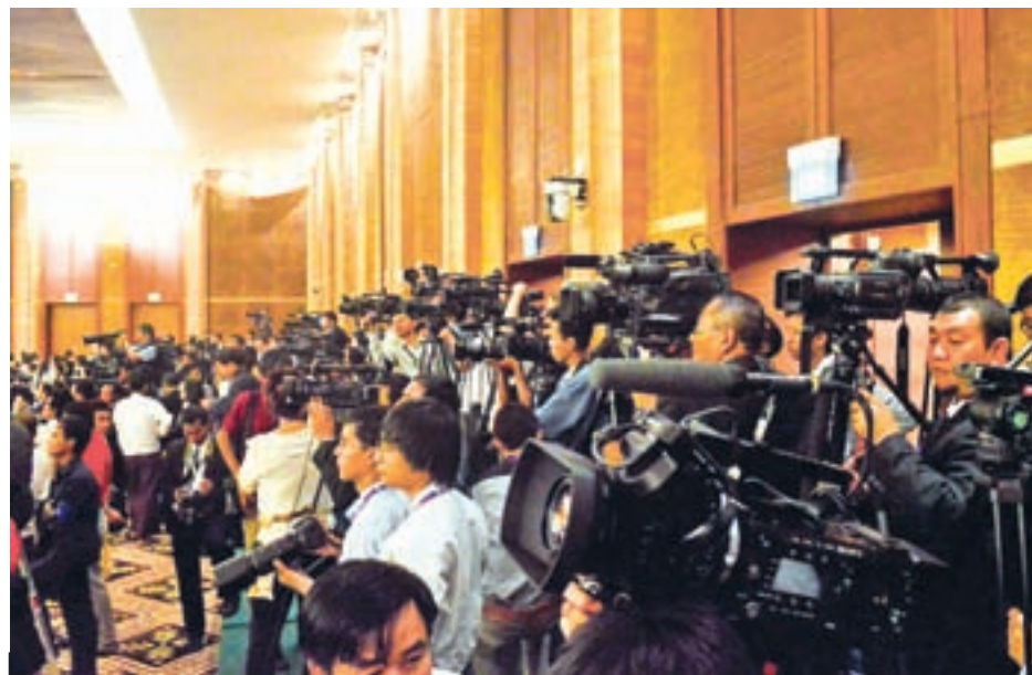
Mediapersons at home and abroad seen at 24 th ASEAN Summit in Nay Pyi Taw.

President U Thein Sein, on behalf of ASEAN, is scheduled to attend G-20 Summit to be held in Brisbane, Australia, from 15 to 16 November this year.—MNA