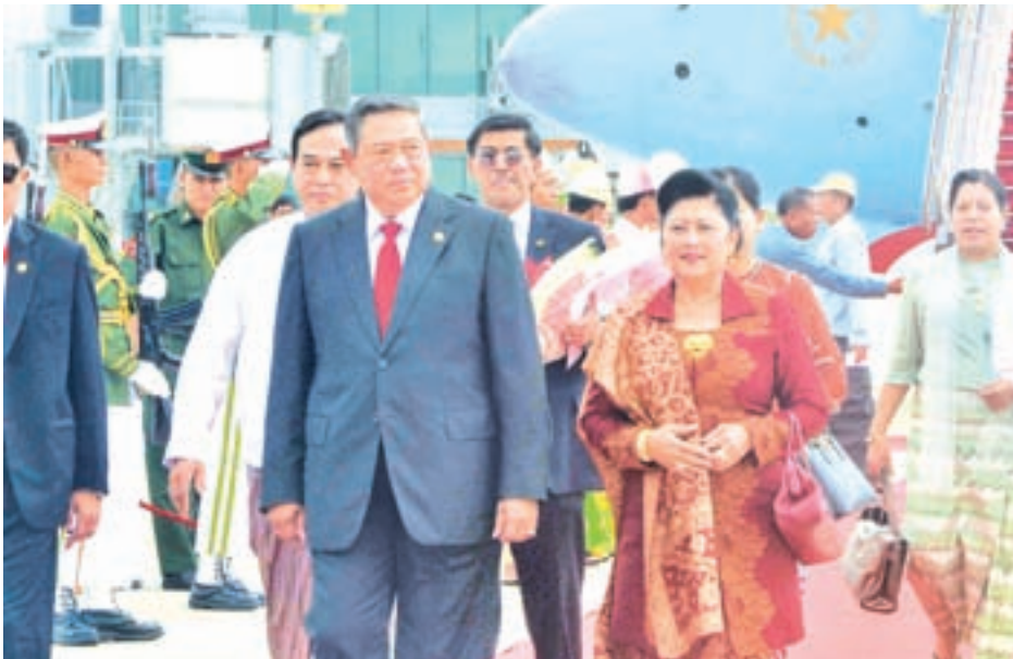
Indonesian President Dr. Susilo Bambang Yudhoyono and wife on arrival at Nay Pyi Taw International Airport.