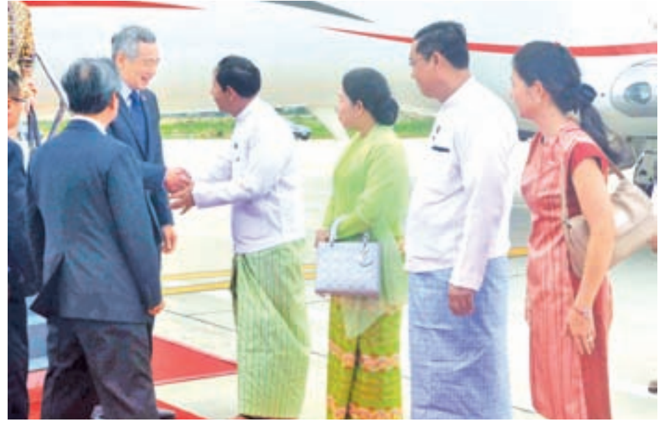
Singaporean Prime Minister Mr. Lee Hsein Loong being welcomed at Nay Pyi Taw International Airport.