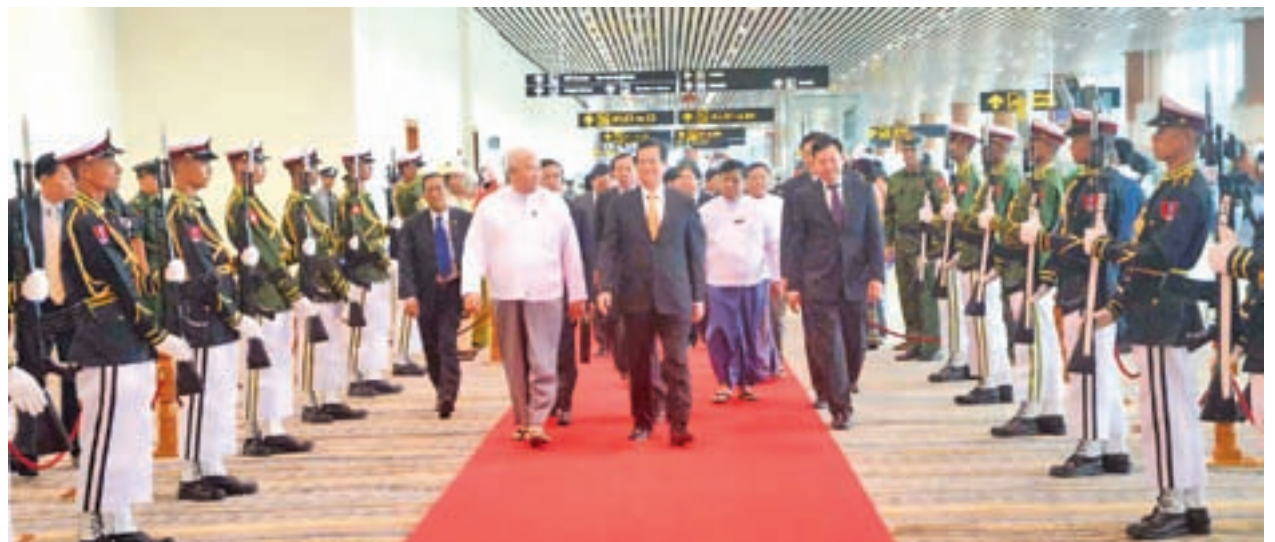
Vietnamese Prime Minister Nguyen Tan Dung being welcomed at Nay Pyi Taw International Airport.