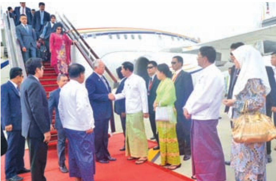
Malaysian Prime Minister Dato Sri Haji Mohammad Najib arrived at Nay Pyi Taw International Airport.