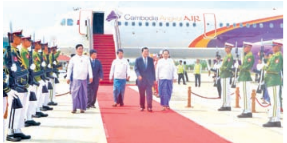
Cambodian Prime Minister Samdech Hun Sen on arrival at Nay Pyi Taw International Airport.