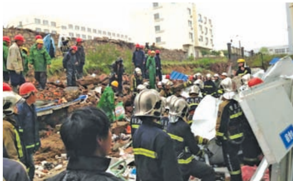
Photo taken by a mobile phone shows rescuers working at the accident site in Huangdao Island, east China's Shandong Province, on 11 May, 2014. Eighteen people were killed and another three injured on early Sunday morning after a rainstorm-triggered wall collapsed here, said local authorities.