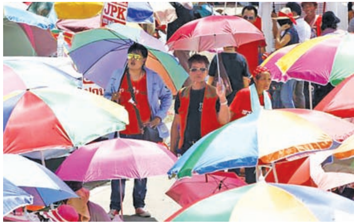
Member of the pro-government "red shirt" group holds an umbrella during a rally in Nakhon Pathom province on the outskirts of Bangkok, on 11 May, 2014.

The sometimes violent protests against Yingluck and Thaksin have sapped investor confidence, fright-