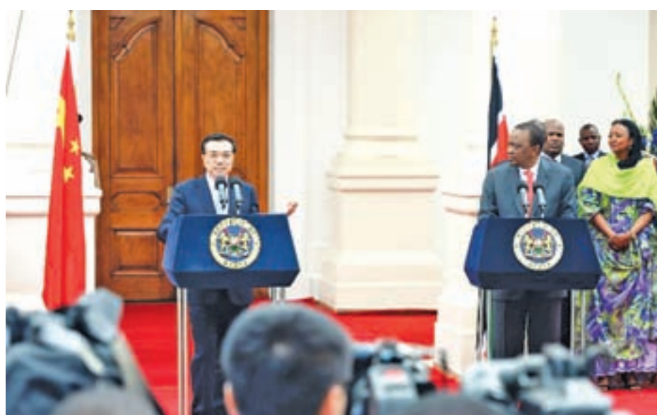
Chinese Premier Li Keqiang (1st L) and Kenyan President Uhuru Kenyatta (2nd L) attend a joint Press conference after their talks in Nairobi, Kenya, on 10 May, 2014.

Kenya is the last leg of Li's first Africa trip as premier, which has already taken him to Ethiopia, Nigeria and Angola.