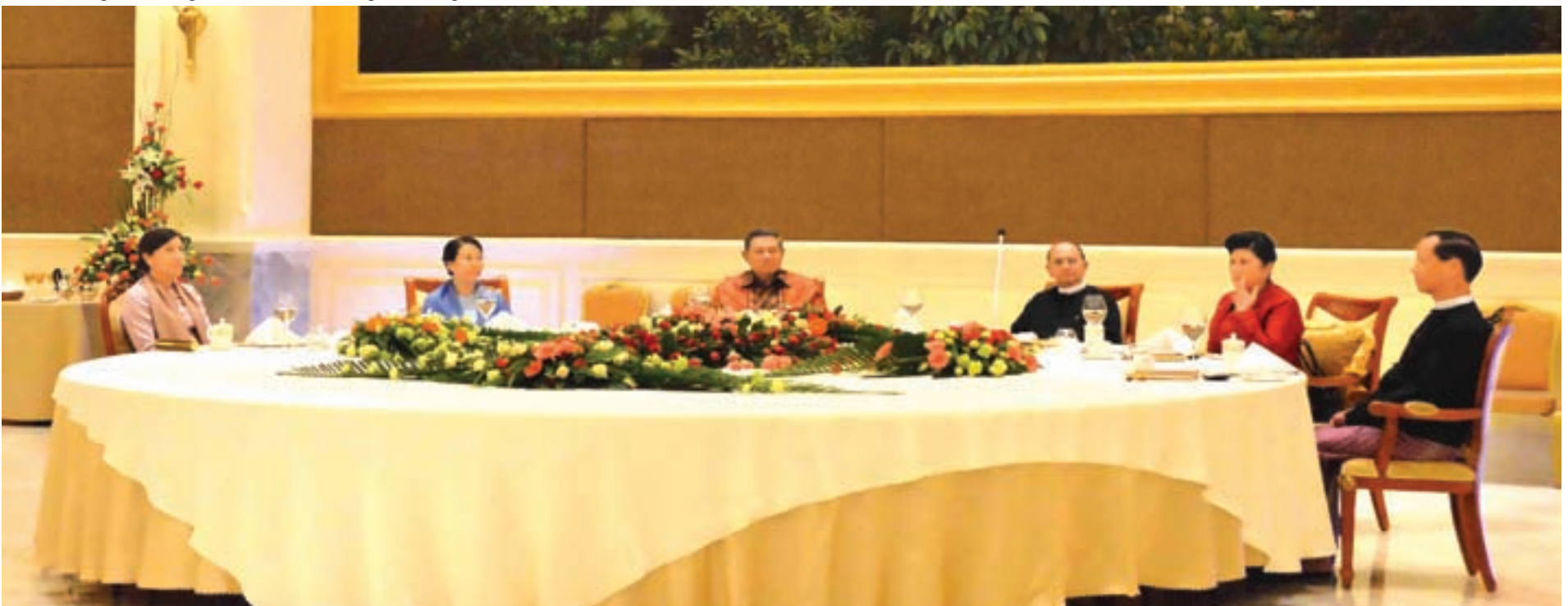
President U Thein Sein and wife, Indonesian President Dr. Susilo Bambang Yudhoyono and wife and Vice-President Dr. Sai Mauk Kham and wife seen at the dinner.