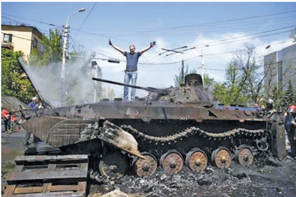
A man reacts as he stands on top of burnt-out armoured personal carrier near the city hall in Mariupol, eastern Ukraine on 10 May, 2014.

MARIUPOL, 11 May — Ukrainian leader Oleksander Turchinov warned pro-Russian eastern regions they would be stepping into the abyss if they voted for self-rule on Sunday in a referendum that has raised Western fears of a slide to full civil war. Barricades of tyres and scrap metal blocked streets in the port city of Mariupol and in Slavi-ansk, centres of an uprising that has unleashed the worst crisis between the West and Russia since the Cold War. There was a clash between army and rebels near Slaviansk late on Saturday, but fighting had largely abated.