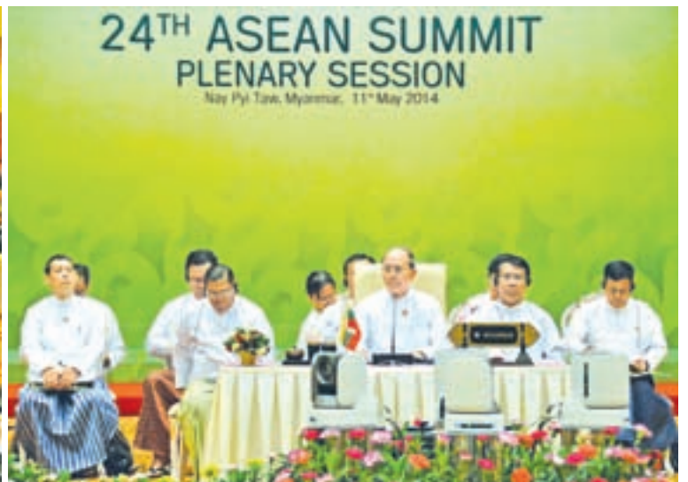
President U Thein Sein addresses 24 th ASEAN Summit Plenary Session in Nay Pyi Taw on 11 May 2014.