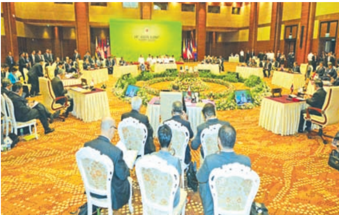
Heads of State/Government of ASEAN countries attending 24 th ASEAN Summit (Retreat Session) in Nay Pyi Taw on 11 May.