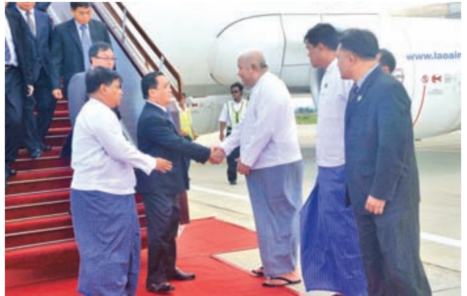
Laotian Prime Minister Mr Thongsing Thammavong being welcomed at Nay Pyi Taw International Airport.