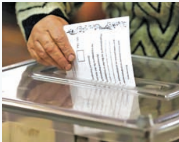
A voter casts a ballot during a referendum in the eastern Ukrainian city of Slaviansk on 11 May, 2014.

Rebels seized government and police buildings in the east with very little