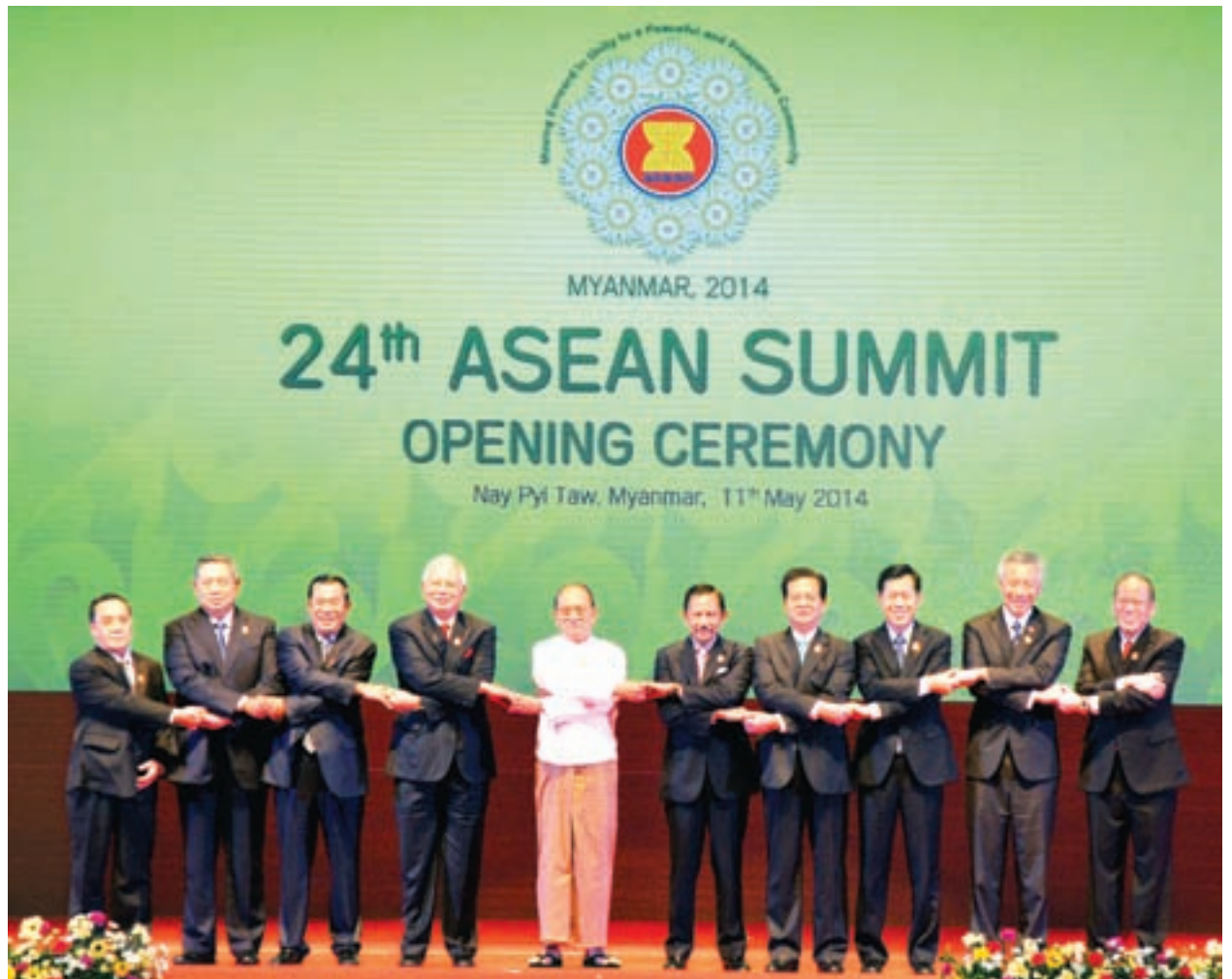
President U Thein Sein and heads of State/Government pose for documentary photo at opening ceremony of 24 th ASEAN Summit in Nay Pyi Taw.

the importance of promoting the "resilience of ASEAN economies and equitable economic development," saying this could be achieved by enhancing "productivity, competitiveness and innovation in ASEAN, especially with small and medium sized enterprises, and the establishment of the ASEAN SME Development Fund as outlined in the ASEAN Economic Community Blueprint." Large parts of the president's speech addressed the impact of climate change. He said disasters have yet to be dealt with adequately by the ASEAN Humanitarian Assistance Center and that in order to deal with the issue an ASEAN Rapid Response capacity should be established, including a pool of rescue and relief experts and equipment in each member country that can be deployed quickly in the event of disasters.