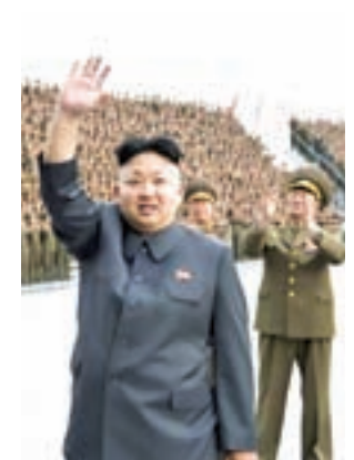
North Korean leader Kim Jong Un

A US official said the United States is "closely monitoring" the situation on the Korean peninsula and urged North Korea to refrain from actions that