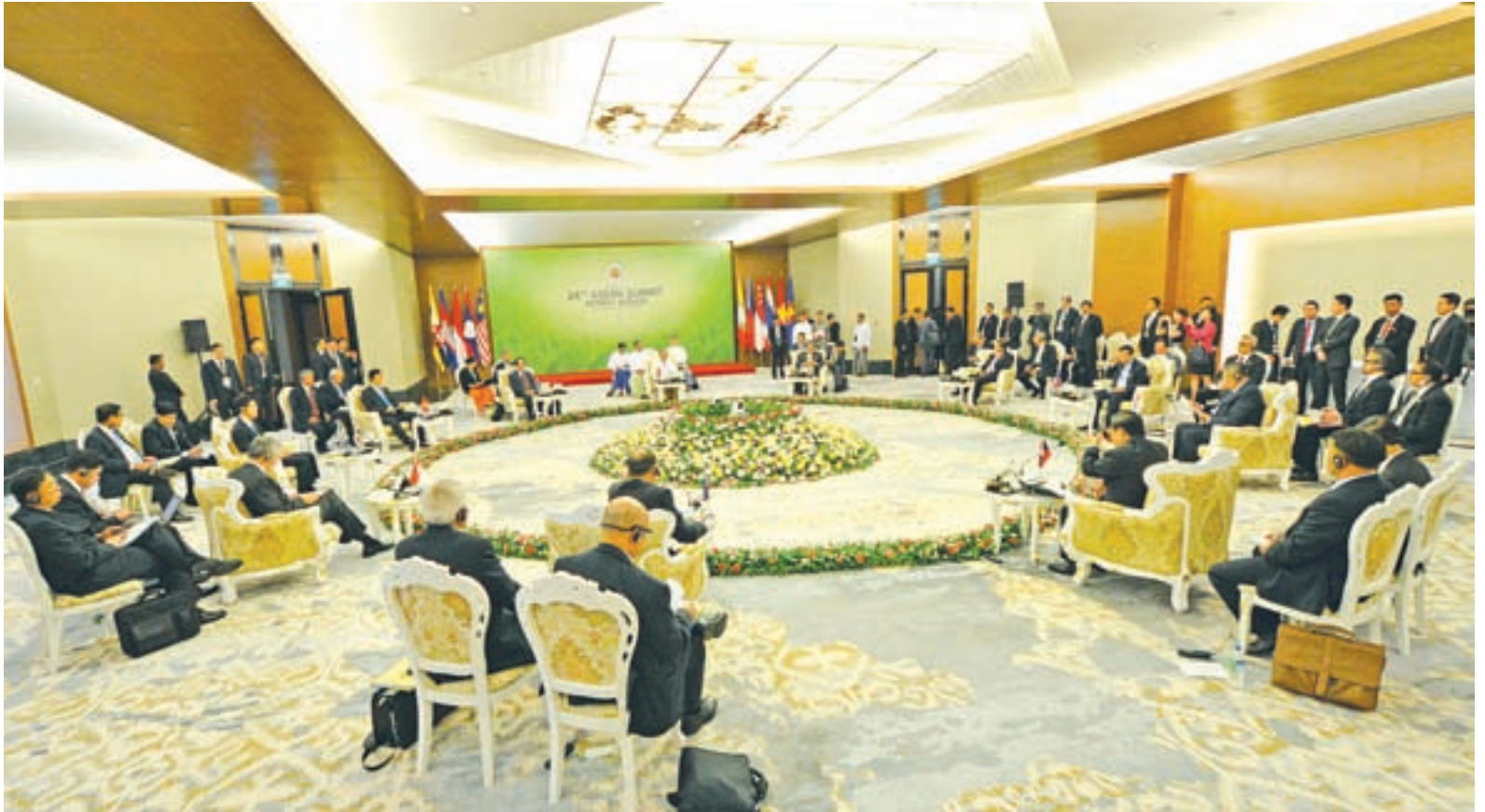
President U Thein Sein delivers an address at 24 th ASEAN Summit Retreat Session in Nay Pyi Taw on 11 May.—MNA