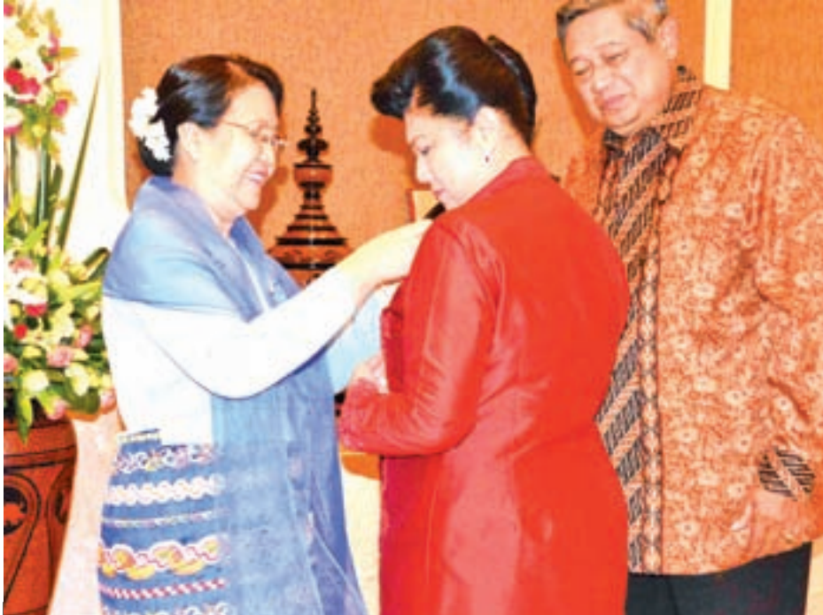
Daw Khin Khin Win, wife of President U Thein Sein, puts brooch on wife of Indonesian President Dr. Susilo Bambang Yudhoyono at the dinner.

He also said emphasis is placed on reduction of poverty, rural development