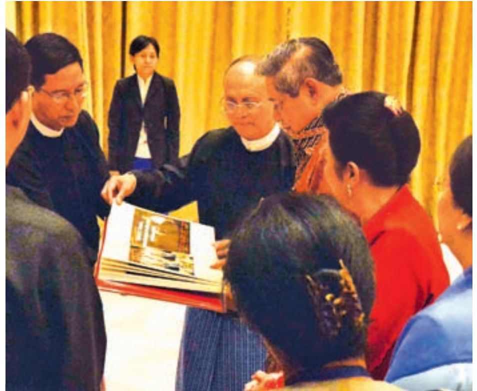
President U Thein Sein shows photo album to Indonesian President Dr. Susilo Bambang Yudhoyono and wife.

President U Thein Sein called for the need to lay down correct policies for business firms in the establishment of the ASEAN economic circle. The dinner drew the Indonesian president and his cabinet members, and representatives from China, Japan, Korea, the European Union, Canada, Australia and the Middle East.