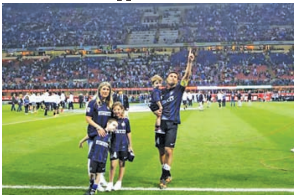
Inter Milan's captain Javier Zanetti (R) celebrates with his family at the end of their Italian Serie A match against Lazio at San Siro stadium in Milan on 10 May, 2014.