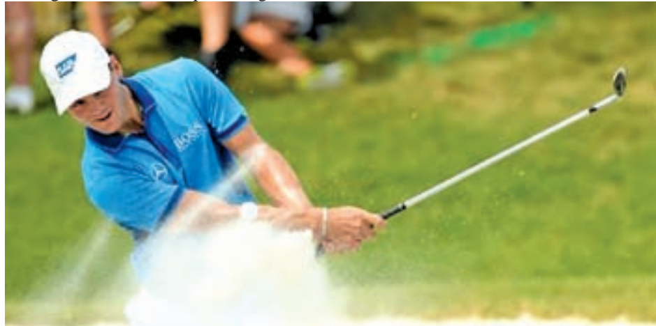
Martin Kaymer plays from a bunker on the 9th hole during the third round of The Players Championship at TPC Sawgrass —Stadium Course.