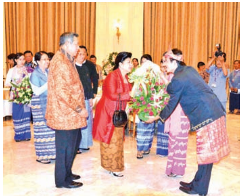
Indonesian President Dr. Susilo Bambang Yudhoyono and wife present basket of flowers to Myanmar traditional artists.