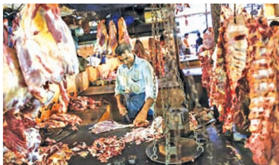
A butcher cuts up portions of beef for sale in an abattoir at a wholesale market in Mumbai on 11 May, 2014.

defines the "cow and its progeny" as integral to India's cultural heritage — appealing to the party's core constituency of Hindus who abhor eating beef.