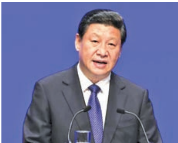
China's President Xi Jinping

BEIJING, 11 May — China's President Xi Jinping has called for the acceleration of land transfers to help modernize the country's agriculture, state media reported on Saturday.