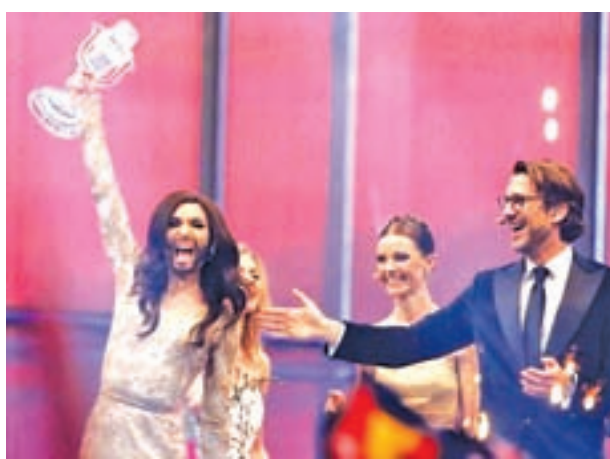
Conchita Wurst (L) representing Austria celebrates after winning the grand final of the 59th Eurovision Song Contest at the B&W Hallerne in Copenhagen on 10 May, 2014.