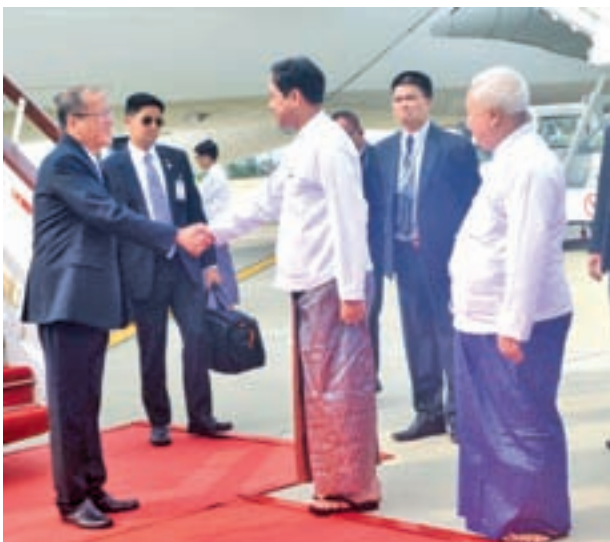
President Mr. Benigno Aquino of the Philippines arrived at Nay Pyi Taw International Airport.