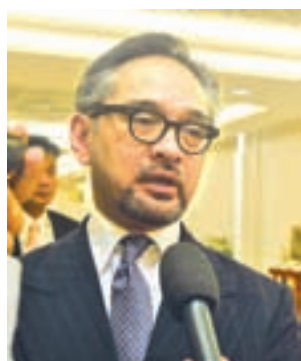
Indonesian Foreign Minister Marty Natalegawa seen at an interview.