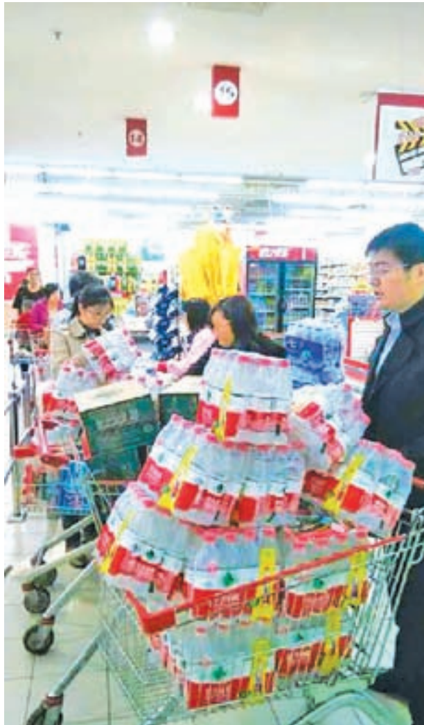
Residents purchase bottled drinkable water at a supermarket in Jingjiang City, east China's Jiangsu Province, on 9 May, 2014.