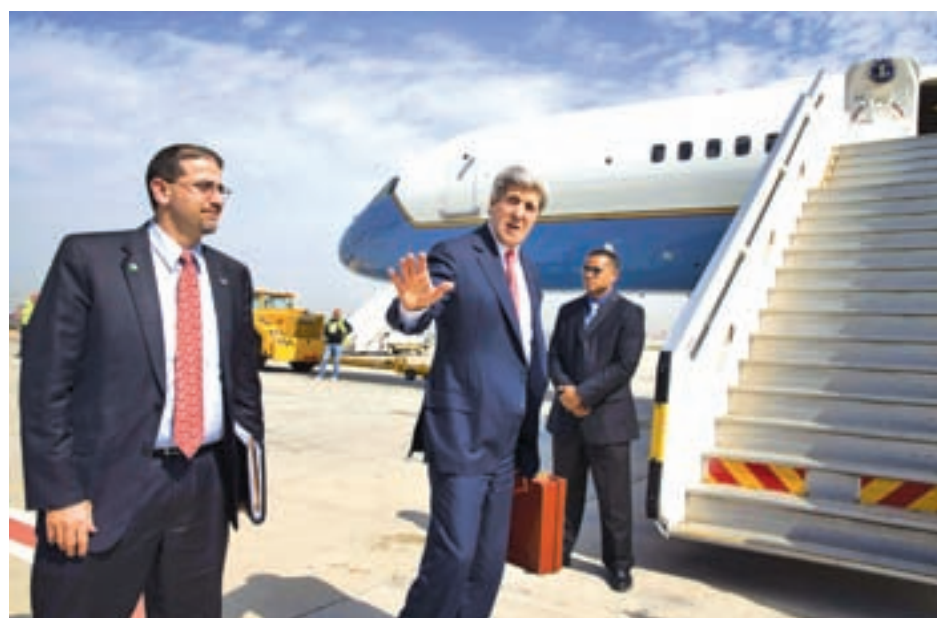
US Secretary of State John Kerry says goodbye to US Ambassador to Israel Daniel Shapiro (L) as he leaves Tel Aviv on 1 April, 2014.

WASHINGTON, 9 May — Israeli and Palestinian leaders were unwilling to make the “gut-wrenching” compromises needed for peace, a top US official said on Thursday, faulting both sides for the collapse of talks last month.