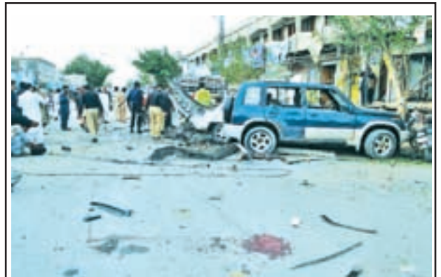
People gather at the blast site in Quetta, southwest of Pakistan, on 8 May, 2014. At least two people were killed and 16 others injured when a bomb exploded near a government office in Pakistan's southwest Quetta city on Thursday, officials said.