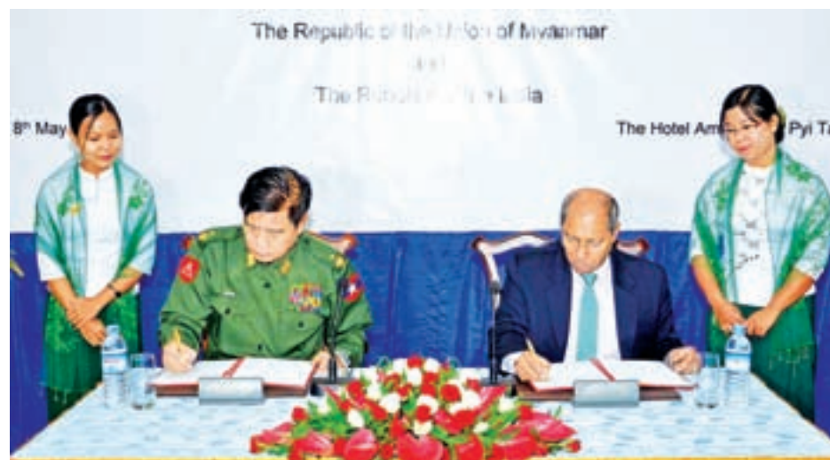
Deputy Minister for Defence Maj-Gen Kyaw Nyunt and Indian Ambassador Mr. Gautam Mukhopadhyaya sign MoU on cooperation in border affairs.