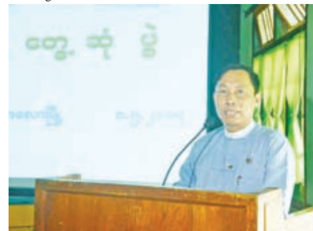
Speaker of the Union and People's Parliaments Thura U Shwe Mann speaking at the ceremony to meet locals in Kalaw of Shan State.