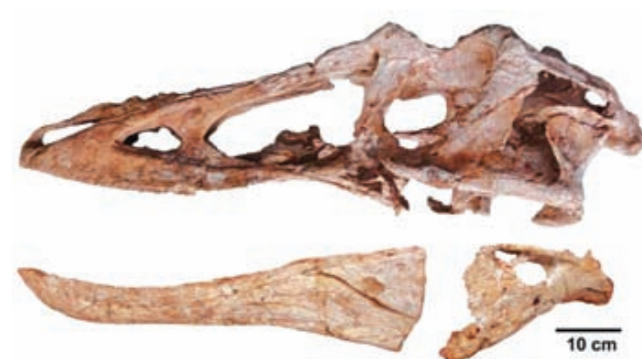
The skull of Qianzhousaurus sinensis (upper jaw in left lateral view and lower jaw in reversed right lateral view) is pictured in this undated handout photo.

Qianzhousaurus was smaller than T. rex, which lived at the same time in North America, measured about 40 feet (12 meters) long and was the largest known land predator ever. Even though it still had the “toothy grin” of T. rex, the unique snout of Qianzhousaurus and its more slender build suggested it favored different types of prey than “conventional” ty-