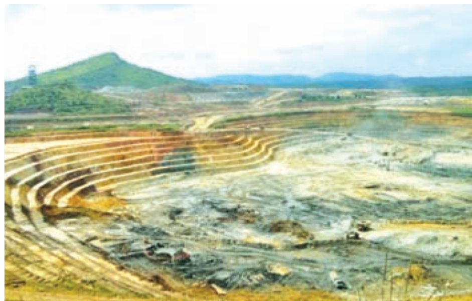
The KCD open pit gold mine at the Kibali mining site in northeast Democratic Republic of Congo, on 1 May, 2014.