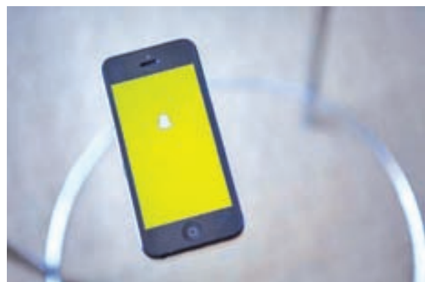
A portrait of the Snapchat logo in Ventura, California on 21 Dec, 2013.

The Millennium Technology Prize was set by the Finnish government in 2004 to honour individuals and groups who have made significant contributions in the fields of science and technology, aiming to particularly highlight innovations that assist and enrich everyday lives. The prize is awarded every two years by Technology Academy Finland, an independent foundation established by Finnish industry and the Finnish state in partnership.— Xinhua