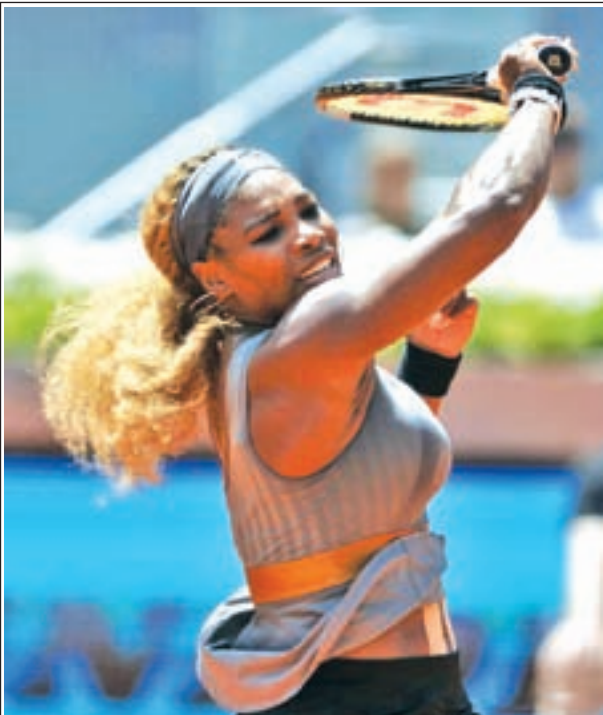
Serena Williams of the United States serves to Spain's Carla Suarez Navarro during the women's singles third round at the Madrid Open tennis tournament in Madrid, capital of Spain, on 8 May, 2014. Williams won 2-0.

chief of staff, it said. Prior to that, he held a number of senior positions at the UN Secretariat in New York and in Africa, including with the UN Operation in Burundi.— Xinhua