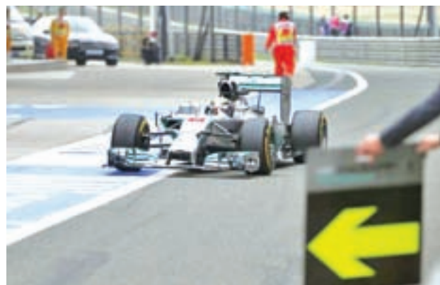
Mercedes Formula One driver Lewis Hamilton of Britain drives to a pit stop during the Chinese F1 Grand Prix at the Shanghai International Circuit on 20 April, 2014.

Critics panned the softer sound at the season-opening Australian Grand Prix with promoters complaining and the sport's commercial supremo Bernie Ecclestone saying the noise needed to be louder. —Reuters