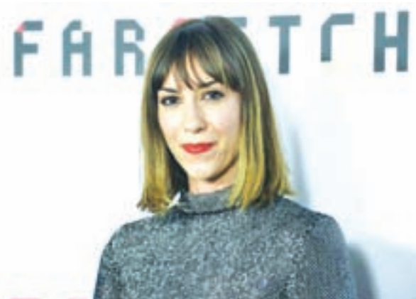
Director Gia Coppola attends the premiere of the film "Palo Alto" in Los Angeles in this file photo.