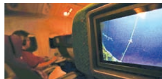
A screen on board Malaysia Airlines Boeing 777-200ER flight MH318 shows the plane’s flight path as it cruises over the South China Sea from Kuala Lumpur towards Beijing, at approximately the same point when on 8 March flight MH370 lost contact with air traffic controllers, at approximately 1.30am on 17 March, 2014.—REUTERS

Pressure for improved tracking of aircraft has increased since the Malaysian jet vanished exactly two months ago. A search for the aircraft and its black boxes in the southern Indian Ocean has so far failed to produce results.— Reuters