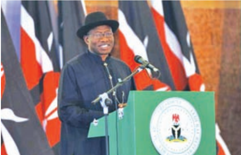
Nigeria's President Goodluck Jonathan speaks during a Nigeria-Kenya bilateral business meeting in Abuja, on 5 May, 2014.

ABUJA/MAIDUGURI, 9 May — Nigerian President Goodluck Jonathan promised on Thursday to find more than 200 schoolgirls abducted by Islamist rebels, as the hostage crisis overshadowed his opening address to a conference designed to showcase investment opportunities in Africa's biggest economy.