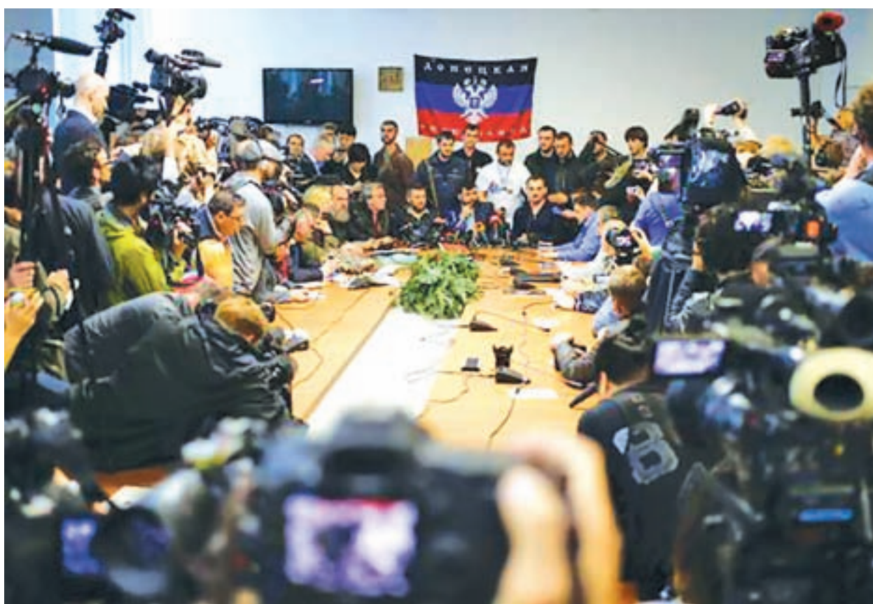
Pro-Russian separatist leaders hold a news conference inside a regional government building in Donetsk, eastern Ukraine on 8 May, 2014.

“Civil war has already begun,” he told reporters. “The referendum can put a stop to it and start a political process.” A man holding a Kalashnikov stood behind him.