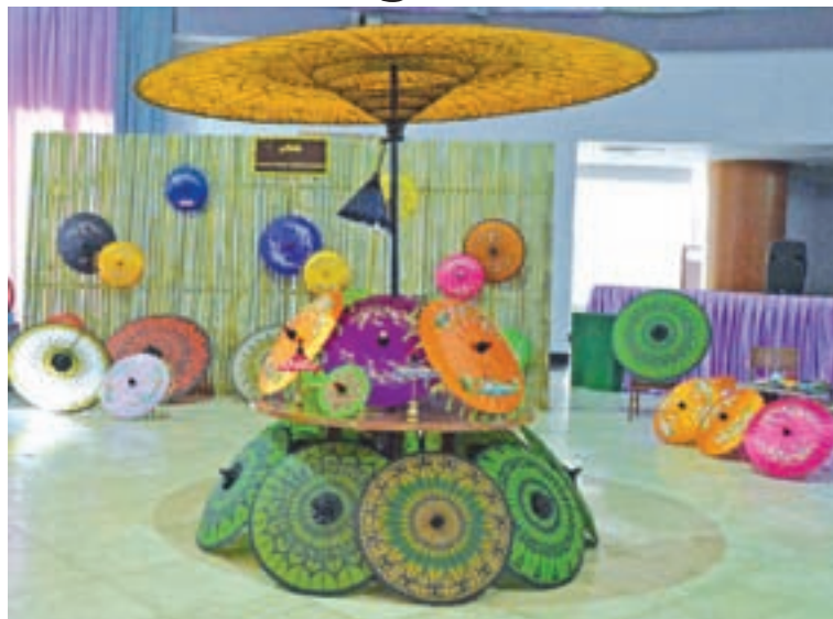
Traditional Patheingyi umbrellas displayed at Myanmar arts and crafts exhibition at Mani Yadana Jade Hall.

Pyu Period offers historical evidence that Myanmar have long been boasting their high standard of culture, dating back to over 2,000 years. Myanmar traditional handicrafts have since been not only impressive but also artful. To