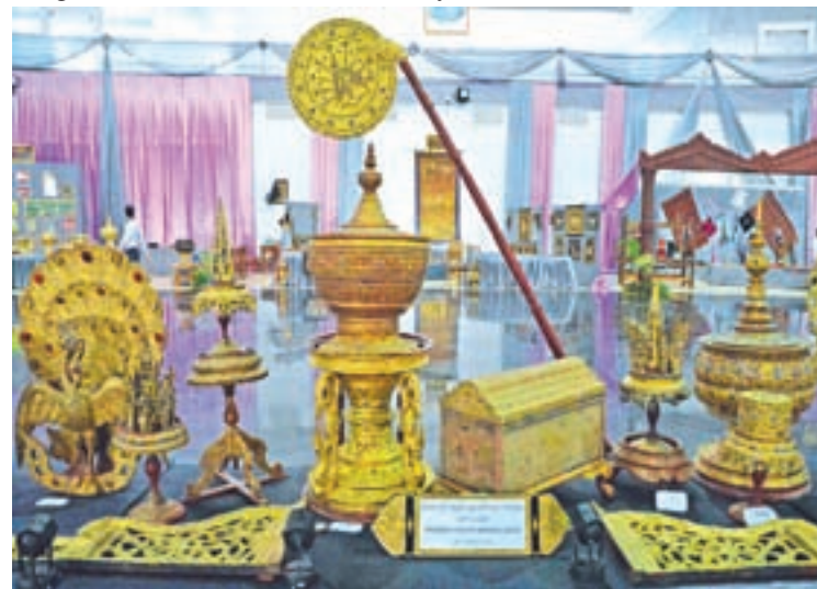
Photo shows Myanmar handicrafts of ancient works put on display at arts and crafts exhibition.