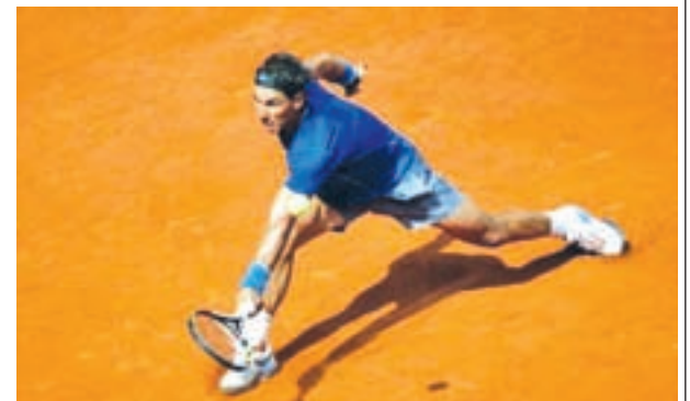
Rafael Nadal of Spain returns the ball to Jarkko Nieminen of Finland during their match at the Madrid Open tennis tournament on 8 May, 2014.

beat Spaniard Carla Suarez 6-2, 6-3, while Petra Kvitkova also progressed 6-4, 6-3 against Lucie Safarova and number 3 seed Agnieszka Radwanska swept past Robert Vinci 6-1, 6-1 in less than an hour.—Xinhua