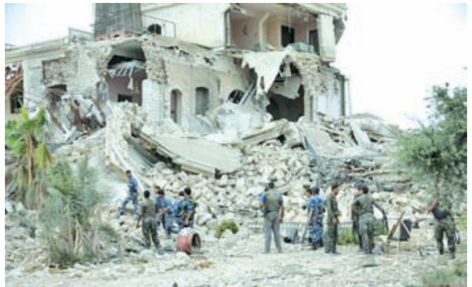
Forces loyal to Syria's President Bashar al-Assad stand on debris at a hotel used by Assad's forces, in old Aleppo on 8 May, 2014.