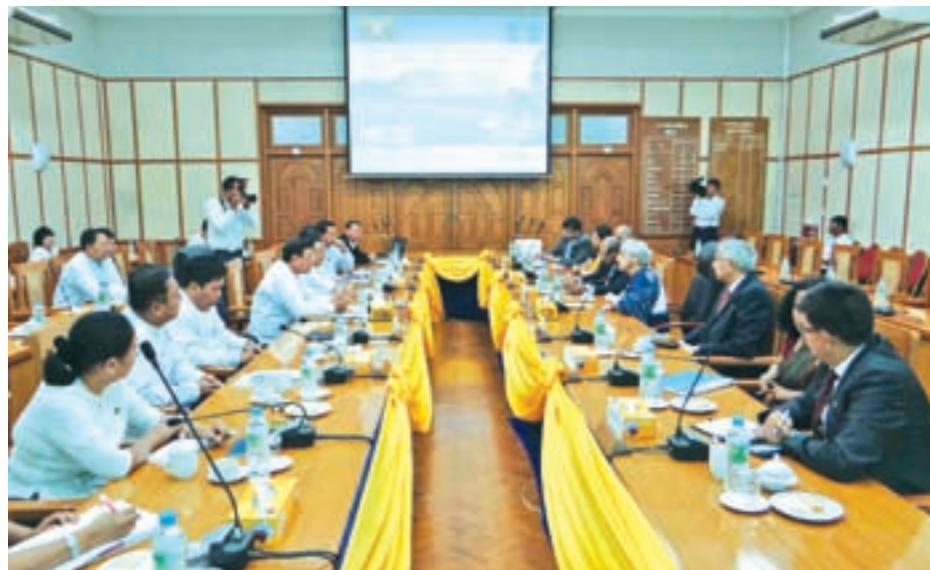
Union Construction Minister U Kyaw Lwin meets Ms Sujata Mehta, Under Secretary of External Affairs of India.—MNA

They also discussed plans to upgrade India-Myanmar-Thailand tripartite ASEAN Highway, Shwebo-Myitkyina-Sumprabum-Putao road, Reed-Tiddim road and Butthidaung-Maungtaung road in cooperation with Public Works under the Ministry of Construction of Myanmar.—MNA