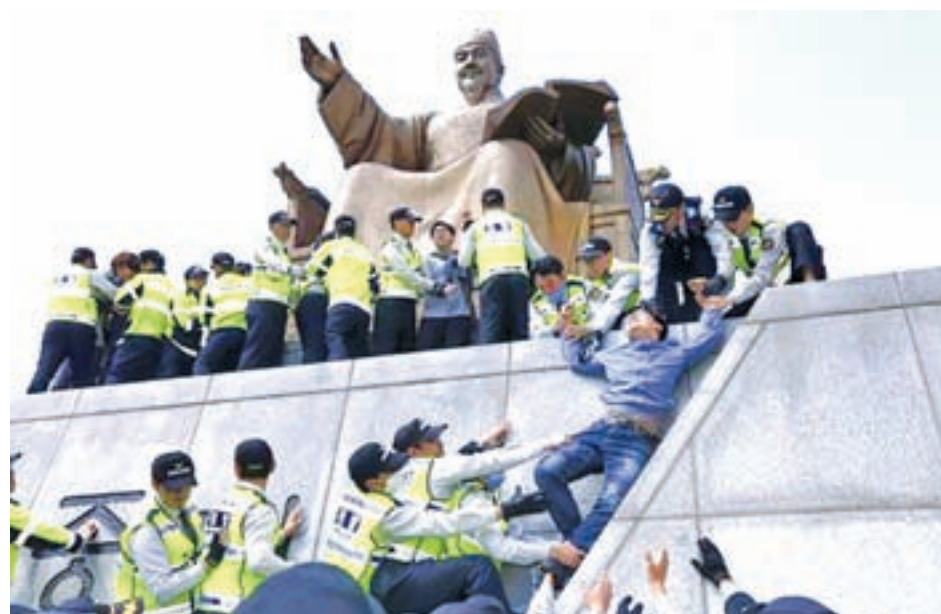
Policemen detain university students on a statue of King Sejong the Great during a protest against South Korean President Park Geun-hye, in central Seoul on 8 May, 2014.

Seated on the ground in the middle of the night, they wore beige blankets and huddled in rows on the cold floor. One mother, overcome with grief, quietly sobbed as she stroked a