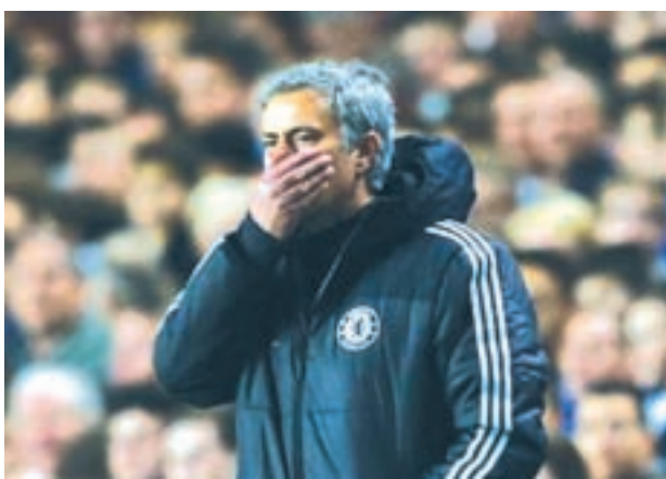
Chelsea's coach Jose Mourinho reacts during their Champions League semi-final second leg soccer match against Atletico at Stamford Bridge in London, on 30 April, 2014.

"And... congratulations also to Mike Riley, the referees' boss. What they are doing through the whole season is fantastic, especially in the last couple of months, and in teams