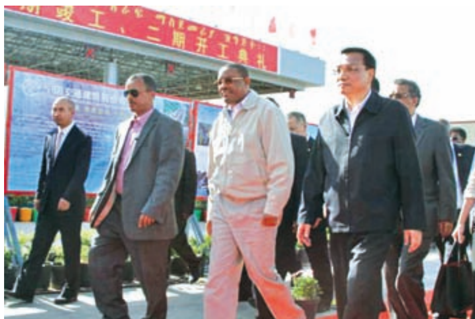
Chinese Premier Li Keqiang (front R) and Ethiopian Prime Minister Hailemariam Desalegn (front 2nd R) walk to inaugurate the Addis Ababa-Adama expressway in Tulu Dimtu, near Addis Ababa on 5 May, 2014.