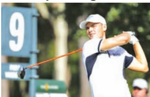
Martin Kaymer tees off on the 9th hole during the first round of The Players Championship at TPC Sawgrass Stadium Course.

"I missed only one fairway, which was on 16. So overall my ball-striking was very good.