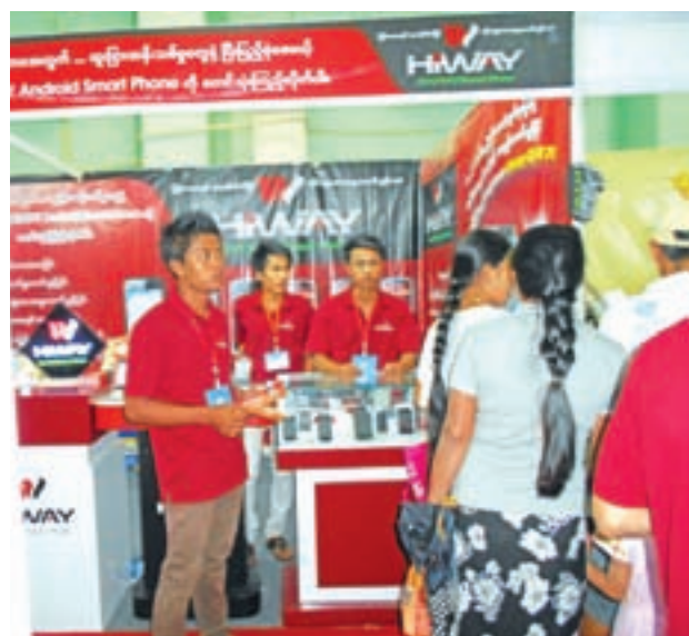
Visitors view round booths at 6 th Myanmar Mobile Fair YGN 2014.

The 6 th Myanmar Mobile Fair YGN 2014 kept open on Friday at Tatmadaw Convention Hall on Wisara Road in Dagon Township in Yangon.