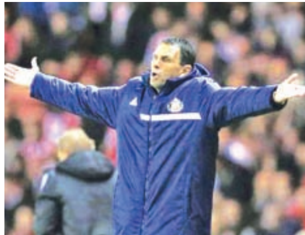
Sunderland manager Gus Poyet reacts during their English Premier League soccer match against West Bromwich Albion at the Stadium of Light in Sunderland, northern England on 7 May, 2014.