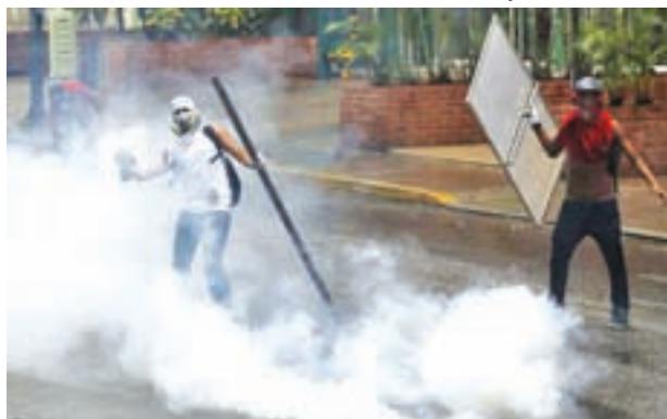
An anti-government protester throws a tear gas canister back at the police during a protest against President Nicolas Maduro's government in Caracas on 8 May, 2014.

"A sniper killed the policeman while he was cleaning debris left by these violent, murderous protesters," a somber Maduro said during an address to the nation. "He was vilely killed."