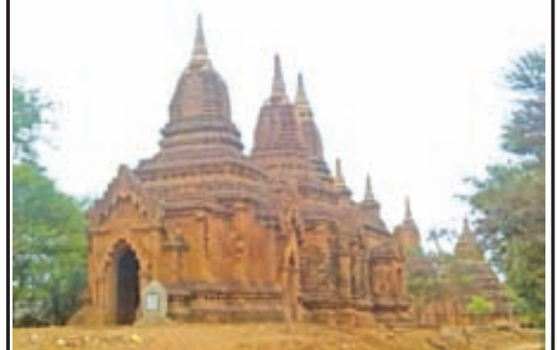
Ancient Bagan pagoda.

The award is aimed to encourage Myanmar's (See page 3)