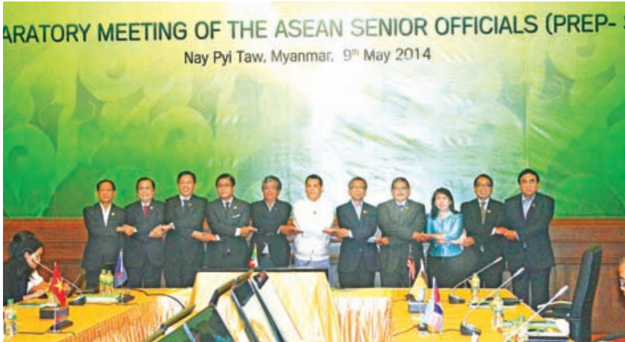
Participants of the Preparatory Meeting of ASEAN Senior Officials discuss the Post 2015-Vision.