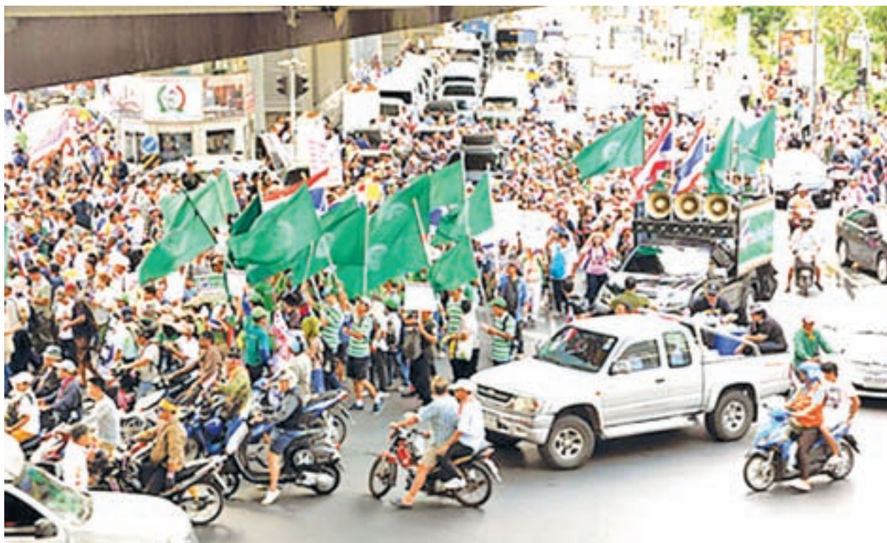
Antigovernment protesters march in central Bangkok, Thailand, on 9 May, 2014.—KYODO NEWS

They have called on the caretaker Cabinet to be replaced by a people's council