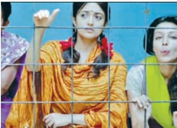
Lakshmi is based on the real-life story of a 14-year-old girl kidnapped and forced into prostitution.—PTI