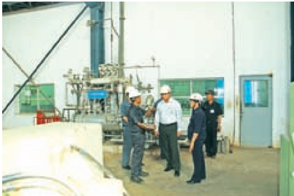
Myanmar delegation of Railway Transport Ministry observing railway and road transport sector.

NAY PYI TAW, 6 May—A Myanmar delegation led by the Union Minister for Rail Transportation paid a visit to Tokyo of Japan from 27 April to 2 May to observe railway and road transport sector of Japan at the invitation of Akihiro Ohta, Japanese Minister of Rail Transportation.