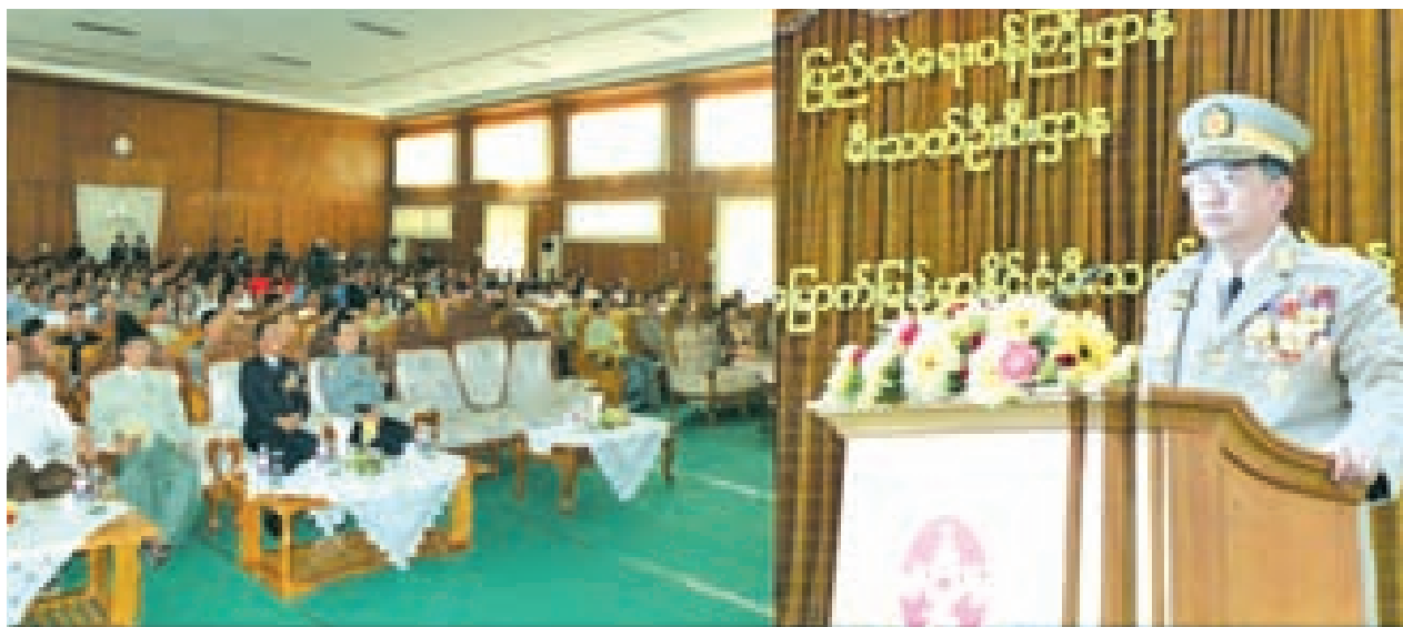
Union Minister for Home Affairs Lt-Gen Ko Ko speaking at ceremony to mark 68 th Anniversary Myanmar Fire Brigade Day. —MNA

The minister said at the event that the ministry provided the MFB with 228 modern fire engines in 2013-14 FY and sent members of the MFB to fire and natural disaster prevention workshops and trainings abroad. —MNA