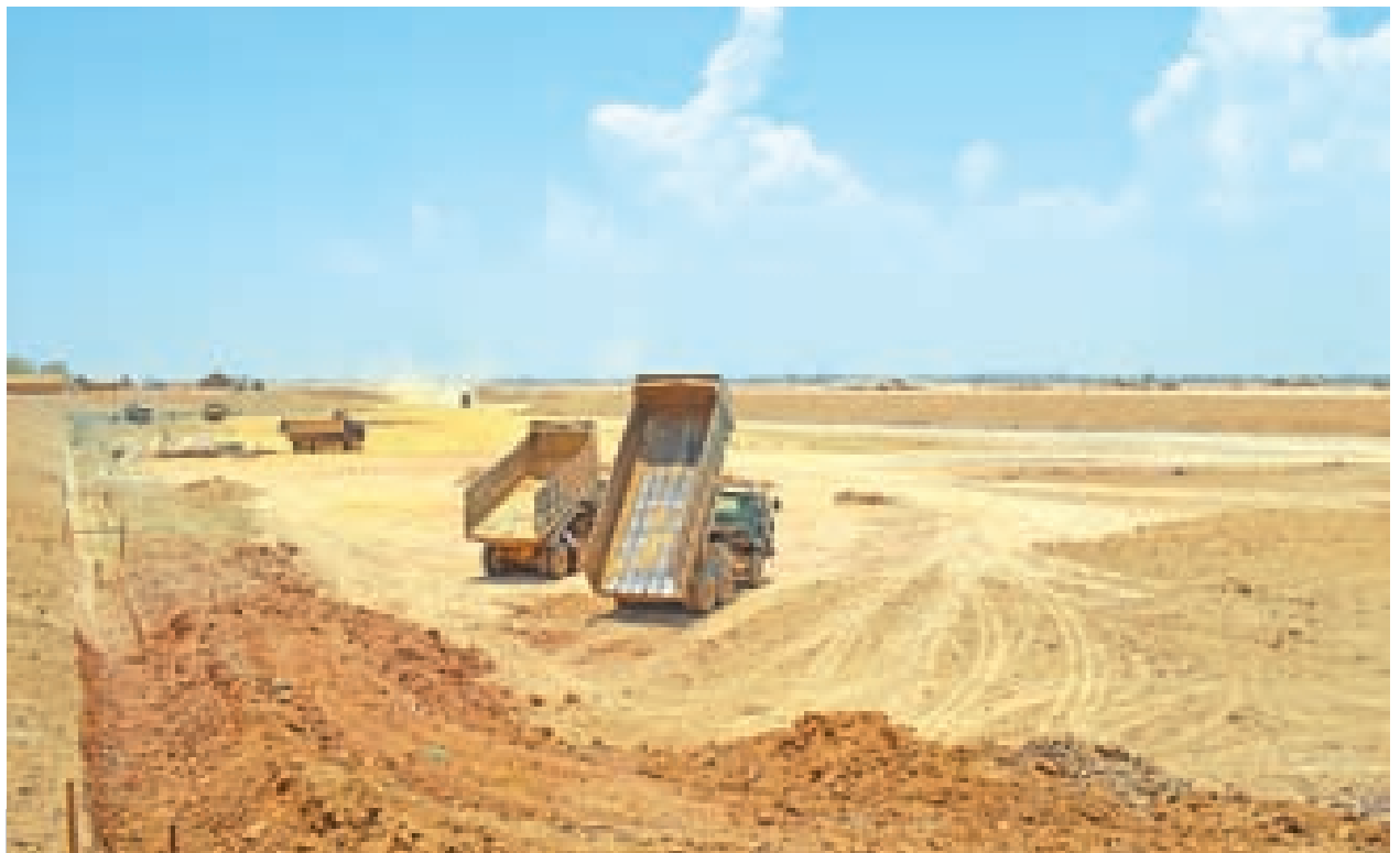
The site for building a retention pond in Thilawa SEZ's class A development area.

To support the establishment of the ASEAN Economic Community which aims at transforming ASEAN into a single market, the ATWG has been working diligently (See page 2)