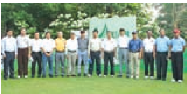
Organizers and golfers pose for photo at Yangon Golf Club in Insein.