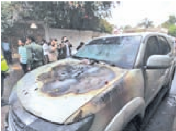
People look at a damaged car where a French man was assassinated, in Sanaa on May, 2014.