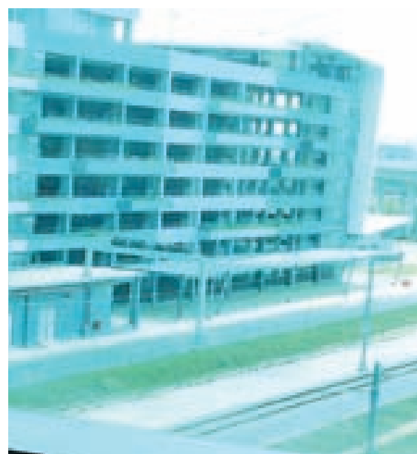
Completed Kuala Lumpur International Airport-2 located near the Kuala Lumpur International Airport in Sepang Township in Selangor State, Malaysia.