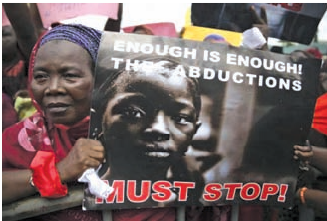
A woman holds a sign during a protest demanding the release of abducted secondary school girls from the remote village of Chibok, in Lagos on 5 May, 2014.

me to sell them. They are his property and I will carry out his instructions," he says.