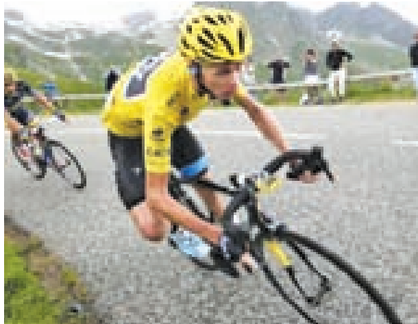
Race leader jersey holder Team Sky rider Christopher Froome of Britain cycles during the 204.5 km stage of the centenary Tour de France cycling race from Bourg d'Oisans to Le Grand Bornand, in the French Alps, 19 July, 2013.

PARIS, 6 May — Although his preparations have been hampered by a back injury and a chest infection, Chris Froome claims he is ahead of schedule as the Briton gears up for his Tour de France defence.