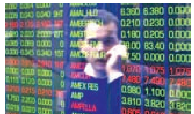
An office worker talks on his phone as he looks the stock board at the Australian Securities Exchange (ASX) building in central Sydney on 15 June, 2012.