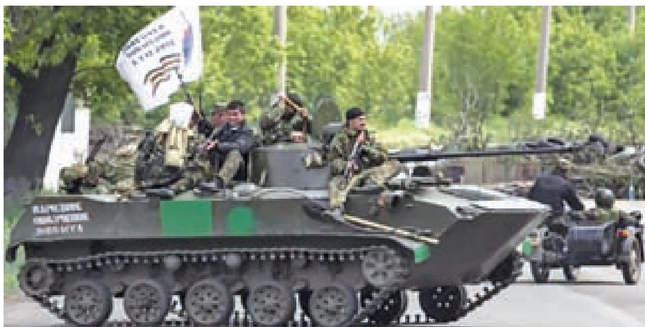
Pro-Russian armed men ride on top of an armoured personnel carrier near the town of Slaviansk, eastern Ukraine, on 5 May, 2014.

In Odessa, a previously peaceful, multi-ethnic Black Sea port where more than 40 people were killed on Friday in the worst day of violence since a February revolt toppled Ukraine’s pro-Russian president, pall-bearers carried the open casket of Andrey Biryukov from a van to the street corner where he was shot.