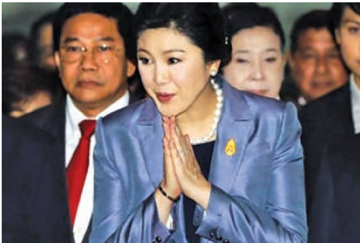
Thailand's Prime Minister Yingluck Shinawatra gives a traditional greeting as she arrives at the Constitutional Court in Bangkok on 6 May, 2014.

to transfer the security chief was made by a committee of ministers.