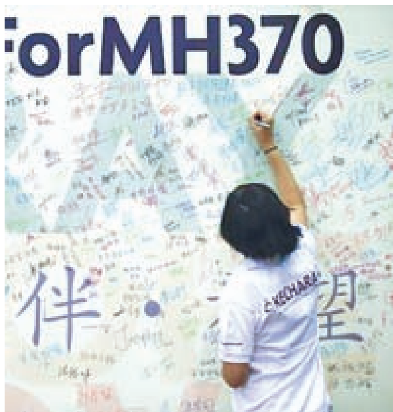
A woman writes a message on a board for family members of passengers onboard the missing Malaysia Airlines Flight MH370 at the Malaysian Chinese Association (MCA) headquarters in Kuala Lumpur on 6 April, 2014.