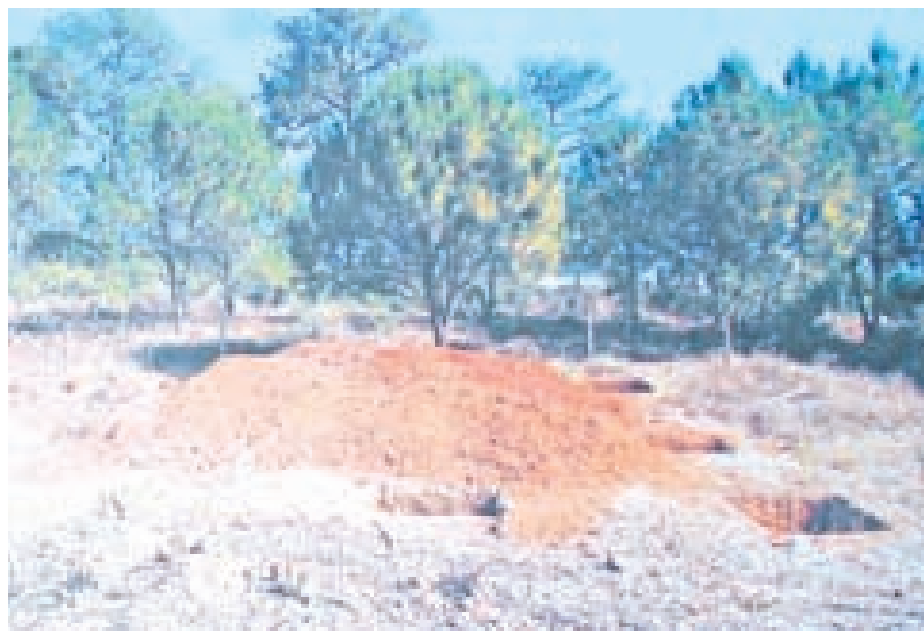
Photo shows construction site for monument of late renowned writer Dagon Tayar.

To mark the 95 th birthday of Writer Dagon Taya, a paper-reading section will be held on 10 May from 9 a.m. to 12 noon at the town hall of Aungban Township in Taunggyi Township in Southern Shan State.