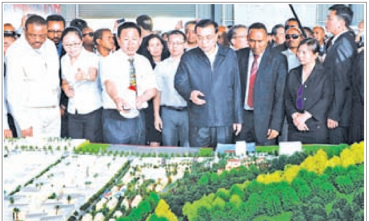
Chinese Premier Li Keqiang, accompanied by Ethiopian Prime Minister Hailemariam Desalegn, visits the Oriental Industrial Park on 5 May, 2014. The park, constructed and invested by China, has provided more than 5,000 jobs for the local people.