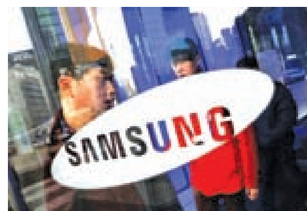
A man walks out of Samsung Electronics' headquarters in Seoul on 6 Jan, 2014.

Apple is seeking to ban sales of several Samsung phones, including the Galaxy S III, as well as monetary damages. It will now be up to Judge Koh to decide whether a sales injunction is warranted, though legal experts deem that unlikely.