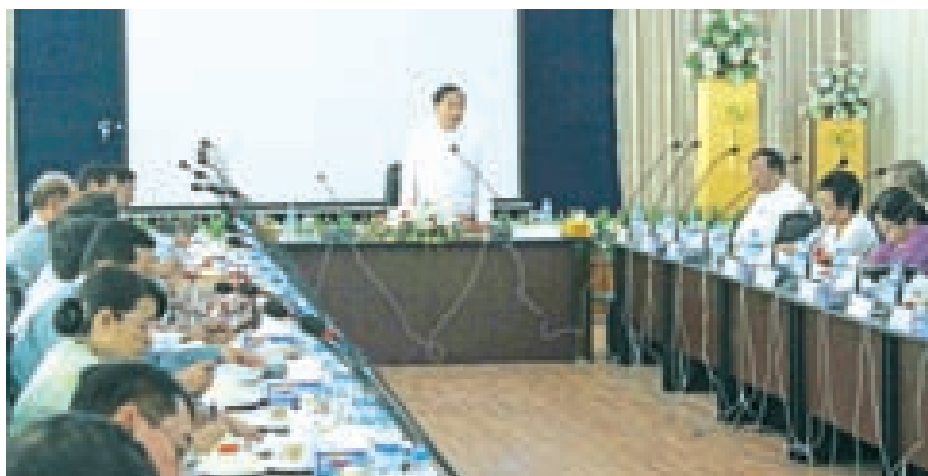
Union Minister for Science and Technology Dr. Ko Ko Oo discussing implementation and promotion of technology and vocational education.

NAY PYI TAW, 6 May—Union Minister for Science and Technology Dr. Ko Ko Oo on Sunday attended the meeting of special working committee for implementation and promotion of technology and vocational education.