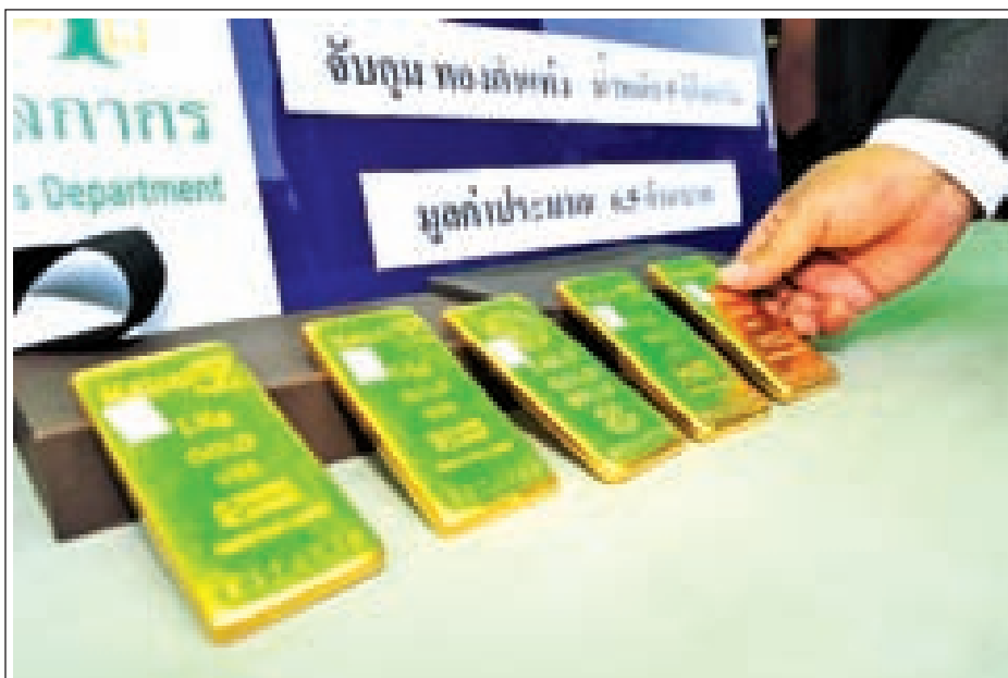
Five smuggled gold bullions are displayed during a Press briefing at the Thai Customs headquarters in Bangkok, Thailand, on 6 May, 2014. Thai customs officials seized five (five kilograms) smuggled gold bullions, worth about 7.5 million Thai baht.