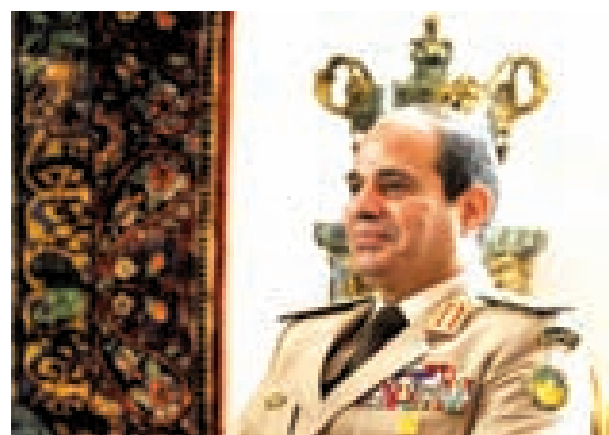
Egypt's Army Chief General Abdel Fattah al-Sisi

it is not me that finished (the Brotherhood). You, the Egyptians, are the ones who finished it,"