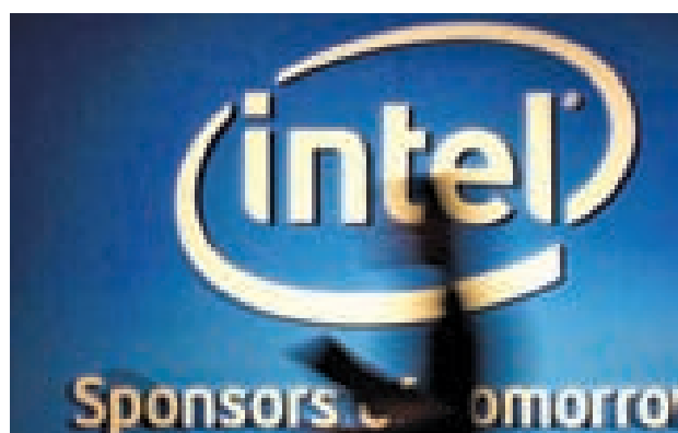
A woman walks past an Intel logo at the 2012 Computex in Taipei on 5 June, 2012.