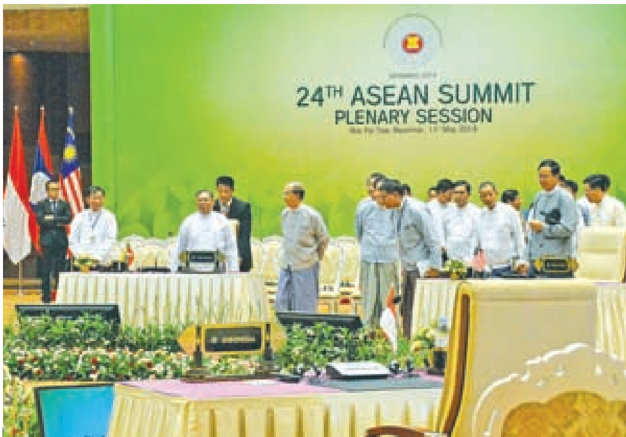
President U Thein Sein overviews preparations for hosting ASEAN Summit at Myanmar International Convention Centre-MICC in Nay Pyi Taw.