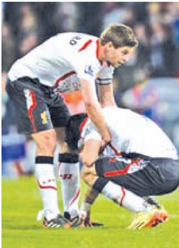
Liverpool's Steven Gerrard (L) and Luis Suarez react following their English Premier League soccer match against Crystal Palace at Selhurst Park in London on 5 May, 2014.

Liverpool's title hopes, already receding after last week's 2-0 home defeat by Chelsea and City's 3-2 win at Everton on Saturday, are now hanging by an even slenderer thread and manager Brendan Rodgers