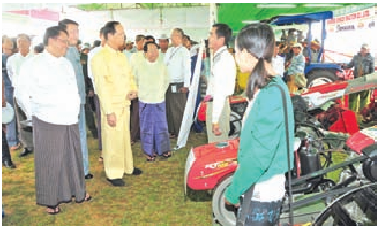
Vice-President Dr. Sai Mauk Kham views power-tillers purchased through loans.

NAY PYI TAW, 6 May—Vice-President Dr. Sai Mauk Kham on Tuesday visited Lashio township during his tour of northern Shan State to inspect rural development programmes.