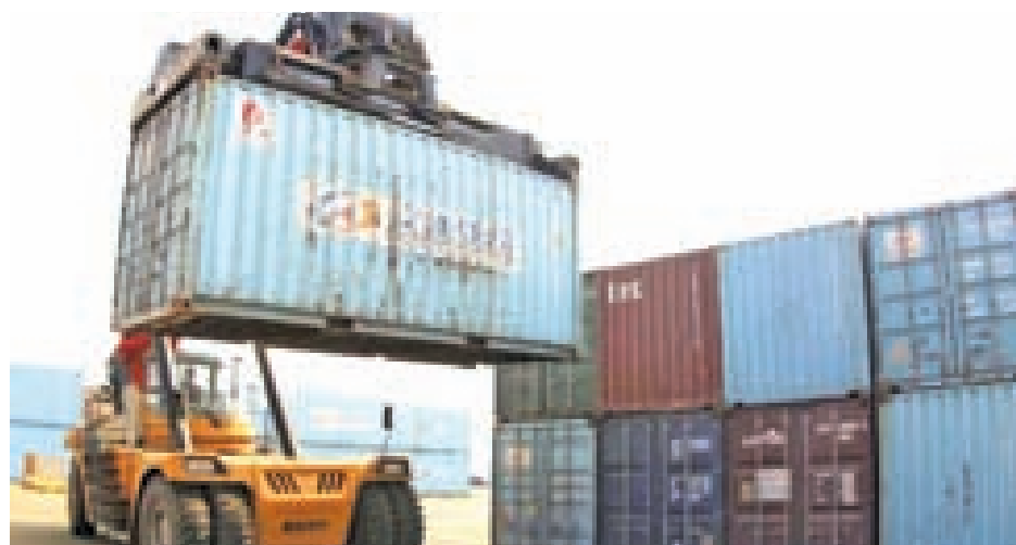
A forklift transfers a shipping container for export at a port in Lianyungang, Jiangsu province on 5 May, 2014.