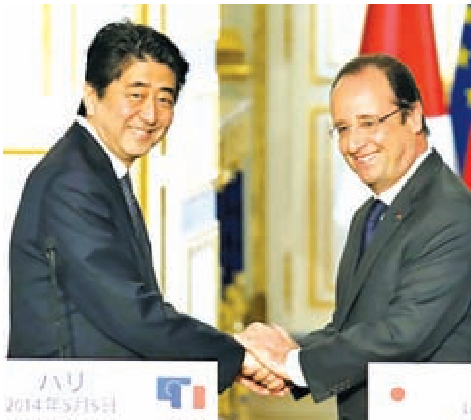
French President Francois Hollande (R) and Japanese Prime Minister Shinzo Abe shake hands after a joint Press conference in Paris on 5 May, 2014.

PARIS, 6 May — Japan and France agreed on Monday to start negotiating a deal to jointly develop defense equipment, while confirming plans to strengthen cooperation on nuclear energy technology and foster dialogue between their economic ministers.