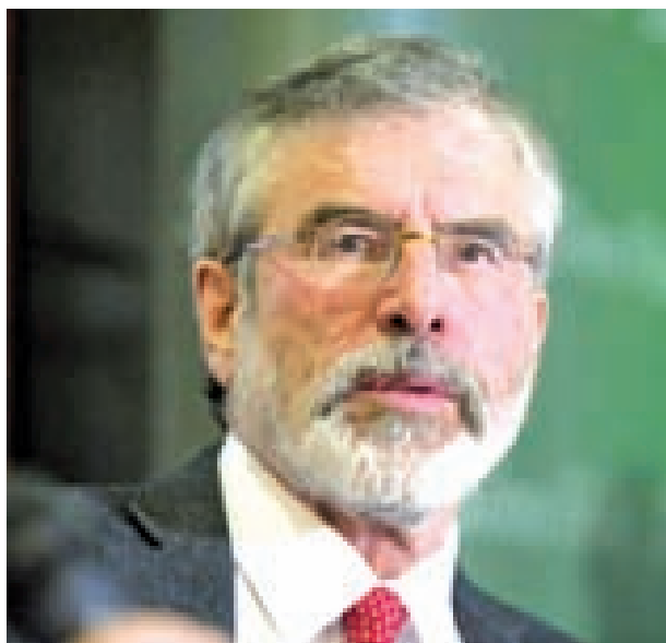
Sinn Fein President Gerry Adams holds a news conference after he was released from police detention, in Belfast, on 4 May, 2014.

“I can confirm that the PSNI visited the homes of Gerry Adams and (fellow