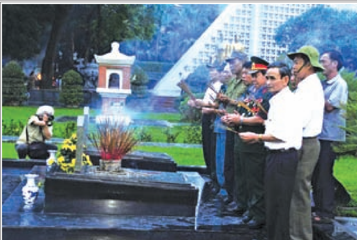
Vietnamese veterans pay homage to soldiers who were killed during the Dien Bien Phu Battle in a Vietnamese martyrs cemetery in Dien Bien Phu, Vietnam, on 5 May, 2014. Vietnam is to hold series of celebrations to mark the upcoming 60th anniversary of Dien Bien Phu victory over French forces, which falls on 7 May.