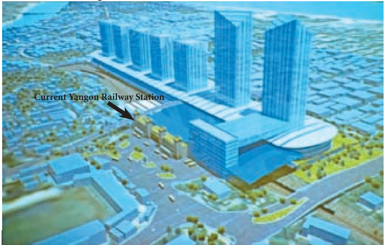
Artist's Impression of the Yangon Railways Station Yard.