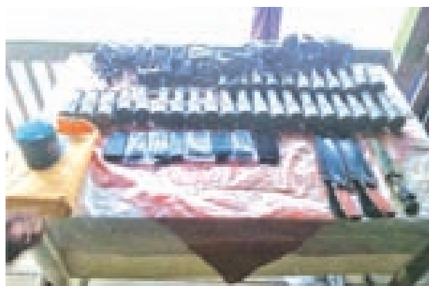
Photo shows weapons seized from eight Chinese in Tamu Township.