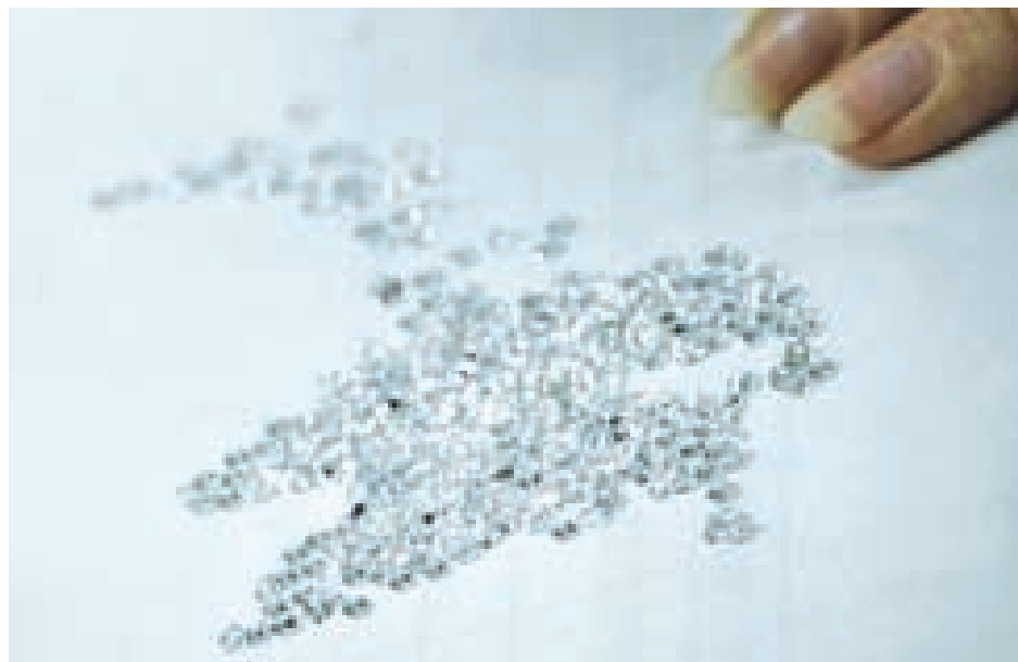
An employee checks diamonds at a jewellery factory in a file photo.

A French-drafted resolution circulated among the 15 council members proposes lifting the diamond ban and easing the 2004 arms embargo to allow government forces to purchase light weapons