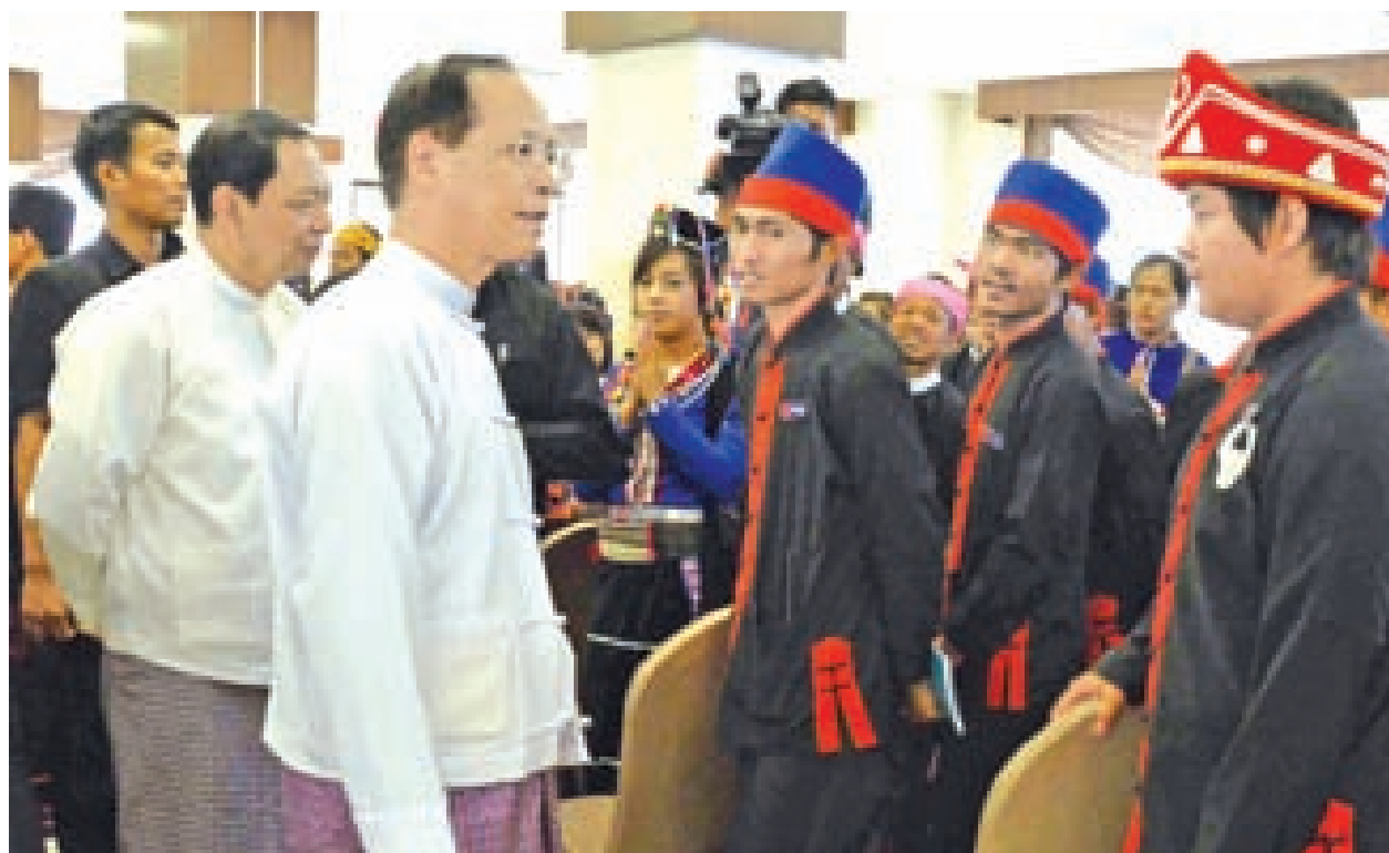
Vice-President Dr Sai Mauk Kham cordially greets members of eight Lashio-based cultural troupes.

He pointed out that poverty and racism are