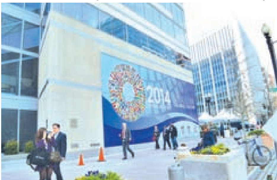
Photo shows IMF Headquarters Building-2 where 2014 Spring Meetings in progress in early April.

Participants in the conference were the Asian Development Bank, the International Finance Corporation, the IMF, Livelihoods and Food Security Trust Fund (LIFT), the Toronto Centre: Global Leadership in Financial Supervision, and the World Bank and bilateral development partners—Bank Negara Malaysia, Bank of Thailand, Deutsche Gesellschaft für Internationale Zusammenarbeit, Financial Services Agency of Japan, Japan International Cooperation Agency, and the United Kingdom Department for International Development.