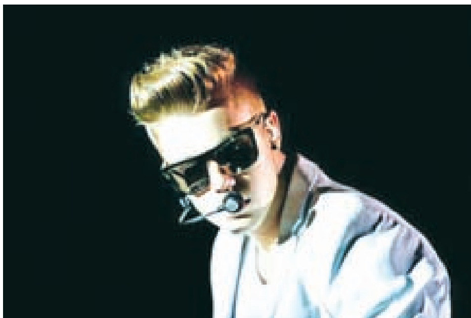
Canadian singer Justin Bieber

The affidavit, released on Friday, said Bieber is observed to be "high-fiving" with a group of males