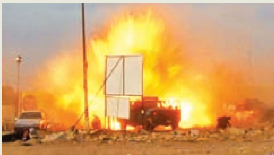
An explosion is seen during a car bomb attack at a Shi'ite political organization's rally in Baghdad, on 25 April, 2014.

WASHINGTON, 26 April — The United States is quietly expanding the number of intelligence officers in Iraq and holding urgent meetings in Washington and Baghdad to find ways to counter growing violence by Islamic militants, US government sources said.