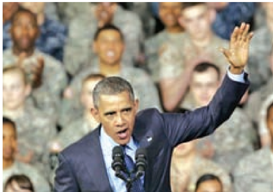
US President Barack Obama waves after delivering a speech at US military base Yongsan Garrison in Seoul, South Korea, on 26 April, 2014.