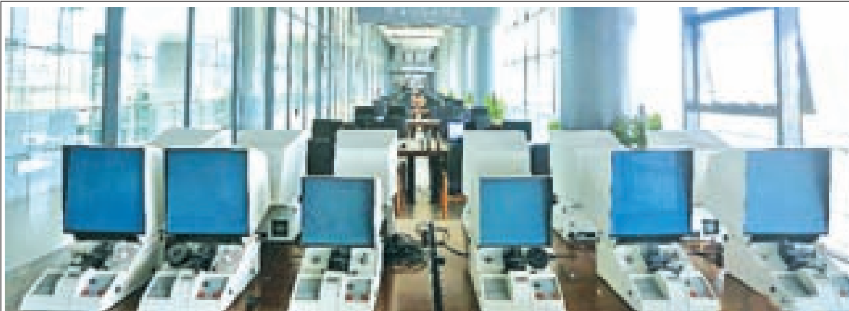
Photo taken on 25 April, 2014 shows micrographic archives reading area of the newly-built Liaoning Provincial Archives in Shenyang, capital of northeast China's Liaoning Province. The archives, which will be opened to the public at 8:30 am on 1 May, will provide free query service to citizens who are entitled to look through declassified documents dating back to Ming and Qing dynasties (1368-1911).