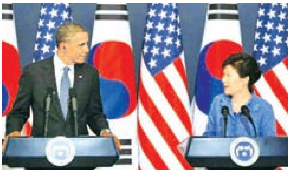
South Korean President Park Geun-hye (R) and US President Barack Obama look at each other during a joint news conference after their meeting at the presidential Blue House in Seoul on 25 April, 2014.

"When North Korea is threatening further provocations and publicly discussing the possibility of a further nuclear test, President Obama's visit to South Korea will send a firm message that North Korea's provocations will