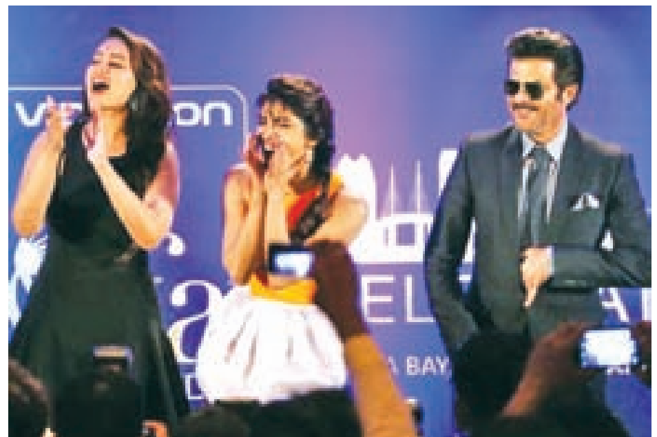
Bollywood Actress Priyanka Chopra (C) and Actress Sonakshi Sinha and Anil Kapoor (R) entertain the crowd ahead of the 15th International Indian Film Academy Awards in Tampa, Florida on 24 April, 2014.