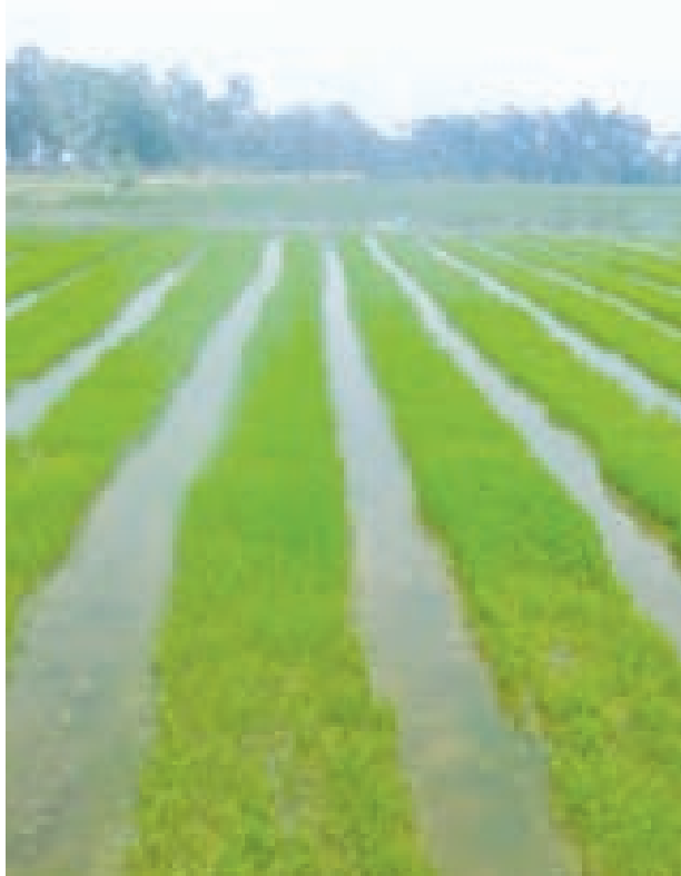
Photo shows summer paddy field in Sagaing Township.