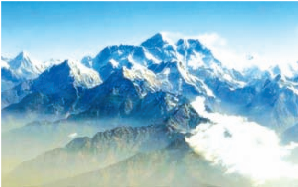
Mount Everest (C), the world highest peak, and other peaks of the Himalayan range are seen from air during a mountain flight from Kathmandu on 24 April, 2010.

Californian mountain guide Adrian Ballinger said that even before the