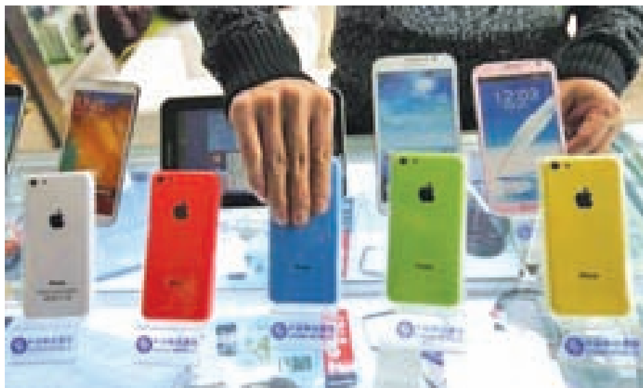
A clerk arranges Apple's iPhone 5C phones on racks bearing the logo of China Mobile, at a mobile phone shop in Beijing on 23 Dec, 2013.

SAN FRANCISCO, 26 April—Apple Inc has offered to replace faulty on-off buttons on the iPhone 5, a rare glitch that it said on Friday affected “a small percentage” of the previous-generation smartphones.