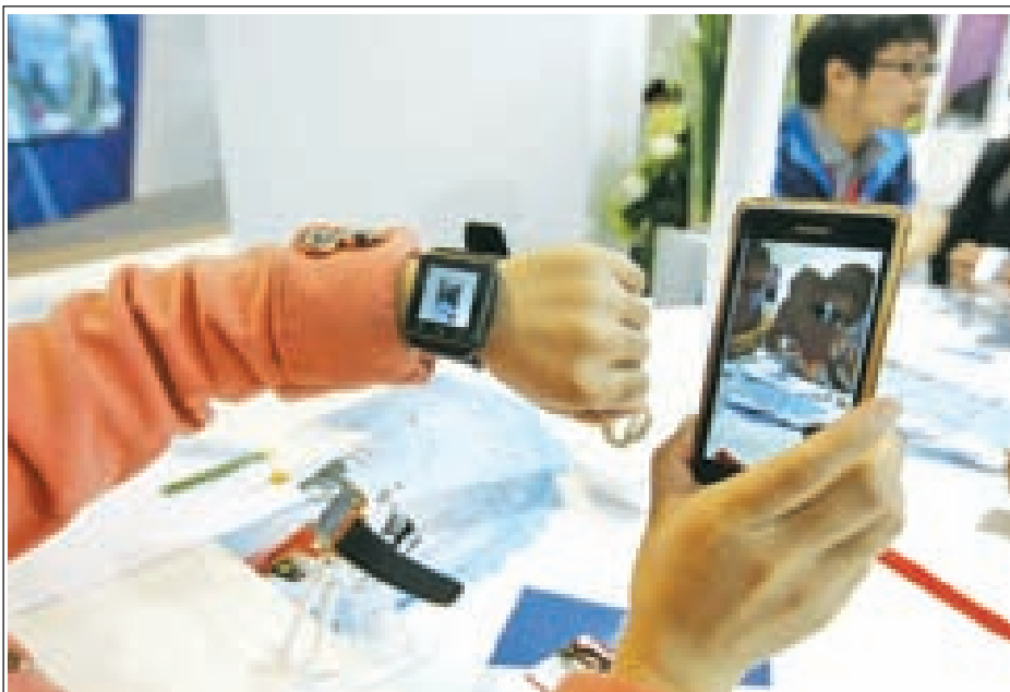
A staff member shows an electronic product, which can be connected with mobile phones with bluetooth technology, during the 2nd China (Shanghai) International Technology Fair in Shanghai, east China, on 24 April, 2014. The fair kicked off here on Thursday.