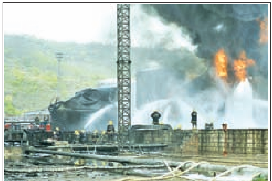
Firefighters try to extinguish fire at the site of a flash explosion on three light crude tanks at the refinery plant of Shaanxi Yancheng Petroleum Group in Yan'an City, northwest China's Shaanxi Province, on 26 April, 2014. The incident occurred at 1:48 am on 26 April, burning three people at the refinery. Rescuers rushed to fight the fire and send the injured people to a local hospital. As of 6 am, rescuers have put the fire under control and set up five intercept dams at upper reaches of the nearby Luohe River to prevent the pollution risks. Local government authorities have relocated 300 residents in the nearby village.

England hosted the 1996 European Championship.