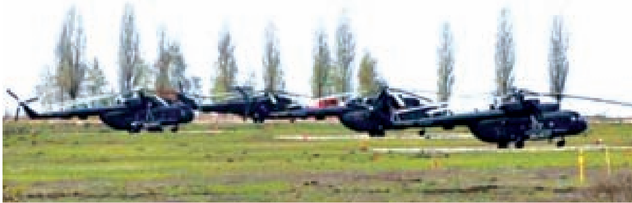
Russian military helicopters are seen in a field outside the village of Severny in Belgorod region near the Russian-Ukrainian border, on 25 April, 2014.

WASHINGTON, 26 April — The United States and the European Union are expected to impose fresh sanctions on Russian individuals on Monday in response to Moscow's alleged efforts to destabilize eastern Ukraine, sources familiar with the matter said.