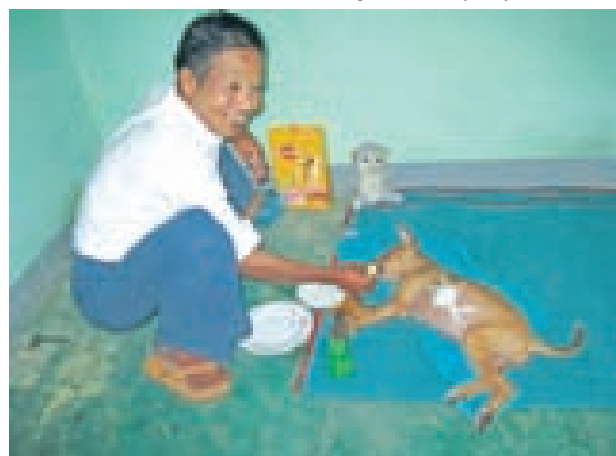
Nigel had multiple diseases and could not walk for three weeks, with around-the-clock dogsitting required.

Moe Vet clinic, 55, Min Ye Kyaw Swar St, Ahlon Tsp, phone 09-5118052