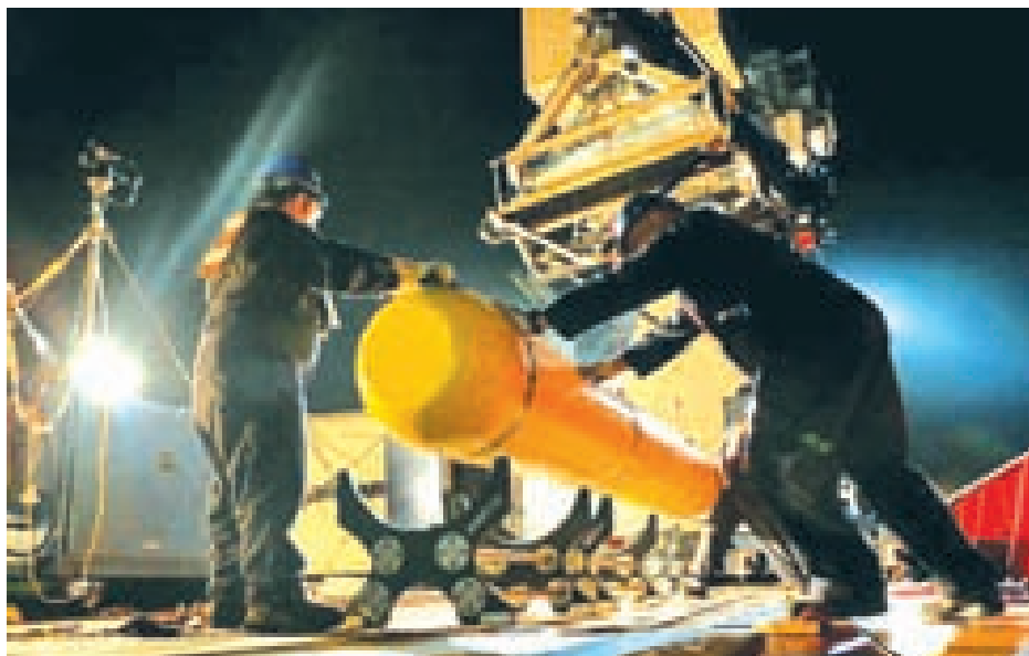
The Phoenix International Autonomous Underwater Vehicle (AUV) Artemis, also known as the Bluefin-21, is prepared for deployment from the Australian Defence Vessel Ocean Shield in the search for missing Malaysia Airlines Flight MH370 in the Southern Indian Ocean in this undated picture released on 21 April, 2014 by the Australian Defence Force.