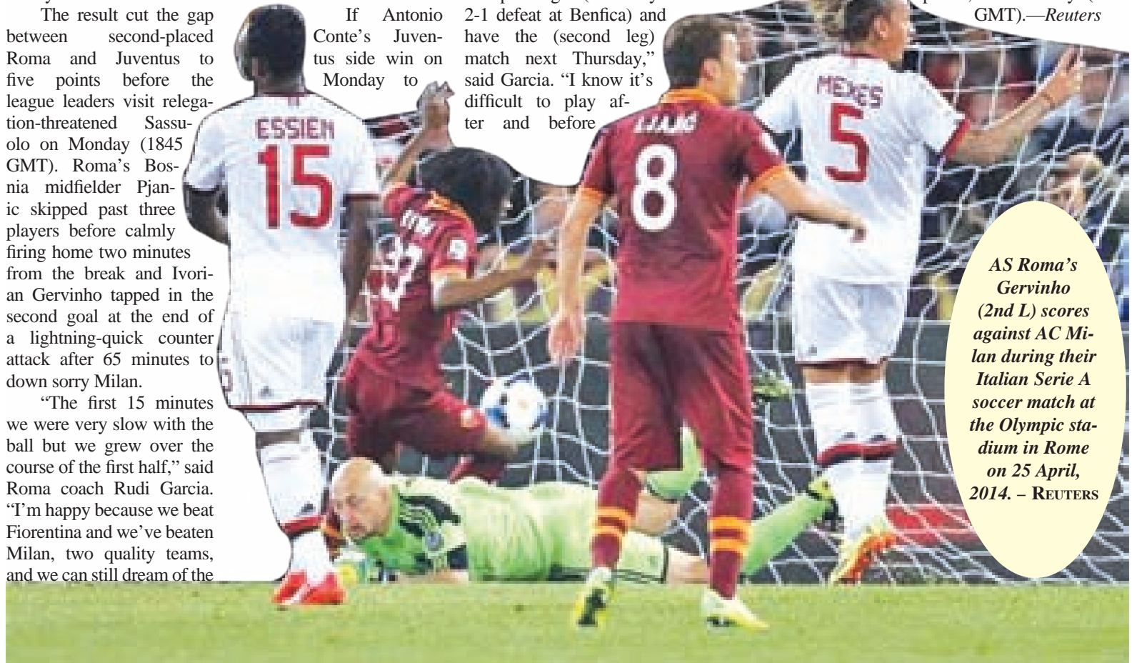
AS Roma's Gervinho (2nd L) scores against AC Milan during their Italian Serie A soccer match at the Olympic stadium in Rome on 25 April, 2014.

Masuzoe, the first Tokyo chief invited by the Beijing municipal government in 18 years, met with Mayor Wang Anshun to discuss and identify areas of future cooperation between the two municipalities. "I believe that Beijing and Tokyo further promoting friendly ties will also contribute to relations between Japan and China," he told Wang.—Kyodo News