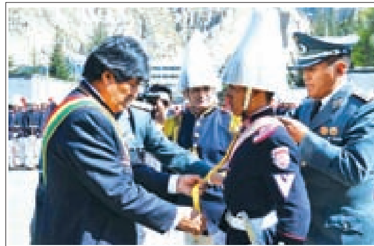
Bolivia's President, Evo Morales (L), participates in a ceremony to commemorate the 123rd anniversary of an army military college, in La Paz, Bolivia, on 25 April, 2014.

Nigeria's President Goodluck Jonathan on Thursday also reassured the international community of the safety of participants to the forum.— Xinhua