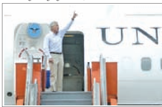
United States Defence Secretary, Chuck Hagel, waves at the Guatemalan Air Base, in Guatemala City, capital of Guatemala, on 25 April, 2014. Hagel is on a three day visit to Mexico and Guatemala.

The disposal of the explosive device ran smoothly and efficiently, according to Vicenza Mayor Achille Variati.— Xinhua