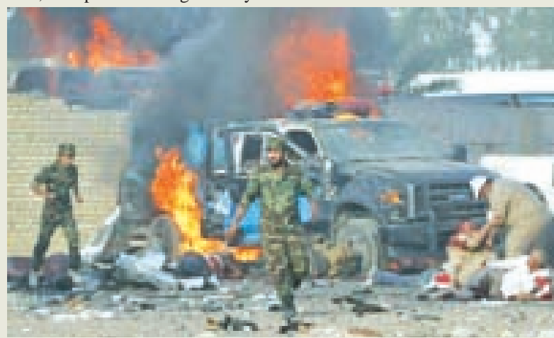
An explosion is seen during a car bomb attack at a Shi'ite political organization's rally in Baghdad, on 25 April, 2014.