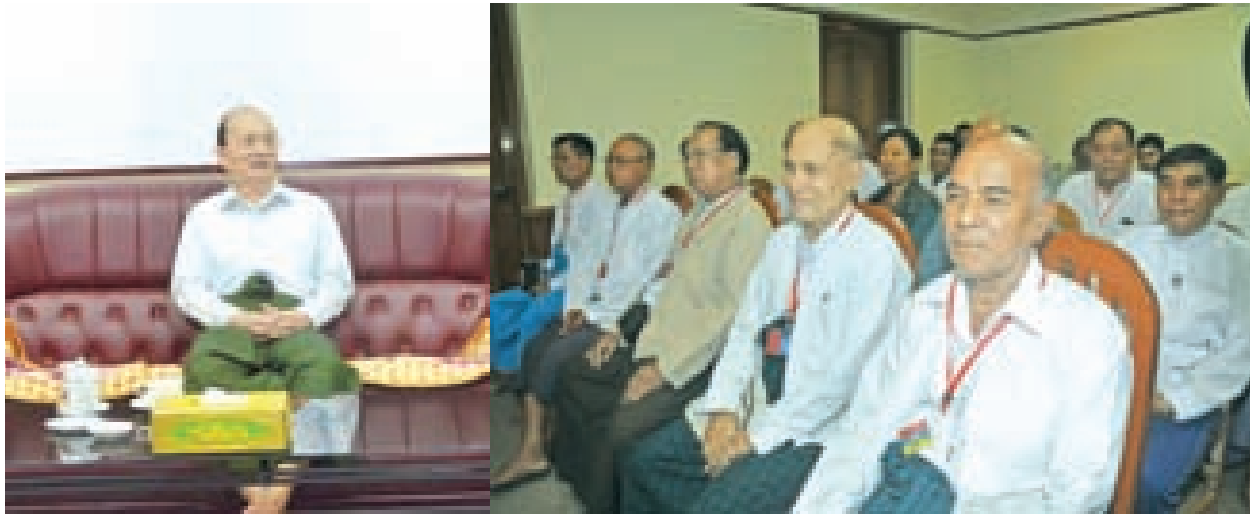
President U Thein Sein meets departmental officials and towns' elders in Kyaukse Township, Mandalay Region.

NAY PYI TAW, 5 April—Speaker of National Parliament U Khin Aung Myint looked round regional development tasks in Yamethin and Pyawbwe Townships in Mandalay Region from 29 March to 5 April.