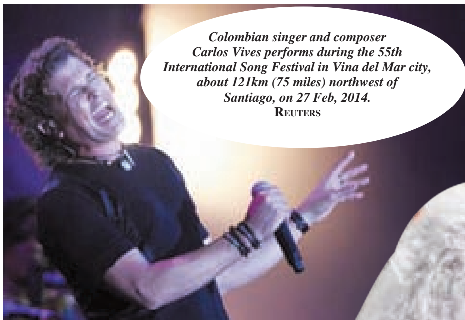
Colombian singer and composer Carlos Vives performs during the 55th International Song Festival in Vina del Mar city, about 121km (75 miles) northwest of Santiago, on 27 Feb, 2014.

MIAMI, 5 April—The US Agency for International Development (USAID) on Friday named Colombian pop singer Carlos Vives its first “inclusion Ambassador” in an effort to promote rights and economic opportunity for Colombia’s displaced indigenous communities.