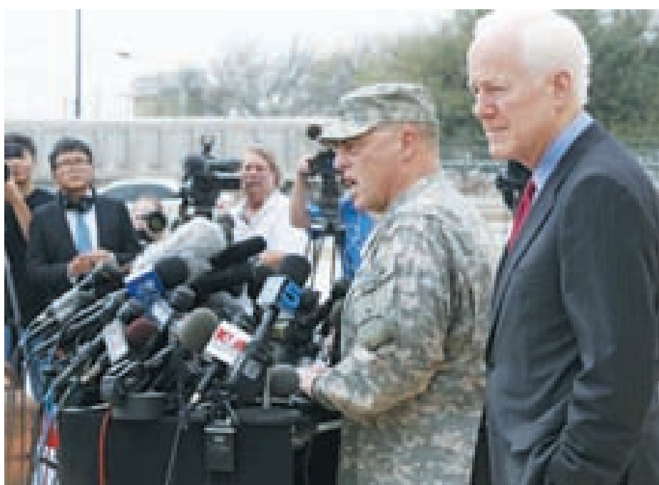
US Army Lieutenant General Mark Milley (2nd R) and US Senator John Cornyn (R-TX) speak at a news conference at the entrance to Fort Hood, regarding Wednesday's shooting that occurred on post, in Texas on 3 April, 2014.