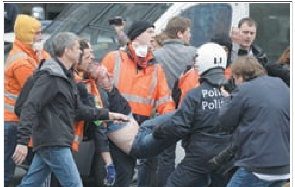
Demonstrators, emergency personnel and policemen evacuate a wounded man during a demonstration by tens of thousands people coming from some 20 European countries to denounce the austerity measures in Europe, in Brussels, capital of Belgium, on 4 April, 2014.