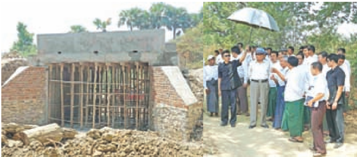
Speaker of National Parliament U Khin Aung Myint looks into progress of Kyi Village Bridge in Pyawbwe Township.