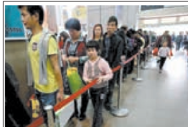
Passengers queue to take long-distance coaches at Liuzhou's bus terminal, in south China's Guangxi Zhuang Autonomous Region, on 4 April, 2014. Guangxi received a travel rush during China's traditional Qingming Festival, or Tomb-sweeping Day, which falls on 5-7 April this year.