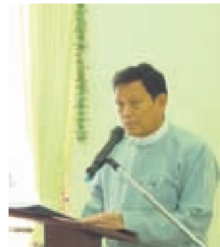
An official speaking at opening of basic course on rule and regulation for export & import (1/2014) in Dawei.

Speaking at the ceremony, Region Minister for Finance U Than Aung said that the course will enable the trainees to be able to operate border trade in the region by applying rules and regulations on export