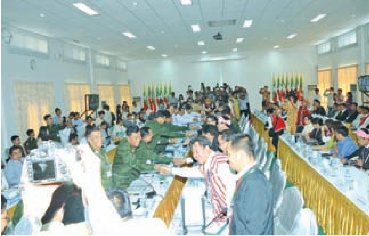
Peace makers representing government and ethnic armed groups shake hands before peace talks.