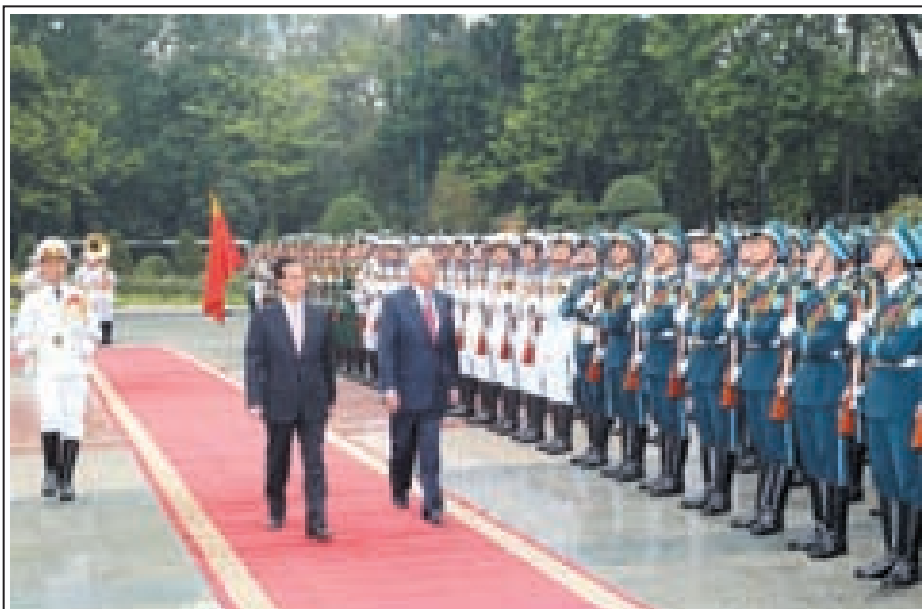
Vietnamese Prime Minister Nguyen Tan Dung (2nd L) holds a welcoming ceremony for his visiting Malaysian counterpart Najib Tun Razak (3rd L) in Hanoi, Vietnam, on 4 April, 2014. Vietnam's Prime Minister Nguyen Tan Dung and his Malaysian counterpart Najib Tun Razak said on Friday that the two sides vow to bring two-way trade turnover to 11 billion US dollars by 2015.