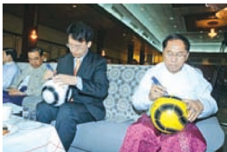
Yangon Region Chief Minister U Myint Swe signs soccer ball at educative talks on narcotic drugs.