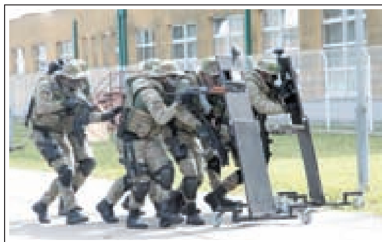
Members of the special police unit take part in exercises to mark the Day of Police in Banja Luka, capital of Republika Srpska (RS), an entity within Bosnia and Herzegovina (BiH), on 4 April, 2014.