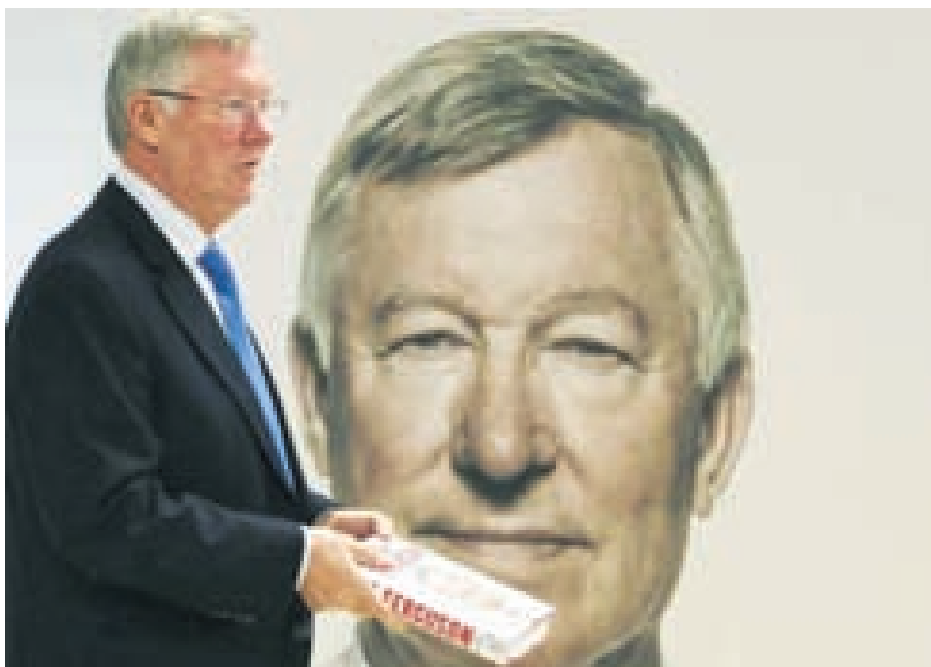
Former Manchester United manager Alex Ferguson poses with his new autobiography before a book signing at a supermarket in Manchester, northern England on 24 Oct, 2013.

LONDON, 5 April — Former Manchester United manager Alex Ferguson will be swapping the dug-out for the lectern after