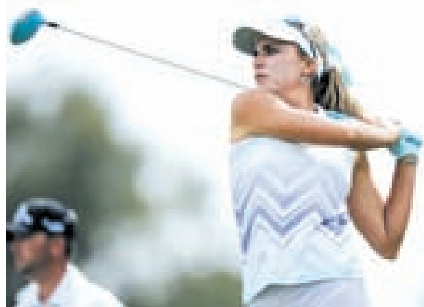
American teenager Lexi Thompson.