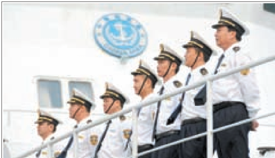
Staff members line up on a marine surveillance ship heading to Boao, south China's Hainan Province, on 4 April, 2014. A fleet of six marine surveillance ships will monitor maritime traffic safety, investigate maritime accidents, detect pollution, and carry out other missions during the Boao Forum for Asia Annual Conference 2014 in Hainan.

The move was part of the government's review of public spending which has estimated 108-million-euro (147-million-US dollar) cuts over three years at the foreign ministry. Italian Foreign Minister Federica Mogherini said on Thursday that the salaries of Italian diplomats including ambassadors will also feature in the cost-cutting plan.— Xinhua