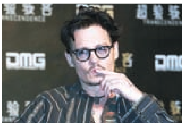
Actor Johnny Depp gestures during a promotional event of his new movie “Transcendence”, on his first visit to China in Beijing, on 31 March, 2014.

The 50-year-old “Pirates of the Caribbean” actor confirmed the news days after he was spotted wearing a woman’s engagement ring on his left index hand, which set off speculation that he was to wed Heard.