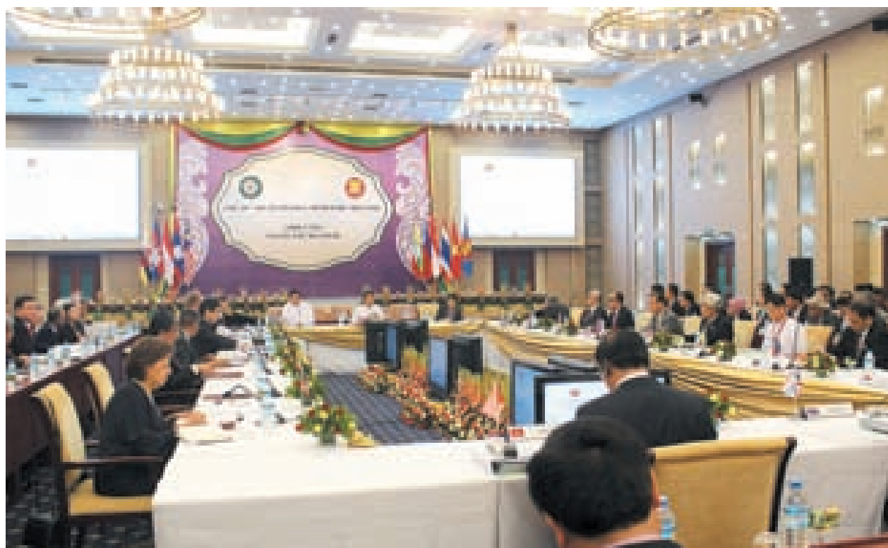
Finance Ministers of ASEAN countries and parties attending 18 th ASEAN Finance Ministers' Meeting in Nay Pyi Taw.