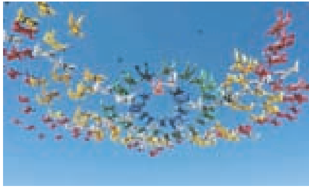
Skydivers form a missing man formation in Eloy, Arizona, on 3 April, 2014.