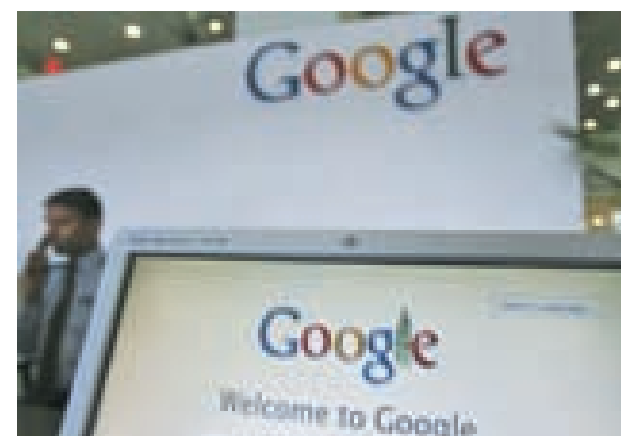
A security personnel answers a call at the reception counter of the Google office in the southern Indian city of Hyderabad in this 6 Feb, 2012, file photo.

But their grand ambitions are inciting concern, according to the poll of nearly 5,000 Americans. Of 4,781 respondents, 51 percent replied “yes” when asked if those three companies, plus Apple, Microsoft and Twitter, were pushing