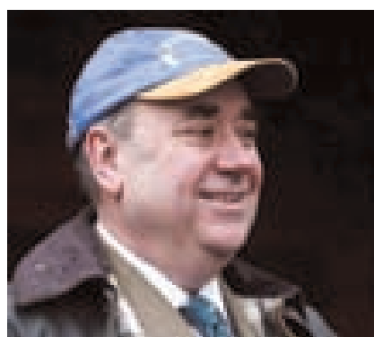
Scotland's First Minister Alex Salmond smiles as he attends the opening day of salmon fishing season on the river Tay at Dunkeld in Scotland on 15 Jan, 2014.

"I don't foresee pressure. I don't think that is what the United States would want to do," Salmond told Reuters. "There