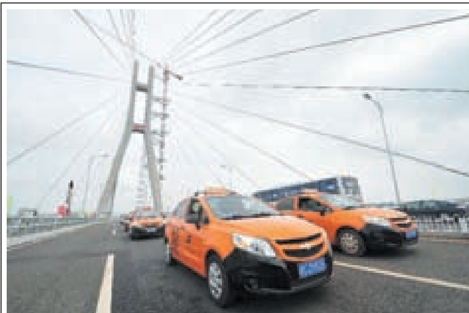
Cars pass on Yangpu Bridge in south China's Hainan Province, on 4 April, 2014. Yangpu Bridge, a cross-sea bridge with the longest span in Hainan, opened on Friday.