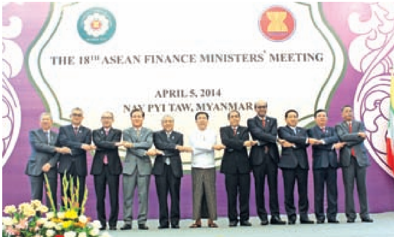
Finance Ministers of ASEAN countries joining hands as they pose for documentary photo.

The Singaporean minister said, however, there were many positive signals as "meaningful steps" are taken for the agreed trading link and that in the future more countries than the current three will join to improve liquidity. "There is good progress, so it shows we are moving forward with exchanges, and that we have moved beyond a mere trading link," he said.