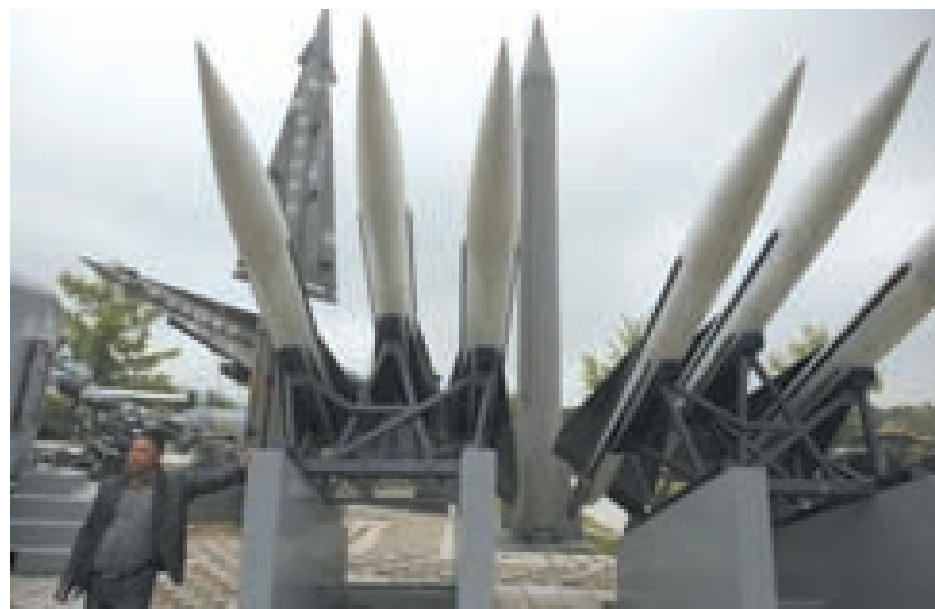
A visitor poses for a photo next to a display of mock South Korean US-made Hawk surface-to-air missiles and a mock North Korean Russian-made Scud-B ballistic missile (C, in gray), at the Korean War Memorial Museum in Seoul on 20 May, 2013.