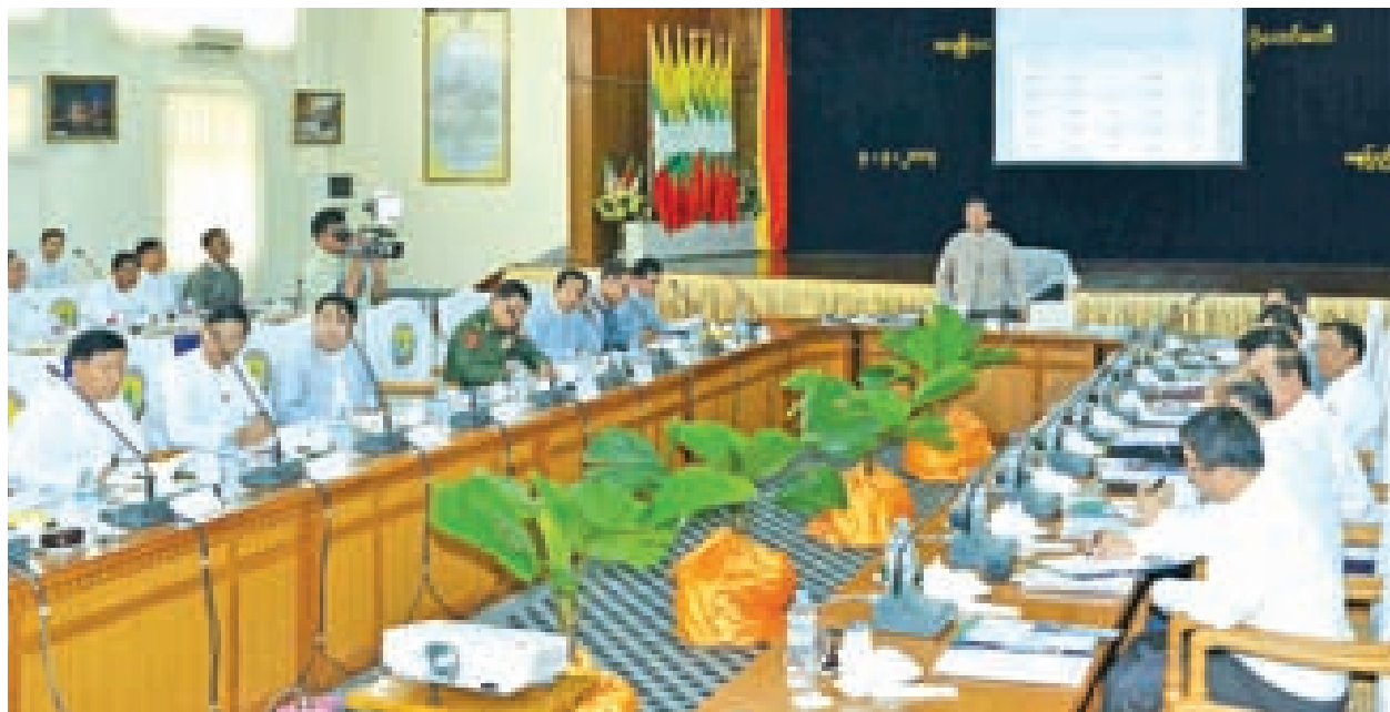
First meeting of the Central Committee for Development of National Tourism Industry at the Ministry of Hotels and Tourism in Nay Pyi Taw in progress.

NAY PYI TAW, 4 April—Vice-President U Nyan Tun attended first meeting of the Central Committee for Development of National Tourism