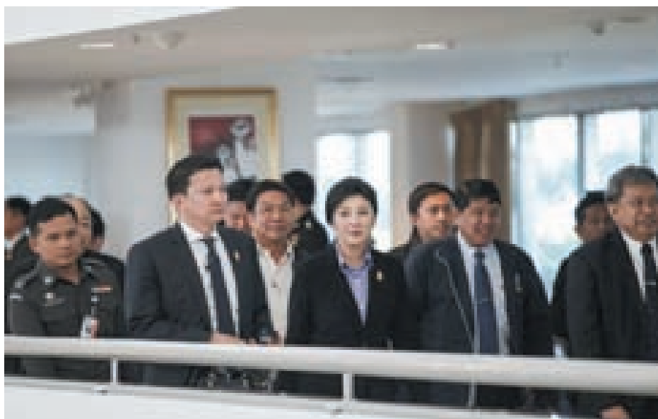
Thailand's Prime Minister Yingluck Shinawatra (C) leaves the Government Complex after a meeting with the Election Commission in Bangkok on 20 Dec, 2013.