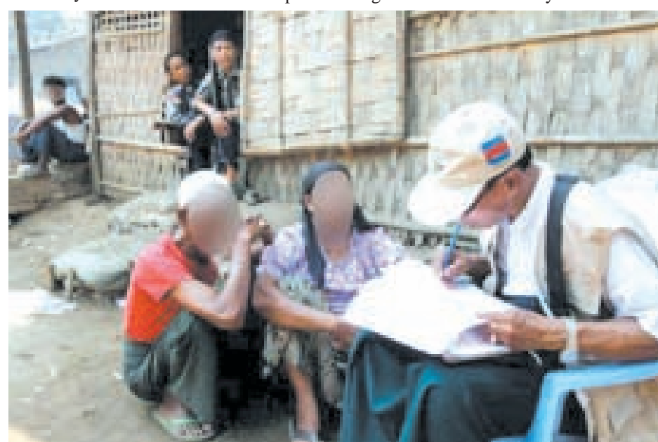
A census enumerator gather data from local people.

ly voiced loudly the word 'Rohingya' these days because they are taking the advantage of the national census," said the deputy minister.