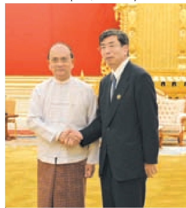
President U Thein Sein shaking hands with Mr. Takehiko Nakao, President of Asian Development Bank.