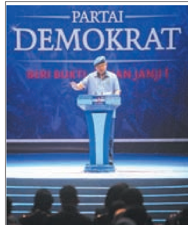
Indonesia's incumbent President and chairman of the ruling Democratic Party Susilo Bambang Yudhoyono delivers a speech to the supporters during an election campaign rally in Jakarta, Indonesia, on 3 April, 2014. Indonesia is scheduled to hold legislative and presidential elections on 9 April and 9 July respectively.

"Household consumption grew 5.7 percent annually in the 1990s in the region and 5.5 percent in the 2000s, well below gross domestic product growth of 9 percent and 8.2 percent in the last two decades," the study read. The study said development organizations such as the ADB can step up efforts to integrate "inclusive growth" into their development strategies. ADB, which adopted inclusive growth as a strategic agenda in 2008, is calibrating its operations to achieve inclusiveness. It also called for better coordination among development organizations to tailor inclusive approaches to specific contexts and needs of countries. —Xinhua