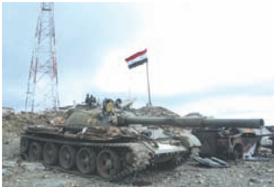
A tank belonging to forces loyal to Syrian President Bashar al-Assad is seen at one of the sites in Latakia mountains, after they took control of it from rebel fighters, on 3 April, 2014, in this handout released by Syria’s national news agency SANA.