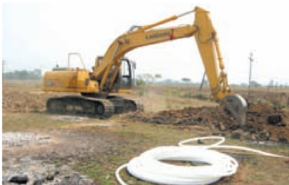
KYAUKDAGA, 4 April—Communication Network laying of fibre cables along Myanmar Fiber Optic Company is carrying out towns and villages of Man-

dalay-Nay Pyi Taw-Yangon-Pathein-Ngwehsaung fibre link for Myanmar Posts and Telecommunications of the Ministry of Communications and Information Technology.