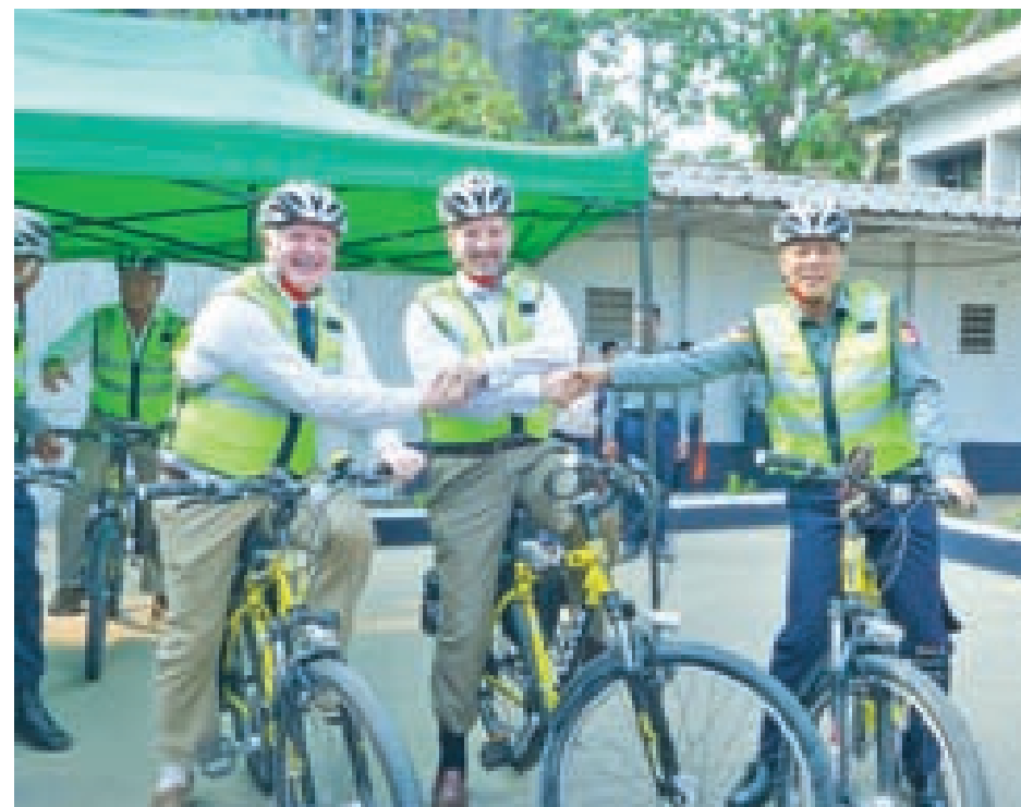
Component Leader for Community Policing, EU Ambassador to Myanmar and Yangon Police Commissioner attach their hands at police bicycles handing over ceremony.