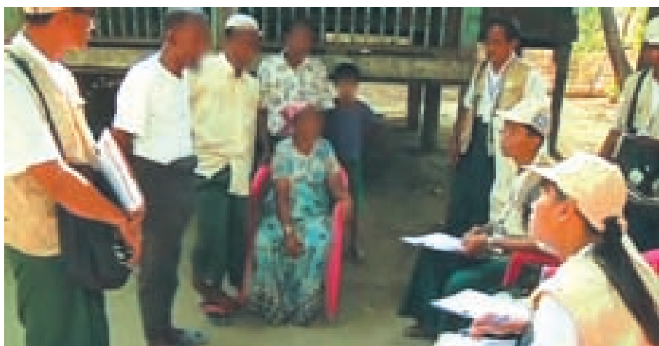
A census enumerator collects data from a local household.

The word (Rohingya) cannot be considered as an ordinary problem as it poses the problem for the national security and national affairs. Such kind of problem should not be approached from the "freedom of speech" point of view and it should be handled in accordance with the basic principles of the constitution, said Information Deputy Minister U Ye Htut.