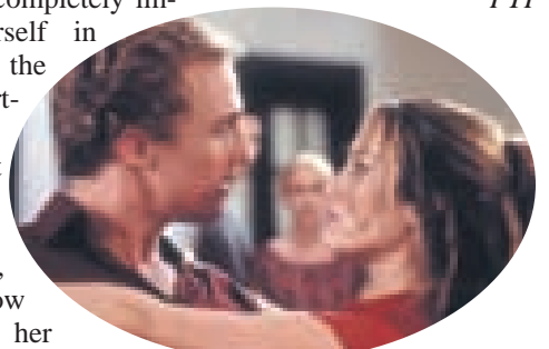
Jennifer and Matthew

the screen space with McConaughey thirteen years ago in 2001 hit rom-com The Wedding Planner.