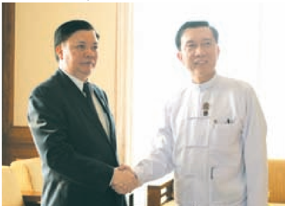
Vietnamese Finance Minister Dinh Tien Dung and U Win Shein discussed further cooperation.

Equally optimistic on the outlook for Myanmar was the Malaysian Finance Minister II, saying the country once had a strong economy and will play a major role in the