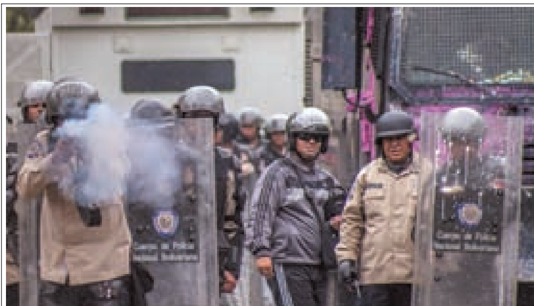
A member of the National Bolivarian Police (PNB, for its acronym in Spanish), shoots during a protest near the Central University of Venezuela (UCV, for its acronym in Spanish), in Caracas, Venezuela, on 3 April, 2014.

The vessel sails regularly between North Korea and China, according to Reuters' ship tracking system. The rescued crew members were taken to a South Korean hospital for treatment, according to the coast guard.—Reuters