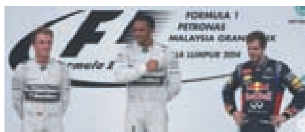
Mercedes Formula One driver Lewis Hamilton of Britain (C) celebrates on the podium as he stands beside second-placed Mercedes Formula One driver Nico Rosberg of Germany (L) and third-placed Red Bull Formula One driver Sebastian Vettel of Germany after winning the Malaysian F1 Grand Prix at Sepang International Circuit outside Kuala Lumpur, on 30 March, 2014.

"Someone else gets in the lead and they'll say something. It's the nature of the game."—Reuters