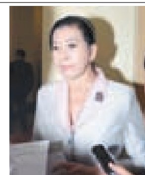
Pavena Hongsakula (Minister of Social Development and Human Security of Thailand)

I highly commend the chairmanship and coordi-