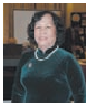
Madame Pham Thi Hai Chuyen (Minister of Labour, Invalids and Social Affairs of Vietnam)

A: At the ASCC meeting, we have reviewed the status of ASCC Blueprint implementation including