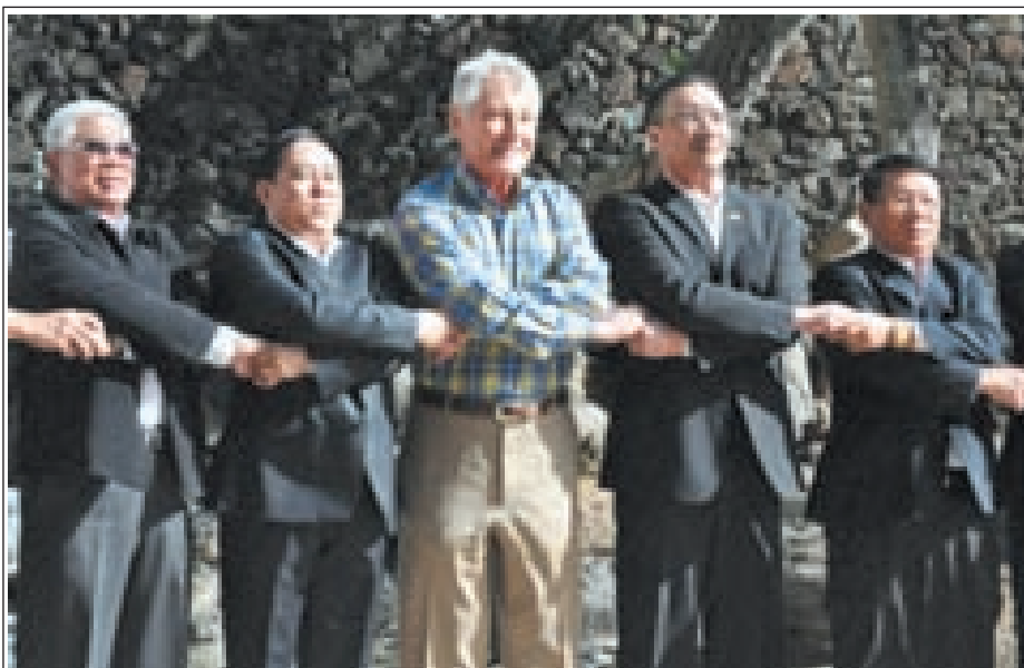
US Defence Secretary Chuck Hagel (C) poses with his ASEAN counterparts as they gather for a meeting in Honolulu, Hawaii, on 3 April, 2014.

Japan concluded bilateral nuclear accords with 11 countries, including Australia, China, France, Russia and the United States — and the European Atomic Energy Community, and is currently promoting talks with India and Brazil to conclude similar treaties.