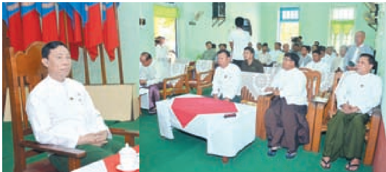
Speaker of Union Parliament Thura U Shwe Mann meets officials from township Land Utilization Management Committee, township development supportive committee and townsmen in Pyu Township, Bago Region.

NAY PYI TAW, 4 April—Speaker of Union Parliament and People's Parliament Thura U Shwe Mann held a meeting on regional development task with officials from township Land Utilization Management Committee, township development supportive committee and townsmen in Pyu Township, Bago Region on Friday.