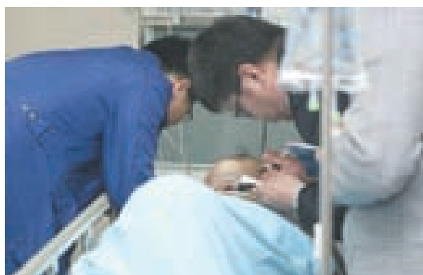
A doctor exams a North Korean crew member from a Mongolian-flagged cargo ship that sank in the sea off Yeosu, at a hospital on Jeju island on 4 April, 2014.