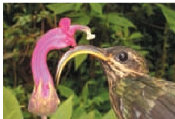
The Buff-tailed Sicklebill ( Eutoxeres condamini ), a Hermit hummingbird with a magnificently recurved bill, along with one of the flowers to which they are specialized, is shown in this image released on 3 April, 2014.

also have the highest rate of energy consumption per gram of any animal," Witt said.—Reuters