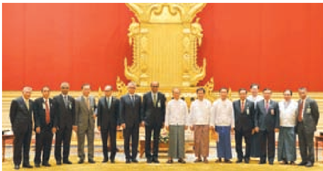
President U Thein Sein poses for documentary photo with Deputy Finance Ministers of ASEAN Countries.