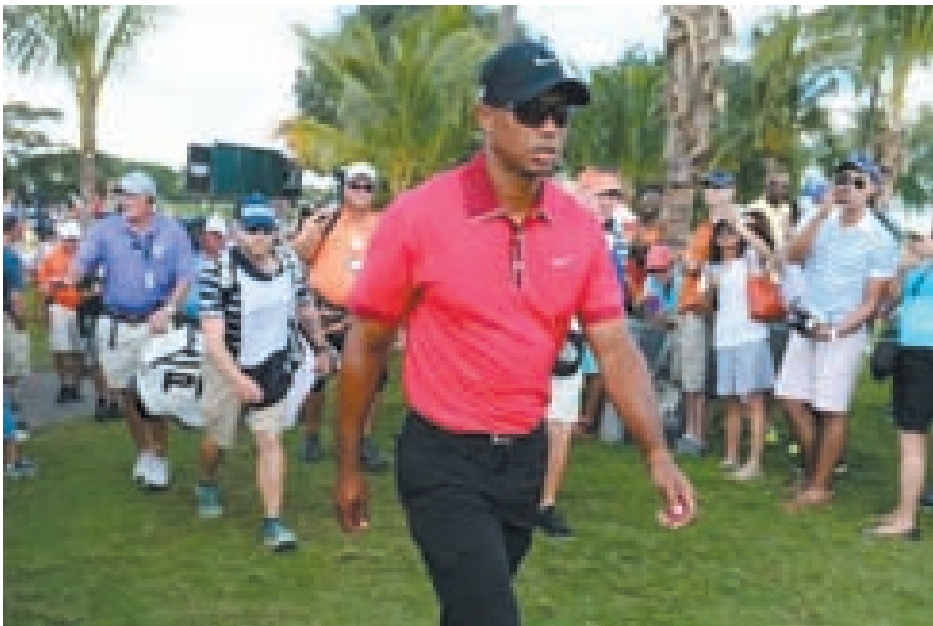
Tiger Woods walks to the 5th tee during the final round of the WGC - Cadillac Championship golf tournament at TPC Blue Monster at Trump National Doral.