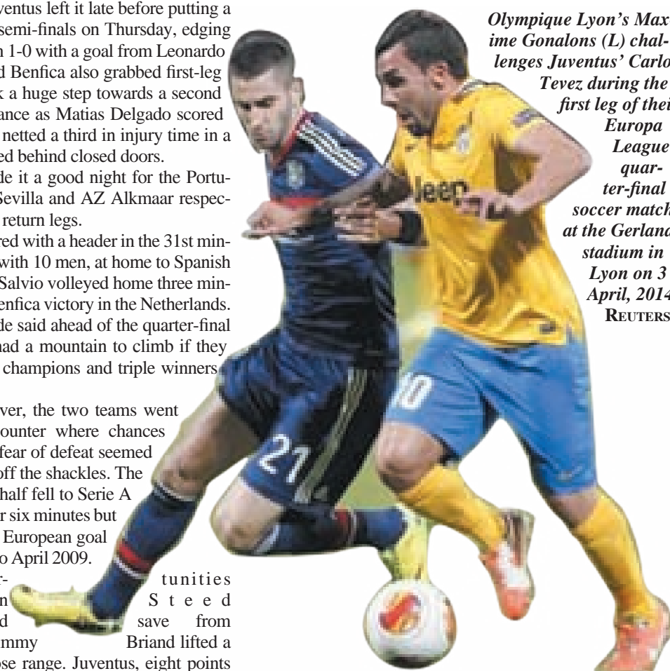
Olympique Lyon's Maxime Gonalons (L) challenges Juventus' Carlos Tevez during the first leg of their Europa League quarter-final soccer match at the Gerland stadium in Lyon on 3 April, 2014.

Basel's clash with Valencia was played behind closed doors after fan trouble in the Swiss team's last-16 tie in Salzburg but the muted atmosphere did little to hamper the hosts who took the lead after 34 minutes, Delgado finding the net