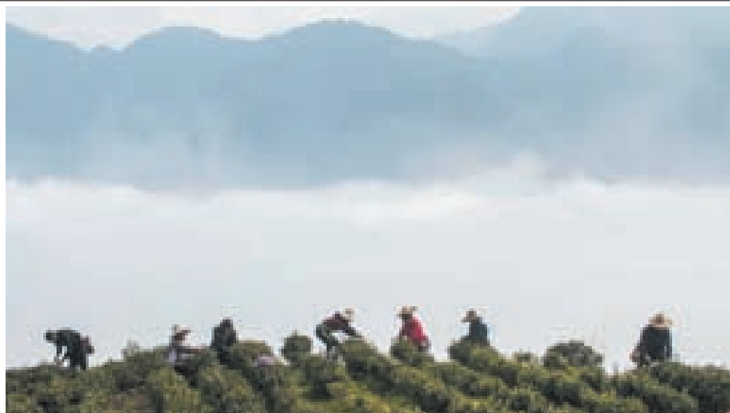
Women pick up tea leaves at a Huiming tea base in Jingning She Autonomous county, east China's Zhejiang Province, on 30 March, 2014. Huiming tea, famous for its unique taste, is a traditional famous tea in Zhejiang.

Advertise with us! For inquiries to place an advertisement in the NLM, Please email wallace.tun@gmail.com