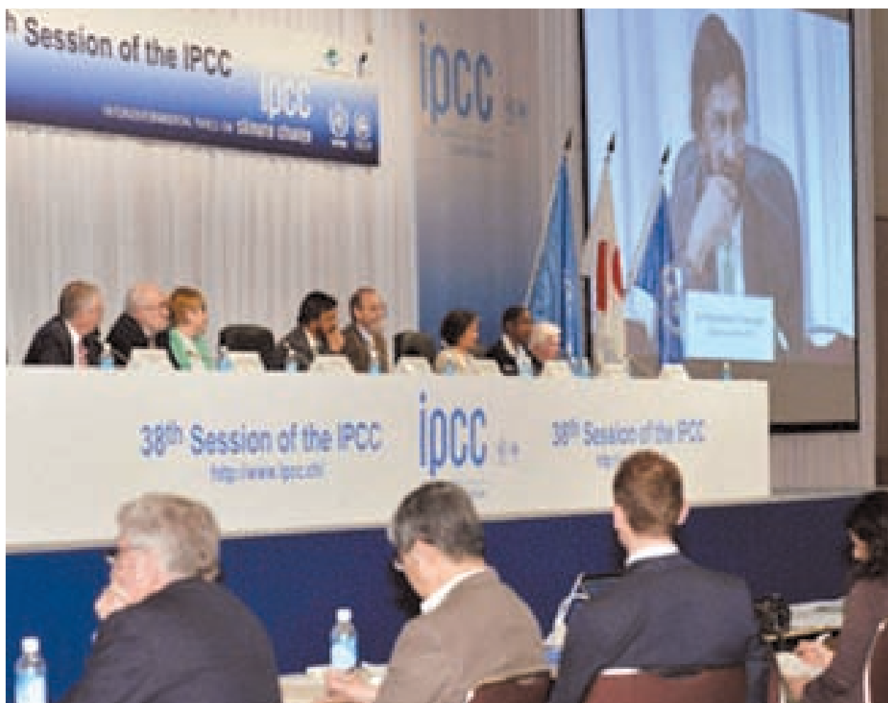
A joint Press conference is held in Yokohama, near Tokyo, on 31 March, 2014, after a general meeting of Intergovernmental Panel on Climate Change closed the previous day. The IPCC released its latest report assessing the impacts of climate change on human and natural systems, options for adaptation and opportunities for the future.