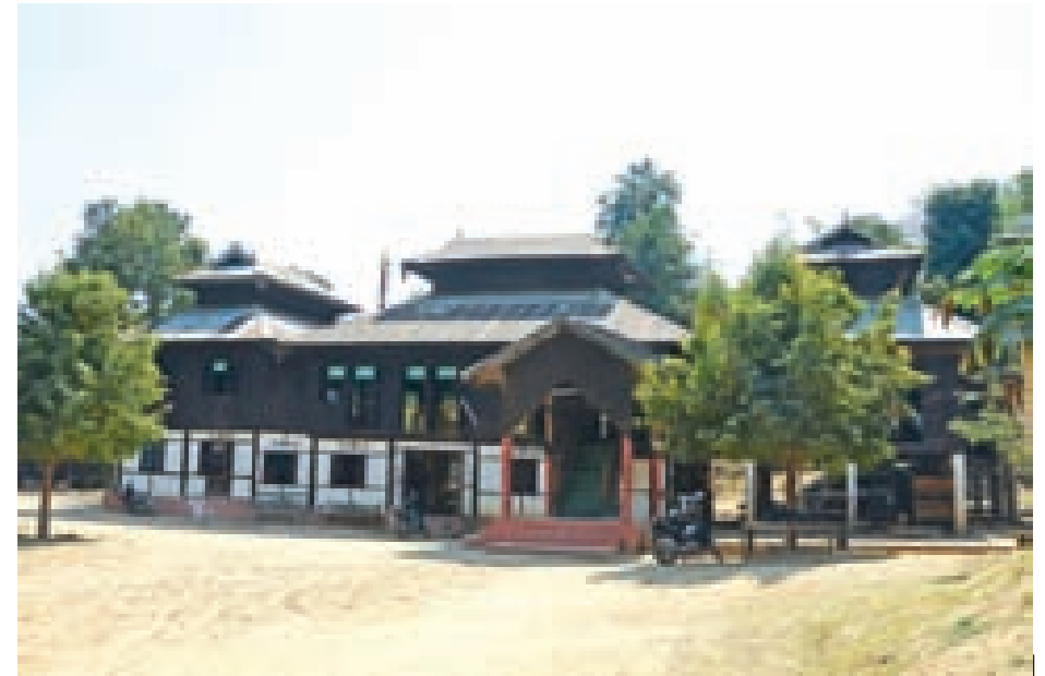
Photo shows a monastery legally established in Nay Pyi Taw Council Area. MNA

After meeting with authorities, bogus monks