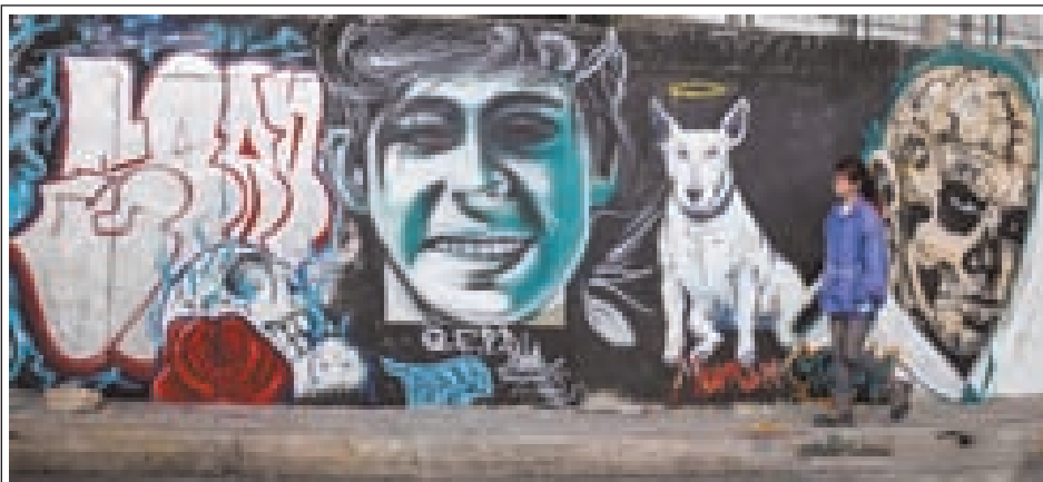
A resident walks in front of a graffiti mural in Bogota city, Colombia, on 30 March, 2014. Hundreds of graffiti artists gathered on Sunday to paint again the walls of the 26 street, after the police removed the graffiti due to an alleged measure of Bogota's acting mayor Rafael Pardo, according to local media.