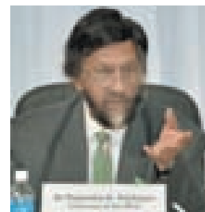
Rajendra Pachauri, chairman of the Intergovernmental Panel on Climate Change, holds a Press conference in Yokohama, near Tokyo, on 31 March, 2014.—Kyodo News

The international community is working to reach a new anti-global warming pact by 2015 to replace the 1997 Kyoto Protocol, which is widely seen as ineffective without the participation of the world’s two biggest carbon emitters — China and the United States. The IPCC has released four comprehensive assessment reports since it was formed in 1988 to help policymakers, with the last one in 2007.—Kyodo News