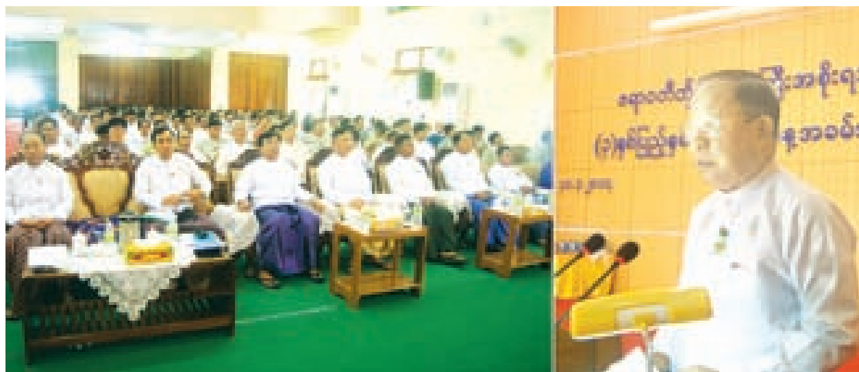
Chief Minister of Ayeyawady Region U Thein Aung addresses third anniversary of Region Government.