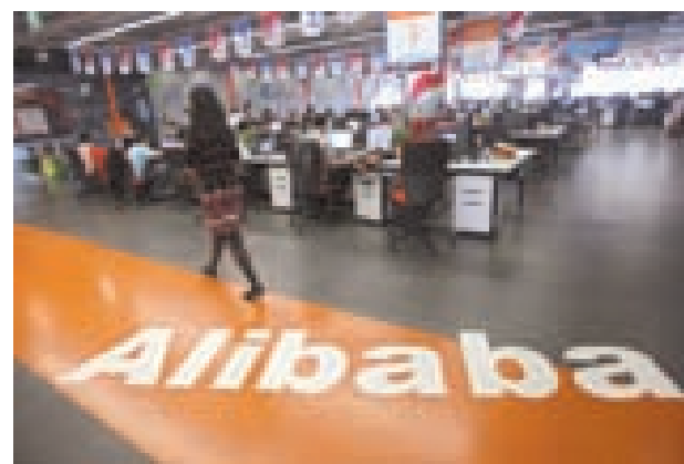
An employee walks past a logo of Alibaba Group at its headquarters on the outskirts of Hangzhou, Zhejiang province, in this 17 May, 2010 file photo.

The purchases come as Alibaba starts its preparations for an initial public offering set to be the biggest-ever technology listing, surpassing Facebook