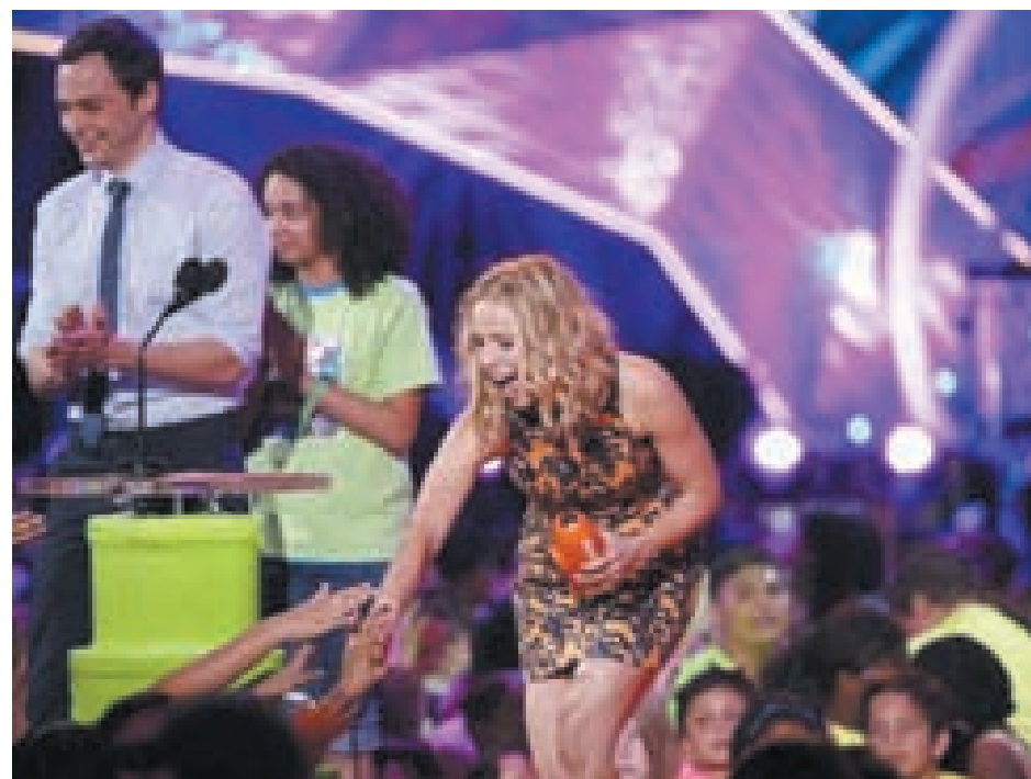
Actress Kristen Bell accepts the award for favourite animated movie for “Frozen” at the 27th Annual Kids’ Choice Awards in Los Angeles, California on 29 March, 2014.

charts for more than three months, also has now become the 10th-largest grossing film in cinema history.—Reuters