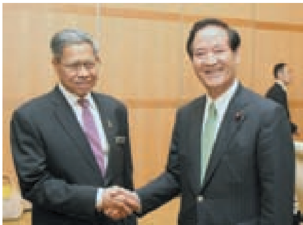
Malaysian Trade Minister Mustapa Mohamad (L) and Koya Nishikawa, a House of Representatives member of Japan's ruling Liberal Democratic Party, shake hands before their talks in Putrajaya on the outskirts of Kuala Lumpur on 31 March, 2014.

PUTRAJAYA, 31 March —Koya Nishikawa, a House of Representatives member of Japan's ruling Liberal Democratic Party, on Monday held talks in the Malaysian capital with Malaysian Trade Minister Mustapa Mohamad.