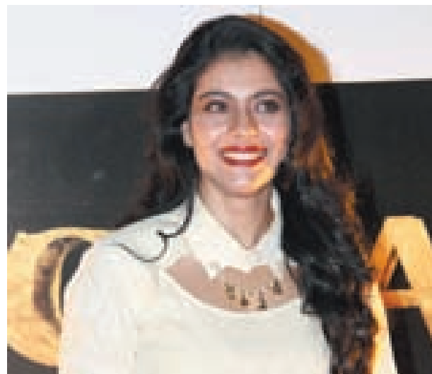
Kajol was among the guests at the launch of the Hindi trailer of Kochadaiiyaan.

MUMBAI, 31 March—Actress Kajol who attended the Hindi trailer launch