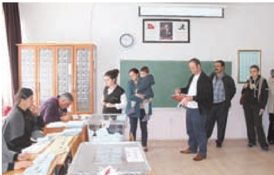
People wait to cast their votes in Ankara, Turkey, on 30 March, 2014. Turkey kicked off local elections with more than 52 million citizens expected to go to more than 190 thousand polls to vote for mayors and district administrators. Results of the local elections will also influence the presidential poll in August and the general elections next year.