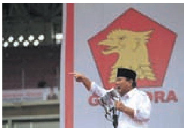
Prabowo Subianto (L), presidential candidate from the Great Indonesia Movement (Gerindra) Party, delivers a speech to supporters during a campaign rally at a stadium in Jakarta on 23 March, 2014.

Opinion polls suggest that PDI-P, currently in opposition, will win the most seats in parliament and easily grab the presidency with its hugely popular candidate, Jakarta governor Joko "Jokowi" Widodo. He has won national approval for his straight-forward leadership style but has yet to detail any economic policy.—Reuters