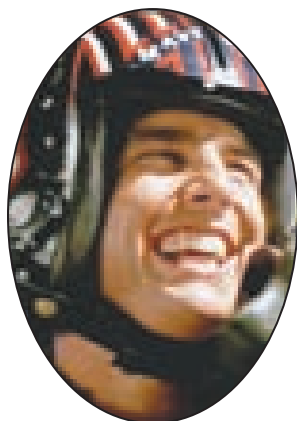
The original movie was released in 1986, when Tom was just 24 years old.

LOS ANGELES, 31 March—Top Gun 2 is still happening, says producer Jerry Bruckheimer, and the plot of the sequel to the 1986 Tom Cruise starrer is modern.