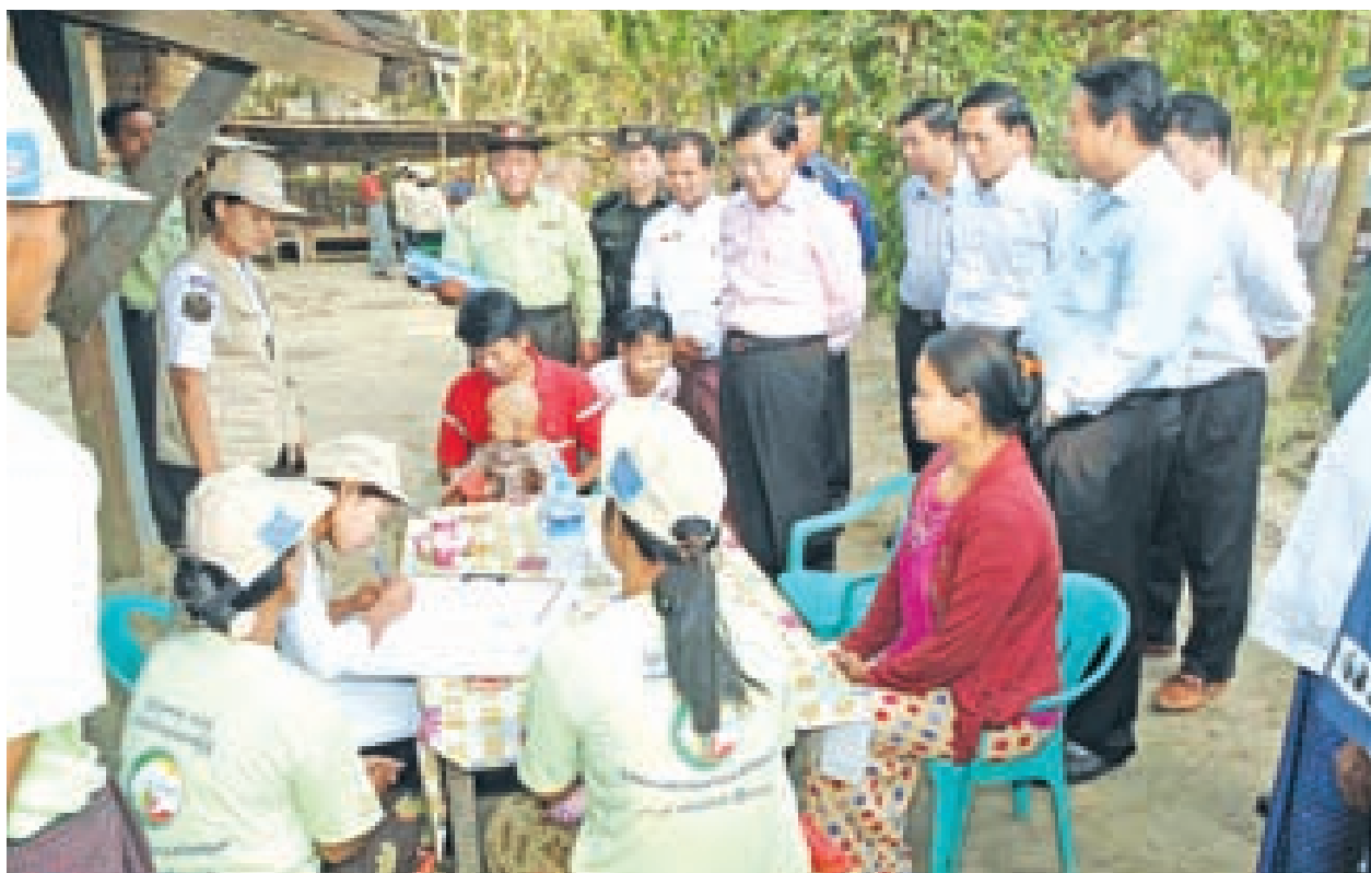
Vice-President U Nyan Tun observes nationwide census taking process in Buthidaung.—MNA

In taking census that was launched on Sunday, population data have been collected from 83737 people from 16065 households in eight townships of the state. The census taking process is going on peacefully.—MNA