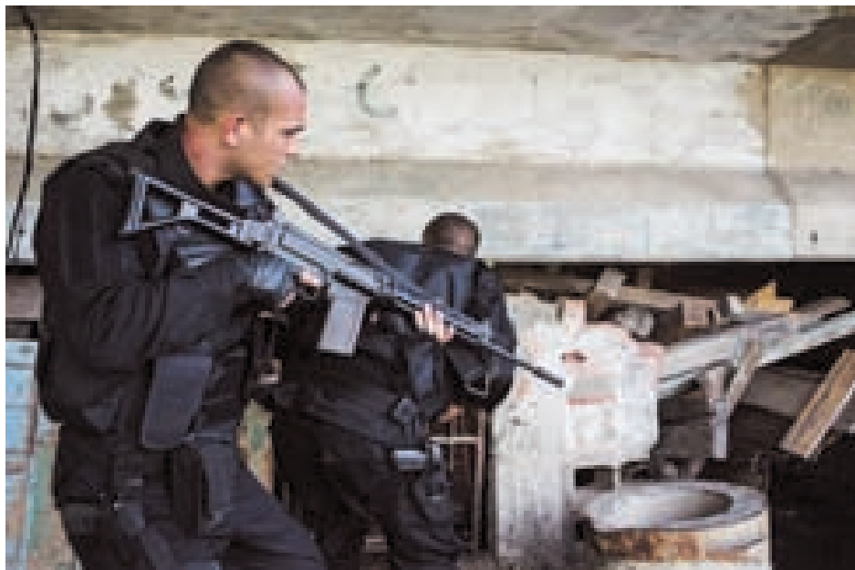
Security elements check a structure in the shanty town complex of Mare, north of Rio de Janeiro, Brazil, on 30 March, 2014.

Marines in armoured cars reinforced the operation that took barely 20 minutes to re-establish police control over the Maré slum complex where 130,000 people live in poverty on the north side of Rio.