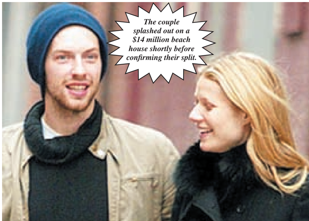
The couple splashed out on a $14 million beach house shortly before confirming their split.