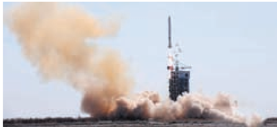
A Long March-2C carrier rocket carrying China's Shijian-11-06 satellite blasts off from the launch pad at the Jiuquan Satellite Launch Center in Jiuquan, northwest China's Gansu Province, on 31 March, 2014. China successfully launched the experimental satellite into preset orbit from Jiuquan Satellite Launch Center in its northwestern gobi desert on Monday morning.

This was the 189th flight of the Long March rocket series.