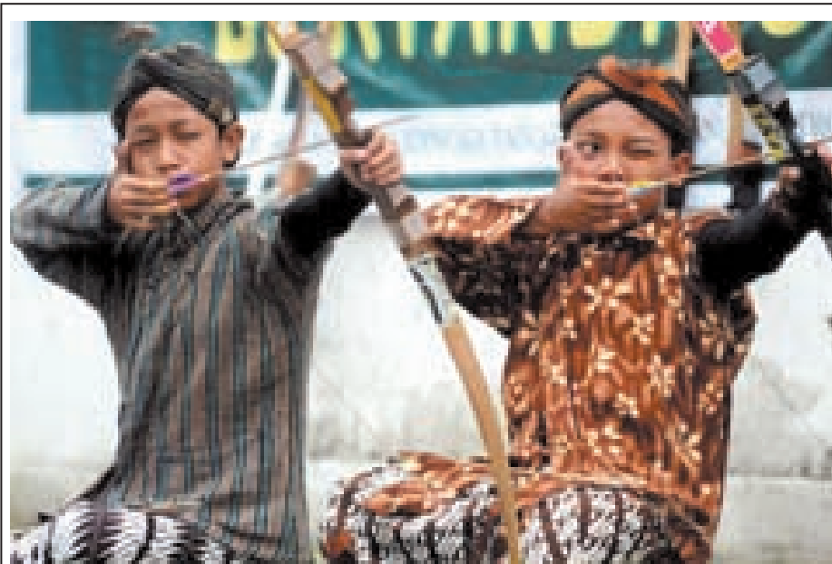
Children participate in a traditional archery contest (Jemparing) at Langenastran Kidul in Yogyakarta, Indonesia, on 29 March, 2014.