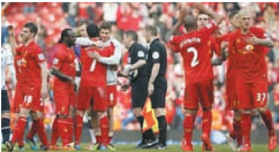
Liverpool's players celebrate after their English Premier League soccer match against Tottenham Hotspur at Anfield in Liverpool, northern England on 30 March, 2014.

Atletico Madrid moved a step closer to an unlikely title triumph when they battled back from a goal down to secure a 2-1 victory at fourth-placed Athletic Bilbao as the top three all won