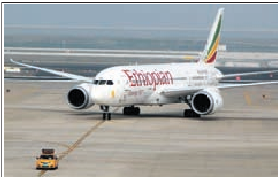
Flight ET 684 of Ethiopian Airlines taxis on the landing apron of Pudong Airport in east China's Shanghai Municipality, on 30 March, 2014. The landing of the plane here on Sunday marks the opening of the first direct flight between Shanghai and Africa.—XINHUA

One alternative to the aircraft data recorder and radar monitoring would be satellite transmission of flight data, but the world would need a satellite system that could handle a huge volume of data, he said.— Xinhua