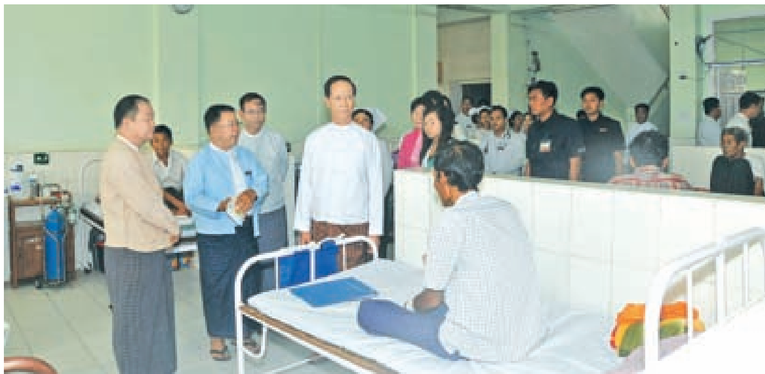
Vice-President Dr Sai Mauk Kham comforts the patients at 1000-bed hospital in Mandalay.

The increasing in number of patients who are willing to receive treatment at hospitals has shown that hospitals are becoming more reliable for them due to free health care services and improvement in diagnostic assessments, the vice-president said at the meeting with staff of the hospital.