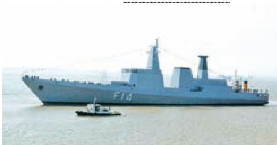
Frigate F 14 seen at No. 4 Naval Port in Thanlyin Station. MYAWADY