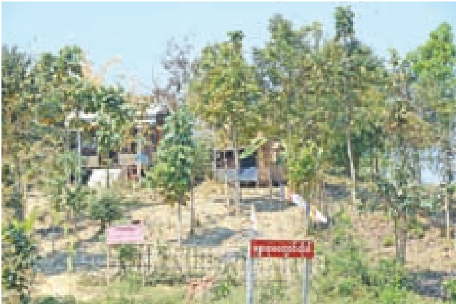
Photo shows illegal monasteries in forest reserve area in Nay Pyi Taw Council Area.—MNA

NAY PYI TAW, 31 March—Out of 21 cases of illegal monasteries which have been brought to court by the Nay Pyi Taw Council Area, three have been settled by respective courts, 10 are currently being dealt with, and monks from eight monasteries will