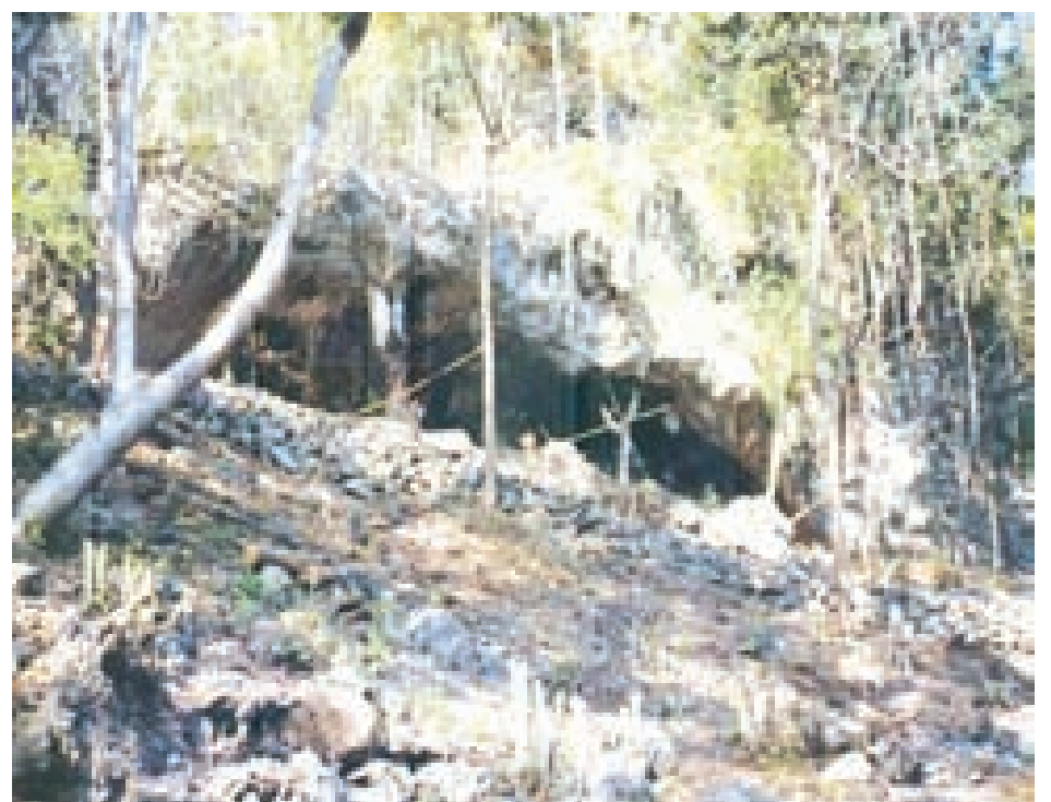
Photo shows Pyadalin Cave in Nyaungchet Village, Ywangan Township, Danu Self-Administered Zone, southern Shan State.

By Mie Mie Khaing (Department of Archaeology and National Museum)