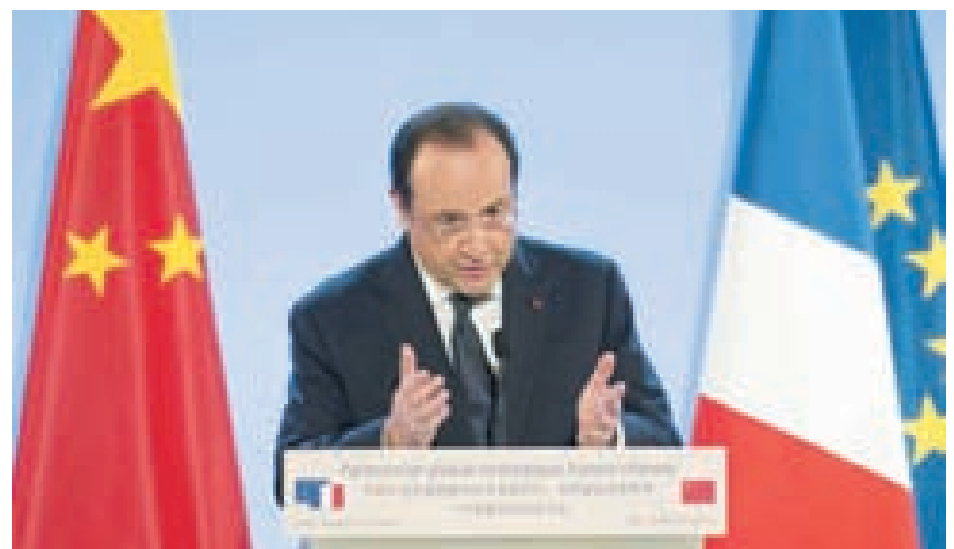
French President Francois Hollande delivers a speech to mark fifty years of diplomatic relations between France and China at the French Foreign Ministry in Paris on 27 March, 2014.