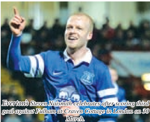
Everton's Steven Naismith celebrates after scoring third goal against Fulham at Craven Cottage in London on 30 March.

The Scotland international let fly from the edge of the box after Richardson had half-cleared a corner, and the low shot struck William Kvist before going in off Stockdale.