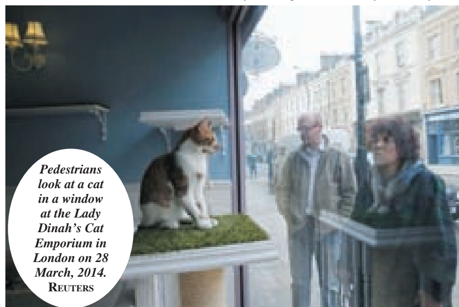
Pedestrians look at a cat in a window at the Lady Dinah's Cat Emporium in London on 28 March, 2014.