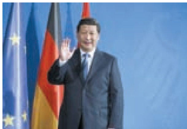
China’s President Xi Jinping waves to media following a joint news conference with German Chancellor Angela Merkel after an agreement signing, at the Chancellery in Berlin on 28 March, 2014.

Annual trade flows between China, the world’s