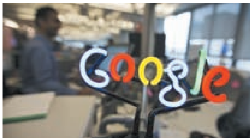
A neon Google logo is seen as employees work at the new Google office in Toronto, on 13 Nov, 2012.