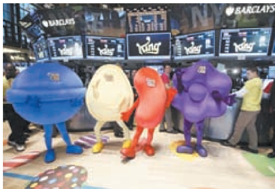
Mascots dressed as characters from the mobile video game "Candy Crush Saga" pose during the IPO of Mobile game maker King Digital Entertainment Plc on the floor of the New York Stock Exchange on 26 March, 2014.

That would mark a sharp turning point for the IPO market, in which investors have been fed a steady diet of new public offerings this year from