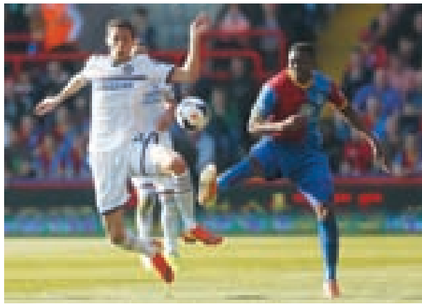
Crystal Palace's Kagisho Dikgacoi (R) challenges Chelsea's Gary Cahill during their English Premier League soccer match at Selhurst Park in London on 29 March, 2014.

Eden Hazard had two opportunities to haul the visitors level but could not find a way past inspired