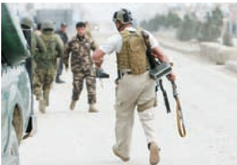
Afghan security personnel arrive near an election commission office during an attack by gunmen in Kabul on 29 March, 2014.

frightened IEC staff and eight international United Nations employees took refuge in safe rooms inside the compound, a security source and staff said.