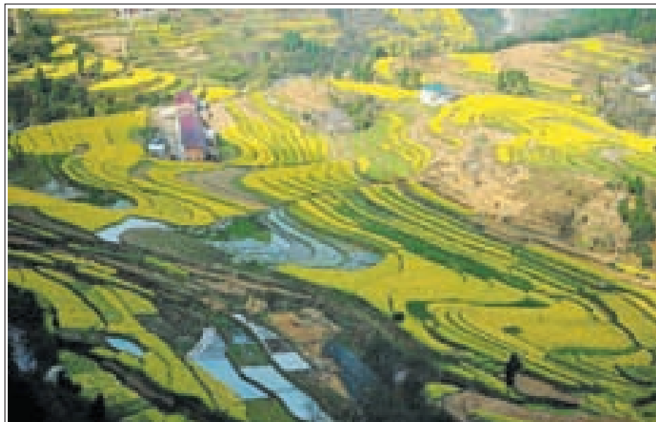
Rape flowers are in blossom on terraced fields in Shiyangzhan Village of Ningqiang County, Hanzhong City, northwest China's Shaanxi Province, on 29 March, 2014.