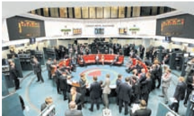
Traders and clerks work at the London Metal Exchange (LME) in London, on 22 July, 2011.

LONDON, 30 March — The London Metal Exchange (LME) pressed on with reforms to its warehousing network on Friday, unveiling tighter “Chinese Wall” restrictions a day after a court ruling forced the LME to halt a plan to cut delivery backlogs.