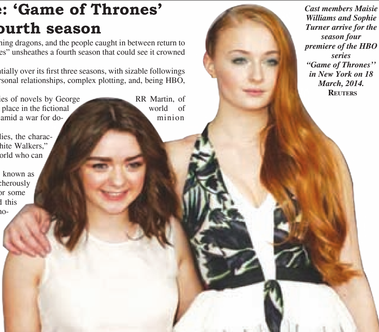
Cast members Maisie Williams and Sophie Turner arrive for the season four premiere of the HBO series "Game of Thrones" in New York on 18 March, 2014.

Last year, the show averaged 14.4 million viewers across all platforms, only about 50,000 viewers shy of HBO's most-watched show ever, the sixth season of the mob family drama "The Sopranos." Among cable dramas, it is second in viewership, trailing only basic cable's zombie apocalypse saga "The Walking Dead" on AMC Newtworks Inc, which is averaging 17.6 million viewers in its fourth season.—Reuters