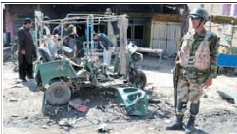
Pakistani security personnel inspect the blast site in southwest Pakistan's Quetta on 29 March, 2014. A five-year-old girl was killed and 18 people were injured when a bomb went off near a vehicle of paramilitary troops in Pakistan's southwest Quetta city on Saturday afternoon, local media reported.—XINHUA

He also demanded intensified efforts by the army to bring the terrorists to justice.— Xinhua