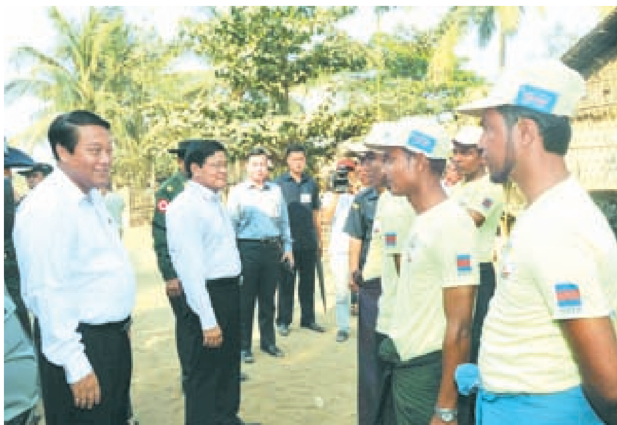
Vice-President U Nyan Tun meets with census taking squad in Sittway Township of Rakhine State.