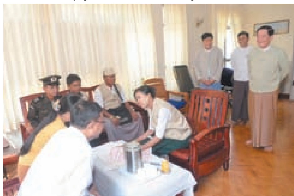
Union Minister U Thein Nyunt views collection of census data in Nay Pyi Taw Council Area.