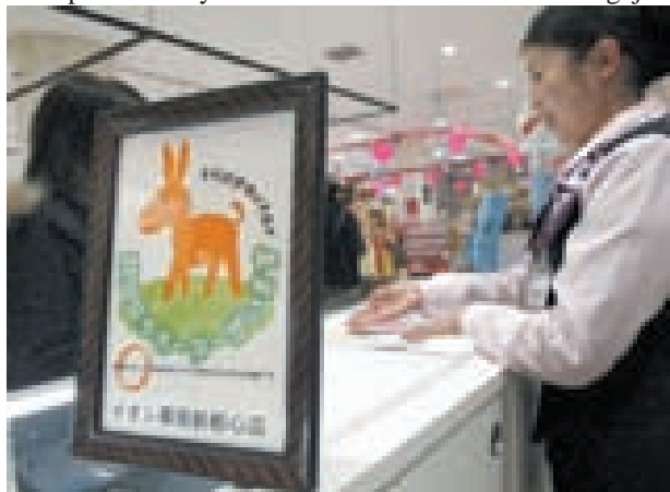
Photo taken on 10 Feb, 2014 shows a sign indicating a dementia care assistant, or "supporter" for people with dementia, is available at an outlet of Aeon Co in Chiba, Chiba Prefecture.