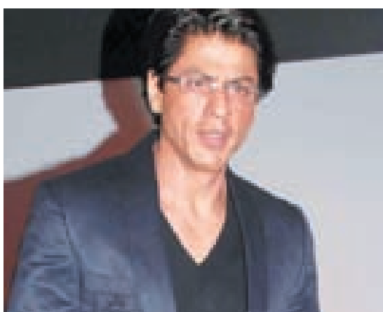
Shah Rukh Khan