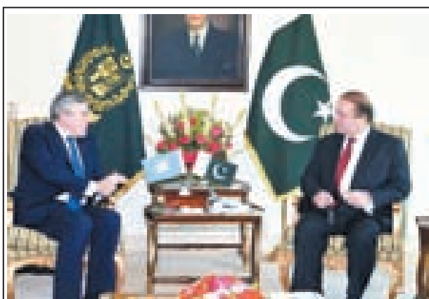
Photo released by Press Information Department (PID) on 29 March, 2014 shows Pakistani Prime Minister Nawaz Sharif (R) meets with United Nations Special Envoy for Global Education Gordon Brown in Islamabad, capital of Pakistan. A financial programme helping Pakistan's 6.7 million out-of-school children get access to education was announced on Saturday by Gordon Brown. —XINHUA

In March 1977, a 7.6-magnitude earthquake killed 1,600 people in Romania and damaged 8,500 buildings. — Xinhua