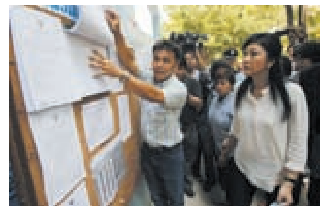
Thai Prime Minister Yingluck Shinawatra (R) checks a list of voters' names before voting at a polling station in Bangkok on 30 March, 2014. Thais voted on Sunday for half of the country's 150-seat Senate in a key test for Yingluck's troubled government, a day before the prime minister is due to defend herself against negligence charges over a disastrous rice subsidy scheme.

While party affiliation is prohibited in the non-partisan Senate, the majority of the 77 elected seats will be decided on the basis of endorsements from powerful, party-affiliated, local institutions, particularly in rural areas, meaning that the result could deliver a pro-Yingluck majority.