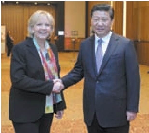
Chinese President Xi Jinping (R) meets with North Rhine-Westphalia State Premier Hannelore Kraft in Dusseldorf, Germany, on 29 March, 2014.

DUSSELDORF, 30 March — China will open a consulate general in the German city of Dusseldorf, President Xi Jinping said here on Saturday.