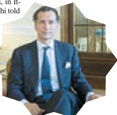
ENI President Giuseppe Recchi poses during a meeting organized by young Confindustria members in Santa Margherita Ligure on 11 June, 2011.

"Our intent is to create value in the interest of all shareholders. There are no different types of shareholders, in my view. There is only one category of shareholders, which is 'all' shareholders".