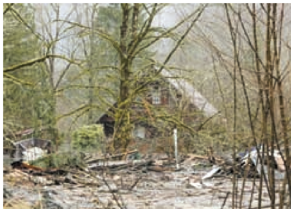
A home located off Highway 530 is surrounded by mud and debris as search work continues from a massive landslide that struck Oso near Darrington, Washington on 29 March, 2014.

Rescue and recovery workers pushed through wind and rain on Saturday continuing to comb through debris left after the