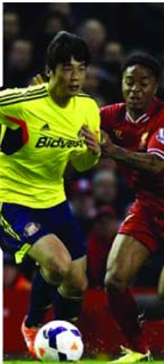
Sunderland's Ki Sung-Yeung (L) is challenged by Liverpool's Raheem Sterling during their English Premier League soccer match at Anfield in Liverpool, northern England on 26 March, 2014.