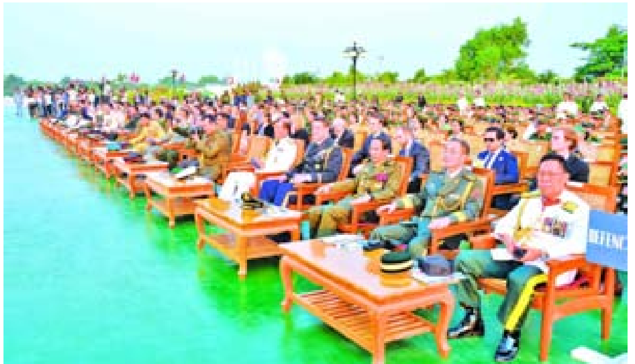
Defence Attaches of foreign countries enjoy observance of 69 th Anniversary Armed Forces Day on 27 March, 2014.