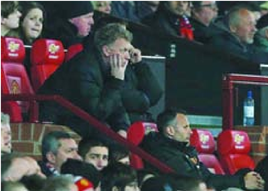
Manchester United's manager David Moyes (L) and Ryan Giggs react during their English Premier League soccer match against Manchester City at Old Trafford in Manchester, northern England on 25 March, 2014.

LONDON, 27 March — After a brief ray of sunshine in a stormy season, the dark clouds were hovering over Old Trafford again on Wednesday in the wake of another humiliation for the champions.