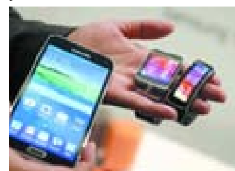
The new Samsung Galaxy S5 smartphone (L), Gear 2 smartwatch (C) and Gear Fit fitness band are displayed at the Mobile World Congress in Barcelona on 23 Feb, 2014.

The model already lacks sweeping hardware improvements and faces intensifying competition from smaller competitors at home and abroad. SK Telecom, South Korea's biggest mobile carrier, said it started to offer the Galaxy S5 at 866,800 Korean won on Thursday, cheaper than its predecessor.—Reuters