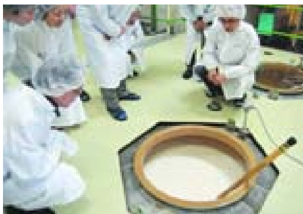
Visitors on a guided tour at Japanese sake brewer Kinshi-Masamune Co's Shintokiwigura plant in Kyoto, western Japan, watch the sake fermentation process as "koji" malted rice and yeast are mixed on 28 Feb, 2014.