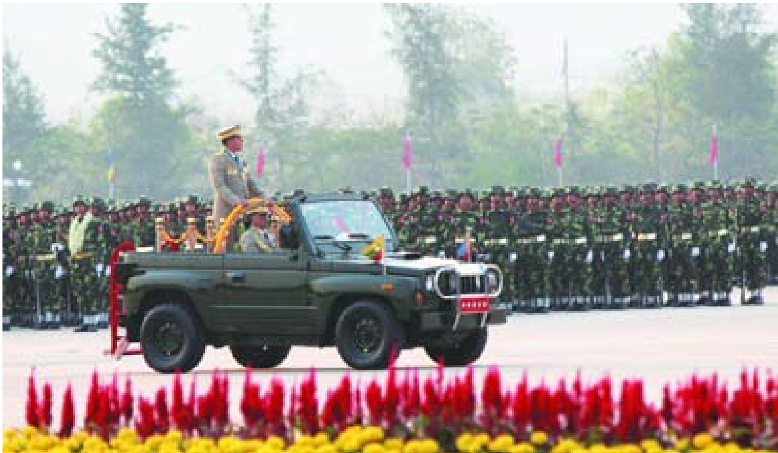
Commander-in-Chief of Defence Services Senior General Min Aung Hlaing inspects parade companies at 69 th Anniversary Armed Forces Day Parade in Nay Pyi Taw.

NAY PYI TAW, 27 March—Myanmar’s Armed Forces performed drills and displayed their military hardware during the 69 th Anniversary Armed Forces Day Parade in Nay Pyi Taw on Thursday, with Commander-in-Chief of Defence Services Senior General Min Aung Hlaing delivering a speech on the role of the Armed Forces. He said that according (See page 3)