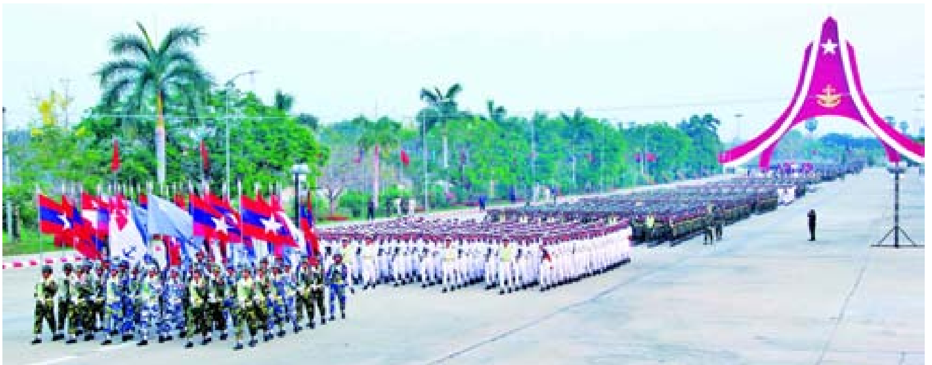
Servicemen marching into Parade Ground for attending 69 th Anniversary Armed Forces Day.