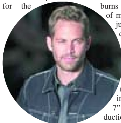
US actor Paul Walker

"Investigators determined the cause of the fatal solo-vehicle collision was unsafe speed for the