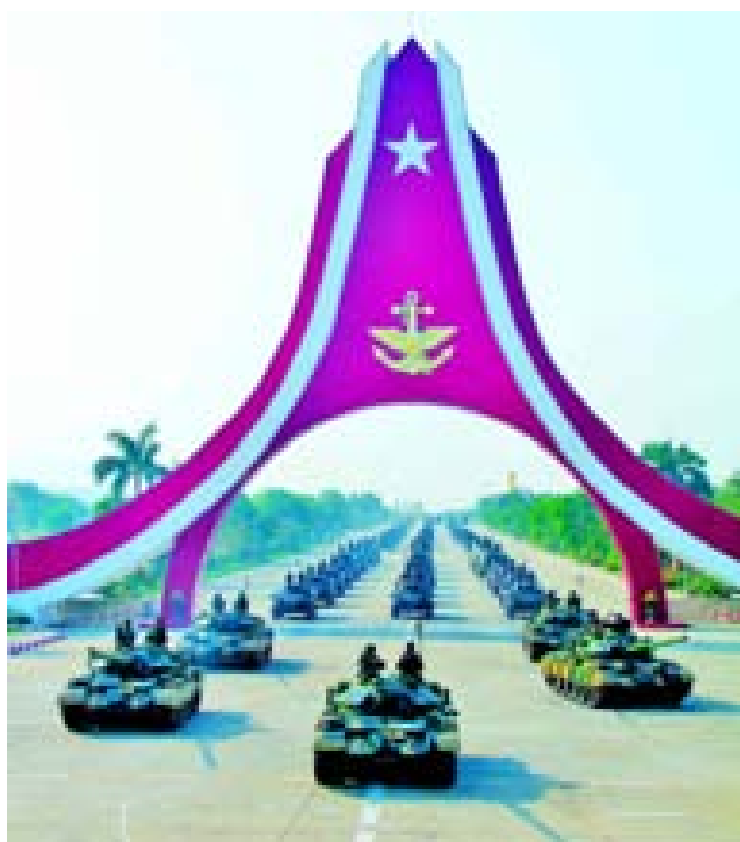
Armoured vehicles driving to parade ground at 69 th Anniversary Armed Forces Day ceremony.