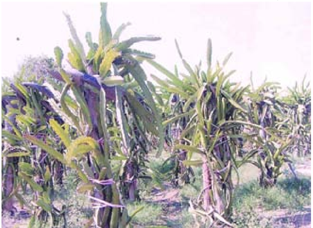
Photo shows thriving Dragon fruits plantation cultivated on a commercial scale.