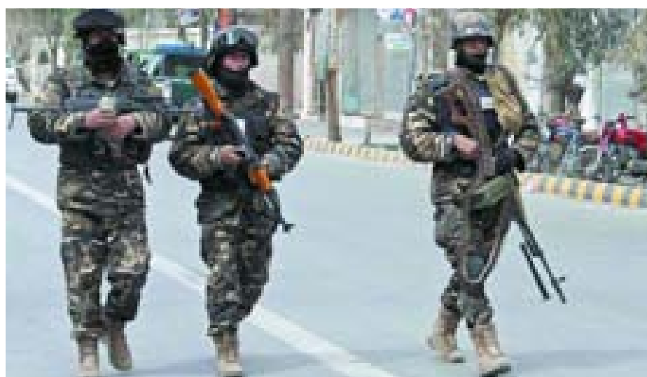
Afghan National Intelligence officers patrol after an assault by suicide attackers in Kandahar, on 12 March, 2014.

"If Kandahar is peaceful, Afghanistan is peaceful," provincial governor