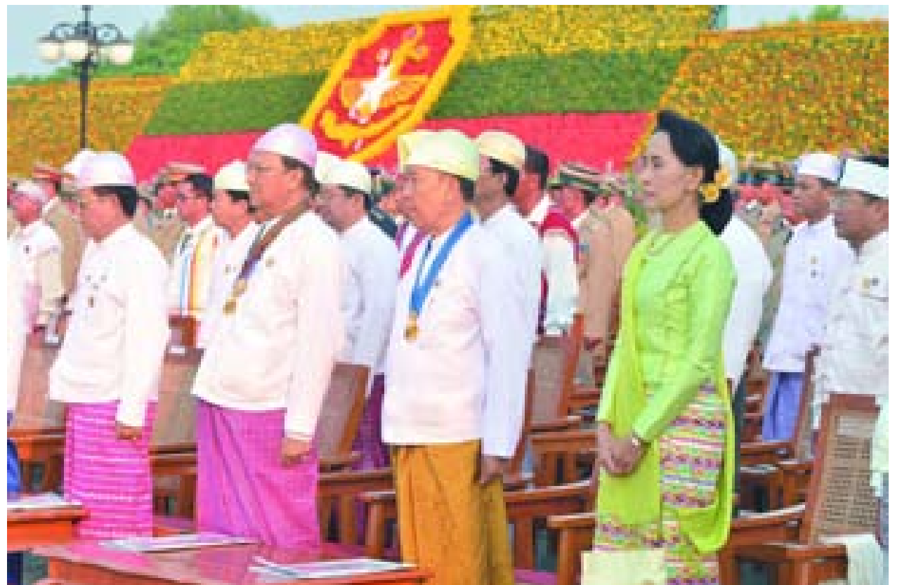
Dignitaries seen at 69 th Anniversary of Armed Forces Day Parade in Nay Pyi Taw.

The need for the Armed Forces to continue their role in political negotiations in order to find solutions to the political issues in Myanmar was stressed by President U Thein Sein on Wednesday