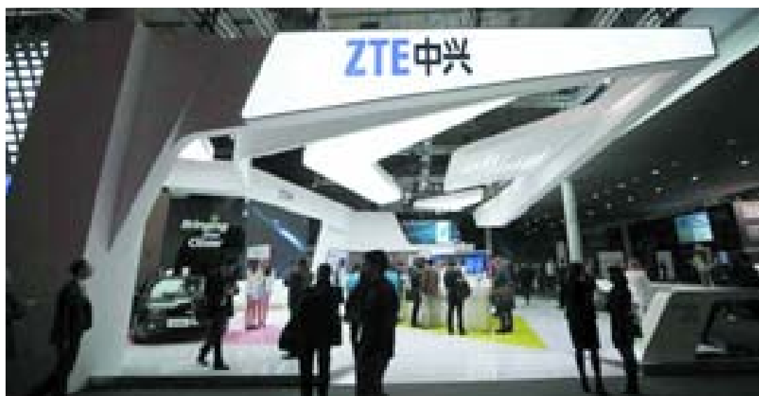
Visitors check out products at the ZTE stand at the Mobile World Congress in Barcelona, on 24 Feb, 2014. —REUTERS

battle with Google to ensure that handset makers using the free Android phone operating system pay Microsoft a license fee. Most of the larger handset makers, such as Samsung, LG and HTC, have already agreed to pay Microsoft a royalty on Android smartphones that Microsoft believes may infringe its patents.—Reuters