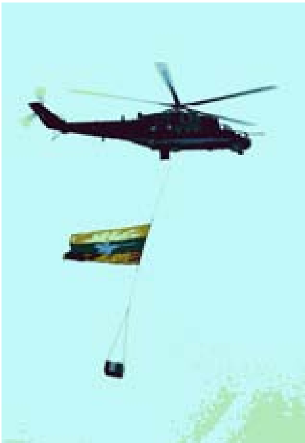
A military helicopter bearing State Flag at Armed Forces Day ceremony.