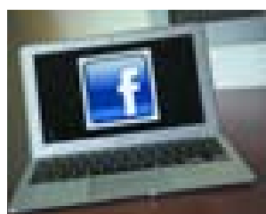
A portrait of the Facebook logo in Ventura, California on 21 Dec, 2013.