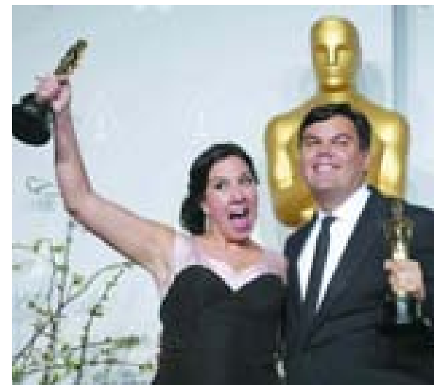
Kristen Anderson-Lopez and Robert Lopez hold their Oscars for best original song for "Let it Go" in the film "Frozen" at the 86th Academy Awards in Hollywood, California on 2 March, 2014.