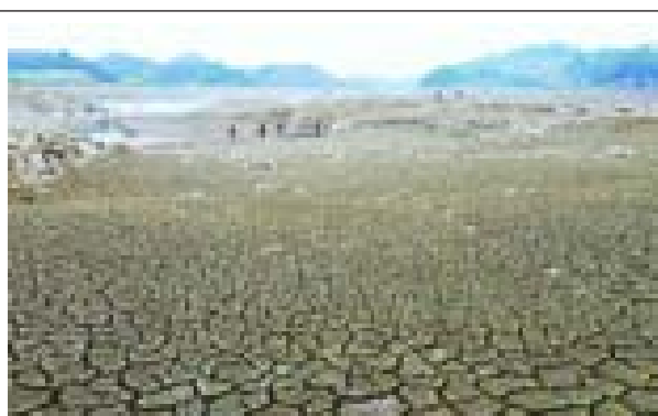
Photo taken on 22 March, 2014 shows the cracked floor of the Chuanqian Reservoir in Heba Town of Fenggang County in Zunyi City, southwest China's Guizhou Province. The lingering drought here makes the water level of the Chuanqian Reservoir, the only drinkable water reservoir of the Fenggang County, fall from 783 meters to less than 770 metres, affecting daily lives of more than 60,000 people.

Officers from Queensland's anti-gang Taskforce Maxima, Victoria's Police Crime Command, and Australian Federal Police from the National Anti-Gangs Squad, took part in the operation.—Xinhua