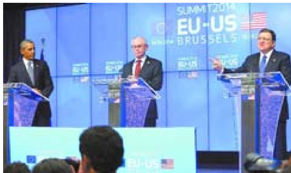
US President Barack Obama (L), European Council President Herman Van Rompuy (C) and European Commission President Jose Manuel Barroso hold a joint Press conference during the EU-US Summit at the EU Headquarters in Brussels on 26 March, 2014.

BRUSSELS, 27 March — The leaders of European Union and United States vowed on Wednesday to support Ukraine and "intensify sanctions" on Russia if things "further escalating."