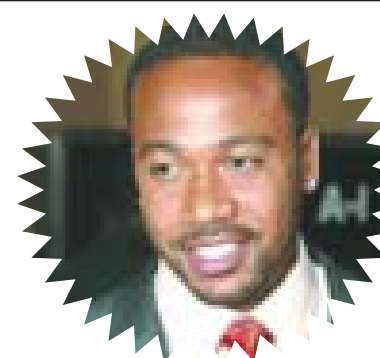
Actor Columbus Short, one of the stars of the film "Cadillac Records", attends the film's premiere in Hollywood, California on 24 Nov, 2008.