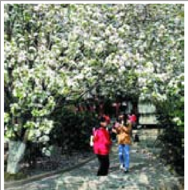
Tourists view the cherry blossoms at the Wulongtan park in Jinan, capital of east China's Shandong Province, on 27 March, 2014.