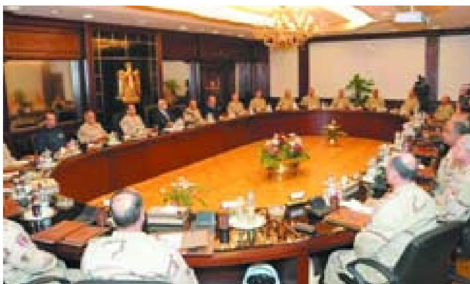
Egypt’s interim President Adly Mansour (L, in suit and tie) meets with Egypt’s army chief Field Marshal Abdel Fattah al-Sisi (seated next to Mansour) and military leaders, in Cairo on 26 March, 2014.

Free SIM cards will benefit about 30,000 independent trekkers who go to the remote areas every year. The cards will be handed over to them with their permits.—Reuters