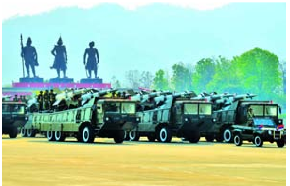
Mobile rocket launchers rolling into parade ground to take part in 69 th Anniversary Armed Forces Day.