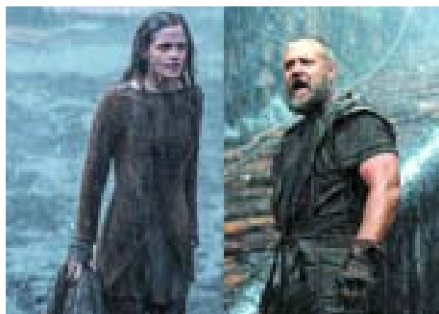
Noah Starring Russell and Emma will release on 28 March in India.