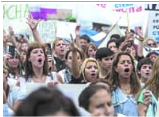
Teachers participate in a national teachers march outside the Education Ministry in Buenos Aires, capital of Argentina, on 26 March, 2014. The march organized in defence of public education and salary, is carried out in the framework of a strike which has lasted 15 days by the teachers in Buenos Aires Province.

Van Rompuy also said that sanctions are a positive incentive to seek a diplomatic solution. While the president of European Commission Jose Manuel Barroso called the Ukraine crisis a "wake up call" for the EU that the EU need to become less dependent from energy coming from "difficult spots", indicating from Russia.—Xinhua