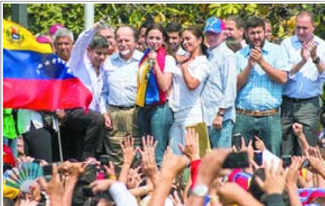
Venezuelan opposition Congresswoman Maria Corina Machado (C) delivers a speech during a rally at Brion de Chacaito Square, in Caracas, Venezuela, on 26 March, 2014.