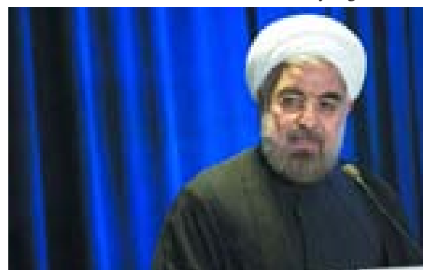
Iran's President Hassan Rouhani speaks during an event hosted by the Council on Foreign Relations and the Asia Society in New York on 26 Sept, 2013.