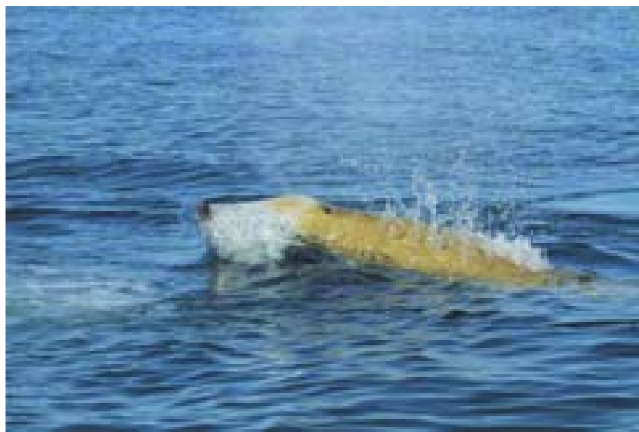
The head of an adult male Cuvier's beaked whale is pictured as it surfaces in this undated handout photo obtained by Reuters on 26 March, 2014.

Cuvier's beaked whales are widely distributed in many deep-water regions from the tropics to cool temperate waters, though not in polar regions. They measure up to about 23 feet long, with stout bodies shaped a bit like a tor-