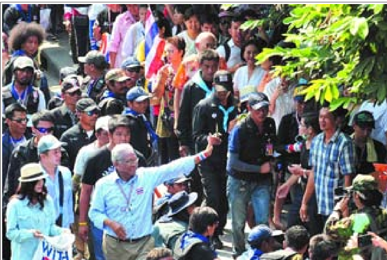
Anti-government protest leader Suthep Thaugsuban (2nd L, front) greets supporters during a march through streets in Bangkok, Thailand, on 27 March, 2014. People’s Democratic Reform Committee protesters marched in Bangkok for the fourth day to invite Bangkok people to join their mass rally on Saturday.—XINHUA