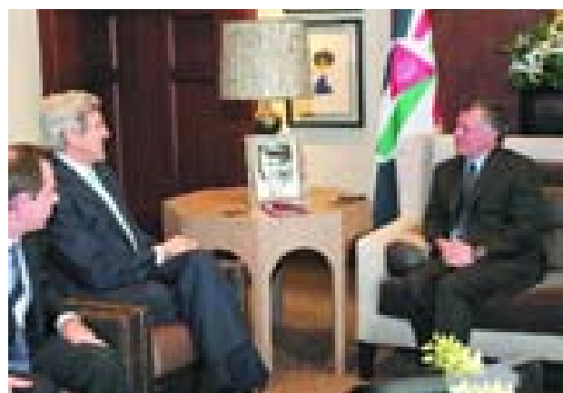
King Abdullah II of Jordan (R) meets with visiting US Secretary of State John Kerry (2nd L) in Amman, capital of Jordan, on 26 March, 2014.