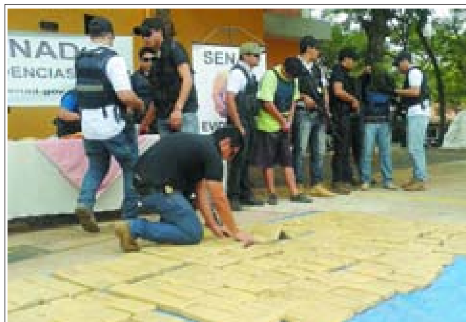
shows SENAD’s agents guarding a shipment of seized marijuana, in Asuncion, Paraguay, on 26 March, 2014. SENAD’s agents intercepted on Wednesday a shipment of marijuana that was heading to Chile, according to local Press.

As the two nations are celebrating five decades of their diplomatic ties this year, it is time to further appreciate the far-sightedness, wisdom and courage of the two late leaders, he said.—Xinhua