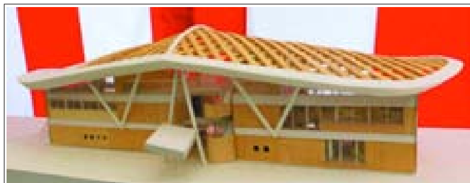
Photo taken on 25 March, 2014 shows a model of East Japan Railway Co's new Onagawa Station in Onagawa Town, Miyagi Prefecture, designed by Japanese architect Shigeru Ban, winner of the 2014 Pritzker Architecture Prize. The north-eastern Japan town was devastated by the March 2011 earthquake and tsunami.