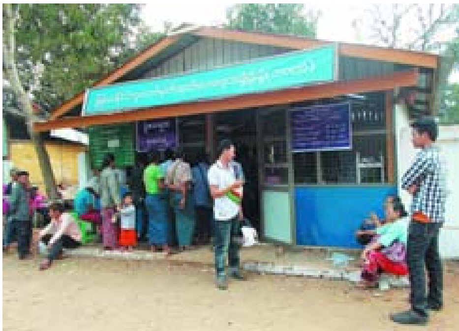
Applicants waiting for their turns to take out passports at Passport Office (Hpa-an) Branch.