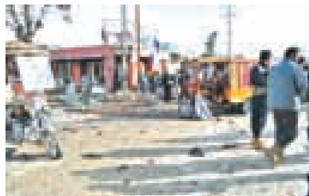
Afghan policemen inspect the site of suicide bombing in Maimana, Afghanistan, on 18 March, 2014. Fifteen people were killed and 20 others injured on Tuesday morning in a suicide bomb attack in Maimana, the provincial capital of northern Afghan province 425 km northwest of Kabul, provincial governor Mohammad Allah Baktash said.