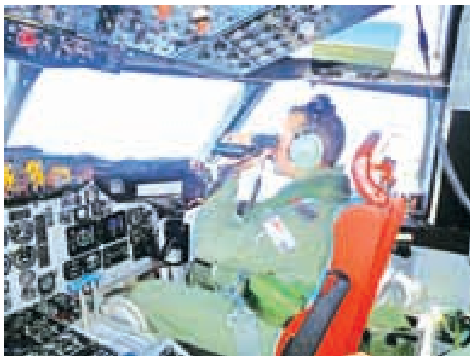
A Royal Australian Air Force pilot of an AP-3C Orion maritime patrol aircraft scans the surface of the sea near the west of Peninsula Malaysia in this handout picture by the Royal Australian Air Force, released via the Australian government's Department of Defence website on 17 March, 2014.—REUTERS

Malaysia's top official in charge of the unprecedented operation said it was