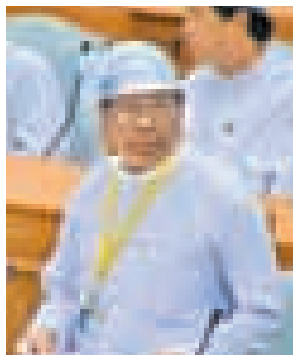
Union Minister for Mines Dr Myint Aung. MNA