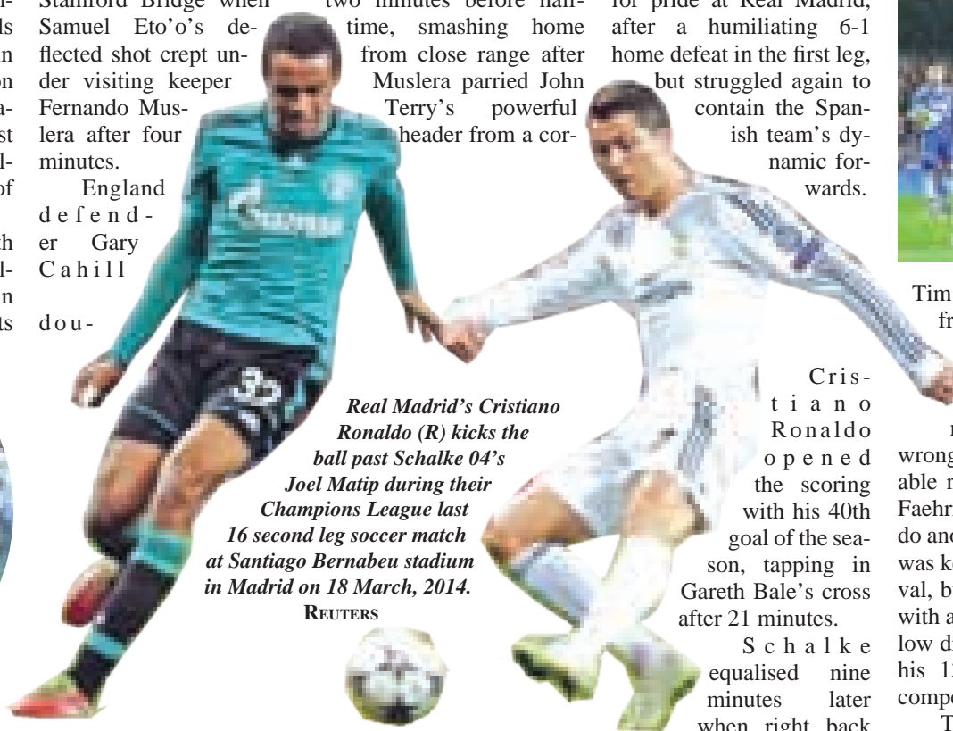
Real Madrid's Cristiano Ronaldo (R) kicks the ball past Schalke 04's Joel Matip during their Champions League last 16 second leg soccer match at Santiago Bernabeu stadium in Madrid on 18 March, 2014.

Tim Hoogland's shot from distance took a mean deflection off Sergio Ramos and trickled into the corner with Iker Casillas wrong-footed. A remarkable reflex save from Ralf Faehrmann denied Ronaldo another when his header was kept out after the interval, but he added a second with a typically spectacular low drive after 74 minutes, his 13th in this season's competition.