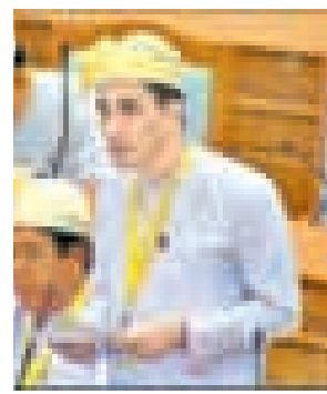
Deputy Minister for Cooperatives U Than Tun. MNA