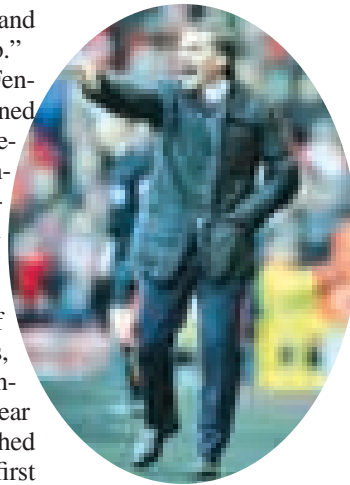
Liverpool's Brendan Rodgers reacts during their English Premier League soccer match against Arsenal at Anfield Stadium in Liverpool, northern England on 8 Feb, 2014.

"He has been a revelation. He keeps tweaking and tinkering with the formation and making little