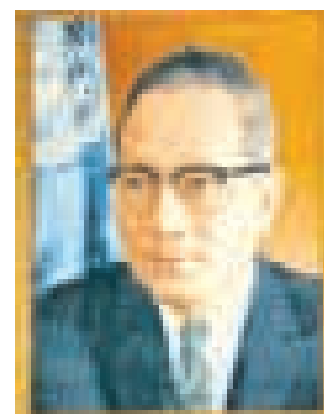
Former UN Secretary-General U Thant.

The 3 rd Secretary-General, an Asian and native of Myanmar, pride of the nation and its people served his full two terms of ten years and retired leaving behind a rich legacy of books, write ups, photos journals all credited to his accomplishments for the world at large. There were two