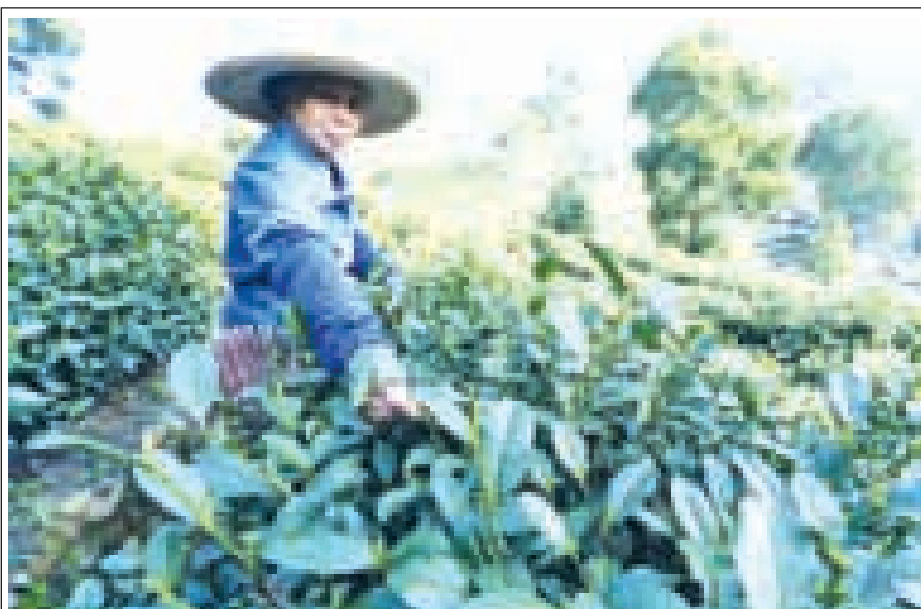
A farmer picks tea leaves at a garden in Hangzhou, capital of east China's Zhejiang Province, on 18 March, 2014.