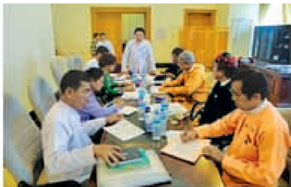
Work coordination meeting on seeking approval for the bill to protect the rights of national races in progress. —MNA