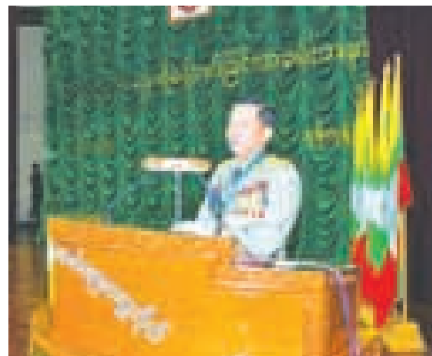
Commander-in-Chief of Defence Services Senior General Min Aung Hlaing delivers speech at commissioning ceremony.

In his speech on the occasion the Commander-in-Chief said that the new officers have to pursue advanced nursing and medical sciences continuously to be able to join the tasks of building a modern, patriotic armed forces.