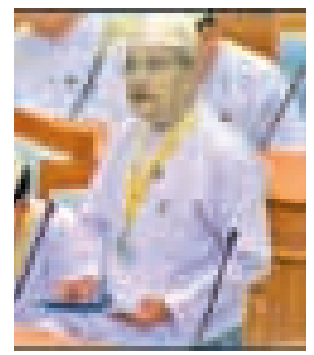
Deputy Minister for Communications and Information Technology U Win Than. —MNA