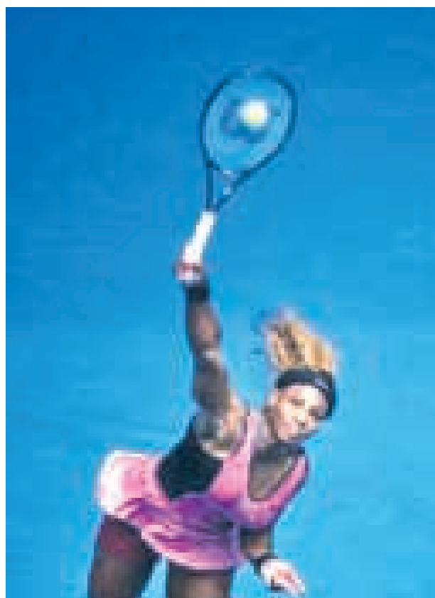
Serena Williams of the US serves to Ana Ivanovic of Serbia during their women's singles match at the Australian Open 2014 tennis tournament in Melbourne on 19 Jan, 2014.

one of oldest players in the women's draw yet remains the sport's dominant force with retirement nowhere in sight. Miami will be her fourth event of the season