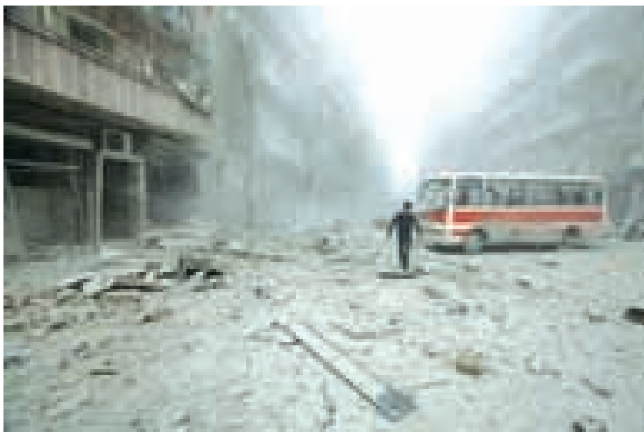
A man inspects the damage at a site hit by what activists said were barrel bombs dropped by forces loyal to Syria's President Bashar al-Assad in Aleppo's District of al-Sukari on 16 March, 2014.

GENEVA, 19 March — UN investigators said on Tuesday they had expanded their list of suspected war criminals from both sides in Syria's civil war and the evidence was solid enough to prepare any indictment.