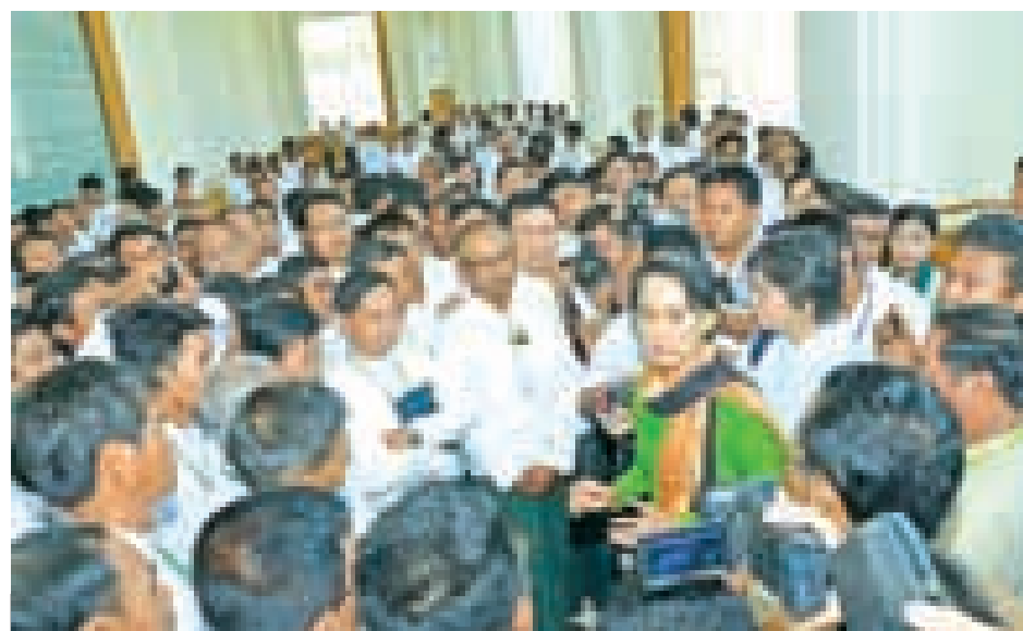
Daw Aung San Suu Kyi cordially meets with USDP members and town's elders of Kawhmu Township.