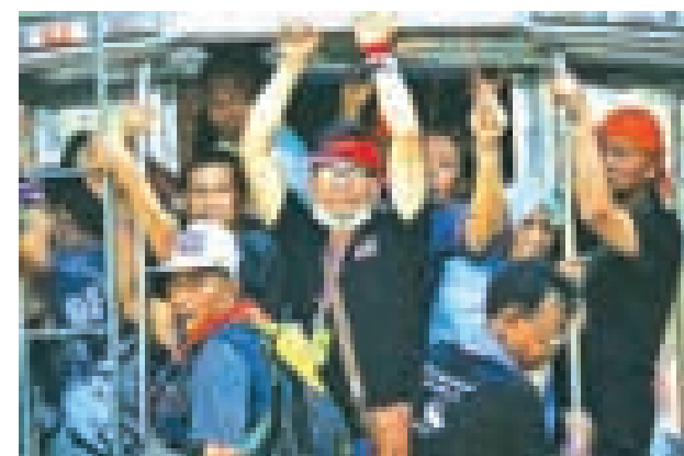
Anti-government protesters travel on a pick-up truck near the Interior Ministry building, which is being surrounded by fellow protesters, in Bangkok on 15 Feb, 2014.

taker administration with limited powers and scrapping the vote would further delay the formation of a new government.