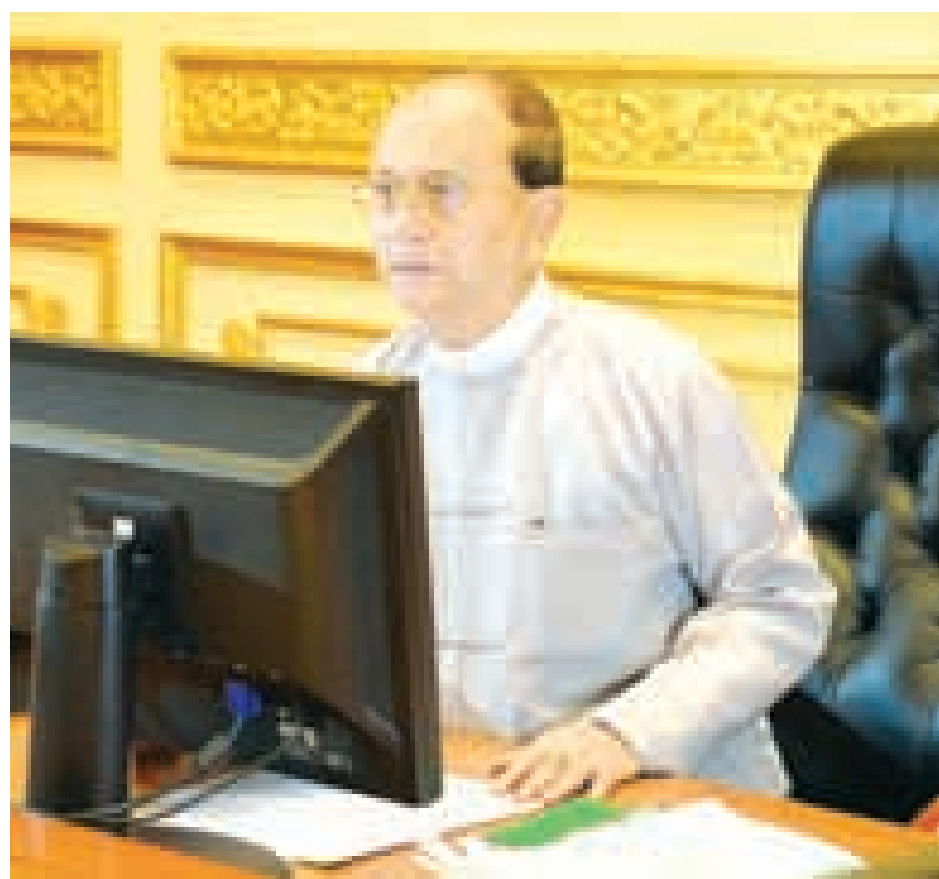
President U Thein Sein delivers address at the meeting of Financial Commission.