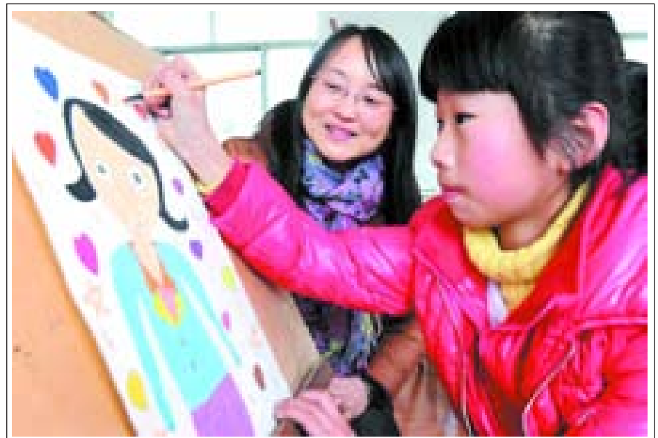
A stay-at-home girl paints a portrait for her teacher in Hefei, capital of east China's Anhui Province, on 7 March, 2014. To greet the International Women's Day on 8 March, a primary school in Hefei organized a painting activity on Friday, in which stay-at-home children painted portraits for the teachers that helped them a lot in their daily life when their parents as migrant workers were away.