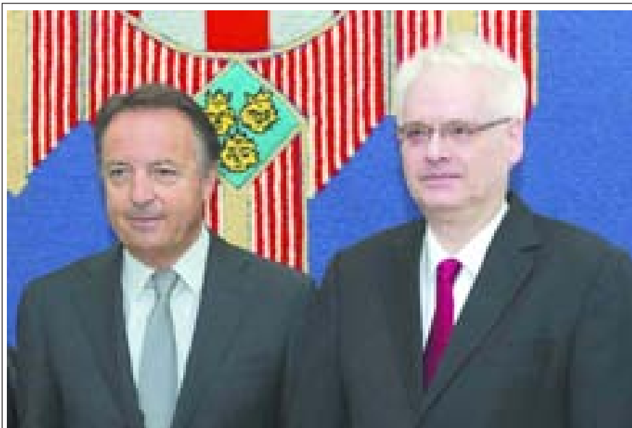
Visiting President of the French Senate Jean-Pierre Bel (L) poses for a photo with Croatian President Ivo Josipovic at the Presidential Palace in Zagreb, capital of Croatia, on 7 March, 2014. After Croatia, Bel is scheduled to visit Greece and Albania.

The US secretary of state arrived in Aqaba from the Italian capital Rome. Earlier he attended a conference on Libya and held meetings on the Ukraine crisis.—Xinhua