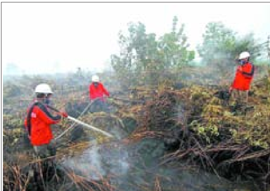
Firefighters extinguish the forest fire in Riau Province, Indonesia, on 7 March, 2014. The number of people having respiratory trouble scale up to over 30,000 at present from over 20,000 at mid of last month as thick smog has hit Riau of Sumatra island since February, official said on 4 March.—XINHUA