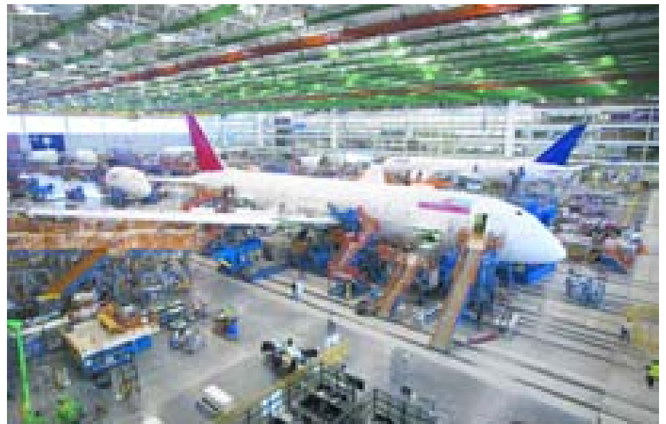
A 787 Dreamliner being built for India Air is pictured at South Carolina Boeing final assembly building in North Charleston, South Carolina on 19 Dec, 2013.

The cracks are the latest trouble for the