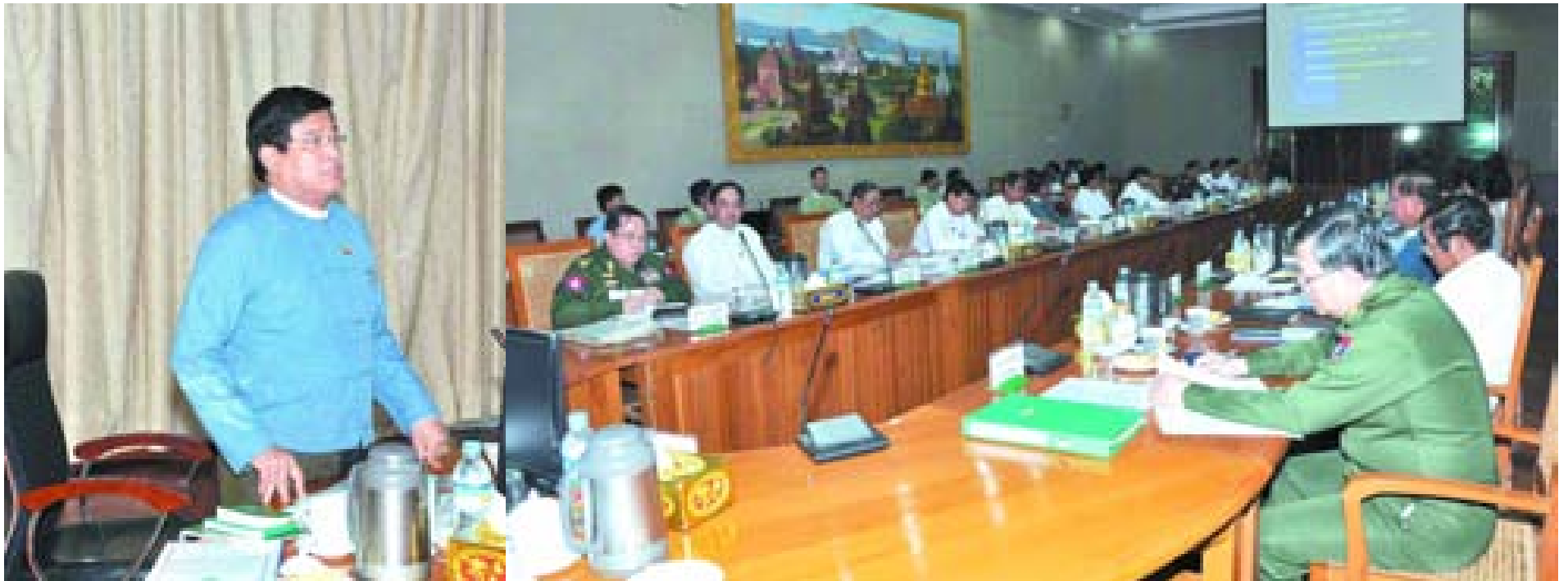
Vice-President U Nyan Tun addresses work coordination meeting aimed at finding ways to reduce the impact of mining on the environment.

NAY PYI TAW, 8 March—Vice-President U Nyan Tun has urged law enforcement bodies to take action against those who are exploring natural resources illegally and busi-