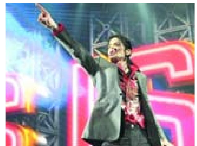
MJ is reportedly the father of a 31-year-old singer.