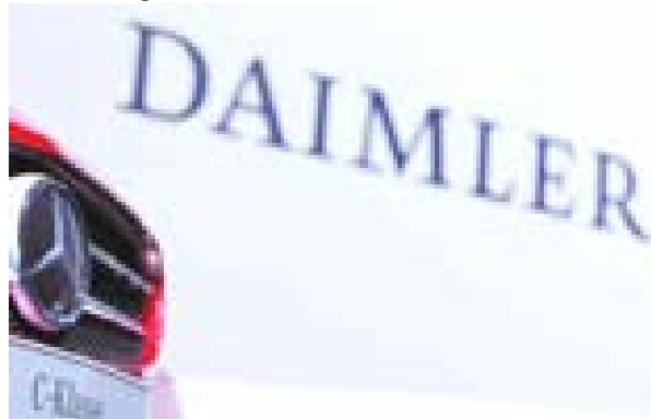
A C-class by Daimler AG is pictured before the company's annual news conference in Stuttgart on 6 Feb, 2014.