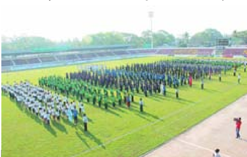
Photo shows opening ceremony of summer sports training courses in Nay Pyi Taw.

Sports and Physical Education Department