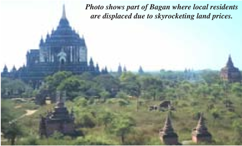
Photo shows part of Bagan where local residents are displaced due to skyrocketing land prices.

As the ancient city of Bagan is attracting more and more foreign tourists, the number of displaced dwellers is on the increase, making way for huge new infrastructure developments. The price of land has soared, and locals watch with anxiety the speed of construction projects everywhere.