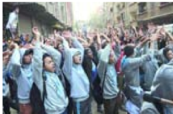
Supporters of Islamist President Mohamed Mursi, who was overthrown by the army after demonstrations against his rule last July, shout slogans during a protest in Om-ranya area, south of Cairo, on 7 March, 2014.