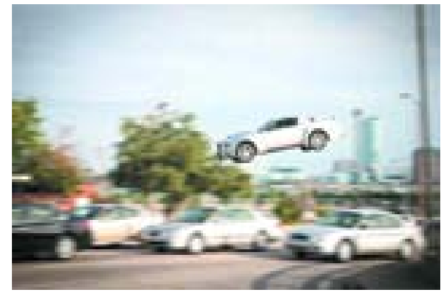
Still of the film "Need for Speed".

She says making a place here has been tough. "It is difficult because the industry is new for me. It's difficult because you don't know what is right and what is wrong. Are they the right people? Or are they going to take advantage of you? All these questions are always there, but you have to believe that your decision is the right one," Sunny said. "I feel business and entertainment are similar no matter wherever you work," said the actress, who will soon be seen in the horror film Ragini MMS 2. — PTI