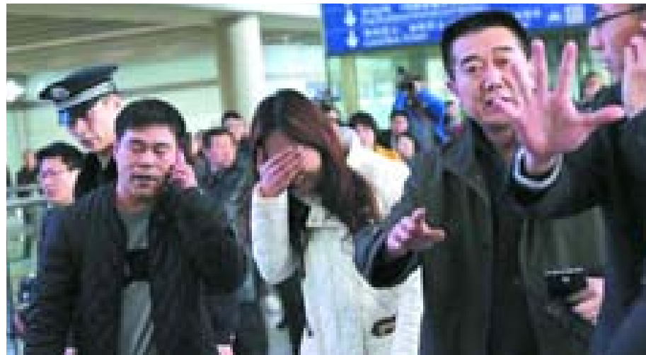
A woman (C), believed to be the relative of a passenger onboard Malaysia Airlines flight MH370, covers her face as she cries at the Beijing Capital International Airport in Beijing on 8 March, 2014.

Malaysia and Vietnam were conducting a joint search and rescue, he said but gave no details. China has also sent two maritime rescue ships to the South