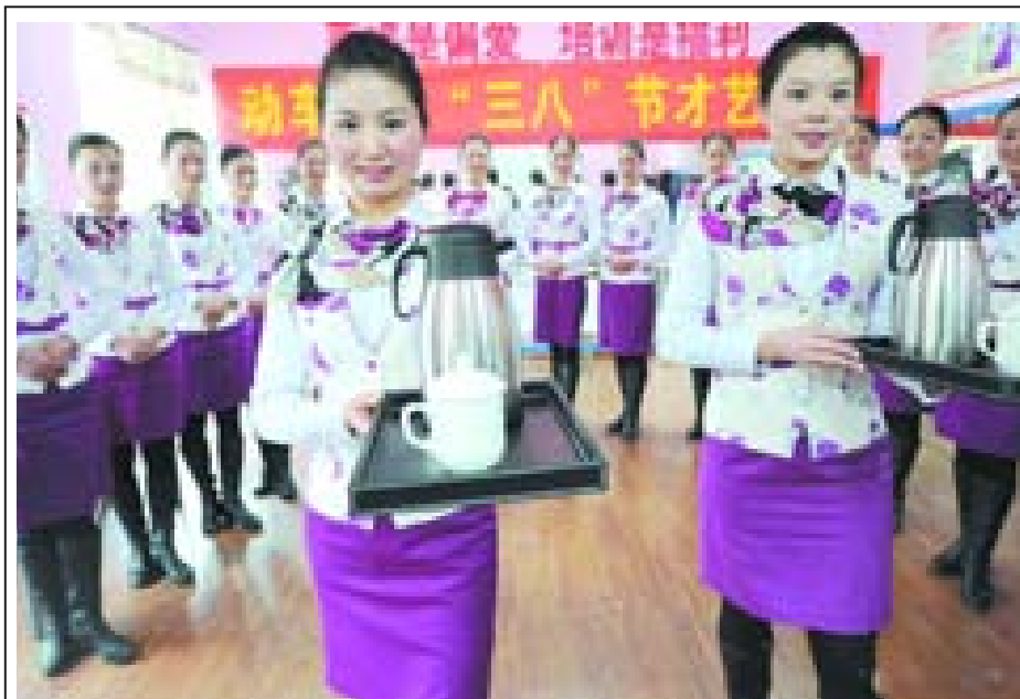
Waitresses on high speed train take part in a serving amenity competition ahead of the International Women's Day in southwest China's Chongqing municipality, on 7 March, 2014.