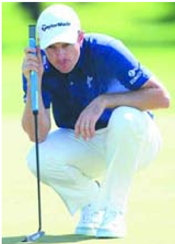
Justin Rose lines up a putt on the 2nd green in the second round of the WGC-Cadillac Championship golf tournament at TPC Blue Monster at Trump National Doral.

Northern Irishmen Rory McIlroy (74) and Graeme McDowell (71), Italian Francesco Molinari (75) and Welshman Jamie Donaldson, who posted the low round of the day with a two-under 70, were all lurking one shot further back. "I felt stressed all day because I knew every shot had a big penalty written all over it, staring at bogey or worse I thought at a well struck shot," Mahan told reporters. "It was a really tough day."