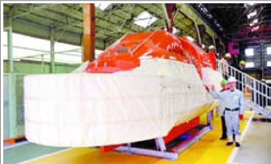
HI Corp unveils a lifeboat that it says can save people from tsunami resulting from an earthquake at its plant in Aioi, Hyogo Prefecture, western Japan, on 5 March, 2014.