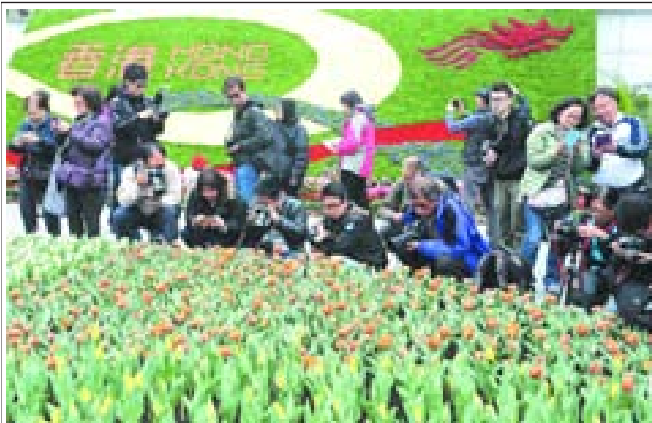
People take photos of flowers at the 2014 Hong Kong Flower Show in Victoria Park in Hong Kong, south China, on 7 March, 2014. The flower show will be held from on 7 to 16 March, exhibiting over 350,000 flowers.