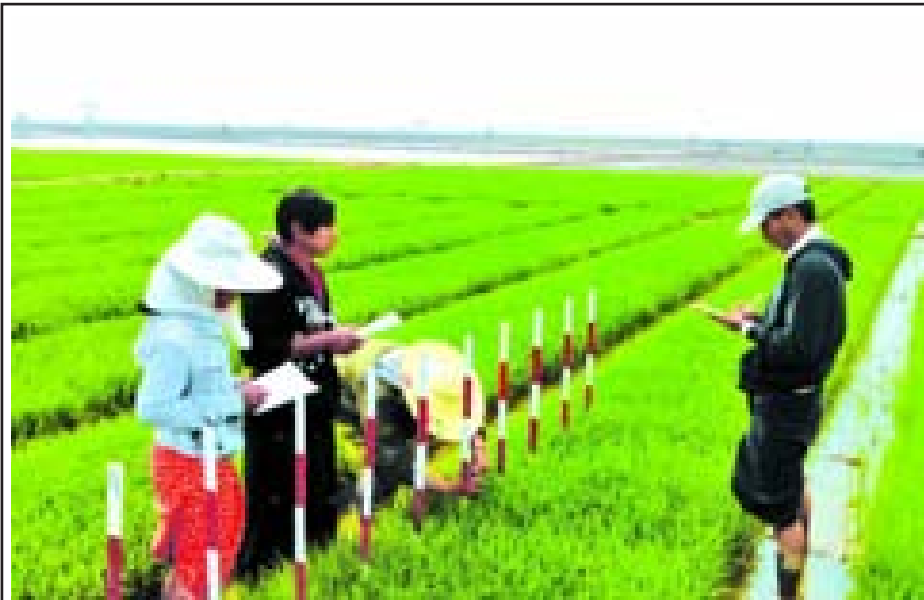
RIGHT DOWN TO THE FIELDS: Photo shows agriculturists making a field trip to the 3000-acre advanced farmland near Hotel Zone in Dekkhinathiri Township of Nay Pyi Taw on 7 March and checking the quality of paddy field for development of agriculture sector and improving the lives of farmers.

About 590 officials, experts and other parties concerned have taken part in discussions on how to reform the education system.