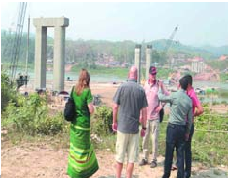
Delegation of Drug Enforcement Administration Yangon visits Tachilek.