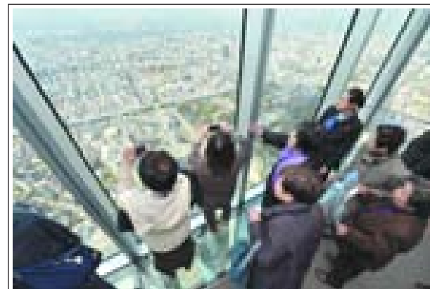
People look at the view from the observation deck of Japan's tallest skyscraper, the 300-metre Abeno Harukas, on 7 March, 2014, the day when it fully opened in Osaka, western Japan.