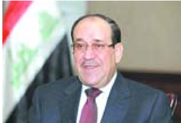
Iraq's Prime Minister Nuri al-Maliki speaks during an interview with Reuters in Baghdad on 12 Jan, 2014.