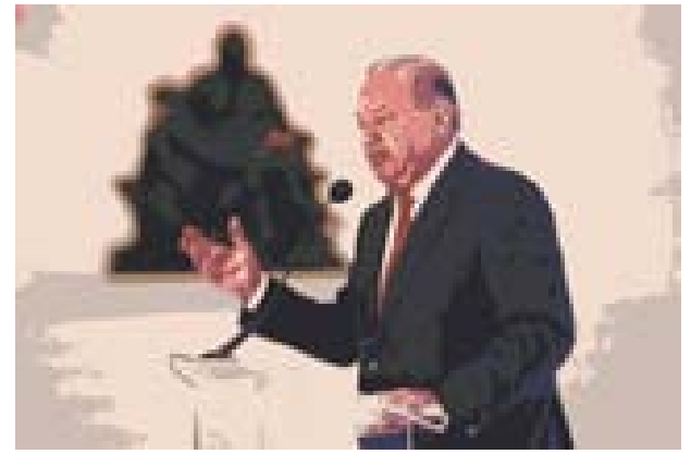
Mexican billionaire Carlos Slim speaks during the presentation of a digital platform, which was created in partnership with the Carlos Slim Foundation and online course platform Coursera, inside Soumaya museum in Mexico City on 29 Jan, 2014 file photo.

Last year, America Movil secured rights on all media platforms to broadcast the 2016 Olympics in Rio de Janeiro. America Movil shares, which are down 15 percent so far this year compared with an 8.9 percent fall in Mexico's IPC index, were flat for most of the day, but closed 1.57 percent lower. Both Inbursa and Grupo Carso said they were analyzing the IFT's decision and would provide details on the steps they would take in response. Inbursa shares closed down 0.74 percent,