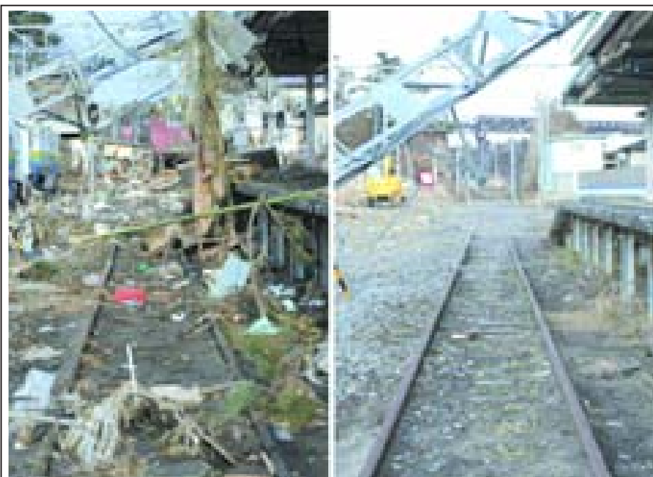
Photos show Nobiru Station on the JR Senseki Line in Higashimatsushima, Miyagi Prefecture, on 14 March, 2011 (L), three days after the Great East Japan Earthquake and tsunami, and on 3 March, 2014 (R).

“The Court has not found any case law supporting the government’s broad assertion that its duty to preserve supersedes statutory or regulatory requirements,” Judge Reggie Walton of the special court wrote in his decision.