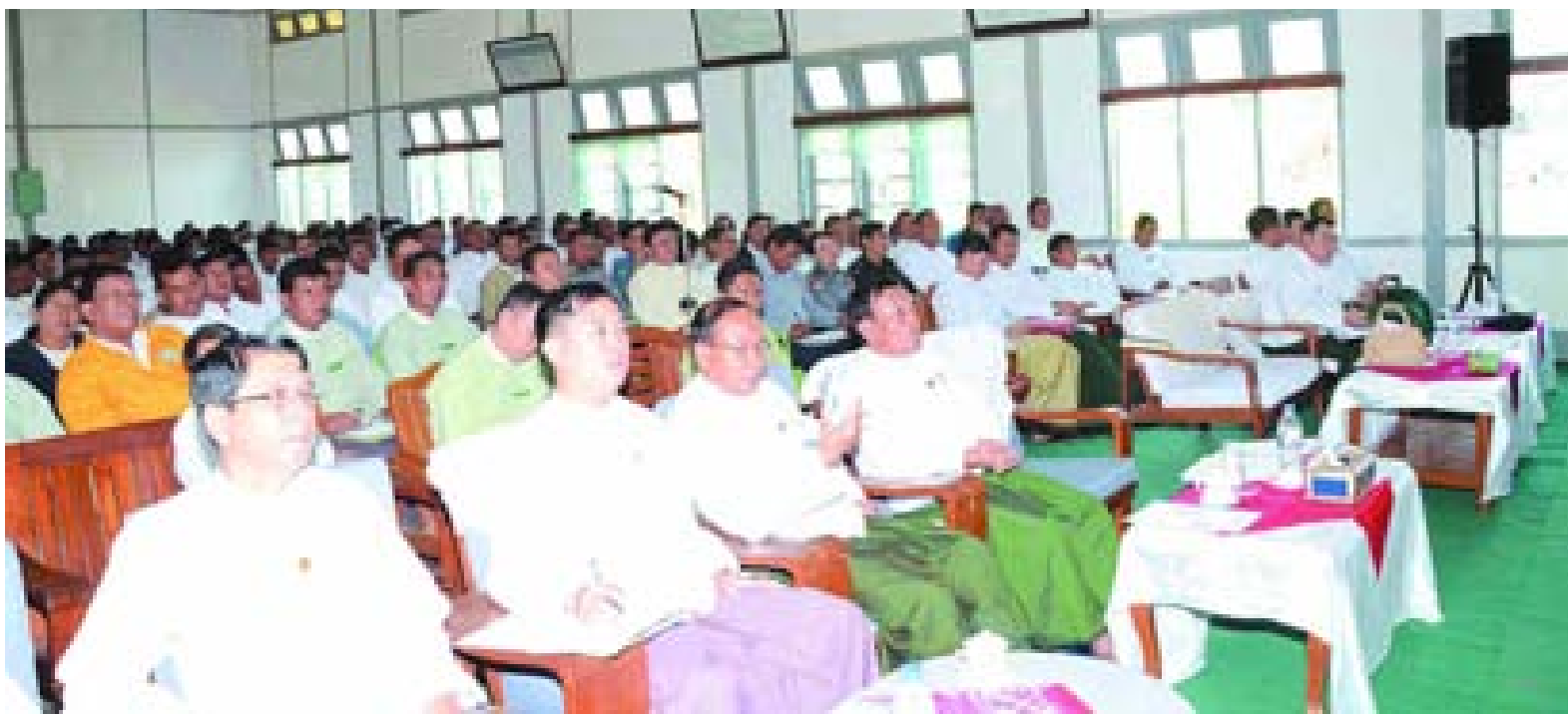
Meeting between Speaker of Union Parliament Thura U Shwe Mann and locals in progress in Letpadan Township.

NAY PYI TAW, 8 March — Thura U Shwe Mann, the Speaker of the Union Parliament, Pyidaungsu