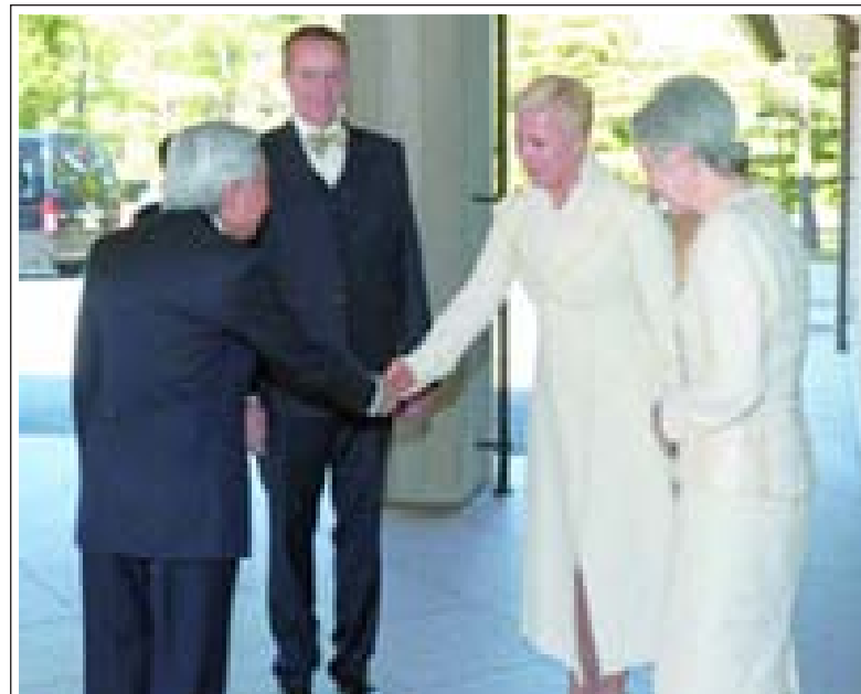
Japanese Emperor Akihito (L) and Empress Michiko (R) see Estonian President Toomas Hendrik Ilves and his wife Evelin off after their meeting at the Imperial Palace in Tokyo on 7 March, 2014.