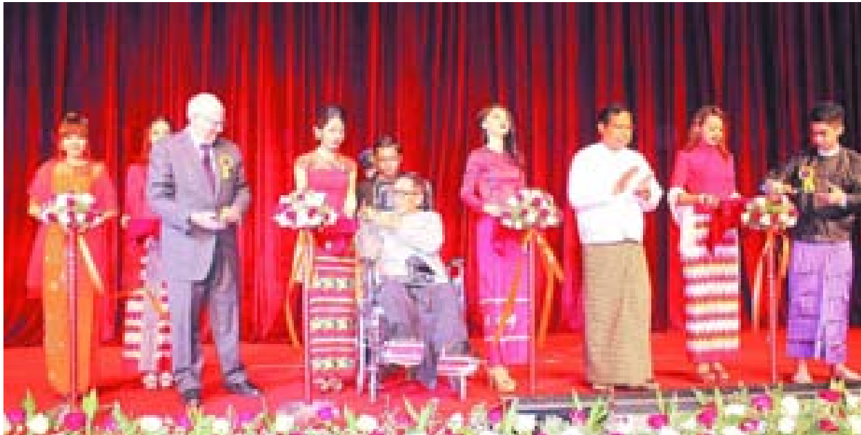
Opening of the Myanmar Marketing Forum 2014 in progress at National Indoor Stadium in Yangon.

NAY PYI TAW, 8 March—Union Minister for Commerce U Win Myint formally opened the Myanmar Marketing Forum 2014 on Saturday at National Indoor Stadium in Yangon.