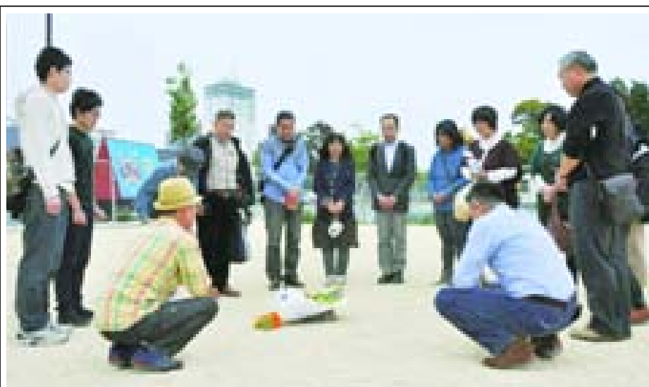
Relatives of Japanese victims killed in a major earthquake that occurred on 22 Feb, 2011, in Christchurch, New Zealand, offer flowers at a vacant lot formerly the site of the collapsed Canterbury Television building in the city on 21 Feb, 2014, a day before the third anniversary of the quake.