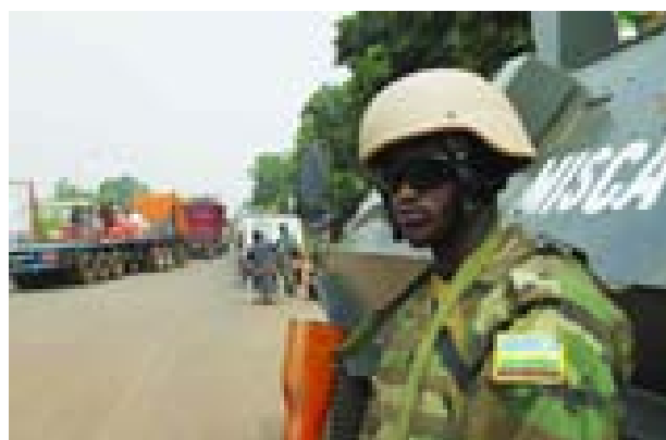
African peace keeping soldiers escort a humanitarian convoy in Bangui, on 15 Feb, 2014.

"The deployment of a peacekeeping operation, if authorized, will take