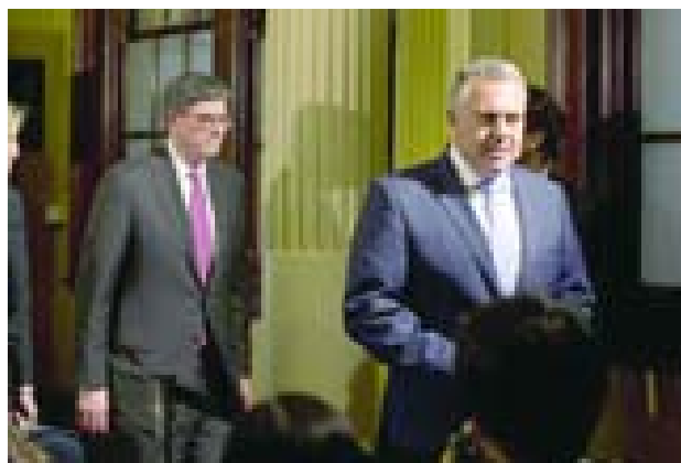
US Treasury Secretary Jack Lew and Australian Treasurer Joe Hockey (R) walk from a joint news conference at the G20 Finance Ministers meeting in Sydney, on 21 Feb, 2014.

SYDNEY, 21 Feb — The world's rich nations pushed back against emerging market complaints about the spillover effects of their monetary policies, saying on Friday they had to get their own houses in order and get with the agenda of