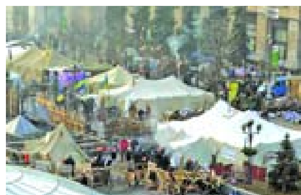
An aerial view shows the anti-government protesters camp in Independence Square in central Kiev, on 21 Feb, 2014.

ister said late on Thursday there was still no agreement over a proposed road map to ease the crisis, which began in November