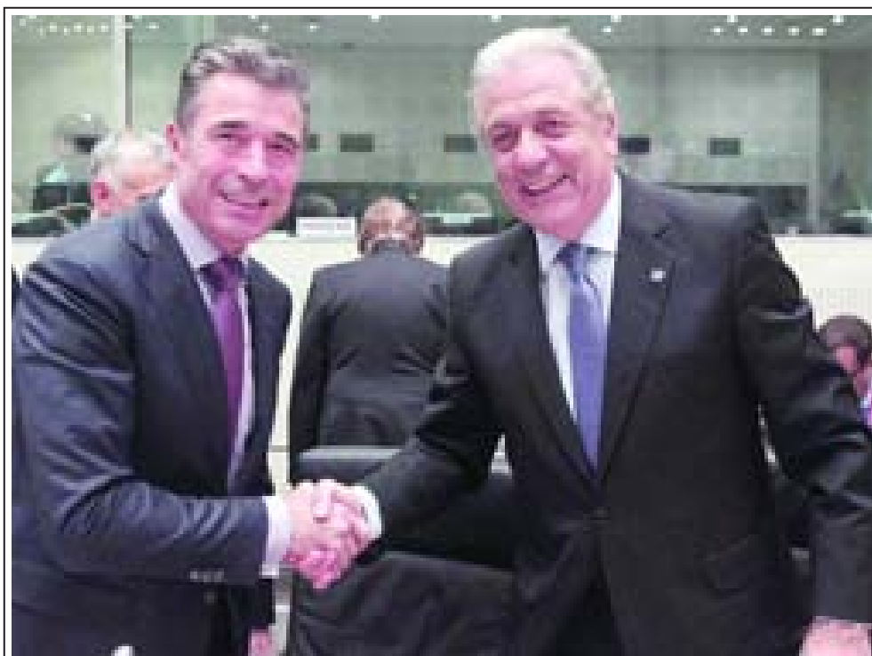
Greece's Defence Minister Dimitris Avramopoulos(R) welcomes NATO Secretary General Anders Fogh Rasmussen during a meeting at Zappeion Hall in Athens, Greece, on 20 Feb, 2014. European Union defence ministers are gathering in Athens to discuss European military operations and cooperation in a two-day informal meeting, which begins on Thursday afternoon, as Greece currently holds the EU's rotating six-month presidency.