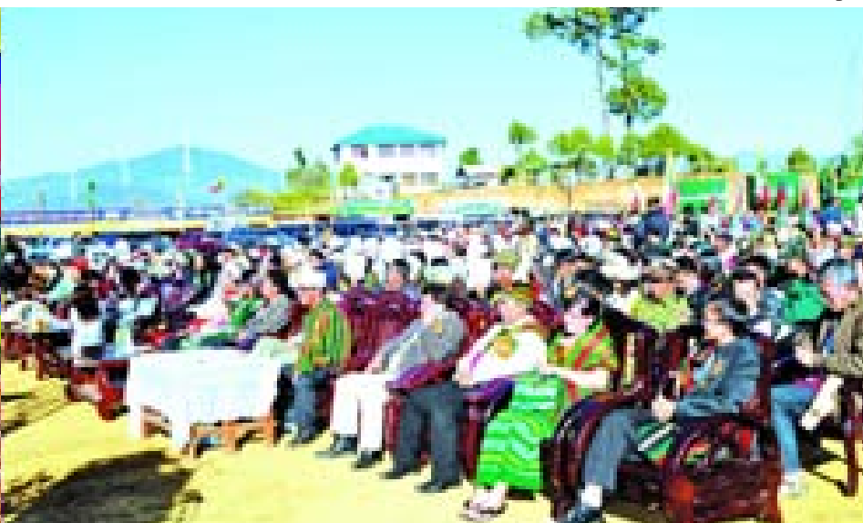
Union Minister U Win Tun reads out message sent by President U Thein Sein at 66 th Anniversary of Chin National Day.