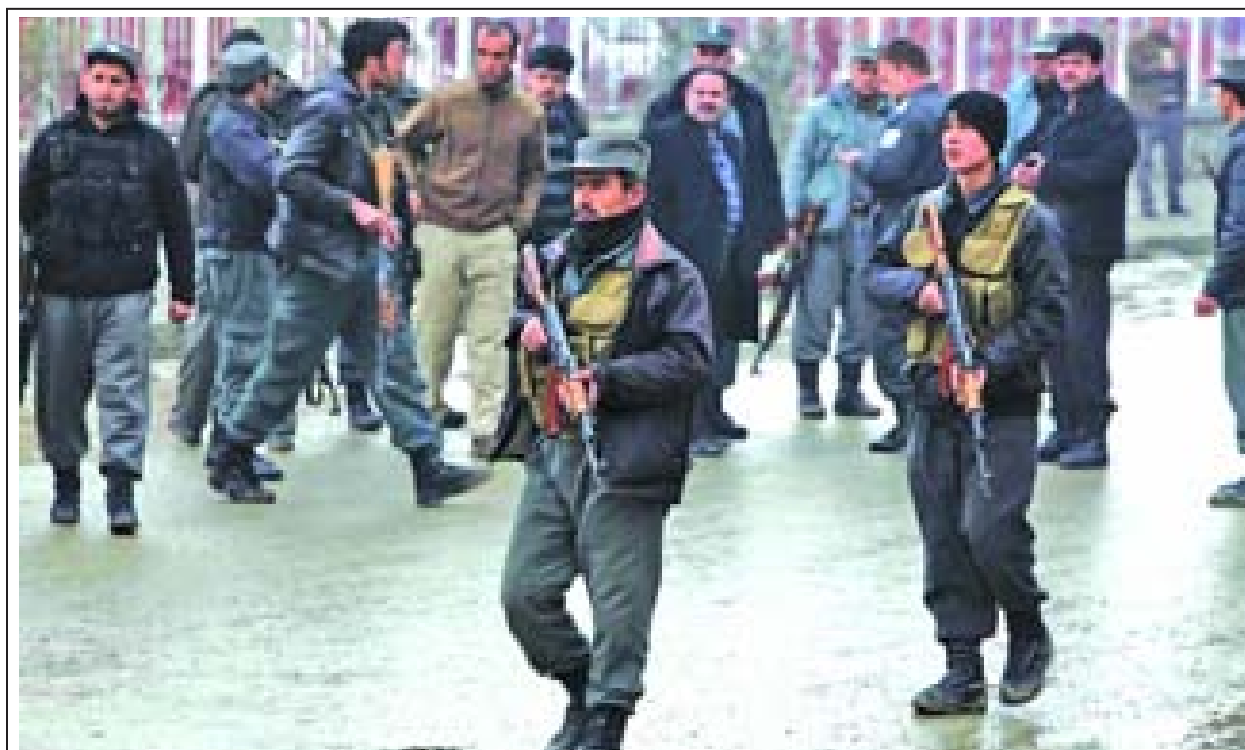
Afghan policemen stand guard at the site of a suicide attack in Kabul, Afghanistan on 20 Feb, 2014. A suicide attack that rocked Kabul city left the attacker dead and injured another on Thursday, Ministry of Interior said in a statement released here. —XINHUA

The epicentre, with a depth of 14.96 km, was initially determined to be at 36.4247 degrees south latitude and 39.5812 degrees west longitude. —Xinhua