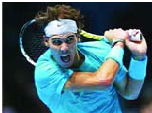
World No 1 Rafael Nadal