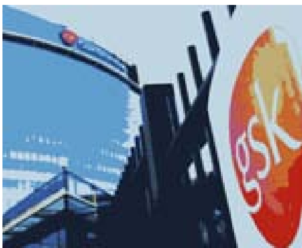
The GlaxoSmithKline building is pictured in Hounslow, west London on 18 June, 2013.

LONDON, 21 Feb — Anoro, a combination drug for chronic obstructive pulmonary disease (COPD) developed by GlaxoSmithKline and Theravance, has received the green light from European regulators, the companies said on Thursday.