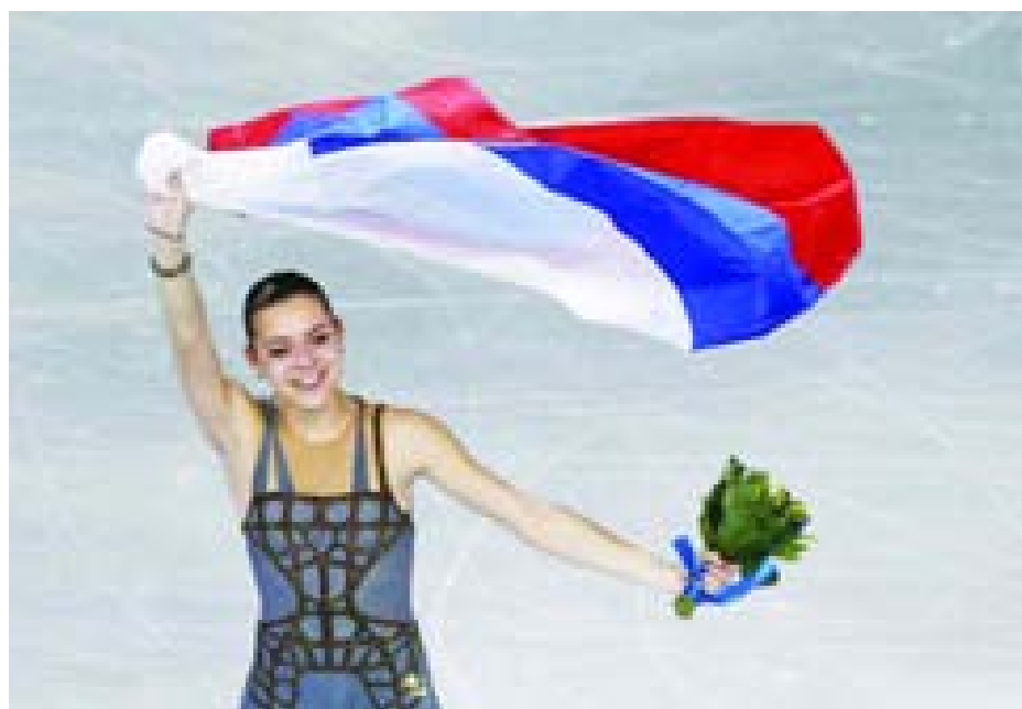
Russia's Adelina Sotnikova celebrates holding her flag at the end of the Figure Skating Women's free skating Program at the Sochi 2014 Winter Olympics, on 20 Feb, 2014.

them on Thursday when a gun battle broke out in the center of Kiev.—Reuters