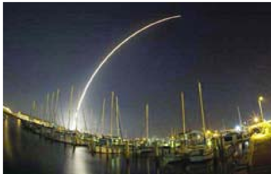
A view of the Delta IV rocket streaking across the sky after launching from Cape Canaveral Air Force Station is seen from Port Canaveral, Florida

The GPS satellite launched on Thursday is the fifth in a next-generation series of spacecraft that beam more precise navigation signals and resist jamming. The so-called "2F" series, which are designed to last 12 years, also include