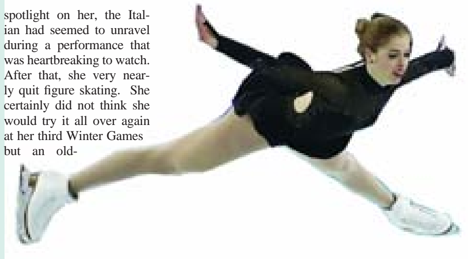
Italy's Carolina Kostner competes during the figure skating women's free skating program at the 2014 Sochi Winter Olympics, on 20 Feb, 2014.

spotlight on her, the Italian had seemed to unravel during a performance that was heartbreaking to watch. After that, she very nearly quit figure skating. She certainly did not think she would try it all over again at her third Winter Games but an old-