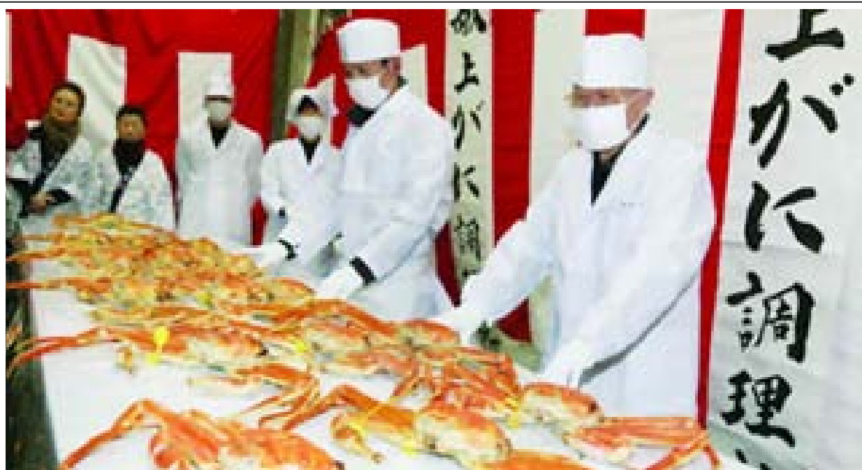
Prized Echizen crabs, a winter delicacy caught in the Sea of Japan, are boiled and prepared in Sakai, Fukui Prefecture, central Japan, on 18 Feb, 2014, for presentation to the Imperial family. The tradition dates back to 1922.