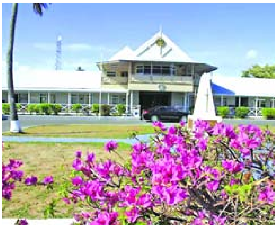
An exterior view of the government offices of the small island nation of Nauru is pictured, on 10 Feb, 2012.

Morrison said the riot began when detainees forced their way out of the center. However, refugee advocates said it was triggered when Manus Island residents, G4S employees and PNG police stormed the facility, attacking the asylum seekers.— Reuters