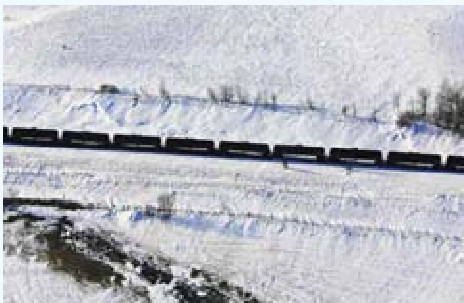
A train makes its way along the Burlington Northern Santa Fe (BNSF) rail line outside of Williston, North Dakota on 12 March, 2013.

The US Transportation Department's Pipeline and Hazardous Materials Safe-