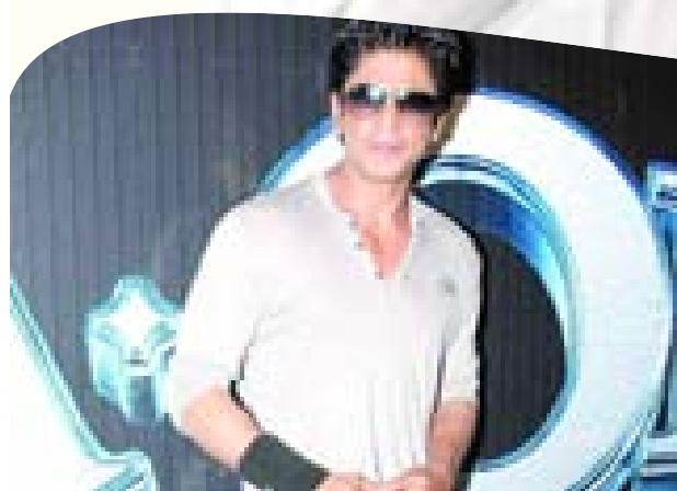
SRK wants to participate in the proposed IPL-style football league.