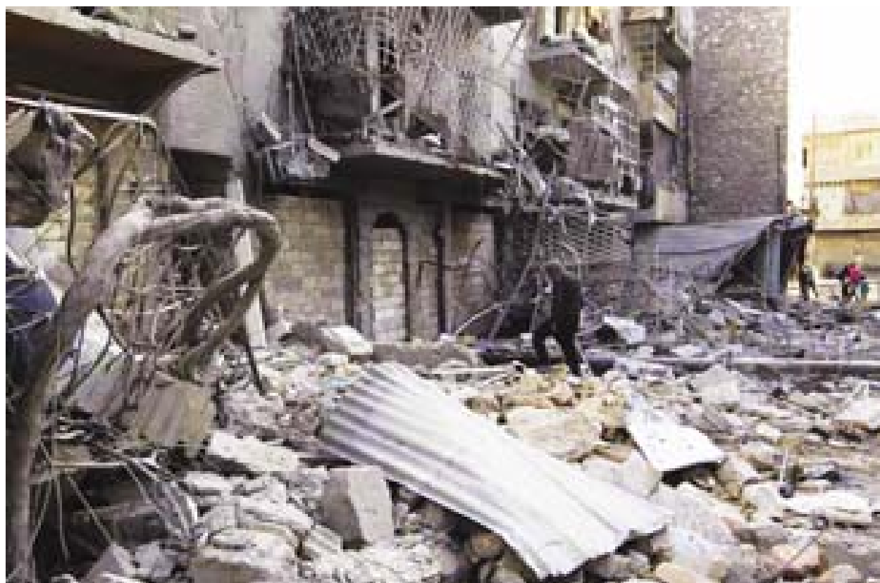
A man walks amid rubble of damaged buildings in the al-Myassar neighbourhood of Aleppo on 19 Feb, 2014.