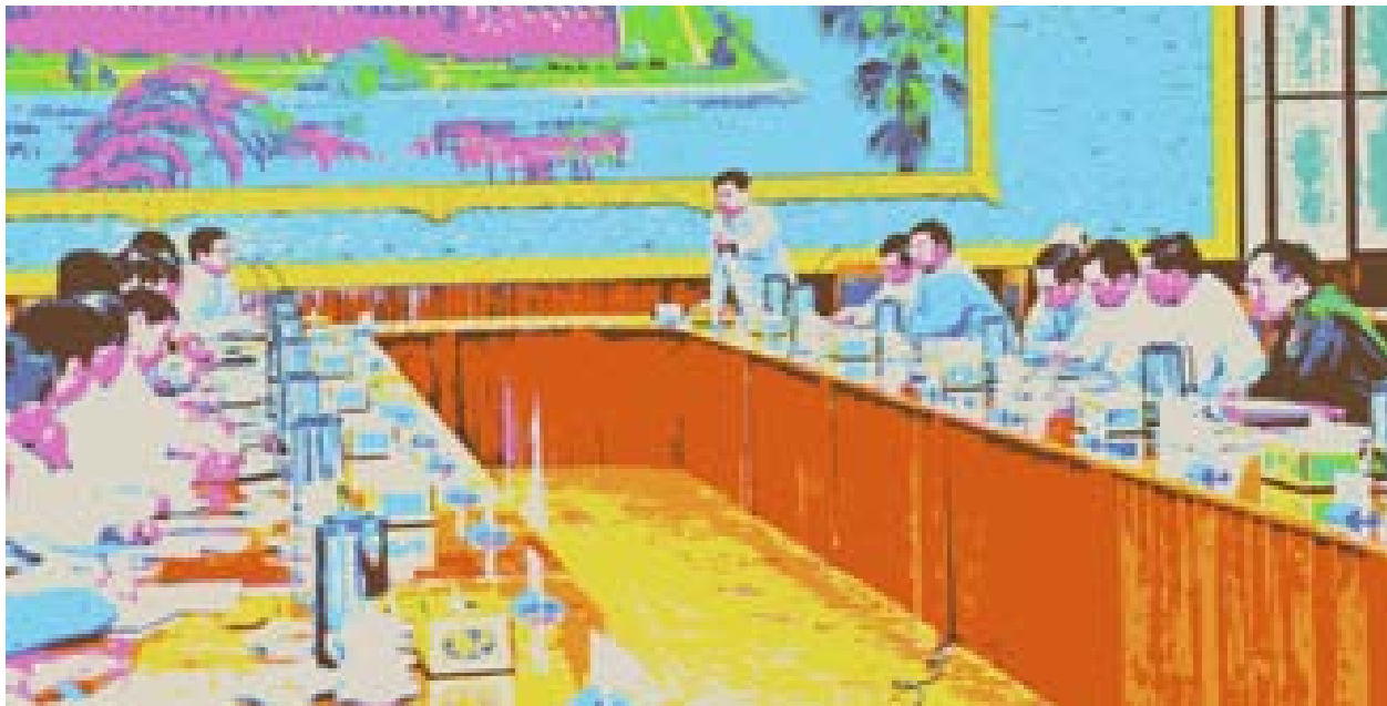
Meeting on resettlement for the landless and homeless in progress.—MNA

NAY PYI TAW, 21 Feb—"The government is drawing city development plan and township development plan for the landless and homeless households," said Union Minister at the President Office U Soe Thane at the meeting on resettlement for the landless and homeless at the hall of the President Office on 21 February morning.