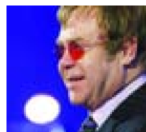
Musician Elton John delivers remarks after receiving a lifetime achievement award for his philanthropic work from the Rockefeller Foundation in Washington on 30 Oct, 2013.

Bonnaroo is among the top live music gatherings of the year, much like the Coachella Valley Music and Arts Festival in California and the Glastonbury Festival of Contemporary Performing Arts in Britain. Tickets for the festival go on sale Saturday on Bonnaroo.com.—Reuters