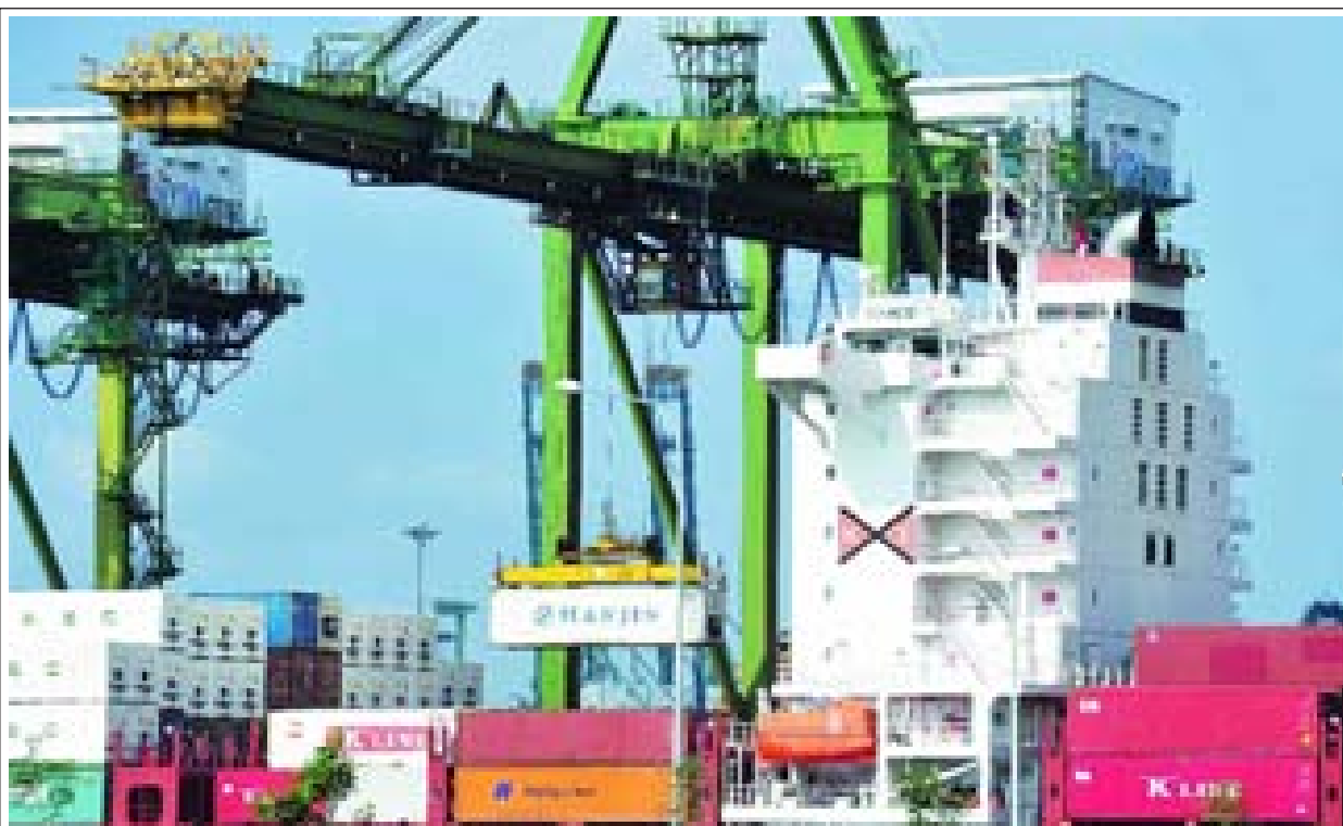
Cranes load and unload containers at Singapore's Tanjong Pagar Container Terminal on 20 Feb, 2014. Singapore's Ministry of Trade and Industry (MTI) announced on Thursday that Singapore's economy expanded by 4.1% in 2013.