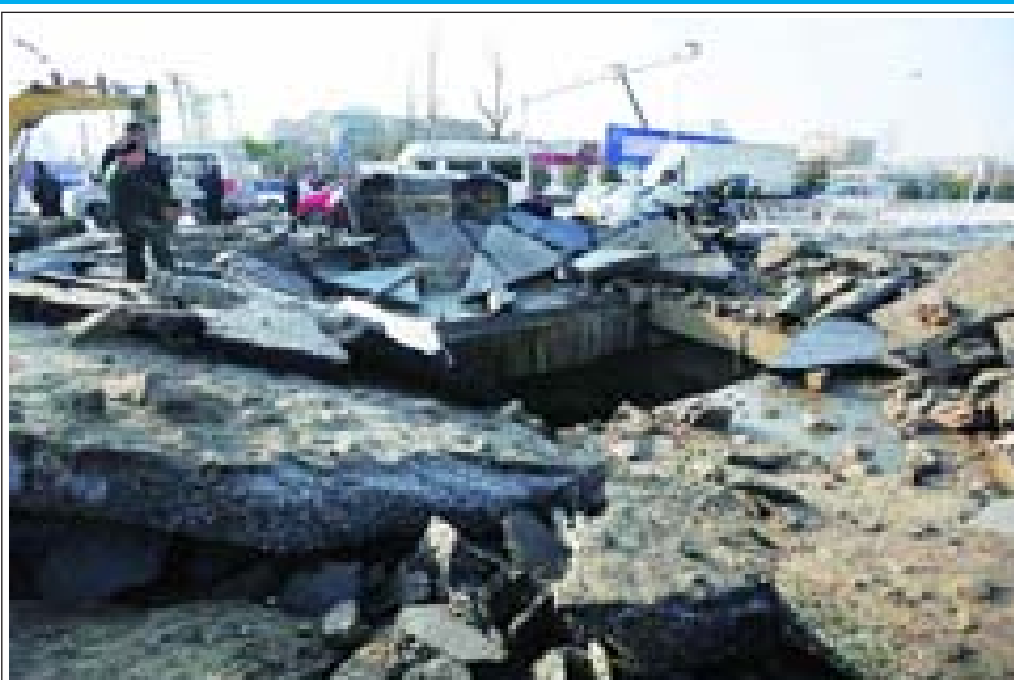
Photo taken on 20 Feb, 2014 shows an explosion site on a road in Qiaokou District of Wuhan City, capital of central China's Hubei Province. According to the local fire department, three people were injured in a methane gas explosion in Wuhan on Thursday, which collapsed an underground sewage pipe.